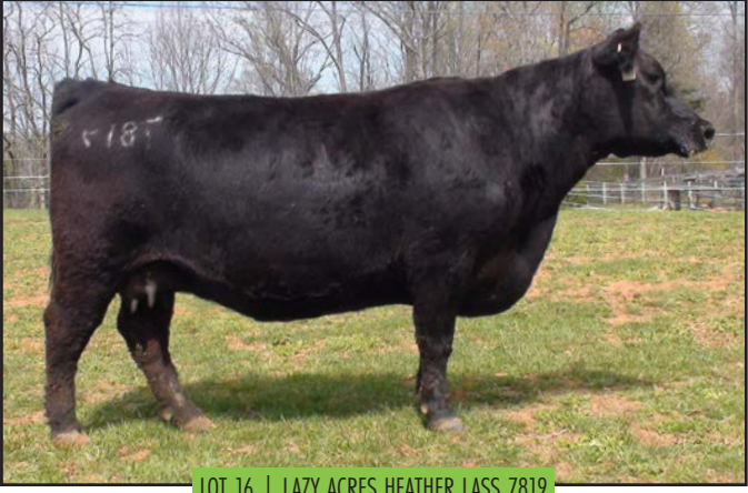
LOT 16 | LAZY ACRES HEATHER LASS 7819