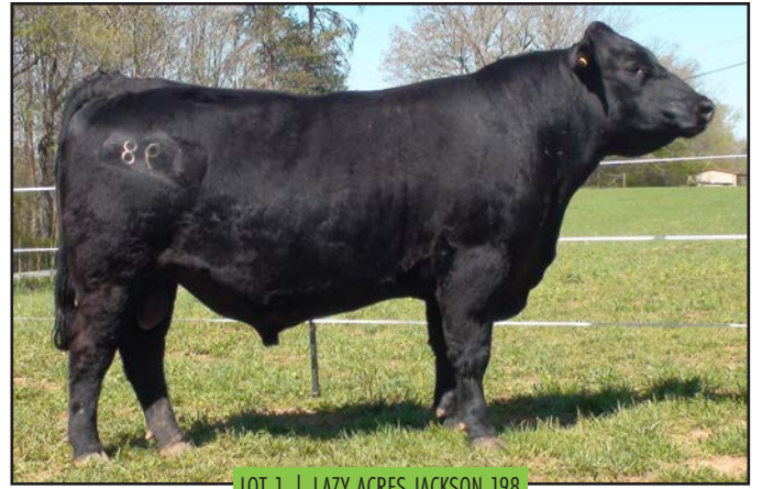
LOT 1 | LAZY ACRES JACKSON 198