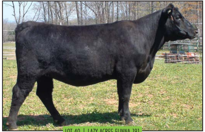
LOT 40 | LAZY ACRES ELINNA 191

Tehama Upward Y238 Tehama Tahoe B767 Tehama Mary Blackbird Y684 S S Niagara Z29 Lazy Acres Elinna 882 Lazy Acres Elinna 4822 Sitz Upward 307R Tehama Elite Blackbird T735 S A V Final Answer 0035 Tehama Mary Blackbird T073 Hoover Dam Jet S S X144 Connealy Combination 0188 Lazy Acres Elinna 2933