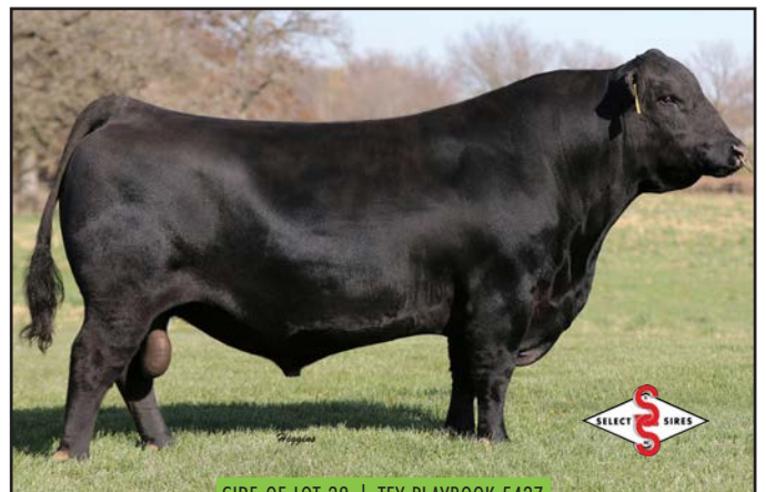
SIRE OF LOT 38 | TEX PLAYBOOK 5437

Connealy Comrade 1385 W H S Predestined Lass 77T