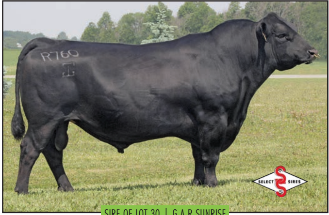
SIRE OF LOT 30 | G A R SUNRISE

LOT 30 LAZY ACRES 7912 REG: Commercial DOB: 9/3/17 TATTOO: 7912 G A R Sunrise Service Sire: Top Cut Due Date: 9/23/23 Fetal Sex: Bull