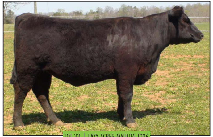
LOT 33 | LAZY ACRES MATILDA 1006

Connealy Earnan 076E Lazy Acres Matilda 981