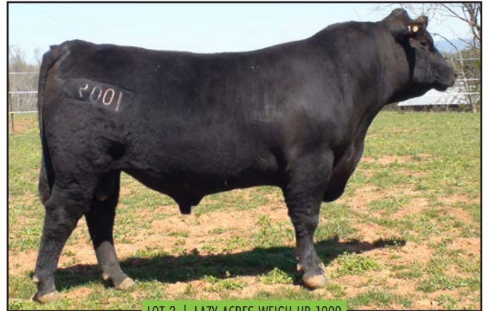
LOT 2 | LAZY ACRES WEIGH UP 1009