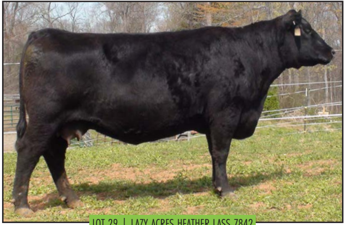
LOT 29 | LAZY ACRES HEATHER LASS 7842

LOT 29 LAZY ACRES HEATHER LASS 7842 REG: 19823138 DOB: 08/31/17 TATTOO: 7842 Hoover Dam S S Niagara Z29 Jet S S X144 G A R Progress Lazy Acres Heather Lass 4951 Lazy Acres Heather Lass 998 SydGen C C & 7 Erica of Ellston C124 B/R New Day 454 JET S S T151 G A R Predestined G A R Objective 2345 Mytty In Focus Lazy Acres Heather Lass 7918