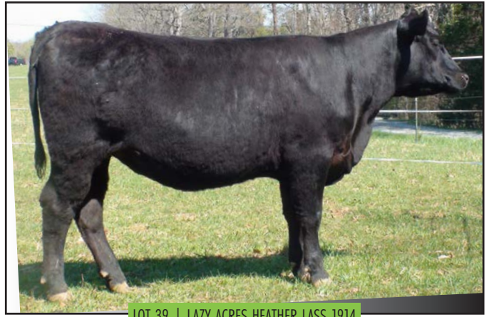
LOT 39 | LAZY ACRES HEATHER LASS 1914

Tehama Upward Y238 Tehama Tahoe B767 Tehama Mary Blackbird Y684 G A R Sunrise Lazy Acres Heather Lass 6005 Lazy Acres Heather Lass 283 Sitz Upward 307R Tehama Elite Blackbird T735 S A V Final Answer 0035 Tehama Mary Blackbird T073 MCC Daybreak G A R Objective R227 S A V Final Answer 0035 Lazy Acres Heather Lass 7918