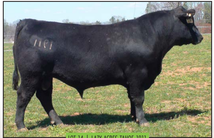
LOT 14 | LAZY ACRES TAHOE 1911