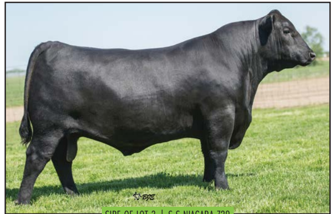
SIRE OF LOT 3 | S S NIAGARA Z29