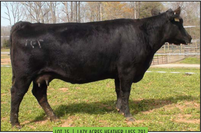
LOT 15 | LAZY ACRES HEATHER LASS 791