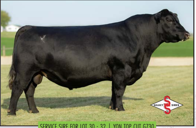
SERVICE SIRE FOR LOT 30 - 32 | YON TOP CUT G730

LOT 32 LAZY ACRES 782 REG: Commercial DOB: 8/25/17 TATTOO: 782 Connealy Uptown 098E Service Sire: Top Cut Due Date: 10/11/23 Fetal Sex: Bull