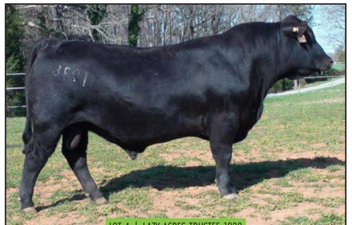
LOT 4 | LAZY ACRES TRUSTEE 1938