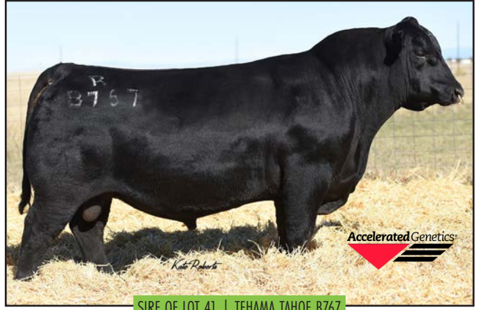
SIRE OF LOT 41 | TEHAMA TAHOE B767

Tehama Upward Y238 Tehama Tahoe B767 Tehama Mary Blackbird Y684 Connealy Courage 25L Lazy Acres Nell 5016 Back Creek Nell P48 Sitz Upward 307R Tehama Elite Blackbird T735 S A V Final Answer 0035 Tehama Mary Blackbird T073 Connealy Confidence 0100 Pearl Pammy of Conanga 194 Hyline Right Time 338 Back Creek Sitz Nell F103