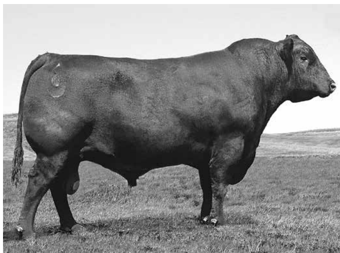
SITZ ALLIANCE 6595