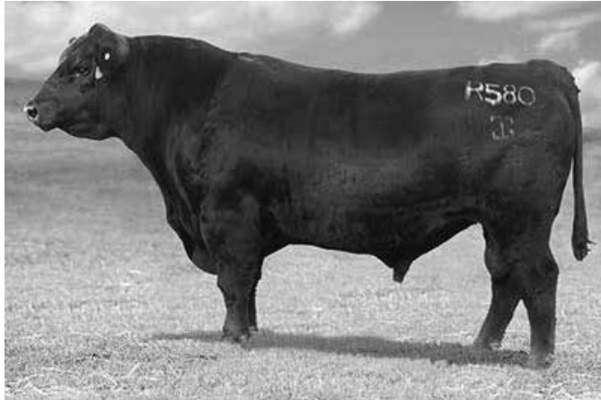
G A R DAYLIGHT