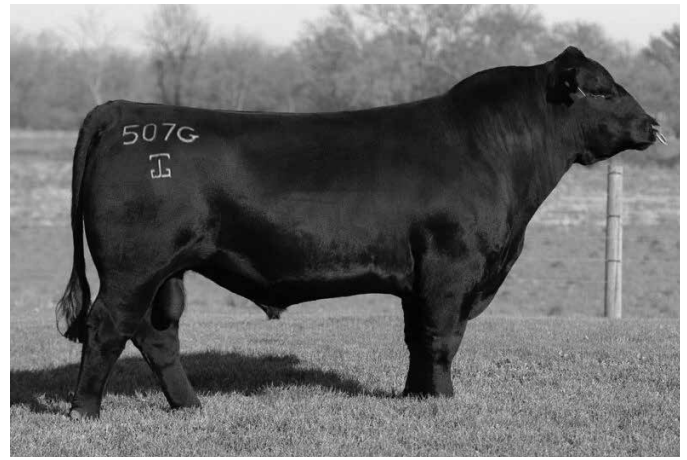
G A R DUAL THREAT