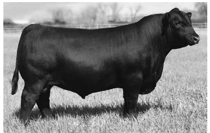
MUSGRAVE 316 STUNNER

Three AI-sired heifers here. K986 is from popular Sire Deer Valley Growth Fund backed by the maternal Donna Cow family. Sells open ready to breed to bull of buyer's choice.