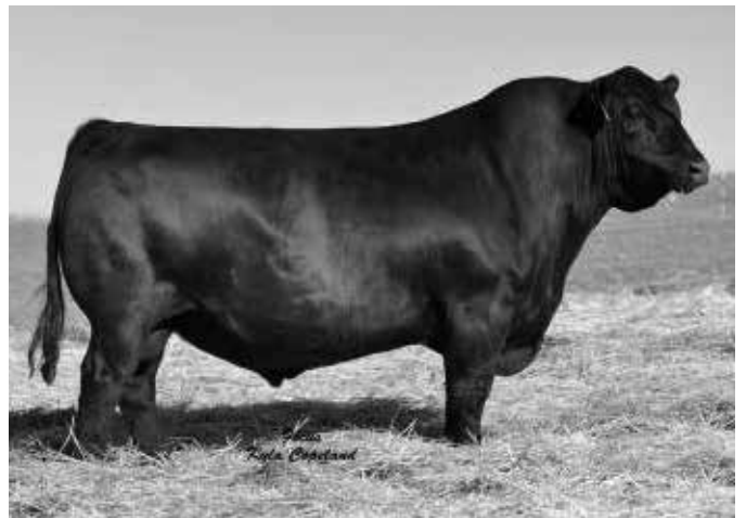
BASIN PAYWEIGHT 1682

Consignor: MATNEY ANGUS FARM/ JUSTIN MATNEY