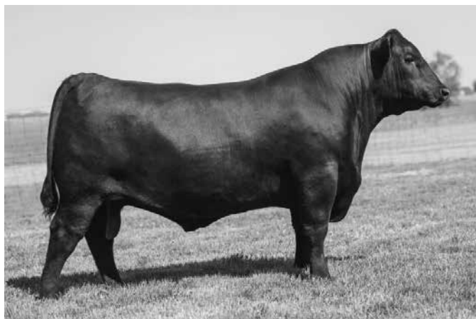
S S NIAGARA Z29