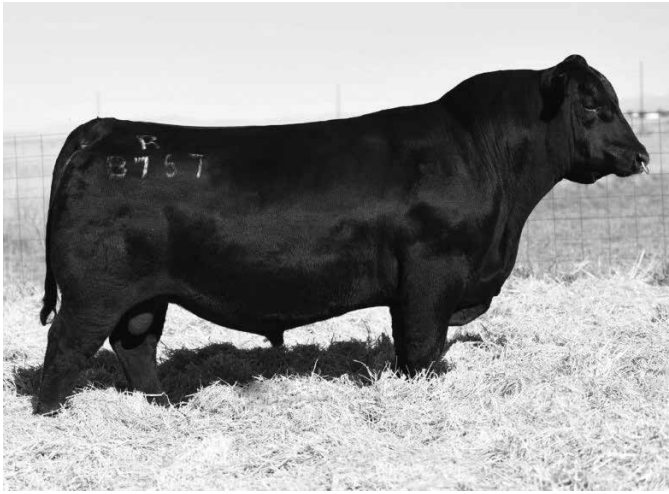
TEHAMA TAHOE B767