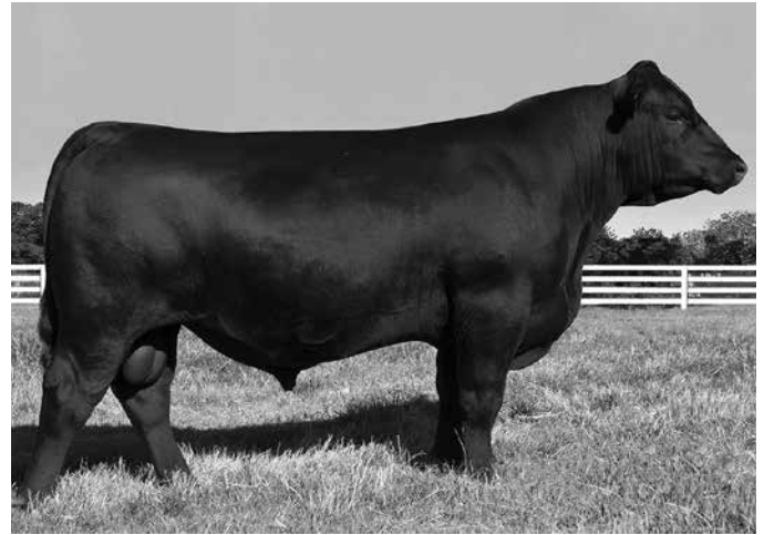
V A R DISCOVERY 2240