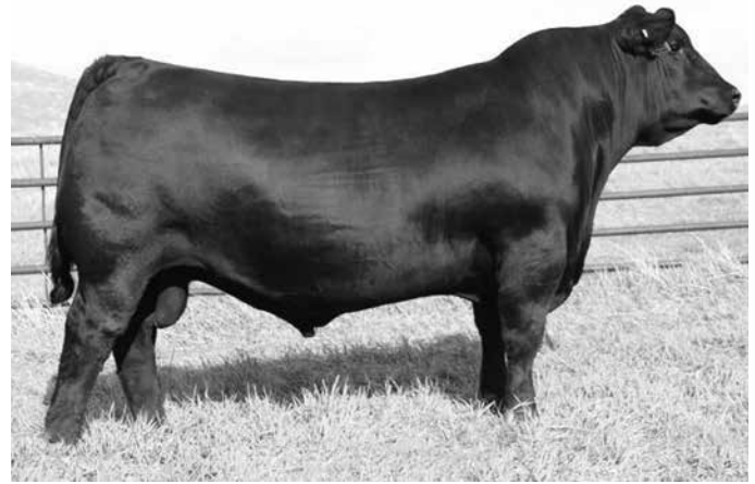
S A V RENOWN 3439