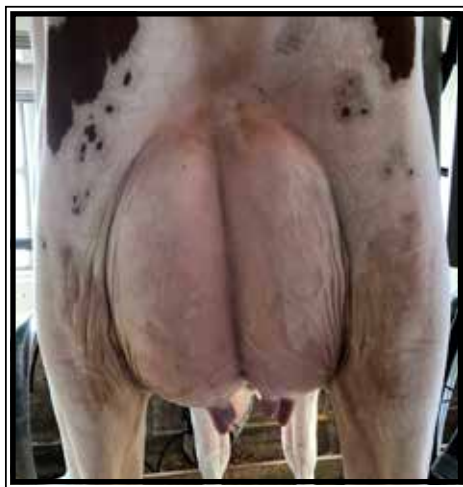
Refresh's beautiful mammary!

8th Dam: Clover-Mist Augy Star-ET*RC EX-94,4E EEEEE DOM 7-10 365 43140 5.0 2136 3.3 1421 Lifetime 206250 4.7 9793 3.5 7187