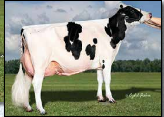
TOMBETH LINJET ELOUISE-ET EX-95 3E SAME MATERNAL FAMILY AS LOTS 11 & 12 Grand Champion, WI Championship Show 2019