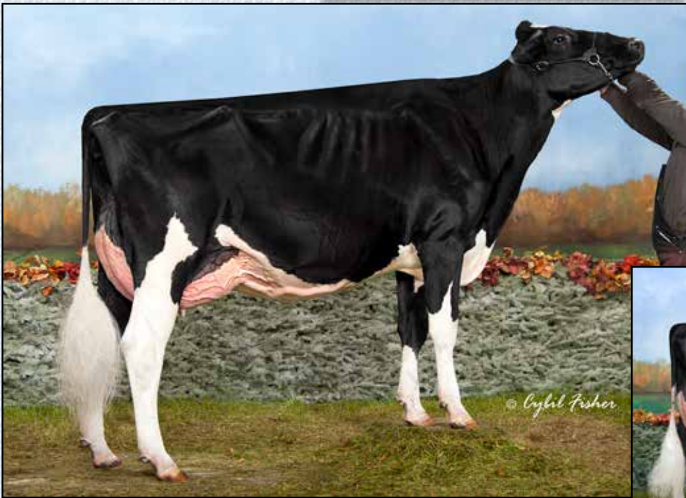
LOTTOS ATWOOD LIZETTE-ET EX-94 3E 3RD DAM OF LOT 29

Reserve All-American Senior 2-Year-Old 2014