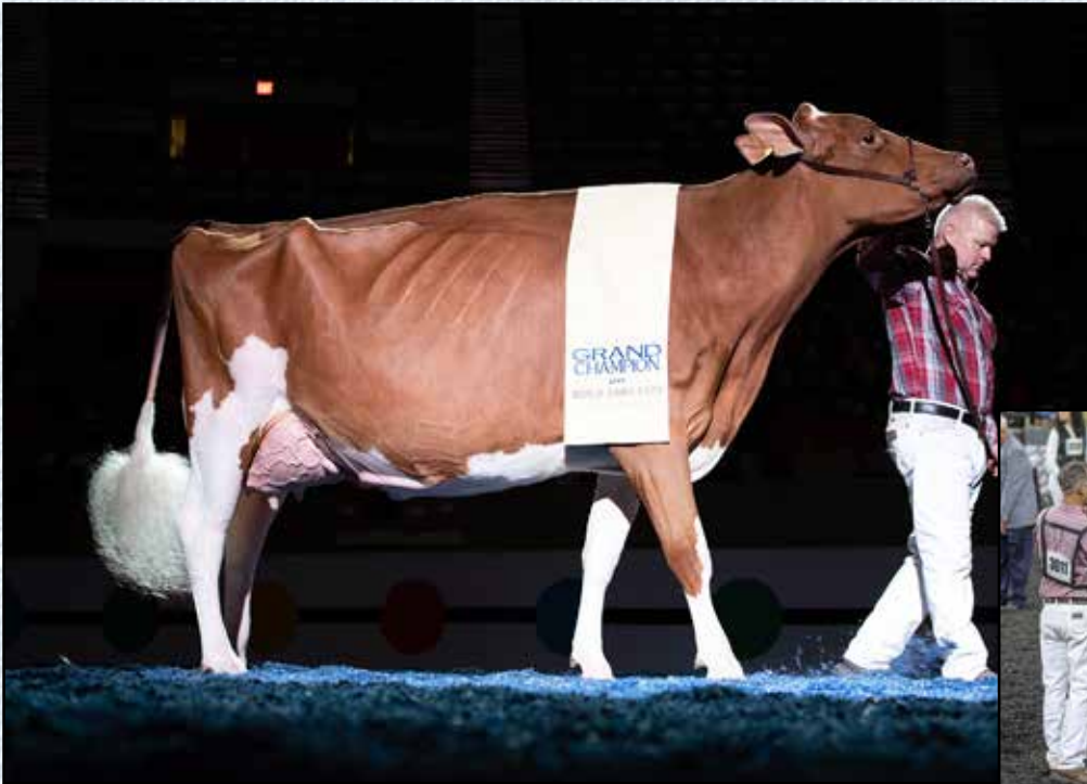
STRANS-JEN-D TEQUILA-RED-ET EX-96 2E DAM OF LOT 7 Grand Champion International R&W Show 2014 & 2015