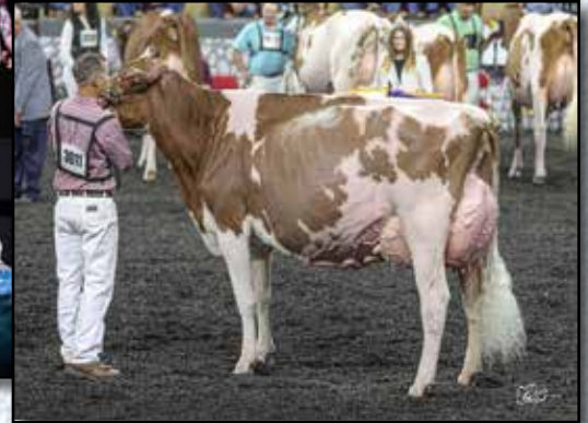
MILKSOURCE TANTRUM-RED-ET EX-92 FULL SISTER TO LOT 7 Reserve All-American R&W Senior 3-Year-Old 2022