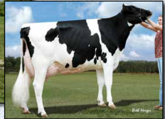
JOLIAM DUNDEE 3035 EX-92 2E 2ND DAM OF LOT 1