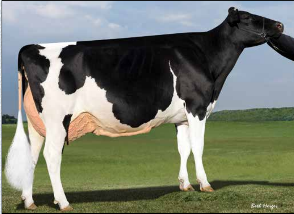
DANHOF M ANGELIC-ET EX-93 2E 3RD DAM OF LOT 25