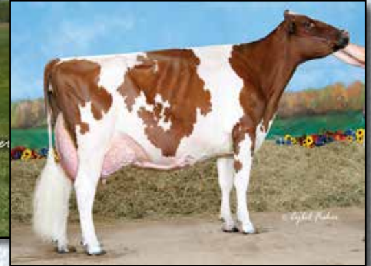
JEN-D DEVIL TIFFANY-RED-ET EX-95 3D 2ND DAM OF LOTS 6 & 7 Seven time R&W All-American Nominee