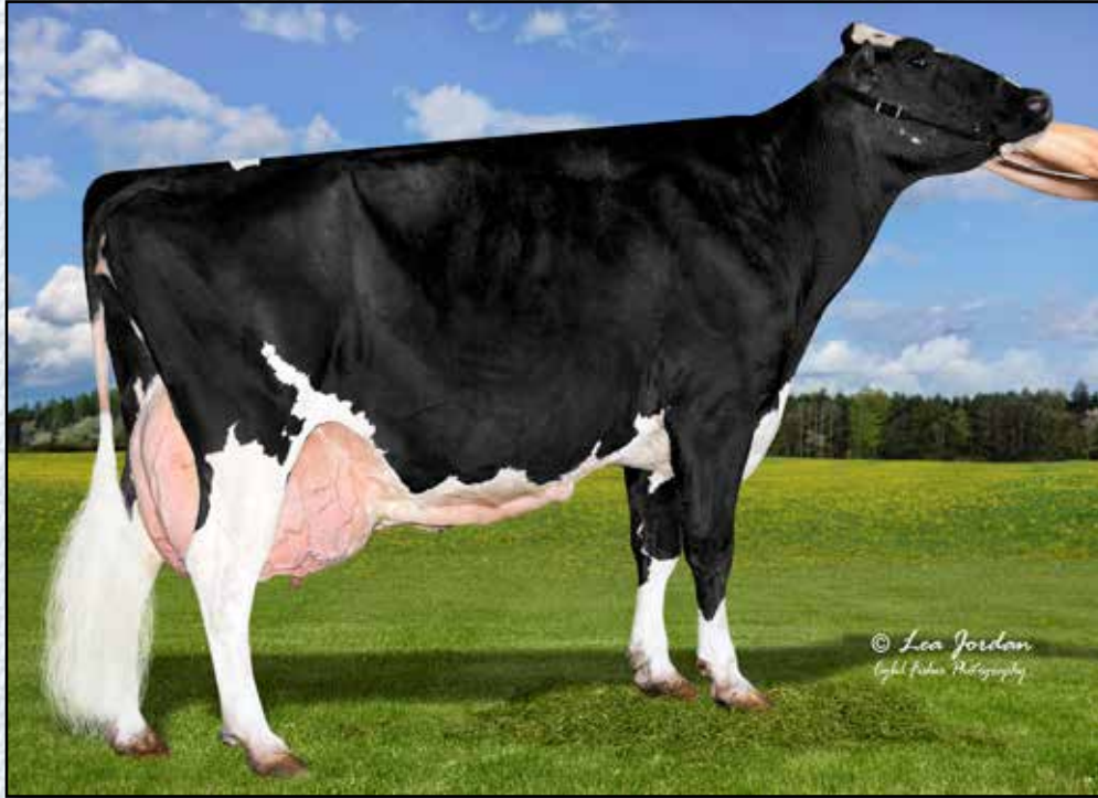
SELZ-PRALLE AFTERSHOCK 3918 VG-88 DAM OF LOT 16; 4TH DAM OF LOT 17 World Milk Record Cow