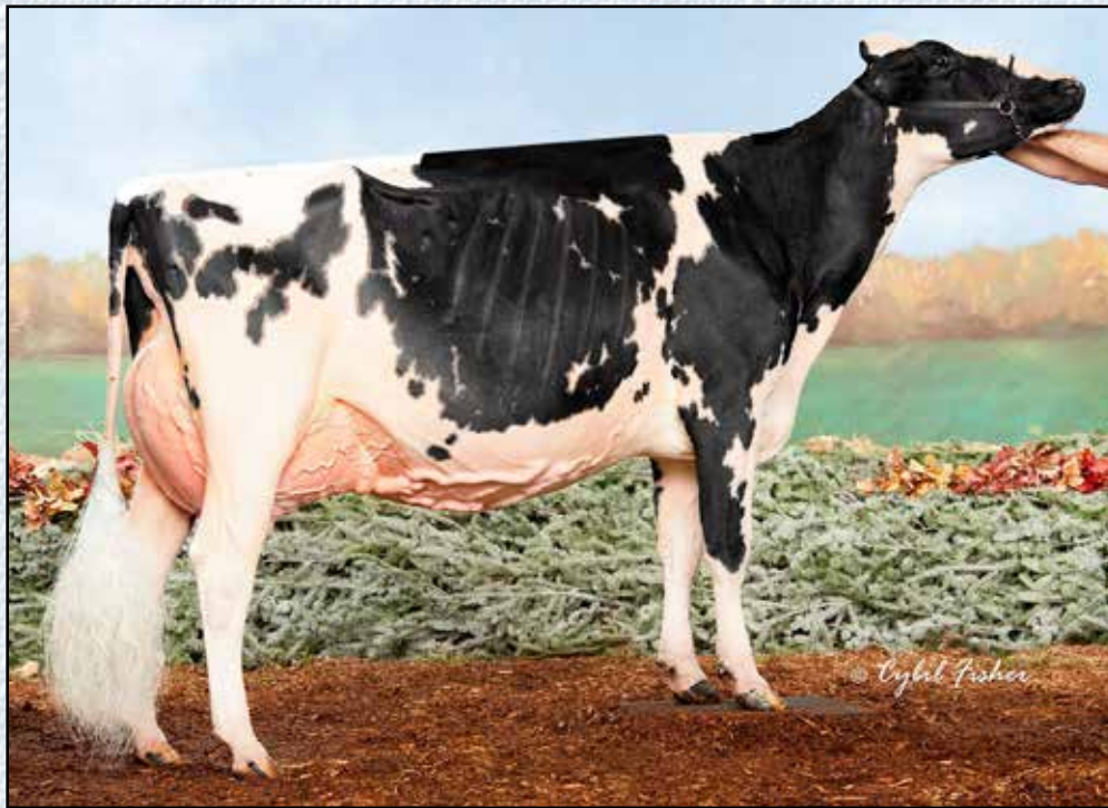
WALKERBRAE DOORMAN LOCKET-ET EX-95-CAN FULL SISTER TO LOT 14

Nominated All-Canadian Milking Yearling 2011