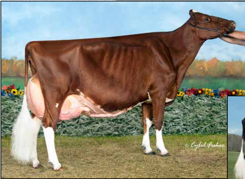
KHW REGIMENT APPLE-RED-ET EX-96 4E 4TH DAM OF LOT 36 All-American R&W 125,000 Lb Cow 2013