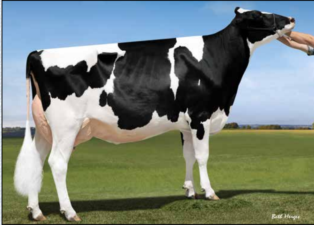
OUR-FAVORITE UNLIMITED-ET EX-94 3E 2ND DAM OF LOTS 8 THRU 10