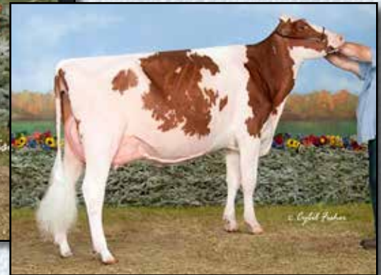
DUCKETT P LUCY-RED VG-89-CAN MATERNAL SISTER TO 2ND DAM OF LOT 20

Nominated All-American R&W 4-Year-Old 2011