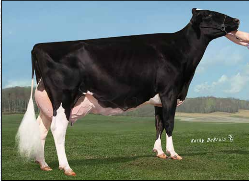
GLORYLAND-I GOLDWYN LOCKET-ET EX-94 2E DAM OF LOT 14; 2ND DAM OF LOT 15 Nominated All-Canadian Milking Yearling 2011