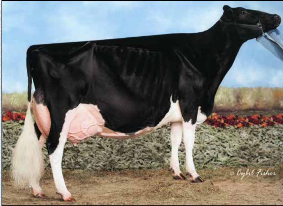
SAVAGE-LEIGH LEONA-ET EX-96 2E 2ND DAM OF LOT 23; 3RD DAM OF LOT 24 Reserve All-American 125,000 Lb Cow 2012