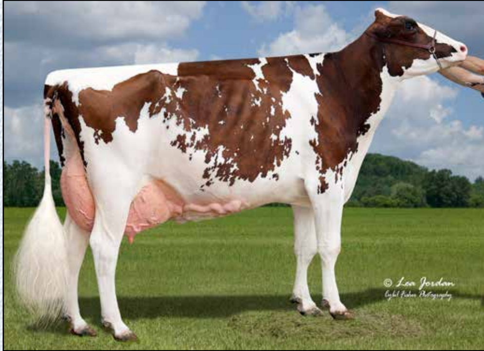
DORSLAND TYLA P-RED-ET EX-94 2ND DAM OF LOT 35