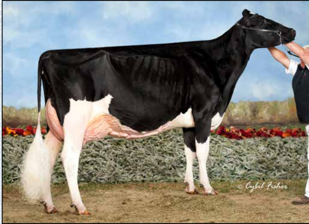
SCIENTIFIC GOLD DANA RAE-ET EX-95 3RD DAM OF LOT 26 Reserve All-American 5-Year-Old 2012