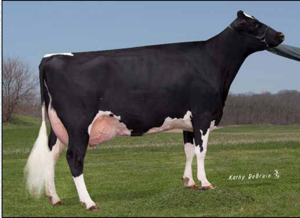
JEFFREY-WAY SAPHIRE EX-94 4E 2ND DAM OF LOT 30