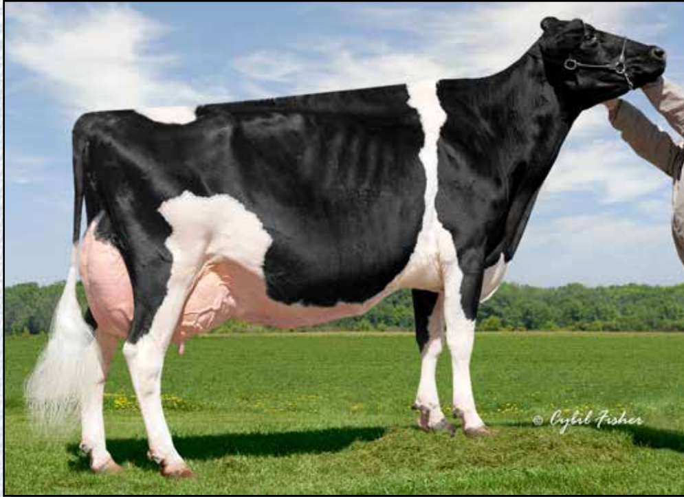
CHERRY CREST LYSTER GOLDEN EX-95 3E 4TH DAM OF LOT 19 Nominated All-American 5-Year-Old 2009