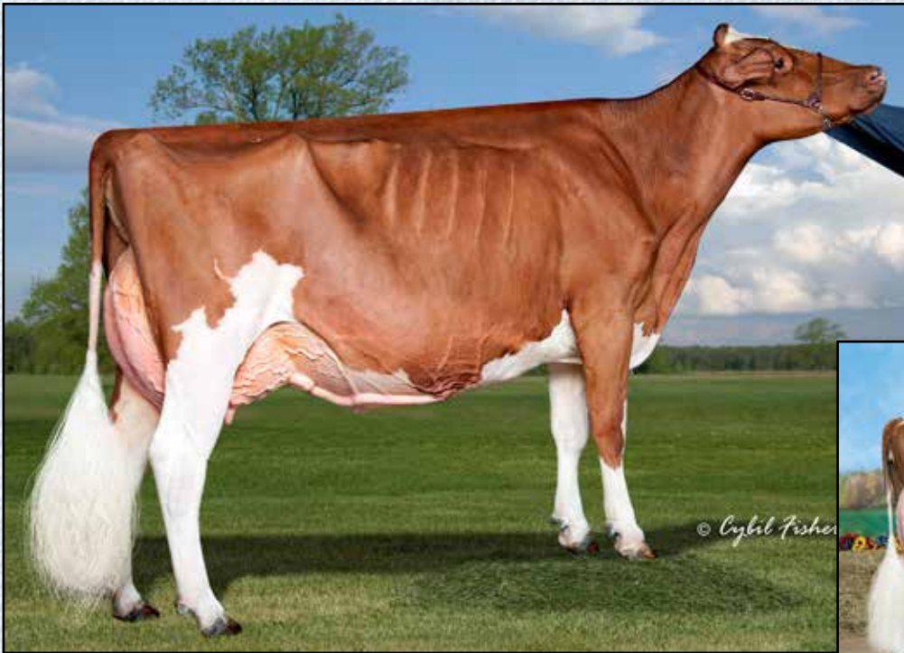
STRANS-JEN-D TEQUILA-RED-ET EX-96 2E DAM OF LOTS 6 & 7 All-American R&W 4-Year-Old 2015