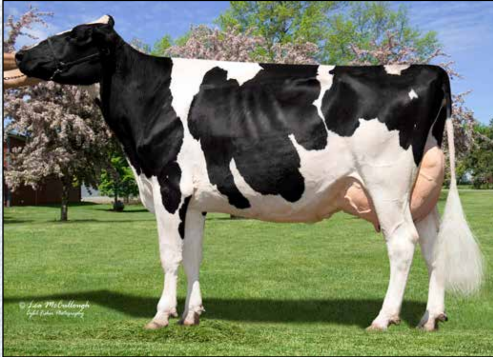
PIERCE-VALE MAC RAIZEL EX-93 MATERNAL SISTER TO DAM OF LOT 37