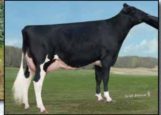
MS APPLES ANNESSA-ET EX-90 3RD DAM OF LOT 36