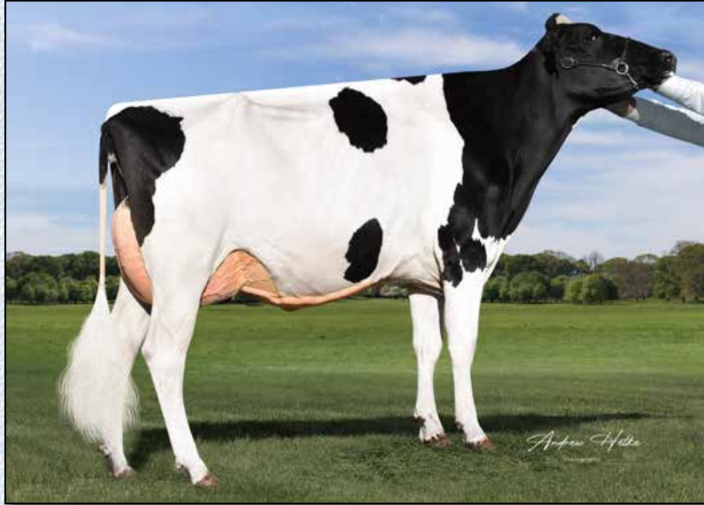
SILDAHL STEVE THE PIRATE-ET EX-92 DAM OF LOT 13