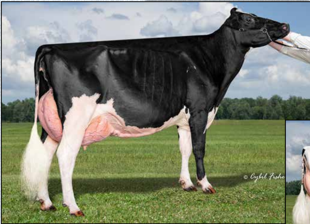
TOMBETH ESACRUSHABLE EX-94 DAM OF LOTS 11 & 12