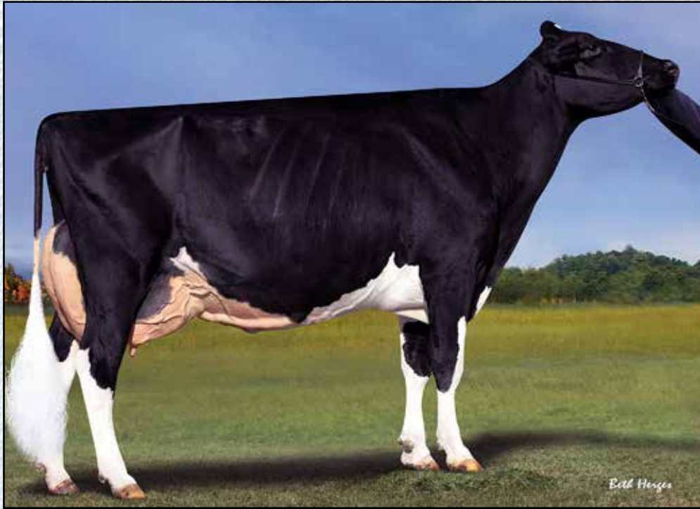
SAVAGE-LEIGH GOLDEN GIRL-ET EX-92 2E DAM OF LOT 23; 2ND DAM OF LOT 24 Reserve All-American Milking Yearling 2014