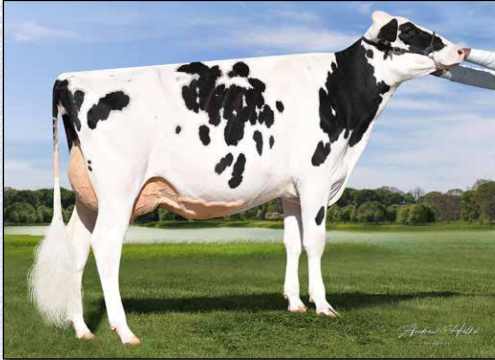
N-SPRINGHOPE THUNDERBIRD EX-90 DAM OF LOT 22 17th generation Excellent!