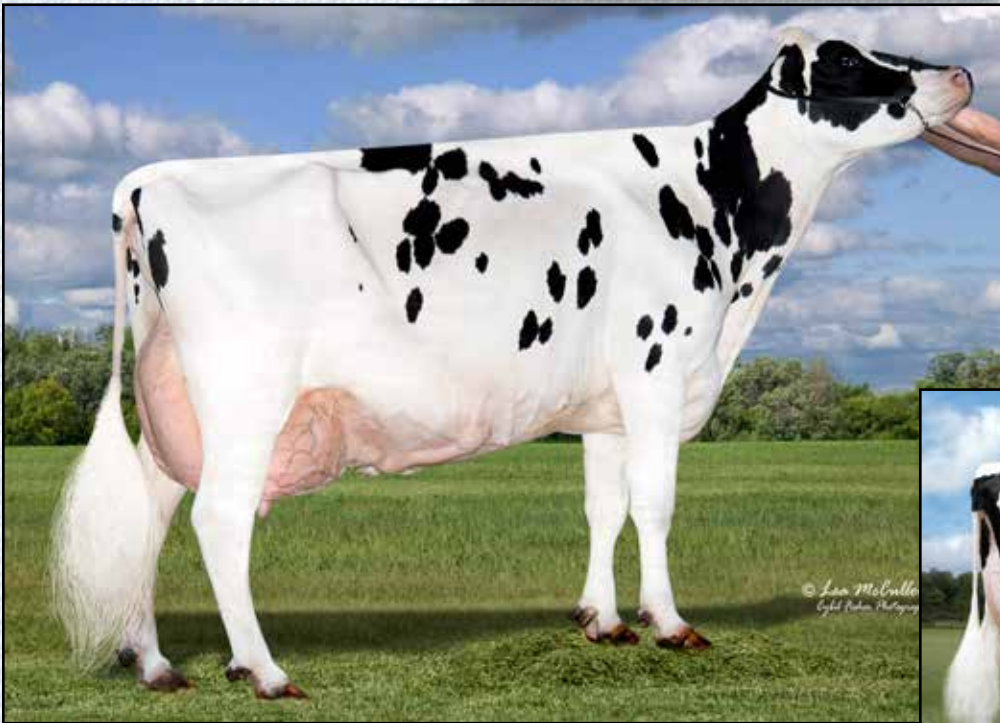
JOLIAM SHOT PEPPER 3729-ET EX-94 4E DAM OF LOT 1