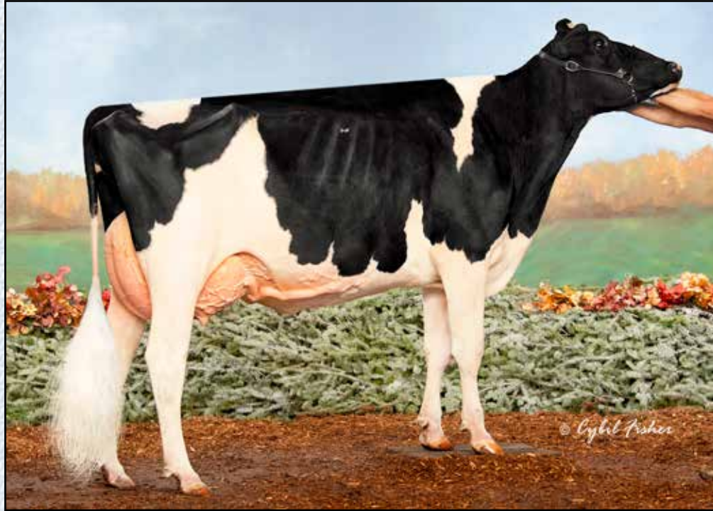
JOLIAM R PENNY 4751-ET EX-93 2ND DAM OF LOT 2

Nominated Junior All-American Senior 3-Year-Old 2018