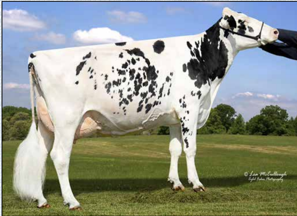
PIERCE-VALE GOLDSUN TRIX-ET EX-92 2E 2ND DAM OF LOT 21 17th generation Excellent!