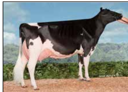
BLUFF-RIDGE BONES DOLCE EX-93 EEEEE 2E MATERNAL SISTER TO DAM OF LOT 74