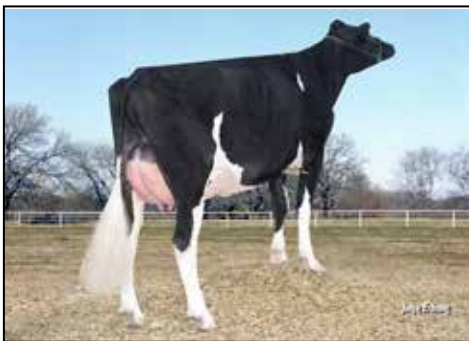
REGANCREST MAC BRITELITE-ET EX-91 5TH DAM OF LOT 71

840003228658239 99%RHA-I Born: December 15, 2020 • Herd No. 944 Due: April 15, 2023