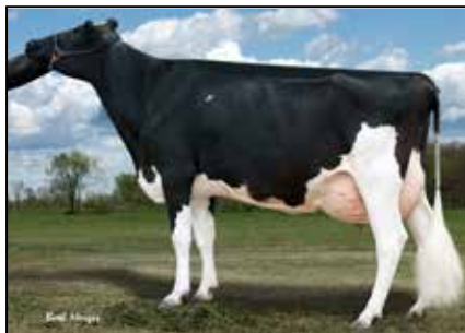
ELM-MOUND DURHAM RAEANN-ET VG-86 FULL SISTER TO 2ND DAM OF LOT 72

840003226844405 99%RHA-I Born: December 20, 2020 • Herd No. 1954 Due: April 20, 2023