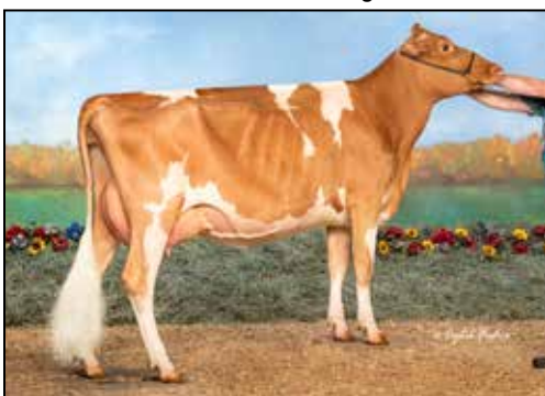
Springhill A Pie Useful-ETV VG-86 Nom. All-American Yearling in Milk 2022 Maternal Sister to Lot 82

CAMPBELLS RODNEYS UNIFY USA000003081349 Appraisal: 94 @ 12-06 (94/91) 2-04 303D 2X 11650M 4.4% 517F 3.4% 399P 94 3-04 306D 2X 15660M 4.4% 685F 3.5% 554P 92 4-11 365D 2X 22410M 4.2% 939F 3.6% 810P DHIA 6-05 306D 2X 16850M 4.0% 666F 3.2% 541P 93 7-10 365D 2X 16840M 4.1% 695F 3.3% 557P DHIA 9-04 365D 2X 20320M 4.1% 833F 3.3% 670P DHIA 10-10 365D 2X 21470M 3.9% 848F 3.5% 745P DHIA 12-06 358D 2X 16840M 4.6% 778F 3.5% 597P 96 3300D 166950M 4.0% 6746F 3.4% 5603P LIFE Six-Time Junior All-American Nominee - Jr. All-American 2009 Three-Time All-American Nominee See pedigree of Lot 59 for daughters of Unify!