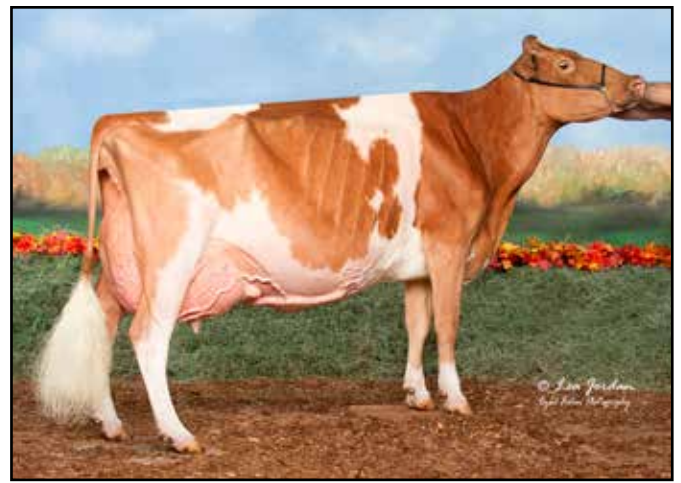
Springhill Kojack Uno-ETV EX-95 Unanimous All-American 5-Year-Old 2021 Res. Grand Champion NGS-Madison 2021 & 2022 Full Sister to Dam of Lot 82