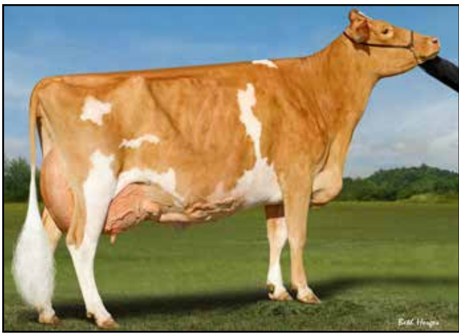
Springhill Kojack Unique-ETV EX-94 2E 5-07 335D 2X 23,800M 5.2% 1,236F 3.7% 881P All-American Sr. 3-Year-Old 2019 Dam of Lot 82