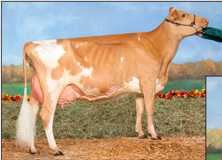
Knapps Fame Jadria-ET EX-92 Jr. All-American Sr. 3 Year Old 2016 (Maternal Sister to Dam of Lot 58 - substitution)