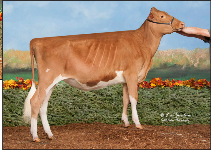
Wapsi-Ana Drone Jaded Jr. All-American Summer Yearling 2022 (Maternal Sister to Lot 58 -substitution)