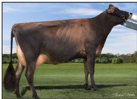
PVF Chrome Reeve-ET EX-91 (Maternal Sister to Granddam of Lot 64)