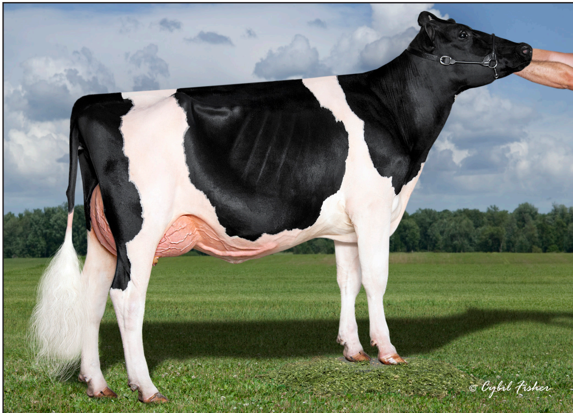
Hobby-Hill Atwood Gibler EX-91 EX-MS (Dam of Lot 10 - Substitution)