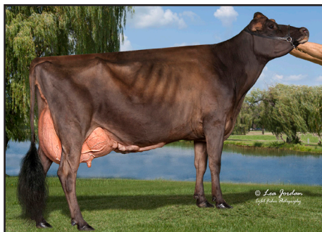
Circlehawk Kyros Rizzo of PVF EX-94 (Third Dam of Lot 64)