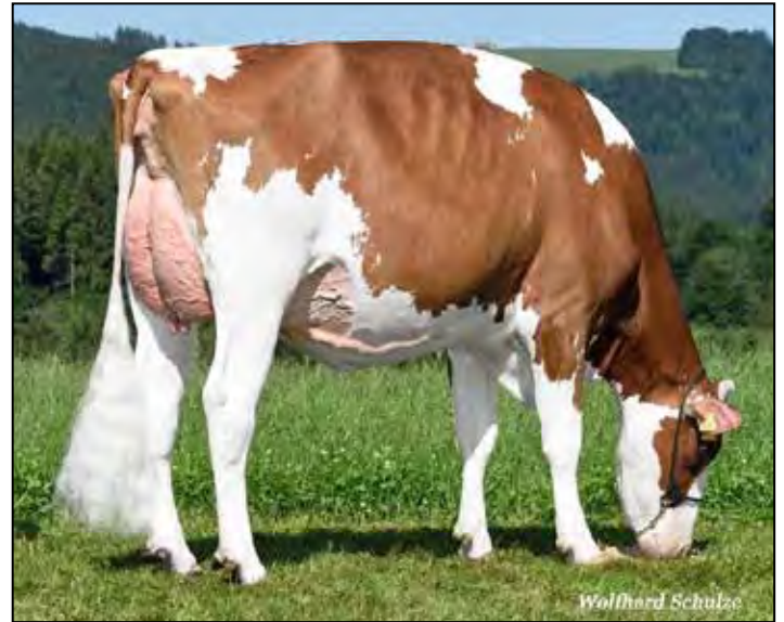
GARAY AWESOME BARBARA-RED-ET EX-92 94-MS FULL SISTER TO LOT 5