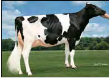
WOODEDGE JORDY TASTYKAKE EX-92