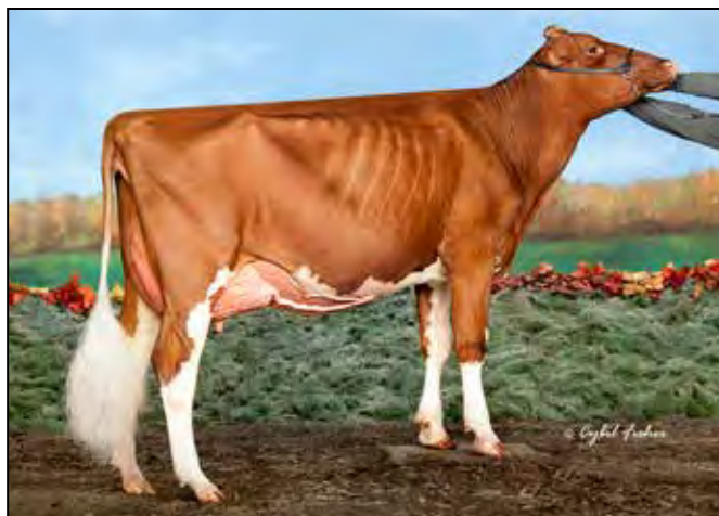
MS DB INFINITY-RED EX-90 MATERNAL SISTER TO LOT 30