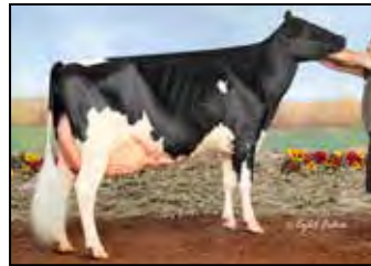
FOXMONT-J GOLDWYN DENA-ET 2E-94 ALL-PA 5-YR-OLD 2018