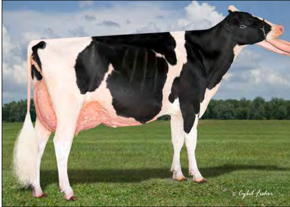
SIEMERS PURE K-ANNA EX-95 EEEEE 2E 2ND DAM OF LOT 40