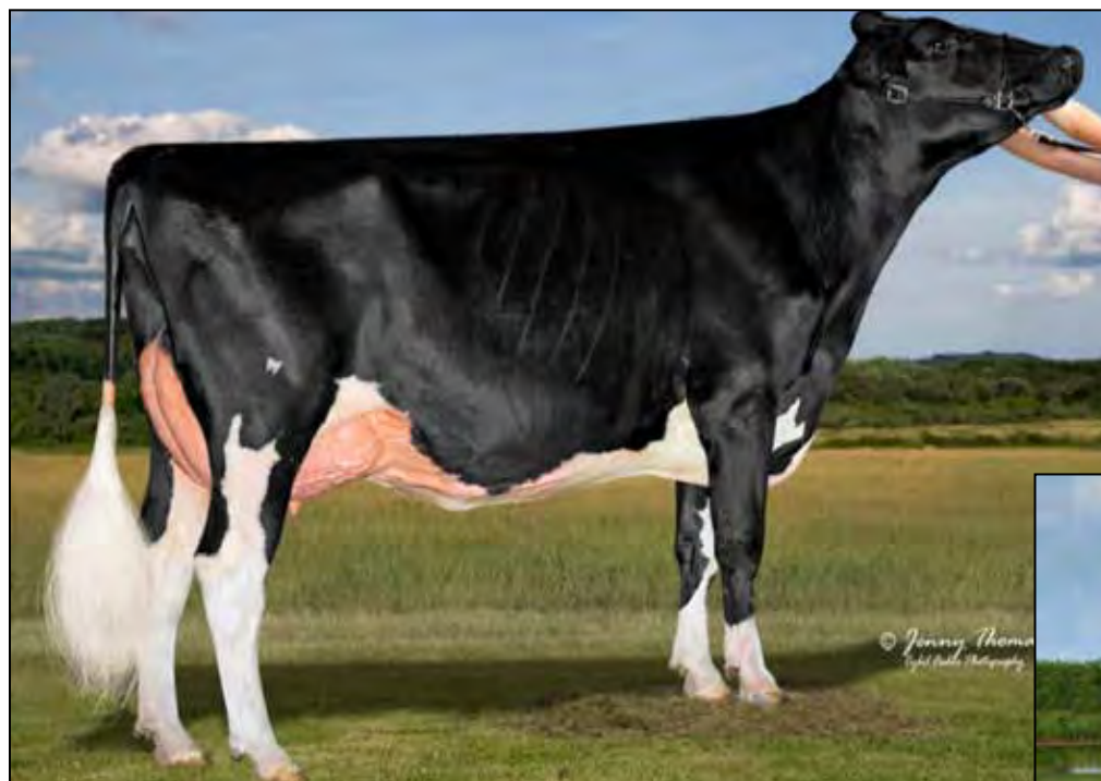
MS CAMPBELL-RUN HEZ KORA EX-92 MATERNAL SISTER TO LOT 22

Pennsylvania Holstein Convention Sale THE PLACE TO BE IN 2023!