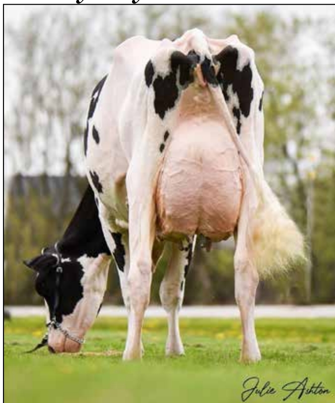
OCD DELTA MISSY 4212-ET EX-94 EX-MS 2E 2ND DAM OF LOT 25