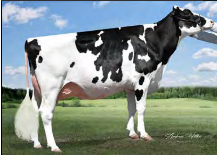
SHEEKNOLL DOORMAN ASPIRE-ET EX-92 EX-MS DAM OF LOT 13