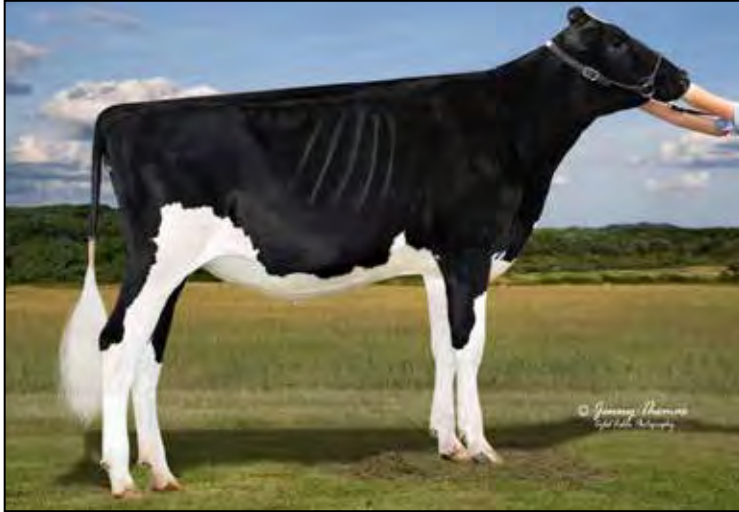
LONDONDALE DIAMOND EMOJI-ET MATERNAL SISTER TO LOT 41

Pennsylvania Holstein Convention Sale THE PLACE TO BE IN 2023!