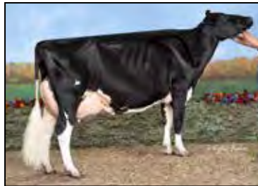
PENWOOD TROY KALAHARI EX-93 EX-MS 3E FULL SISTER TO 3RD DAM OF LOT 55 & 2ND DAM OF LOT 56

840003236453351 99%RHA-I Born: March 31, 2022 • Herd No. 710