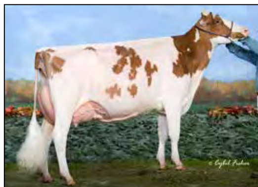
SILVERMAINE ADV TALLY-RED-ET EX-93 EX-MS 2E 2ND DAM OF LOT 37