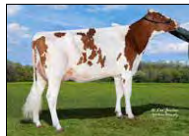
PHEASANT-ECHOS TRILL-RED-ET GP-83 @ 2-02 DAM OF LOT 49A