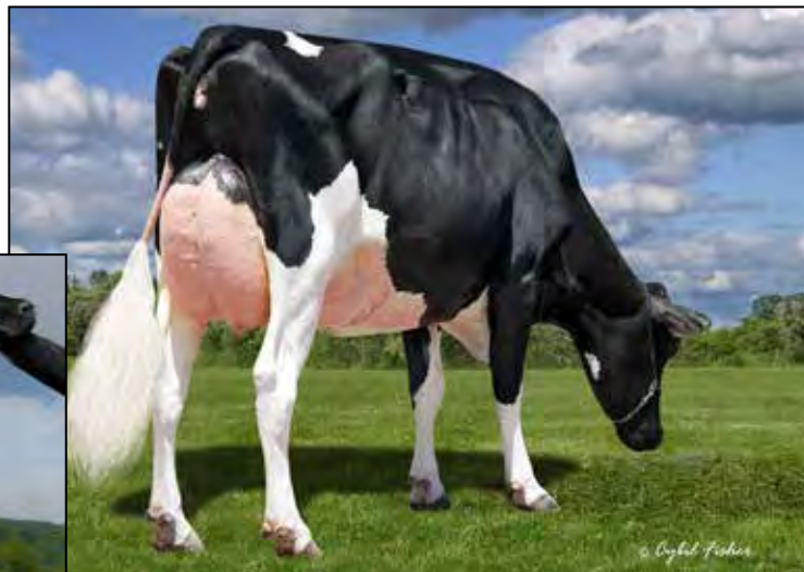
OAKFIELD GOLDWYN DAISY-ET EX-94 EEEEE DAM OF LOT 46