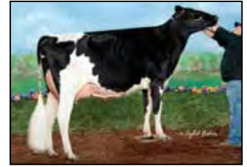
PENNWOOD BROKAW TIANA EX-94 RES JR ALL-AMERICAN SR 3-YR-OLD 2016