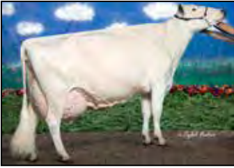
PENNWOOD LEADER ROCKLYN 3E-95 HIGHEST SCORED COW AT PENNWOOD