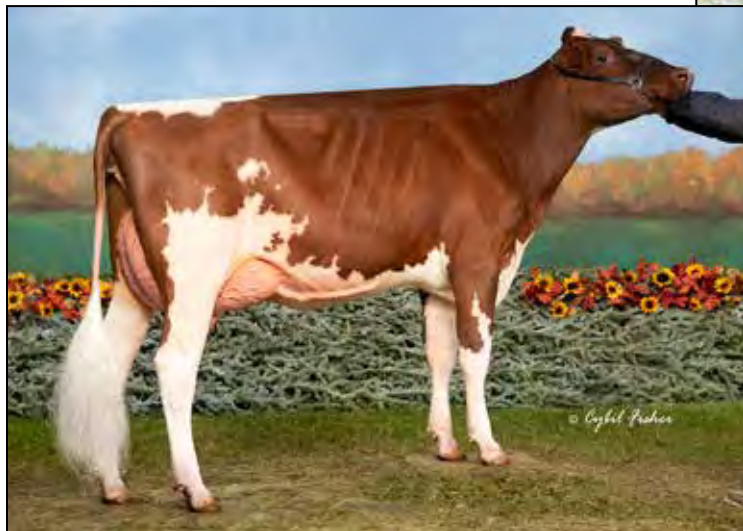
CHERRY-LOR US ROBUST-RED-ET VG-86 VG-MS @ 1-10 SAME FAMILY AS LOT 7