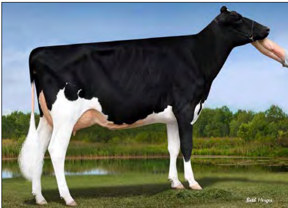
MS DOORMAN LYSETTE-ET EX-94 EEEEE 2E 2ND DAM OF LOT 43

Pennsylvania Holstein Convention Sale THE PLACE TO BE IN 2023!