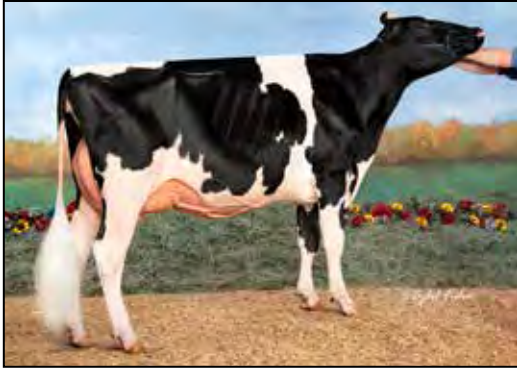
CHEERS AVALNCHÉ CHEYENNE-ET VG-88 VG-MS @ 2-09 DAM OF LOT 14

Pennsylvania Holstein Convention Sale THE PLACE TO BE IN 2023!