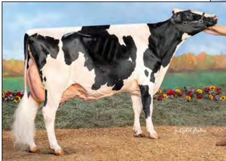
CURR-VALE DIAMONDBACK ADA-TW EX-91 EX-MS DAM OF LOT 47

Pennsylvania Holstein Convention Sale THE PLACE TO BE IN 2023!