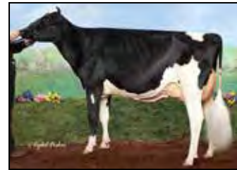
PENNWOOD GLD CHIP MADISON EX-91 RES INT CHAMP NYSS 2016