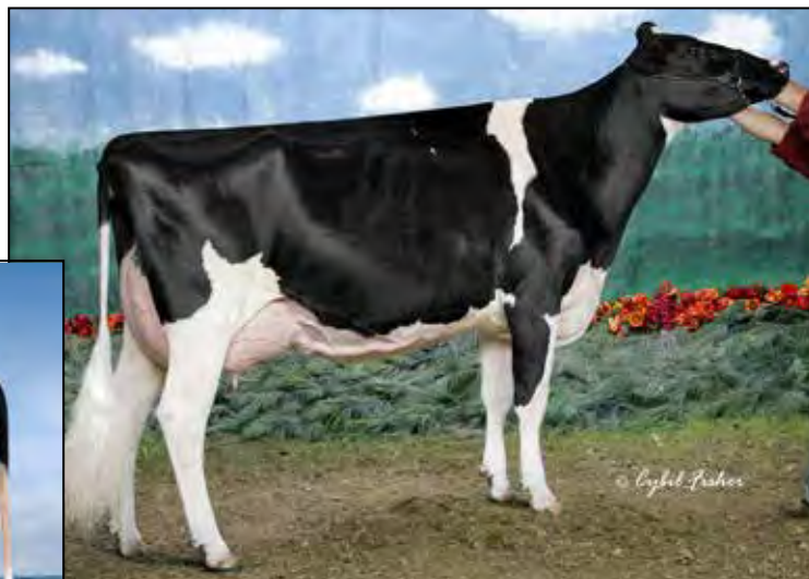
MD-DELIGHT DURHAM ATLEE-ET EX-92 GMD DOM 6TH DAM OF LOT 24