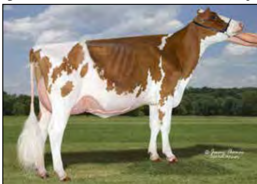
MDHILLBROOK INSTAGRAM-RED VG-88 MATERNAL SISTER TO LOT 30

Pennsylvania Holstein Convention Sale THE PLACE TO BE IN 2023!