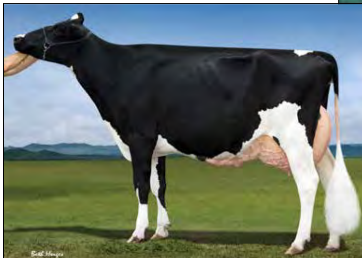
VT-POND-VIEW GOLD APRIL-ET EX-93 EX-MS 2E 4TH DAM OF LOT 24

Pennsylvania Holstein Convention Sale THE PLACE TO BE IN 2023!