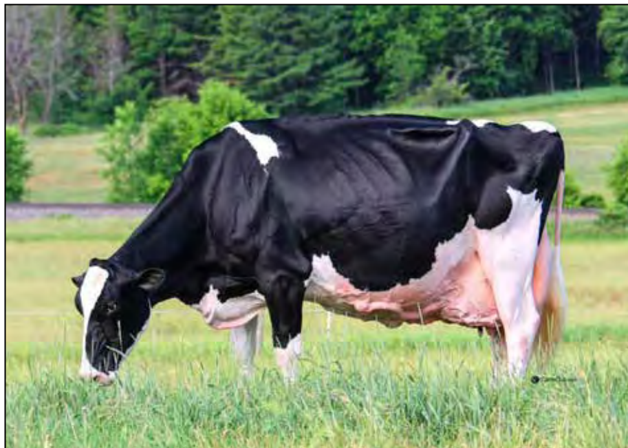
BLONDIN GOLDWYN SUBLIMINAL-ETS EX-97 EEEEE 4E 2ND DAM OF LOT 26

Pennsylvania Holstein Convention Sale THE PLACE TO BE IN 2023!