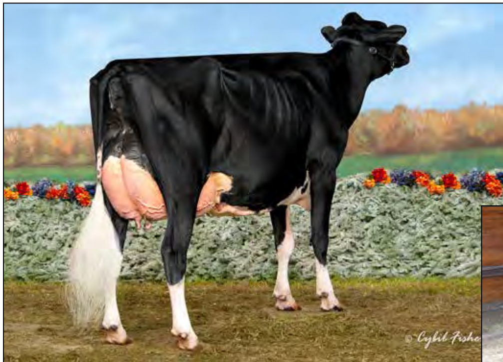
JACOBS SID BEAUTY-ET EX-95 EEEEE 3RD DAM OF LOT 48