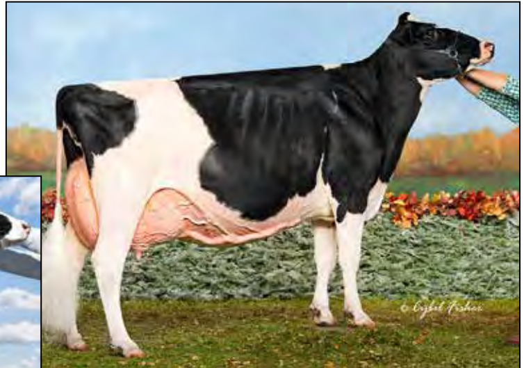
SHEEKNOLL DURHAM ARROW EX-96 EEEEE 2E 2ND DAM OF LOT 13