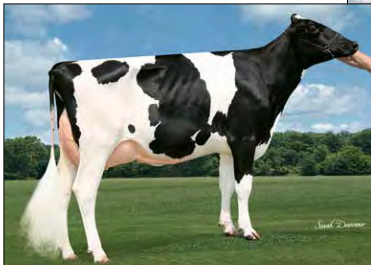
WOODEDGE JORDY TASTYKAKE EX-92 EX-MS DAM OF LOT 19