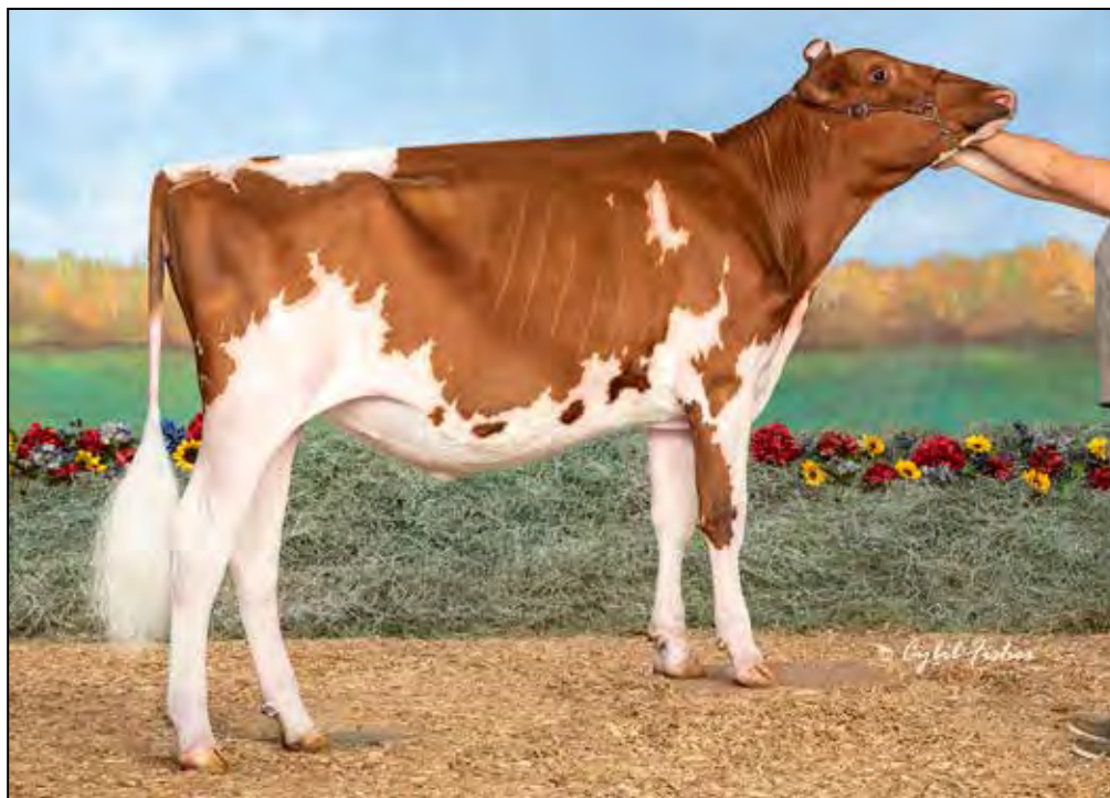
WELK-CREST DBACK CHANCE-RED SELLS AS LOT 18

Pennsylvania Holstein Convention Sale THE PLACE TO BE IN 2023!