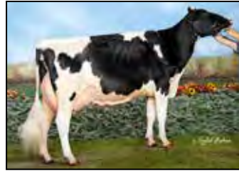
PENNWOOD DUNDEE TURNIP 2E-EX-94 3X JR ALL-AMERICAN