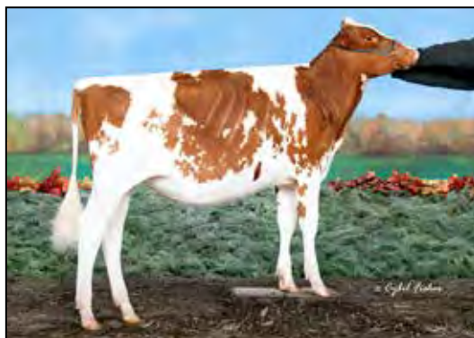
MDHILLBROOK INDABLUE-RED-ET VG-87 MATERNAL SISTER TO LOT 30