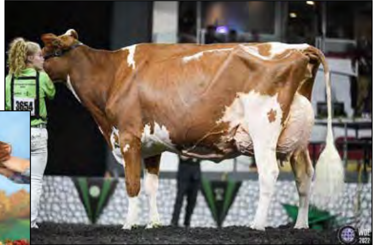
GARAY RED DIAMOND-RED-ET EX-91 EX-MS DAM OF LOT 6