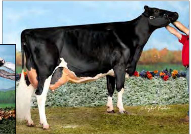
PIERSTEIN DAMION LINDSAY-ET EX-94 EEEEE DAM OF LOT 45