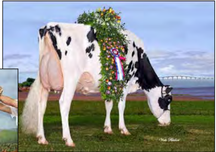
IDEE WINDBROOK LYNZI EX-95-CAN 2E MATERNAL SISTER TO LOT 36