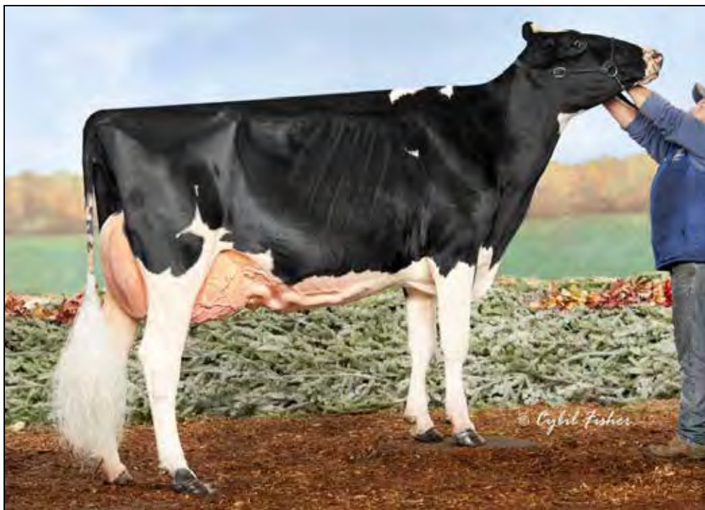
COMESTAR HOPRA ATWOOD-ET EX-93 EX-MS DAM OF LOT 53

Pennsylvania Holstein Convention Sale THE PLACE TO BE IN 2023!