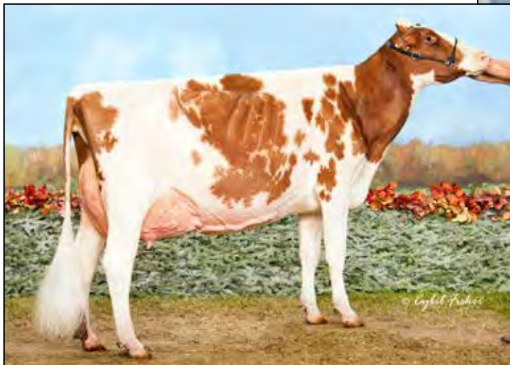
KEVETTA RDBURST LUCIOUS-RED EX-94 EEEEE 2ND DAM OF LOT 27