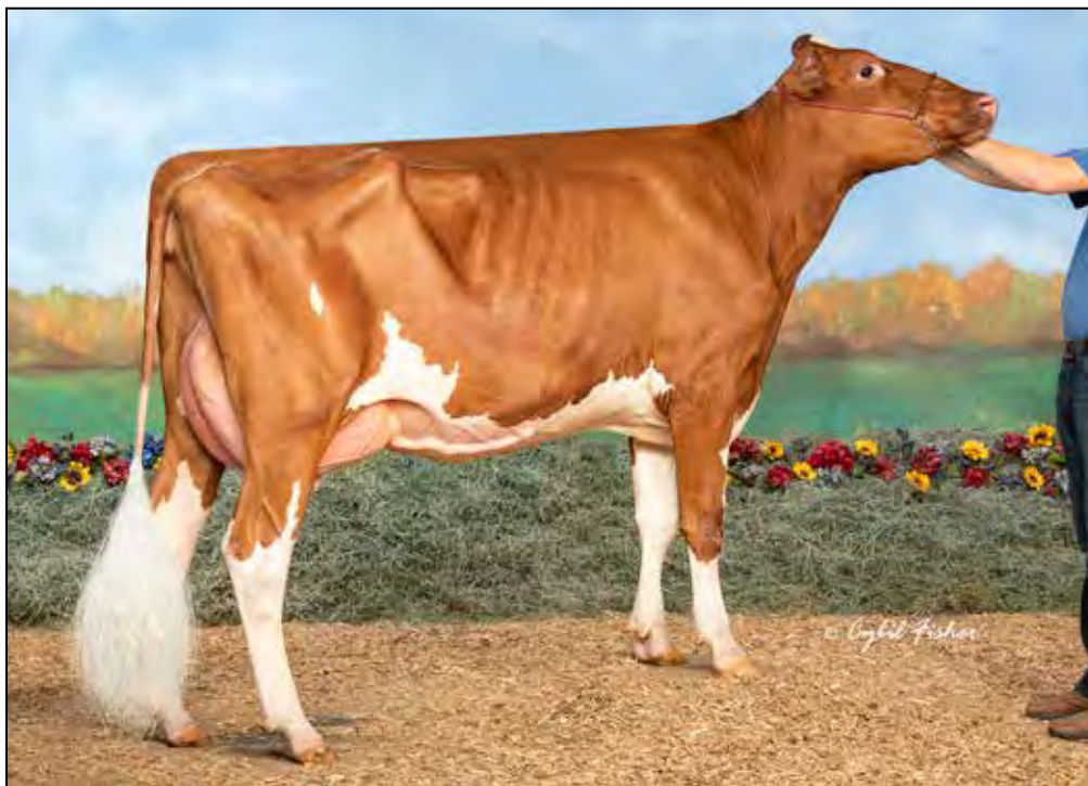
GOLDEN-ROSE WR LETMEWIN-RED VG-87 VG-MS @ 2-08 DAM OF LOT 50