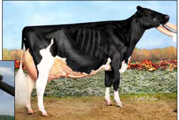
ROSIER BLEXY GOLDWYN-ET EX-97 EEEEE 3E 2ND DAM OF LOT 3 & 4