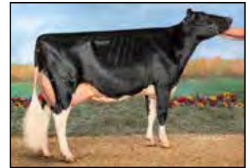
ALL-GLO CORVETTE KOOP EX-90 ALL-PA 5-YR-OLD 2022 GRANDDAUGHTER OF KALAHARI

PICK FIVE OUT OF TWENTY-TWO HEAD OF HAND SELECTED 1ST & 2ND CALF COWS. PENNWOOD HAS BEEN BREEDING REGISTERED HOLSTEINS SINCE 1963. THEY'VE BRED OVER 200 EXCELLENT COWS TO DATE. MULTIPLE ALL-AMERICAN & JR ALL-AMERICAN HONOREES ALONG WITH COUNTLESS ALL-PA AND JR ALL-PA BRED HERE!