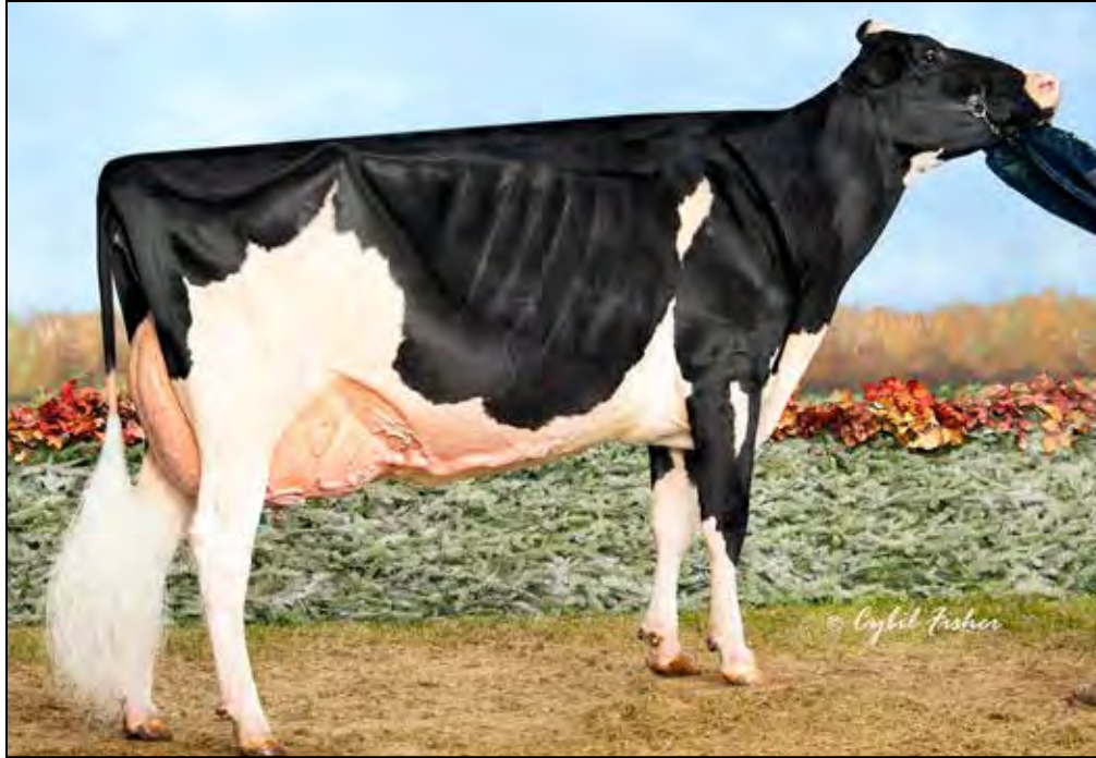
PETITCLERC GOLDWYN ANOUK-ET EX-93-CAN 2ND DAM OF LOT 28

Pennsylvania Holstein Convention Sale THE PLACE TO BE IN 2023!