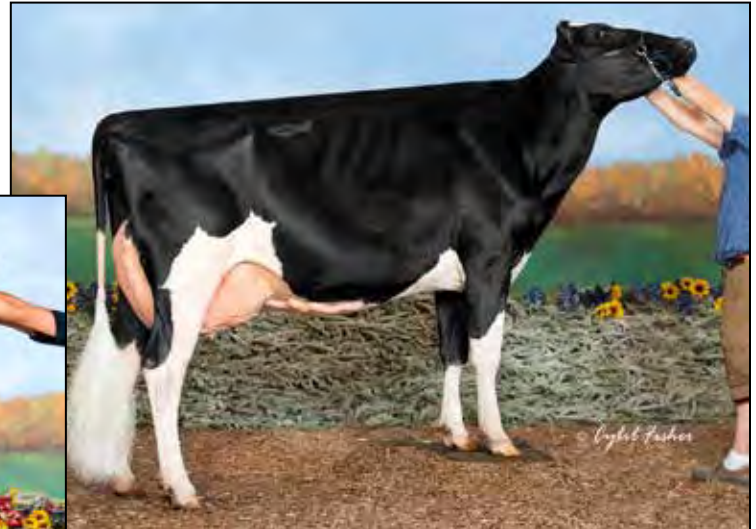
RAN-CAN ALEXANDER CLAIR-ET EX-92 94-MS 2E 3RD DAM OF LOT 51