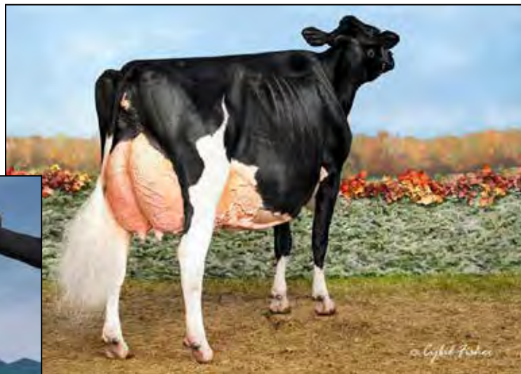
ROSIER BLEXY GOLDWYN-ET EX-97 EEEEE 3E 2ND DAM OF LOT 3 & 4