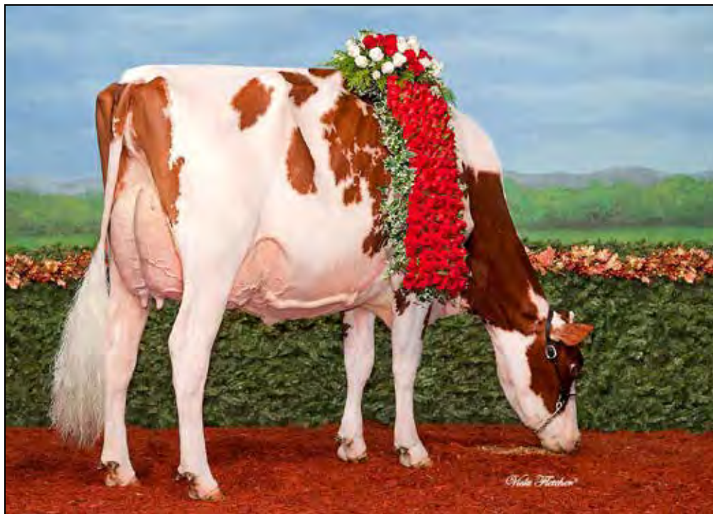
L-MAPLES HVEZDA CALLI-RED EX-94 EEEEE MATERNAL SISTER TO LOT 31