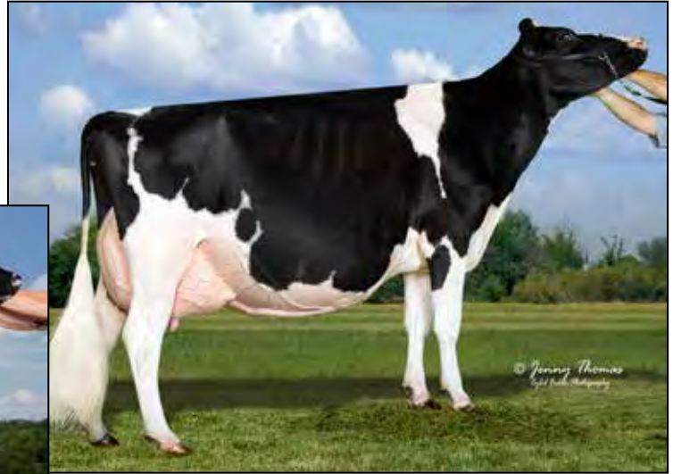
T-TRIPLE-T DUNDEE PAIGE EX-96 EEEEE 3E 3RD DAM OF LOT 11 & 42 2ND DAM OF LOT 12