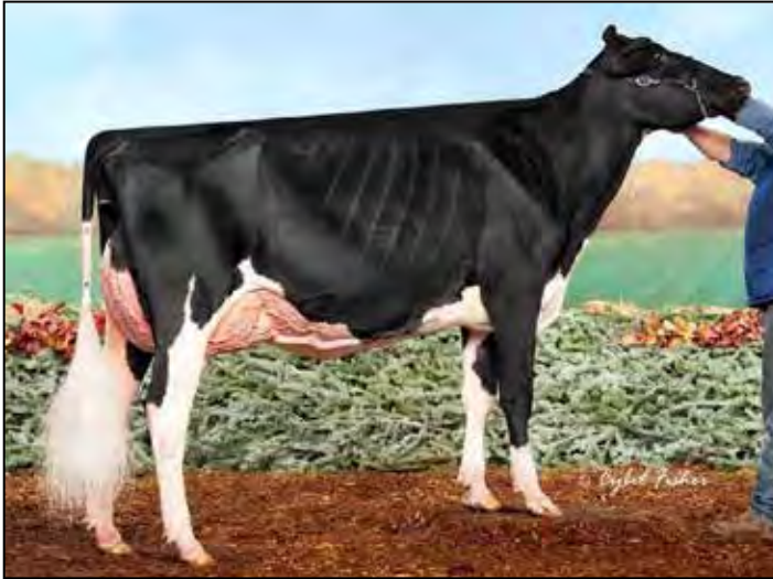
GARAY AWESOME BEUTY-ET VG-88-CAN FULL SISTER TO LOT 5