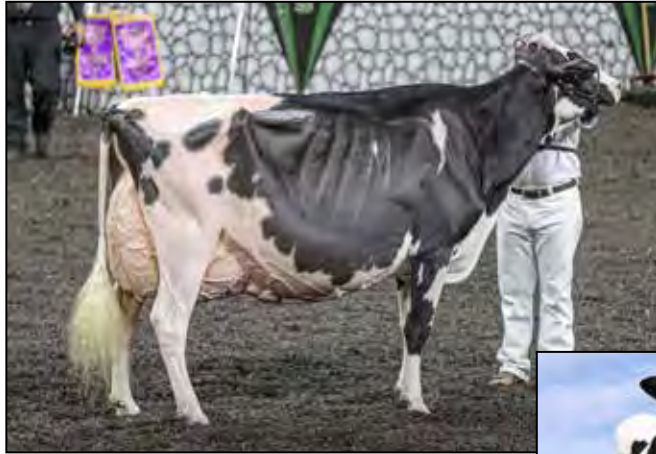
OAKFIELD SOLOM FOOTLOOSE-ET EX-96 98-MS 2ND DAM OF LOT 2