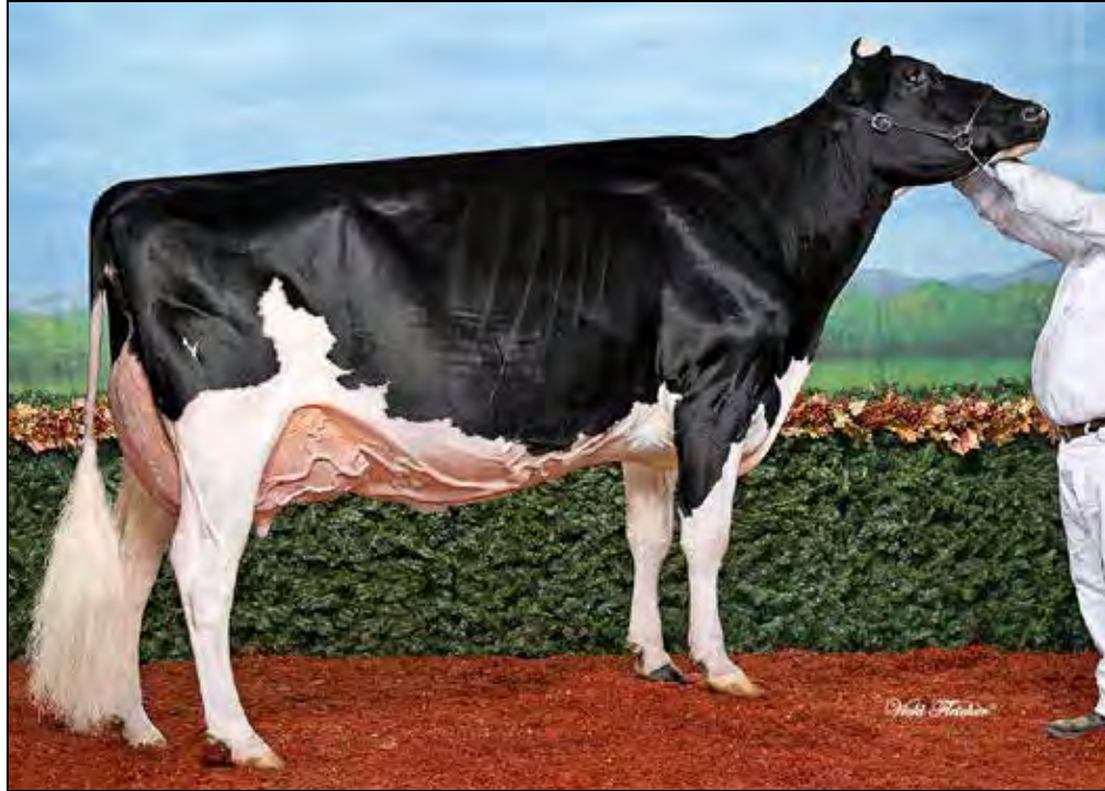
LOYALYN GOLDWYN JUNE EX-97-CAN 6E 2ND DAM OF LOT 21