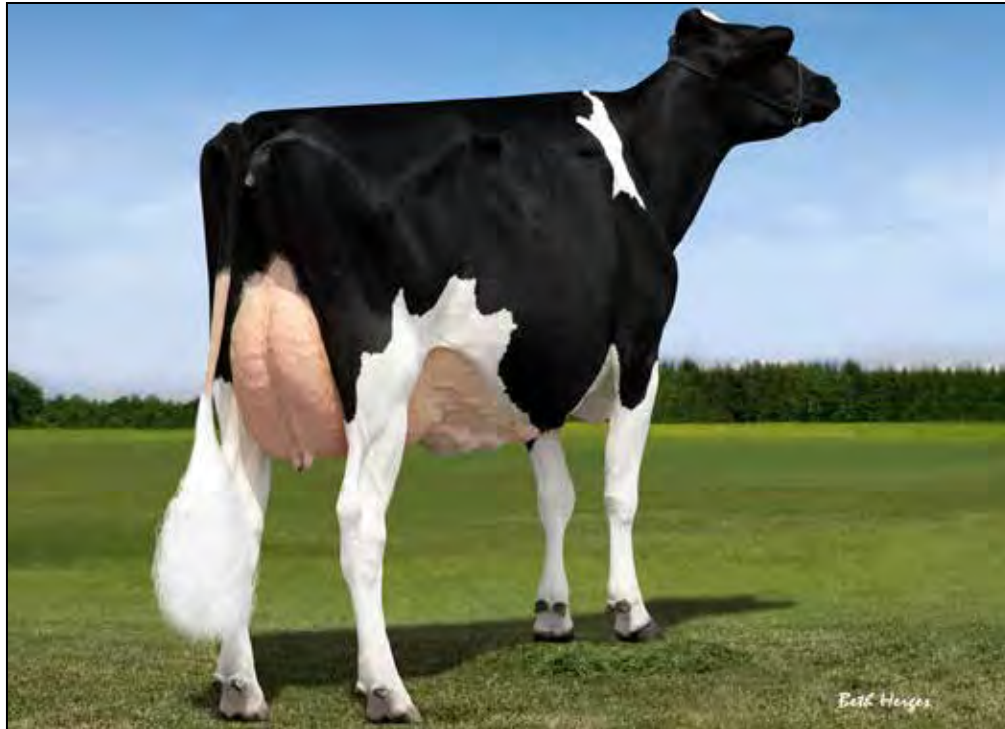
LYLEHAVEN ATWOOD LYLly-ET EX-95 EEEEE 3E DAM OF LOT 33 & 34