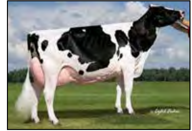
DUBEAU DUNDEE HEZBOLLAH EX-92