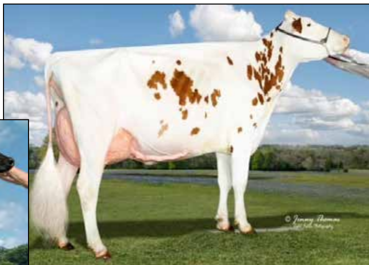
MS AWESOME JEALOUSY-RED EX-94 MATERNAL SISTER TO 2ND DAM OF LOT 19