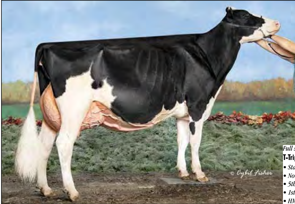
T-TRIPLE-T PETUNIA-ET EX-95 EEEEE 2E DAM OF LOT 12

Pennsylvania Holstein Convention Sale THE PLACE TO BE IN 2023!