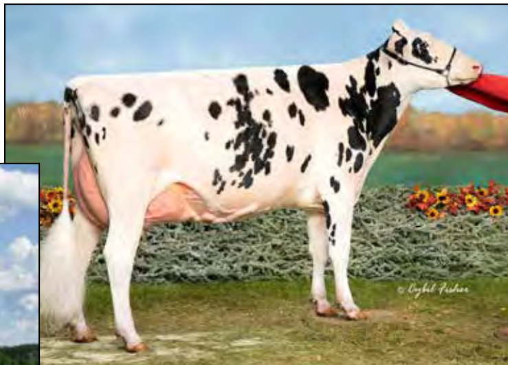
M-RIVERVIEW GOLD CHIP ANDIE EX-91 EX-MS DAM OF LOT 23