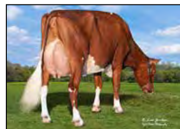
TERRA-ROSE PENELOPE-RED-ET EX-90 EX-MS 2ND DAM OF LOT 49B

840003137017967 Excellent-90 EX-MS 3-11 2x 299d 24961 4.3 1078 3.3 825 3-00 2x 293d 22959 4.4 1053 3.4 799 1-11 2x 267d 15047 4.3 642 3.3 502 • 3X Grand Champ PA Farm Show 20, 22 & 23 • 2nd 4-Yr-Old All-American R&W Show 2022