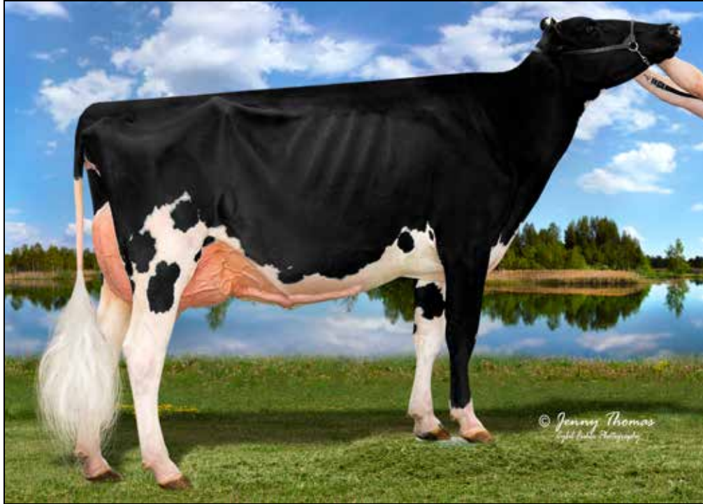
ALL-GLO REGINALD KALLIE-ET EX-93 EX-MS 2E DAM OF LOT 56

Pennsylvania Holstein Convention Sale THE PLACE TO BE IN 2023!