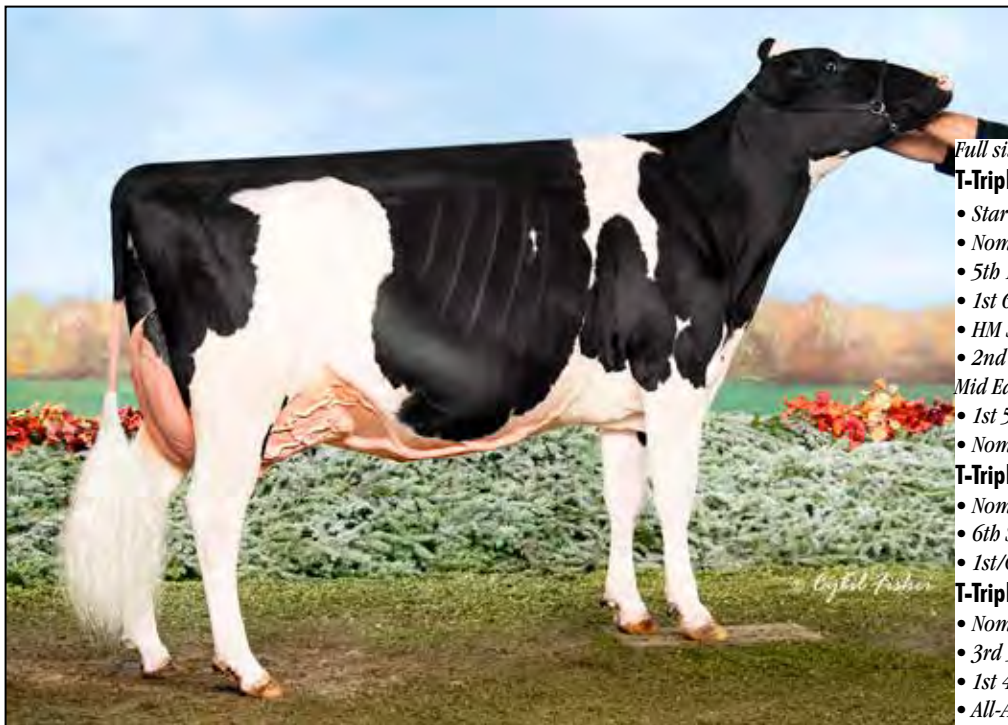
T-TRIPLE-T PHANTOM EX-92 EX-MS DAM OF LOT 42