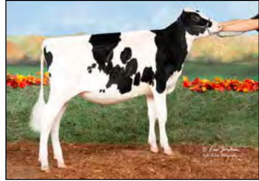
KOZY-KOUNTRY J CHESAPEKE MATERNAL SISTER TO LOT 14