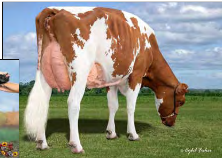
CURR-VALE ABS ADORED-RED-ET EX-94 MATERNAL SISTER TO 2ND DAM OF LOT 47