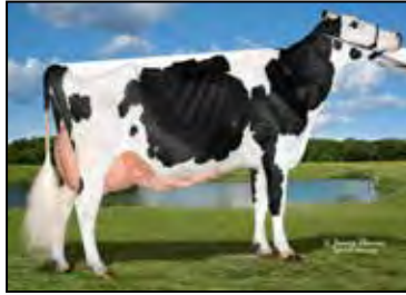
LIN-RO REDBURST JEN 94-3E 7TH GENERATION EX-94 OR HIGHER