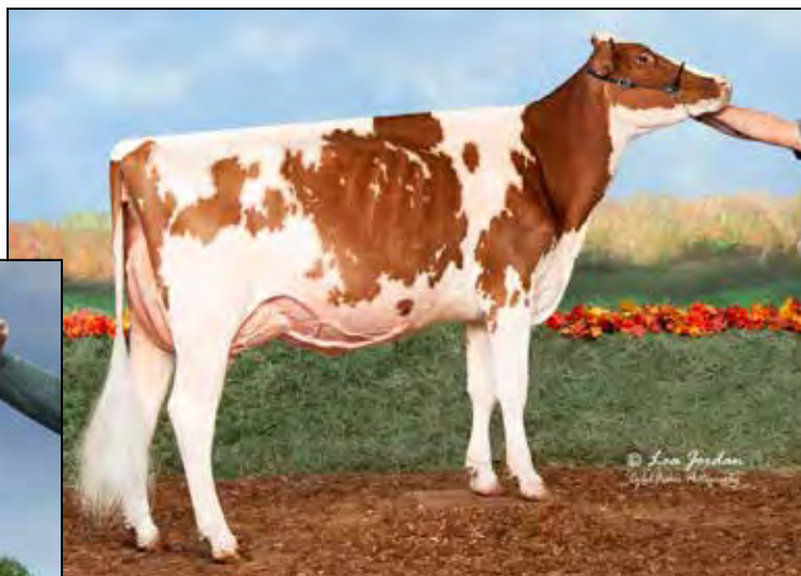
MS ANDRINGAS LIGHT-RED-ET VG-88 EX-MS @ 2YRS MATERNAL SISTER TO LOT 15