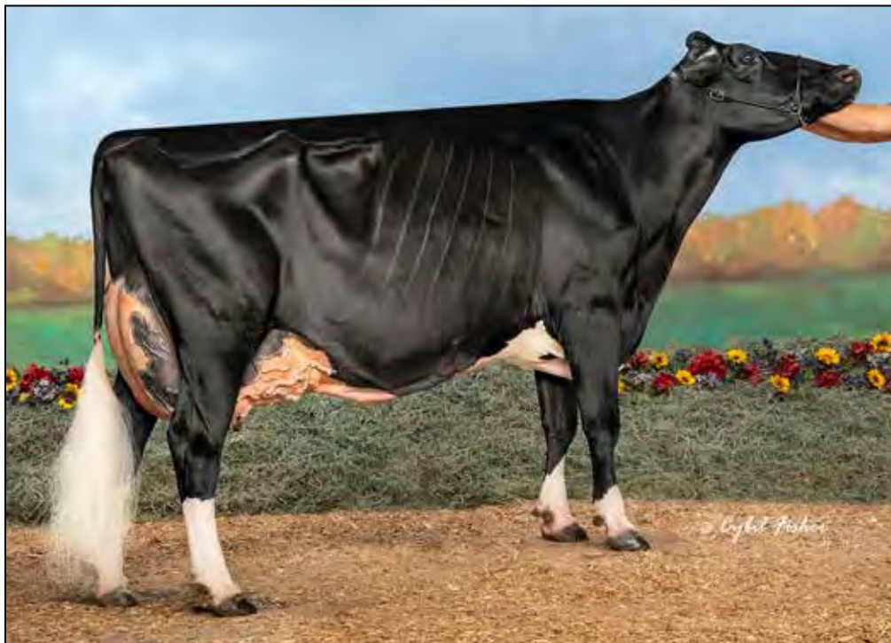
LUCK-E DIAMOND ALLURE-ET EX-94 EEVEE 2E DAM OF LOT 20

Pennsylvania Holstein Convention Sale THE PLACE TO BE IN 2023!