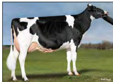
BUDJON-VAIL AW SARA JEAN-ET EX-92 EX-MS 2E DAM OF LOT 26