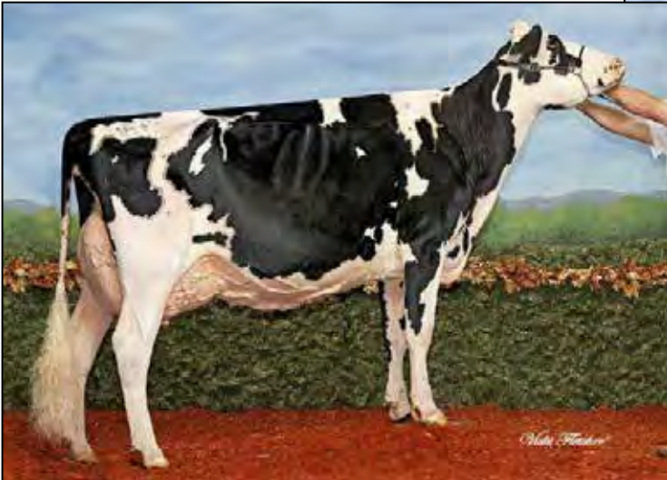
IDEE GOLDWYN LUCIA-ET EX-92-CAN DAM OF LOT 36