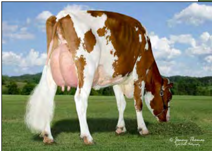
M-RIVERVIEW AUDRA-RED-ET EX-93 EX-MS MATERNAL SISTER TO 3RD DAM OF LOT 23