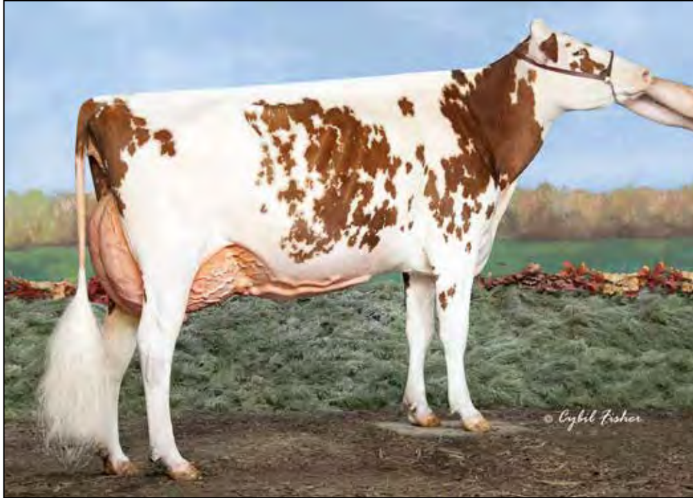
L-MAPLES DFNT CASSEY-RED-ET EX-93 EX-MS DAM OF LOT 32

Pennsylvania Holstein Convention Sale THE PLACE TO BE IN 2023!