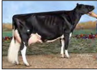
PENNWOOD TROY KALAHARI 3E-93 HM JR ALL-AMERICAN 4-YR-OLD 2012