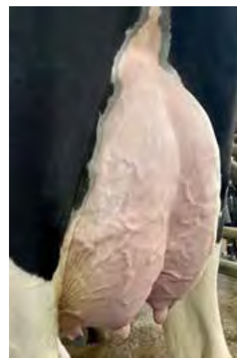
C-COVE UNIX LASO SELLS AS LOT 1