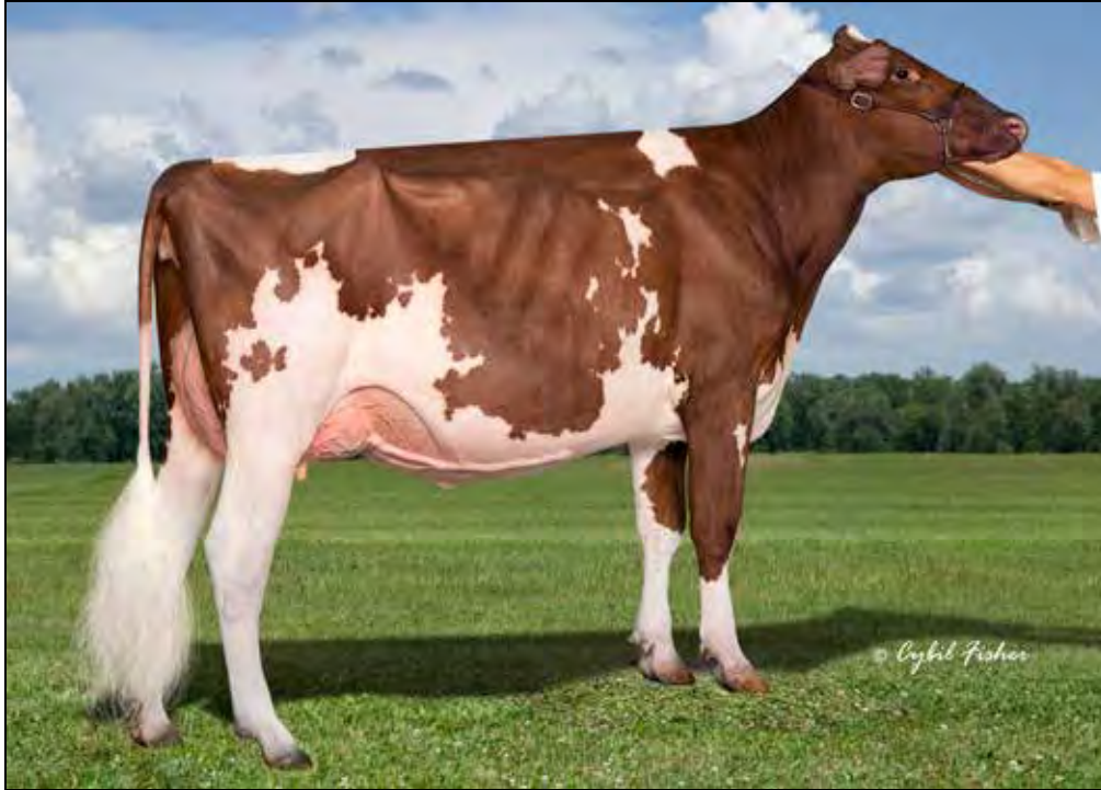
DREAM-ON HOTOFFTHEPRESS-RED VG-88 VG-MS @ 2-04 DAM OF LOT 29