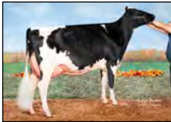
ALL-GLO GOLD C KAPPUCCINO EX-91 RES ALL-AMERICAN WINTER CALF 2016