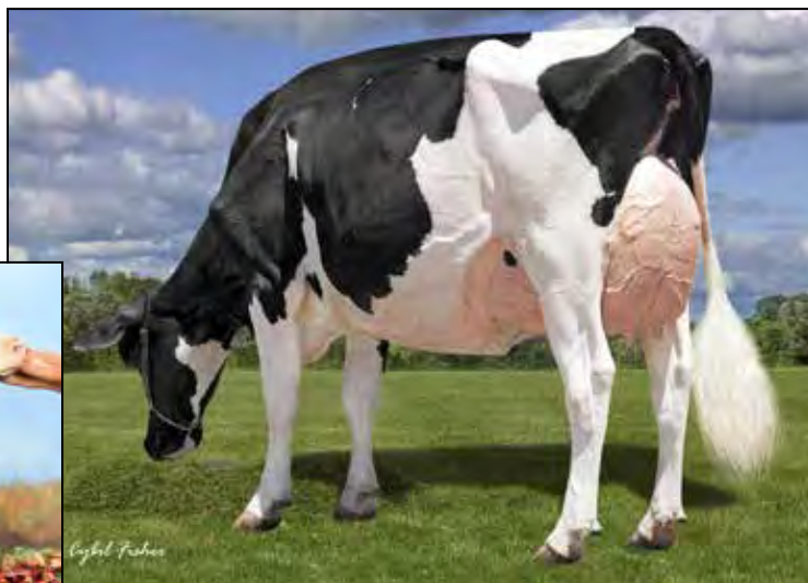
KEVETTA DANIEL LEXI EX-94 DAM OF LOT 27