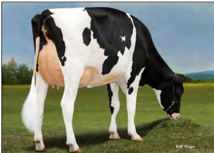
OAKFILED MOMENT MEDLEY-ET VG-86 VG-MS @ 2-01 DAM OF LOT 25