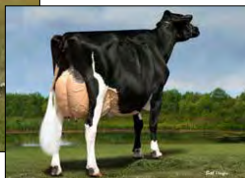
TC SANCHEZ KRISTINA EX-96 EEEEE 2E 2ND DAM OF LOT 22