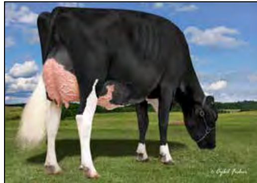
UNIQUE DEMPSEY CHEERS EX-95 96-MS 2ND DAM OF LOT 14