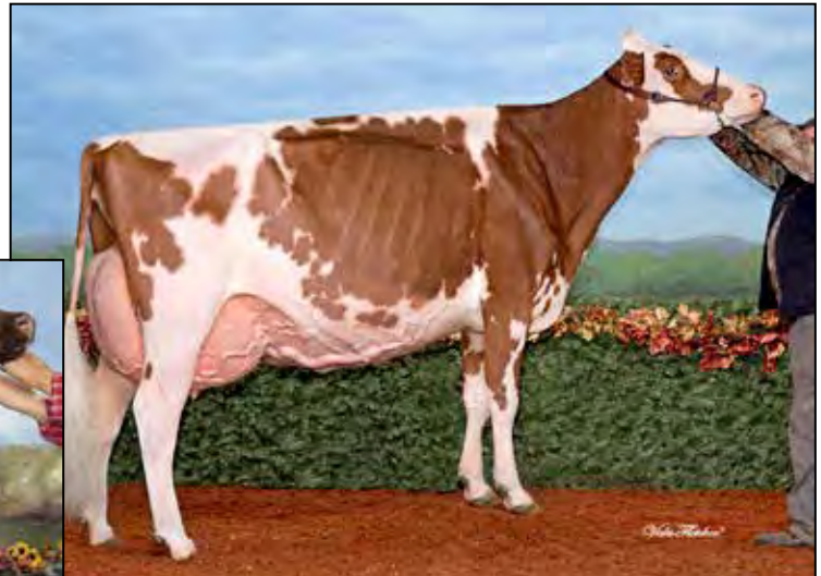
MISS APPLE SNAPPLE-RED-ET EX-96 EEEEE 2E MATERNAL SISTER TO DAM OF LOT 16