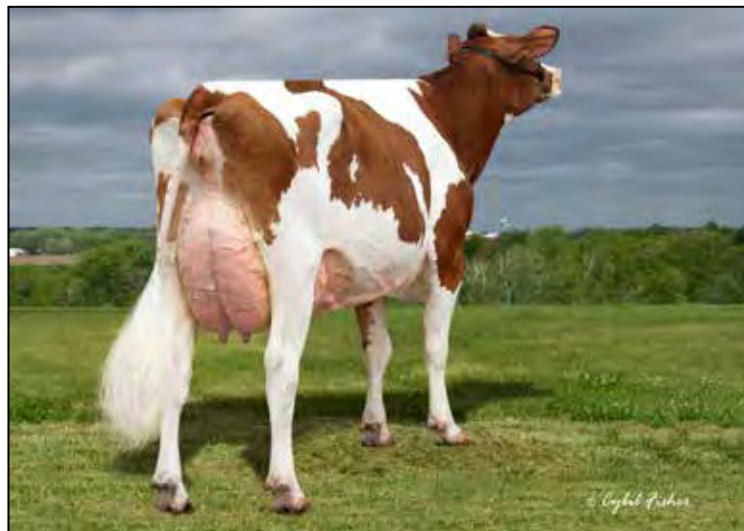
MILKSOURCE LVRG TINA-RED-ET EX-91 EX-MS DAM OF LOT 37

Pennsylvania Holstein Convention Sale THE PLACE TO BE IN 2023!