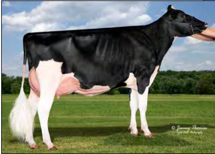
T-TRIPLE-T FEVER PITCH-ET EX-94 EEEEE 2E 2ND DAM OF LOT 11