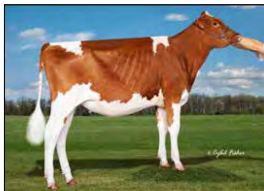
CANTATA WAR TANZANIA-RED-ET MATERNAL SISTER TO LOT 37