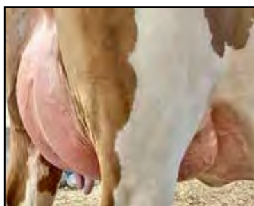
FORGE-HOLLOW PIPER-RED DAM OF LOT 49B

145489007 99%RHA-I Born: December 3, 2022 • Herd No. 32