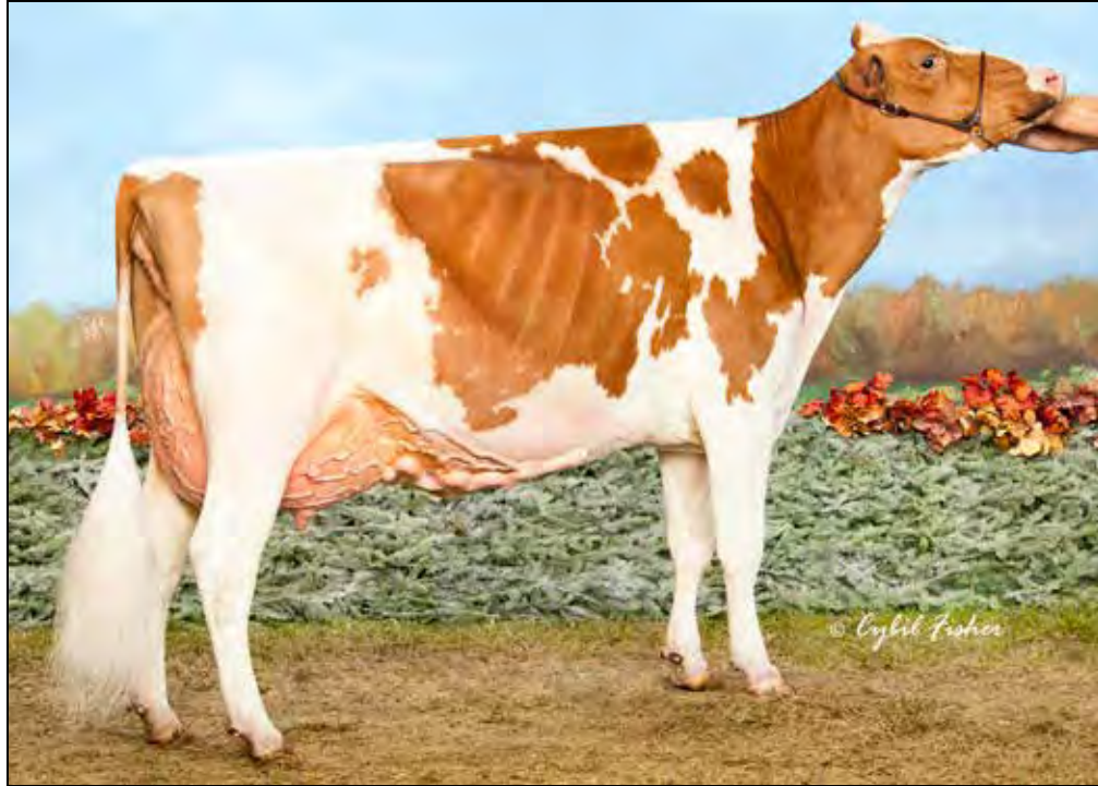
HEATHERSTONE REDHOT-RED EX-92 EX-MS DAM OF LOT 17