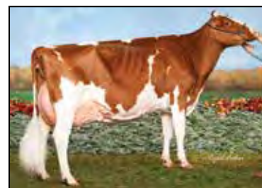
PHEASANT-ECHOS TURVY-RED-ET EX-95 EEEEE 2E 2ND DAM OF LOT 49A