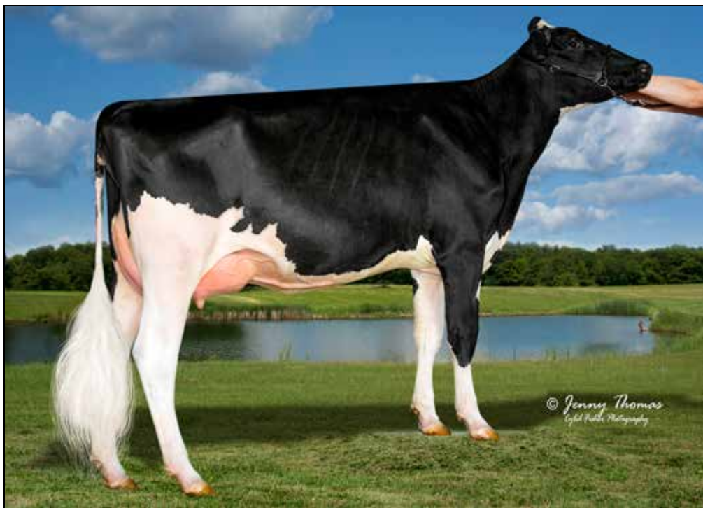
PHEASANT-ECHOS WB ARIANA-ET EX-91 EX-MS 3RD DAM OF LOT 52A & 2ND DAM OF LOT 52B