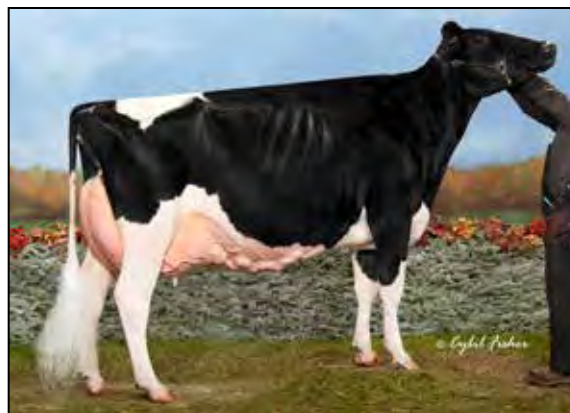
MILKSOURCE GOLDWV AFRICA-ET EX-95 96-MS 2E 3RD DAM OF LOT 39