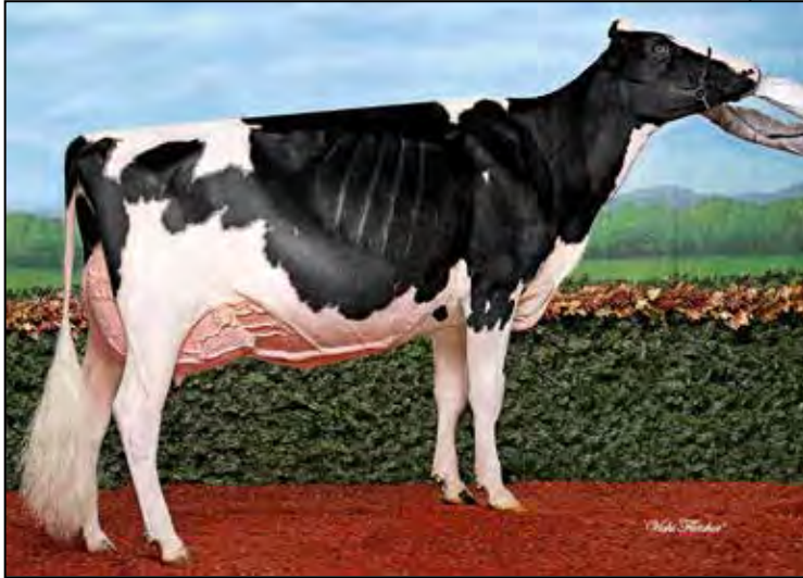
JACOBS GOLD LIANN EX-94-CAN 2E 2* MATERNAL SISTER TO DAM OF LOT 45

Pennsylvania Holstein Convention Sale THE PLACE TO BE IN 2023!