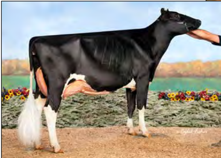
RAN-CAN CORVETTE CHEVY-ET EX-91 MATERNAL SISTER TO 2ND DAM OF LOT 51

Pennsylvania Holstein Convention Sale THE PLACE TO BE IN 2023!