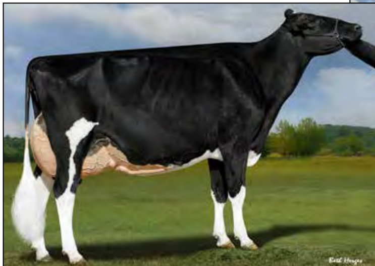
OAKFIELD GC DARBY-ET EX-95 MATERNAL SISTER TO DAM OF LOT 46