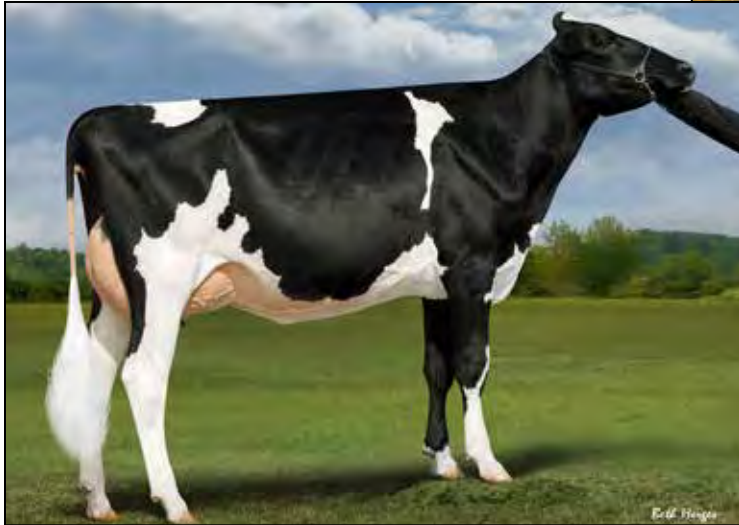
BLEXYS HIOCT BATON ROUGE-ET VG-87 VVVVV @ 2-00 DAM OF LOT 3