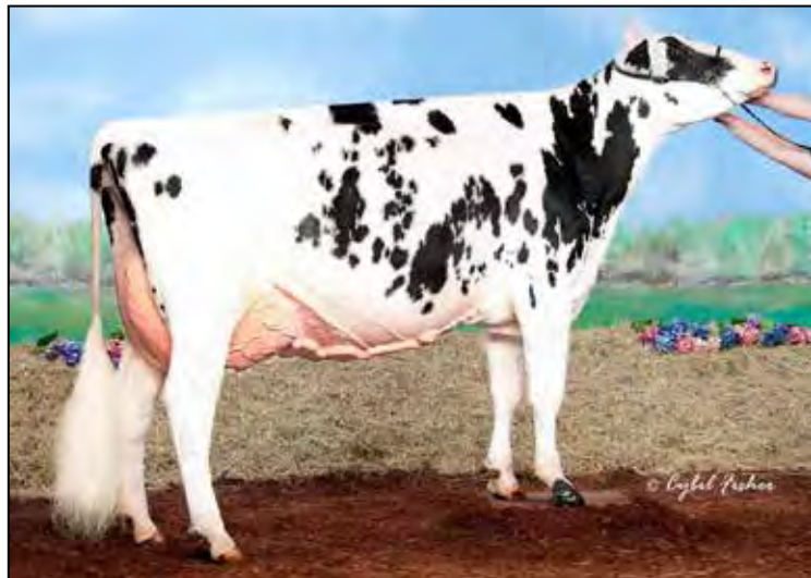
MILKSOURCE BRXTN ACCLAIM-ET EX-94 EEEEE 2E 2ND DAM OF LOT 39

Pennsylvania Holstein Convention Sale THE PLACE TO BE IN 2023!