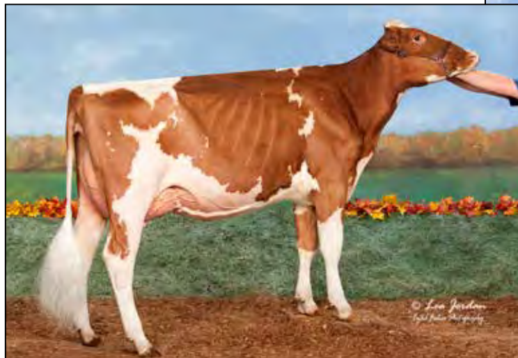
MCWILLIAMS UN REAL-RED EX-90 MATERNAL SISTER TO LOT 10

Pennsylvania Holstein Convention Sale THE PLACE TO BE IN 2023!