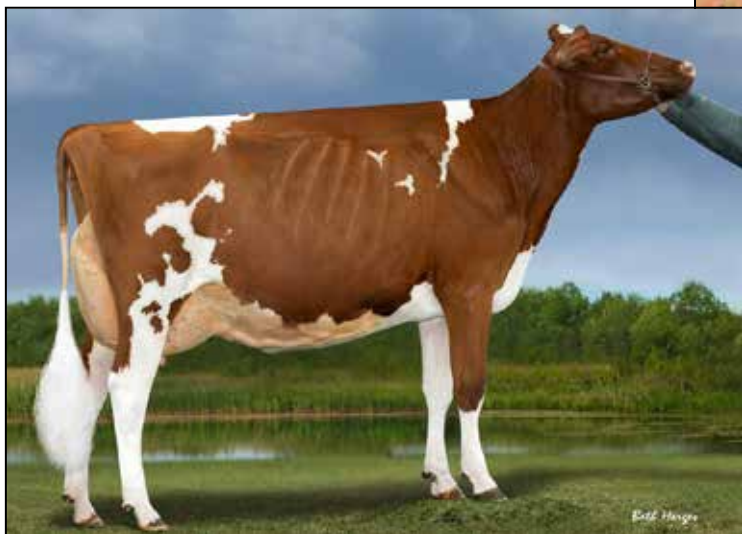
MS APPLE ANDRINGA-RED-ET EX-94 EX-MS 2E DAM OF LOT 15