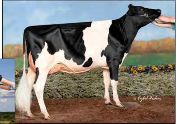
LONDONDALE JACEY ELITE EX-94 MATERNAL SISTER TO LOT 41