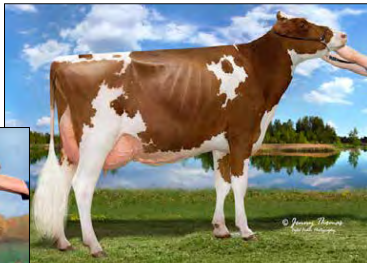
MS ACTION RONDELLA-RED-ET 2E-92 DAM OF LOT 10