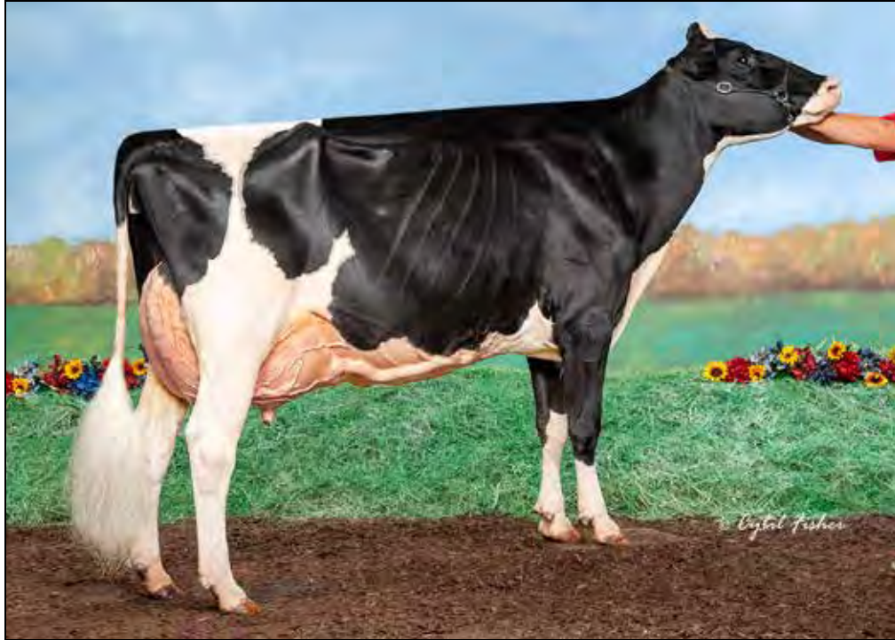
SAXTON-HILL SWEET LADY PO EX-93 EX-MS 2E DAM OF LOT 35

Pennsylvania Holstein Convention Sale THE PLACE TO BE IN 2023!