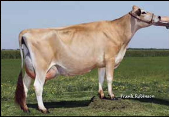
JARS OF CLAY VENERABLE 1771 2620-P EX-90% 4TH DAM OF LOT 4G