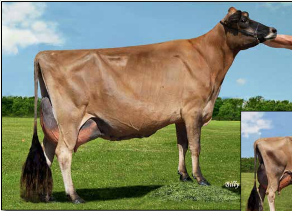
SVHEATHS COTON MONIQUE EX-95% MATERNAL SISTER TO LOT 75J 1st Senior 2-Year-Old, PA All-American 2016