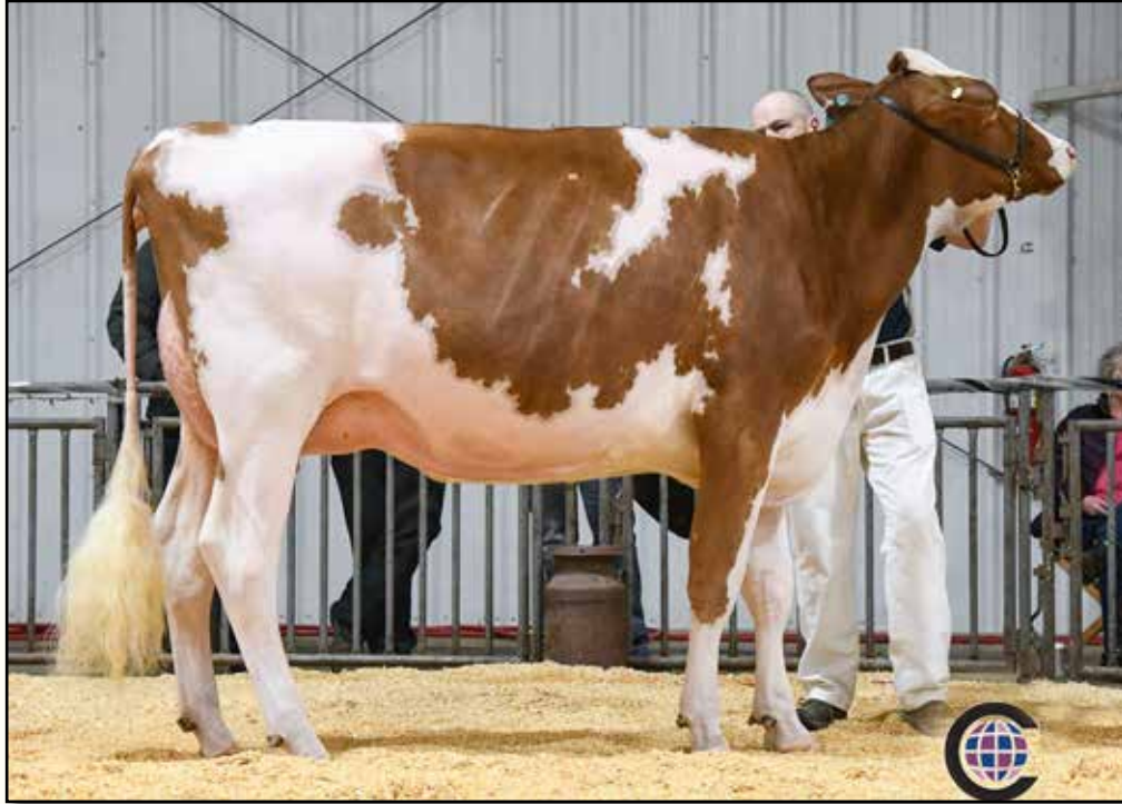
ROKEYROAD MOOVIN ARTIST-RED SELLS AS LOT 65H

Reserve Intermediate Champion, Southern Spring National 2023