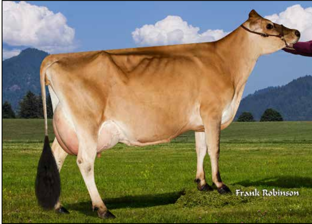
ROG-AL CHROME SHELBY EX-90% 2ND DAM OF LOT 7G