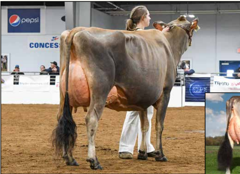
UNDERGROUND VIP MANHATTAN-ET EX-91% MATERNAL SISTER TO DAM OF LOT 76J 1st 4-Year-Old, NY Spring Show 2023