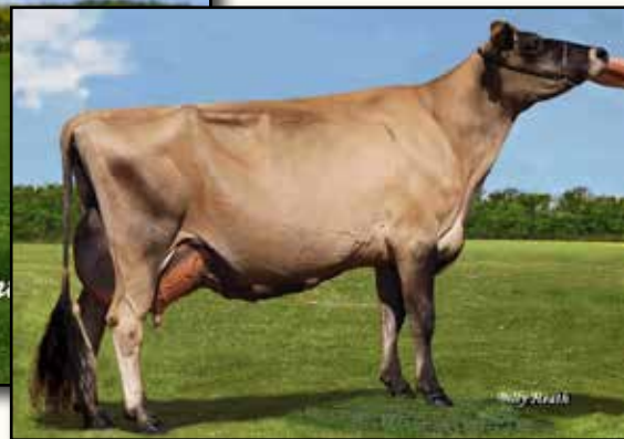
THISTLE DEW SWEETAPPLE EX-92% DAM OF LOT 77J Nominated All-Canadian Summer Yearling 2018