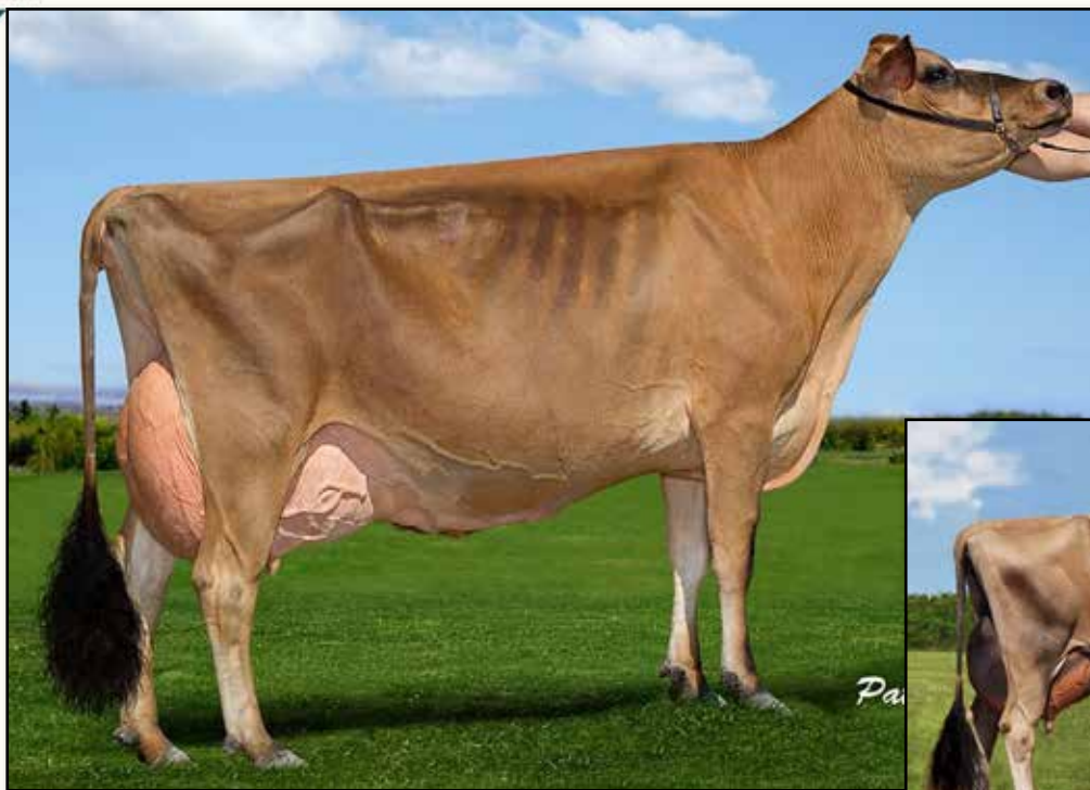
SHANTALS CGAR SHILOH EX-95-2E-CAN MATERNAL SISTER TO 3RD DAM OF LOT 77J All-Canadian Senior 2-Year-Old 2009