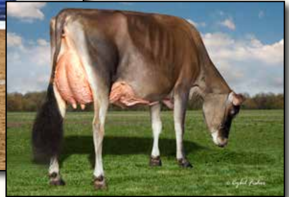
UNDERGROUND MILKSHAKES MAI TAI VG-86% MATERNAL SISTER TO LOT 76J Intermediate Champion, NY Spring Show 2021