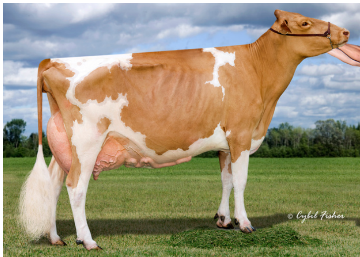
Prairie Moon Y Antebella