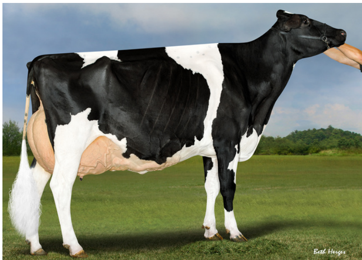
Jacobs Absolute Milou