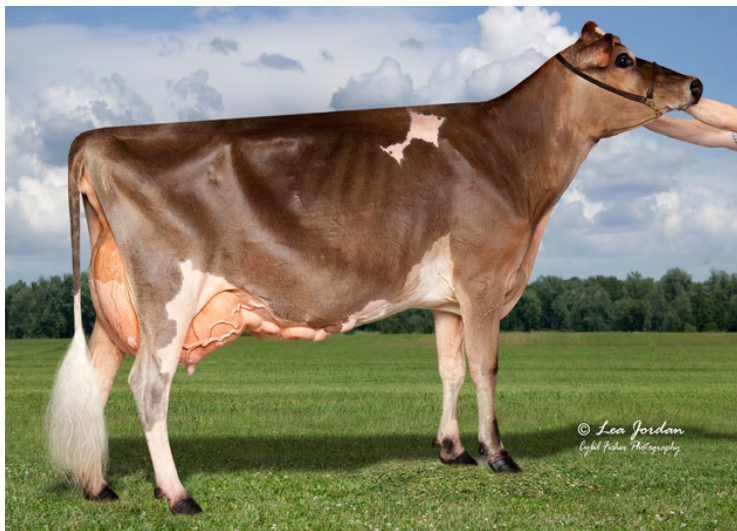
Maughlin Giller Eclipse