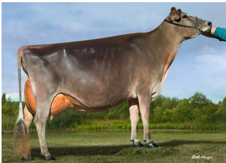
Woodmohr Marlos Divine-ET