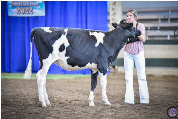
Quality-Ridge Doc Marquee