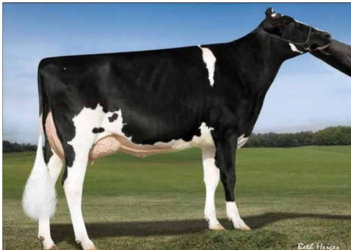
Fragrant-Rose of Rosedale