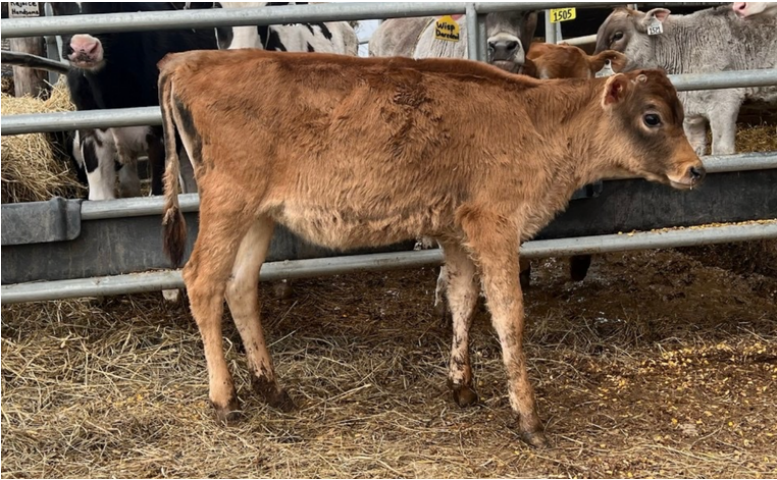
Wapsi-Ana VIP Alley