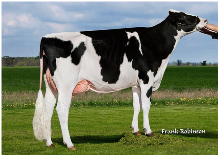
Dinomi Drman Ryley-ET