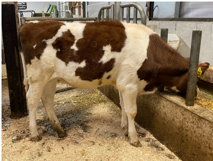
Arbor-Haven MCDLD Fancy-Red