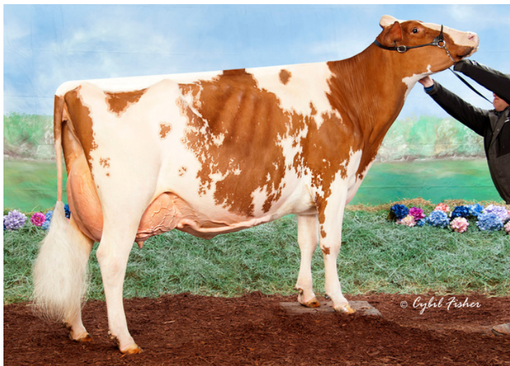
Redtag Destry Sneezey