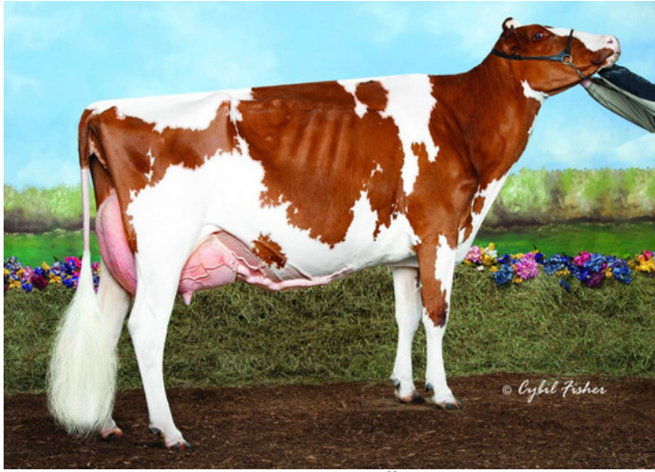
Starmark AD Hotstuff-Red-ET