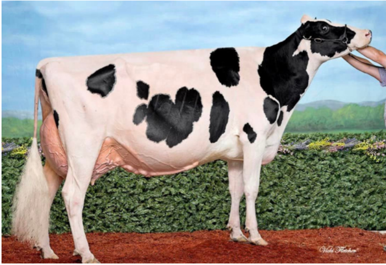
Walnutlawn McCutchen Summer