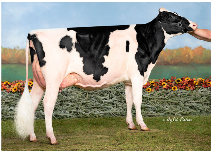
Kara-Kesh-RK Jacot Selene