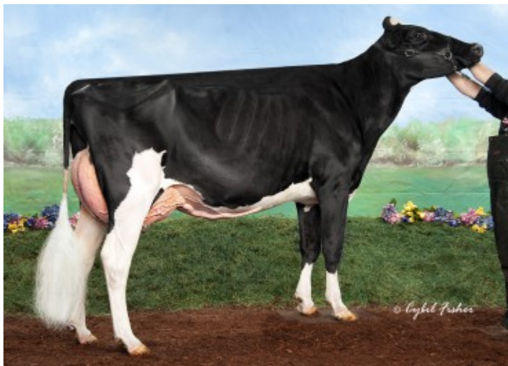
Craigcrest Rubies Rachelle