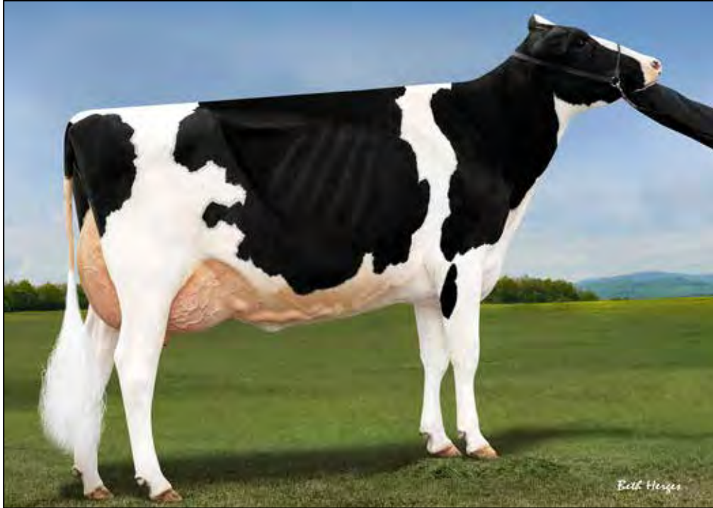
HEZ HEZBOLLAHS HONOUR-ET EX-94 DAM OF LOT 13