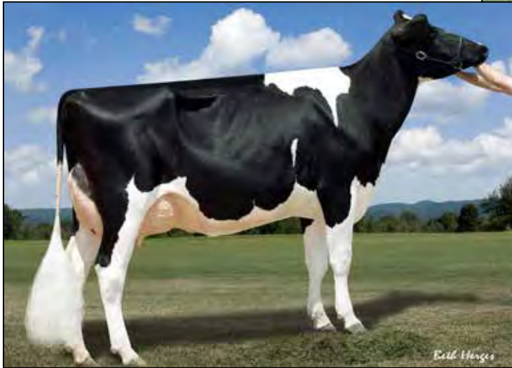
LUCK-E ADVENT BOOMERANG EX-93 MATERNAL SISTER TO 4TH DAM OF LOT 30