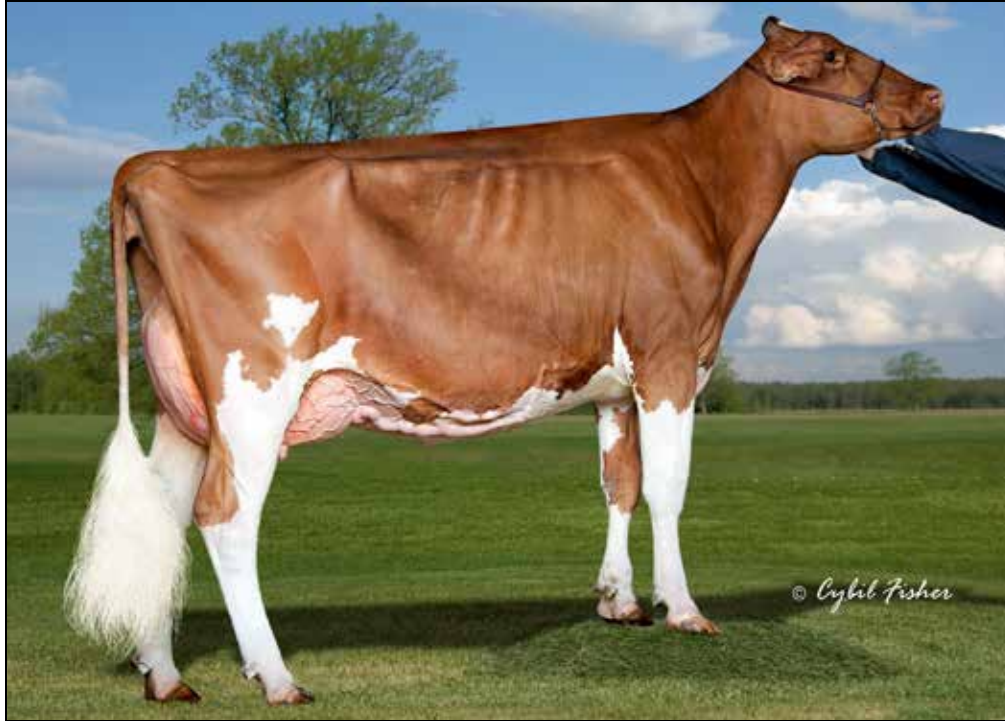
WESTCOAST ABSOLUTE ROULETT-RED EX-93 2E 2ND DAM OF LOT 39