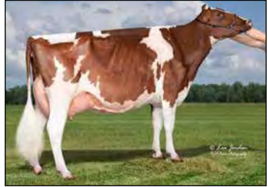
MS TROYER-LWH DFNT TIKI-RED EX-93 EEEEE 2E DAM OF LOT 1