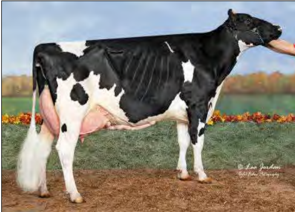
ONEEDA CORVETTE KAYLA EX-94 EX-MS 2E 2ND DAM OF LOT 40