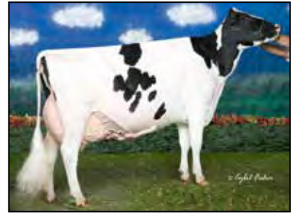
CAMERON-RIDGE BC LISA EX-96 EEEEE 4E DOM 3RD DAM OF LOT 42

Due: July 7, 2023 to Md-Luckylady Eye Candy-ET (Sexed Semen) 7H016104