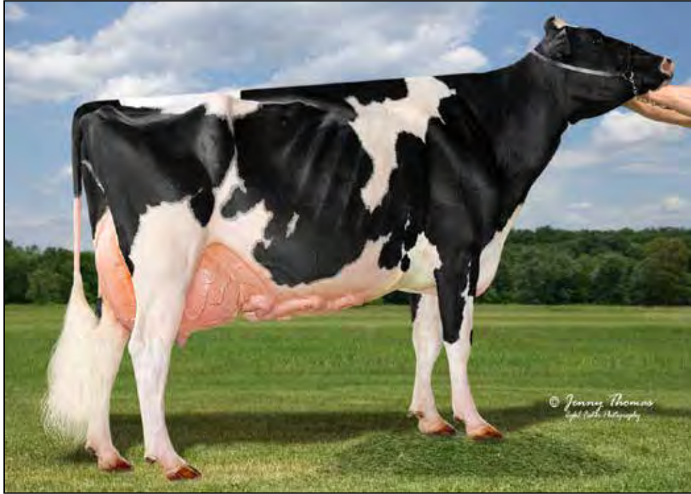
TOPPGLEN ATWOOD WAKI EX-94 EEEEE 2E DAM OF LOTS 9, 10 & 11