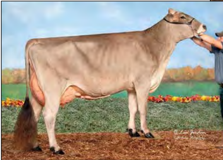
ROUND HILL TALANT WILONA ET EX-90 DAM OF LOT 73