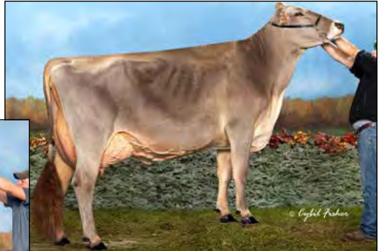
TOP ACRES GARBRO WANDA ET EX- 91 2ND DAM OF LOT 73