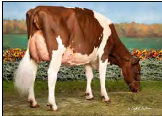
TROYER-VIEW DB TANGO-RED EX-92 MATERNAL SISTER TO LOT 1