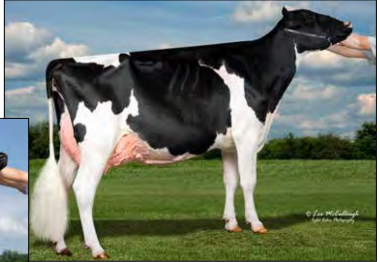
K-HURST ATWOOD PREMISE-ET EX-91 EX-MS 2ND DAM OF LOT 23