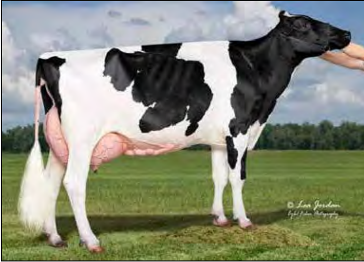
LEANN-ACRES GOLD C SUSIE-ET EX-91 EX-MS 2E DAM OF LOT 15