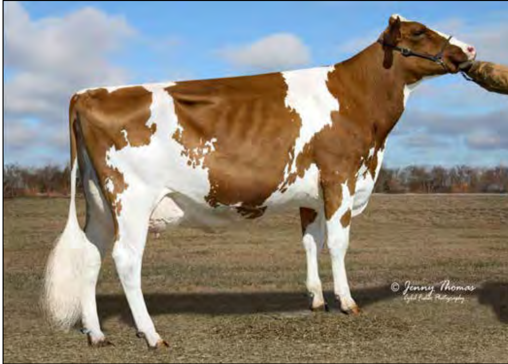
JA-BOB WUNDER HOLLIE-P-RED EX-92 EEEEE 2E 2ND DAM OF LOT 35