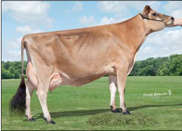
DEMENTS SAGE ROSEMARY EX-93 4TH DAM OF LOT 65