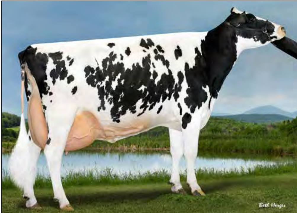
COMESTAR ALYSKA AFTERSHOCK-ET EX-93 EEEEE 2E DAM OF LOT 36