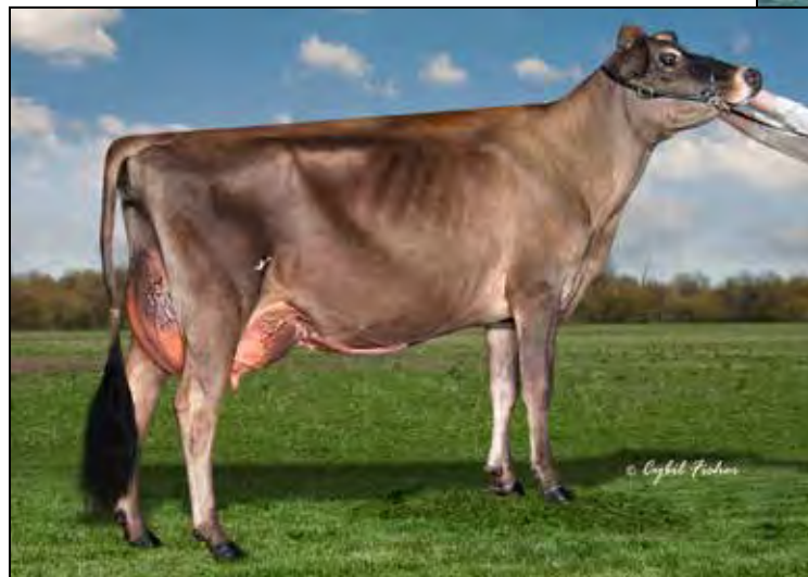
KEVETTA COLTON GLAMOUR EX-91 DAM OF LOT 63