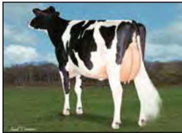
KING-STREET DBACK GEMINI EX-91 SAME FAMILY AS LOT 22