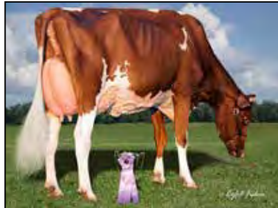
SIEMERS DESTRY SUNNY-RED-ET EX-93 95-MS SAME FAMILY AS LOT 48