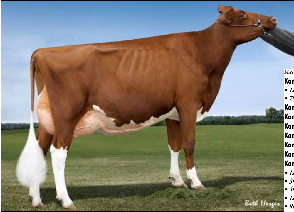
KHW REGMENT APPLE B-RED-ETN EX-90 4TH DAM OF LOT 5