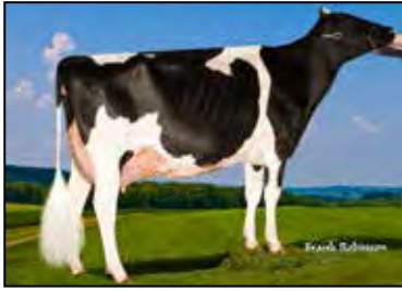
KING-STREET GC GRATITUDE EX-94 2E 3RD DAM OF LOT 22