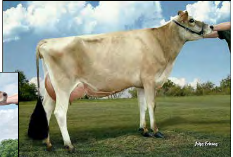
DEMENTS COUNTRY MILES ROXANNE EX-92 MATERNAL SISTER TO 3RD DAM OF LOT 65