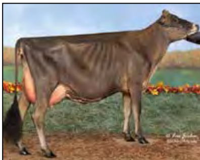
MCGUIRES HIRED GUN KIMBERLY EX-91 MATERNAL SISTER TO DAM OF LOT 68

67170989 Born: June 24, 2022 • Herd No. 9