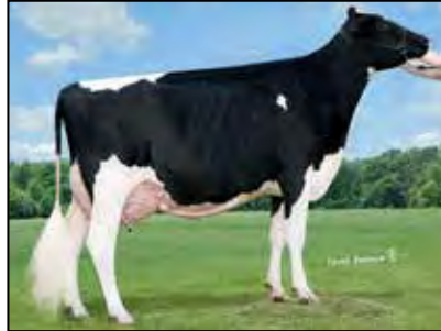
MS J&S MARSEL STAC DEDRA-ET EX-92 EEEEE 2E 3RD DAM OF LOT 45

Bred: July 15, 2022-September 1, 2022 Hilltop-RJ Usb Laser-Red (Unstoppabull-Red X Evacres Ammo Lila A-Red • 1st Summer Yrlg IN State Fair R&W 2019)