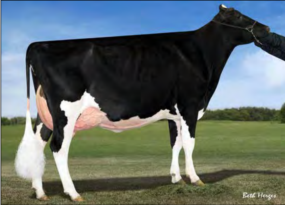
ERNEST-ANTHONY JAZ TEMPO-ET EX-94 EEEEE 2ND DAM OF LOT 19

Maternal sister to Temple Oakfield Goldwyn Terri VG-87 • HHM Jr All-NY Spring Calf 2015 Oakfield Byway Taxi-ET • Nom All-American Winter Calf 2017 Oakfield Brokaw Thelma-ET • Nom Jr All-American Fall Calf 2016 • Res Jr Champ Mid-West Spring Nat'l 2016 • 7th Fall Calf WDE Jr Show 2016