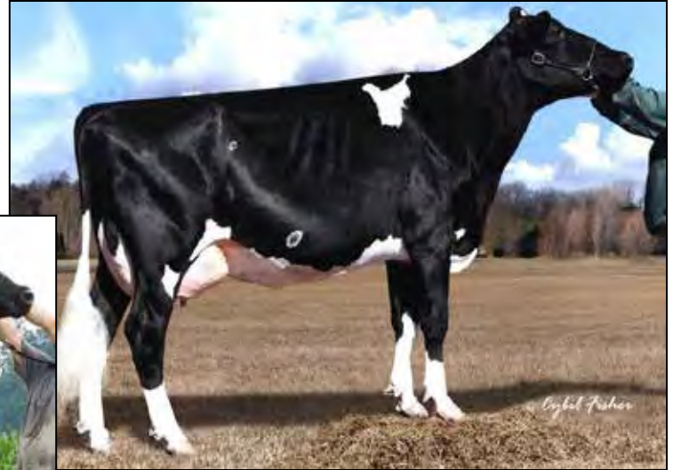
OAKFIELD-BRO FANTASIA-ET EX-94 3E MATERNAL SISTER TO 2ND DAM OF LOT 24