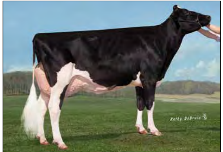
MS APPLES ARIA-ET EX-92 EX-MS 2E 4TH DAM OF LOT 4