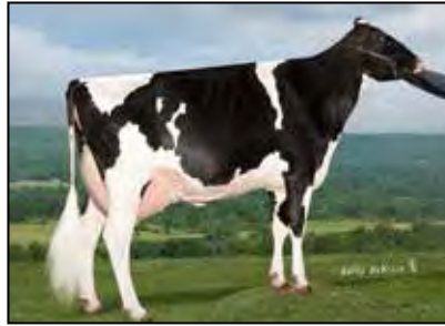
Q-COVE-W-JMKCURRAN DOLLY-ET EX-94 EEEEE 2E 4TH DAM OF LOT 52

840003230511019 99%RHA-I Born: September 2, 2022 • Herd No. 402