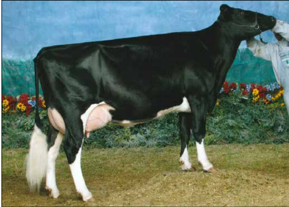
VIADUCT LEE BEAU EX-94 4TH DAM OF LOT 26