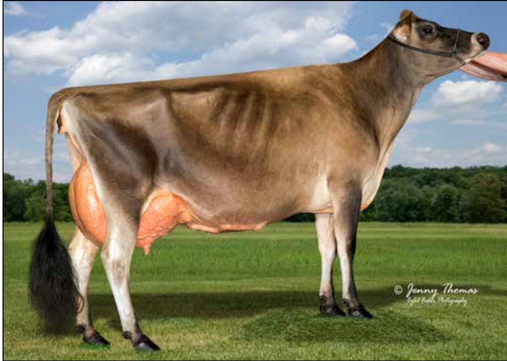
MAMIES MEDALLION EX-95 2ND DAM OF LOT 66