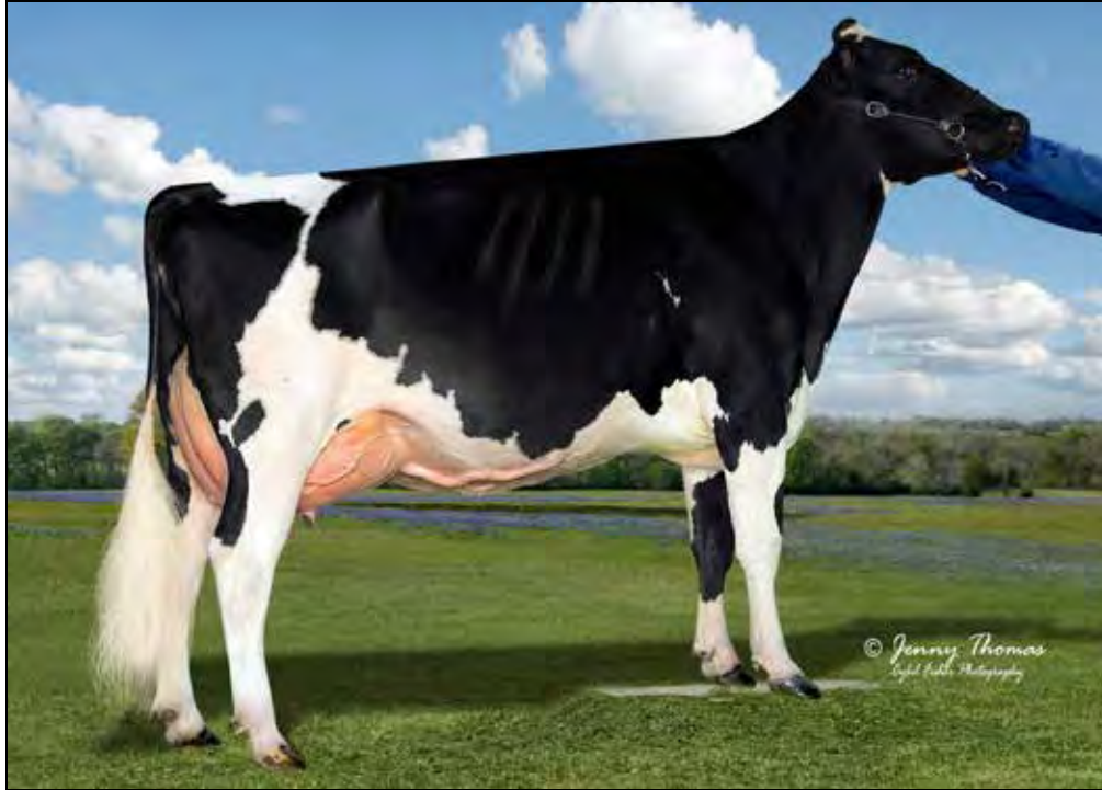
TRI-KOEBEL JEALOUSY EX-91 EX-MS 2E 2ND DAM OF LOT 31