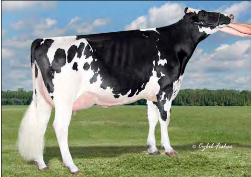
COOKIECUTTER EPIC HAZEL-ET EX-91 EX-MS 4TH DAM OF LOT 41