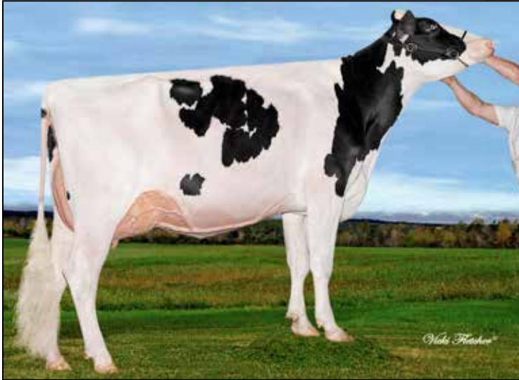
MAPLELEY DUPLEX JUPLEX EX-94-CAN 4E 3* DAM OF LOT 37