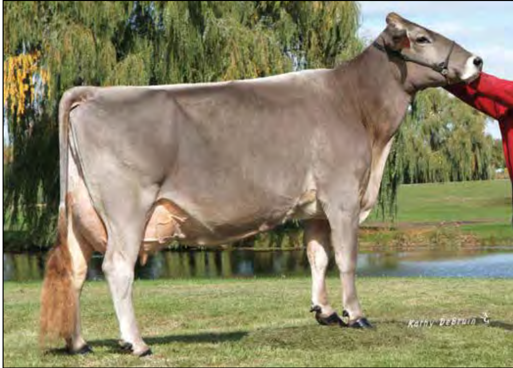
MORT NIKE DAZZLE 3E-E93 3RD DAM OF LOT 74