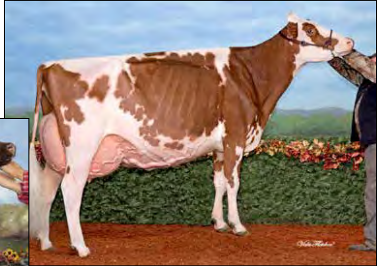
MISS APPLE SNAPPLE-RED-ET EX-96 EEEEE 2E MATERNAL SISTER TO DAM OF LOT 3