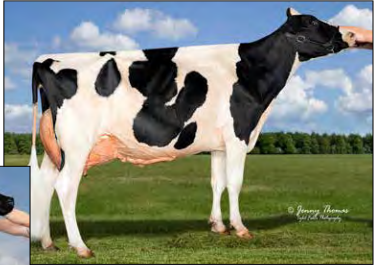
LEANN-ACRES GOLD C SWEET EX-92 2E FULL SISTER TO DAM OF LOT 15