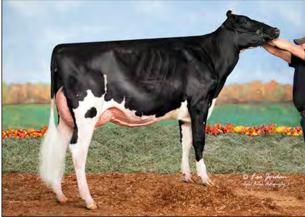
LANDIS-MRK JACOBY DILLY-D EX-92 EX-MS DAM OF LOT 23 & MATERNAL SISTER TO LOTS 18