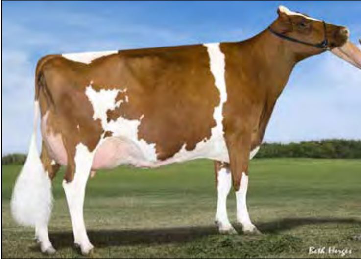
JK-RG ADVENT EARLENE-RED-ET EX-94 EEEEE 3E 2ND DAM OF LOT 12