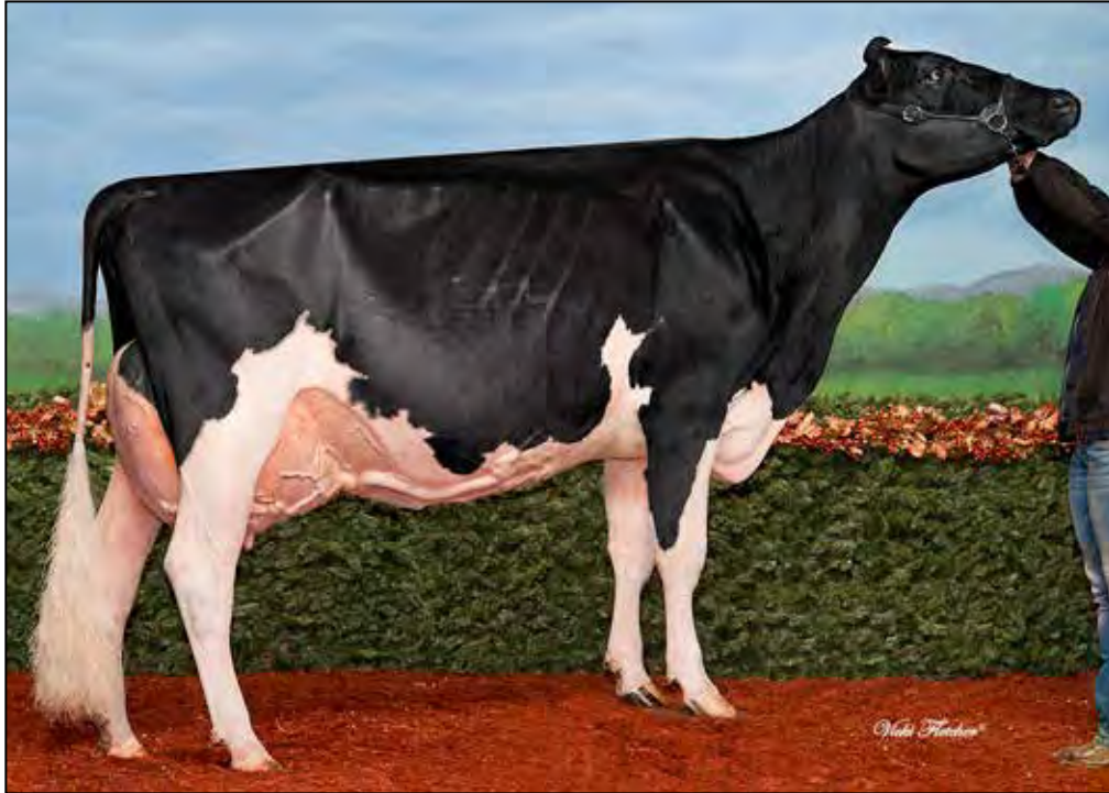
JACOBS GOLDWYN LISAMAREE EX-94-CAN 93-MS 2ND DAM OF LOT 34