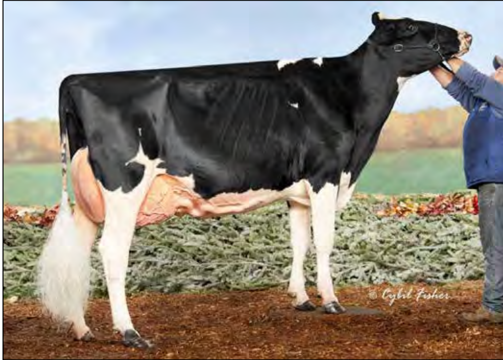
COMESTAR HOPRA ATWOOD-ET EX-93 EX-MS MATERNAL SISTER TO 2ND DAM OF LOT 44