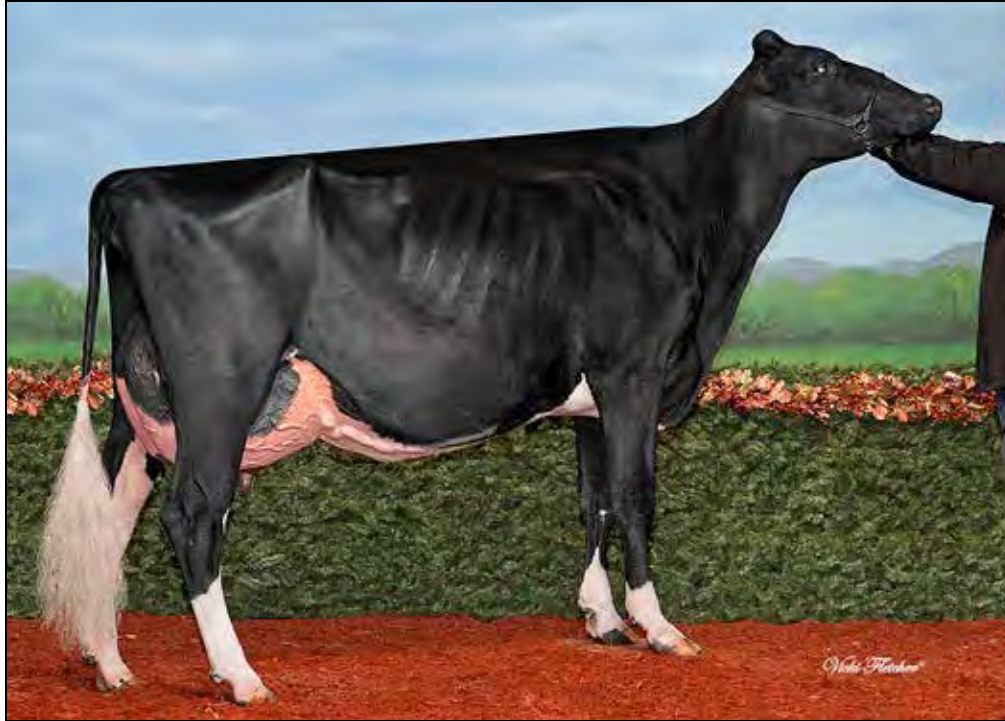
GAEMENCHET SID KATIA EX-94 DAM OF LOT 33