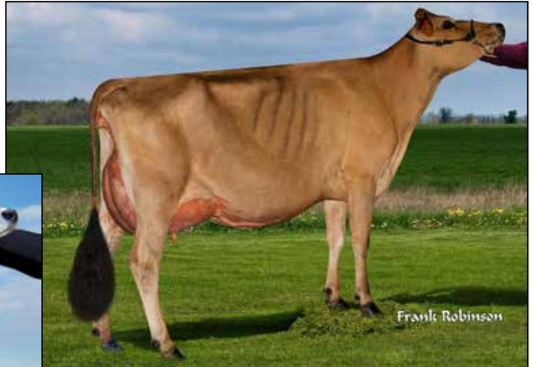
CLASS-E VIRAL FLAIR VG-88 MATERNAL SISTER TO LOT 64