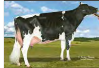
LEANN-ACRES BLITZ SHEENA EX-92 EX-MS 3E 2ND DAM OF LOT 15