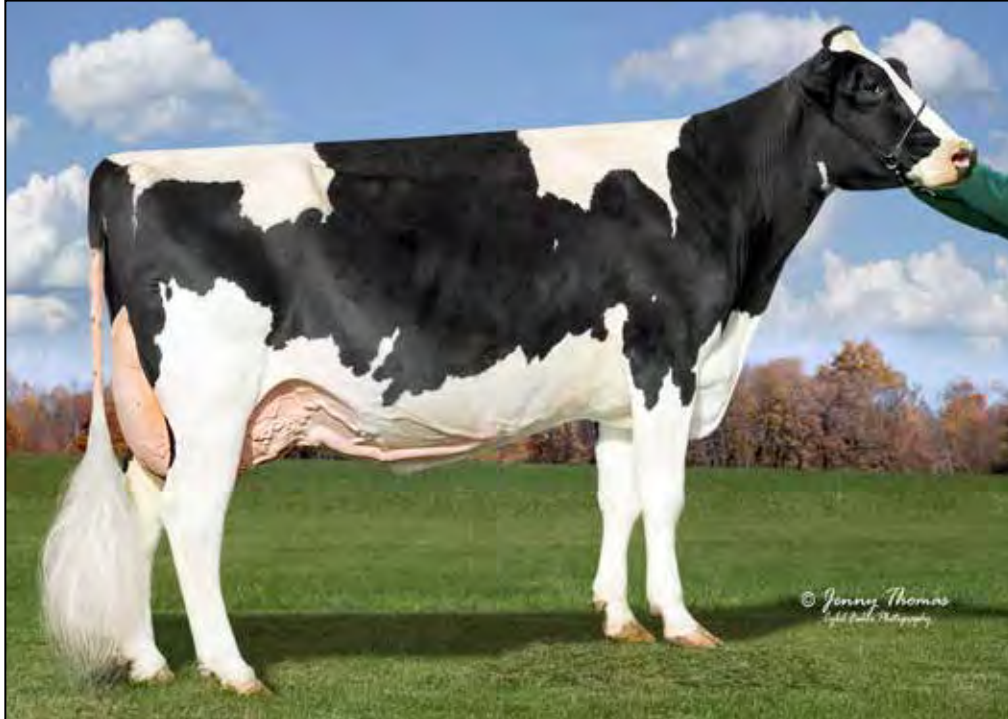
NISE-N-FANCY CHIKIN BISKIT EX-92 EEEEE 2E DAM OF LOT 27 & 2ND DAM OF LOT 28