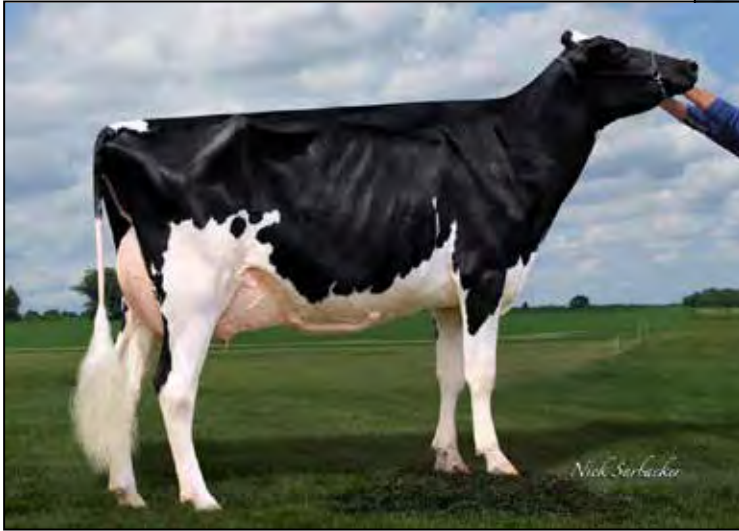
KY-BLUE GW DEBBIE-ET EX-94 EEEEE MATERNAL SISTER TO 2ND DAM OF LOT 38