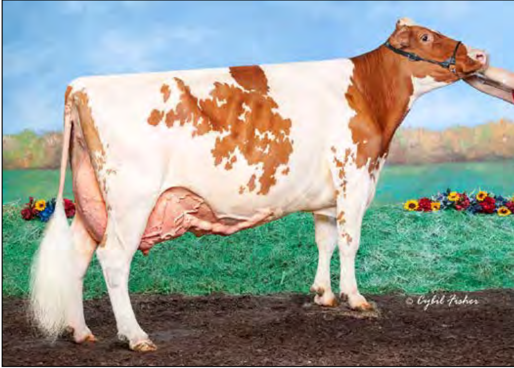
EK-STJ BRILLIANT-RED-ET EX-94 EEEEE 3E DAM OF LOT 17