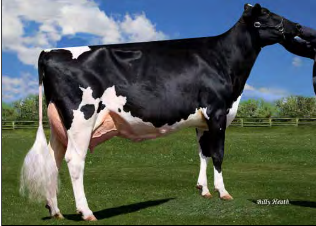
WINDSOR-MANOR ZE GIDGET-ET EX-94 3E DAM OF LOT 25