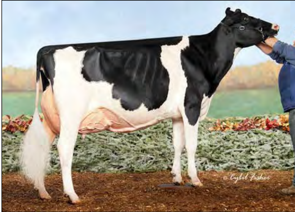
LINGLE GOLD FREAKY GIRL-ET EX-93 EX-MS DAM OF LOT 21