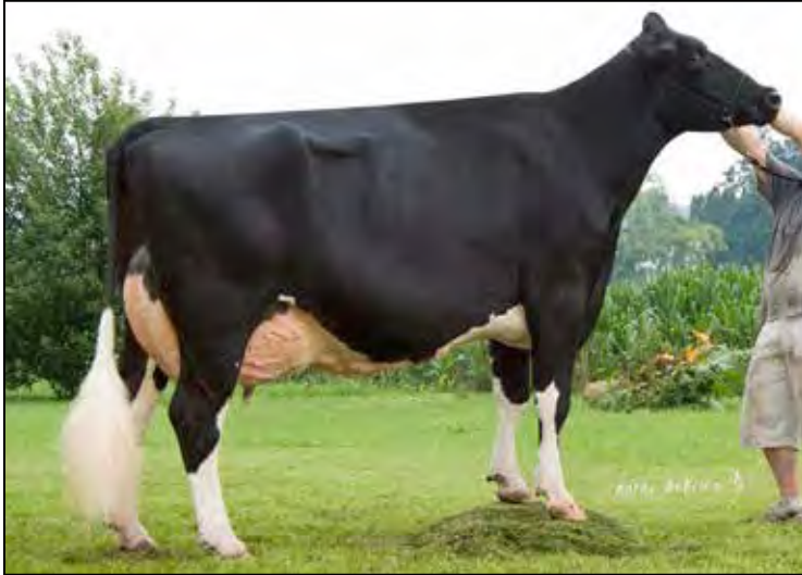
PENN-GATE STORM FLEUREL-ET EX-94 EEEEE 2E DOM 3RD DAM OF LOT 24