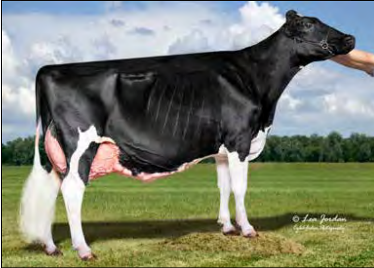
MS LOOKWELL PORTIA EX-93 MATERNAL SISTER TO DAM OF LOT 23