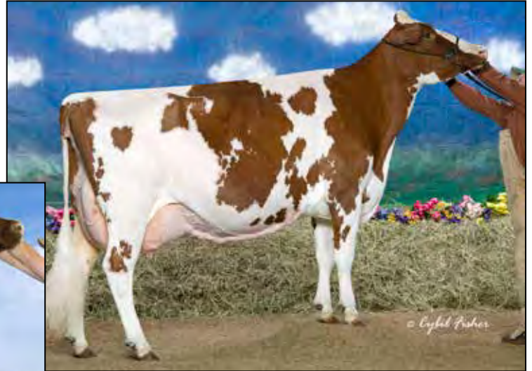
GREENLEA RUB MARLENE-RED-ET EX-94 EEEEE 3E 3RD DAM OF LOT 12