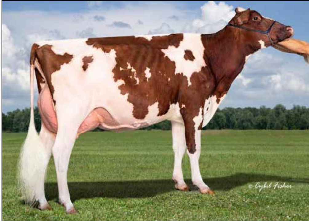
HOSKING JORDY ALABAMA-RED VG-88 VG-MS DAM OF LOT 16