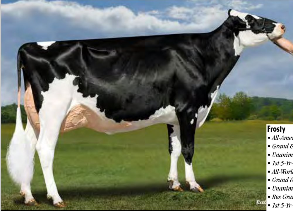
DUCKETT DOORMAN FUSHIA-ET EX-93 EX-MS DAM OF LOT 7