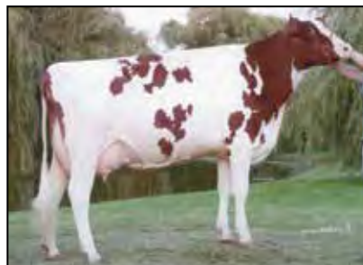
MORRILL RMRK SCARLET-RED-ET EX-94 EEEEE 2E 5TH DAM OF LOT 49

145514383 99%RHA-I *RC Born: June 9, 2022