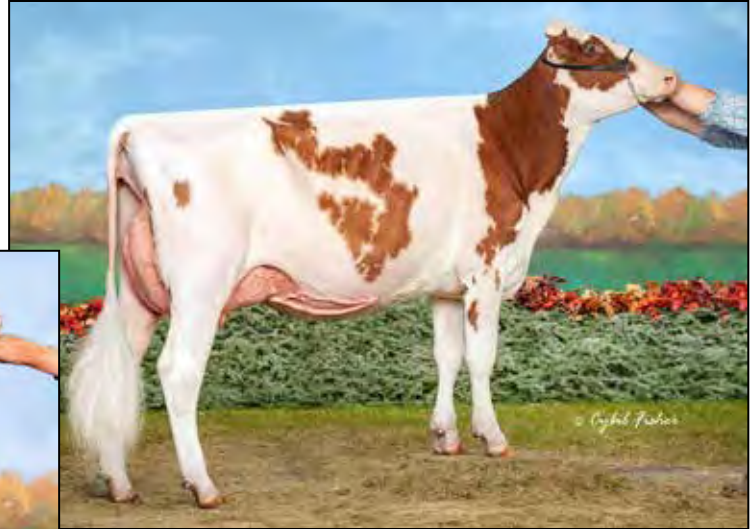
SIEMERS GREAT 31589-RED-ET EX-92 MATERNAL SISTER TO LOT 8