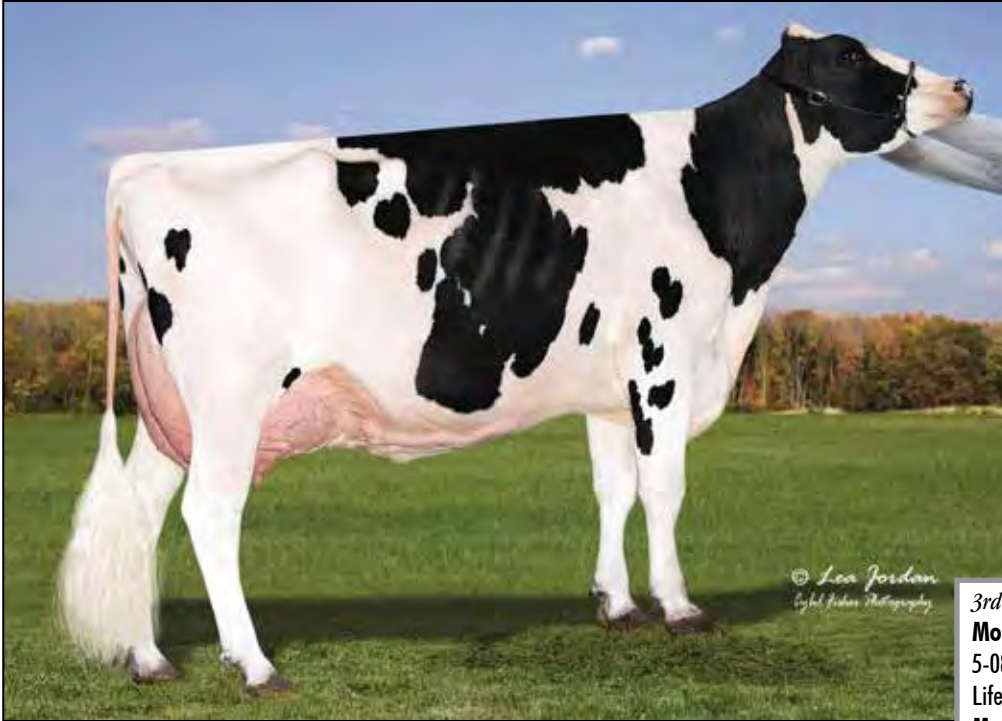
Y-WHISPER SILVER ROYALTY-ET EX-94 EEEEE 2E 2ND DAM OF LOT 32