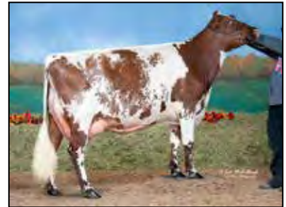
WEISSWAY PT CARMEL ICING 2ND MATERNAL SISTER TO 2ND DAM OF LOT 78