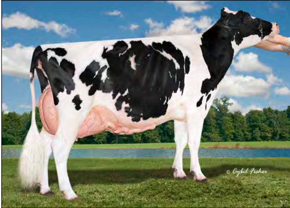
PENCROFT AFTERSHOCK TISHA EX-94 EEEEE 2E DAM OF LOT 20