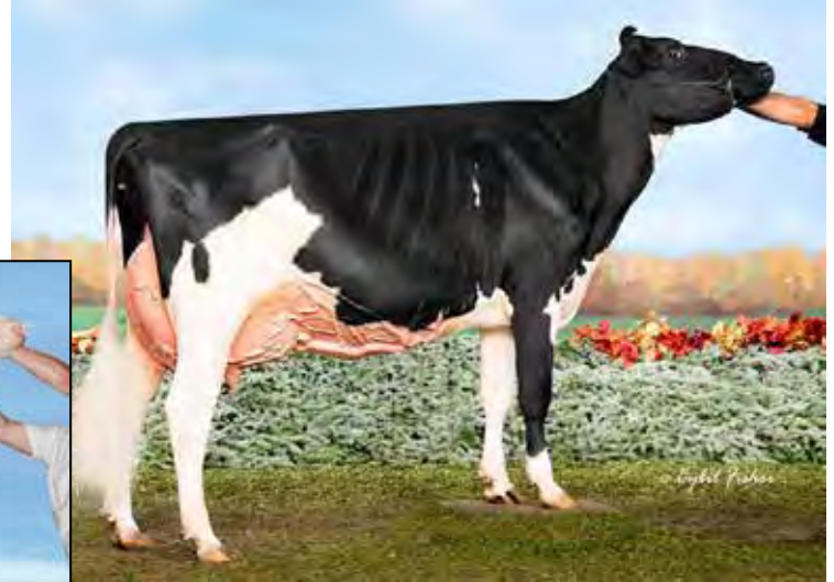
MAPLELEY GOLDWYN JULIA EX-95-CAN 2E MATERNAL SISTER TO LOT 37