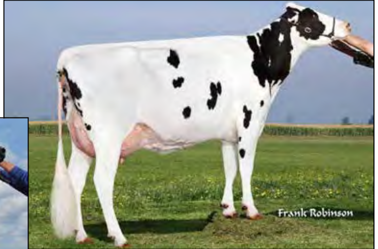
KY-BLUE SANCHEZ DEIDRA-ET EX-93 MATERNAL SISTER TO 2ND DAM OF LOT 38