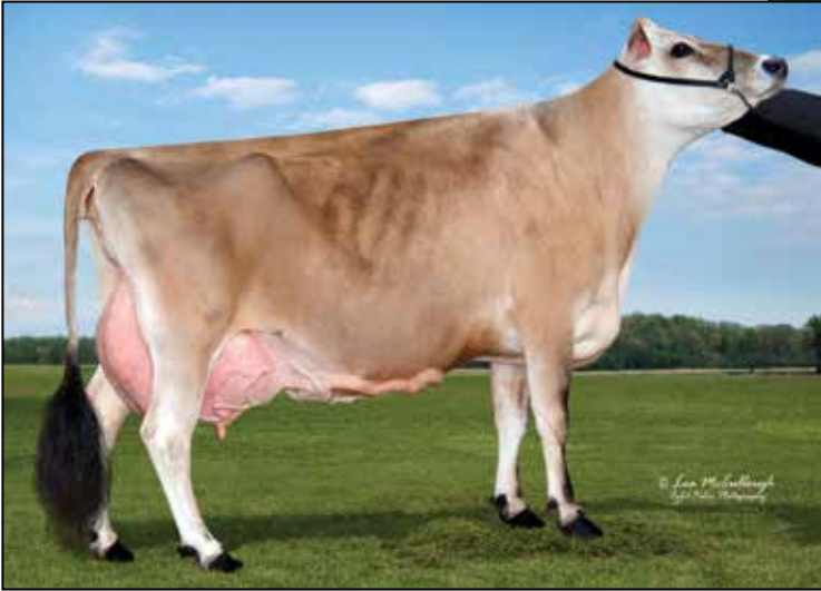
AF FUROR FUDGE EX-93 3RD DAM OF LOT 64