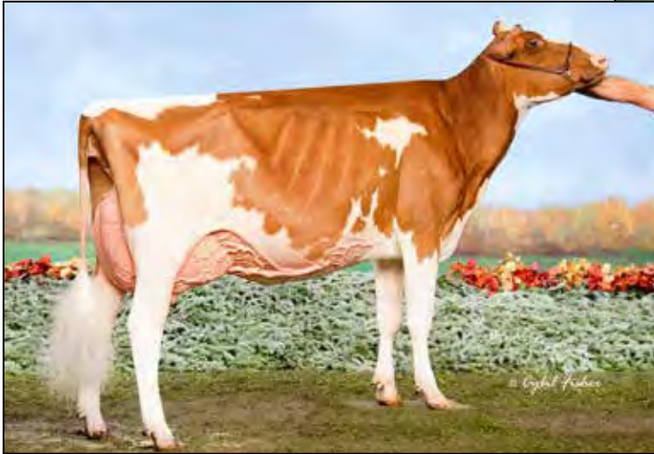
SIEMERS AWESOME GREAT-RED EX-93 EEEEE 2E DAM OF LOT 8