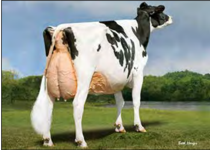
FARNEAR TBR ARIA ADLER-ET EX-96 MATERNAL SISTER TO 3RD DAM OF LOT 4