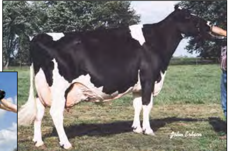
VITAL-I LINCOLN BONNIE EX-96 EEEEE 2E GMD DOM 4TH DAM OF LOT 30