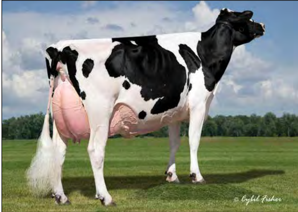
DUBEAU DUNDEE HEZBOLLAH EX-94 EEEEE 2ND DAM OF LOT 14