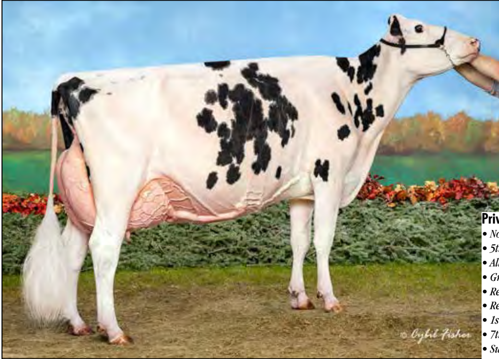
GLEANN BRADY PRIVATEER EX-95 EEEEE 2E 2ND DAM OF LOT 2