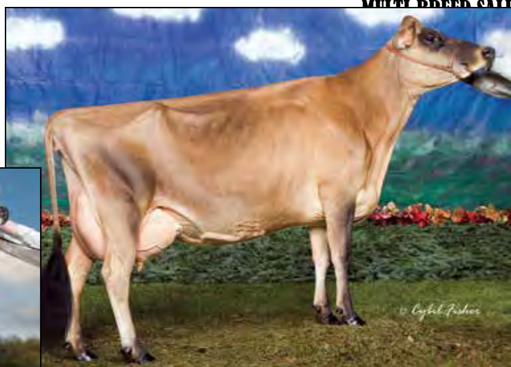
SHEER GRACE EX-95 3RD DAM OF LOT 63