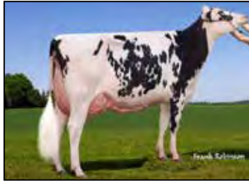
KING-STREET ARCRIVL GRAFFITI EX-93 MATERNAL SISTER TO 2ND DAM OF LOT 22 Grand Champ Jr Show MI All-Breeds 2023