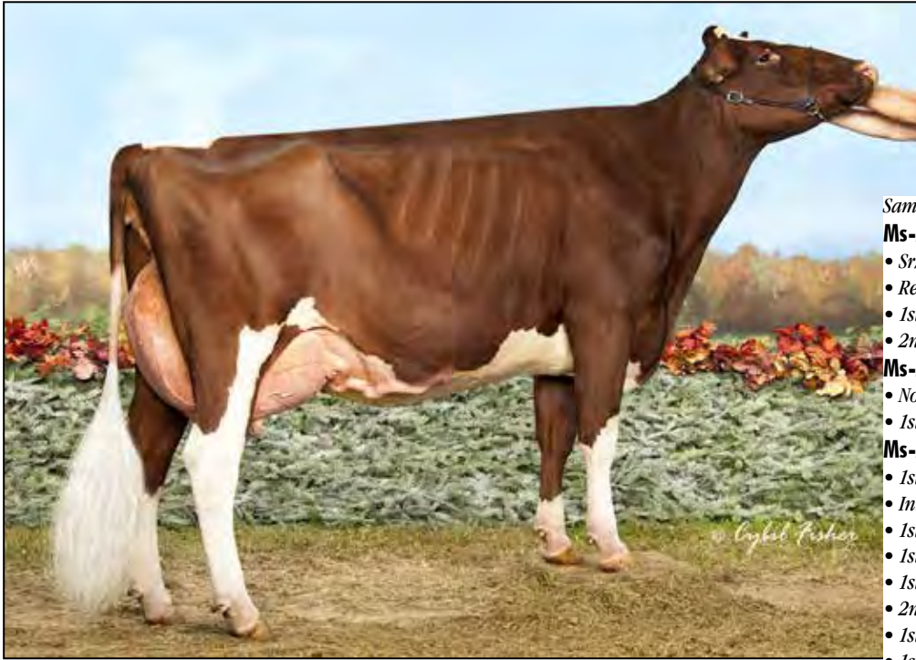
PARKVUE ABSOLUTE RAP-RED-ET EX-94 EEEEE 2E DAM OF LOT 6