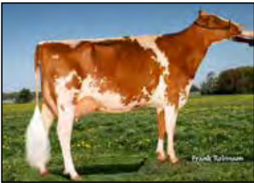
KING-STREET C45 GOTCHA-RED EX-90 MATERNAL SISTER TO 3RD DAM OF LOT 22