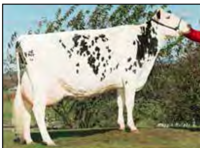
VT-POND-VIEW MARK JOSIE EX-94 EEEEE 3E 7TH DAM OF LOT 51

840003240345974 99%RHA-I Born: September 1, 2022 • Herd No. 1324