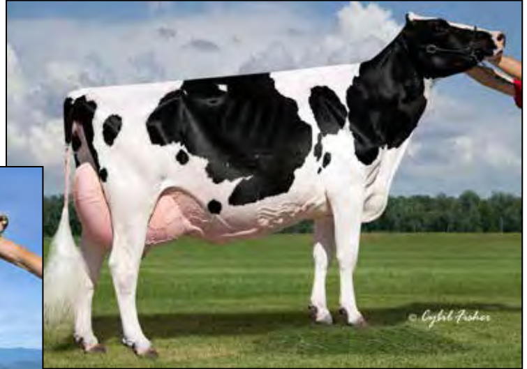
DUBEAU DUNDEE HEZBOLLAH EX-92 EEEEE 2ND DAM OF LOT D