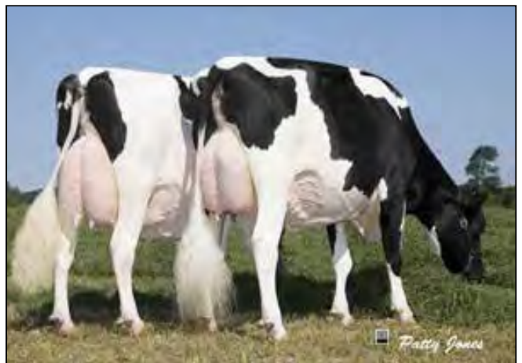
MONTDALE DUNDEE RUBIE EX-93 & MONTDALE DUNDEE RUBI EX-92-CAN 94-MS