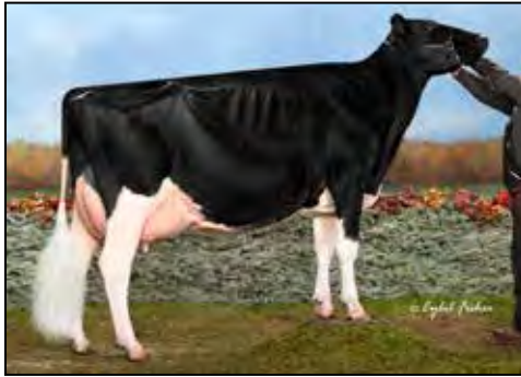
T-TRIPLE-T PLATINUM-ET EX-94 EEEEE 2E DAM OF LOT A