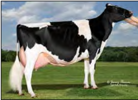
T-TRIPLE-T GOLD PRIZE EX-94 EEEEE 2E 3RD DAM OF LOTS 16 & 17 FULLS SISTER TO DAM OF LOTS 16 & 17