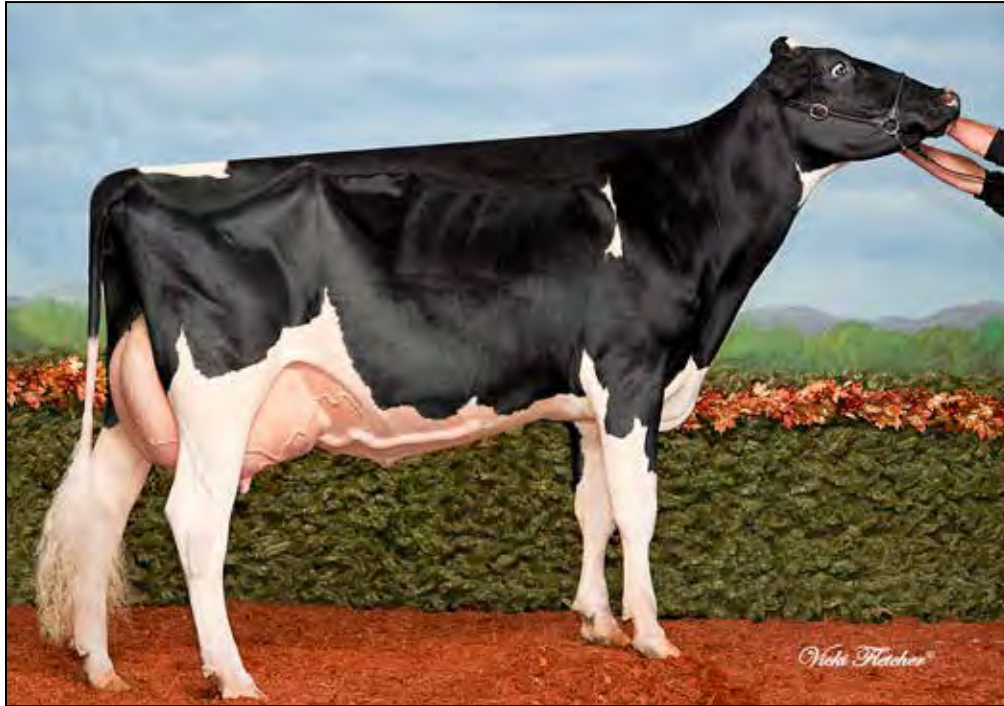
VT-POND-VIEW STM CORA-ET EX-94 EEEEE 2E DAM OF LOT 28