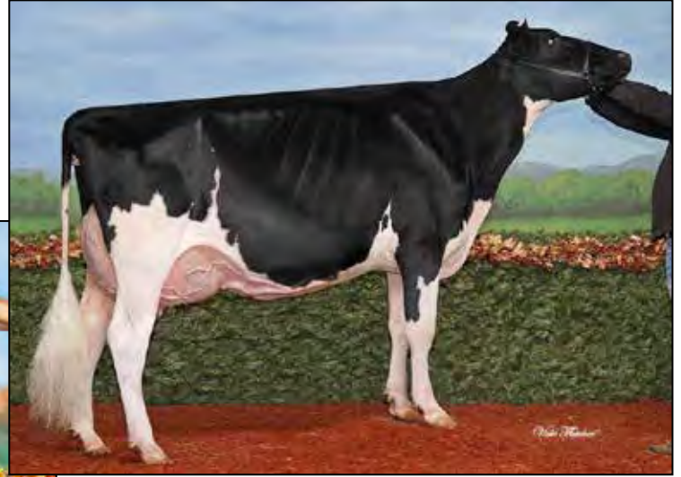
GEN-I-BEQ SNOWMAN AKILIANE EX-91 EX-MS *RC DAM OF LOT 61