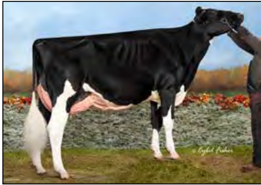
LOTTOS ATWOOD LIZETTE-ET EX-94 EEEEE 2ND DAM OF LOT 27