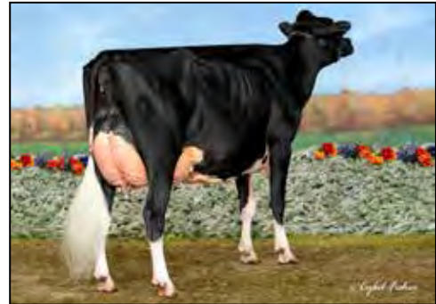
JACOBS SID BEAUTY EX-95 EEEEE DAM OF LOTS 2-4