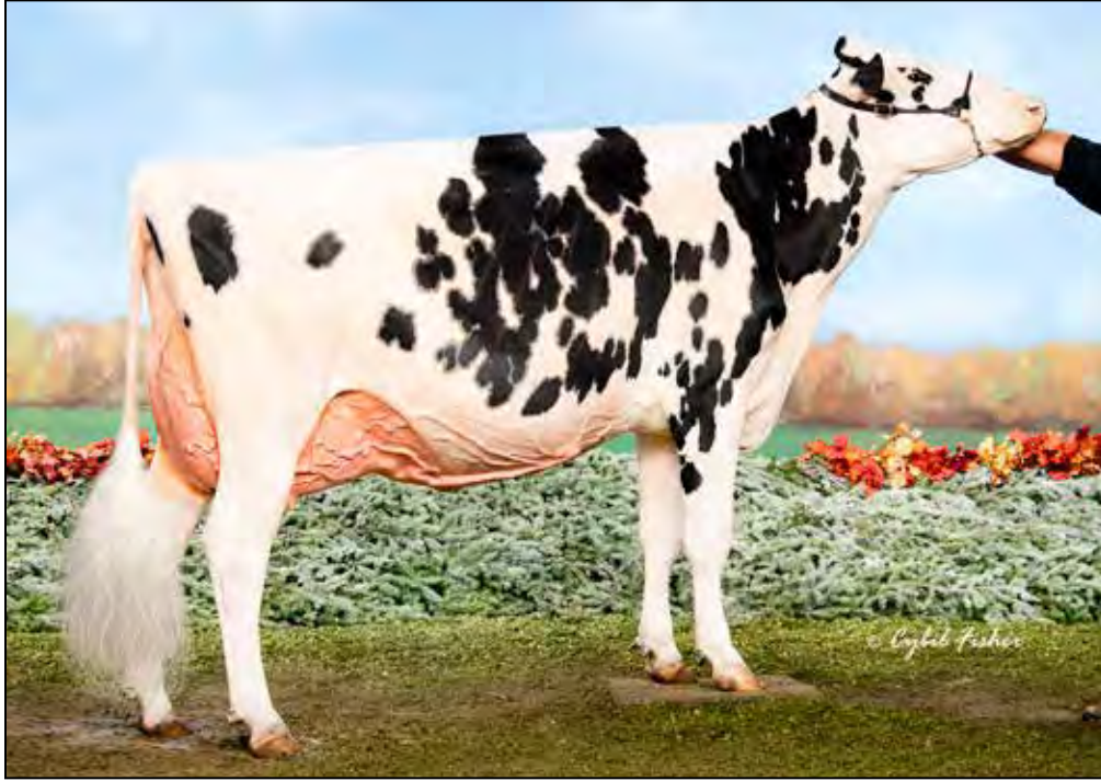
SUNNY PLAINS DEMPSEY LAUREL EX-94 EEEEE DAM OF LOTS 50 & 51