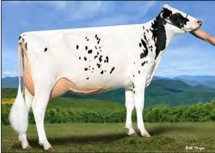
HEZ AFTERSHOCK HUIZZAH-ET VG-89 EX-MS DAM OF LOT D