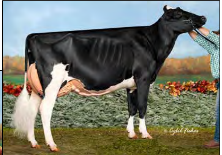
CRAIGCREST RUBIES RACHELLE-ET EX-94 EEEEE DAM OF LOT 53