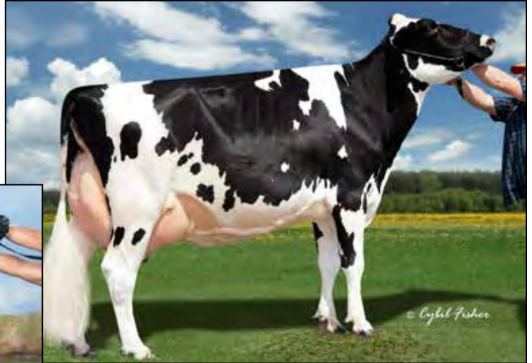
LUNCREST SHOTTLE WHIT-1149 EX-92 EX-MS 2ND DAM OF LOT 54