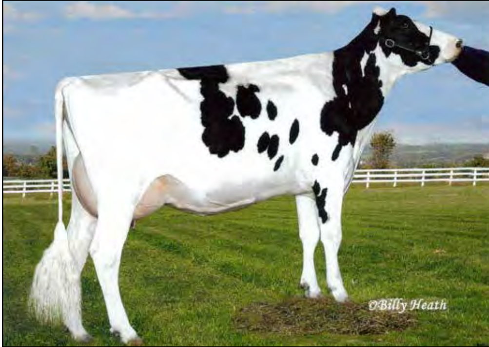
MISS RIDGEDALE FLAREON EX-93 EEEEE 3E 2ND DAM OF LOT 56