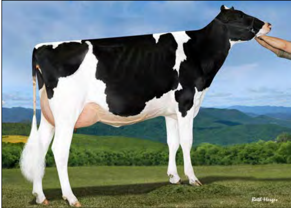
HEZ HEZBOLLAHS HOPE-ET VG-88 VG-MS DAM OF LOT 52