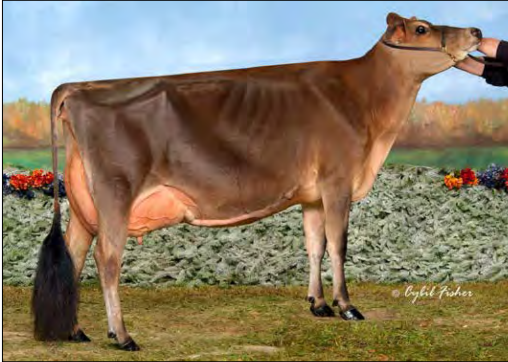
CHILLI PREMIER CINEMA-ET EX-93 DAM OF LOT J4