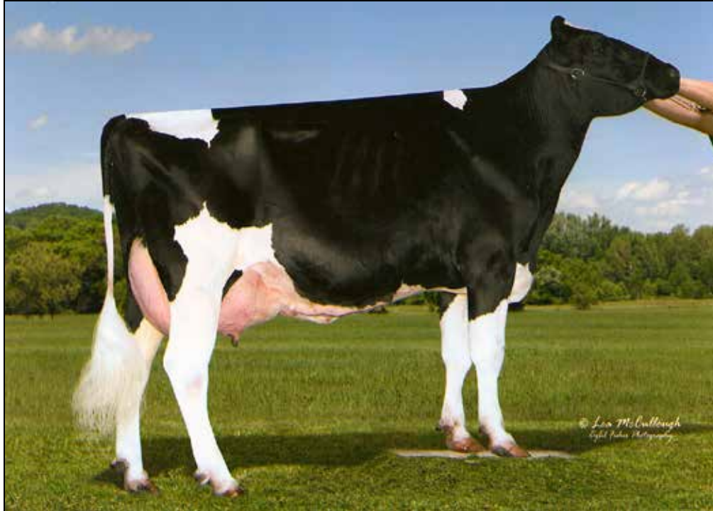
KINGSBURY PARSNIP-ET EX-94 EEEE 2E 2ND DAM OF LOT 25