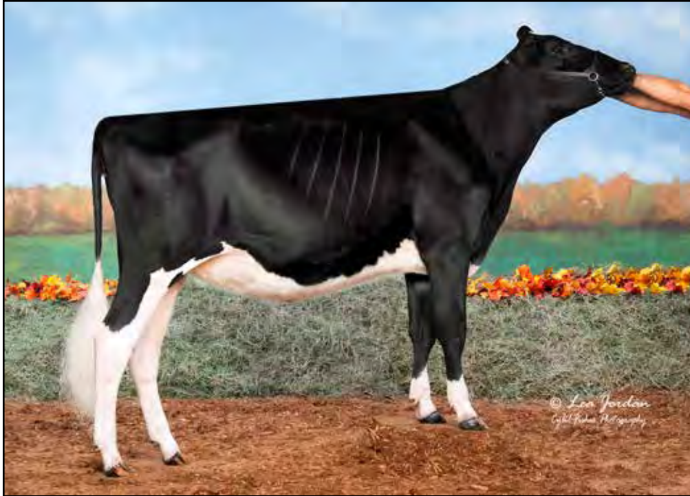
PETITCLERC IMPRESSION AURALIE SELLS AS LOT 62