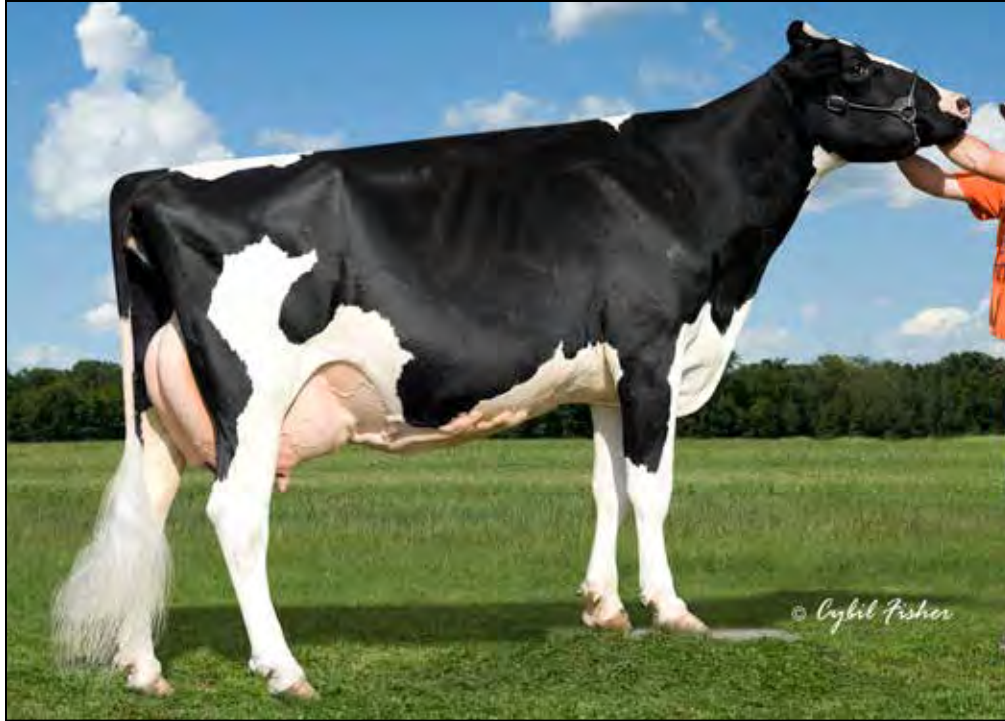
LIDDLEHOLME-R DRHM RHONDA-ET EX-94 EEEEE MATERNAL SISTER TO 2ND DAM OF LOT 68