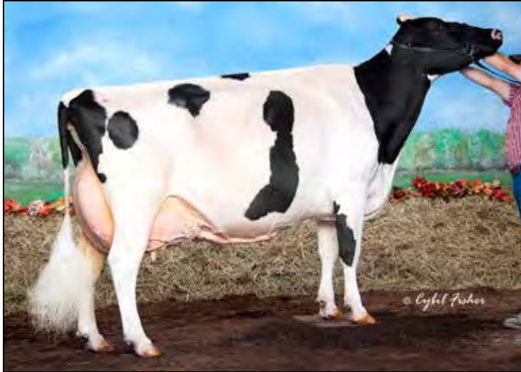
QUALITY-RIDGE STORMI HAZEL EX-96 EEEEE 2E 3RD DAM OF LOT 26