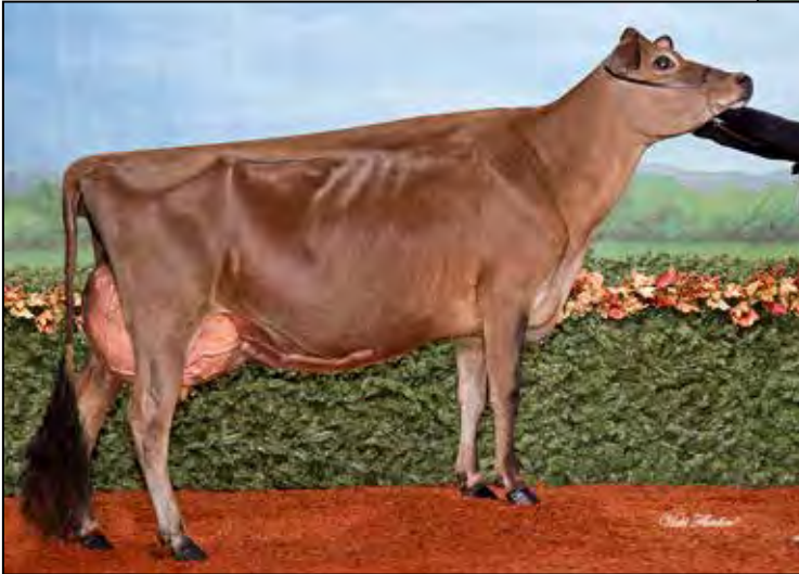
SOUTH MOUNTAIN SANTANAS SPIRIT-ET EX-91 DAM OF LOT J5