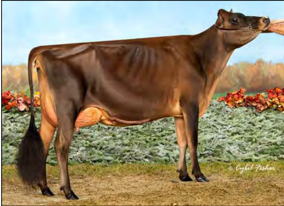
PAULLYN VANCE RAINELLE EX-93 DAM OF LOT J3