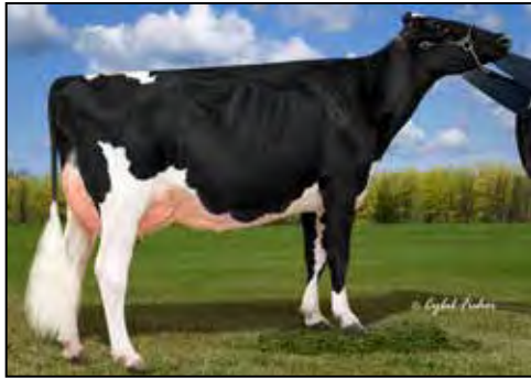
BUDJON-JK GCHIP ELLEN-ET EX-91 EX-MS DAM OF LOT 11