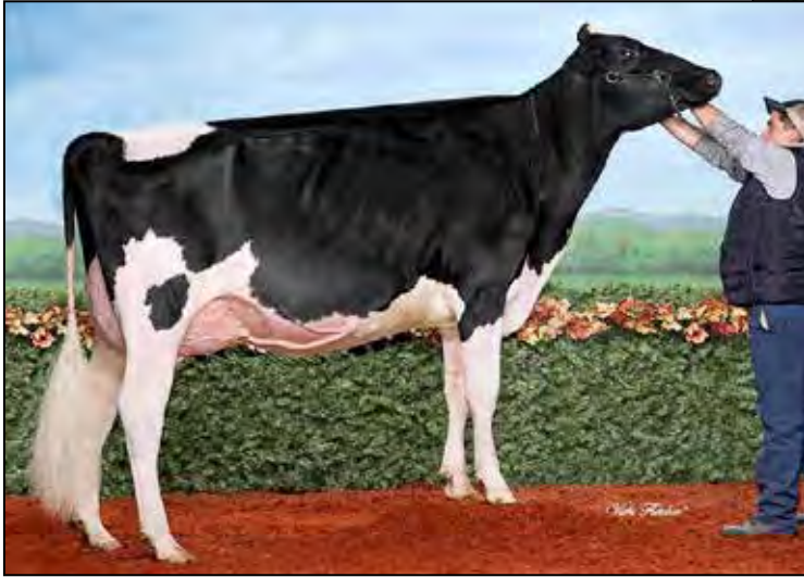
PETITCLERC DOORMAN ANASTSIA EX-90-CAN DAM OF LOT 45