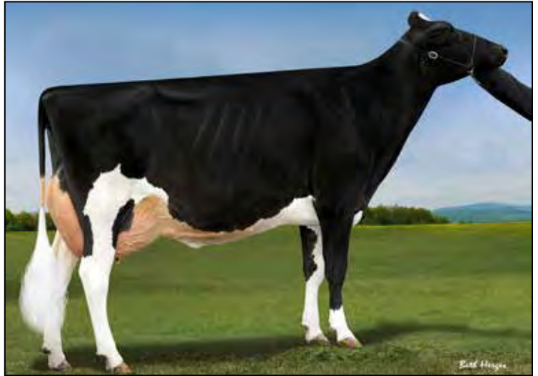
CRAIGCREST REJOICES SIDNEY-ET EX-94 EEEEE