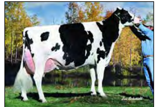
PINE-SHELTER CHEYENNE EX-95 3E DOM 5TH DAM OF LOT 23