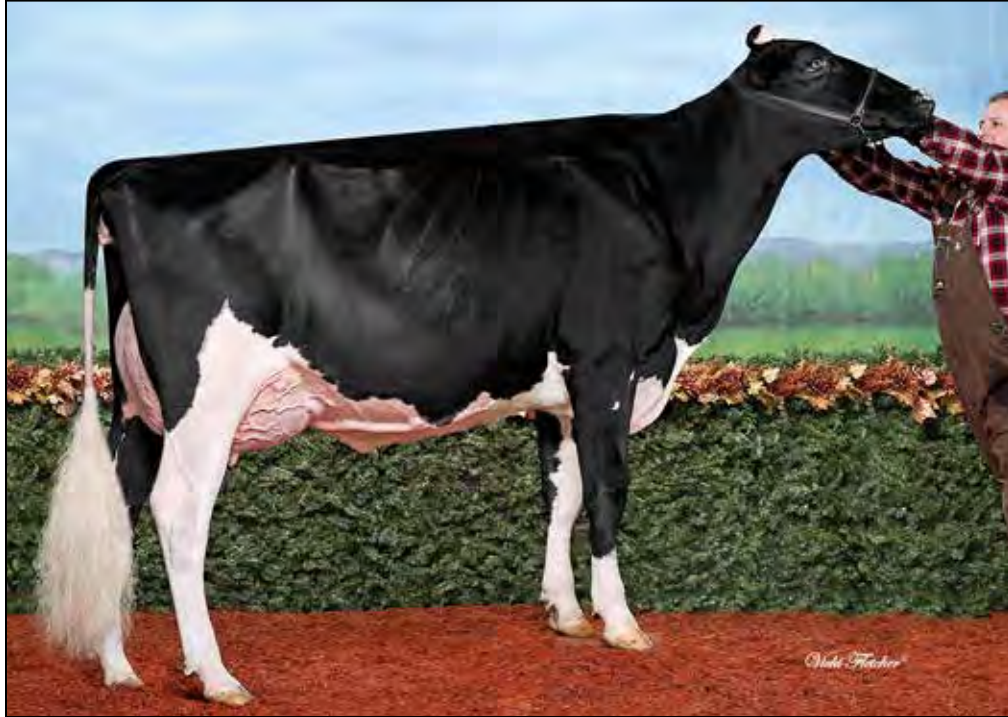
AIIA GOLDWYN GIOVANNI-ET EX-92 EX-MS DAM OF LOT B