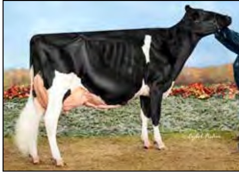
T-TRIPLE-T-I DURHAM POPPI EX-95 EEEEE 2E 2ND DAM OF LOTS 16 & 17