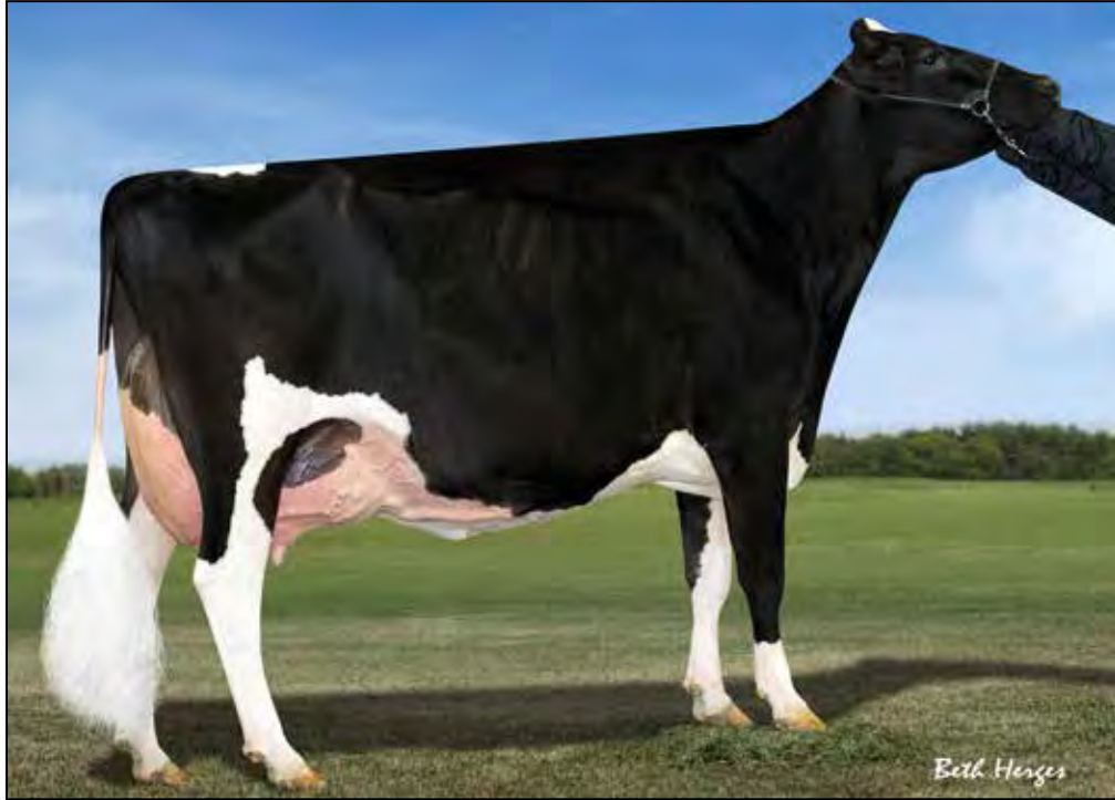
DONNANVIEW DAMION LYZA-ET EX-94 EEEEE 2E DAM OF LOTS 20 & 21