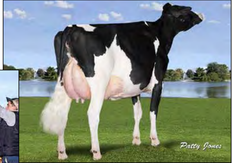
PETITCLERC GOLDWYN ANOUK-ET EX-93-CAN 2ND DAM OF LOT 45