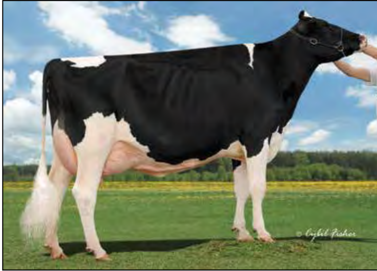
COWTOWN DUNDEE SINDY EX-94 2E 2ND DAM OF LOT 57