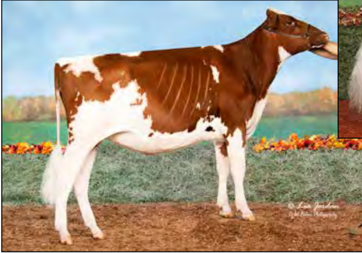
MS LUNCREST ALI-1949-RED-ET MATERNAL SISTER TO LOT 61