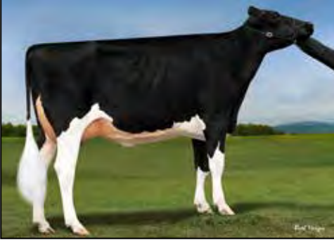
JERICO-DAIRY ATWOOD LENNOX EX-91 EX-MS MATERNAL SISTER TO LOT 41