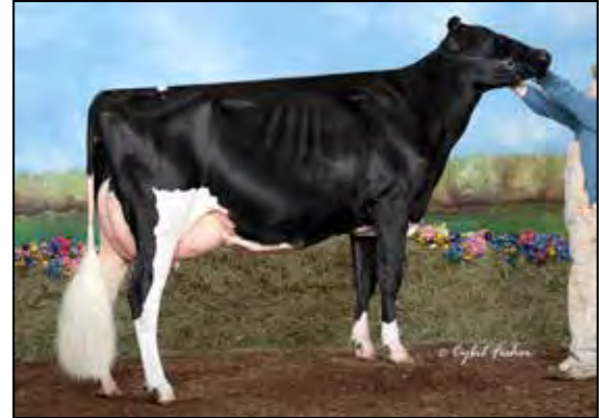
JOLEANNA GOLD POURINRAIN-ET EX-92 MATERNAL SISTER TO DAM OF LOT 22