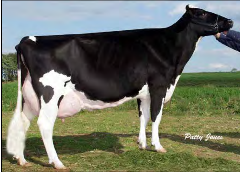
WINDY-KNOLL-VIEW PROMIS-ET EX-95 2E GMD DOM 4TH DAM OF LOT 65