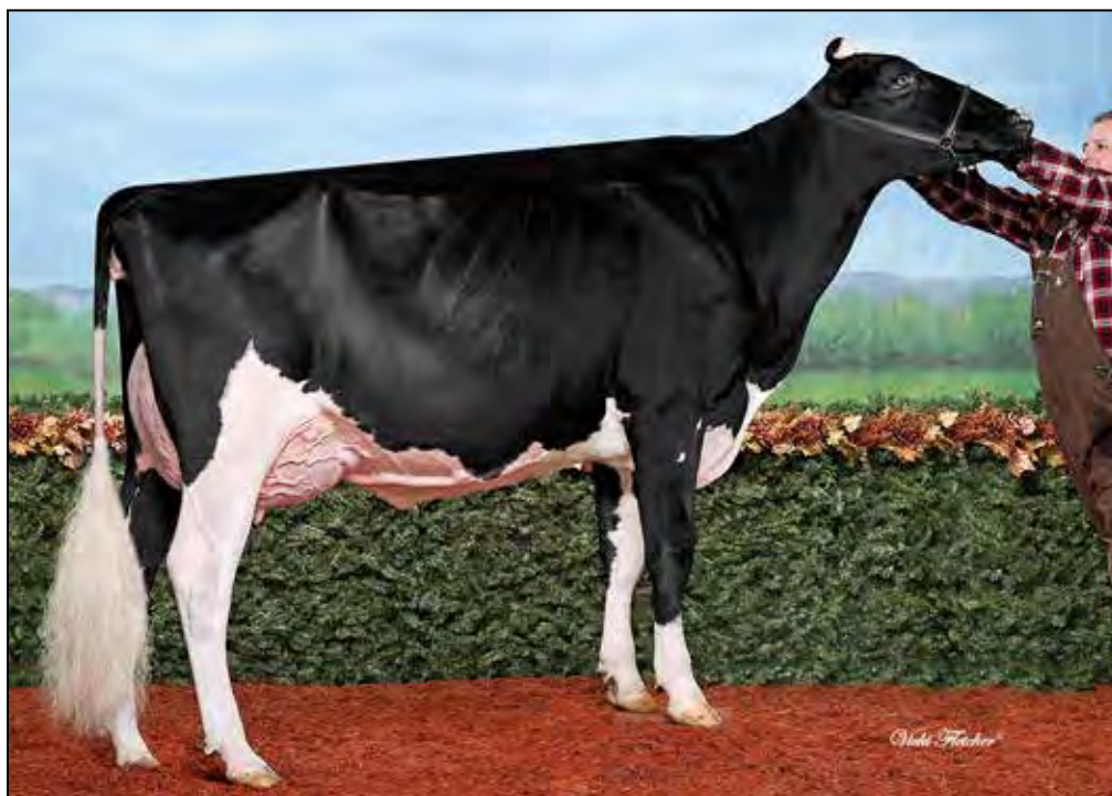
AIIA GOLDWYN GIOVANNI-ET EX-92 EX-MS DAM OF LOTS 29-31