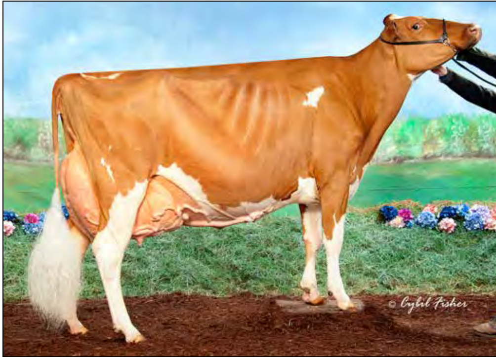
ROSEDALE LUCKY-ROSE-RED EX-94 EEEEE 2E DAM OF LOT 34