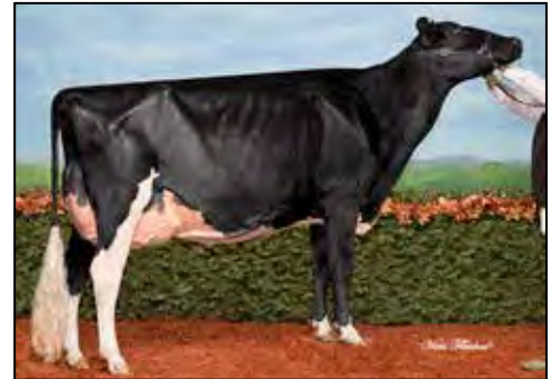
JACOBS GOLDWYN BRITANY-ET EX-96 2E 4* 3RD DAM OF LOT C