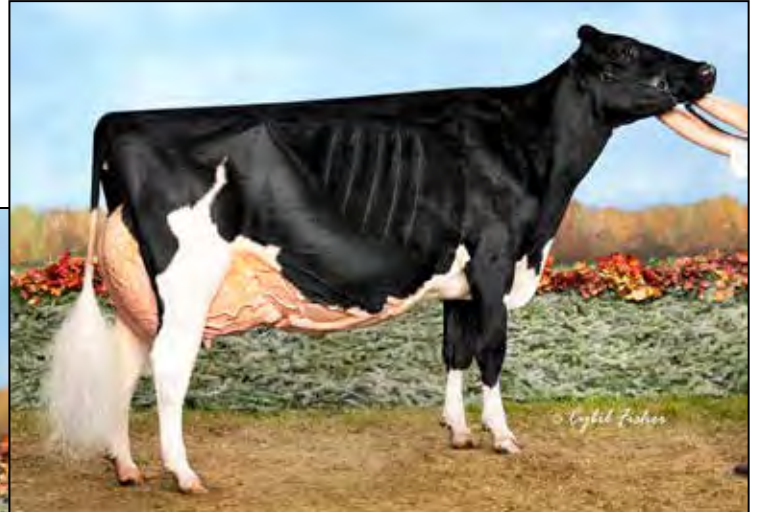
ROSIER BLEXY GOLDWYN-ET EX-96 EEEEE 3E SAME FAMILY AS LOT 59