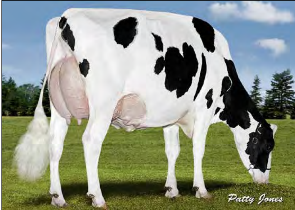
WALNUTLAWN MCCUTCHEN SUMMER EX-94 SAME FAMILY AS LOT 60