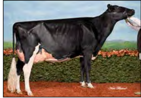
JACOBS GOLDWYN BRITANY EX-96 FULL SISTER TO LOT 1