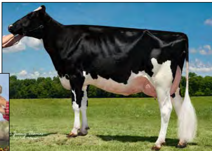
MISS N UNO AUTHORITY-ET EX-92 EEEEE FULL SISTER TO DAM OF LOT 24