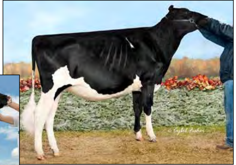
VAILWOOD DRMN SIGRID FULL SISTER TO LOT 57