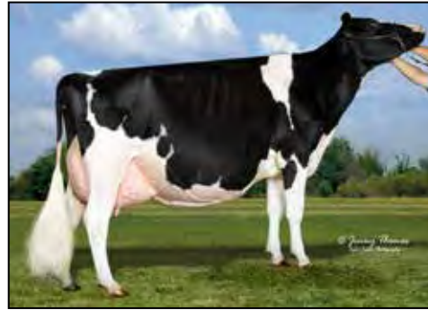
T-TRIPLE-T DUNDEE PAIGE EX-96 EEEEE 3E 2ND DAM OF LOT A