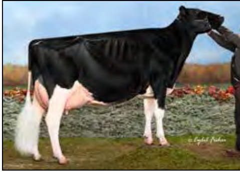
T-TRIPLE-T PLATINUM-ET EX-94 EEEEE 2E DAM OF LOTS 14 & 15