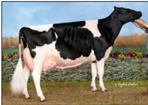
BUDJON-JK EMILYS EDAIR-ET EX-95 EEEEE 2E 2ND DAM OF LOT 11