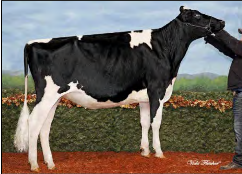
FUSION PASSIONS POISON VG-88-CAN 90-MS 2ND DAM OF LOT 55