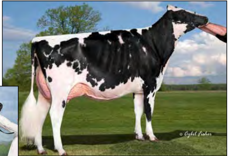
PETITCLERC DOORMAN SAPPHIRE SAME FAMILY AS LOT 46-48