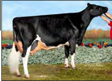
PIERSTEIN DAMION LINDSAY-ET EX-94 EEEEE DAM OF LOT 41