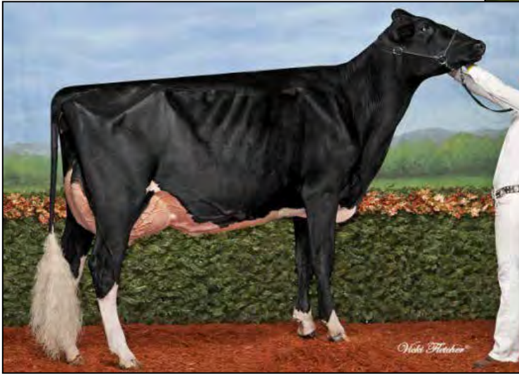
PETITCLERC GOLD SALALAMACCHIA VG-89-CAN @ 2YRS DAM OF LOT 46