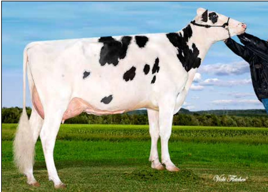
EDG CLAIRE CLING-ET VG-85-CAN 2ND DAM OF LOT 23