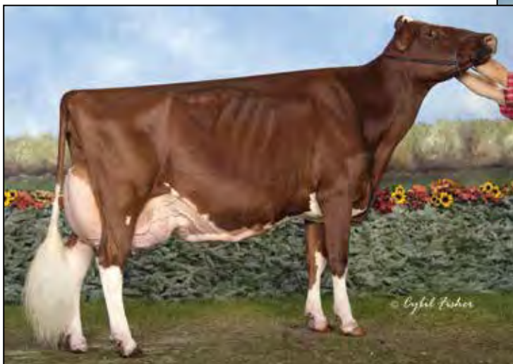
KHW REGIMENT APPLE-RED-ET EX-96 EEEEE 4E DOM 2ND DAM OF LOT 24