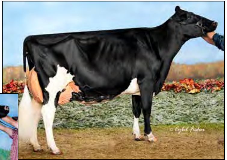
HAZELS GLDWN HATTY-ET EX-96 EEEEE 3E