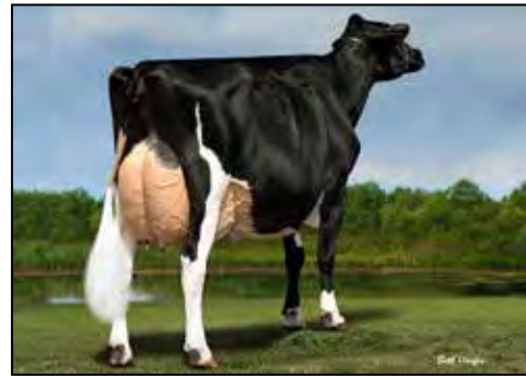
TC SANCHEZ KRISTINA EX-96 EEEEE 2E DAM OF LOTS 36 & 37