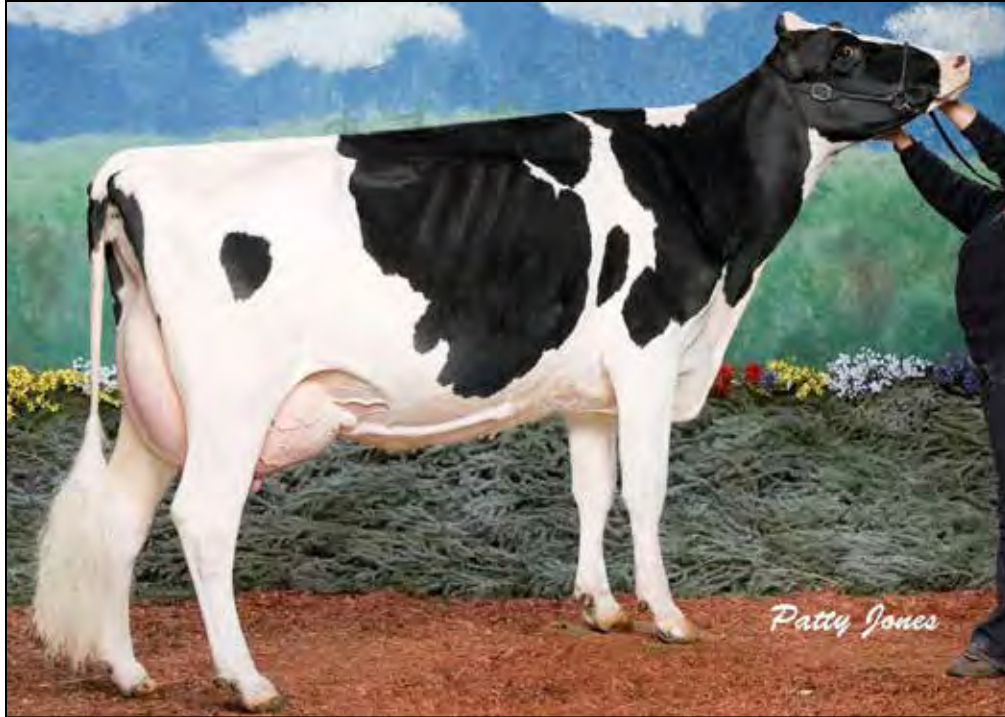
LINDENRIGHT DUNDEE L LAUREL EX-93-CAN 2E 4TH DAM OF LOT 49