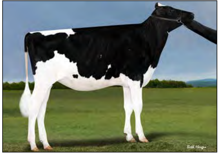
LIZETTES AVA BEADED LACE-ET DAM OF LOT 27