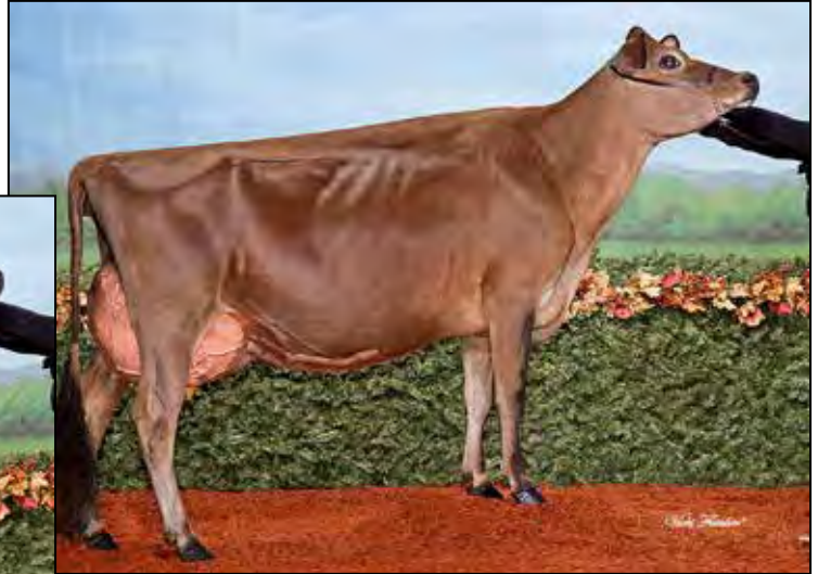
SOUTH MOUNTAIN PREMIER SPRITE EX-91 FULL SISTER TO LOT J5