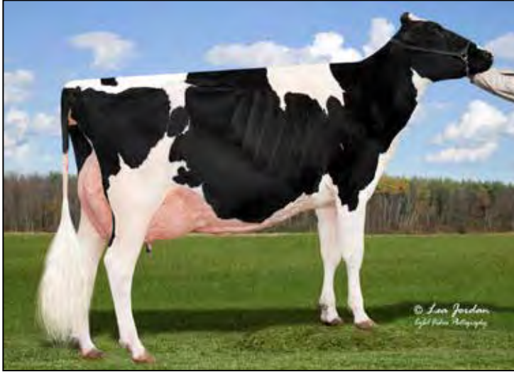
OCD ATWOOD SALSA DANCER-ET EX-94 EEEEE DAM OF LOT 22