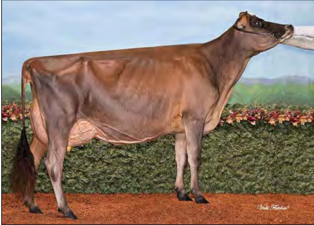
ESPERANZA GA VIVIAN EX-93 DAM OF LOT J1