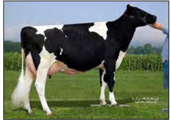
JOLEANNA DUR SPLASH OF RAIN EX-91 EX-MS 2ND DAM OF LOT 22