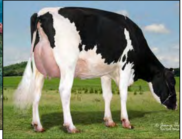
PIERSTEIN DUNDEE ROSALYNE EX-92-CAN 2ND DAM OF LOT 33