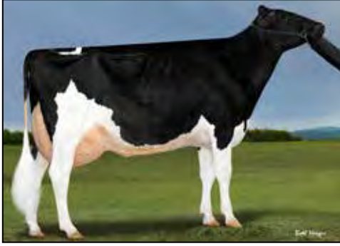
T-TRIPLE-T-ENT PRTY GIRL-ET EX-91 @ 3-05 DAM OF LOTS 16 & 17