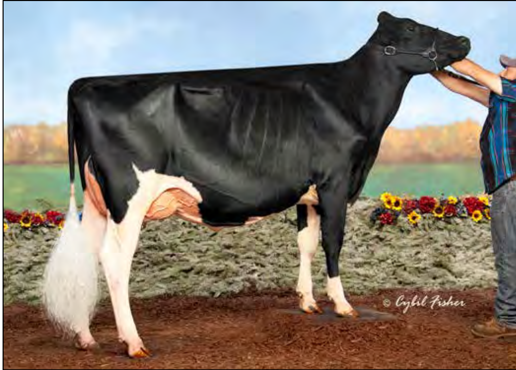
JACOBS ALONZO OBAMA SELLS AS LOT 5