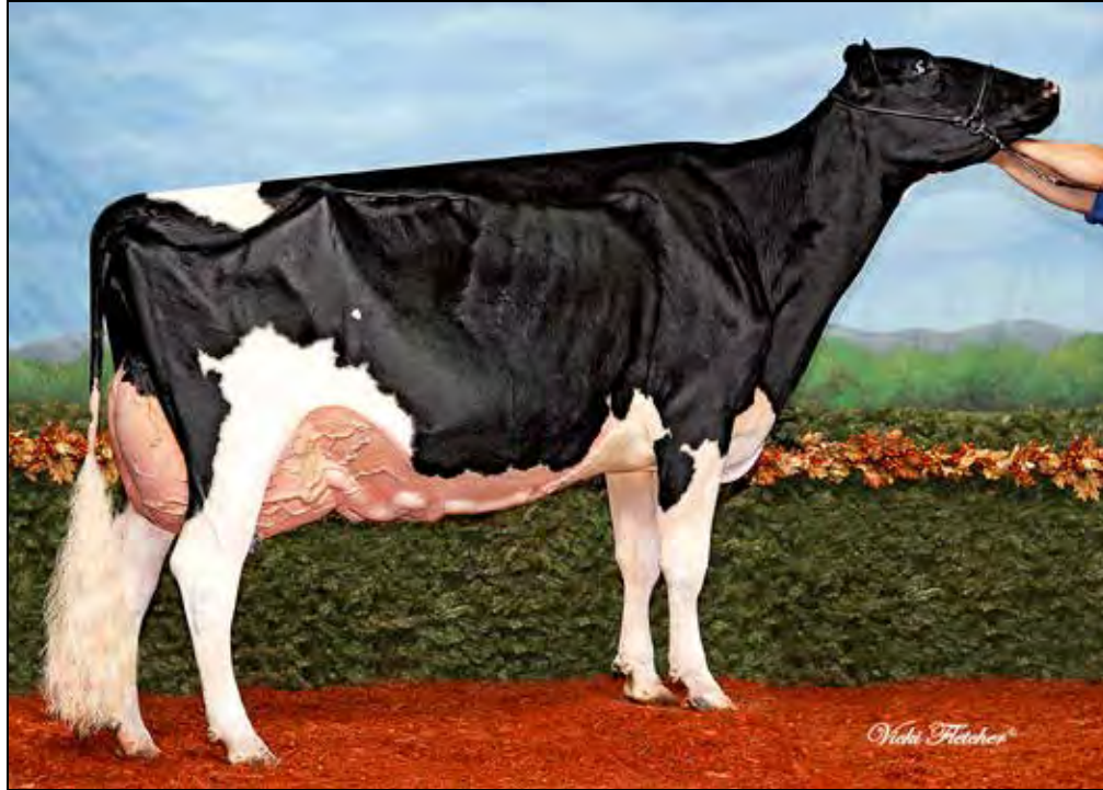
BONACCUEIL MAYA GOLDWYN EX-95 95-MS 2E 2ND DAM OF LOT 38