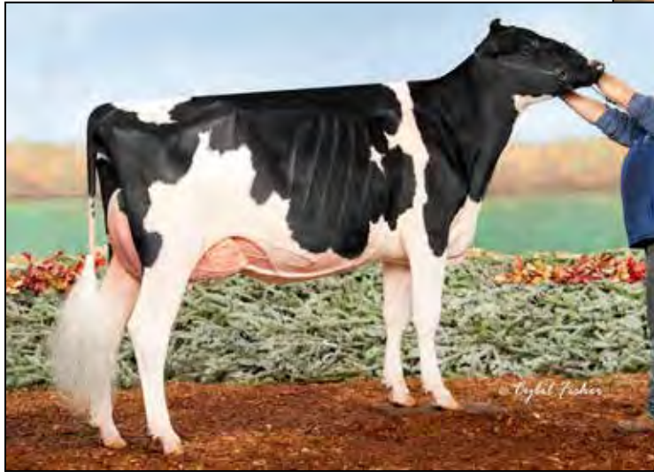
JUNIPER SID CHARDONNAY-ET VG-87 DAM OF LOT 43