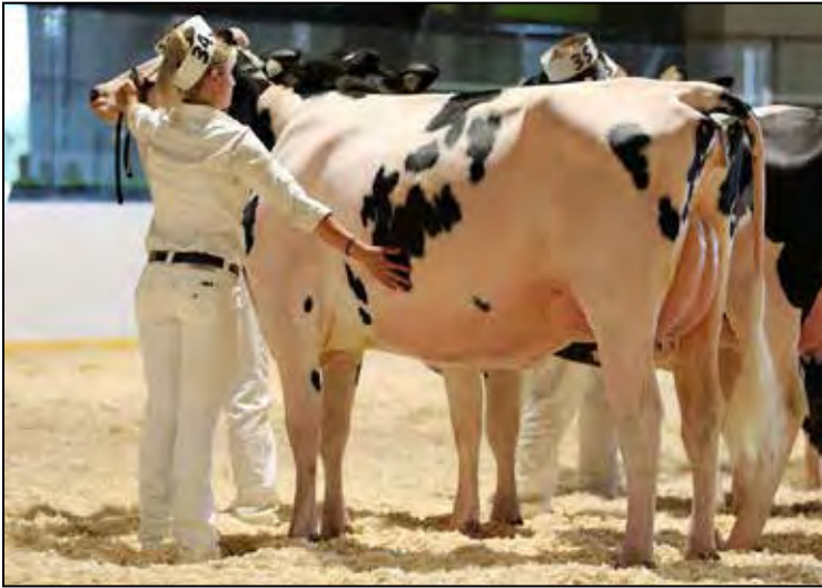
JACOBS SOLOMON BRIDAL SAME FAMILY AS LOTS 1-4