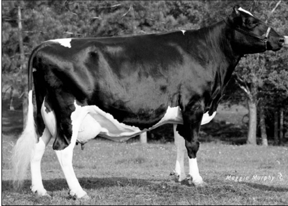
COL-RAY BARRETT MARY EX-93 7TH DAM OF LOT 42