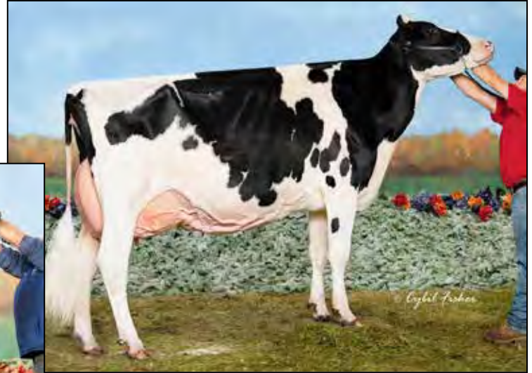
HOWARDVIEWWG GOLD CASEY-ET EX-94 EEEEE 3E 2ND DAM OF LOT 43