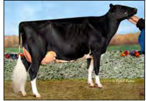
JACOBS SID BEAUTY-ET EX-95 EEEEE 2ND DAM OF LOT C