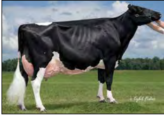
WINTERBAY GOLDWYN LOTTO EX-95 EEEEE 3RD DAM OF LOT 27