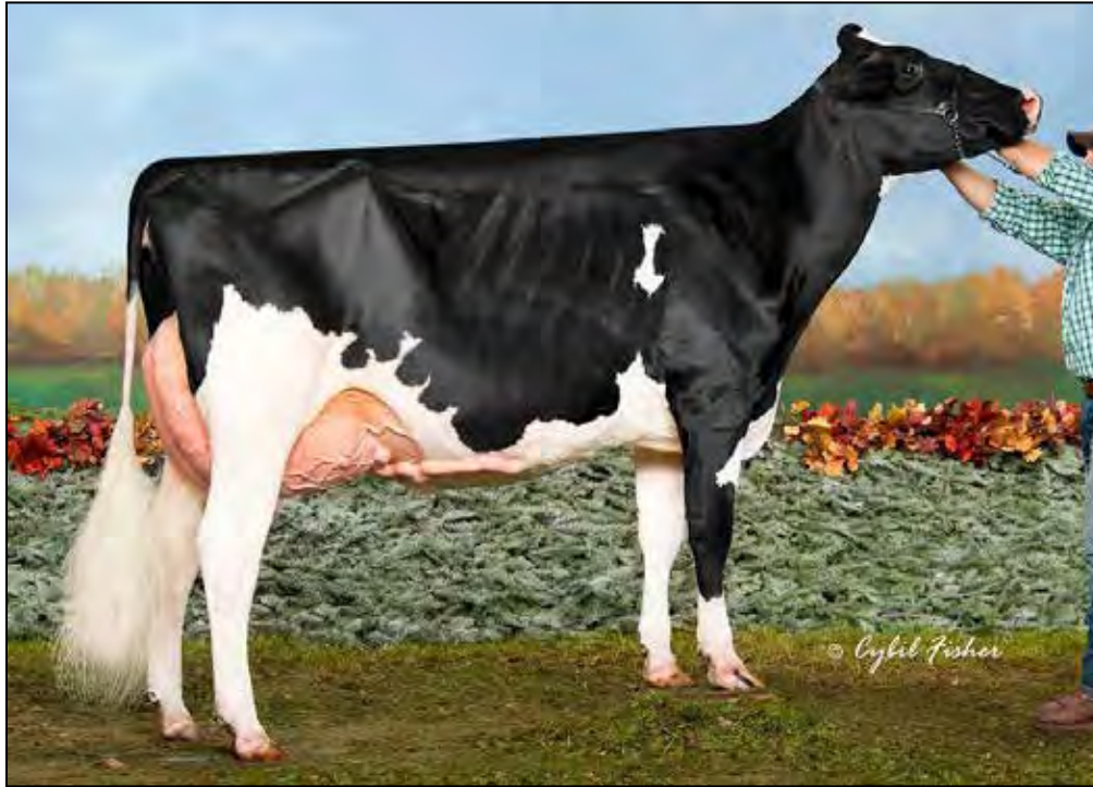
BEAVERBROCK GOLDWYN ZOEY-ET EX-94 EEEEE 2E 2ND DAM OF LOTS 18 & 19