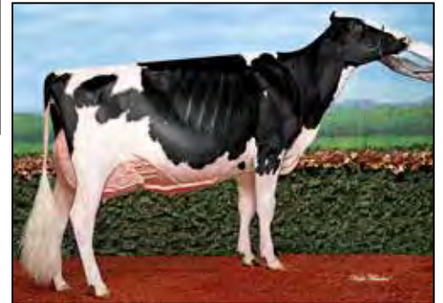
JACOBS GOLD LIANN EX-93 MATERNAL SISTER TO DAM OF LOT 41