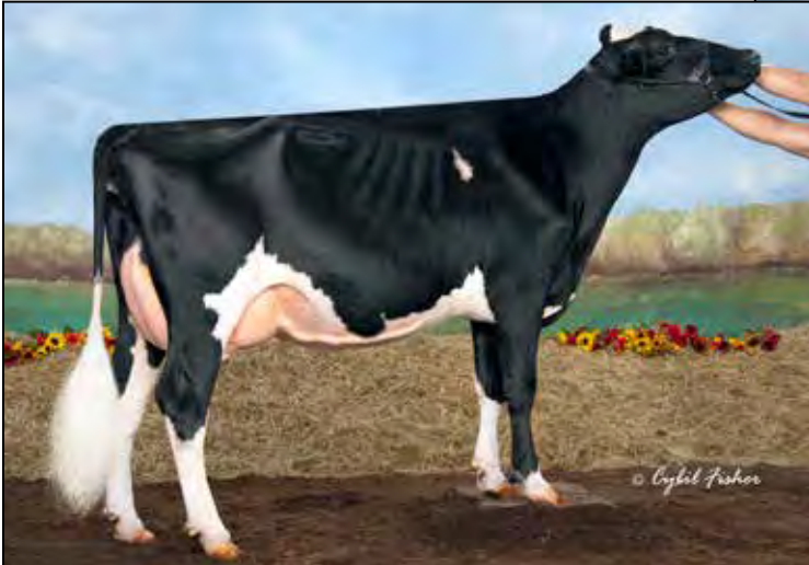
LUNCREST ALEX WICKED-1289 EX-94 EEEEE 3E DAM OF LOT 54