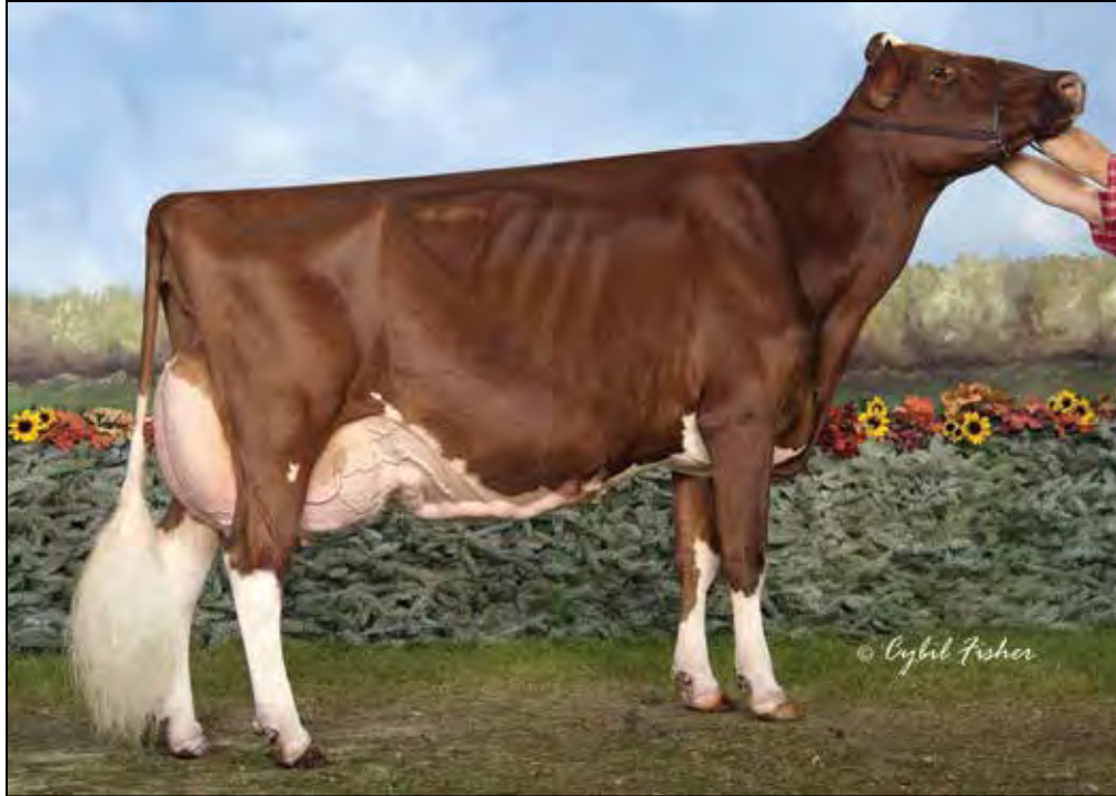
KHW REGIMENT APPLE-RED-ET EX-96 4E DOM 3RD DAM OF LOT 58