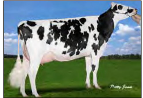
PINE-SHELTER CLAIRE WOOD-ET VG-87-CAN 3RD DAM OF LOT 23