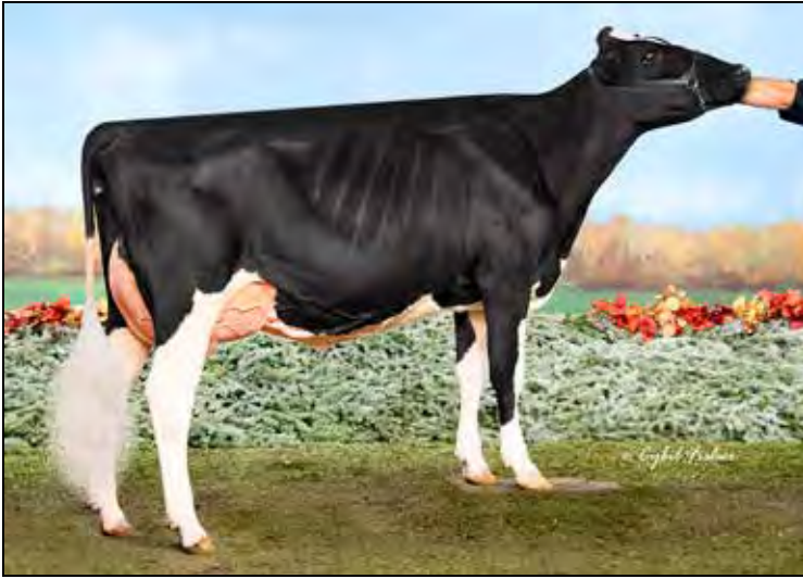
SIDBEAUTY DMPSY BRITTANY-ET VG-88 EX-MS DAM OF LOT C