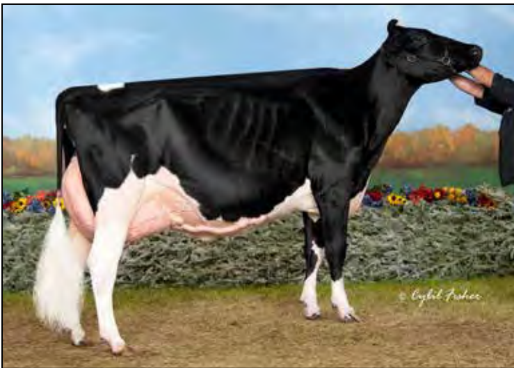
CRAIGCREST RUBIES GOLD REJOICE EX-94