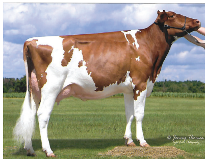
T-FARM TALENT SAPPHIRE-RED EX-91 4Y EEVVE Descendents begin Lot 93