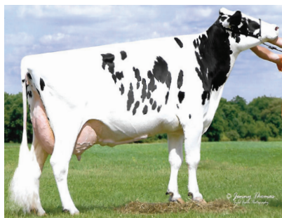
T-FARM JOURNALIST SONATA EX-94 6Y EEEEE Descendents begin Lot 93