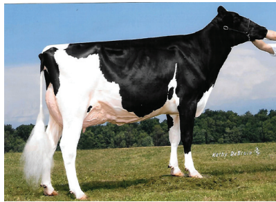
T-FARM GOLDWYN CHRISTY 2E-93 EEEVE Descendents begin Lot 28