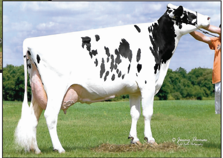
3rd Dam Lots 93, 94 T-FARM JOURNALIST SONATA EX-94 6Y EEEEE Life 2036 151600 4.3 6548 3.2 4917