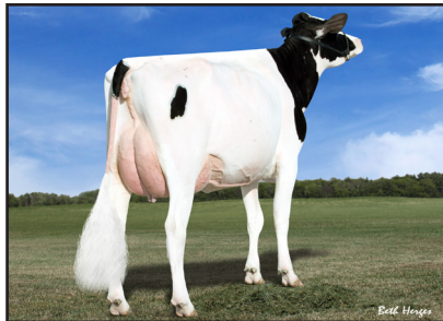
Des-Y-Gen Planet Silk-ET *RC "EX-90" 10* (Fourth Dam of Lot 55)