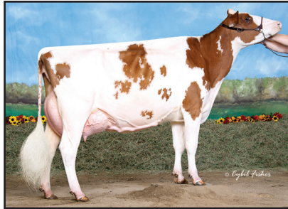
Wilstar Ad Roses Reba-Red "2E-92" (Granddam of Lot 23)