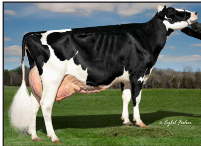
R-R-Letters Atwood Hilda "2E-90" (Dam of Lot 27)