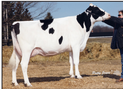
Cherown Marsha "EX-92 3E" (Fourth Dam of Lot 57)