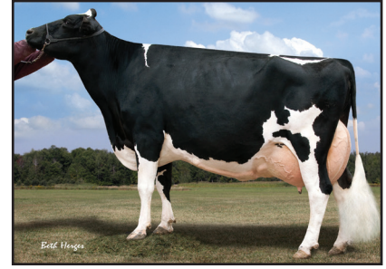
Farmdale Canyon Dazzle *RC "4E-94" GMD (Third Dam of Lot 22)

72182341 Excellent-91 VEVEE 2E *TL *TD 4-05 2x 359d 30,890 4.4 1364 3.0 942 6-06 2x 335d 30,930 4.4 1354 3.1 970 7-07 2x 305d 29,040 4.5 1293 3.2 939 5-06 2x 310d 28,470 4.1 1156 3.1 891 3-04 2x 323d 27,810 4.1 1135 3.0 845 2-00 2x 365d 23,410 4.5 1064 3.3 784 Life: 2173d 183,100 4.4 7977 3.2 5790 S: Ladys-Manor PL Shamrock-ET