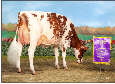
Scenic-Edge Jordan-Red "EX-94" (Full Sister to Lot 10)

2-09 2x 305d 28,230 4.1 1156 3.1 876 •Unanimous All-American R&W Jr. 3 Yr Old 2021 •Unanimous Jr. All-American R&W Jr. 3 Yr Old 2021 •Supreme Champion WDE Junior Show 2021 •All-Canadian R&W Summer Yearling 2019 •HM All-American R&W Summer Yearling 2019 •Junior All-American R&W Summer Yearling 2019