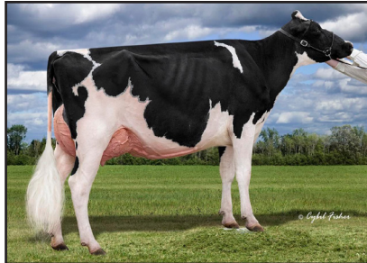
Promise-Haven Doc Kayla "EX-90 EX-MS" (Dam of Lot 13)