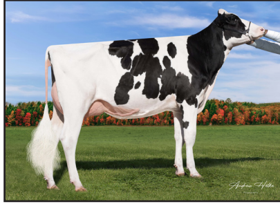
Klinkner Cght My Eye Sylvia (Lot 30)