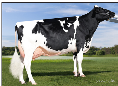
Crest-View-Acres Alexis "VG-86" (Dam of Lot 72)