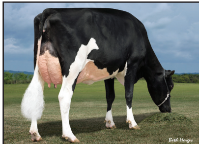
Velthuis Golden Alice-ET "EX-90 EX-MS" (Third Dam of Lot 31)

Due 12/31/22 to Stantons Chief-ET 513HO3190 (ultrasound female)