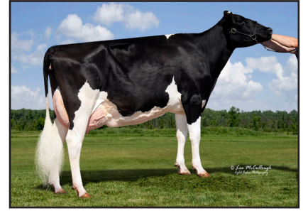
Ms Sugar-C Alexndr Queen-ET "2E-92" (Third Dam of Lot 6)

Sugar-C Diamond Rio-ET EX-92 4-10 3x 305d 38,490 3. 1514 3.1 1187 Sugar-C Mack Elite EX-92 2E 4-01 3x 339d 39,480 3.6 1434 3.0 1165