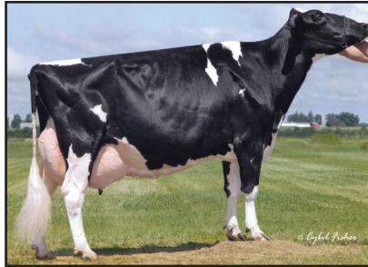
2nd-Look Durhm Juba 3433-ET "2E-95" (Third Dam of Lot 7)