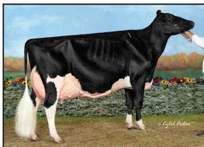
Cookview Goldwyn Monique "3E-96" 2* (Granddam of Lot 47)

840003243996905 • Born December 27, 2021 H.N. 161 99%RHA-I