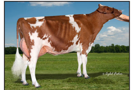
Oakfield-Bro Fritz-Red-ET "EX-92" (Dam of Lot 11)