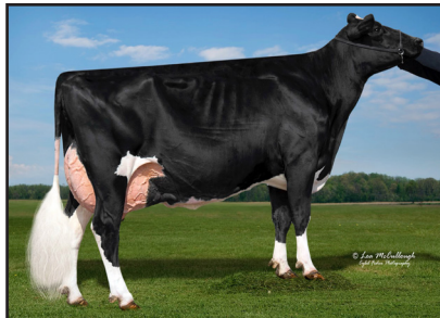
Milksource Damion DD Rae-ET "2E-92" (Dam of Lot 3)