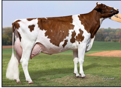
Winterfield Trenda-Red-ET "EX-92" (Third Dam of Lot 56)

Paltzer-JT Adt Tina-Red-ET VG-88 3-06 3x 365d 25,800 4.9 1255 3.6 924 Ms Paltzer JT Tulsa-Red-ET EX-90 EX-MS 5-09 3x 350d 27,450 4.7 1293 3.6 996 •Res. All-Wisconsin Winter Calf 2014