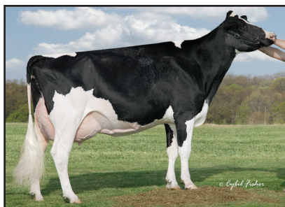
Rhineland Durham Amy-ET "4E-95" (Fourth Dam of Lot 35)