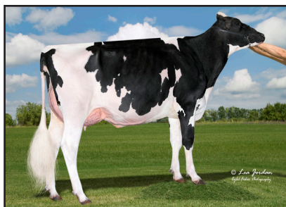
Townlineacre King Doc Lena "VG-89 EX-MS" (Dam of Lot 19)

Walkerbrae Doorman Locket-ET EX-95 EEEEE 4-10 2x 284d 31,833 4.7 1498 3.3 1047 •HM All-American 5 Year Old 2018 •Nom. All-Canadian & All-American Jr. 3 Yr Old 2016 •Grand Champion Vermont State Show 2017 Golden-Oaks Line Em Up-ET EX-94 EEEEE 3-10 2x 365d 38,457 3.8 1467 3.3 1227* •Nom. All-American Fall Yearling 2017 •4th Fall Yearling Int'l Holstein Show 2017