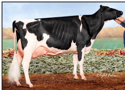
Rbcc-Xtreme V Sid-Evil "EX-92 EX-MS" (Dam of Lot 38)