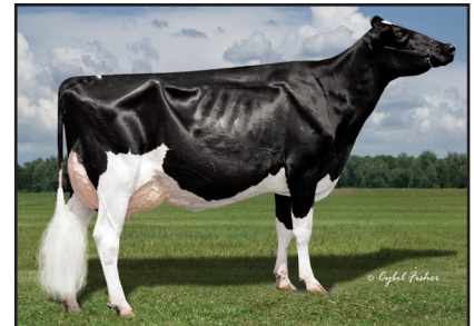
Scientific Gold Dana Rae-ET "2E-95" (Granddam of Lot 3)

69954175 Excellent-92 EEEEE 2E 6-10 4-08 2x 365d 33,580 3.1 1033 3.0 1018 6-07 2x 365d 23,880 3.7 878 3.0 715 2-03 2x 305d 22,520 2.9 649 3.2 726 S: Erbacres Damion