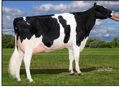
Sugar-C Uno Essay-ET "EX-92" GMD (Granddam of Lot 6)