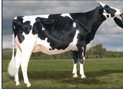
Our-Favorite Expectation-ET "VG-87" (Granddam of Lot 4)

Our-Favorite Undenied-ET VG-87 PTAT +3.16T Our-Favorite C Limitless-ET PTAT +3.62 Our-Favorite Drifter 124-ET PTAT +3.45 Our-Favorite Upgrade-ET PTAT +3.37 Our-Favorite Unrivald-ET *RC PTAT +3.35 Our-Favorite King Doc 51-ET PTAT +3.17 Our-Favorite Avinche 135-ET PTAT +3.10 Our-Favorite Untouchable-ET PTAT +3.02