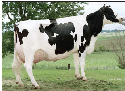
Crest-View-Acres Luke Tatum "3E-93" (Fifth Dam of Lot 1)