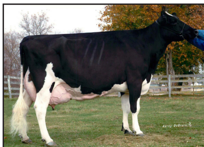
Driftline Redstar Paisley "4E-94" (Fourth Dam of Lot 43)

840003230758068 • Born June 9, 2022 H.N. 679 99%RHA-I