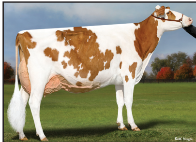
Mead-Manor Def Adeline-Red "EX-94" (Dam of Lot 41)

Mead-Manor Sol Adoration *RC EX-91 EX-MS 3-00 3x 318d 27,500 4.0 1105 3.2 869