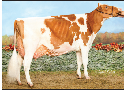
Heatherstone Redhot-Red "EX-92" (Dam of Lots A & B)