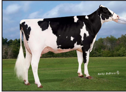
Morningview Uno Regina-ET *RC "2E-91" (Dam of Lot 2)

Y-Whisper Silver Royalty-ET *RC EX-94 2E 5-03 2x 365d 33,515 4.6 1544 3.4 1148" Dam of: Trent-Way-JS Ronald-ET *RC +2613 GTPI 250HO14465