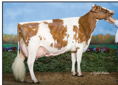
Derrwyn Special Missy-Red "2E-92" GMD DOM (Third Dam of Lots 28 & 29)

71242684 Excellent-92 EEEEE 5-02 2-00 2x 365d 31,840 3.9 1232 3.2 1017 5-05 2x 352d 33,040 3.7 1226 3.1 1036 3-03 2x 339d 30,350 3.2 981 3.1 948 Life: 1118d 100,110 3.6 3622 3.2 3165 S: Hunsberger Alchemy-ET *RC