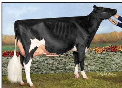
Budjon-JK Damion Eklipse-ET "2E-94" (Maternal Sister to Dam of Lot 39)

Bred 7/02/22 to Mr Chassity Gold Chip-ET 7HO10920 (sexed semen)