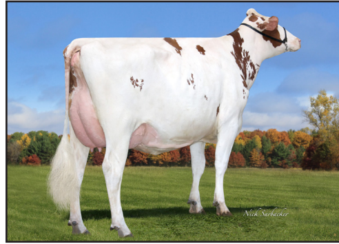
C-Haven Alchem Motto-Red-ET "EX-92" (Dam of Lots 28 & 29)