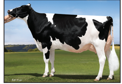
Our-Favorite Unlimited "3E-94" (Third Dam of Lot 4)

Our-Favorite Endless-ET EX-94 2E Our-Favorite Reckoning-ET EX-94