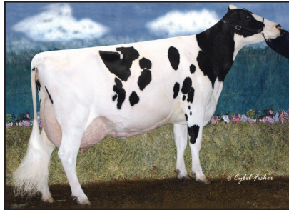
Elm-Lawn-G Linjet Milkshake "3E-94" (Third Dam of Lots 20 & 21)