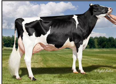
Hilrose Goldy Perfection-ET "2E-93" GMD (Granddam of Lot 25)