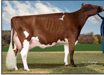
Elm-Mound Advnt Rein-Red-ET "2E-91" (Granddam of Lot 12)