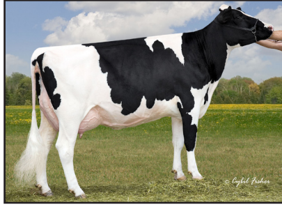
Elm-Lawn-G Cousteau Maggie "3E-93" (Third Dam of Lot 20)