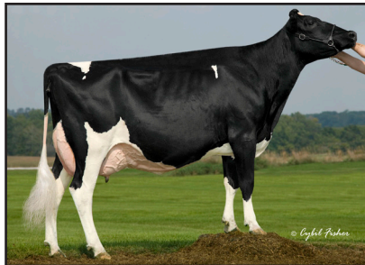
Budjon-JK Durham Exclaim-ET "2E-93" (Fourth Dam of Lot 37)