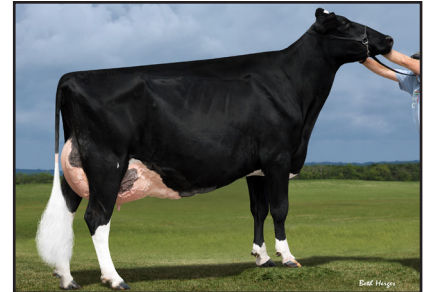
Welk-Shade Atwood Koko-ET "3E-95" (Maternal Sister to Granddam of Lot 13)

3203042622 Excellent-90 EEVEE 3-09 *TR *TC 3-00 2x 291d 25,243 3.8 969 3.0 760"RIP S: Woodcrest King Doc