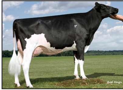
Hicklee Goldwyn Good-Tw-ET "2E-94" (Fifth Dam of Lot 40)

Bred 8/30/22 to Avant-Garde-I KD Summerfest-ET 94HO19370