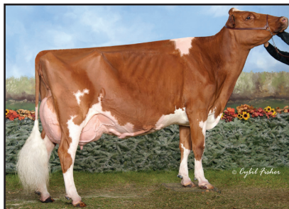
Wilstar-RS Tit Limited-Red "2E-94" (Fourth Dam of Lot 46)

840003231723659 • Born December 30, 2021 H.N. 309 99%RHA-I