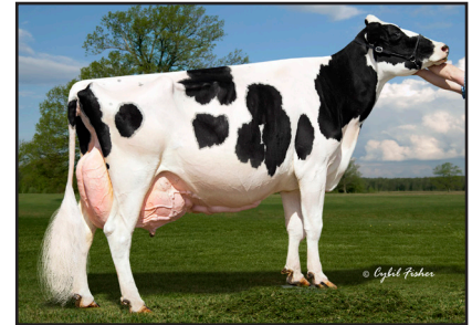
Dorsland Ely Evelyn-ET "3E-94" (Dam of Lot 5)

62823578 Excellent-94 EEEEE 3E 10-4 7-07 2x 365d 34,330 3.4 1179 2.9 995 5-11 2x 365d 38,360 3.0 1141 3.1 1173 4-02 2x 365d 32,360 3.4 1094 3.0 964 3-01 2x 325d 30,420 3.0 917 3.0 919 2-00 2x 331d 24,930 3.3 826 3.0 752 Life: 2274d 199,580 3.4 6803 3.1 6135 *3rd 150,000 lb. Cow Midwest Spring Nat'l 2014 S: Oseana Astronomical-ET