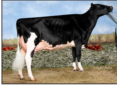
Carlidot Goldwyn Carlin "EX-93" (Granddam of Lot 36)