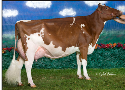
Red-Vision Dis Della-Red-ET "3E-92" GMD (Third Dam of Lot 51)