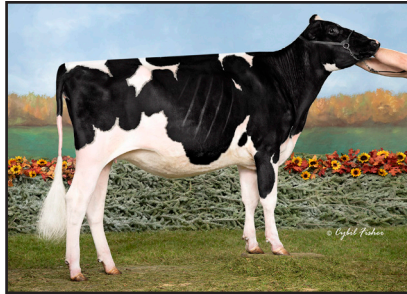
Dreamhaven Tropic Riviera (Maternal Sister to Dam of Lot 17)

Dreamhaven Chrome Rhetoric EX-90 EX-MS 4-03 3x 365d 37,070 4.1 1533 3.2 1174