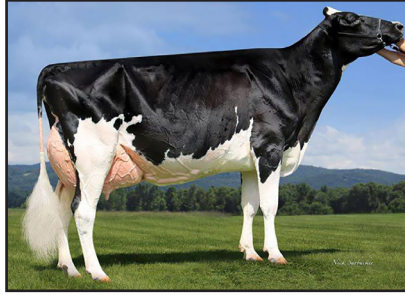
KY-Blue GW Debbie-ET "4E-94" (Third Dam of Lot 44)

840003224857858 • Born December 4, 2021 H.N. 892 99%RHA-I