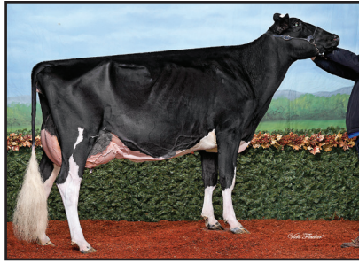
Comestar Hodree Goldwyn-ET "EX-91" (Dam of Lot 48)

Comestar Hopra Atwood-ET EX-93 4-08 2x 365d 36,260 4.5 1645 3.4 1233 •Nom. All-American Milking Yearling 2016 •Nom. All-Canadian Milking Yearling 2016