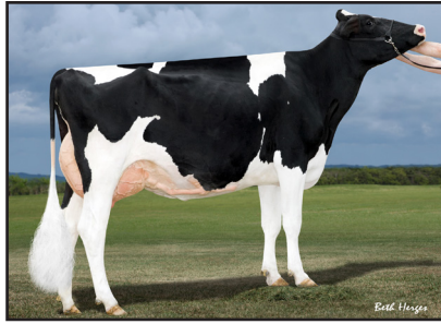
Hilrose Baltimore Penny-ET "EX-93" GMD (Granddam of Lot 26)

Bred 9/10/22 to Stantons Chief-ET 513HO3190