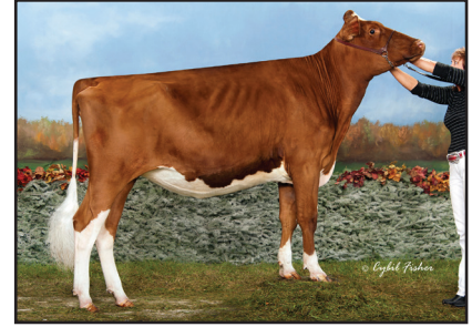
Lyn-Vale Cherrypepper-Red "VG-89" Unanimous All-American R&W Winter Yrlg 2014 (Maternal Sister to Dam of Lot 52)

3126667584 Very Good-88 EX-MS 6-03 5-09 2x 365d 28,970 4.7 1366 3.4 982 4-06 2x 365d 28,690 4.3 1224 3.3 953 3-05 2x 345d 25,110 4.5 1139 3.4 865 2-03 2x 365d 22,240 4.6 1030 3.5 780 Life: 1489d 107,860 4.5 4907 3.4 3684 S: Mr Apples Armani-ET *RC