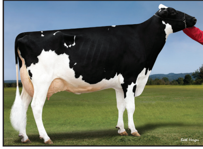
Merklina Doorman Pallas-ET "2E-93" (Granddam of Lot 54)