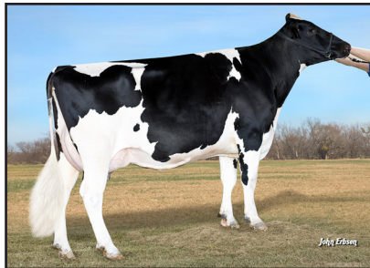
Roylane Shot Mindy 2079-ET “VG-86” DOM (Fourth Dam of Lot 33)