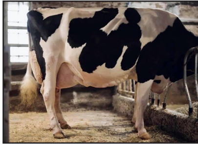
Opsal Mogul Cortney-ET “2E-94” (Granddam of Lot 32)