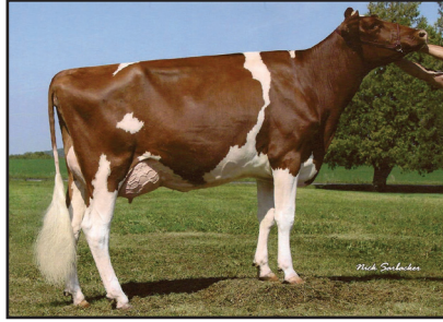
Lyn-Vale Ad Chilipepper-Red "VG-88 EX-MS" (Granddam of Lot 52)

Lyn-Vale Cherry Wine-Red-ET VG-88 EX-MS •Res. All-American R&W Winter Yearling 2016 •Junior Champion Int'l R&W Jr. Show 2016 •Jr. All-American R&W Winter Yearling 2016