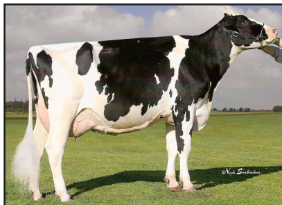
Swaindale RM Godiva "EX-90" (Third Dam of Lot 58)