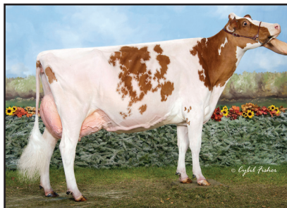
Budjon-Nitzzy Destiny-Red-ET "2E-94" (Granddam of Lot 42)

840003231723656 • Born September 10, 2021 H.N. 306 99%RHA-I