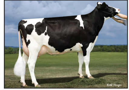
Merklina Iota Penya "VG-86" (Third Dam of Lot 54)