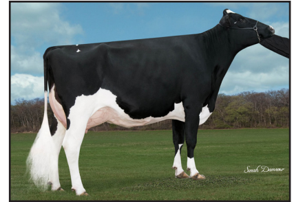
Dreamhaven Gold Chip Reva "VG-87" (Granddam of Lot 17)