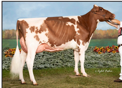
Trav-Annah Fantasy-Red-ET "VG-87" (Maternal Sister to Lot 11)