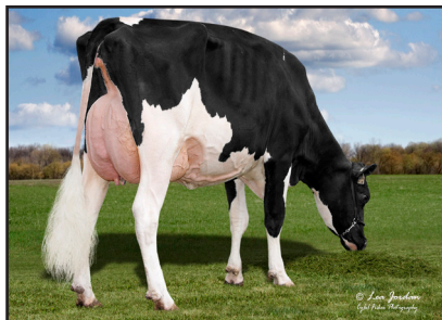
Jimtown KD Narcisa-ET "VG-88" (Dam of Lot 18)