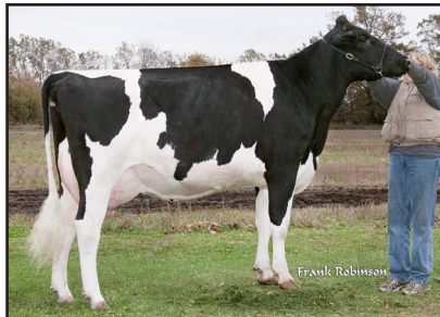
Winterfield LJ Stormy-Rae "EX-91" (Fourth Dam of Lot 45)

840003203805336 • Born March 1, 2022 H.N. 14 99%RHA-I