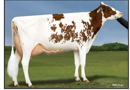
Kamps-Hollow Des Accent-Red "2E-94" (Maternal Sister to Lot 8)

Kamps-Hollow Altitude-ET *RC 2E-95 2* DOM 7-00 2x 365d 39,690 4.7 1849 3.5 1385 Life: 1844d 144,460 4.4 6295 3.7 5288