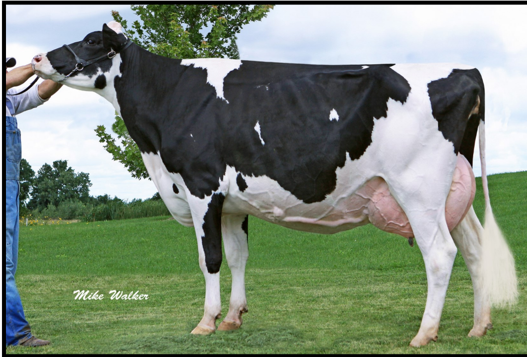
STE-PEN Distinctive Wise-ET