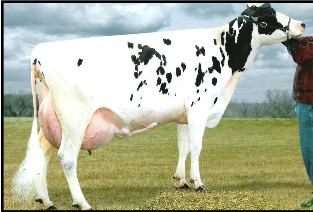
Miss Roedale Out Franny-ET