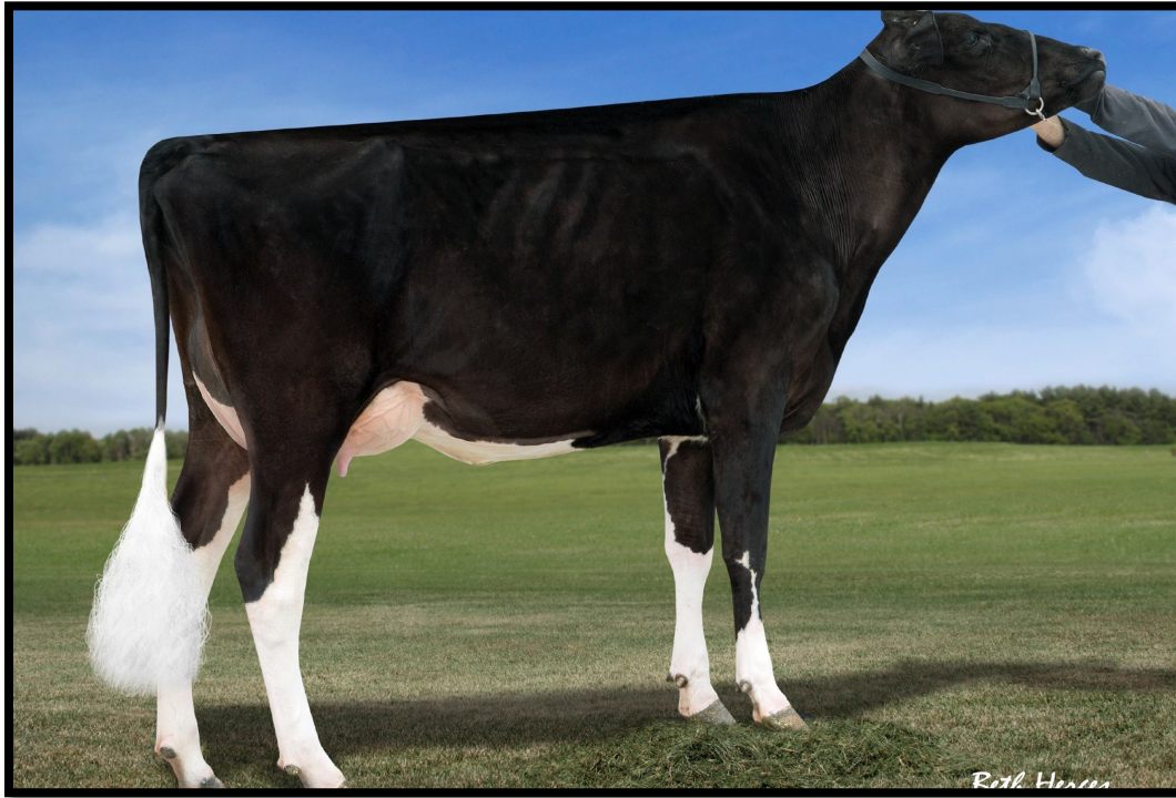
Quiet-Man Alexander 2309-ET