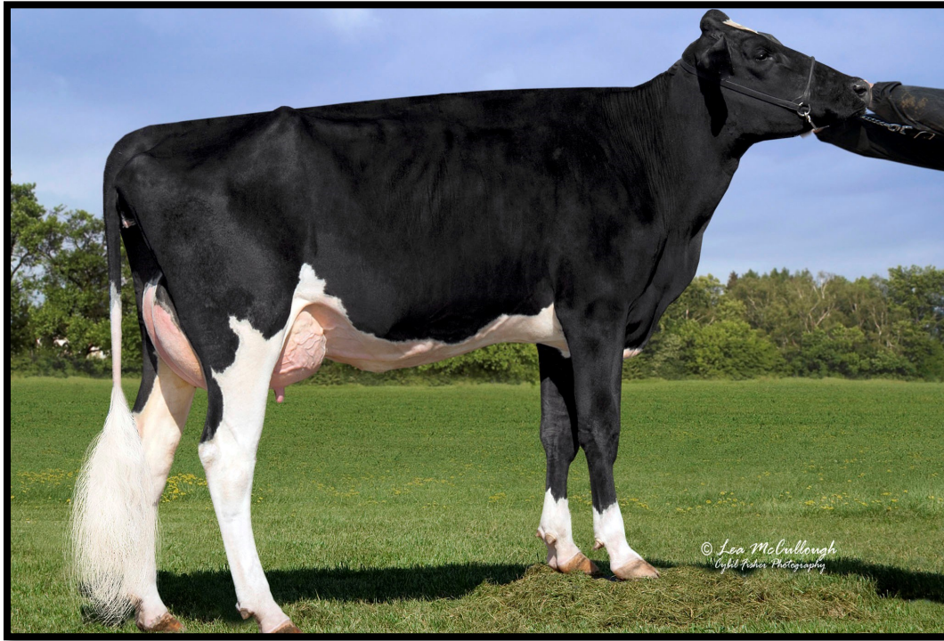
Woodcrest Domain Yeah-ET