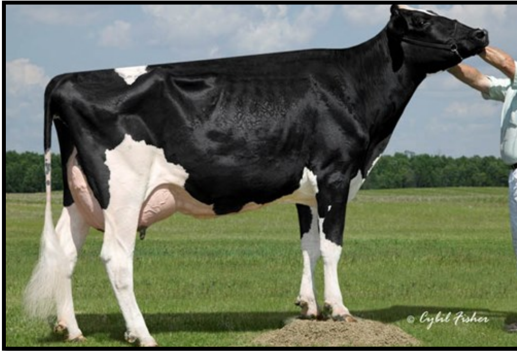
Windsor-Manor Z Delight-ET