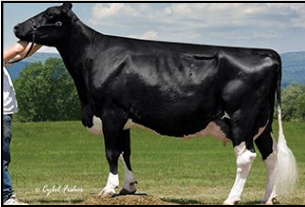
Springway Finley Clarisa-ET