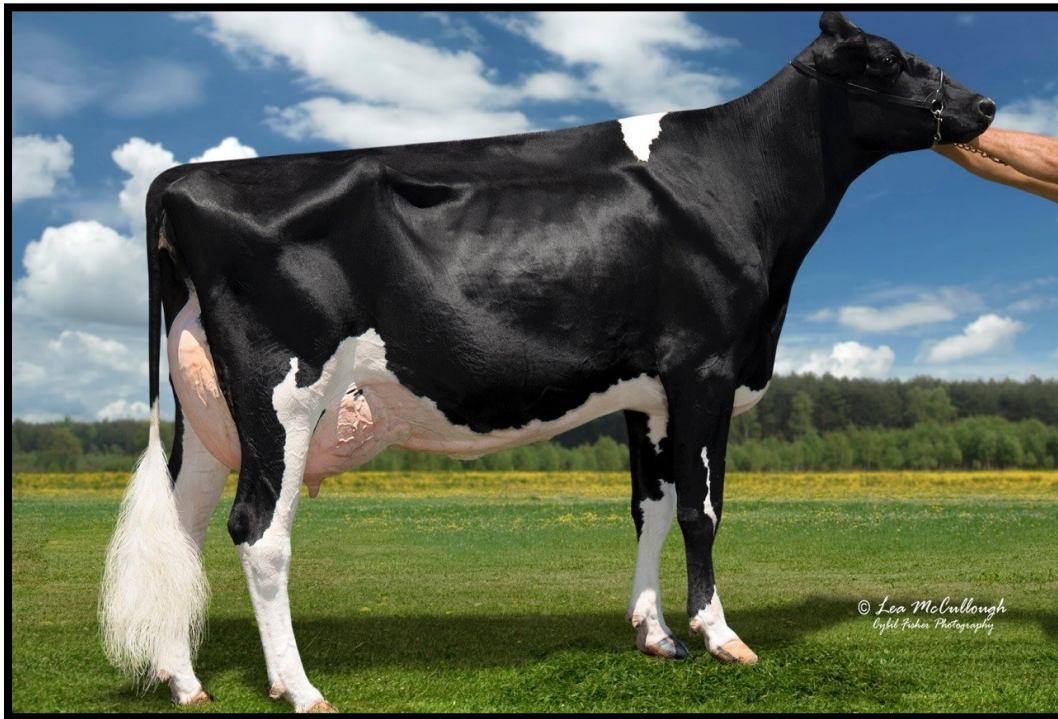
Gillette Lauthority 2nd Run-ET