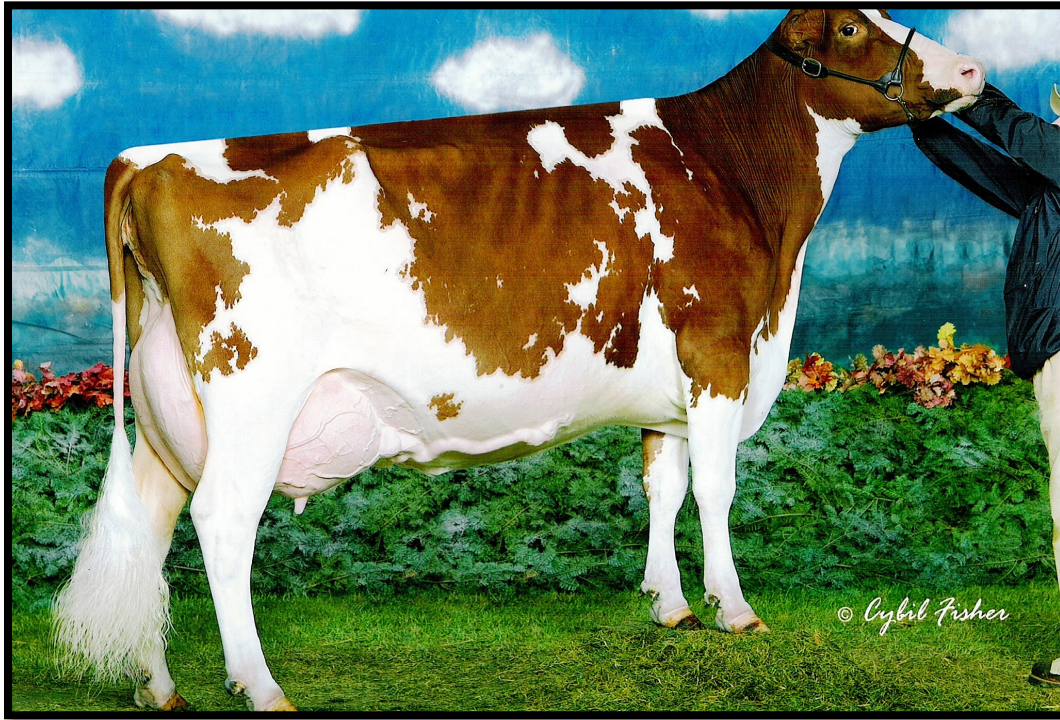
DERRWYN MISS SPECIAL-RED-ET