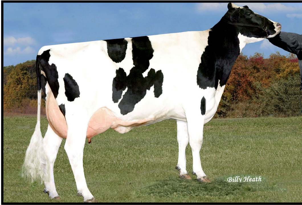
Whittier-Farms Toy Carol-ET