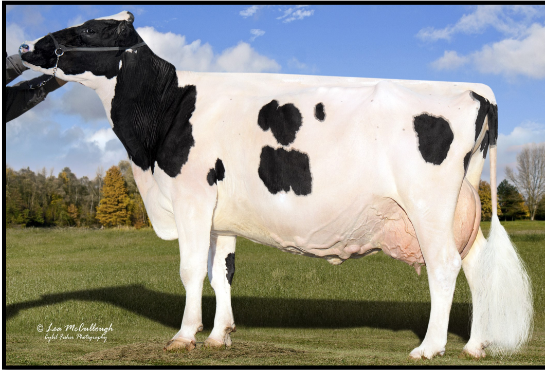
MS Roedale Fashlyn