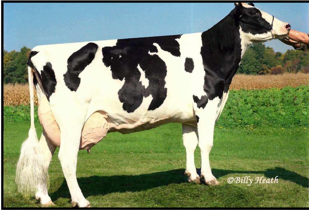
Stone-Rise Manat Smacks