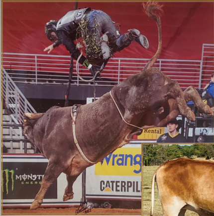
8194 BLUE DUCK