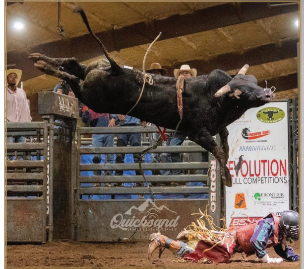
CONSIGNOR: H BAR E