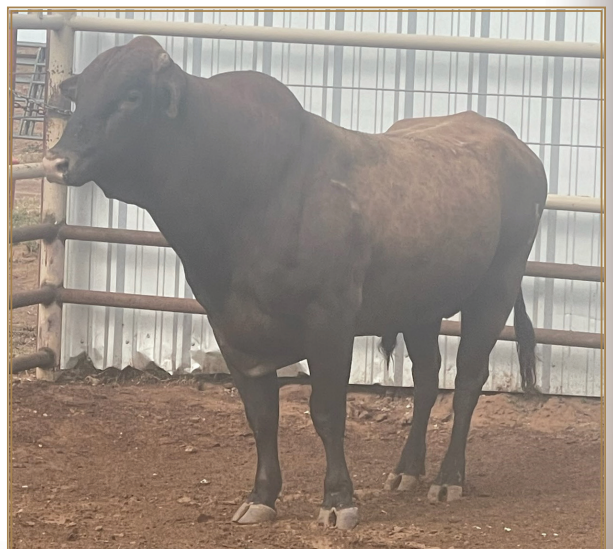
CONSIGNOR: FRONTIER RODEO CO

This bull lived on the truck from June to August. He was bucked at all of the Frontier's PRCA Rodeos. He can handle being on the road and eats on the road. Reserves the rights to collect 200 straws of semen.