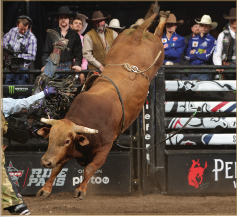
CONSIGNOR: D&H CATTLE Co