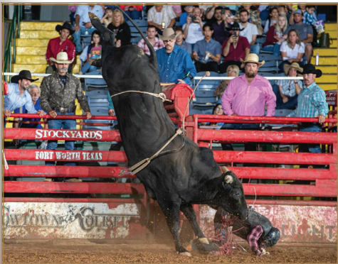
CONSIGNOR: X-FACTOR/GENTLEMEN'S CLUB

This is a special offering of a rank bull and a true breeding piece! Magic Carpet has been a standout from the start. He has had a ton of intensity and ability from the time we started him. He was on the top end of that set of calves and has stayed there. He was hauled a bunch as a futurity calf and placed most of the time. With a cowboy he has only gotten better. He is a hotter kind of bull and has had some outstanding trips. He has been on the truck and knows how to handle the road. This is an outstanding sire prospect. Sired by Magic Maker, one of the best sires we have raised to date, and out of an incredible cow family. He has Shepherd Hills Tested on both sides, and that has worked very well for us over the years. Don't miss out on a sound young potential super star and a potential super sire.