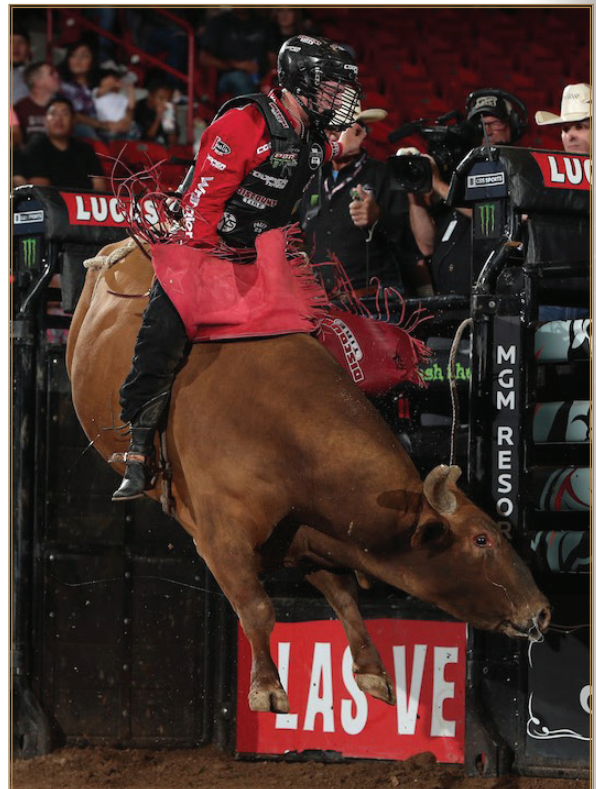
CONSIGNOR: YOUNT BUCKING BULLS, LLC

Page 82B is Page bred top and bottom and stacked with producers! He is sired by 52U Midnight Mood, who is a son of the great 194 Smooth Move and out of the dam to 205 Holy Moly, 602 Wild Child, S45 High Society, and more! Midnight Mood was a super producer that passed away too soon. In his limited offspring, Midnight Mood has progeny earnings of over $265,000! A few of his notable sons include: 05A After Midnight, 44A Smooth Over, 08B Hostage, 4A After Midnight, and 484B Quick Fix! Page 82B's dam, Page 882U, is a direct daughter of the legendary 36 Backlash! Backlash females have been a cornerstone in the prominent D&H program for years. Page 882 is the maternal granddam to futurity stud and derby standout 289 Sonny B who has been marked as high as 95 points in his career! 82B is stacked with producing genetics top and bottom and he has already sired money earning offspring as well! On top of being a producer himself, he has also proved himself in the arena with multiple PBR outings and a career high ride score of 89 points by Cody Jesus! This bull is the total package in terms of a breeding piece and should fit anyone's program!