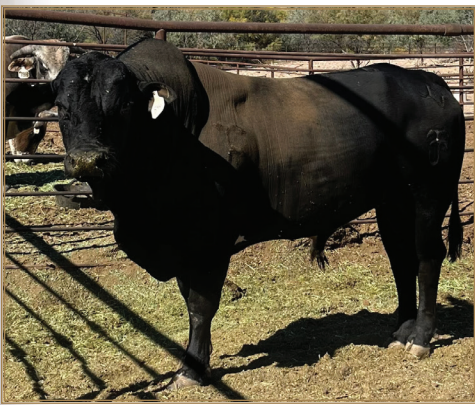
CONSIGNOR: FRONTIER RODEO Co

This jam up red bull is as electric as you could ask for one to be. He's tight made, a money earner and has had some outstanding trips. He has been on the rodeo truck and to the bull ridings and handles it all. He's in the gate to the right with a ton of kick and intensity. When he puts it all together, he is as impressive as it gets. He comes into the finals with the ability to win a lot more money and has a huge future ahead of him. He is seasoned and ready to go. We have bred to him as well, he has the kind of action and ability to get off the ground we look for in a potential sire, his calves should be the kind.