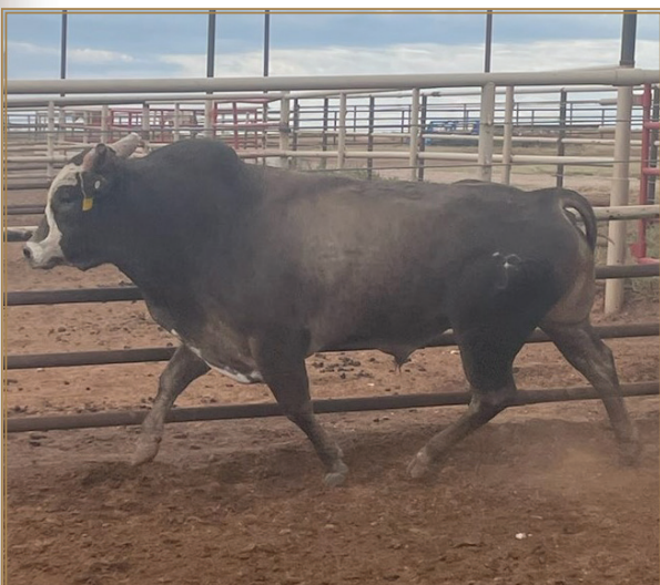
CONSIGNOR: FRONTIER RODEO CO

This bull lived on the truck from June to August. He was bucked at all of the Frontier's PRCA Rodeos. He can handle being on the road and eats on the road. Reserves the right to collect 200 straws of semen.