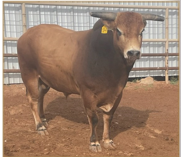
CONSIGNOR: FRONTIER RODEO CO

This bull lived on the truck from June to August. He was bucked at all of the Frontier's PRCA Rodeos. He can handle being on the road and eats on the road. Reserves the rights to collect 200 straws of semen.