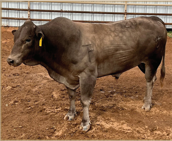
CONSIGNOR: FRONTIER RODEO CO