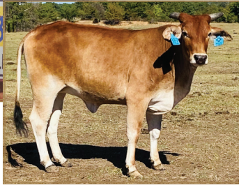
CMC 387 MISS SOLO TIME