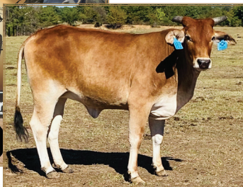
CMC 387 MISS SOLO TIME