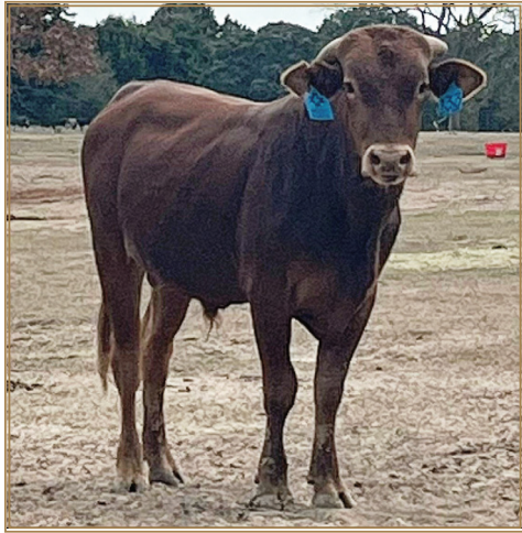
CONSIGNOR: CORD McCOY