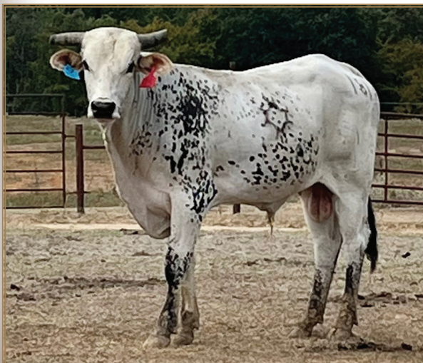
CONSIGNOR: CORD McCOY

167 is up and down in the gate everytime. Ready to go compete. Stands good and handles great for any class.