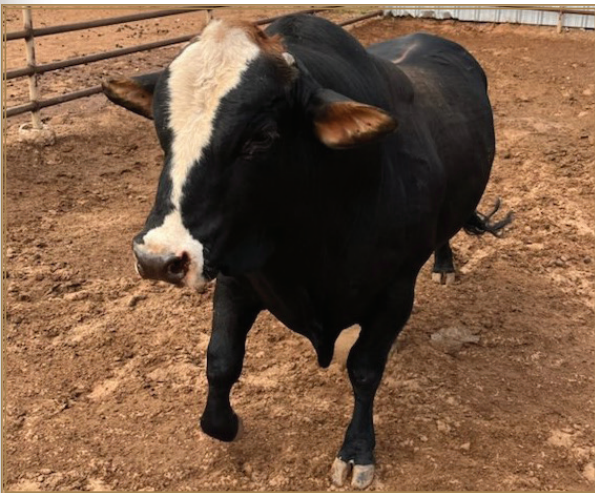
CONSIGNOR: FRONTIER RODEO CO

This bull lived on the truck from June to August. He was bucked at all of the Frontier's PRCA Rodeos. He can handle being on the road and eats on the road. Reserves the rights to collect 200 straws of semen.