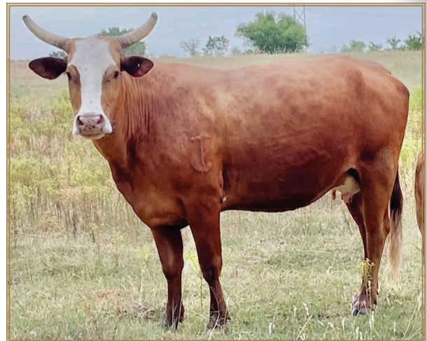
CONSIGNOR: ROCKIN T RANCH

This dam is mother to the 2021 World Champion Derby bull, War Department, whose LTE earnings are over $75,000. R3 has produced keeper females. R3 is bred to Rockin T 45 who has offspring whose earnings are nearly $160,000. Offering 50% with option to double to own full ownership. 50% ownership of calf in her belly. Cow will remain with Rockin T Rodeo Ranch. All future plans of flush will be discussed and everything will be split 50/50.