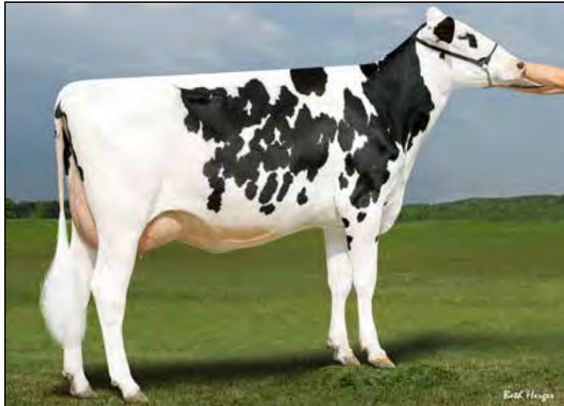
ARBOR-HAVEN LUSTER P TINAEH GP-83 @ 2-01 SELLS AS LOT 17