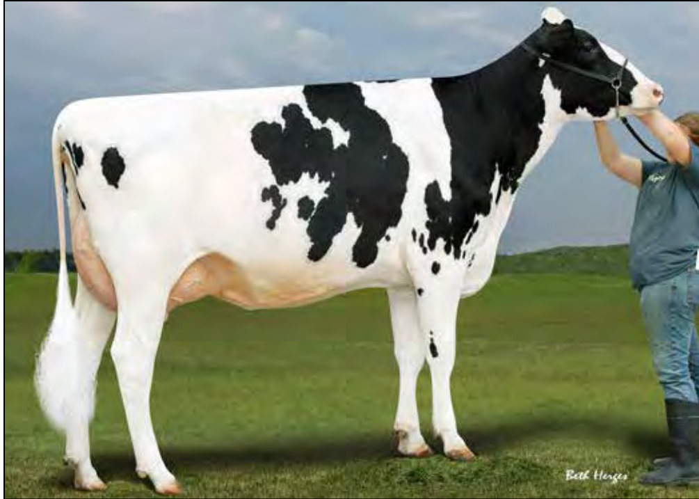
PALMCREST PHARO TALIA VG-86 VG-MS @ 2-11 SELLS AS LOT 6 DAM OF LOT 7