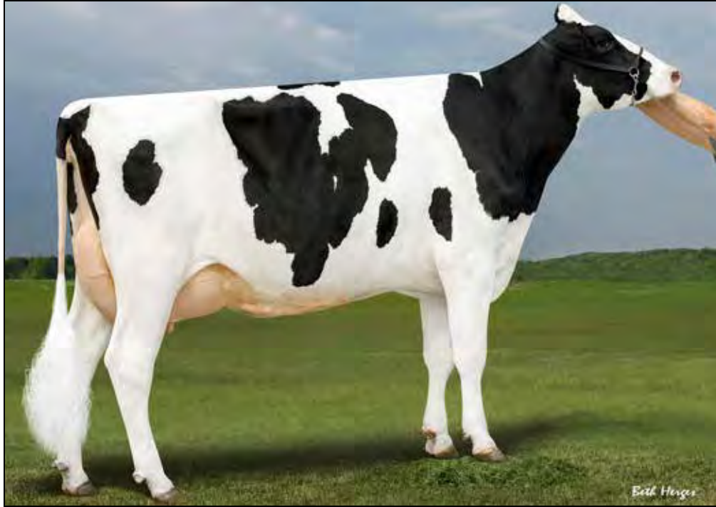
PALMCREST DOC SIMPLE VG-87 VVVVV @ 2-03 SELLS AS LOT 116 DAM OF LOT 117