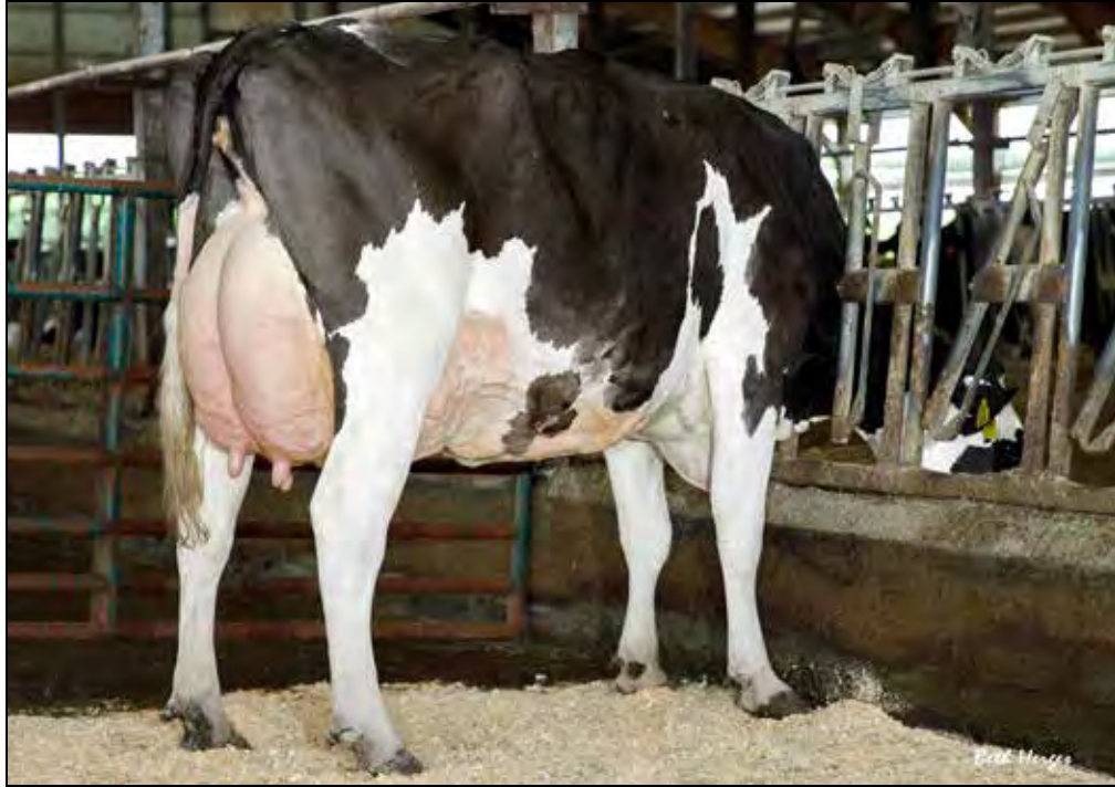
PALMCREST UPRIGHT BRIO VG-88 VG-MS SELLS AS LOT 68 DAM OF LOT 69