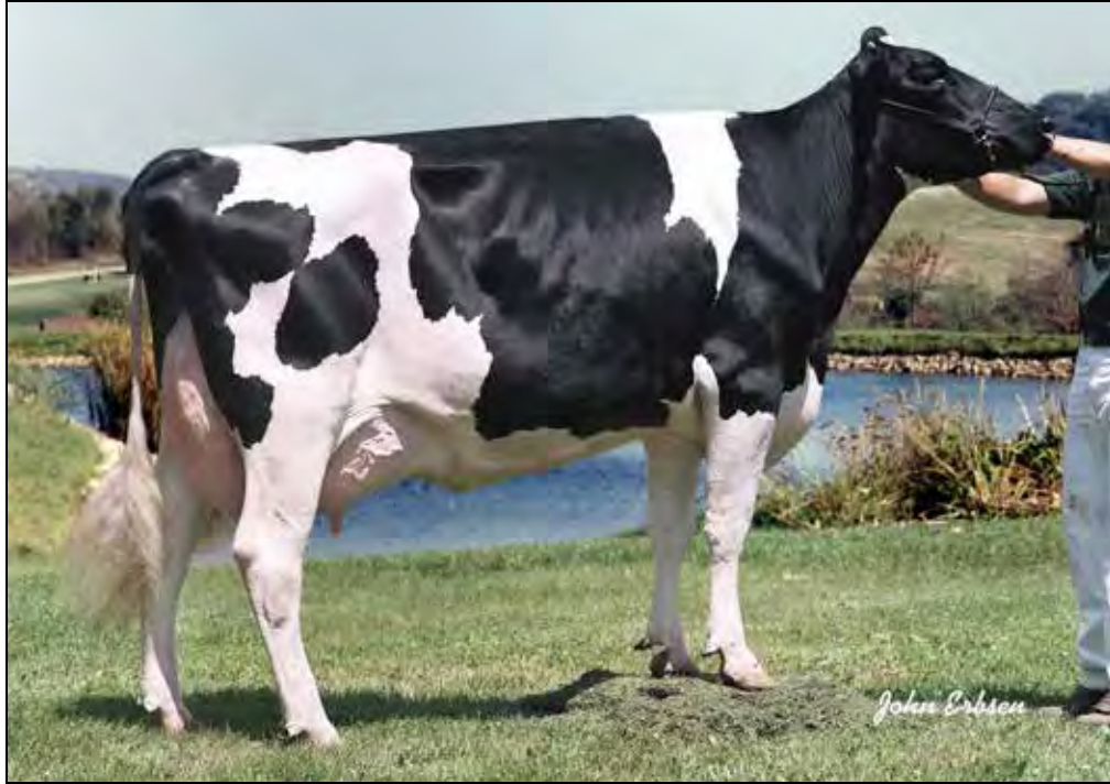
REGAN-JOY DURHAM REGENIA-ET EX-92 GMD DOM 7TH DAM OF LOT 204