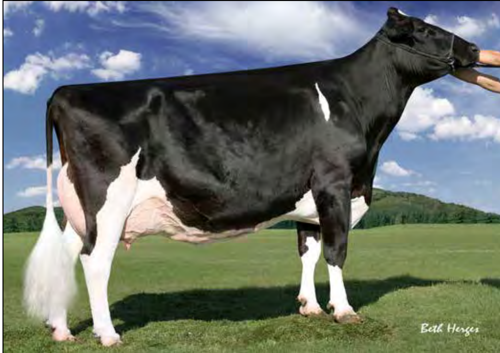
REGANCREST-PR BARBIE-ET EX-92 GMD DOM FULL SISTER TO RGNCREST DURHAM BLISS