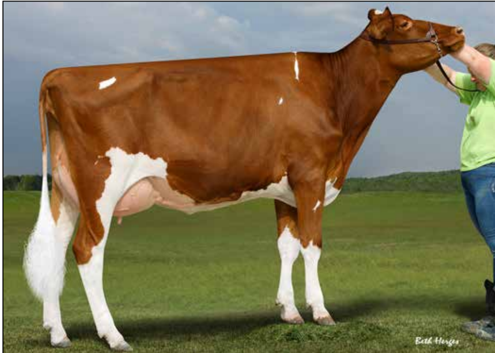
ARBOR-HAVEN RGR CHARLIE-RED GP-83 @ 1-11 SELLS AS LOT 24