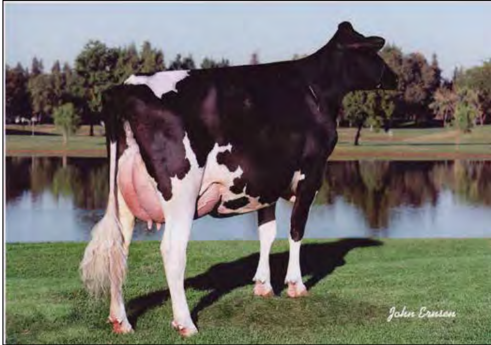
RGNCRST-RH DURHAM BLISS-ET VG-89 EX-MS GMD 3RD DAM OF LOT 25 MATRIARCH OF LOTS 25-62