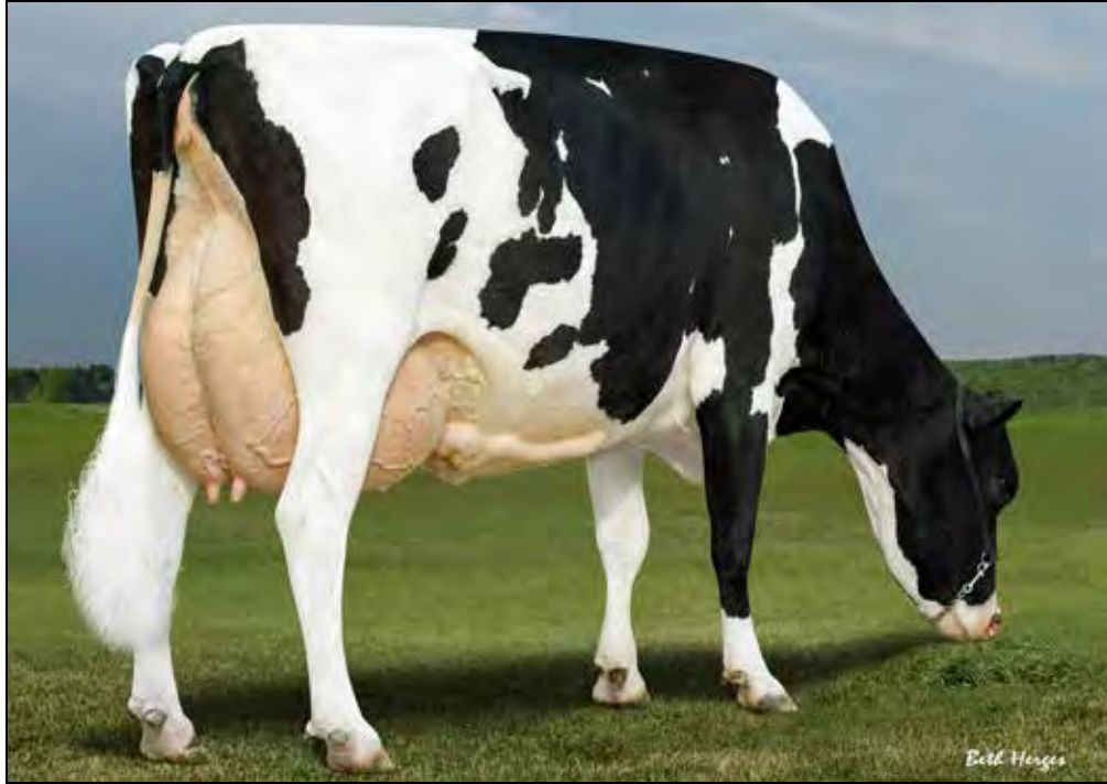
PALMCREST KICKBALL SABLE-TW EX-90 EX-MS SELLS AS LOT 106