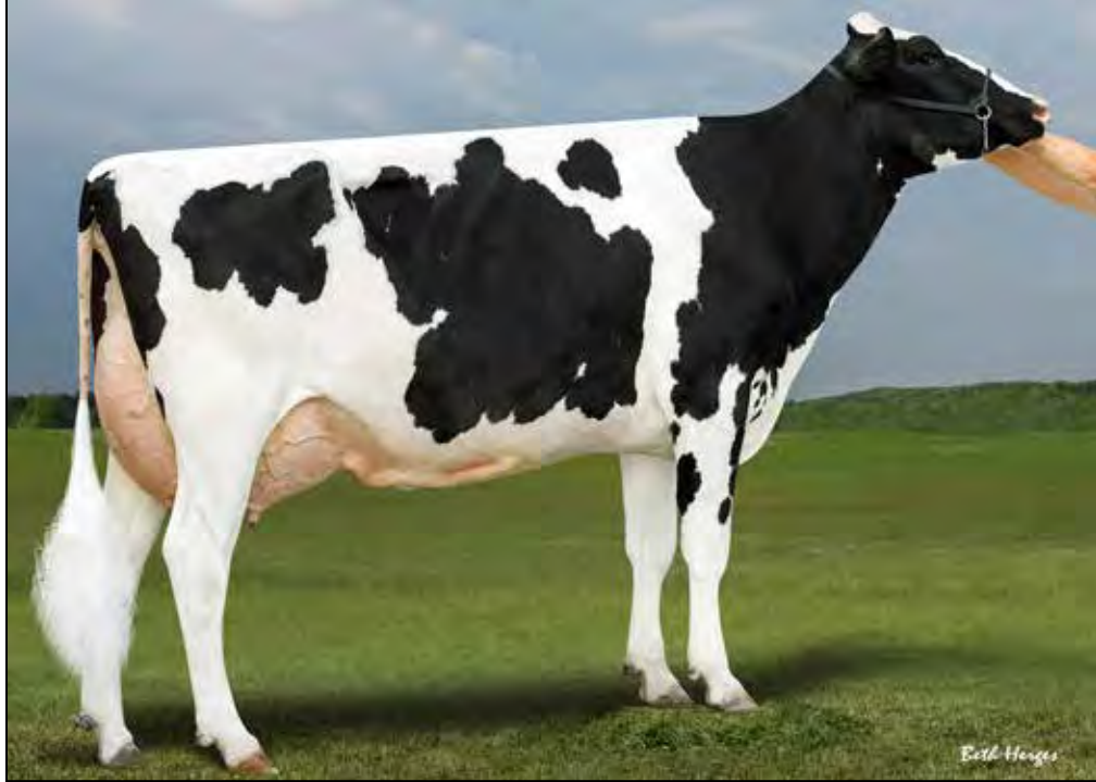
PALMCREST VERTEX BEXLEY VG-87 VG-MS @ 3-02 SELLS AS LOT 27 DAM OF LOT 28