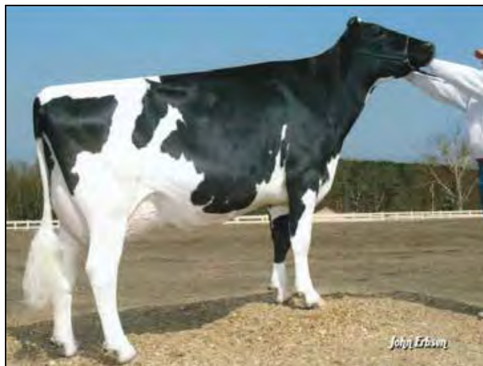
PALMCREST OSIDE BRITTANY EX-92 SAME FAMILY