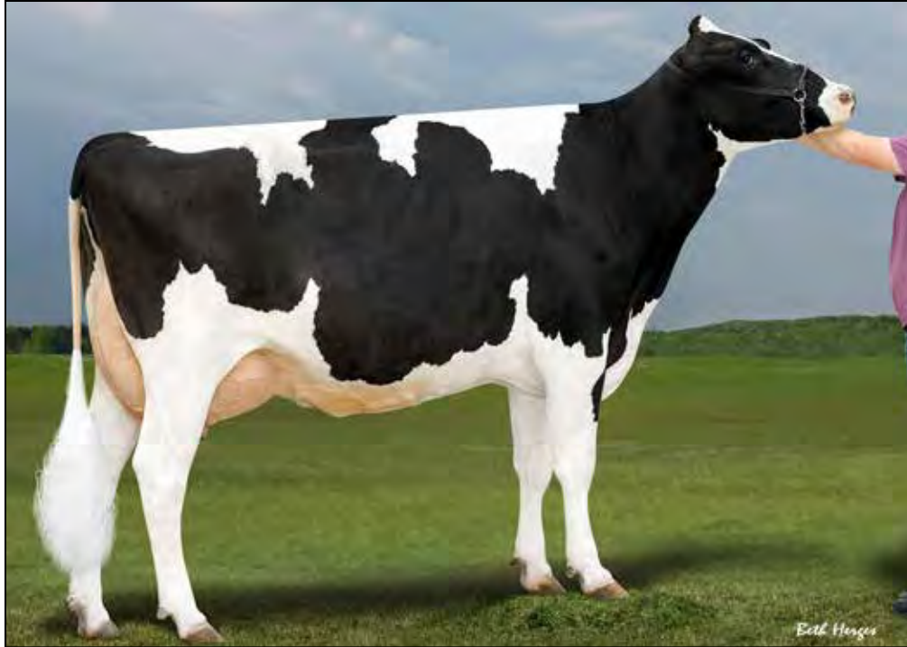
PALMCREST DOC TAYLA EX-90 EX-MS @ 3-11 SELLS AS LOT 1 DAM OF LOT 2