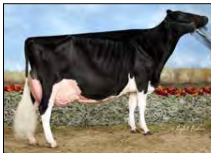
SAVAGE-LEIGH LEONA 3E-96 GMD MATERNAL SISTER TO 3RD DAM OF LOT 61