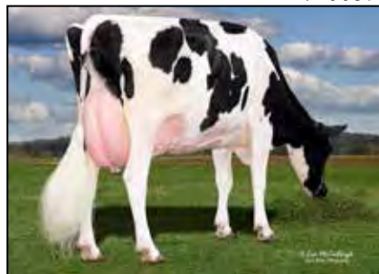
MS FFR DE-LITE DUN ARIEL-ET EX-90 EX-MS 2E 3RD DAM OF LOT 96