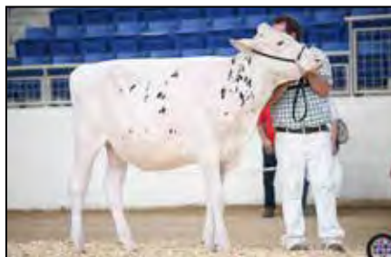
RICECREST HANLEY CHERISH-ET MATERNAL SISTER TO LOT 58