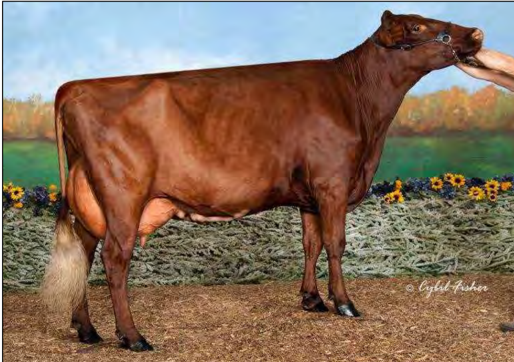
MILLCREEK LOGIC ANGEL EX-92 4E 3RD DAM OF LOT 26