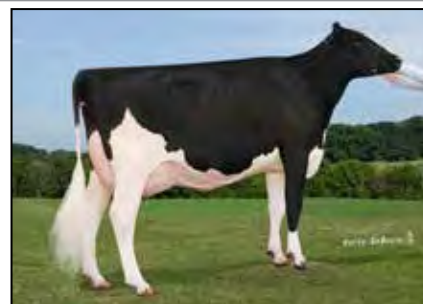
WOODEGE D-BACK NETFLIX-ET EX-90 EX-MS @ 3-11 DAM OF LOT 75

840003224012439 99%RHA-I Born: March 17, 2022 • Herd No. 1442