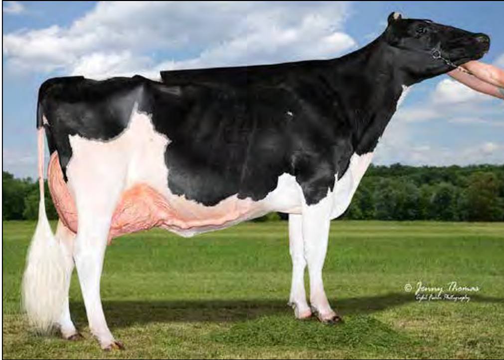
MS TRIPLE-T GRATEFUL-ET VG-87 VG-MS @ 2-08 DAM OF LOT 53 Grand Champion Int'l Jr Show 2022