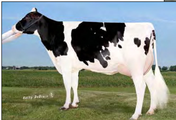
PINE-TREE 9882 PROF 7019-ET VG-86 4TH DAM OF LOT A