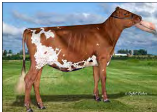
KOZY-KOUNTRY REAGAN MUNCHKIN FULL SISTER TO LOT K