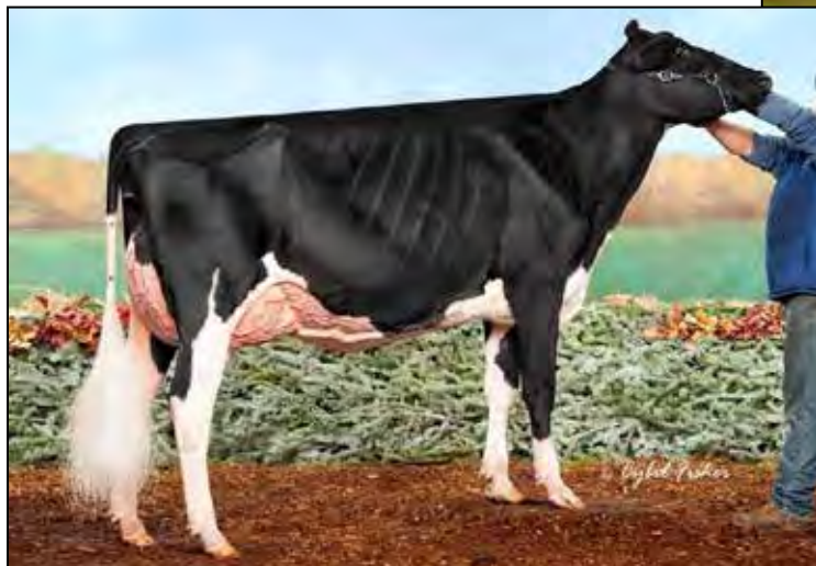
GARAY AWESOME BEAUTY-ET VG-88-CAN @ 2YRS MATERNAL SISTER TO DAM OF LOT 11