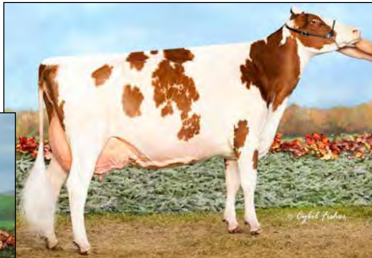
L-MAPLES HVEZDA CALLI-RED EX-94 EEEEE MATERNAL SISTER TO LOT O