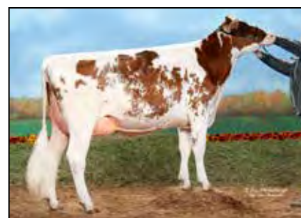
JACHER COLT RISSY EX-91 MATERNAL SISTER TO DAM OF LOT 88