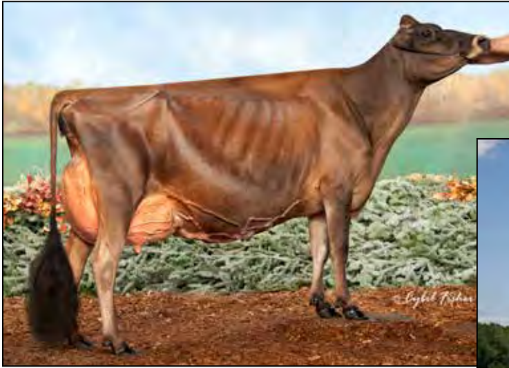
MB LUCKY LADY FELIZ NAVIDAD-ET EX-93 MATERNAL SISTER TO DAM OF LOT L