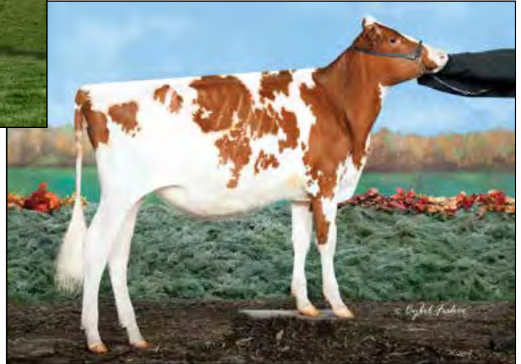
OAKFIELD US AVIVA-RED FULL SISTER TO DAM OF LOT R