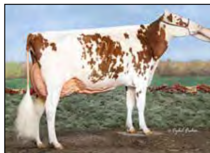
L-MAPLES DFNT CASSEY-RED-ET EX-92 EX-MS DAM OF LOT 55

840003223018892 99%RHA-I Born: March 4, 2022 • Herd No. 12