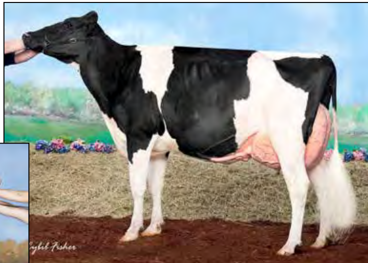
MS ZBW DEMPSEY LOUANA-ET EX-94 EEEEE 2E 2ND DAM OF LOT 24