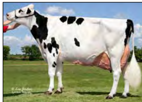
PRICESTEAD ATWOOD LILA-ET EX-94 EX-MS 3E 2ND DAM OF LOT 80

Due: December 3, 2022 to Mr Laces Crshabull Lazer-ET 551H004556