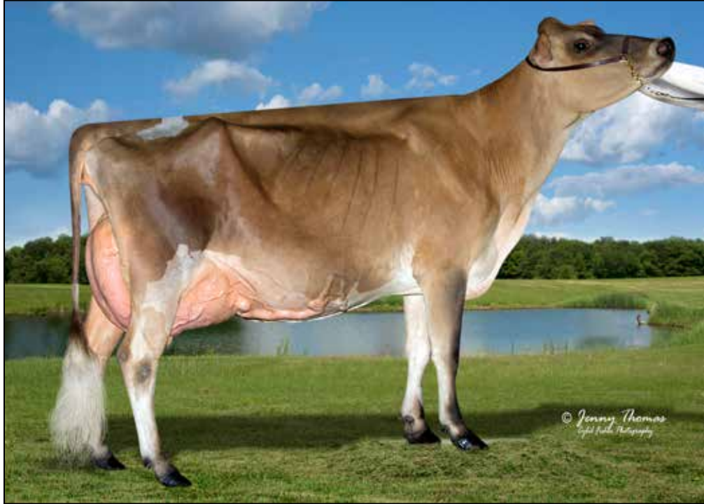
HEARTS DESIRE COLTON FICKLE EX-92 DAM OF LOT 40