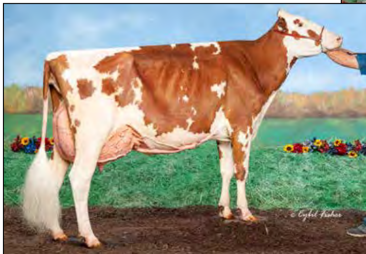
LAKE-EFFECT JUSTRIGHT-RED EX-92 EEEEE DAM OF LOT 17