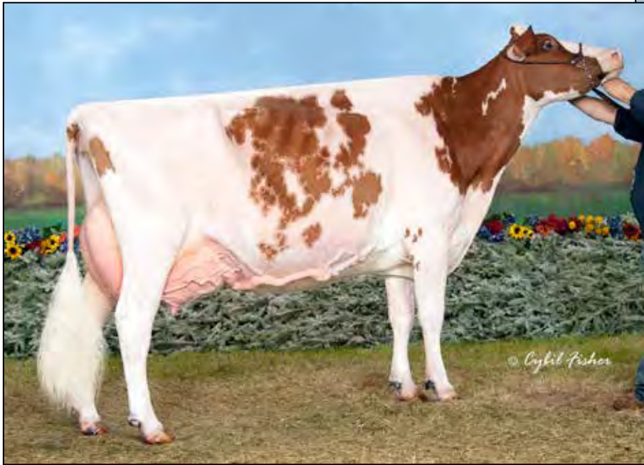
BUDJON-NITZY DESTINY-RED-ET EX-94 MATERNAL SISTER TO DAM OF LOT 22