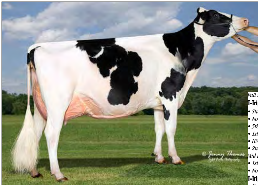
T-TRIPLE-T GOLD PROMISE-ET EX-93 EX-MS 2E DAM OF LOT 3