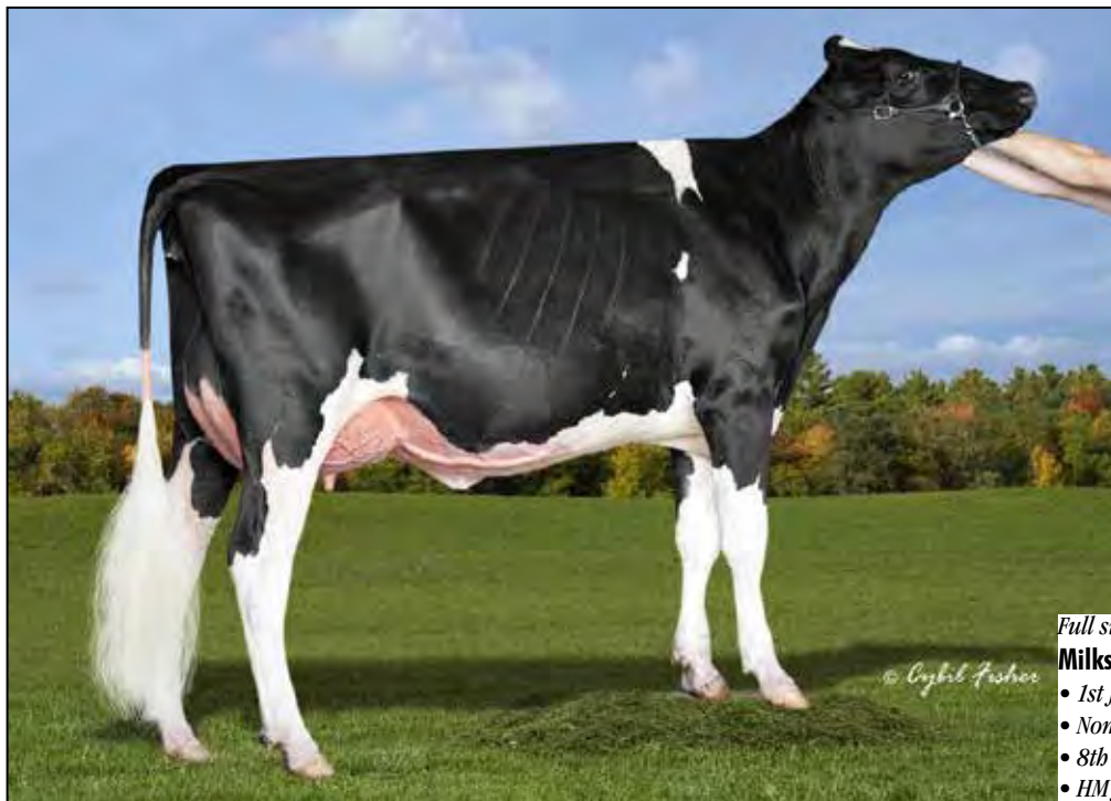
OCD DEFIANT LETHAL-ET EX-93 EEEEE *RC DAM OF LOT 21