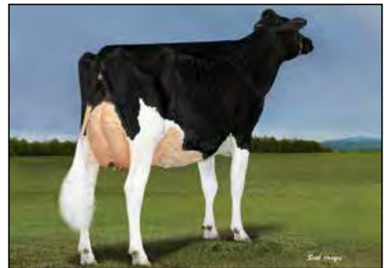
HOLMGREN ABSOLUTE DUCHESS EX-92 EX-MS *RC DAM OF LOT 50