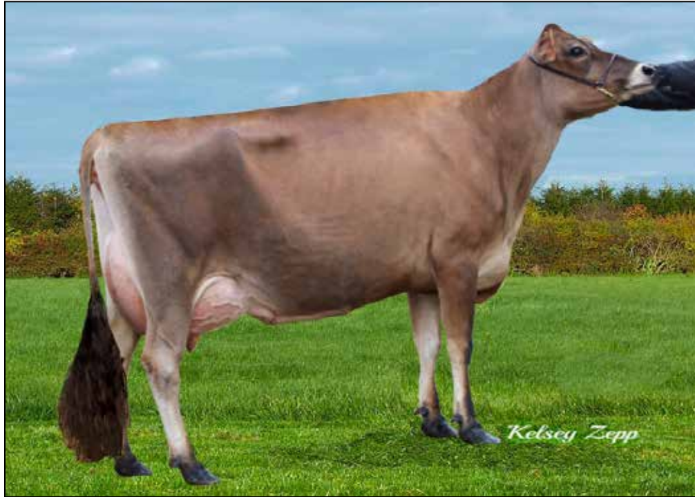
LOCUST-AYR PREMIER BROOKLYN EX-90 DAM OF LOT 38