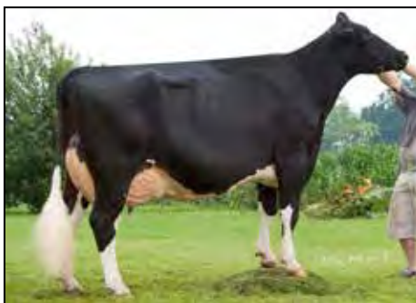
PENN-GATE STORM FLEUREL EX-94 2E DOM 4TH DAM OF LOT 73

840003209615394 *RC Born: March 23, 2020 • Herd No. 394 Fresh: July 2, 2022 Bred: September 19, 2022 to Duckett Crush Tadoo-ET