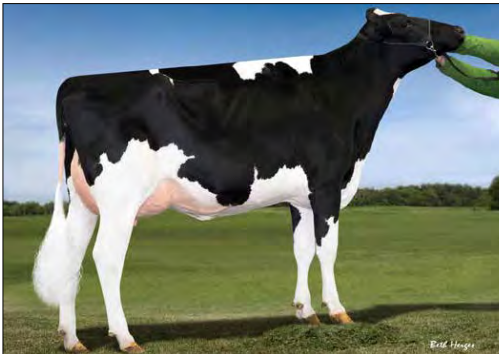
FARNEAR-TBR-BH GEORGIA-ET VG-88 6TH DAM OF LOT C