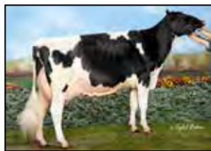
PENNWOOD DUNDEE TURNIP EX-94 EEEEE 2E 2ND DAM OF LOT 54

Due: December 28, 2022 to Jacobs Backflip 7H014324