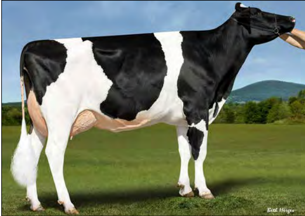
TTM LEGACY ARABELLA-ET VG-86 VG-MS 2ND DAM OF LOT B