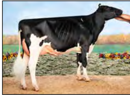
SWEET-PEAS GC AFFECTION-ET EX-91 EEEEE 2ND DAM OF LOT 66