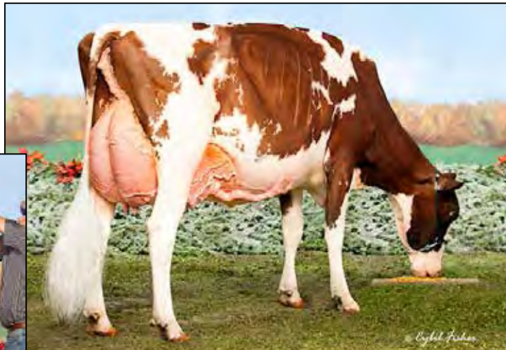
CHERRY-LOR LADD RIPPLE-RED EX-95 EEEEE 2E 2ND DAM OF LOT 9 & 3RD DAM OF LOT 10