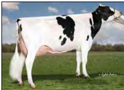
MER-ACRES KING ROYAL LILLY EX-92 EX-MS DAM OF LOT 72

840003218602699 99%RHA-1 Born: March 1, 2022 • Herd No. 1464