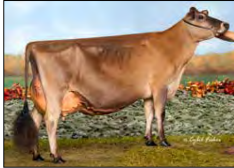
BIG GUNS JAMAICA VANILLA EX-95 2ND DAM OF LOTS 35 & 36