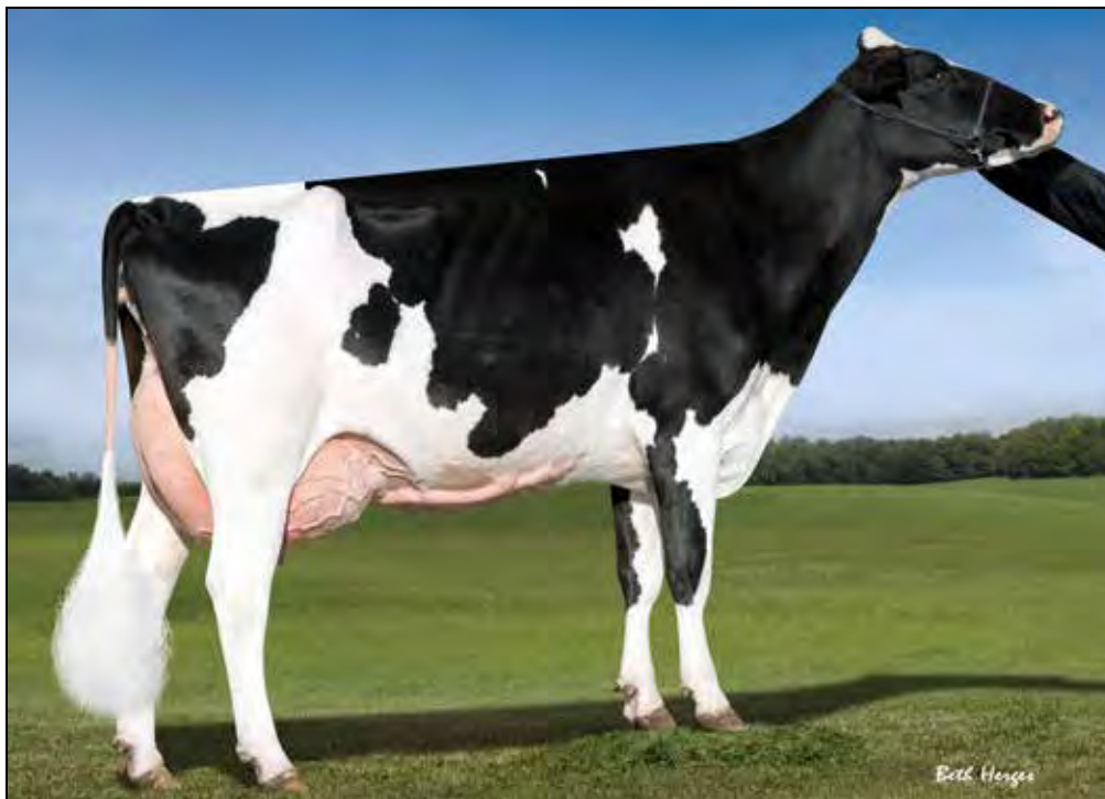
MDF GOLDWYN BREEZIER 39-ET EX-94 EX-MS 3E DAM OF LOT 13