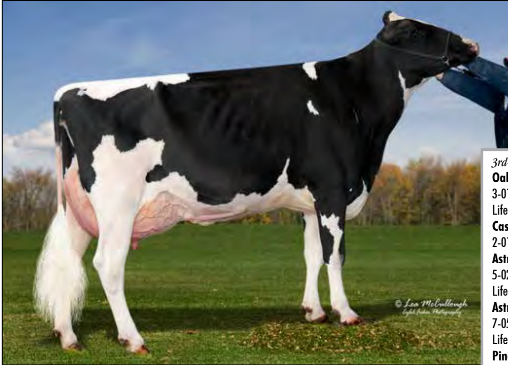
KING-LANE G CHIP ROBYN-ET EX-90 EX-MS 2E 2ND DAM OF LOT 103