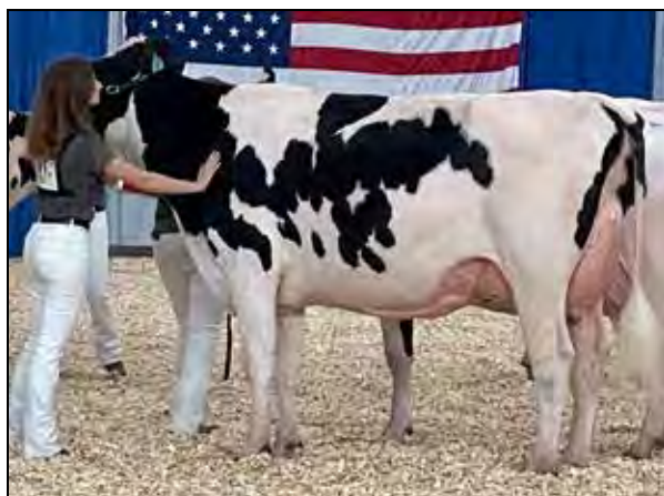
DE-LITE DRIVE TRIPLE AXEL VG-88 SELLS AS LOT 96