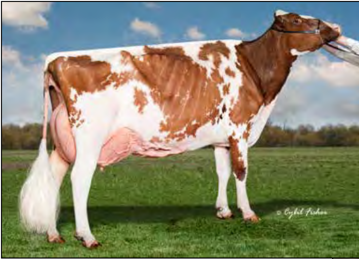
COLGANADOS D AVIANCA-RED-ET EX-95 EEEEE 2E 2ND DAM OF LOT R