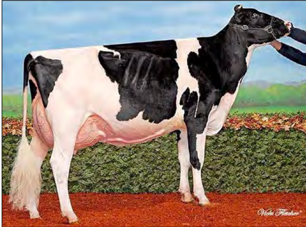
KINGSWAY TENACIOUS ROCHELLE EX-94 EEEEE 2ND DAM OF LOT 16