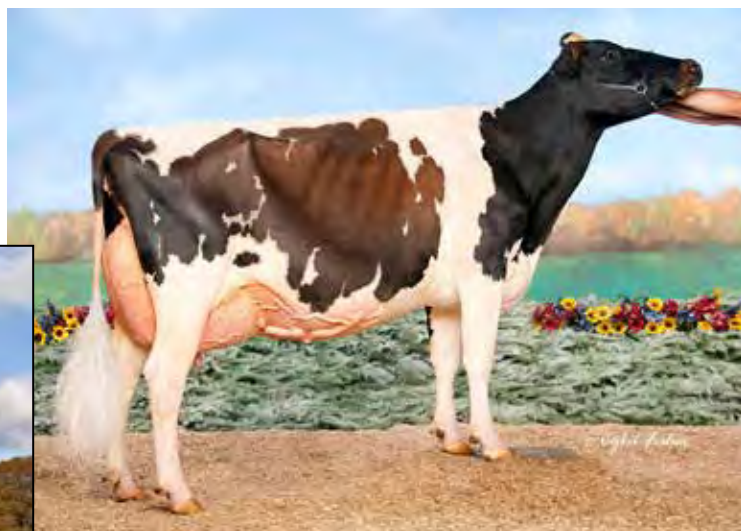
D-ANDREWS ABSOLUTE LUSH EX-94 MATERNAL SISTER TO LOT 44