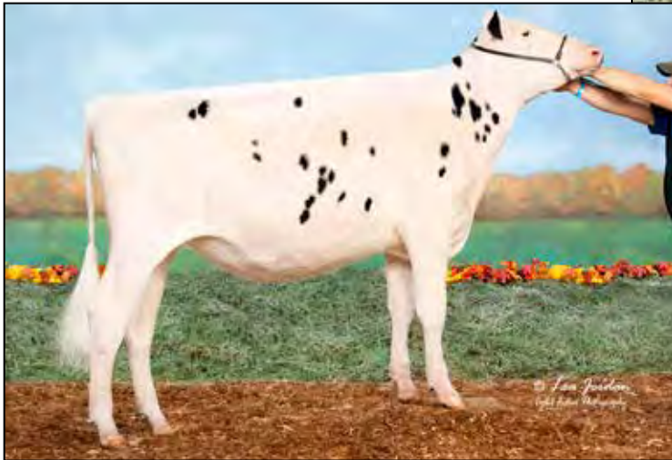
MS LAURELS CRUSH LYDIA-ET VG-88 VG-MS DAM OF LOT 12