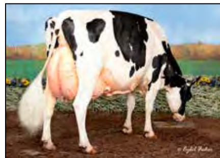
WINDY BRAE HEFTY JANET EX-94 3E 2ND DAM OF LOT 62