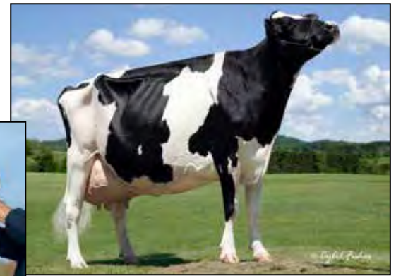
BUDJON REDMARKER DESIRE EX-96 4E GMD *RC 2ND DAM OF LOT 22