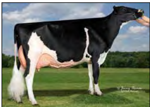
BUDJON-JK ATWOOD EKRIA-ET EX-94 MATERNAL SISTER TO LOT 25