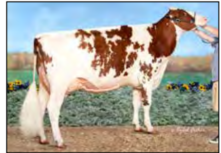
COUNTRY-PATH CON HAZEL-RED EX-94 EEEEE 2E DAM OF LOT 54

Due: April 7, 2023 to Farnear Altitude-Red-ET (Sexed Semen)