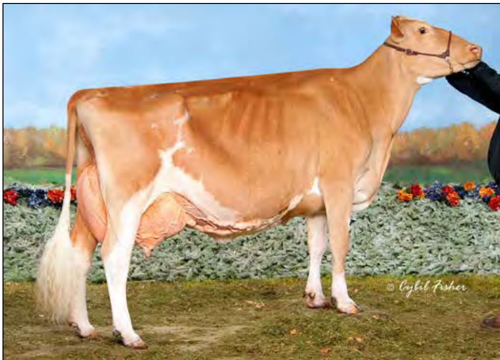
KNAPPS REGIS TAMBOURINE-ET EX-95 3RD DAM OF LOT 28