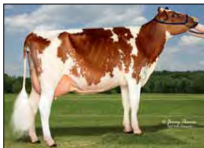
JACHER MAGENTA ROCKSTAR EX-90 MATERNAL SISTER TO DAM OF LOT 88

840003219028609 99%RHA-I Born: April 17, 2022 • Herd No. 609