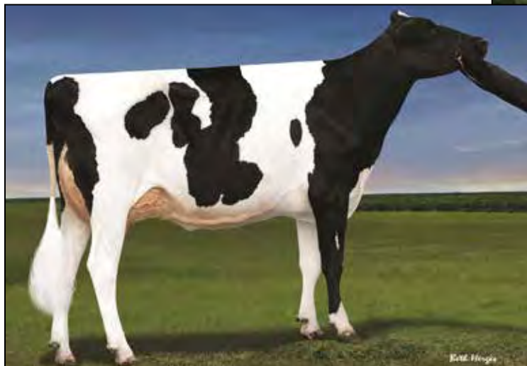
OH-RIVER-SYC MOGAL BRYLAN VG-85 VVVVV DAM OF LOT 23