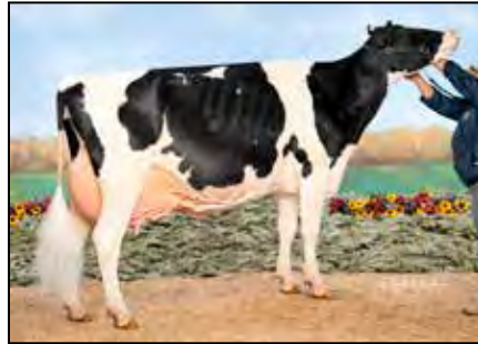
EASTRIVER GOLDWYN DEB-ET EX-94 EEEEE 3E FULL SISTER TO 2ND DAM OF LOT 51

Due: December 27, 2022 to Ocd Thunder Struck-ET (Ultrasounded Female) 250H015329