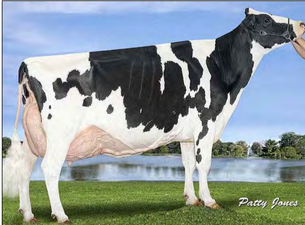
NIPPONIA R D LIZABETH-ET EX-96-CAN 3E DAM OF LOT 20