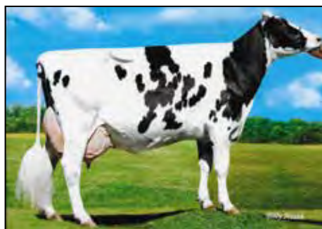
LOCUST-AYR MILLION ASTON-ET EX-92 EX-MS 3RD DAM OF LOT 93

840003235688223 99%RHA-I *RC Born: December 9, 2021 • Herd No. 172