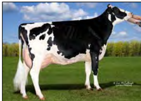
GLEN-VALLEY ROYAL GOLD-ET EX-90 EX-MS 2E 3RD DAM OF LOT 92

Due: December 16, 2022 to Jimtown Nashville (Sexed Semen) 777H012191