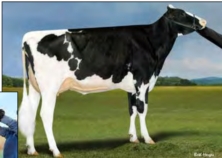
GARAY JORDY BLACK KISS-ET VG-88 VG-MS DAM OF LOT 11