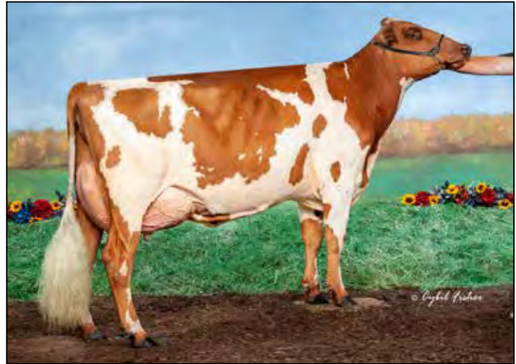
SUNNY-ACRES BKING KOINCIDENCE MATERNAL SISTER TO DAM OF LOT 29