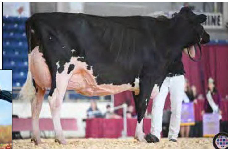
OAKFIELD SOLOMON SUNSET-ET EX-92 MATERNAL SISTER TO LOT 5