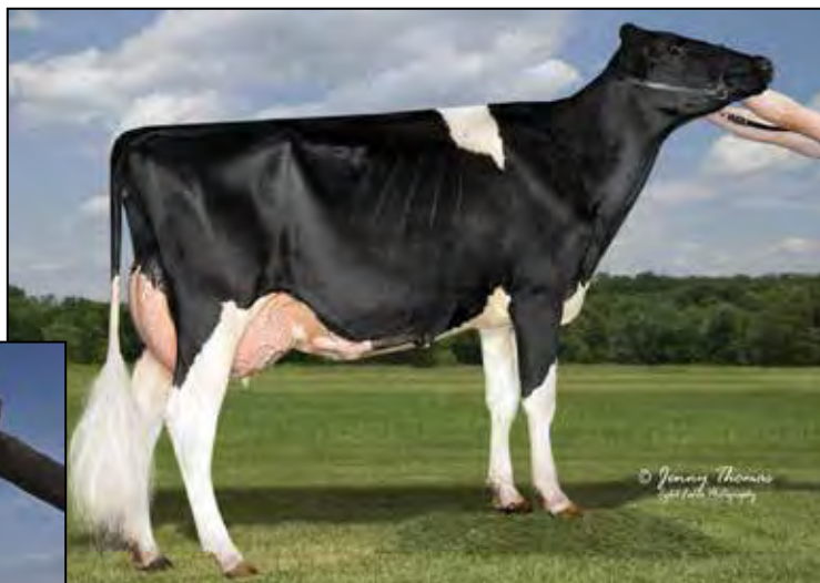
OH-RIVER-SYC MRDN BILLIE-ET EX-91 EX-MS 2ND DAM OF LOT 23