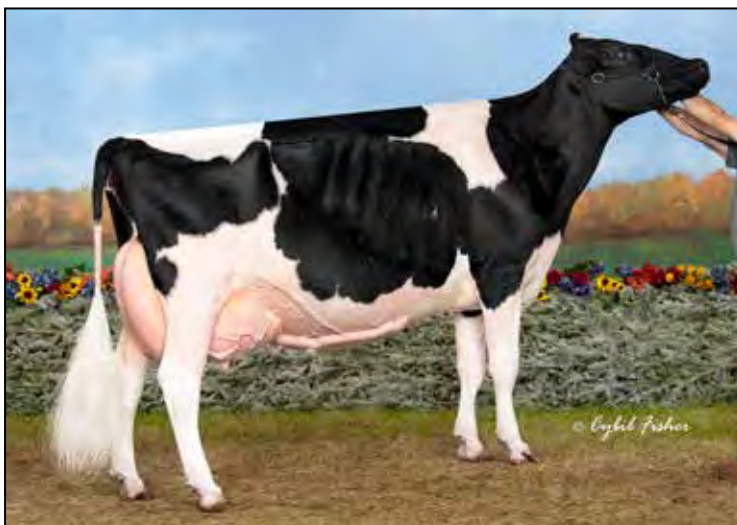
BUDJON-JK EMILYS EDAIR-ET EX-95 2E DAM OF LOT 25