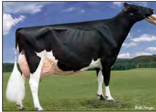
HARVUE ROY FROSTY EX-97 EEEEE 3E GMD 4TH DAM OF LOT 48