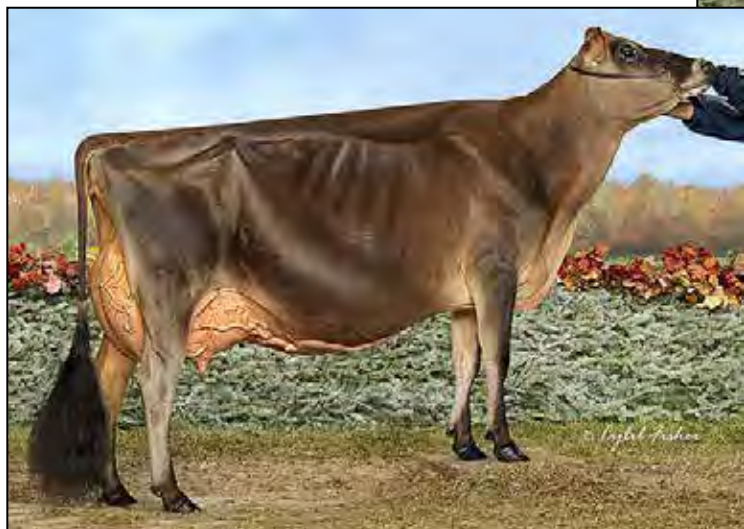
ELLIOTTS BLACKSTON CHARLOTTE EX-94 MATERNAL SISTER TO LOT 32