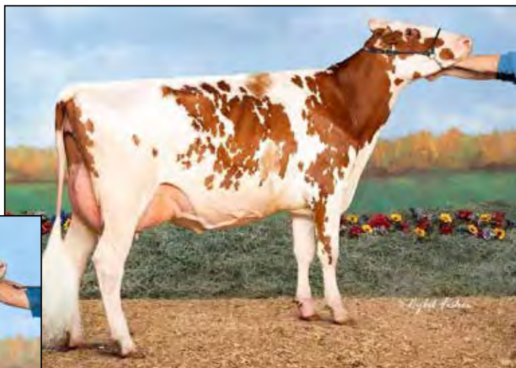
LAKE-EFFECT JUSTADREAM-RED MATERNAL SISTER TO LOT 17