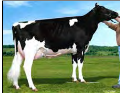
POTSDALE GOLDWYN ROZINA-ET EX-94 EEEEE 4E 2ND DAM OF LOT 37A & 4TH DAM OF LOT 37B