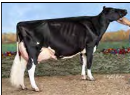
PENNWOOD TROY KALAHARI EX-93 EX-MS 3E 3RD DAM OF LOT 84 & 2ND DAM OF LOT 85

840003244597907 99%RHA-I Born: January 22, 2022 • Herd No. 8217