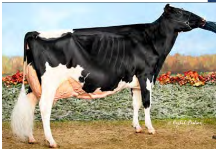
BELLA-ROSA GW SARA-ET EX-96 EEEEE 3E DAM OF LOT 5