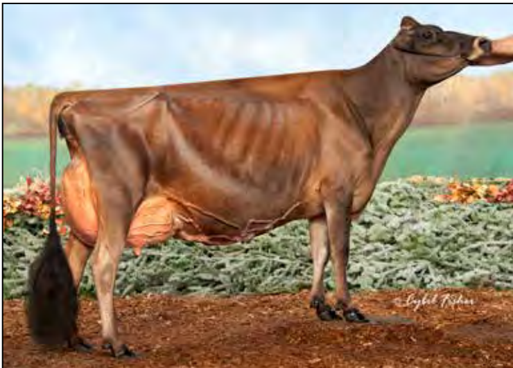
MB LUCKY LADY FELIZ NAVIDAD-ET EX-93 MATERNAL SISTER TO DAM OF LOT 37