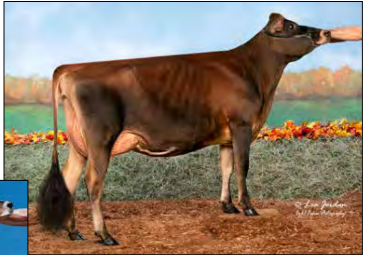
LOCUST-AYR ANDREAS HONEYBUNS VG-87 MATERNAL SISTER TO DAM OF LOT 39