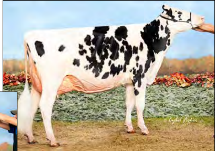
SUNNY PLAINS DEMPSEY LAUREL EX-94 EEEEE 2E 2ND DAM OF LOT 12