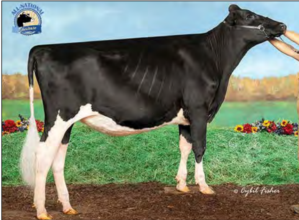
MERRILLEA BITTY BUG SELLS AS LOT 14