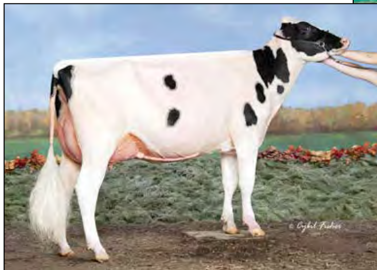
ZBW M KD LORI-ET EX-91 SAME FAMILY AS LOT 24 (LIGHT BEEMS DAUGHTER)