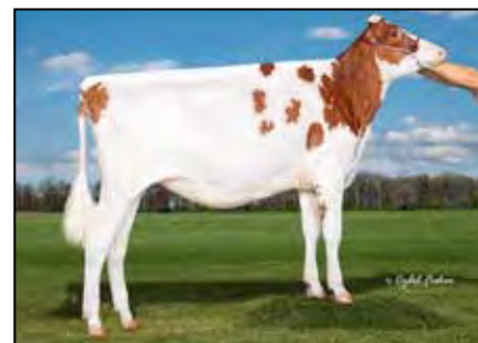
MERRILLEA UN CABERNET-RED DAUGHTER OF LOT 57