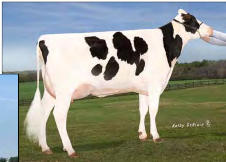
OCD SUPERSIRE 9882-ET VG-86 VG-MS DOM 5TH DAM OF LOT A