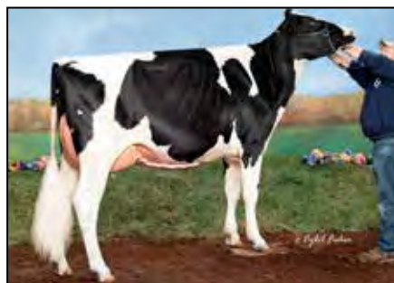
OAKFIELD ARCHRIVAL DINA-ET EX-92 EEEEE DAM OF LOT 65

Due: April 3, 2022 to Siemers Exc Hanans 31753-ET 507H015325