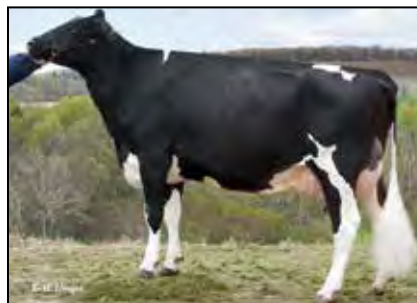
SONNEN SOVEREIGN CALDONIA EX-95 96-MS 2E 3RD DAM OF LO T 99

840003145067453 99%RHA-I Born: June 10, 2022 • Herd No. 434