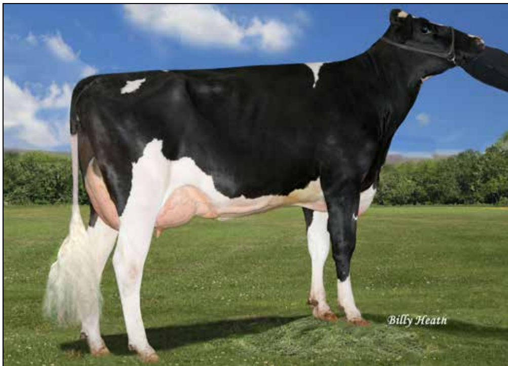
COLDSPRINGS RAPID 11678-ET GP-80 MATERNAL SISTER TO LOT 19