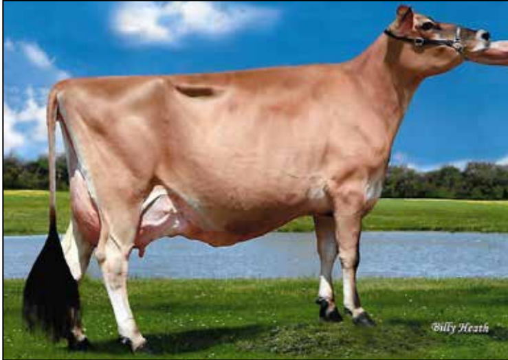
LOCUST-AYR FERMASTER HALOTI EX-91 MATERNAL SISTER TO DAM OF LOT 39