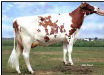
KULP-DALE ADVENT RENN-P-RED EX-90 EX-MS 2ND DAM OF LOT 74

840003212907417 99%RHA-I Born: October 5, 2020 • Herd No. 402 Fresh: July 29, 2022 Milking: 56# 4.2F 3.1P Bred: October 4, 2022 to Jacobs Showtime-ET *RC (Sexed Semen) 694H019826