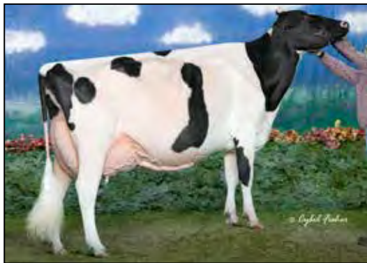
QUALITY-RIDGE STORMI HAZEL EX-96 EEEEE 2E 5TH DAM OF LOT 49