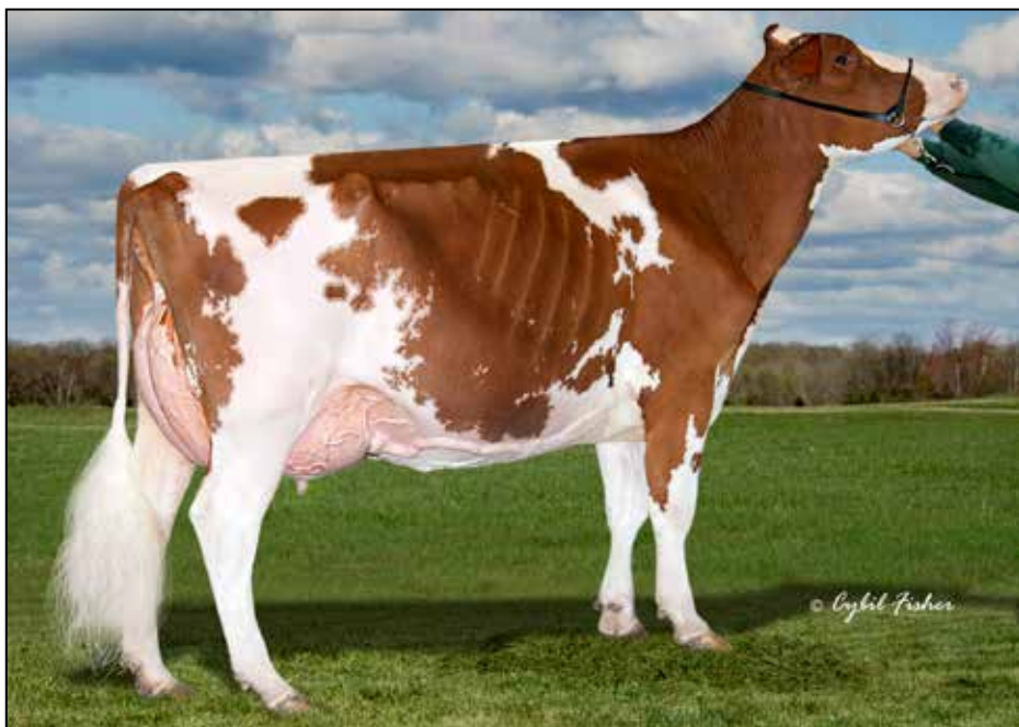
DJ-PUREPRIDE INFRA-RED-ET EX-93 EX-MS DAM OF LOT 45, 46 & 47