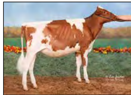
MS STULTZ WARRIOR EPIC-RED SELLS AS LOT 82