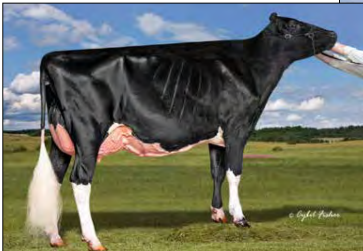
FAIRMAONT-RE AVLANCH FEBE-ET EX-92 EEEEE 2ND DAM OF LOT G