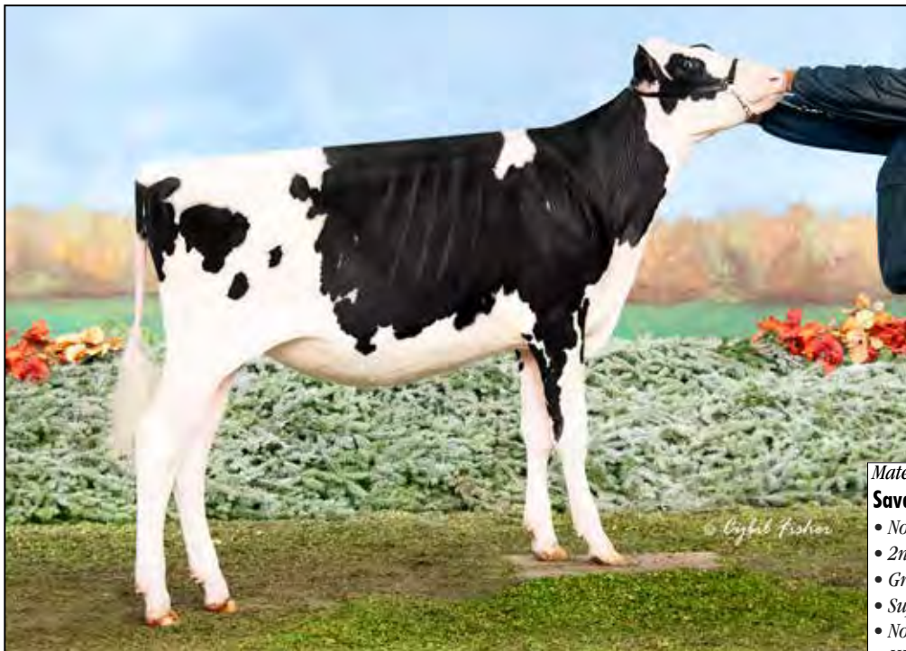
MS MCWILLIAM DEMP LADY LUCK MATERNAL SISTER TO LOT 15