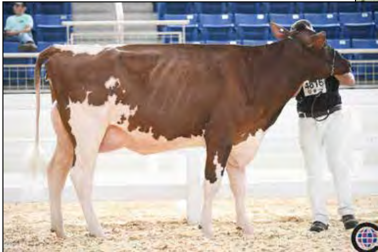
CHERRY-LOR LADD RIPPLE-RED EX-95 EEEEE 2E 3RD DAM OF LOT 10