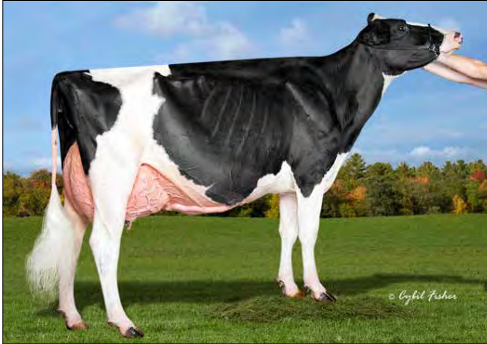
HEZ BO ATWOOD RUTH-ET EX-93 2ND DAM OF LOT H