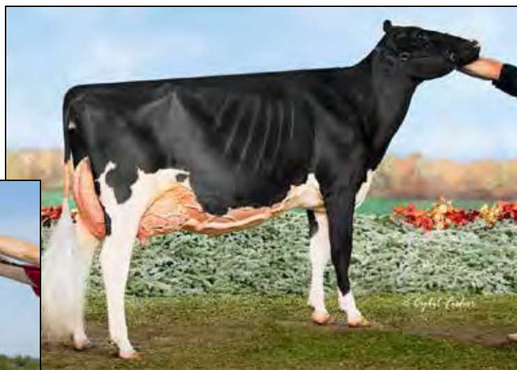
MS BEAUTYS BLACK VELVET-ET EX-95 2E 2ND DAM OF LOT M