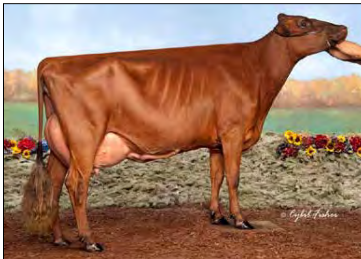
MOWRY'S BURDETTE MOJO EX-93 2E DAM OF LOT K