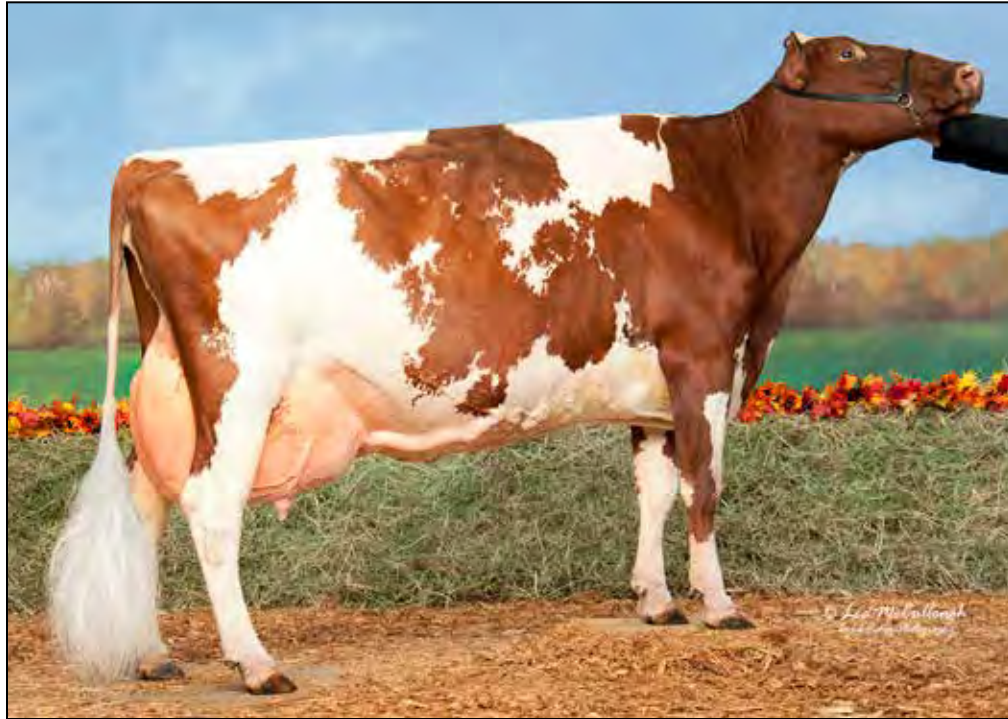
HARD CORE ACE ROXY-EXP EX-95 4E 2ND DAM OF LOT 27