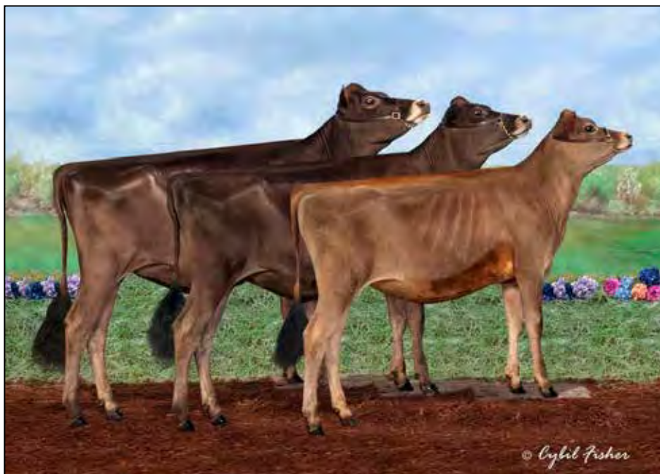
BIG GUNS JAMAICA VANILLA DAUGHTERS SISTERS TO DAM OF LOT 35