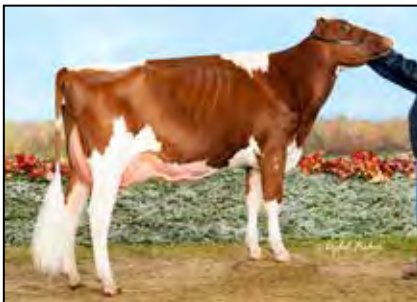
CHERRY-LOR ABS LILLY-RED-ET VG-88 VG-MS DAM OF LOT 81

840003253663381 99%Rha-NA Born: June 1, 2022 • Herd No. 757