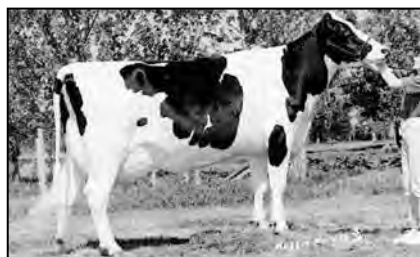
LAKE-EFFECT AER WINDSONG-ET EX-91 3E DOM 4TH DAM OF LOT 95