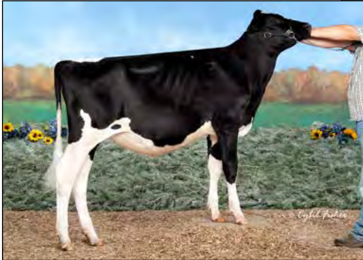
GLORIANNA DAMION PRIMM DAM OF LOT 100