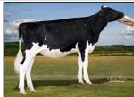
PHOENIX BENEFITJEWELS VG-85 VG-MS @ 2-04 SELLS AS LOT 59