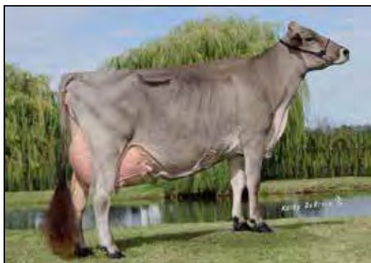
TOP ACRES SUPREME WIZARD-ET EX-95 3E MATERNAL SISTER TO 3RD DAM OF LOT 31