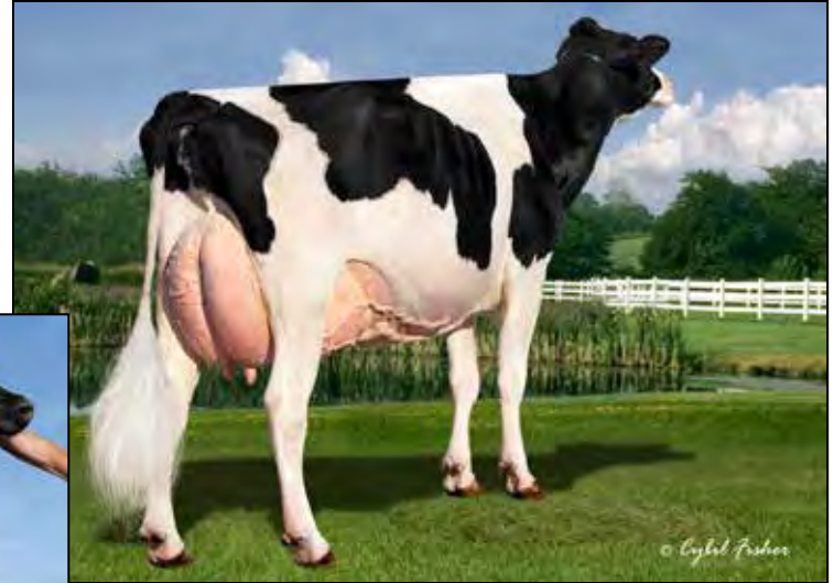
ROQUET JASMINE SANCHEZ-ET EX-95 EEEEE 2E 2ND DAM OF LOT 6