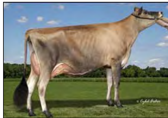
HEART&SOUL FIZZ FAITH EX-91 FULL SISTER TO LOT 37