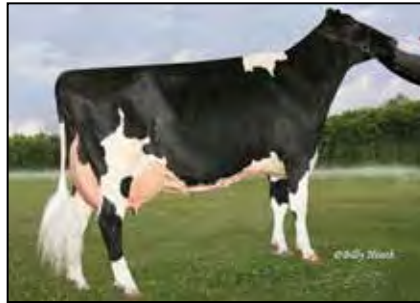
PENN-DELL GOODLUCK KATHY-ET EX-94 EX-MS 2E DAM OF LOT 67

840003220288664 99%RHA-I Born: June 27, 2020 • Herd No. 1801 Fresh: September 10, 2022 First Test: 68# @ 15 DIM