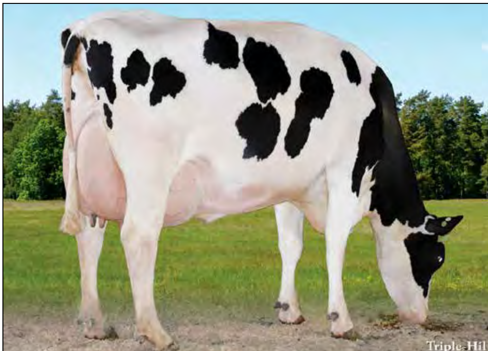
PINE-TREE ERA ACHIE 7593-ET GP-82 @ 3-00 2ND DAM OF LOT 2