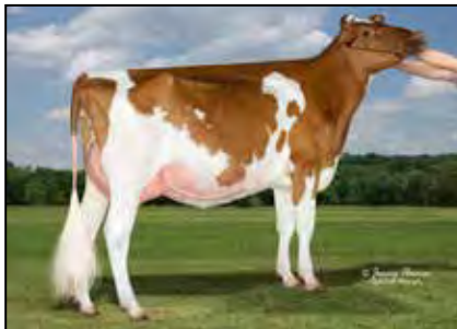
ROSEDALE J LOVIE-RED-ET VG-86 VG-MS @ 2-05 DAM OF LOT 76