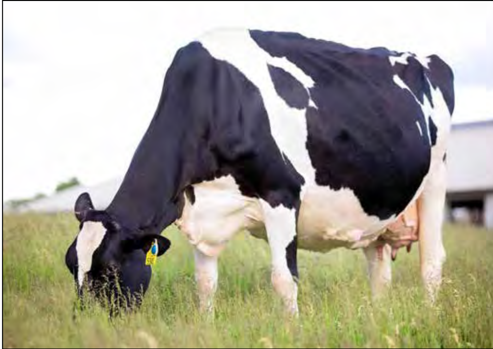
SANDY-VALLEY BL PARADISE-ET EX-94 EEEEE 2E DOM DAM OF LOT F