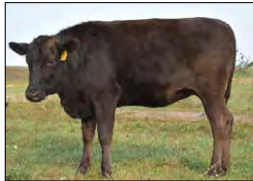
GRF MS YASAFUKU F57 "WENDY WAGU" DAM OF 104