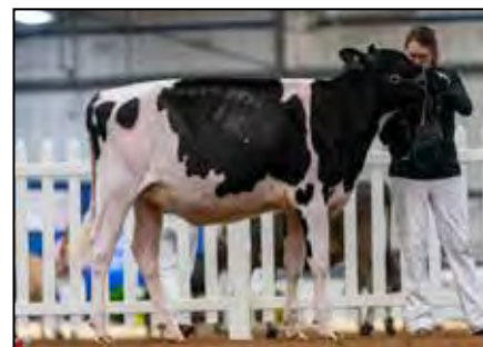
UBERCREST ANALYST MORGAN DAUGHTER OF LOT 63