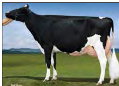
VT-POND-VIEW GOLD APRIL-ET EX-93 EX-MS 2E 3RD DAM OF LOT 70

840003212907416 99%RHA-I *TR *TC *TL Born: September 8, 2020 • Herd No. 401 36K GTPI +2228G PTA +3.16T +2.55UDC +1.50FLC 79R 8/22 Fresh: July 17, 2022 Milking: 66# 3.3F 2.4P SCC 15,000 Bred: October 2, 2022 to Siemers Exc Hanans 31753-ET 7H015325