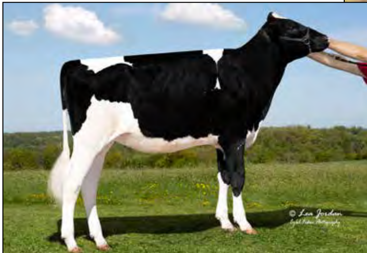
DUCKETT WARRIOR VESTA-ET DAM OF LOT M