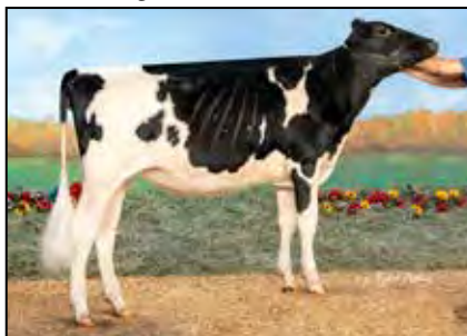
JLT JORDY BLISS DAUGHTER OF LOT 71

840003207150654 99%RHA-I VG-88 VG-MS Born: June 2, 2019 1-09 2x 291d 17100 4.4 759 3.4 580 2-08 2x 208d 16100 3.5 566 2.7 427 RIP Fresh: March 3, 2022 Milking: 75# Due: May 26, 2023 to Eclipse Atwoods Archival-ET • 2nd Summer Jr 2-Yr-Old NE Spring Nat'l 2021 • 1st Summer Yrlg Western PA Show 2020