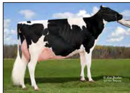
OCD ATWOOD SALSA DANCER-ET EX-95 EEEEE 2E DAM OF LOT 22