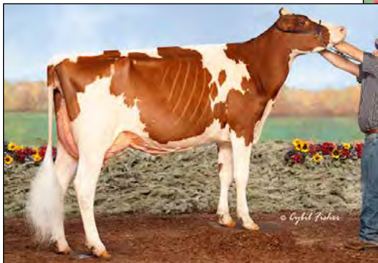
CHERRY-LOR AWE RIPPY-RED-ET EX-94 EEEEE DAM OF LOT 9