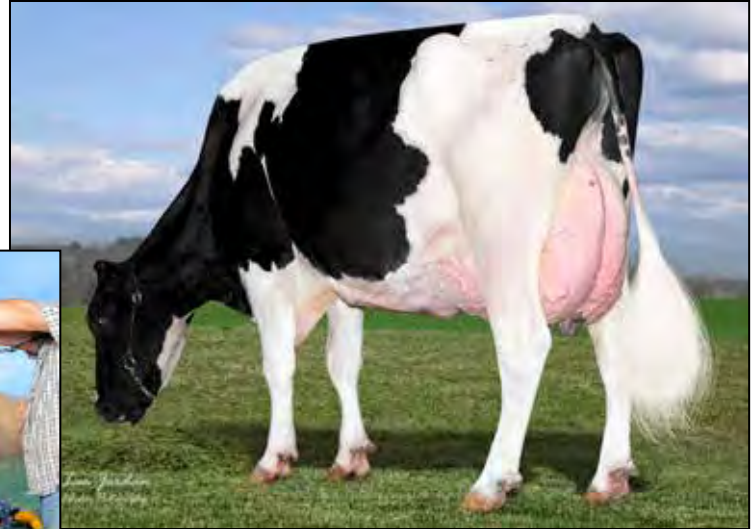
SMITH-HOLLOW ATLAS PISA EX-92 EX-MS 2E 3RD DAM OF LOT 100