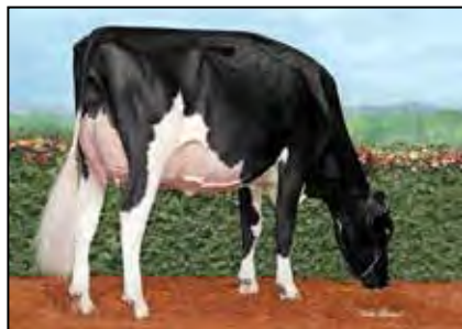
MIDAS-TOUCH JEDI JANGLE-ET VG-89 EX-MS 2ND DAM OF LOT 90

840003247256975 Pending Born: May 16, 2022