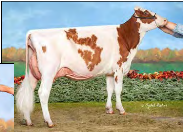
SIEMERS GREAT 31589-RED-ET VG-89 MATERNAL SISTER TO LOT E