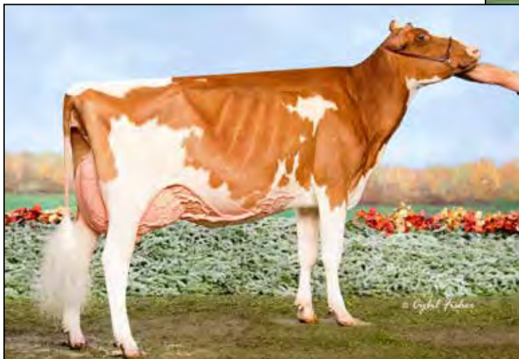
SIEMERS AWESOME GREAT-RED EX-93 EEEEE 2E DAM OF LOT E