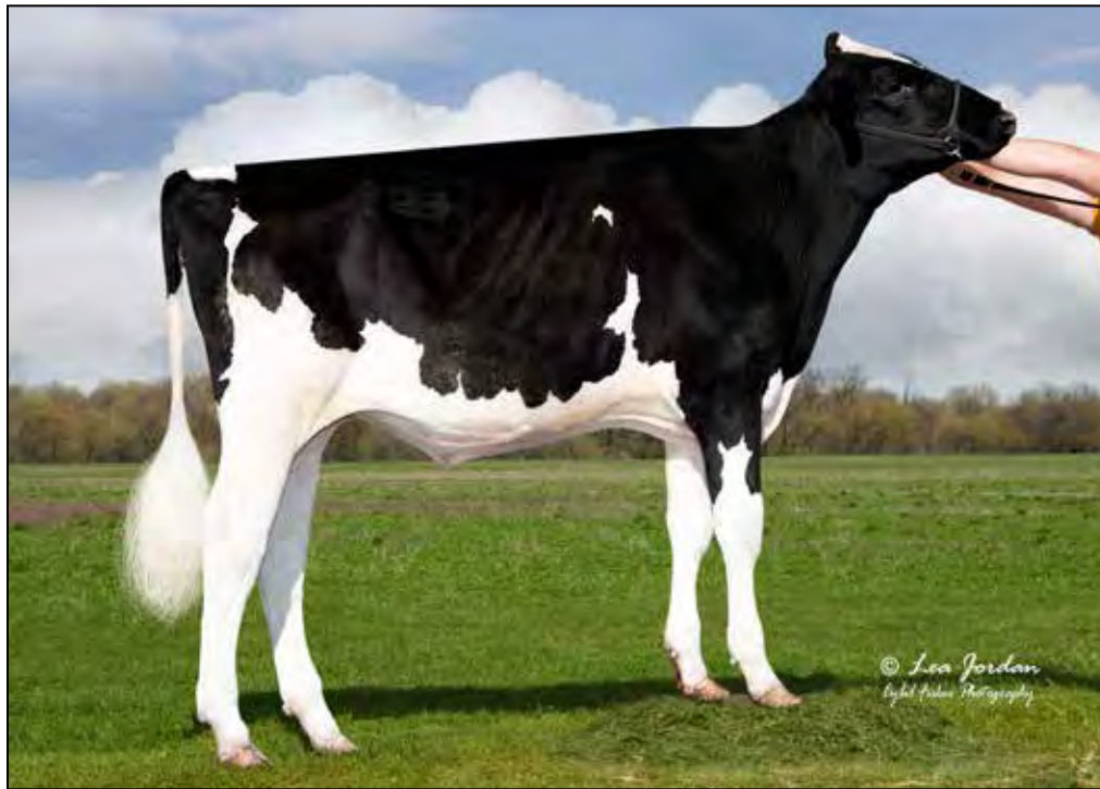
CRYSTAL-STAR ADMRL ANGEL-ET FULL SISTER TO LOT 18