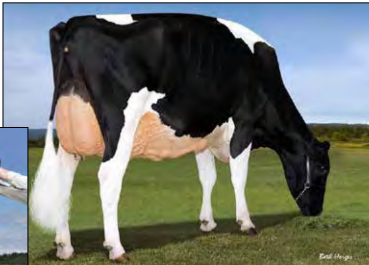
FOX-FIELD PITBULL LAIR EX-95 EEEEE 2E 3RD DAM OF LOT G