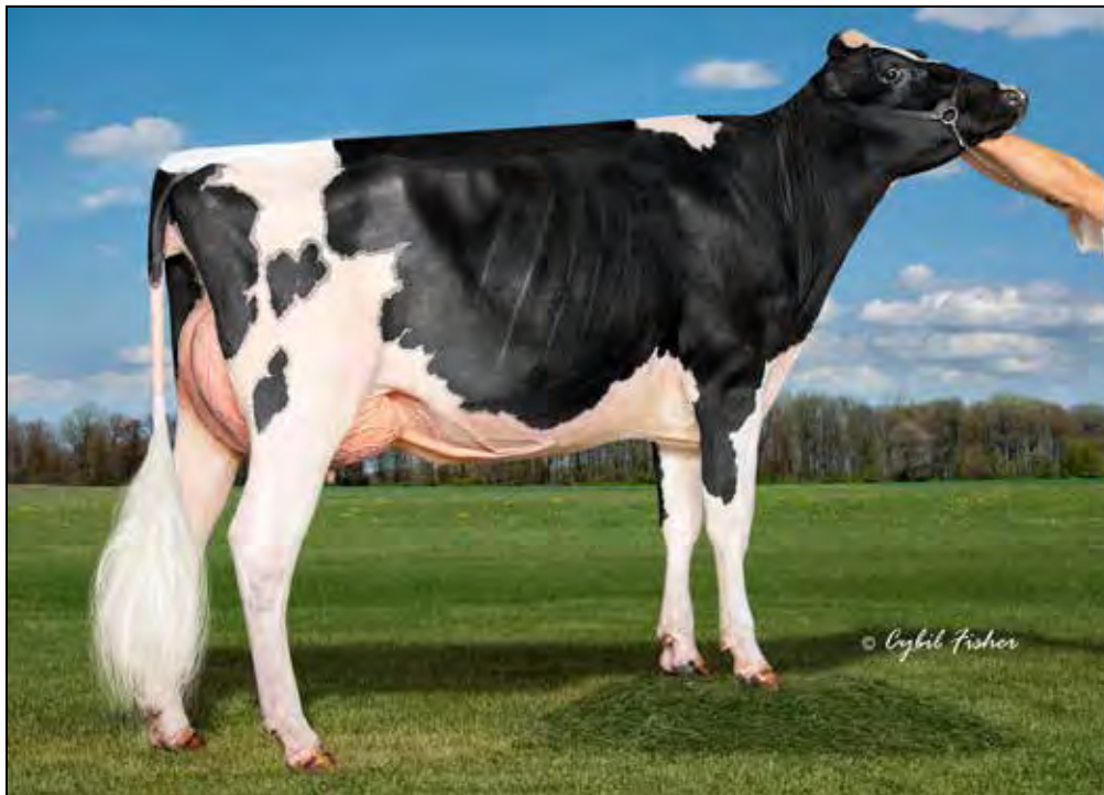
ZBW BUST A MOOVE VG-89 EX-MS @ 2-04 (MAX) DAM OF LOT 7