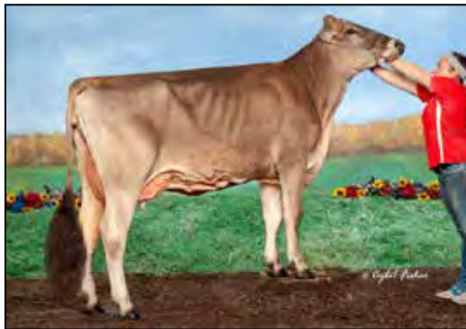
CHAMPION VIEW DYNAMITE WINK VG-88 VG-MS DAM OF LOT 31