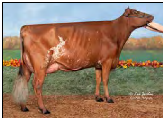
MOWRY'S REAGAN MOCHA VG-88 FULL SISTER TO LOT K