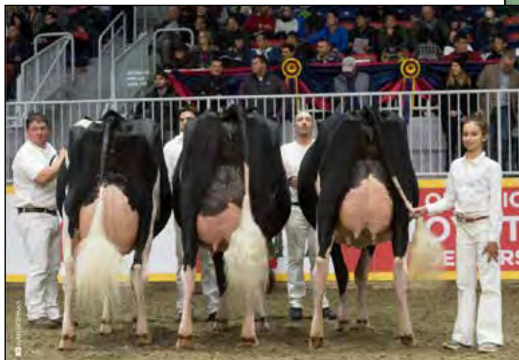
KNONDALE JASMINE-ET EX-96-CAN 4E KNONDALE MUDPIE-ET EX-94 2E KNONDALE ORANGECRUSH EX-93 2*