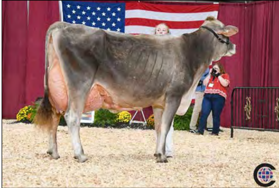
NORTHKILL CREEK GROOVY MATERNAL SISTER TO 3RD DAM OF LOT 30