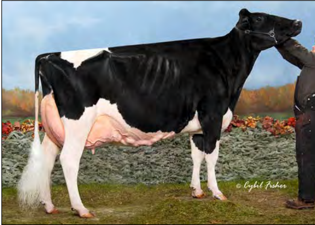
MILKSOURCE GOLDWN AFRICA-ET EX-95 96-MS 2E 2ND DAM OF LOT 8