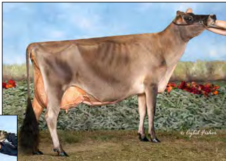
ARETHUSA VERONICAS COMET-ET EX-95 DAM OF LOT 32