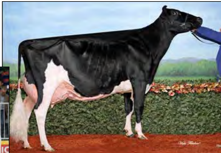
KNONDALE JASMINE-ET EX-96-CAN 4E DAM OF LOT 1