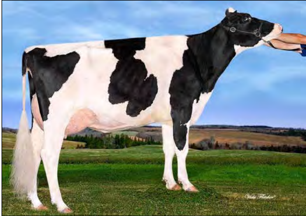
GARAY ATWOOD DIVA EX-92 EEEEE DAM OF LOT J