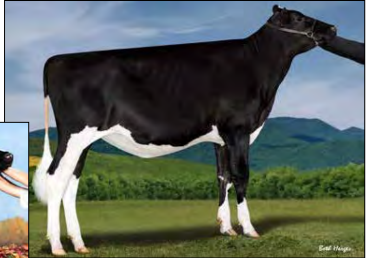
BLEXYS KING DOC BLOOM-ET DAM OF LOT D