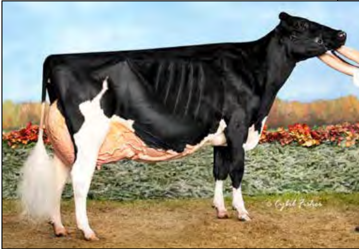
ROSIER BLEXY GOLDWYN-ET EX-97 EEEEE 3E 2ND DAM OF LOT D