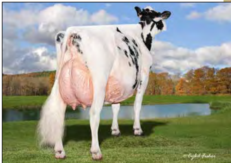
LIDDLEHOLME RESUR LU EX-97 3E EEEEE MATERNAL SISTER TO DAM OF LOT 44