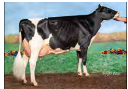
SAXTON-HILL SWEET LADY PO EX-92 EX-MS 2E 2ND DAM OF LOT 67