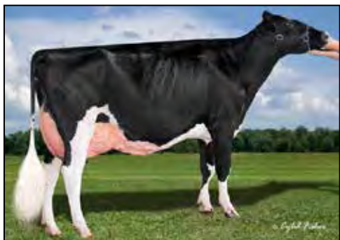
BUDJON-JK ATWD EWARE-ETS EX-94 MATERNAL SISTER TO LOT 25