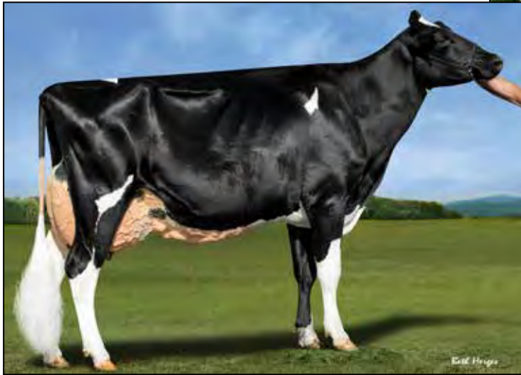
ARETHUSA ATWOOD JAIDEN-ET EX-94 EEEEE DAM OF LOT 6