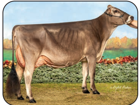
CUTTING EDGE F FAROH ETV 68188589 'E91/E92ms' 2/04 365d 2X 23030 4.1 940 3.7 848 DHIR ALL AMERICAN SR 3 YR OLD 2021, HON MEN AA SR 2 YR OLD 2020 RES GRAND CHAMP INTERNATIONAL SHOW 2021 Maternal Sister to Dam of Lot 23

IE DOUBLE W FAWN 379326224 07/05 2E-E90 E93 E92 E90 V86 E90 (06/12) 03/05 278d 3X 23130 3.4 794 2.6 612 DHIR 04/05 365d 3X 25660 3.7 949 3.2 820 DHIR 05/10 312d 2X 21030 3.9 818 3.1 648 DHIR 06/10 365d 3X 24170 3.6 869 3.2 781 DHIR Lifetime: 1849d 117000m 4347f 3620p