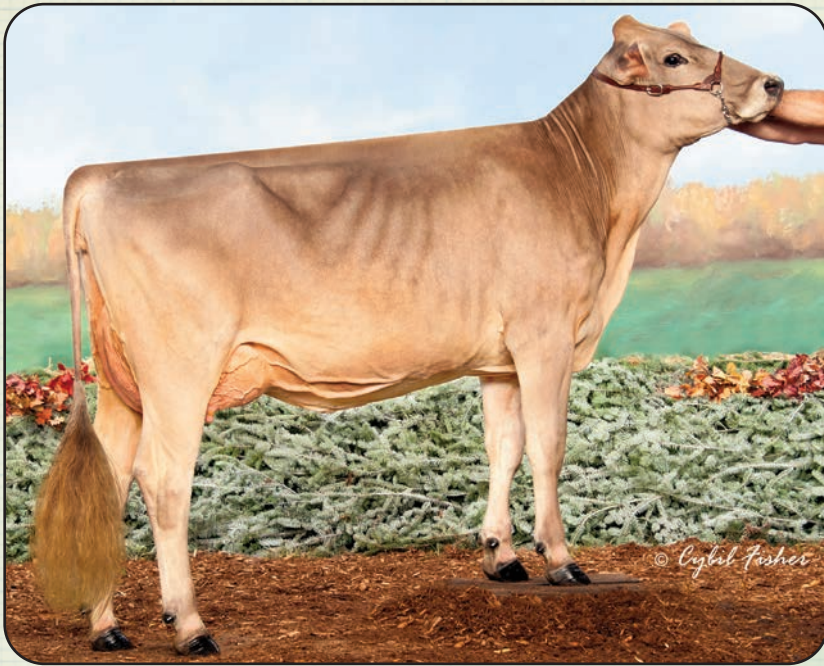
V B HP Norwin Tyra ET 'E91/E91ms' 3/03 305d 2X 31120 4.3 1347 3.2 993 DHIR Nominated All American Yrlg in Milk 2018 Nom All American Produce of Dam 2018 Dam of Lot 35

From Front to Back, the Quality is Never-Ending