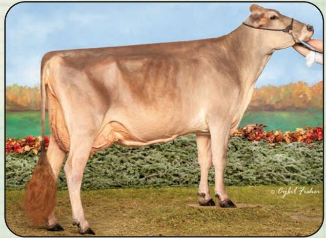
A JOY C NISSAN 'E91/E92ms' 4/09 365d 2X 29330 4.4 1292 3.2 942 DHIR Res All American Sr Best 3 Fmls Member 2019 Dam of Choice Lot 18B