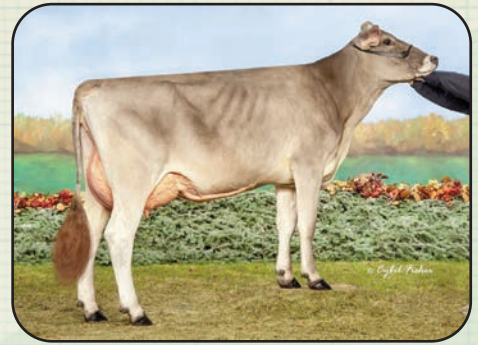
WF Nexus Chattin 68201207 'V85/V86ms' Maternal Sister to Lot 19