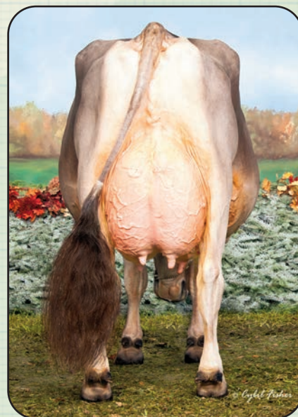
BROWN HEAVEN GLENN FANTASY '2E97/E97ms' 5/11 365d 2x 35556 4.7 1658 3.4 1208 DHIA All American Jr 2,4,&5 Yr Old 2012, 2014, 2015 All American Aged Cow 2016 - 3rd Dam of Lot 23