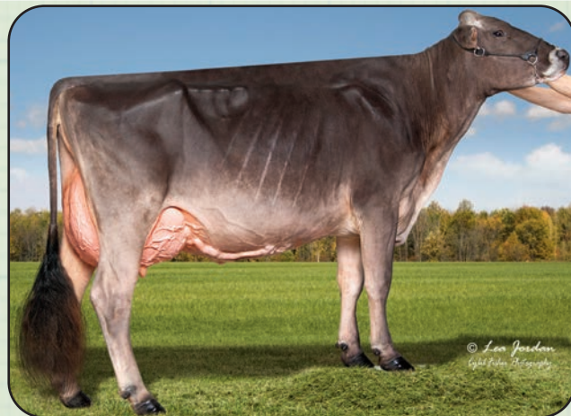
KUHLKOWS BRAID SANGRIA '2E92/E92ms' 5/07 365d 2X 28140 3.7 1039 3.4 949 DHIR Nom All American 5 Yr Old 2020 Maternal Sister to Salt-Choice Lot 18C