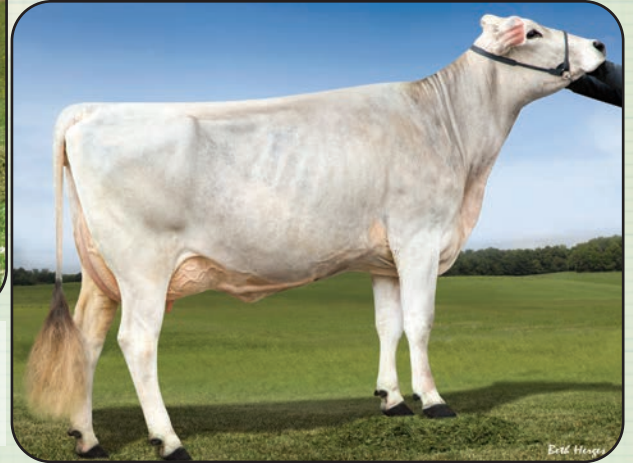
Voelkers Brook Cara 'E92/E90ms' 8/02 365d 2X 49950 5.1 2531 3.5 1766 DHIR Aged Cow 305d & 365d 2X Honor Rolls *Certified - Protein Plus* - MGD of Lot 12