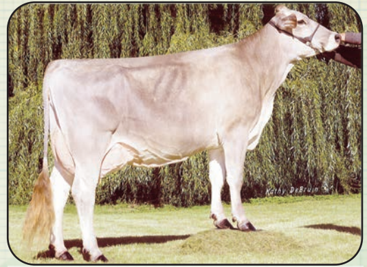
SUN-MADE GB PLT PRETZEL ET 2/03 365d 2X 32770 4.4 1453 3.5 1135 DHIR 2nd Sr 3 Yr Old IN SF 2011 - Dam of Lot 34