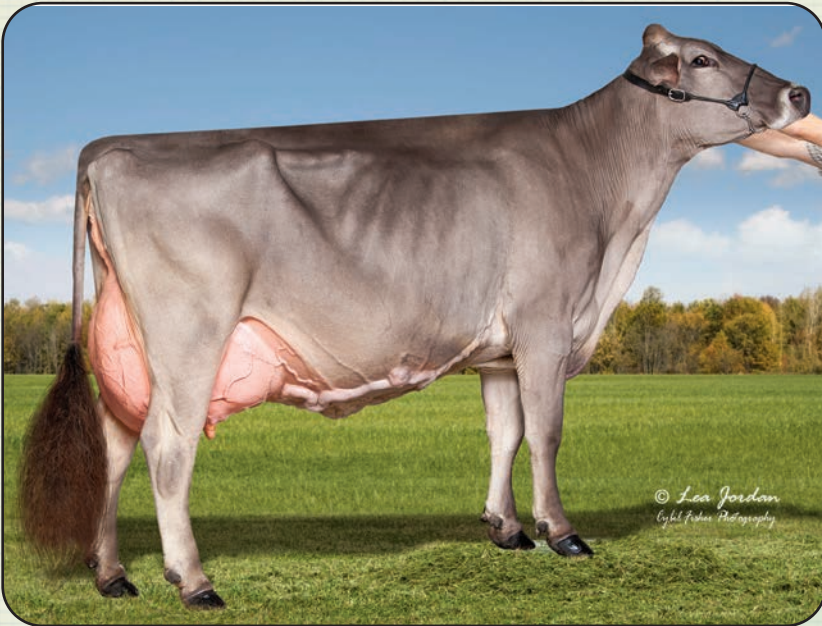
Top Acres Peppy Wizella 'E94/E93ms'

6/03 365d 2X 30990 4.2 1317 3.5 1071 DHIR