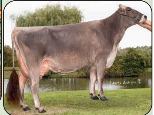
RANDOM LUCK B TIGER LILY 68114007 '2E93/E93ms' 5/00 365d 2X 28150 4.5 1278 3.5 993 DHIR Res All American Produce of Dam Member 2016 Full Sister to MGD of Lot 25