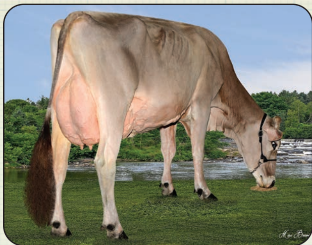
BROWN HEAVEN MANCHEST FRECKLE '3E92/E94ms' 4/07 365d 2X 31916 4.9 1559 3.8 1202 DHIA MGD of Lot 21