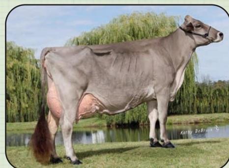
TOP ACRES SUPREME WIZARD ET '3E95/E95ms' - 3rd Dam of Lot 27

$_____ Lot 27 🐄 HILLTOP ACRES FC WANDA ETV 840003254238532 Born: 01/16/2022 Tattoo: 2369 / 2369