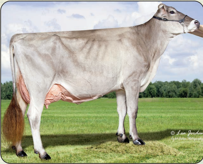
VB HP THUNDER MOCHA ET 'E90/E91ms' 2/00 365d 2X 22340 4.7 1049 3.7 823 DHIR 1st Jr 3 Yr Old IN State Fair 2022 Dam of Lot 9