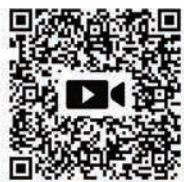
Real Science Webinar Series