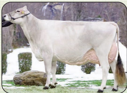
PGD: Adrian's Calvin ELANA-ET 2/05 305d 20827m 913f 747p