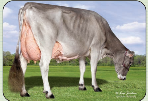
WF RICHARD CHIT CHAT 'E91/E92ms' 4/02 360d 2X 36680 3.8 1383 3.3 1219 DHIR Reserve Grand Champion IA State Fair 2021 *Protein Plus* - Dam of Lot 19