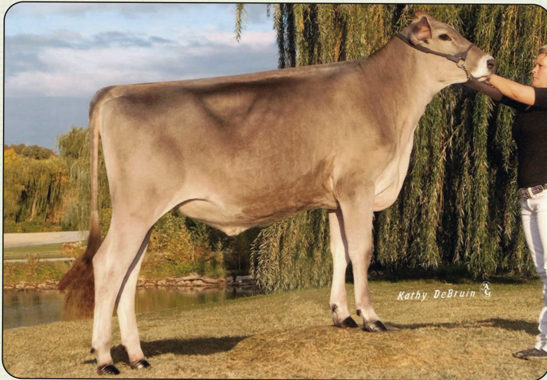
MORT JAVA LUCKEY LADY '2E92/E91ms' 4/10 365d 2X 24300 3.8 925 3.5 852 DHIR Nominated All American Fall Heifer Calf 2012 Dam of Lot 30