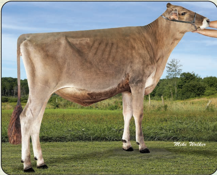
MOORCLOSE WEAPON JINX 3rd Spring Hfr Calf Eastern National 2021 Selling - Lot 33