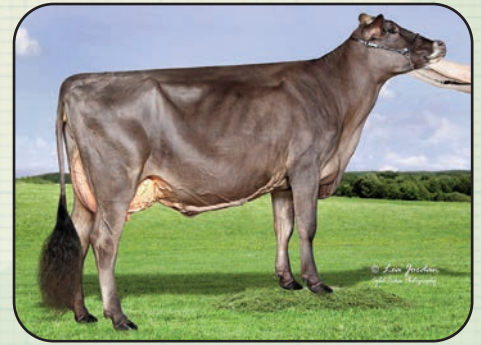
CUTTING EDGE W FAMOUS ETV 'E91/E91ms' 2/00 313d 3X 19160 4.7 908 3.5 664 DHIR Res All American Produce of Dam Member 2021 Dam of Lot 23