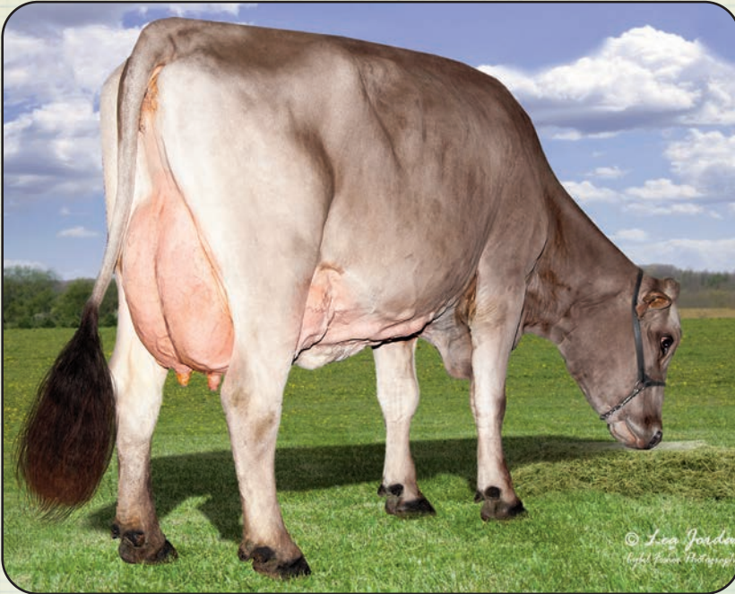
KULP-TERRA CASANDRA ET '2E93/E94ms' 4/00 365d 2X 27873 4.9 1367 3.7 1038 DHIR Dam of Kulp-Terra Silver Coin Dam of Lot 12