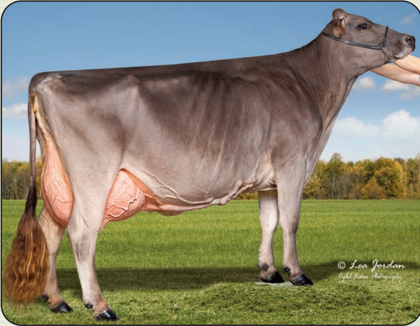
LA RAINBOW BFLY SUNKIST ETV '4E94/E94ms' 6/01 365d 2X 45770 3.4 1577 3.4 1548 DHIR National Total Performance & Cow For All Seasons Winner 2019 *Protein Plus* - Donor Dam of Lot 20C