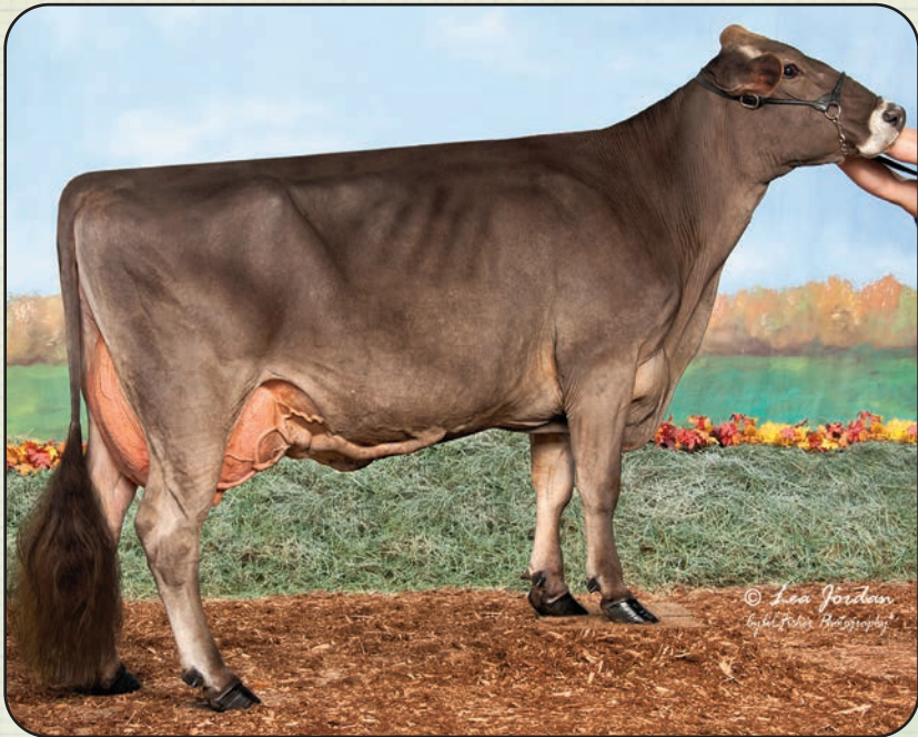
TOPP-VIEW LEE FAME '2E94/E94ms' 3/06 305d 2X 20400 4.1 839 3.5 719 DHIR 1st Aged Cow Ohio State Show 2020 MGD of Lot 31