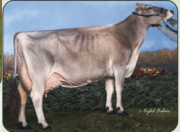
POT LUCK SB BUTTERFLY ET '3E94/E95ms' 6/03 305d 2X 25100 4.5 1121 3.7 933 DHIR All American Aged Cow 2007 MGD of Lot 20C