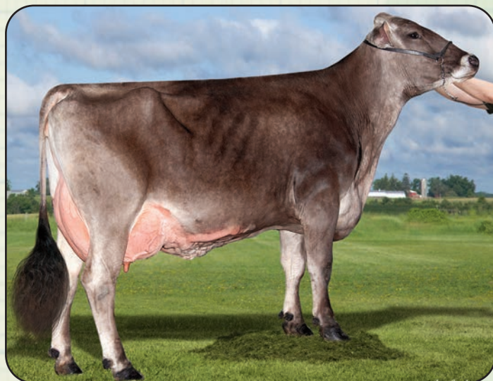
PERRY BROOK BUSH INDIAN 'V88/E90ms' 2/11 365d 3X 28570 4.2 1199 3.6 1022 DHIR Dam of India - 11B Donor Dam MGD of Lulu - 11A Donor Dam