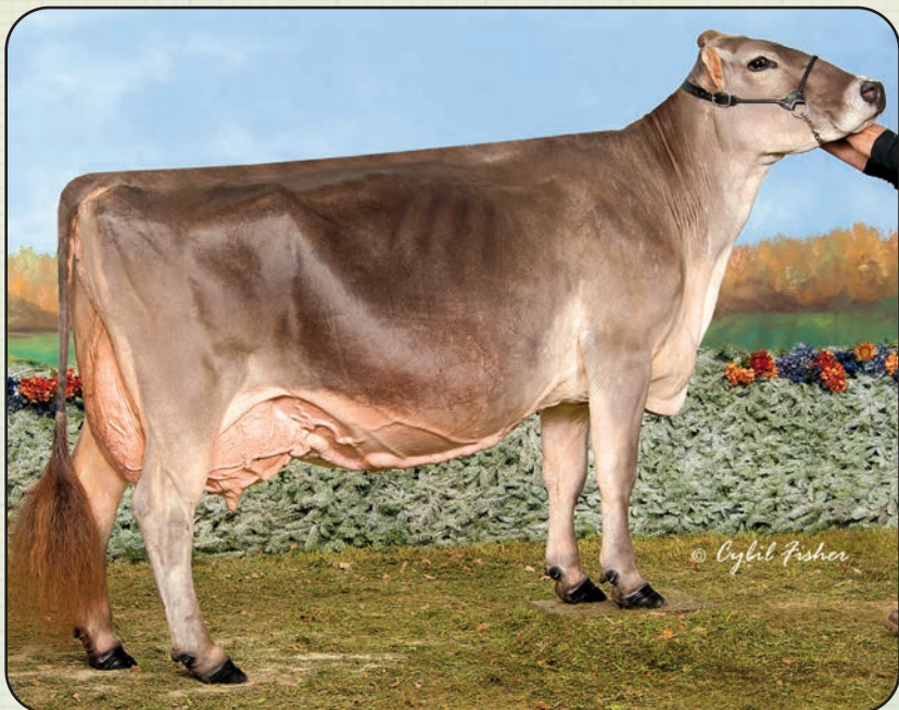
ELOC WAGOR KANDID '3E95/E95ms' 7/04 365d 2X 27291 5.4 1457 4.1 1111 DHIA All American Aged Cow 2014, 2015 Donor Dam of Lot 17