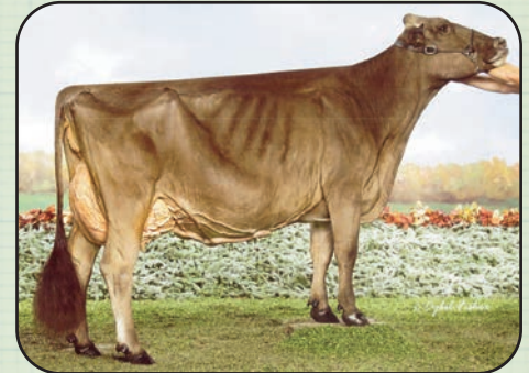
CIE DOUBLE W EM FAVOR '2E95/E94ms' 3/03 365d 2X 29410 4.5 1329 3.2 941 DHIR All American 4 Yr Old 2015 & HM AA 5 YO 2016 MGD of Lot 23