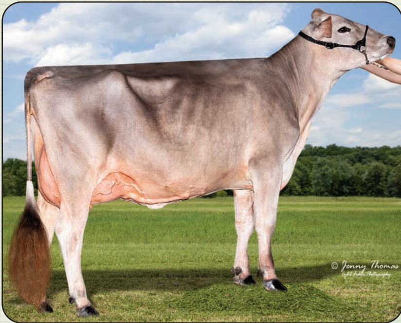
LA RAINBOW SWEET CHEERIOS 'V87/V88ms' 1/10 305d 2X 14720 4.5 661 3.5 520 DHIR 1st Futurity Winner, Ohio State Fair 2022 Dam of Lot 10

Select Sires, New Generation Genetics, and ST Genetics have interest in talking with the purchaser about matings and offspring from Cheerful!