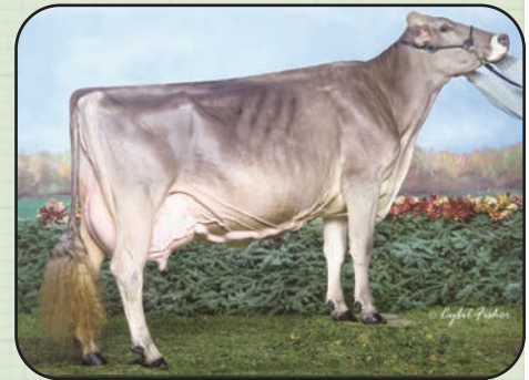
JO-DEE BANKER ROSE ET '2E92/E92ms' - 3rd Dam of Lot 26E Nom All American Comp Merit Cow 2009