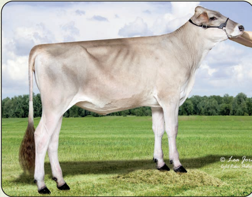
BLESSING GARBRO F PRUTY ETV 7 Excellent Dams Selling - Lot 34