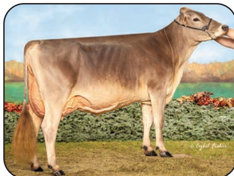
WF CAYENNE NICOLE ET 'E91' ALL AMERICAN JR 3 YR OLD 2021 HON MEN ALL AMERICAN PRODUCE OF DAM MEMBER 2021 Maternal Sister to Dam of Lot 24

4th Dam: TUOLUMNE ENSIGN NOEL 858885 '2E90' 03/05 302d 2X 31440 3.5 1090 3.4 1056 DHIA 04/05 365d 2X 37880 3.6 1345 3.2 1206 DHIR 1st TOTAL PERFORMANCE WESTERN NAT'L 2001 3rd & 3rd BU 5 YR OLD WESTERN NATIONAL 2001