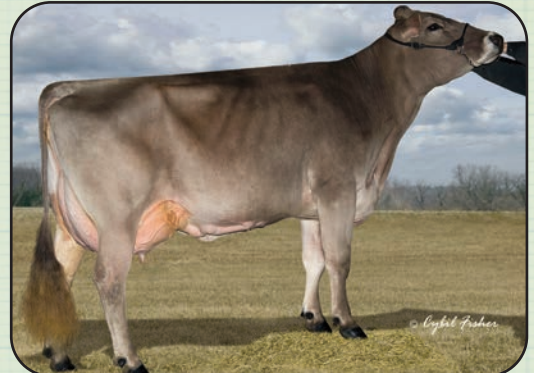
SUN-MADE GARBRO EG PATSY ET 'E91/E91ms' 5/02 365d 2X 52360 5.0 2592 3.4 1794 DHIR National Protein & JP Eves Milk Awards 2009 *Certified - Protein Plus* - MGD of Lot 34