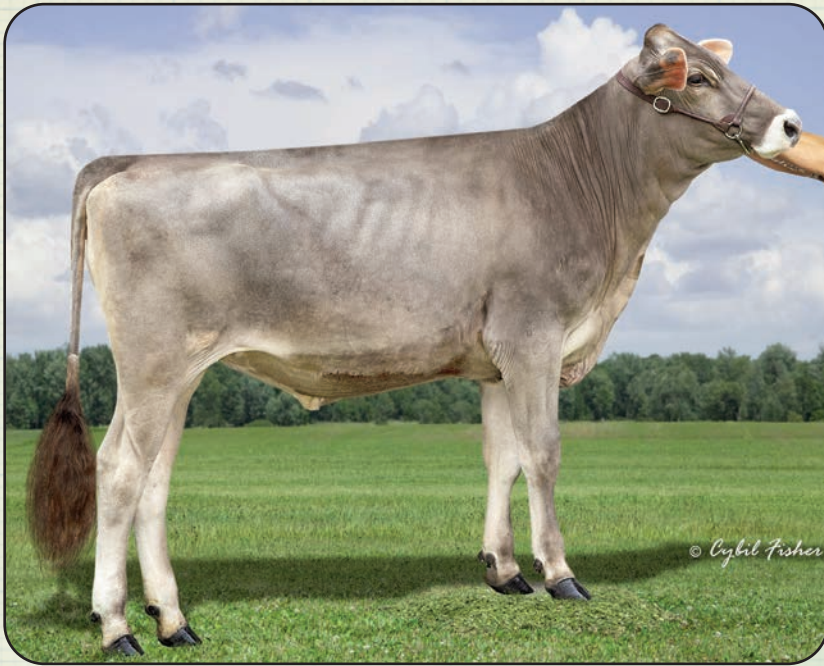
USA DIEGO CHARLOTTE 1st Spring Calf Iowa State Fair 2021 Selling Lot 19