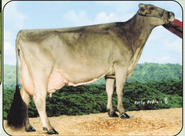
V B HILLPOINT MARILYN ET '2E94/E91ms' 6/07 365d 2X 40490 4.2 1692 3.2 1307 DHIR National Total Performance Winner 2017 MGD of Lot 9