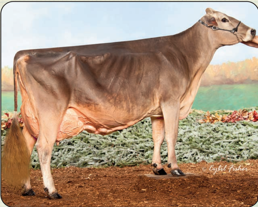
CUTTING EDGE STRATUS SUE '3E94/E95ms' 9/06 365d 2X 60550 6.8 4097 3.6 2208 DHIR All American Aged Cow, AA Sr Best 3, Prod of Dam 2018 *Protein Plus* - Donor Dam of Lot 16F