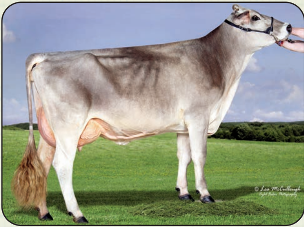
A JOY W CHEETAH '3E91/E91ms' 7/01 326d 2X 24630 4.7 1146 3.6 890 DHIR 2nd Spring Yrlg Hfr PA Farm Show 2015 Dam of Choice Lot 18A