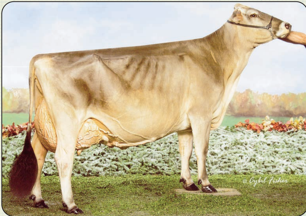
CUTTING EDGE T DELILAH '2E95/E95ms' 6/05 365d 2X 32770 4.7 1554 3.6 1170 DHIR All American Sr 2, 3, 5 Yr Old & Aged Cow Dam of Lots 1 & 2, MGD of Lot 3