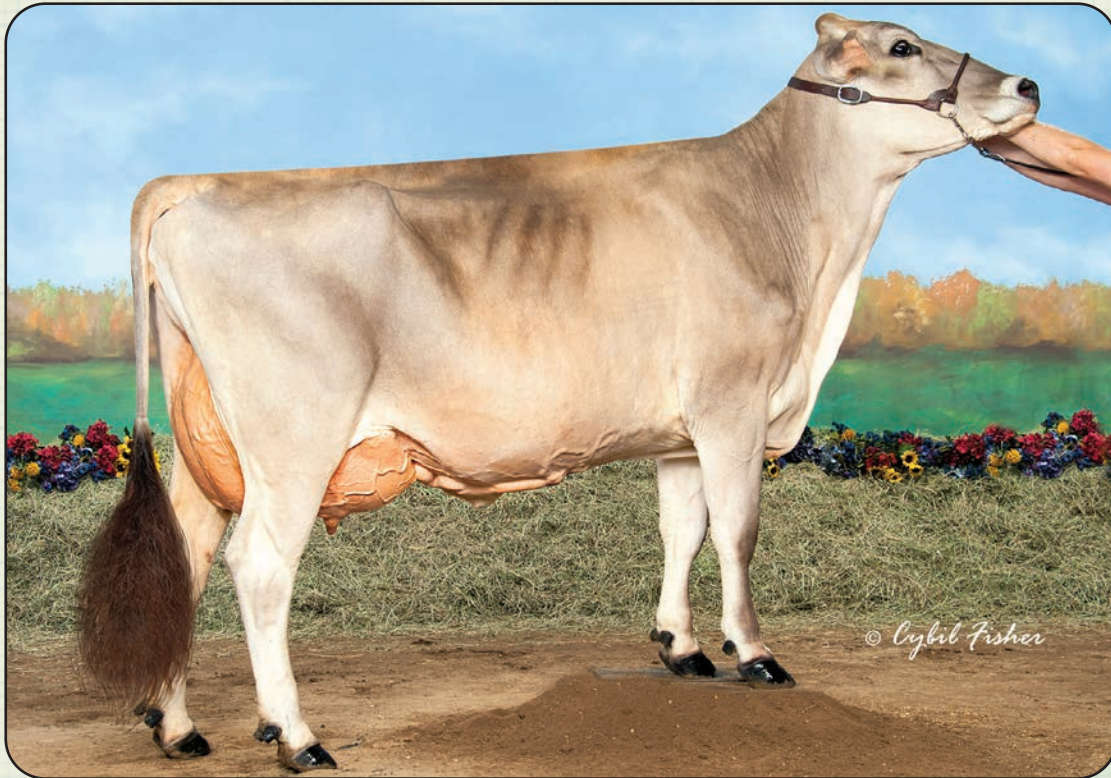
HF CADENCE ASPEN 'E93/E93ms' 3/03 348d 2X 26870 5.3 1437 3.9 1040 DHIR 1st Sr 3 Yr Old MN State Show & Fair 2017 MGD of Lot 15

$ _____ Lot 15 🐄 HF PACTOLE AZALEA 840003238336781 Born: 03/12/2022 Tattoo: 5783