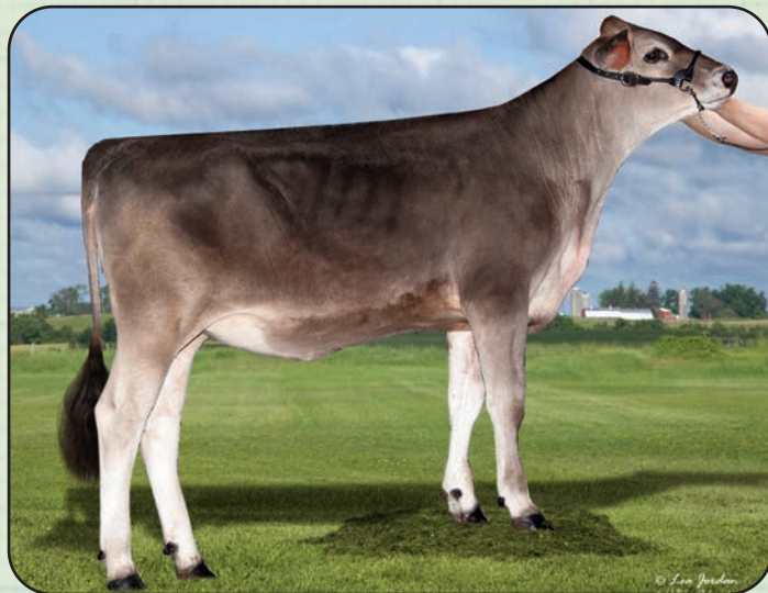
PERRY BROOK NORA GRETS ETV 68219129 PPR: +207 #3 on 8/22 Top Heifer List PTA: +1015m +44f +49p +695NM$ 99%$ (GEN) Daughter of 11C Donor Dam

TERMS: Buyer is purchasing the right to control the next IVF session. Buyer is guaranteed IVF sessions until a minimum of 8 #1 or #2 IVF embryos are produced. Embryo grades are determined at the time of transfer if fresh embryos or at time of freezing if freezing is requested by buyer. Buyer keeps all resulting embryos from these controlled IVF sessions. Buyer is responsible for all costs of the aspiration and mating sire decisions.