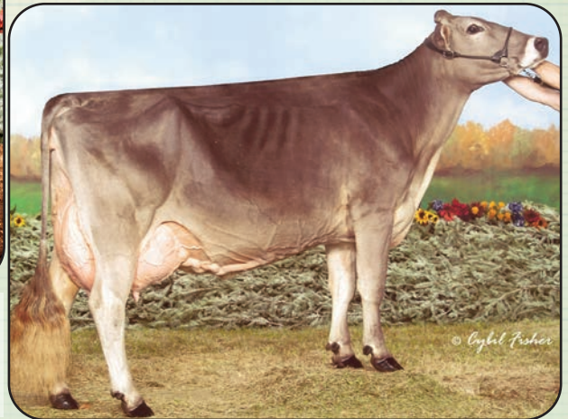
CUTTING EDGE PS STORM ET '2E92/E94ms' 3/10 356d 2X 29880 4.1 1224 3.5 1050 DHIR Res All American Sr Best 3 Member 2013 MGD of Lot 16F