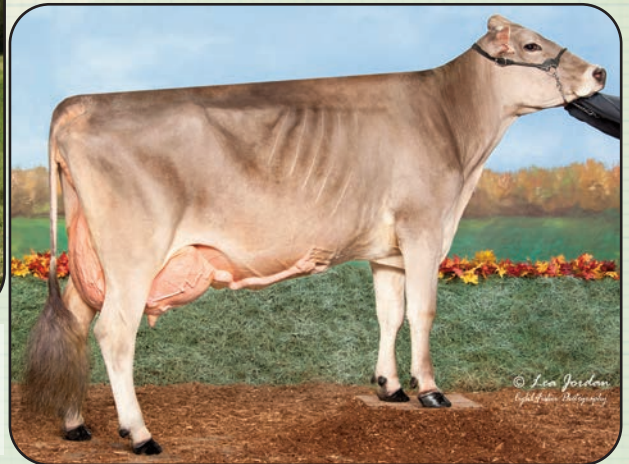
LA RAINBOW SWEET CHEERS ET 'E91/E91ms' 3/00 308d 2X 22510 4.2 942 3.5 790 DHIA 1st 4 Yr Old, Ohio State Show 2022 MGD of Lot 10

Select Sires, New Generation Genetics, and ST Genetics have interest in talking with the purchaser about matings and offspring from Cheerful!