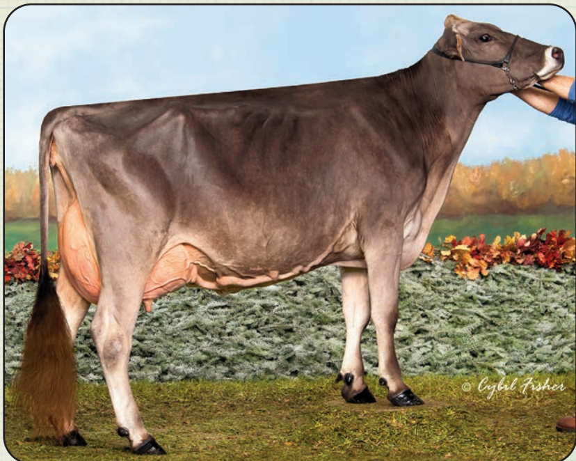
KRUSES VICTOR JITERBUG ET 'E91/E91ms' 4/06 294d 2X 21170 4.2 886 3.6 756 DHIR Hon Men All American Sr 3 Yr Old 2016 Dam of Lot 22

KRUSES ACC C JUST DANCE ETV 840003224513321 * JR CHAMPION MD STATE FAIR 2022 * 1st FALL HFR CALF MD STATE FAIR 2022 Maternal Sister to Lot 22