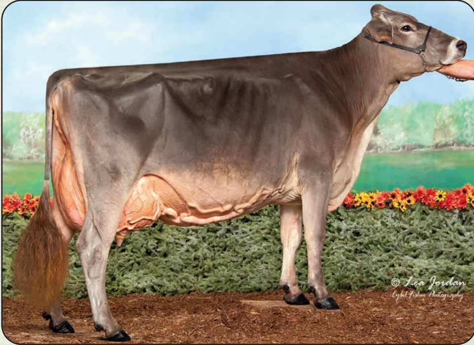
RANDOM LUCK B TEA ROSE '3E95/E95ms' 9/05 365d 2X 27450 4.6 1258 3.3 897 DHIR All American Component Merit Cow 2021 MGD of Lot 25