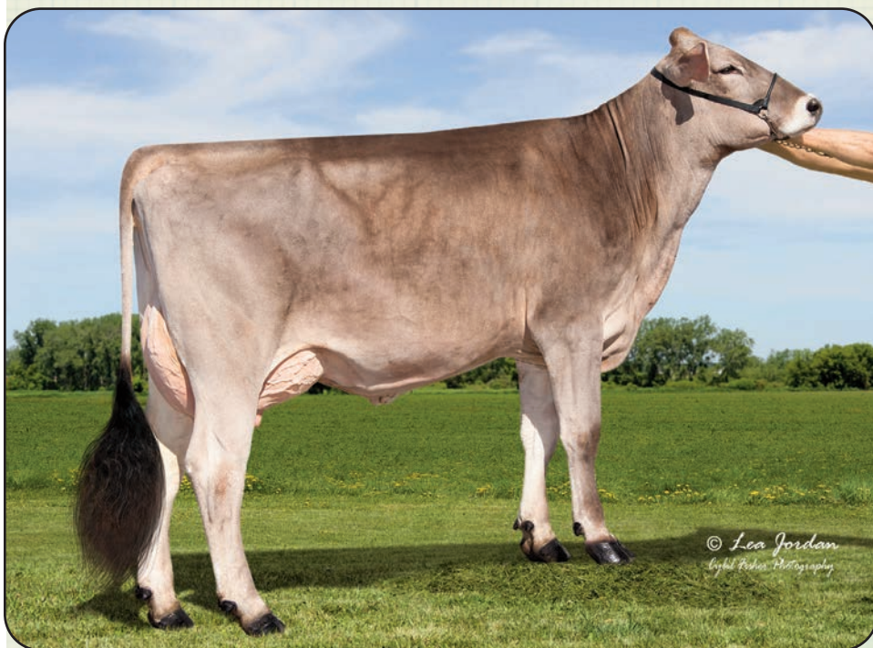
HILLTOP ACRES DB WHISPER ETV 'V87/V88ms' *Certified* Dam of Lot 27