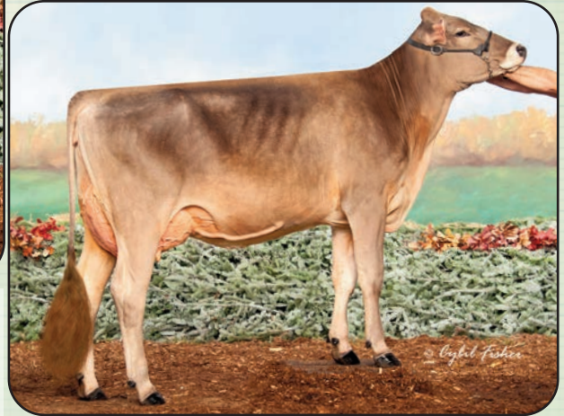
V B HP Norwin Teanna ET 68178969 '2E90/V89ms' 3/00 338d 2X 27670 4.5 1246 3.3 917 DHIA Reserve All American Yrlg in Milk 2018 Full Sister to Dam of Lot 35