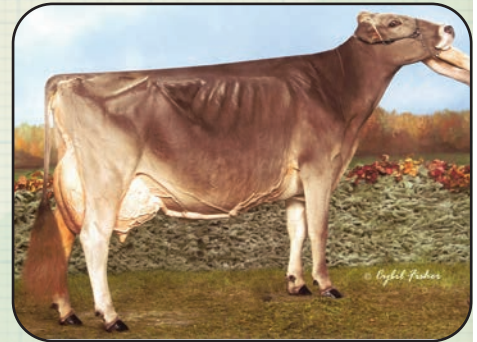
JO-DEE ENSIGN ROSEBUD '2E93/E92ms' - MGD of Lot 26E All American Aged Cow 2013