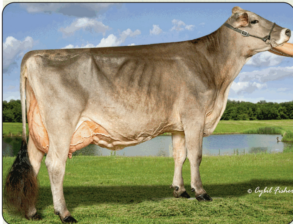
WF BIVER NORTHERNLIGHTS ET 'E93/'E93ms Hon Men All American Sr 3 Yr Old 2021 Hon Men All American Produce of Dam Member 2021 Donor Dam of Lot 24