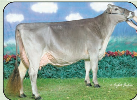
VALLIGROVE JETWAY NORA '2E91/E92ms' - 3rd Dam of Lot 24 All American Component Merit Cow 2007