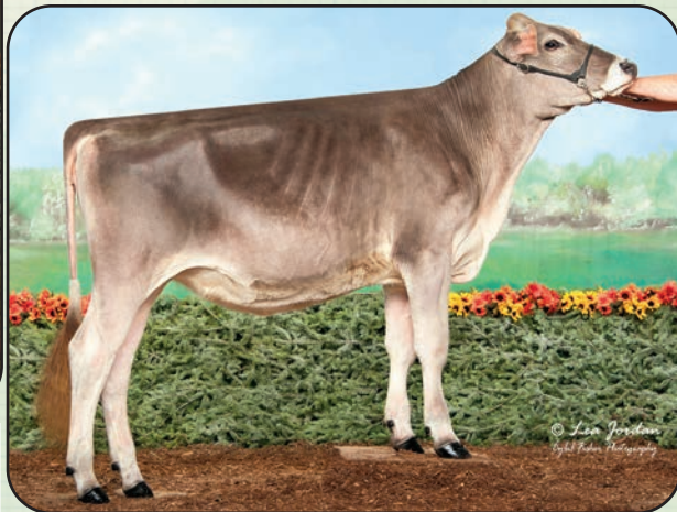
Kruses Carter Jive ETV 68211836 Hon Men All American Fall Calf 2021 Reserve Jr Champ Mid-Atlantic Invitational 2022 1st Fall Yrlg Mid-Atlantic Invitational 2022 Maternal Sister to Lot 22

KRUSES ACC C JUST DANCE ETV 840003224513321 * JR CHAMPION MD STATE FAIR 2022 * 1st FALL HFR CALF MD STATE FAIR 2022 Maternal Sister to Lot 22