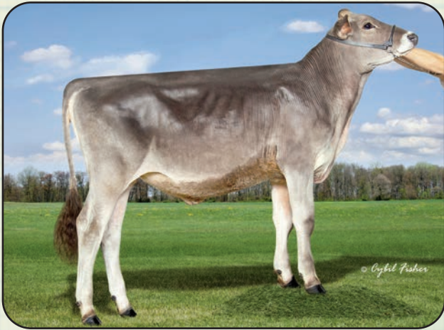
A JOY W NIKE 1st Summer Yrlg Hfr NY Spring Show 2022 Choice Lot 18B