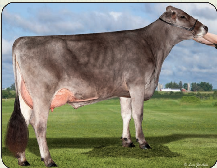
PERRY BROOK LUCKY INDIA 'V87/V88ms' Her Sons: Perry Brook P Crazy Horse ETV #1 PPR Perry Brook P Indigenous ETV #2 PPR Perry Brook Jonmar Charaka ETV #36t PPR Perry Brook Pact Shawnee ETV #47t PPR Dam of Lulu - 11A Donor Dam - #1 PPR Heifer Dam of Perry Brook Pac Winona ETV - #4 PPR Hfr Perry Brook Segs Seneca ETV - #32t PPR Hfr Perry Brook Jon Tallulah ETV - # 46t PPR Hfr 11B Donor Dam