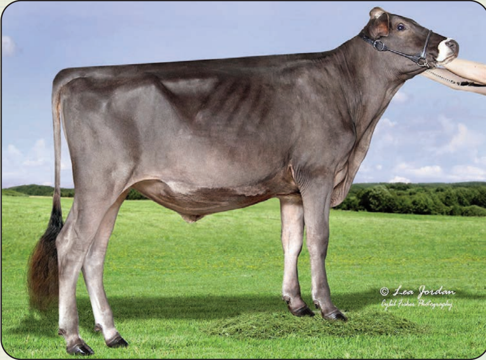
BLUE HEAVEN SEAMAN FANCY 1st Spring Yrlg NY State Fair 2022 Selling - Lot 23