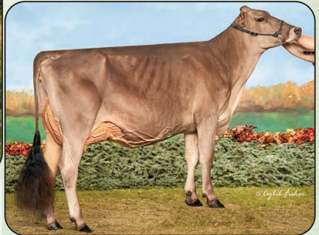
BUSCHS FAMOUS JENNA 'E91/E92ms' Nom All American Sr 2 Yr Old 2021 Res Grand Champ Mid-Atlantic Invitational 2022 Intermediate Champ Mid-Atlantic Invit'l 2022 Dam of Lot 33

$ _____ Lot 33 🐄 MOORCLOSE WEAPON JINX 68213629 Born: 03/30/2021 Tattoo: S87 Consignor: VAIL, PETER, ENGELWOOD, FL