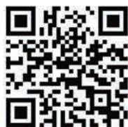
Real Faces of Dairy

Balchem's Real Faces of Dairy project is flooding the internet with positive images of the dairy industry. Add in the Kooler Kids food bank refrigeration program, the Real Science Lecture Series and the Real Science Exchange podcast, and you can see how Balchem is amplifying the dairy industry's commitment to producing safe and sustainable food for a growing population.