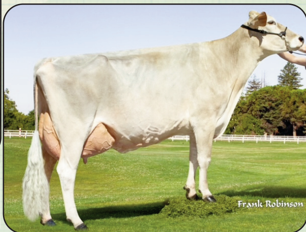
T-G Daredevil Sandra 'E92' 3/03 365d 2X 30671 4.6 1405 3.5 1083 DHIR Grand Champion CA State Fair 2022 Maternal Sister to Donor Dam of Lot 14C