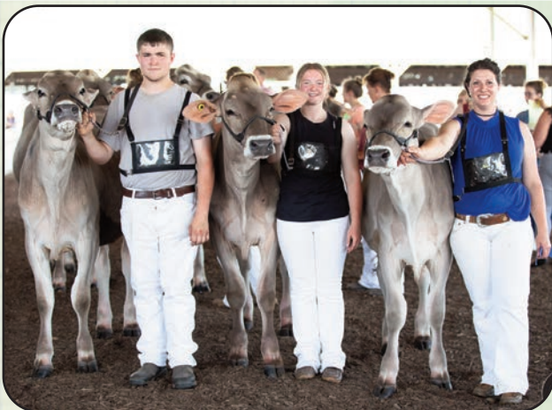
1st Jr Best 3 at Mid-Atlantic Invitational 2022 Chichi, Nike, Salt - Your Choice All 3 will be shown at WDE