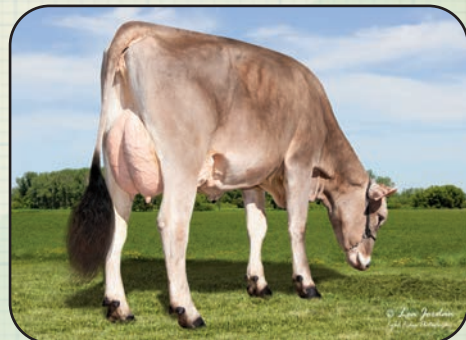
Whisper's V88 Mammary