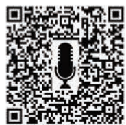
Real Science Exchange Podcasts