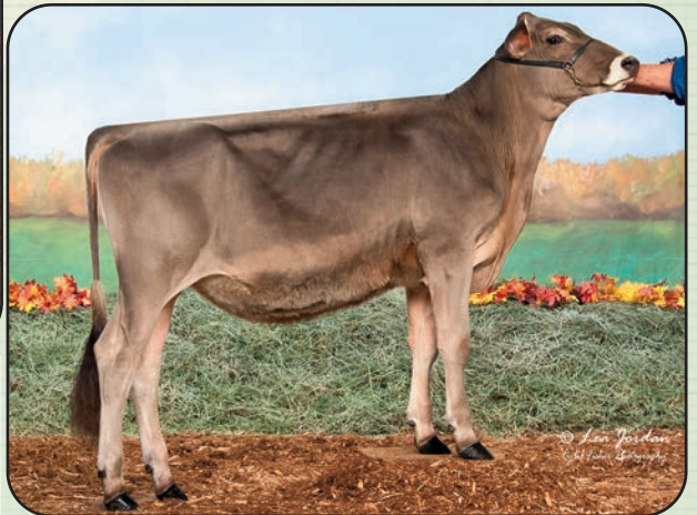
TOPP-VIEW GLNWOOD FANTASTIC 'V85' Reserve All American Spring Hfr Calf 2020 Dam of Lot 31