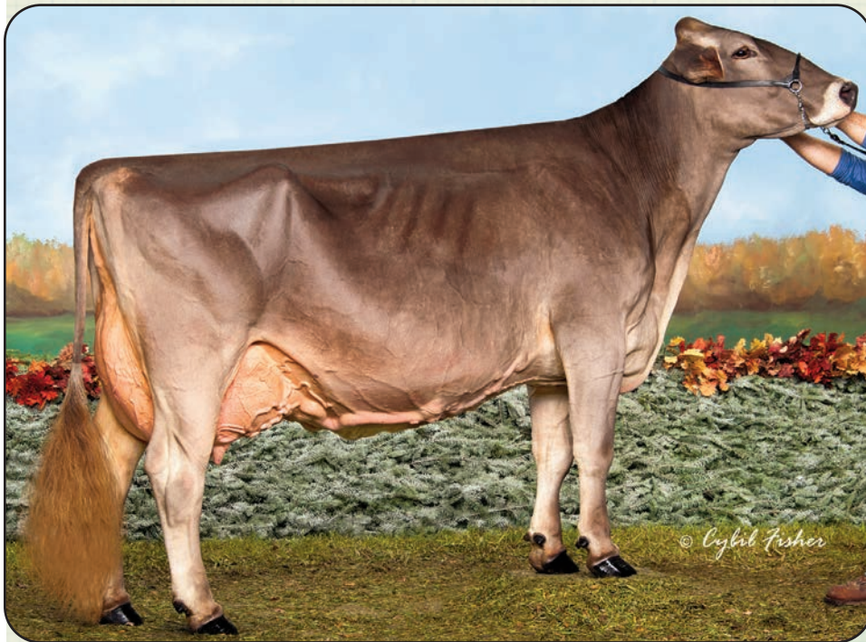
Jo-Dee Nemo Risky '2E94/E95ms' 8/08 365d 2X 33740 4.1 1367 3.1 1058 DHIR Reserve All American 4 Yr Old 2014