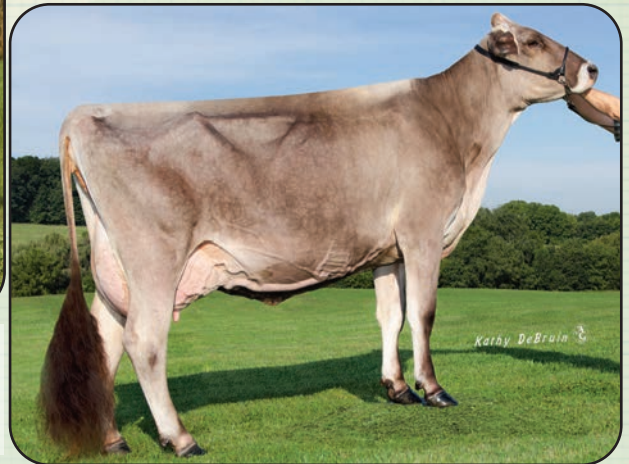
Top Acres C Wizzie Fly ET '2E93/E94ms'

3/04 359d 2X 30060 5.6 1687 3.3 985 DHIA