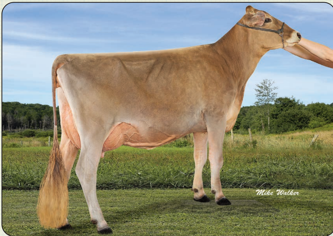
ARETHUSA PHANTOM AXEL 'V89/E90ms' Nominated All American Spring Yrlg Hfr 2021 Dam of Lot 32

$ _____ Lot 32 🐄 RUCKS VAIL RASTA ANITA 68220995 Born: 04/05/2022 Tattoo: 607