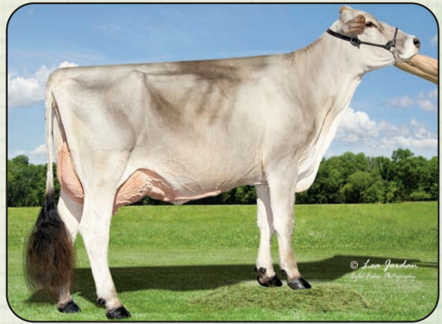
A JOY T CHEERIO 68197048 'E90/E90ms' 2/00 359d 2X 16650 5.0 829 3.6 607 DHIR Nom All American Summer Yrlg Hfr 2019 Maternal Sister to Chichi-Choice Lot 18A