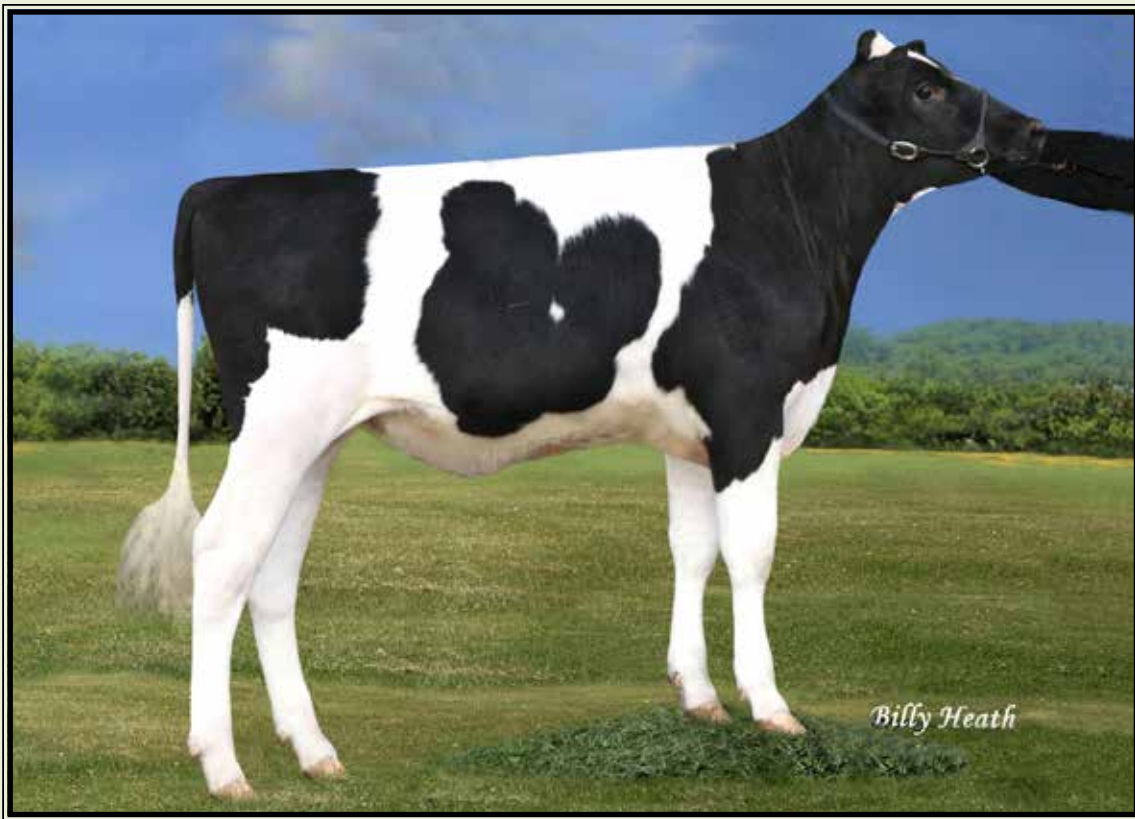
Pen-Col Gameday Baily-ET (Dam of Lot 2)