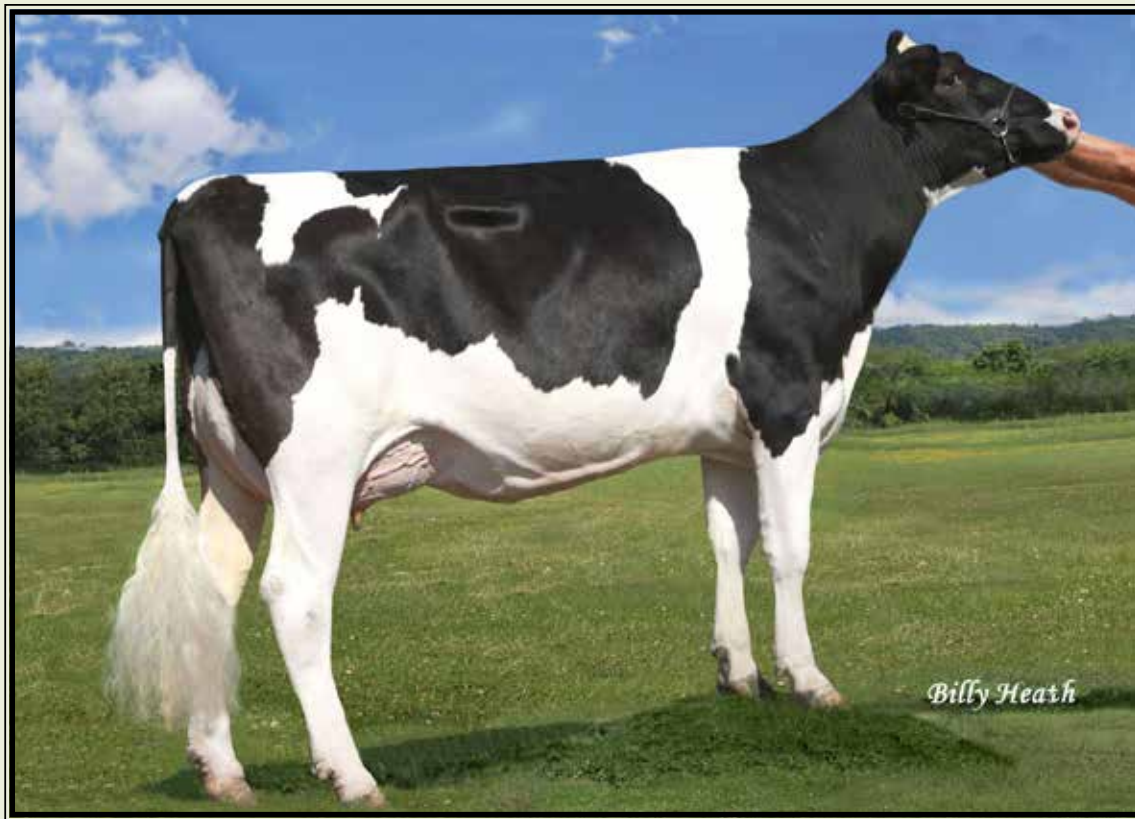
Pen-Col Legacy Bridget-ET VG-86 +++UU (Dam of Lot 36)