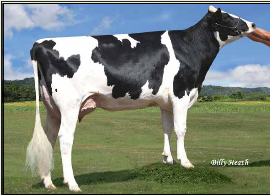
Cherrypencol L Lolly-ET VG-85 UUUGU (Dam of Lots 27 & 28)