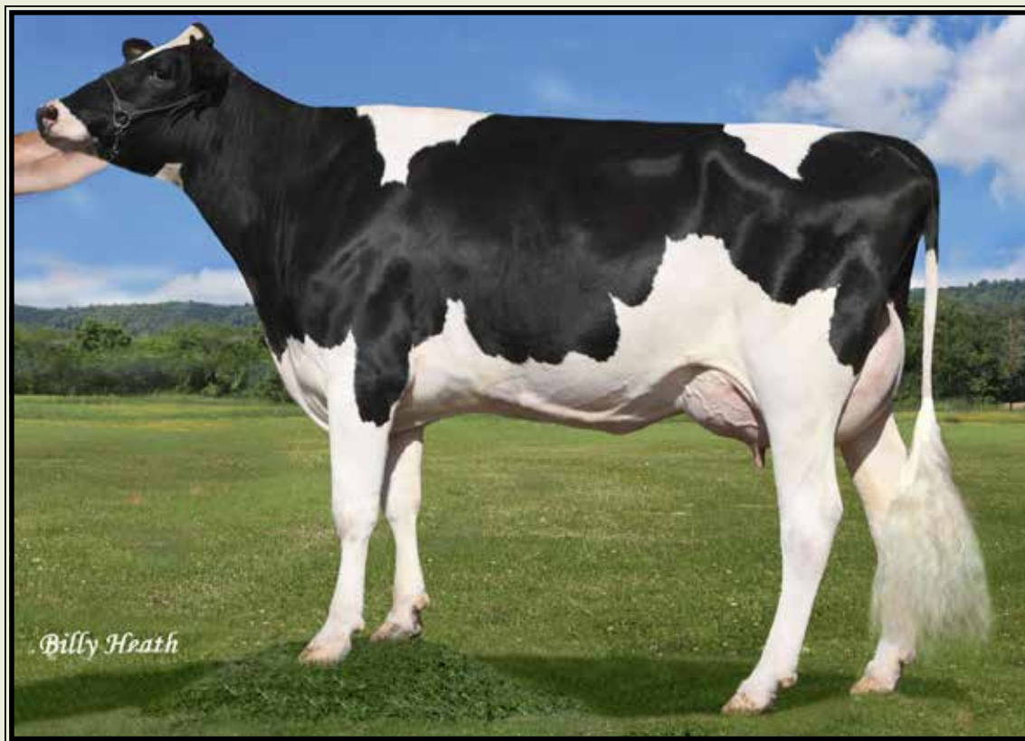
Pen-Col Legacy Jazz-ET VG-87 UU+UU (Dam of Lot 33)