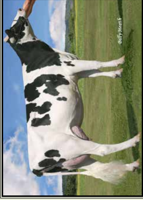
Pen-Col Legacy Jess-ET VG-87 (Dam of calves in group lots)