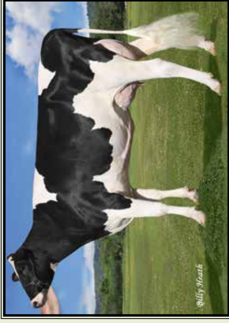
Pen-Col Legacy Jazz-ET VG-87 (Dam of calves in group lots)