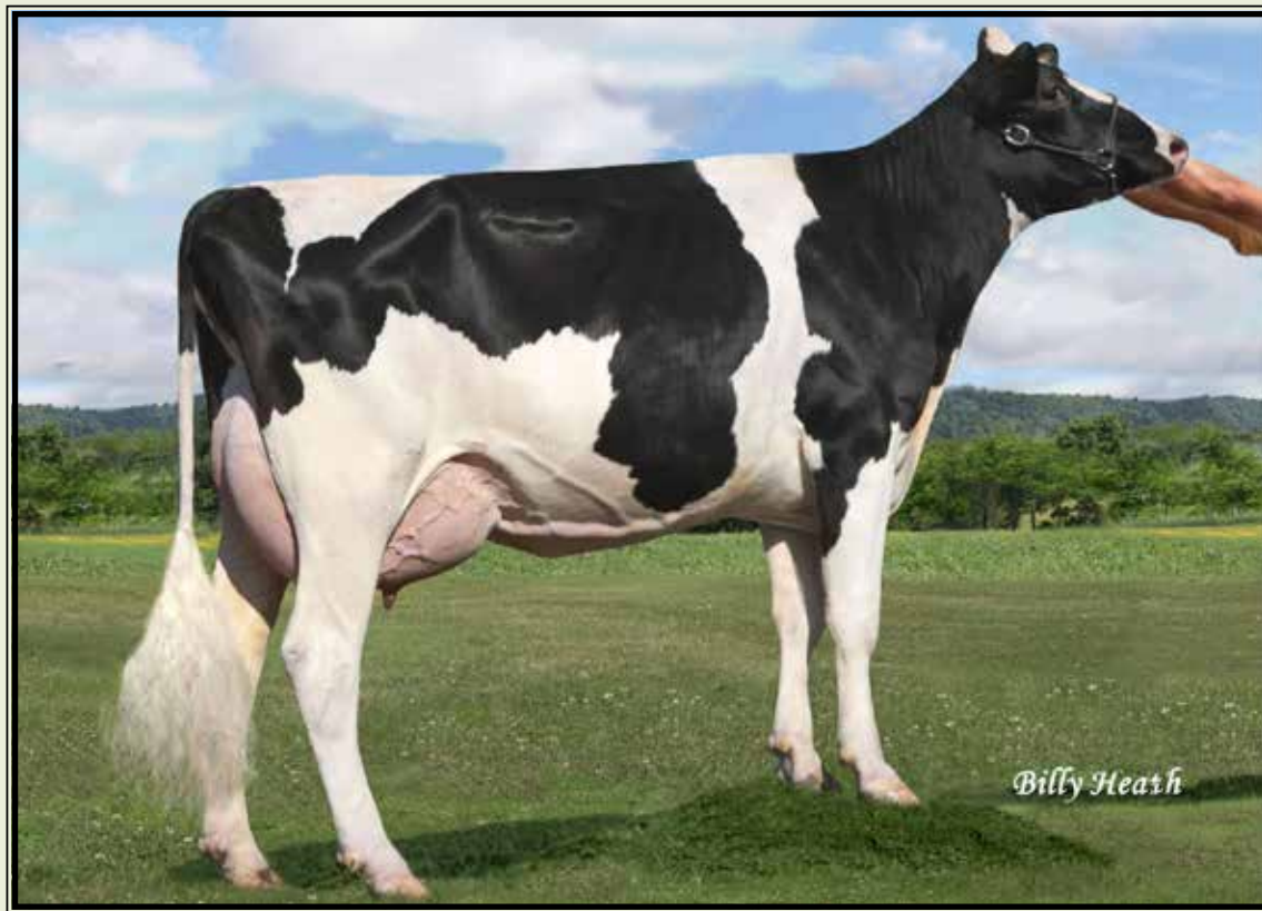
Pen-Col Legacy Jane-ET VG-87 UUUUU (2nd Dam of Lot 18 and Dam of Lots 20, 43 & 44)