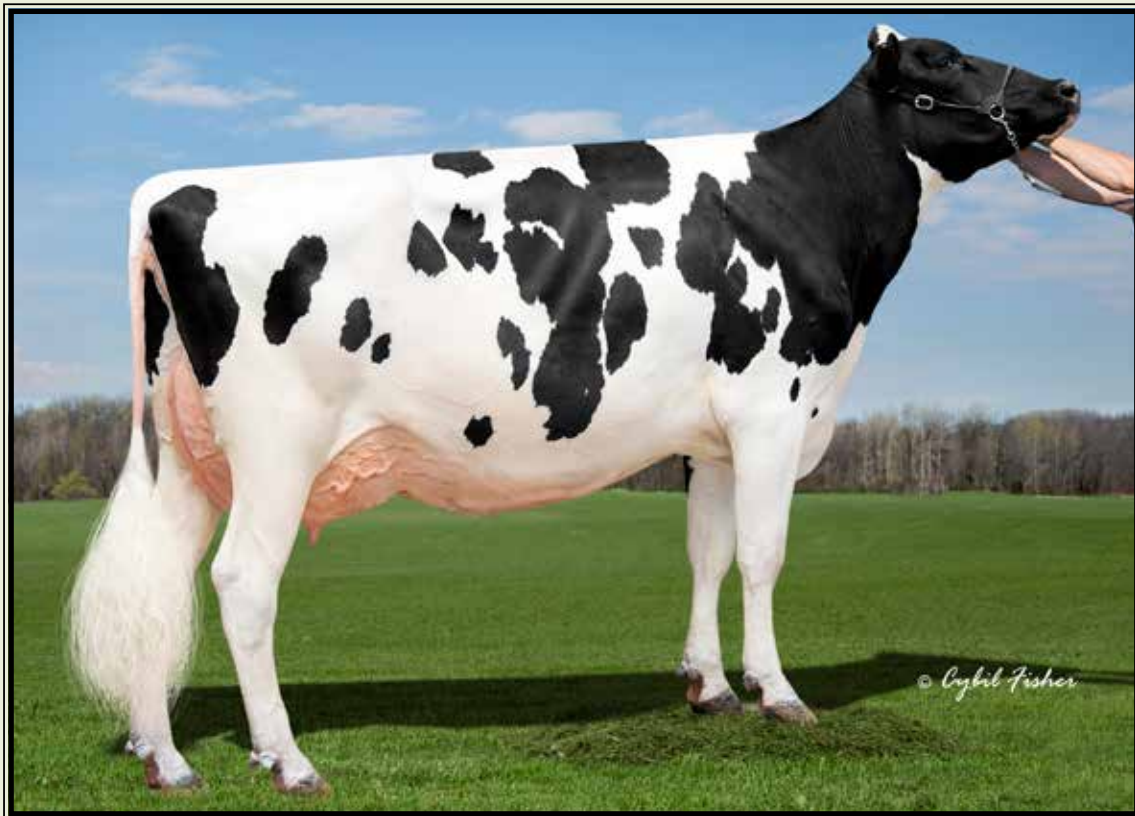
Pen-Col Silver Mist-ET EX-90 EE+UE (4th Dam of Lot 46)