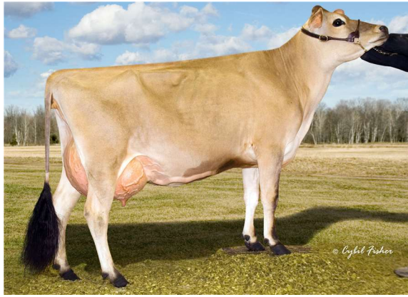
NORSE STAR FUROR BEAUTY, E-91% FOURTH DAM OF LOT 100F