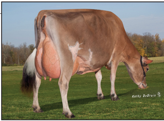
KILGUS RANDOM CORTNEY, E-93% GRANDAM OF LOT 2