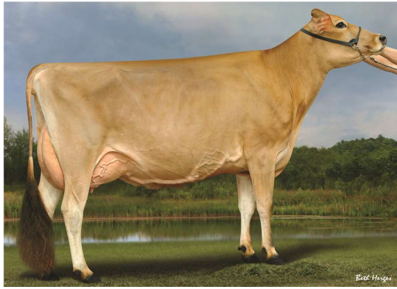
OKATO RISING TEMP LISSY, 91% DAM OF LOT 29