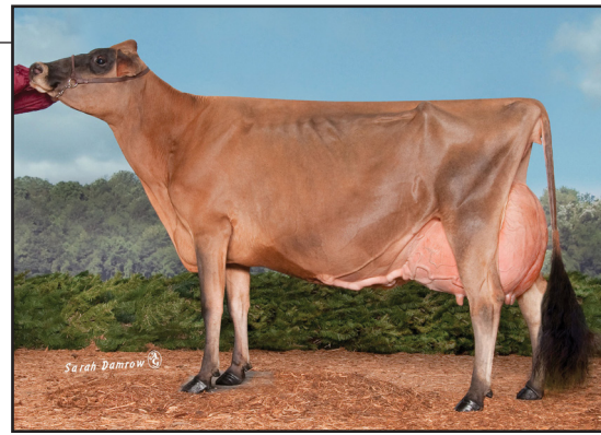
KILGUS GOVERNOR MAID {4}, E-94% GREAT GRANDAM OF LOT 1