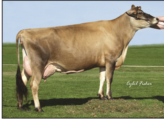
SAMBO FRAN OF FAMILY HILL, E-93% GREAT GRANDAM OF LOT 18