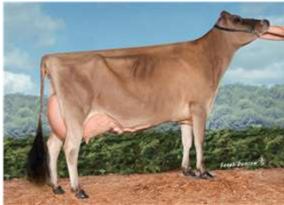
SNAFU HOLBRIC TBONE DIAMOND, E-94% GRANDAM OF LOT 10