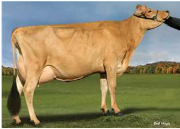
ALL LYNN'S CRAZE VERA, E-92% DAM OF LOT 21