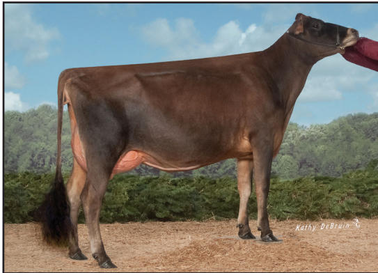
HARMONY-CORNERS SOCRATES 11086-ET, E-93% SAME FAMILY AS LOT 24