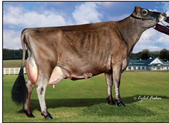
HARMONY CORNERS FRANKIE-ET, E-90% SAME FAMILY AS LOT 18