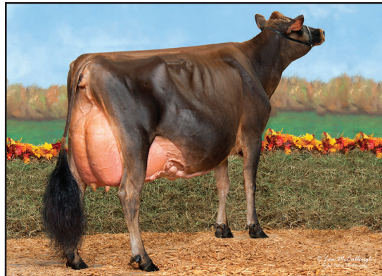
HARMONY CORNERS FOZZY-ET, E-95% SAME FAMILY AS LOT 18