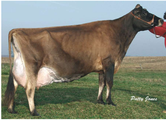
ENNISKILLEN TOPS GROVE, EX-95% (CAN) GREAT GRANDAM OF LOT 27