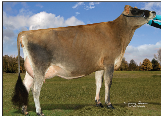
SANFORDALE GOVERNOR ELAINE, VG-86% GREAT GRANDAM OF LOT 7