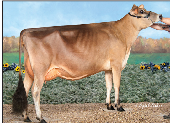
M-SIGNATURE NEVADA EPIC, VG-88% SAME FAMILY AS LOT 7