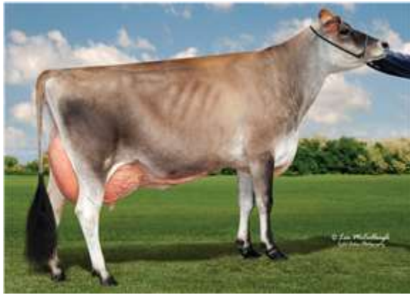
SUNSET CANYON HG ANTHEM-ET, E-90% GREAT GRANDAM OF LOT 9