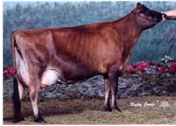
ENNISKILLEN TITLE GROVE, SUP-EX 94% (CAN) FOURTH DAM OF LOT 27