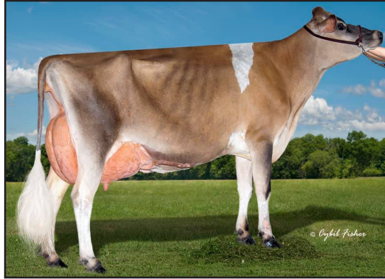
M-SIGNATURE ESSENTIALS EXQUISITE, E-92% DAM OF LOT 7