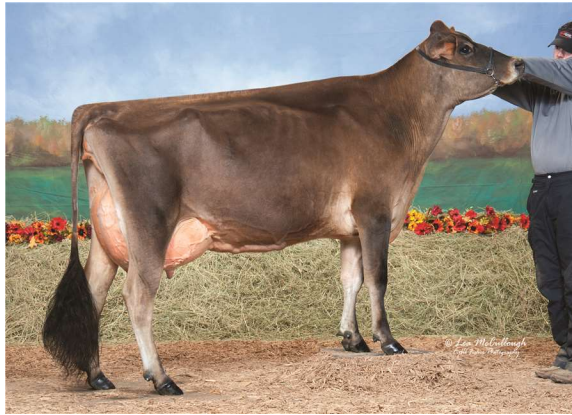
NORSE STAR IATOLA BROOKLYN, E-93% DAM OF LOT 28