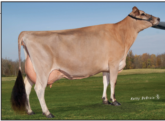
MAPLE LAWN IATOLA IVY, E-90% GRANDAM OF LOT 11