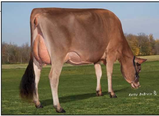
KILGUS VALENTINO MARIAH {5}, E-92% SAME FAMILY AS LOT 1