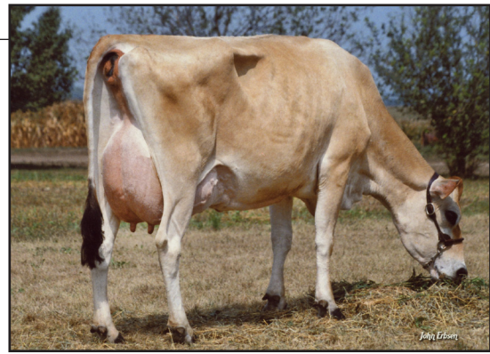
AUBURNVUE SOONER GINGER, E-93% FOURTH DAM OF LOT 11