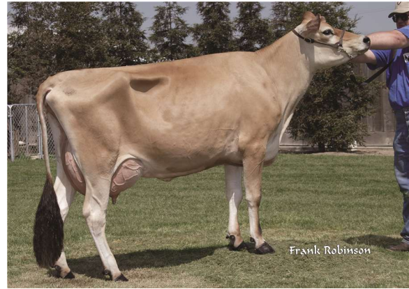
D&E PARAMOUNT VIOLET, E-90% FOURTH DAM OF LOT 21