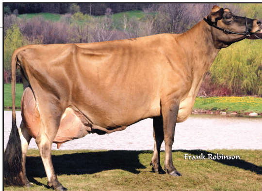
WAYMAR PATRICK NADINE, SUP-EX-97% (CAN) FOURTH DAM OF LOT 25