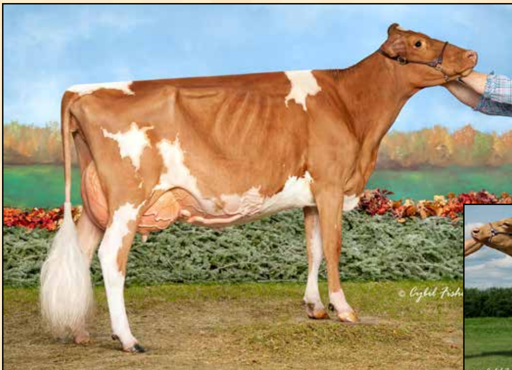
KNAPPS HP MB TRINA-ETV DAM OF LOT 6

Reserve All-American Junior 3-Year-Old 2021