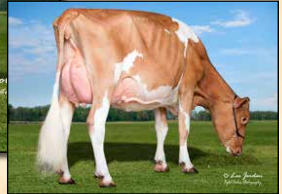
PONDS NPINES BEAU NUTTER BUTTER VG-89 DAM OF LOT 9

Unanimous All-American Summer Yearling 2020