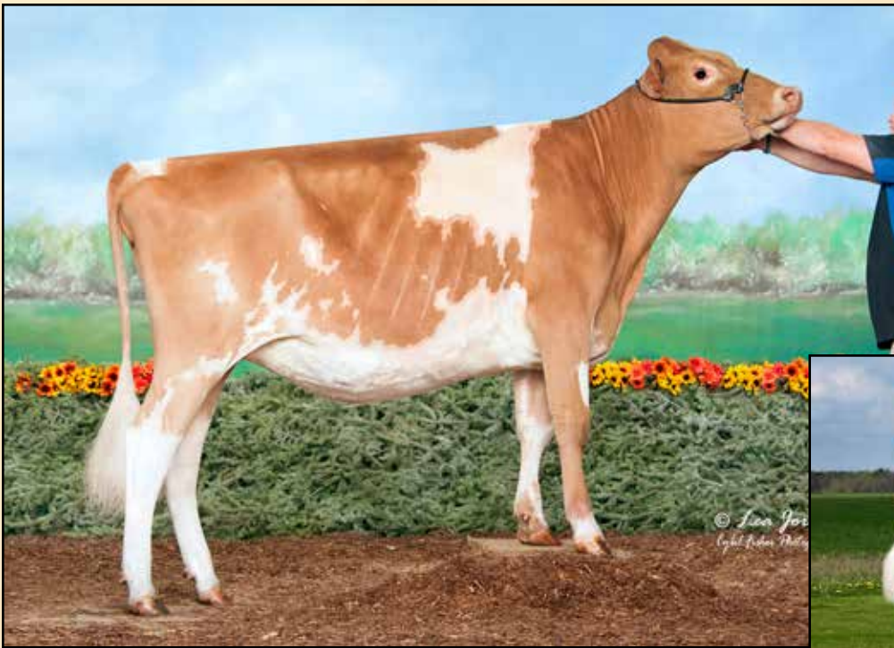
THURSTON FARM POPEYE ADDYSON VG-86 DAM OF LOT 13 All-American Fall Yearling 2021