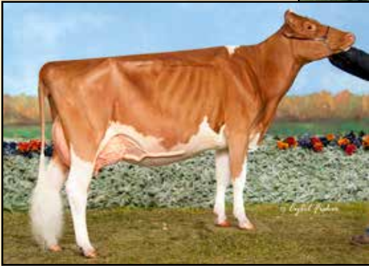
MISTY MEADOWS LEVI SUEDE-ET EX-94 MATERNAL SISTER TO DAM OF LOT 8

Grand Champion at Madison, Louisville & Harrisburg 2015