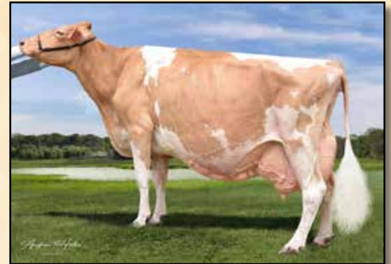
KNAPPS HILLPOINT PIE TEACUP EX-94 2ND DAM OF LOTS 5A & 5B HM All-American Junior 2-Year-Old 2011