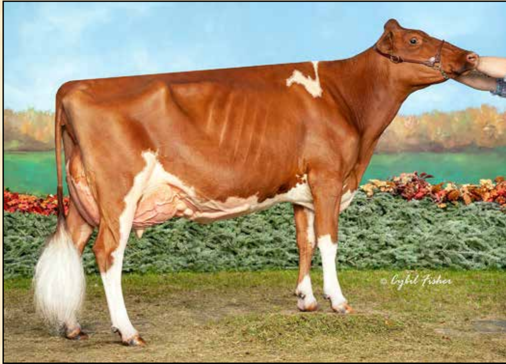
PARE-VIEW PANDORAS BOX EX-91 DAM OF LOT 15