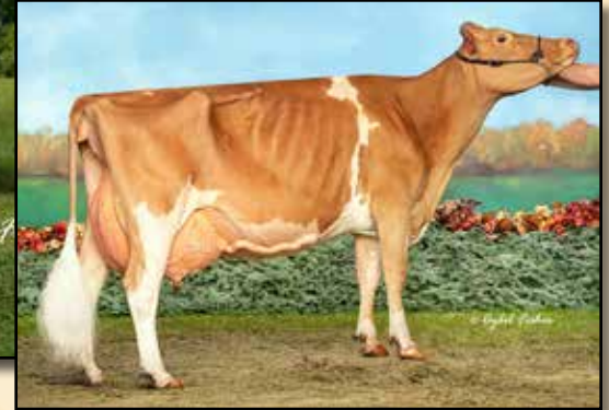
VALLEY GEM LUCK DEIDRA EX-92 2ND DAM OF LOT 3