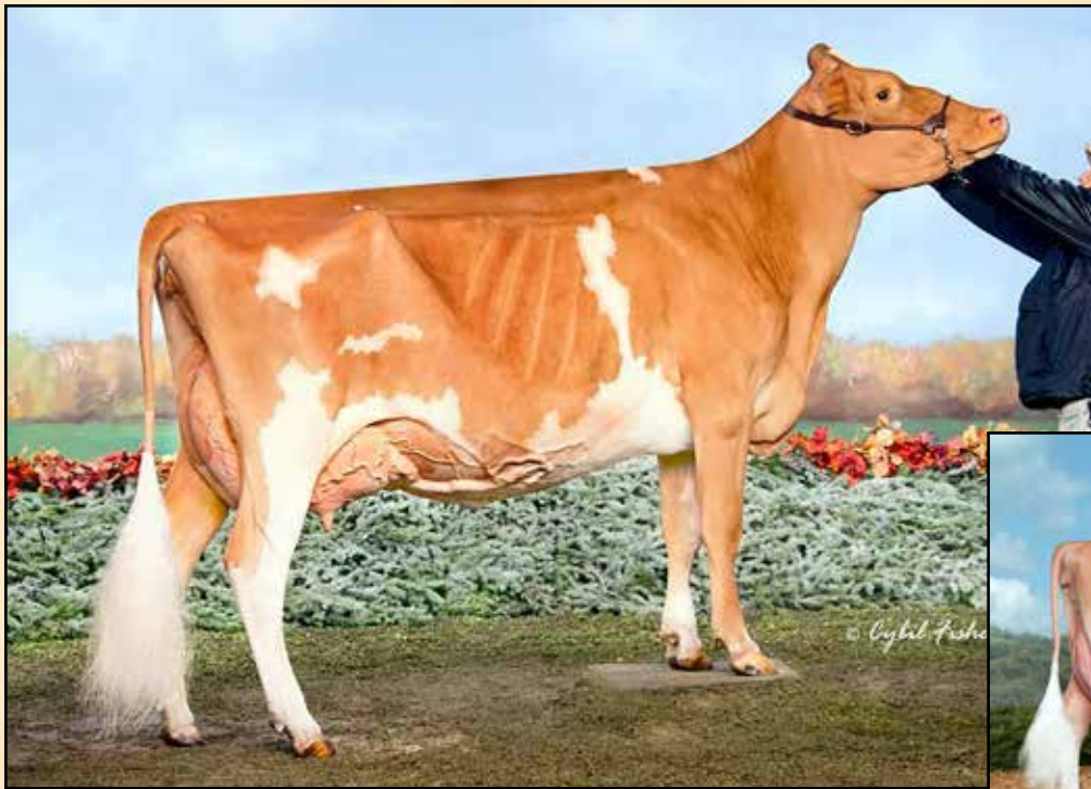
SPRINGHILL KOJACK UNIQUE-ETV EX-94 DAM OF LOT 14