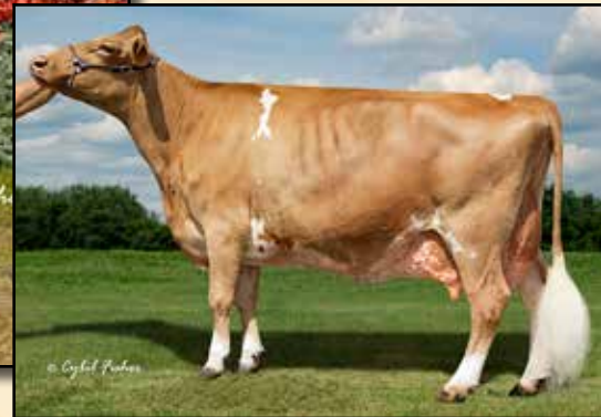
KNAPPS ACE TAMERA EX-93 2ND DAM OF LOT 6

Reserve All-American Junior 3-Year-Old 2021