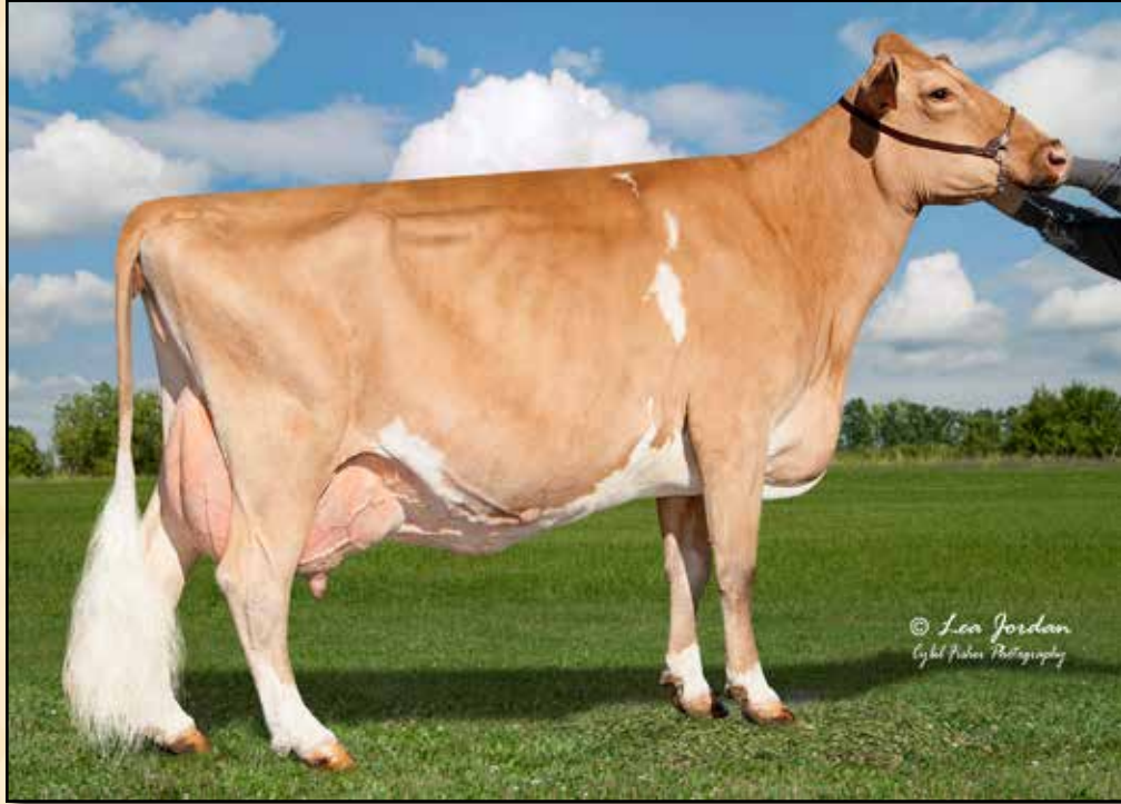
MAR RAL MAESTRO MILLY EX-94 3E DAM OF LOT 1 Reserve All-American 5-Year-Old 2018