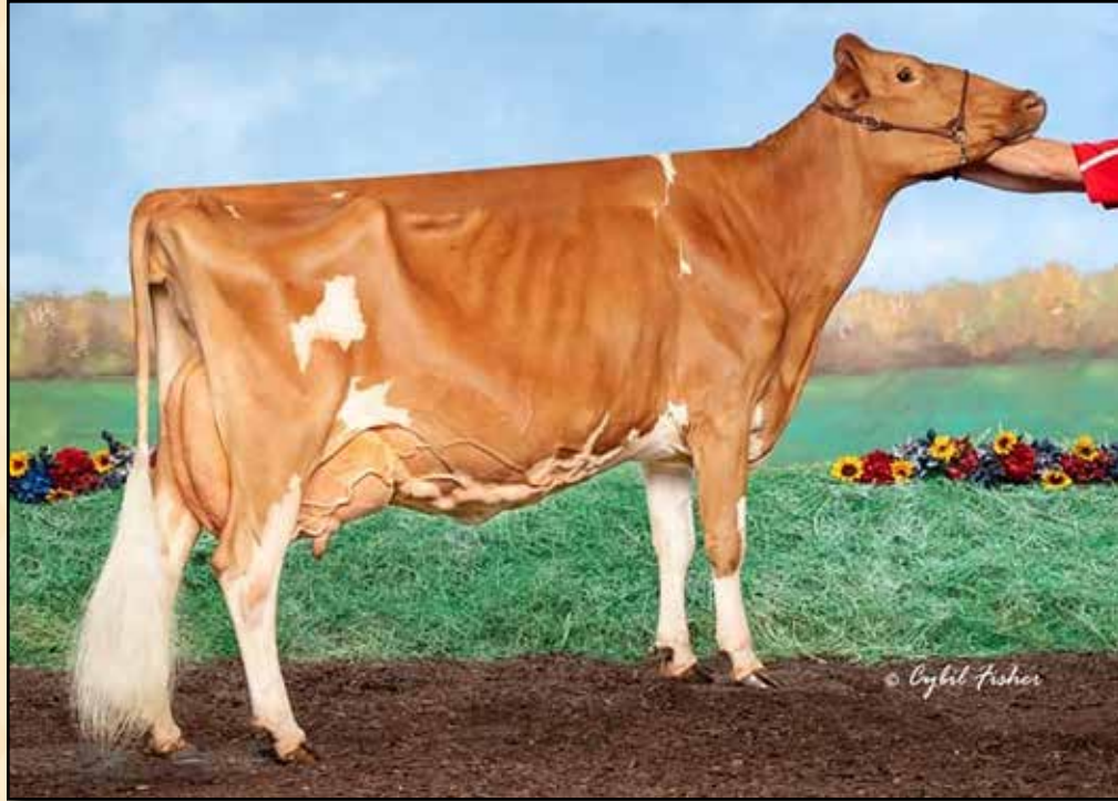
OAKLAND LATIMERS PRESTIDGE EX-94 DAM OF LOTS 21A & 21B HM Junior All-American 5-Year-Old 2021