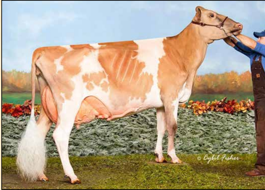
SPRINGHILL BLUE JUDITH EX-93 DAM OF LOT 23

Nominated All-American Junior 3-Year-Old 2016