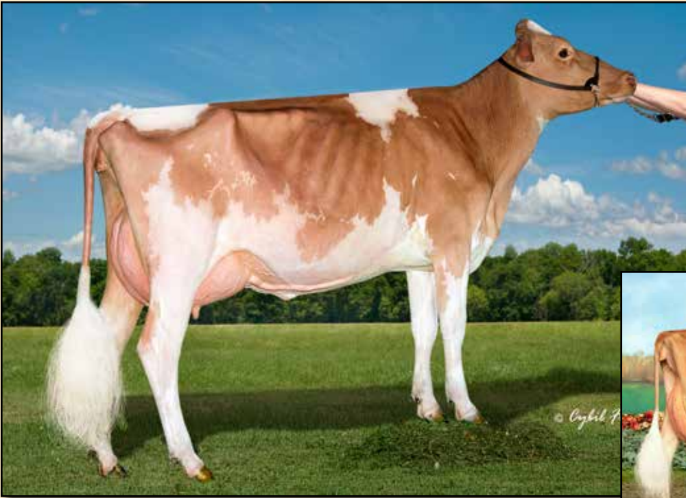
VALLEY GEM HIT IT DEVORA EX-90 DAM OF LOT 3