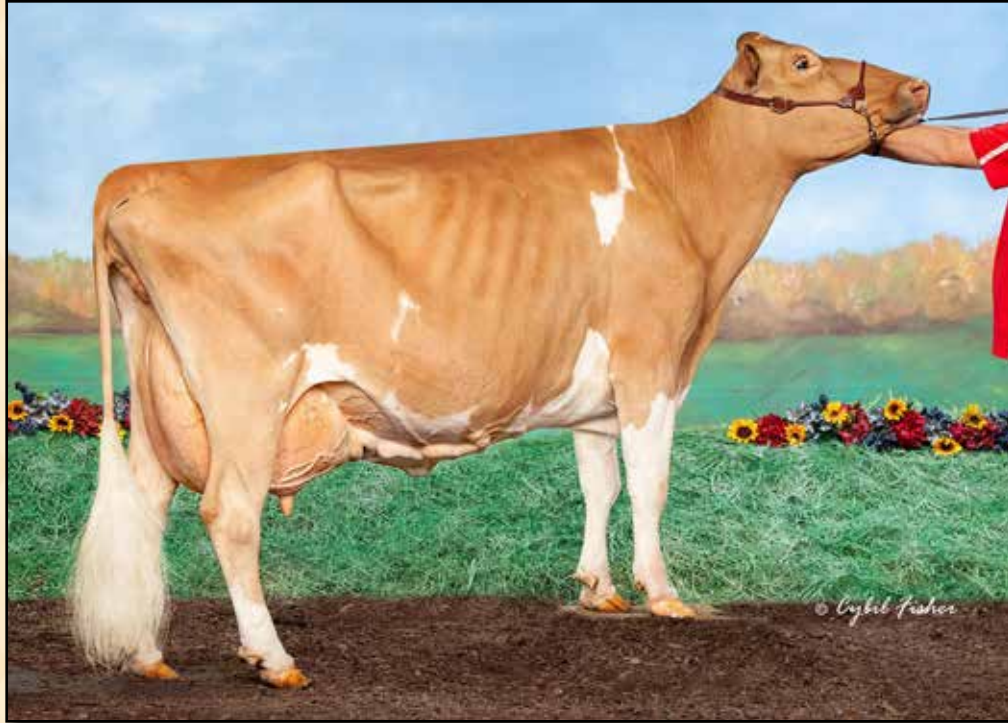
ROCKY HILL PRADA HOLIDAY EX-94 DAM OF LOT 20

HM All-American Lifetime Production Cow 2021