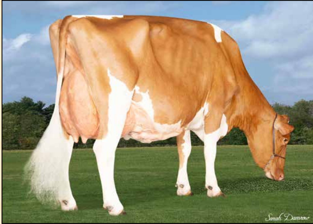
HI GUERN VIEW DIVA DESIGNER EX-94 DAM OF LOT 2

Unanimous All-American Junior 3-Year-Old 2018