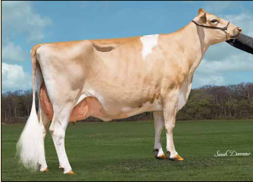
STIL DREAMN JUDGMENT TRIXIE EX-94 DAM OF LOT 17