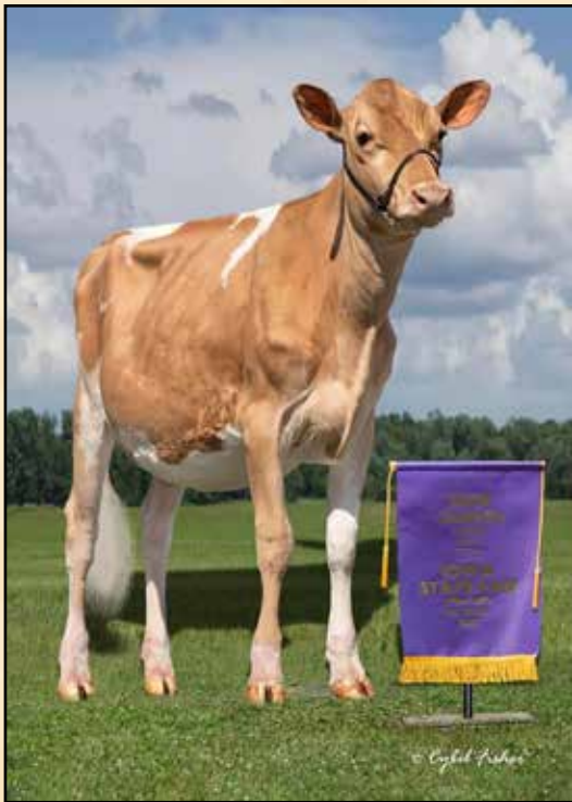
KNAPPS TEMPEST IN A TEAPOT-ETV 2ND DAM OF LOTS 5A & 5B