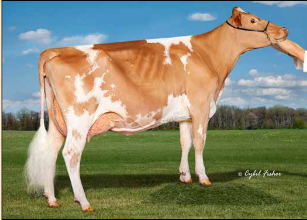
DIX-LEE GLADHEART FIONA-ET DAM OF LOT 7

Reserve Grand Champion, NY Spring Show 2022