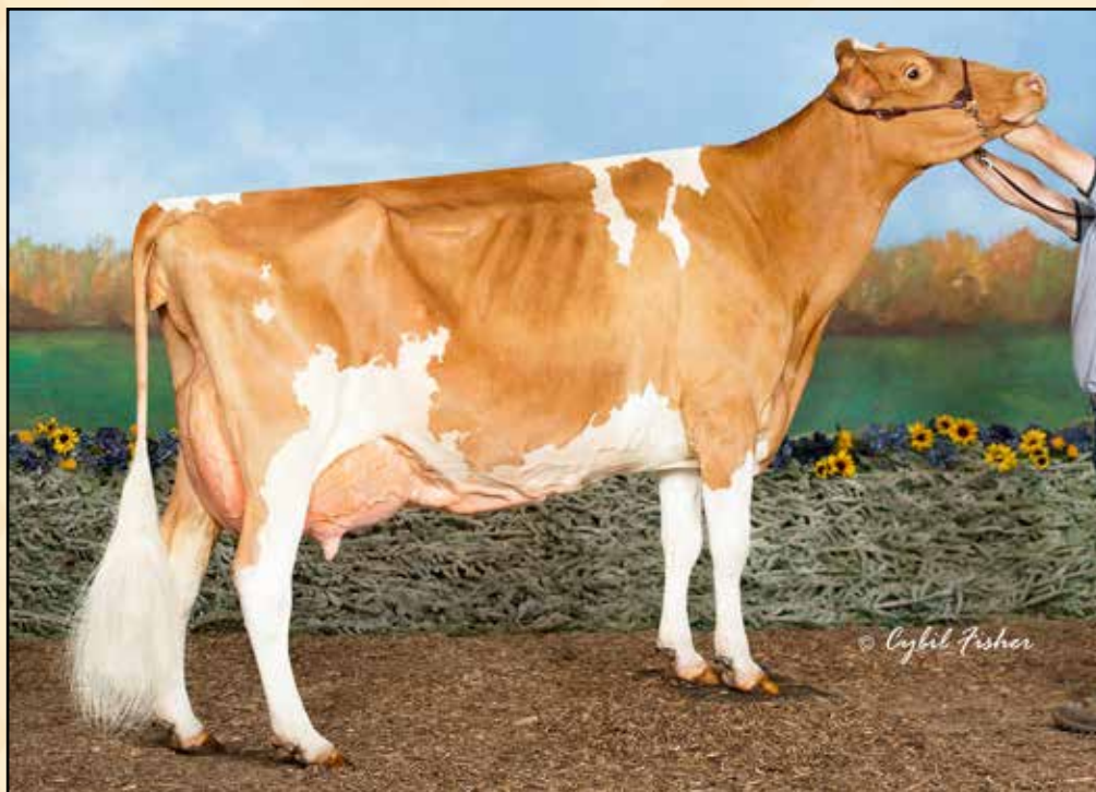
SNIDERS GARRETT ASHANTI-ET EX-94 DAM OF LOT 16