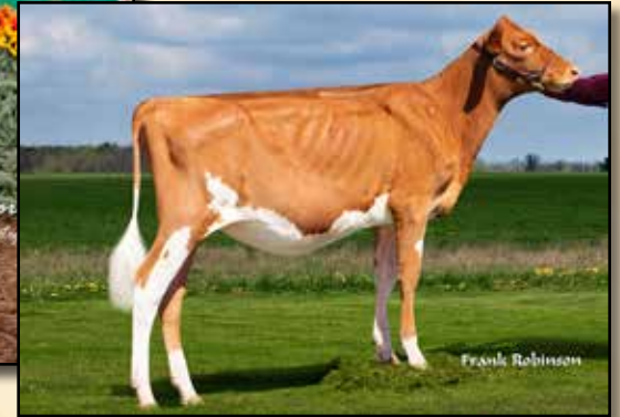
EPIC VIEW DRONE AGNES SELLS AS LOT 13