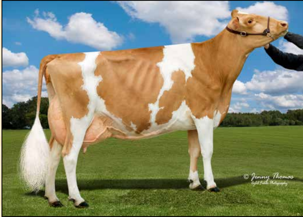
MAPLEHURST YB MERCY EX-92 DAM OF LOT 19