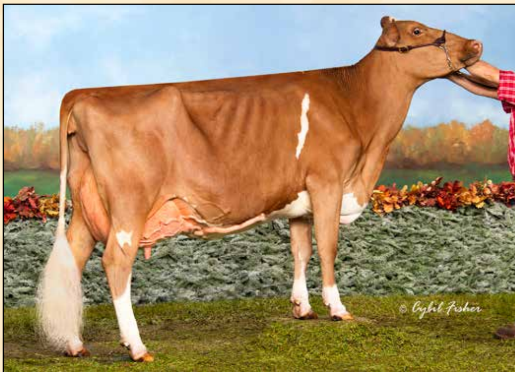
LANG HAVEN PRADA NUGGET-ET EX-90 2ND DAM OF LOT 18