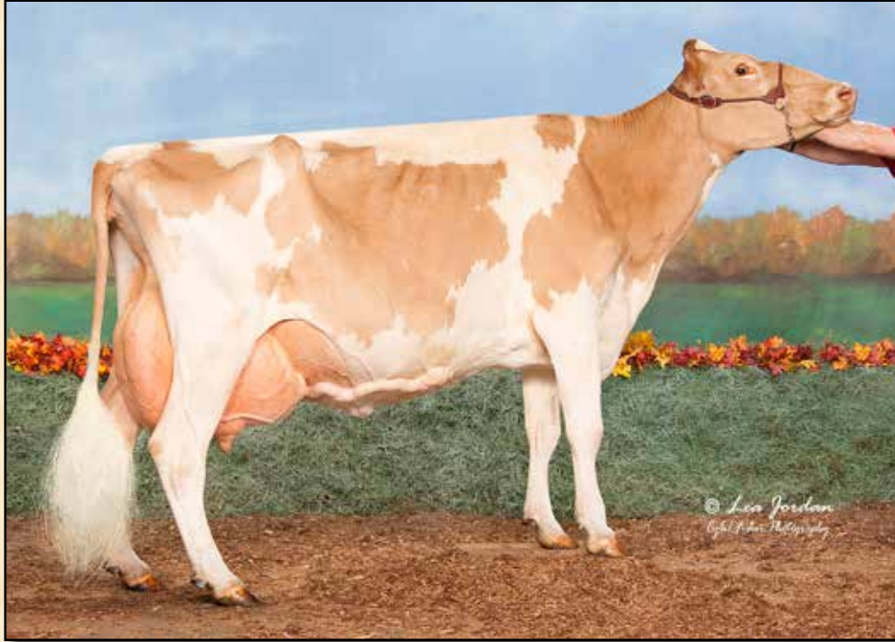
VILLA CREST PEYTON ALBA EX-92 DAM OF LOT 24

Nominated All-American Lifetime Production Cow 2021