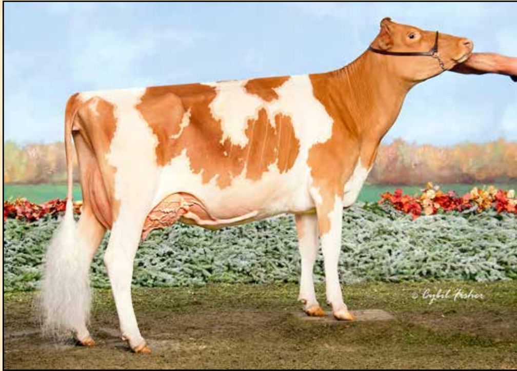
WARWICK MANOR MISS AMERICA-ET EX-92 DAM OF LOT 10