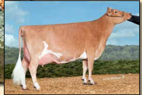
CAMPBELLS RODNEYS UNIFY EX-94 2ND DAM OF LOT 14