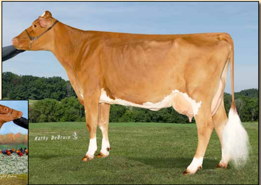
MISTY MEADOWS GG HP SCARLET-ETV EX-91 DAM OF LOT 8