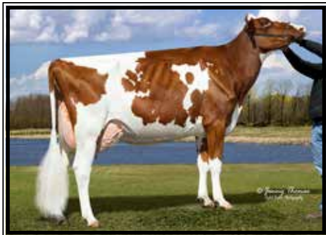
Miss California-RED EX-93,2E (2nd Dam of R&W Awesome)

Klinedell Farms 610 South Ramona Rd Myerstown, PA 17067 717-644-1306