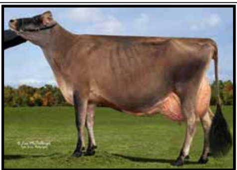
Klinedell H Gun Paline EX-95% (Sister to 2nd Dam of the 3/10 Venetian)

2nd Dam: Hillacres Vixen Valhala EX-91% 6-11 305 18720 4.6 862 3.5 663 3rd Dam: (Pictured at left) Hillacres Vavooms Vixen EX-95% *Res. Grand Champion MD State Fair 2005 *Res Int. Champion NY Spring Show 2005 4th Dam: Hillacres Villas Vavoom VG-88%