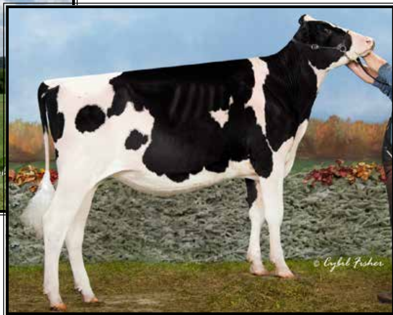
Solid-Gold De Gsun Disco-ET EX-91,92-MS *Un. All-American & All-Canadian Summer Yearling 2014 (Mat. sister to Lot 6)

LOT 6 Holstein Camp-Gold Dback Daisy-ET 3141609361 99%RHA-I Born 12/14/19