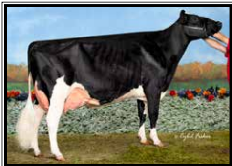
Luck-E Goldwyn Aaliyah-ET EX-94 (2nd Dam of 2 Altitude calves)

2nd Dam: (Pictured at left) Miss California-RED*TV EX-93,2E *1st Jr 2yr-old and HM Int. Champion Royal Winter Fair 2012 *Grand Champ R&W 2015 PA Farm Show! 3rd Dam: KHW Regiment Apple 2-RED-ETN*CV EX-93,2E EEEEE DOM 3-06 282 23050 4.3 1000 3.6 824 *Grand Champion NAILE 2013 Clone of the amazing Apple: KHW Regiment Apple-RED-ET EX-96,3E EEEEE DOM *Multiple time All-American 4th thru 9th Dams All EX