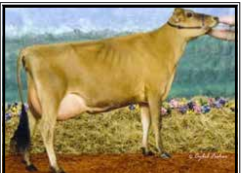
Hillacres Vavooms Vixen EX-95% (2nd Dam of Chrome calf)

2nd Dam of both calves: Luck-E Goldwyn Aaliyah-ET EX-94 EEEEE (Pictured at left) *2016 HM All-PA Aged Cow *2016 Nom. Jr All-Am Aged Cow 3rd Dam: Luck-E Outside Anxious EX-94 4th Dam: EX-90 5th Dam: EX-93 6th Dam: EX-94 7th Dam: VG-86 8th Dam: EX-93