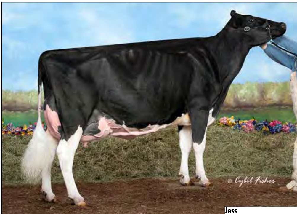
SUNROSE JESS EX-94 EEEEE 2E DAM OF LOT 8