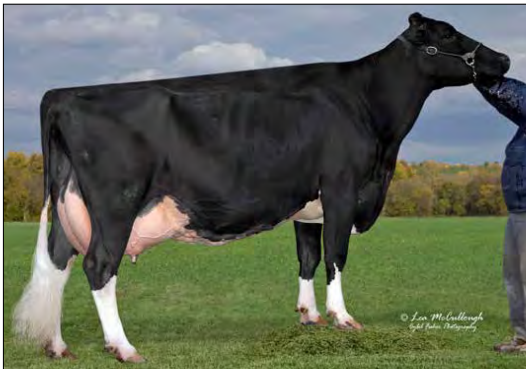
LUCK-E TALENT TAMARA-ET EX-94 2E DAM OF LOT 1