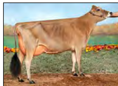
OBJ CENTURION SUGAR DAM OF LOT 66

AJCA 12/19 GPTAT 75%R +1 GJPI 75%R +40.7