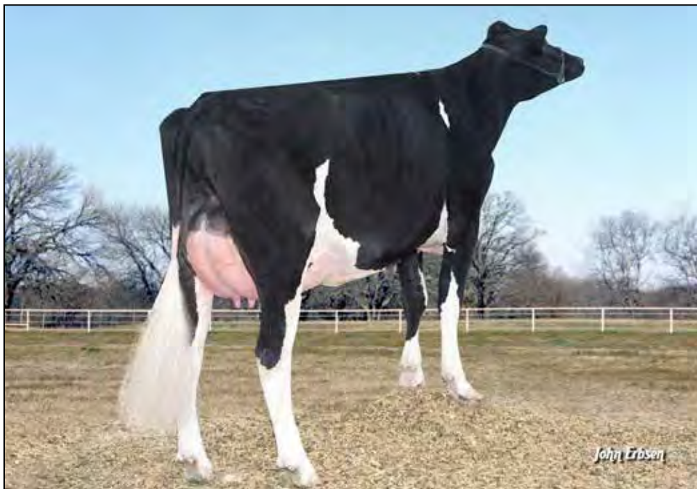
REGANCREST MAC BRITELITE-ET EX-91 4TH DAM OF LOT 55