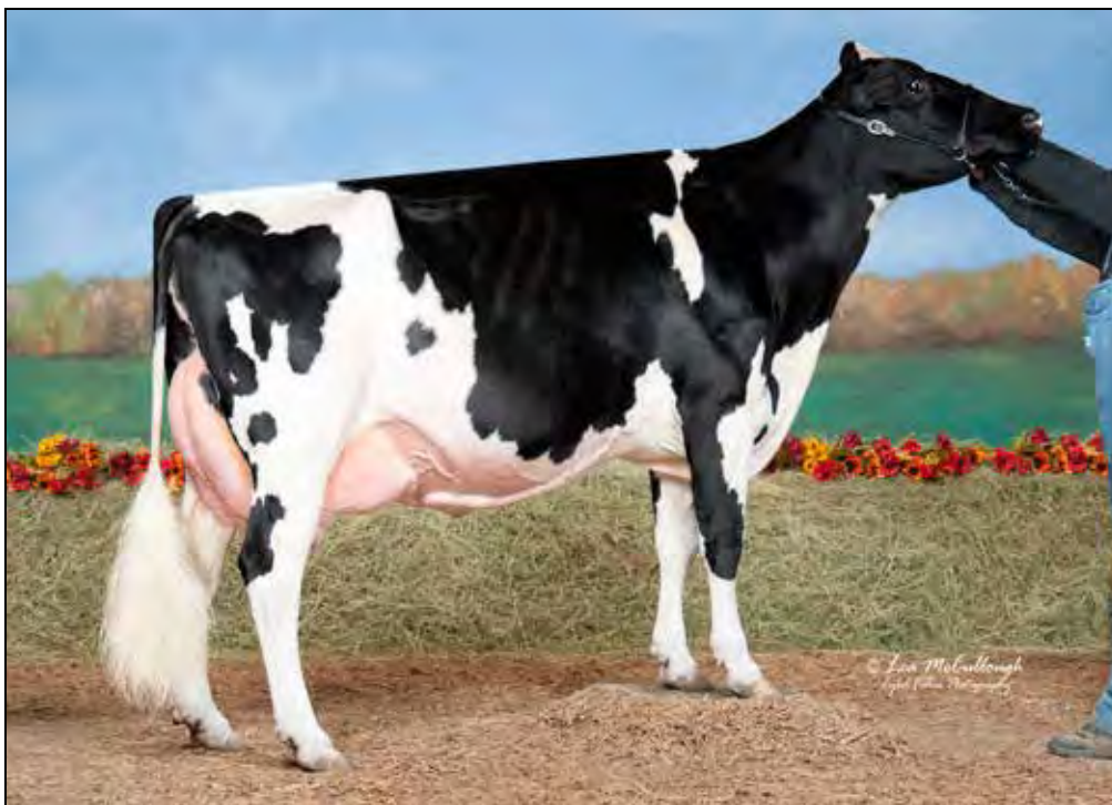
EASTSIDE GOLDWYN MILLIE EX-94 EEEEE 2E FULL SISTER TO DAM OF LOT 23 & 2ND DAM OF LOT 24