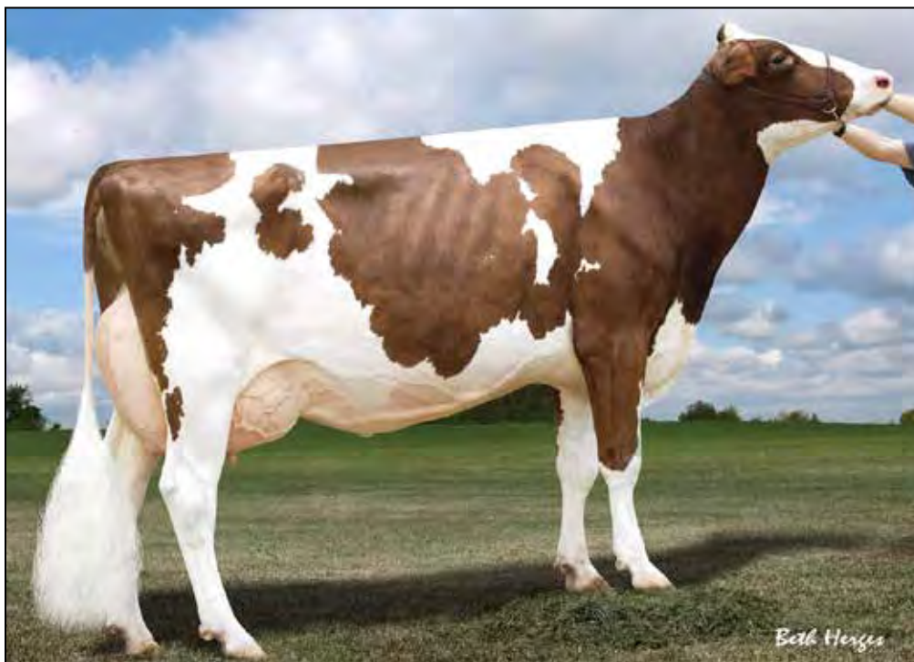
WELK-ERA ADVENT ASIA-RED EX-91 EX-MS 2E 2ND DAM OF LOT 53