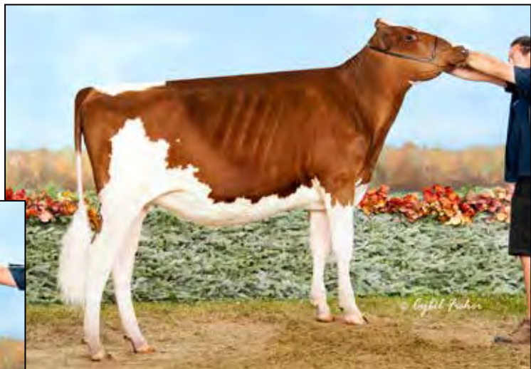
GREENLEA AD AVERY-RED-ET MATERNAL SISTER TO DAM OF LOT 4