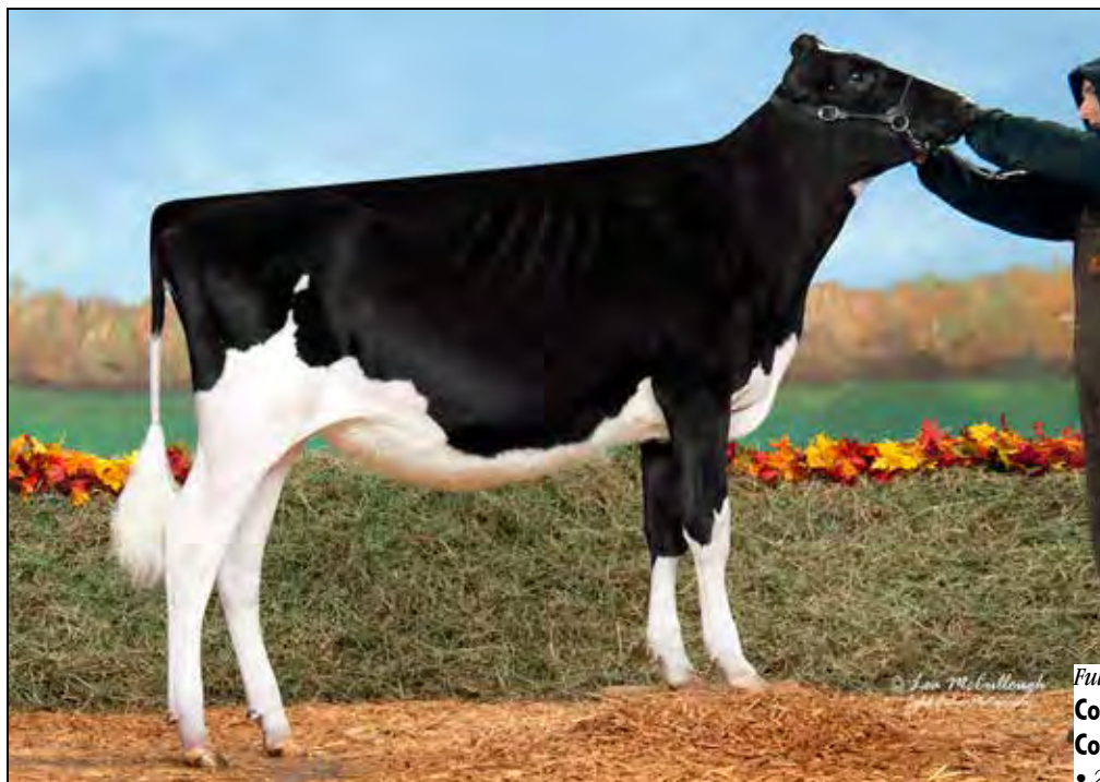
MISS JEDABAR ARMANI GEM-ET FULL SISTER TO DAM OF LOT 36