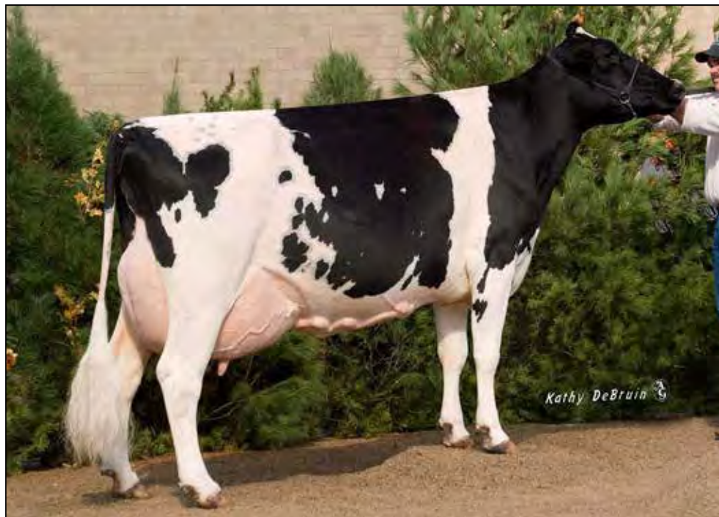
SYMPHONY WILMA STORM EX-94 EEEVE 2E 4TH DAM OF LOT 54