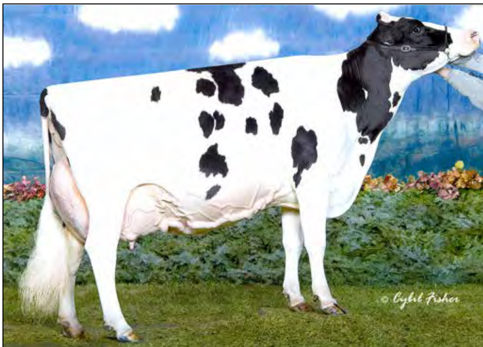
MACTALLA MARKER MOLLY EX-95 EEEEE 3E 2ND DAM OF LOT 23 & 3RD DAM OF LOT 24