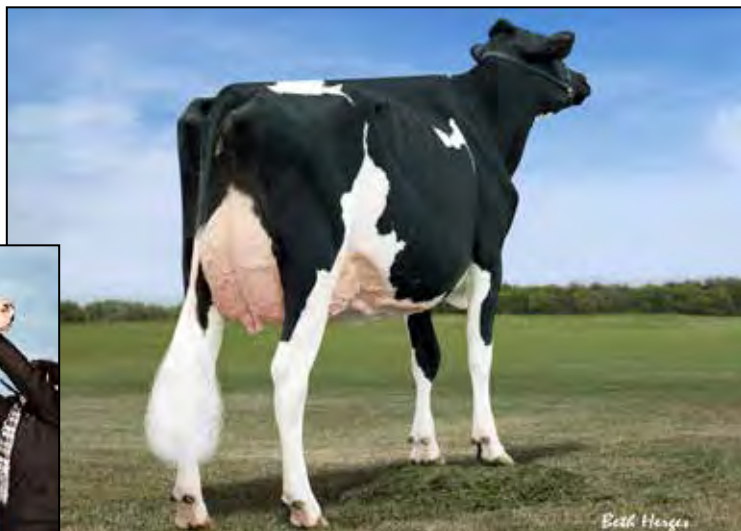
BVK ATWOOD ABRIANNA-ET EX-92 EX-MS FULL SISTER OF 2ND DAM OF LOT 15