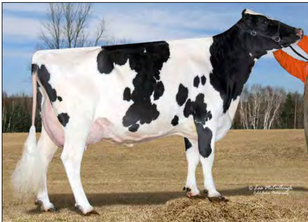
PENN-GATE RMARKER FERGGY-ET EX-93 EEEEE 3E 2ND DAM OF LOT 32