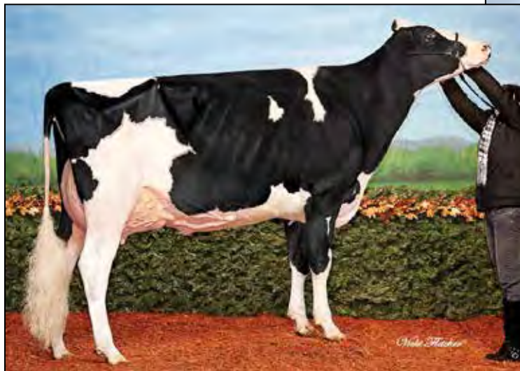
BVK ATWOOD ARIANNA-ET EX-94 EX-MS 2ND DAM OF LOT 15