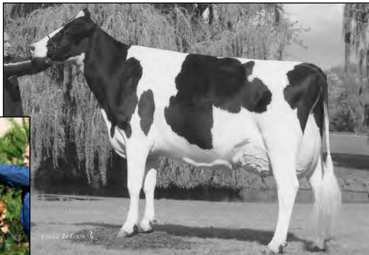
TOPP-VIEW RUBENS EXTASY EX-94 EEEEE 2E 2ND DAM OF LOT 10