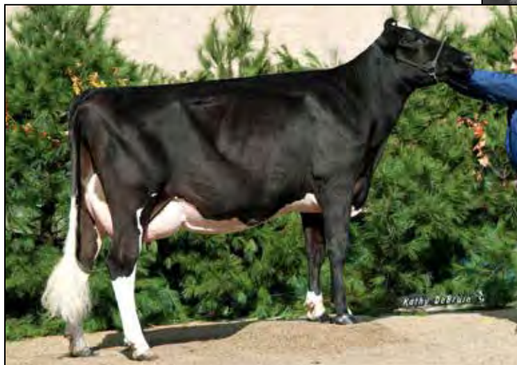
TOPP-VIEW ELAND ELECTRA EX-90 2E MATERNAL SISTER TO DAM OF LOT 10