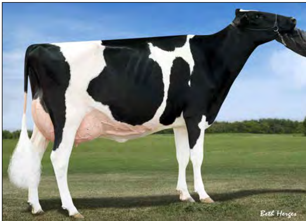
COOLEA FARMS SANCHEZ LIZA-ET EX-93 EEEEE 2E 2ND DAM OF LOT 12