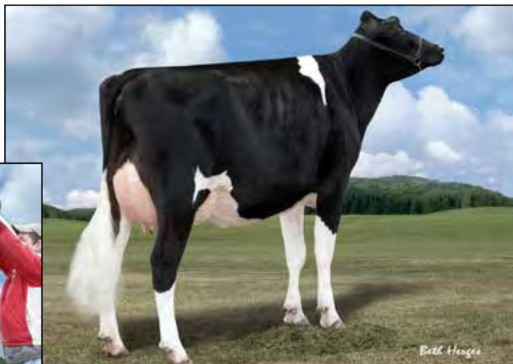
REGANCREST MAC BIKASA-ET EX-90-CAN GMD 2ND DAM OF LOT 16