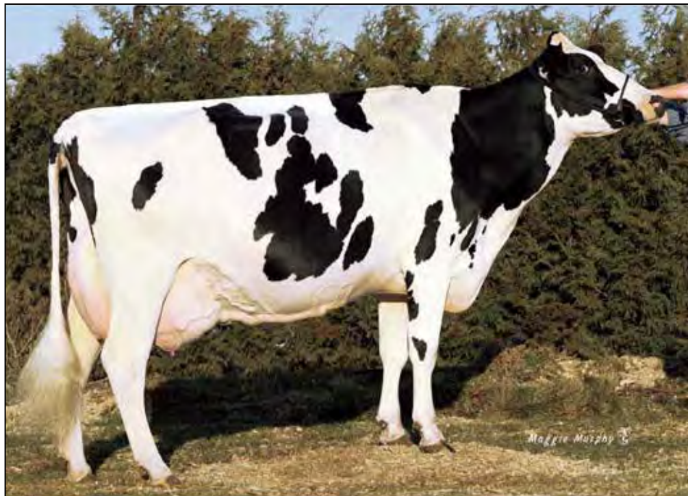
VT-POND-VIEW CHARISMA-ET EX-95 EEEEE 3E DOM 4TH DAM OF LOT 13