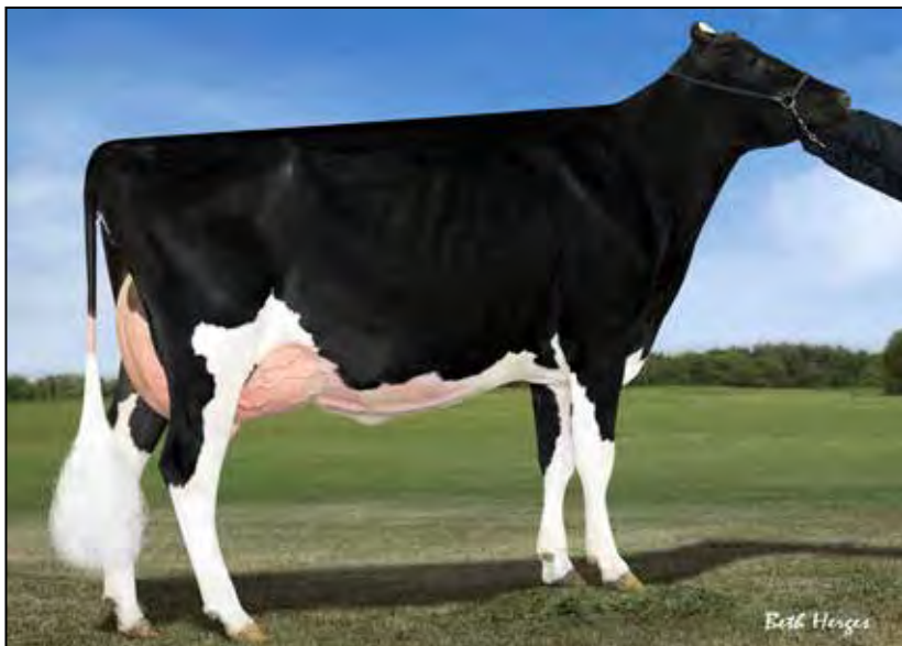
ERNEST-ANTHONY JAZ TEMPO-ET EX-94 EEEEE DAM OF LOT 29