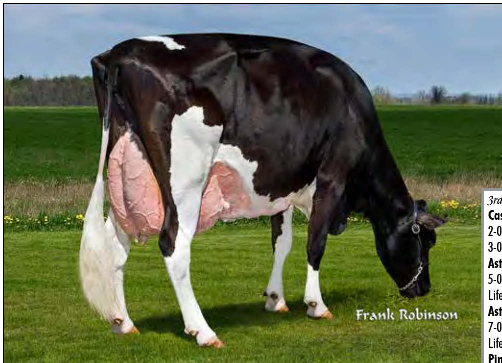
OAKFIELD PRONTO RITZI EX-93 EEEEE 3E MATERNAL SISTER TO 2ND DAM OF LOT 9