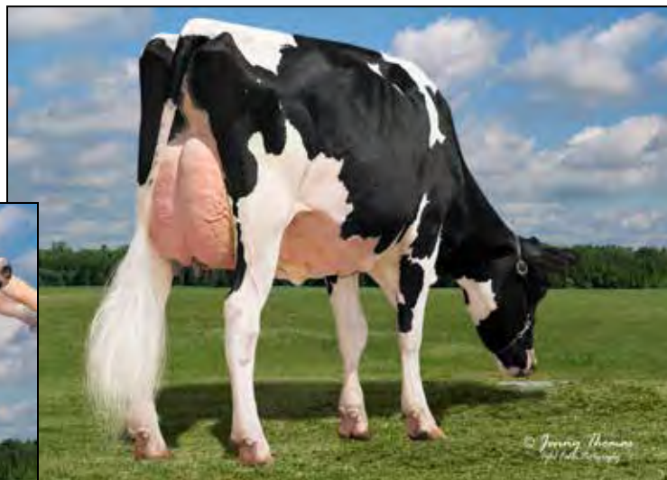
RUMMAGE ATWOOD SHELBY EX-92 EX-MS DAM OF LOT 3