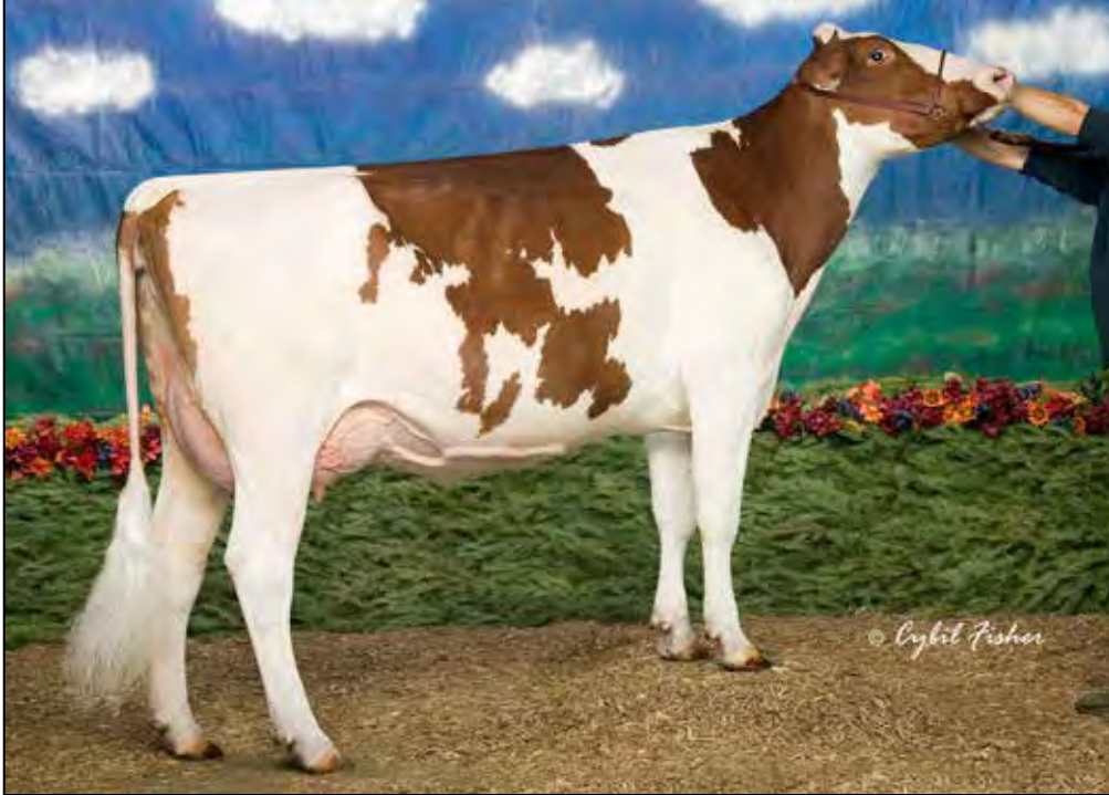
BOHONIKS KITE ROSES-RED EX-90 EX-MS 2ND DAM OF LOT 41