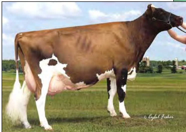
ELLBANK CHERRY COKE-RED-ET EX-92 EX-MS 2ND DAM OF LOTS 27 & 28