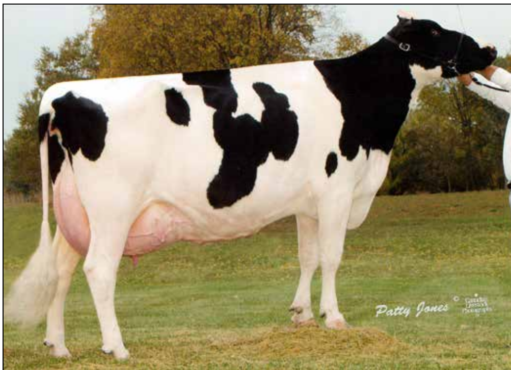
TRI-DAY ASHLYN-ET EX-96 2E GMD DOM 3RD DAM OF LOT 22