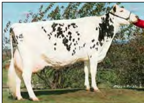
VT-POND-VIEW MARK JOSIE EX-94 EEEEE 3E 3RD DAM OF LOT 19