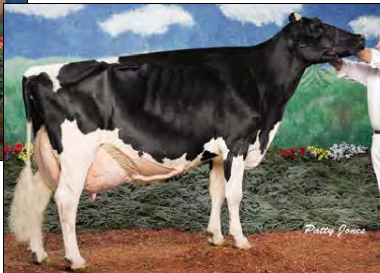
BELROUX STORM CRISTAL EX-96 2E-CAN 1* *RC 4TH DAM OF LOT 16