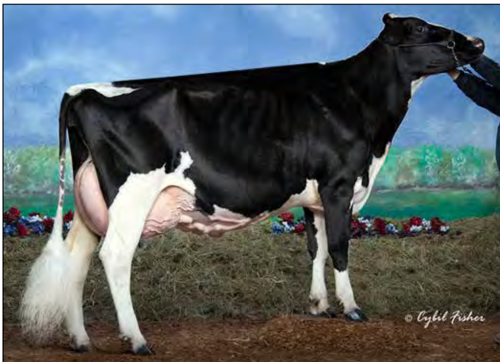
MA-TOM-BA GIBSON ECLIPSE-ET EX-92 EX-MS 4TH DAM OF LOT 33