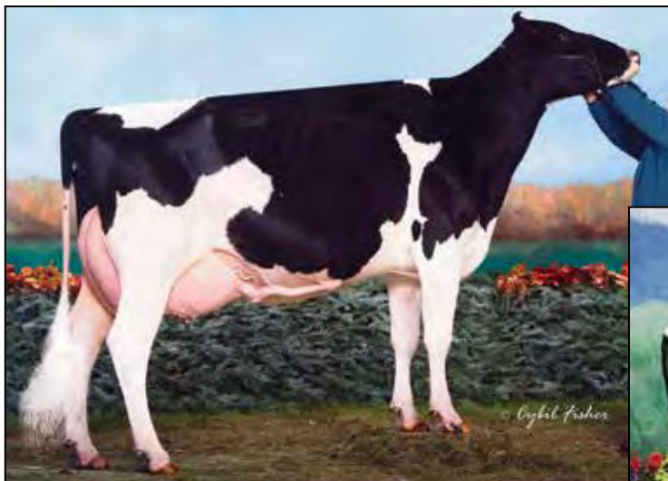
LYLEHAVEN DURHAM CABERNET EX-95 EEEEE DOM 2ND DAM OF LOT 16