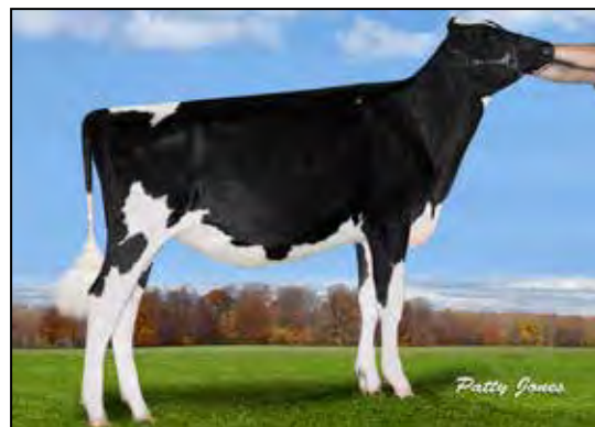
OAKFIELD BYWAY TAXI-ET MATERNAL SISTER TO DAM OF LOT 29