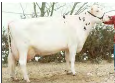
VT-POND-VIEW K B JESSICA EX-92 3E GMD DOM 4TH DAM OF LOT 19