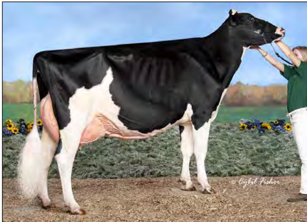
SAVAGE-LEIGH ATWD LIC-ET EX-92 MATERNAL SISTER TO 3RD DAM OF LOT 11