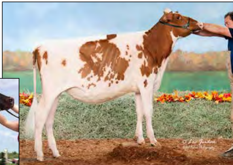
BUFFALO-CREEK D CAMILLE-RED SELLS AS LOT 28