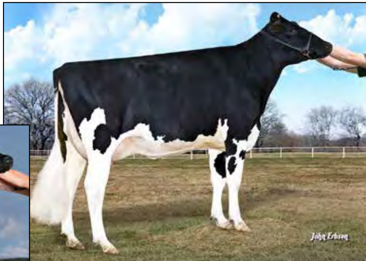
MS APPLE BRANDY-ET EX-90 EX-MS 2ND DAM OF LOTS 2 & 2A