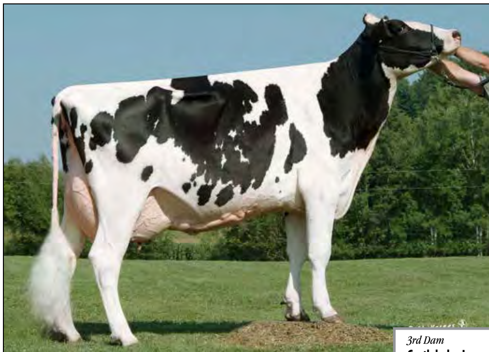
ASTRAHOE R LORENZO RACHEL EX-90 EX-MS 4TH DAM OF LOT 44