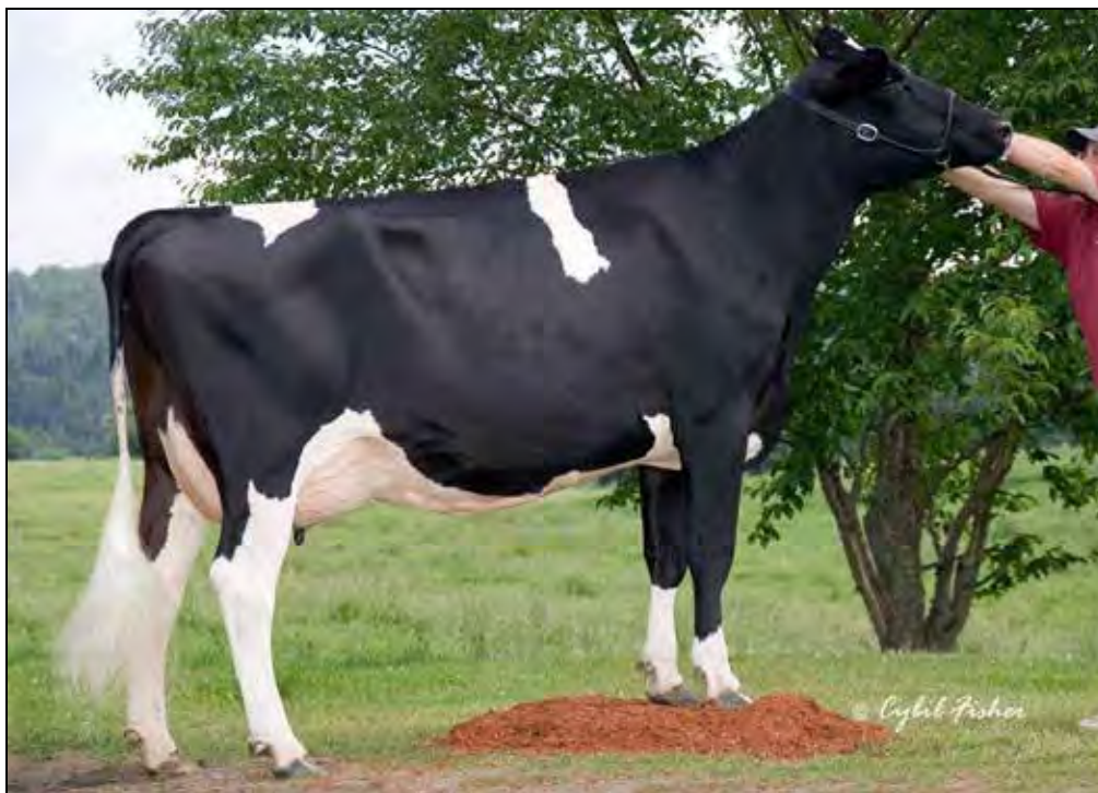
RUMMAGE SKB STRAWBERRY-ET EX-94 EEEEE 4TH DAM OF LOT 30