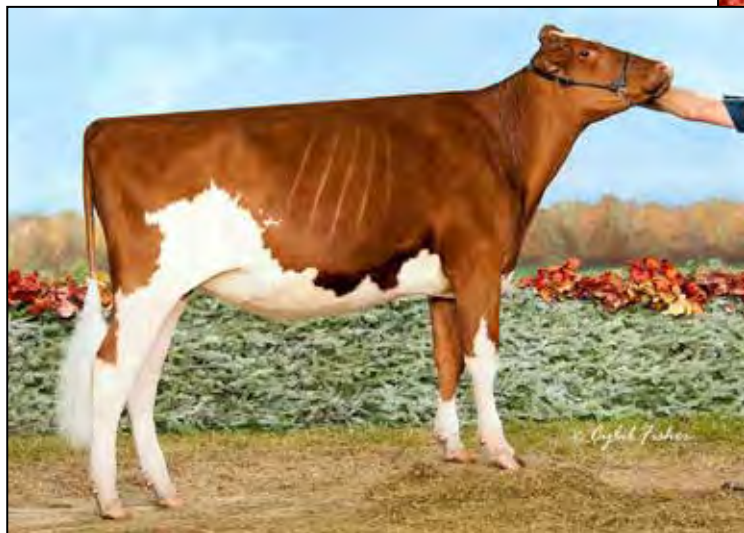
GREENLEA AD ANNIE-RED-ET MATERNAL SISTER TO DAM OF LOT 4