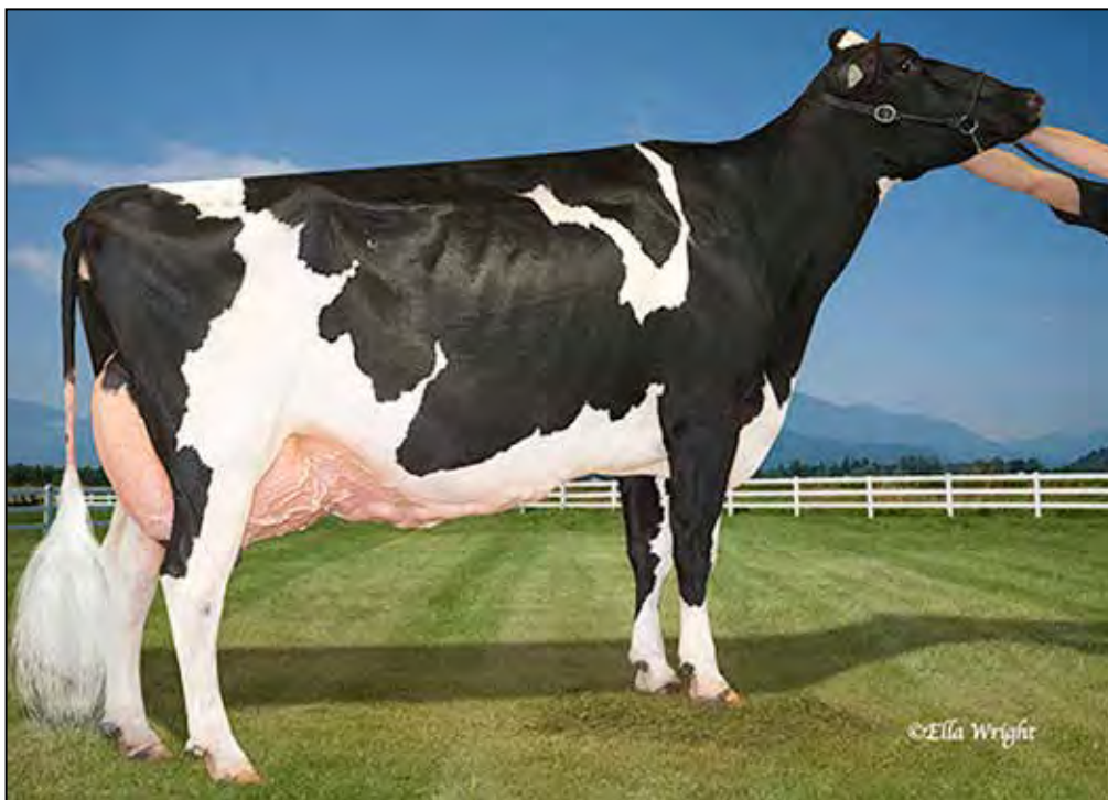
LINDENRIGHT GOLDWYN ADORE EX-94 4E-CAN 94-MS DAM OF LOTS 17 & 18