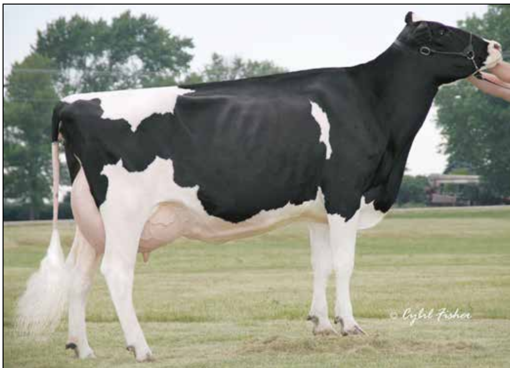
SCIENTIFIC DEBUTANTE RAE-ET EX-92 5TH DAM OF LOT 33