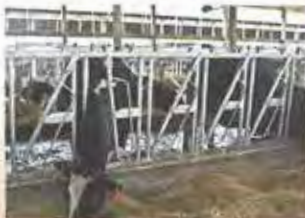
J&D Head Locks