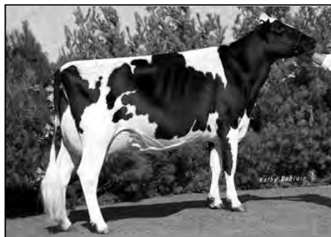
SYMPHONY INTEGRITY JODY EX-92 EEEVE 3RD DAM OF LOT 35

DILLAN TODD CHAPEL HILL, TN 37034 931-364-2643