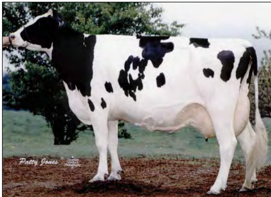
VT-POND-VIEW ASTR JACKIE-ET EX-92 EEEEE 2E 2ND DAM OF LOT 19