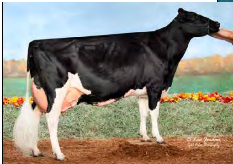
POP-A-TOP GUTHRIE TONIE EX-93 EEEEE 2E DAM OF LOT 14