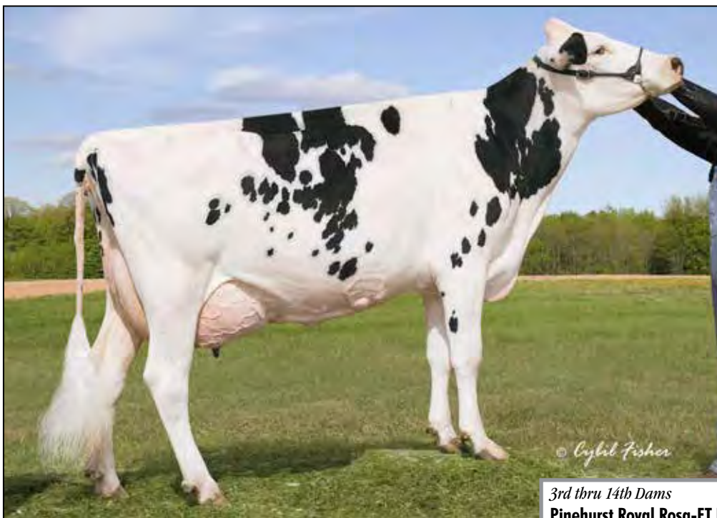
ASTRAHOE R GIBSON RENEE-ET EX-93 EEEEE 3E 2ND DAM OF LOT 38