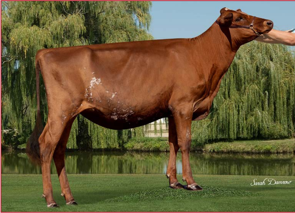
BLACKSTONE R VENGEANCE-ET NOM ALL-AMERICAN WINTER CALF, 2021 SELLING AS LOT 13