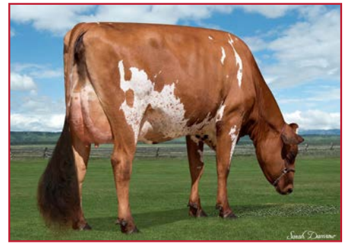
BLACKSTONE CHINA'S REVENGE, VG-87 DAM OF LOT 13