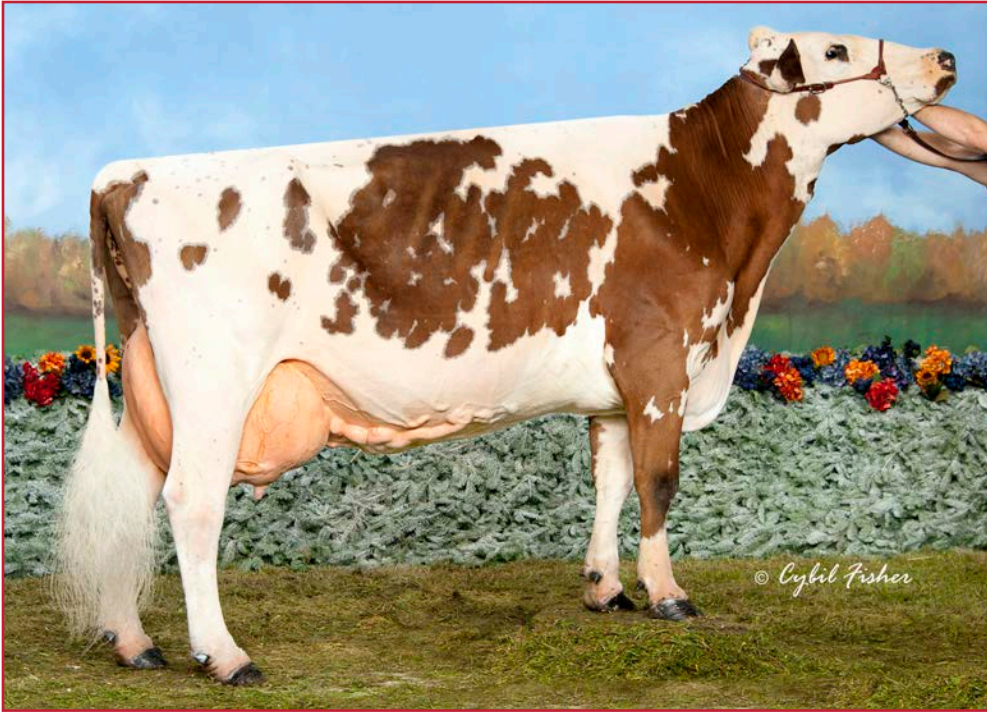
GRAND-VIEW SUMTOTAL DIVOT, EX-94 4E 5-10 365D 29,390M 3.8% 1113F 3.2% 942P HM ALL-AMERICAN 100,000 LB COW, 2015 GREAT-GRANDDAM OF LOT 22