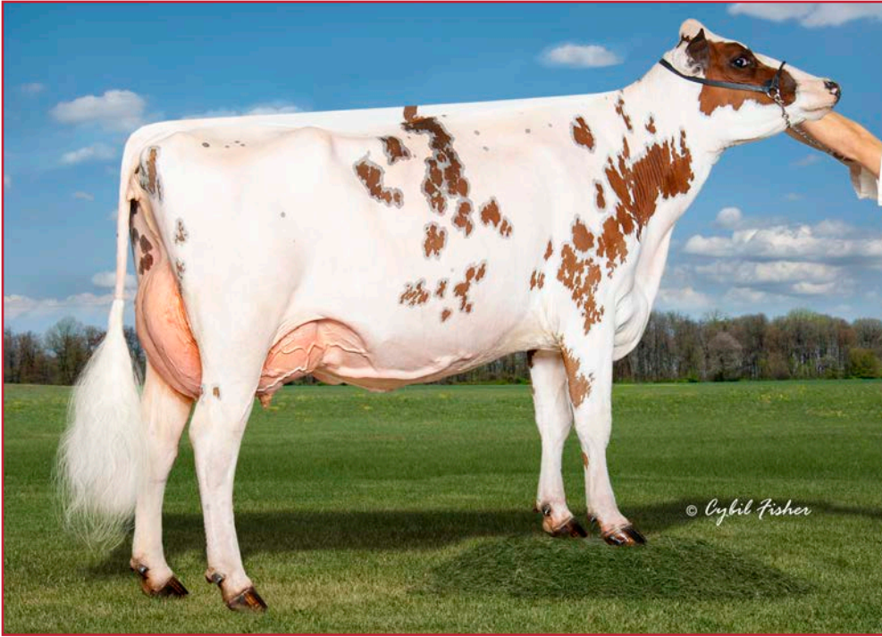
KLER-VU CHRISTMAS CANDY-ET, EX-90 3-05 PROJ 22,171M 3.4% 753F 3.1% 683P DAM OF LOT 14