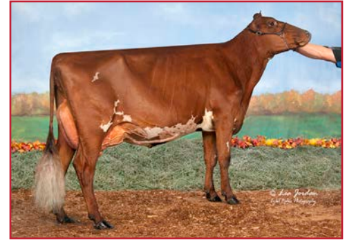
NOR-BERT LOCHIN VESTA, EX-91 3-07 305D 33,800M 7.8% 2653F 4.1% 1391P RES ALL-AMERICAN & JR ALL-AMERICAN SR 2-YEAR-OLD, 2020 HM JR ALL-AMERICAN SR 3-YEAR-OLD, 2021 FAMILY MEMBER OF LOT 10