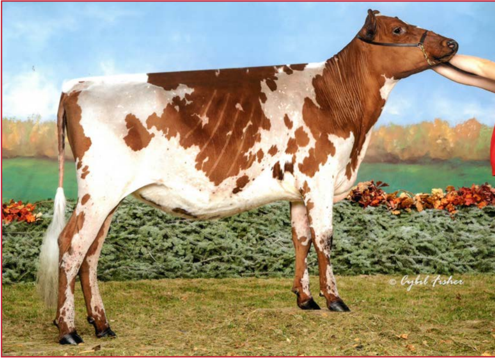
KOZY KOUNTRY REAGAN PEEKABOO RES ALL-AMERICAN WINTER YEARLING, 2021 FULL SISTER OF LOT 2