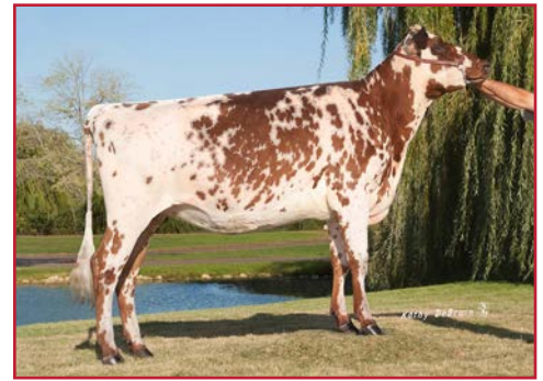
TOPPGLEN POKER SUZIE RES ALL-AMERICAN WINTER YEARLING, 2013 FULL SISTER TO DAM OF LOT 3