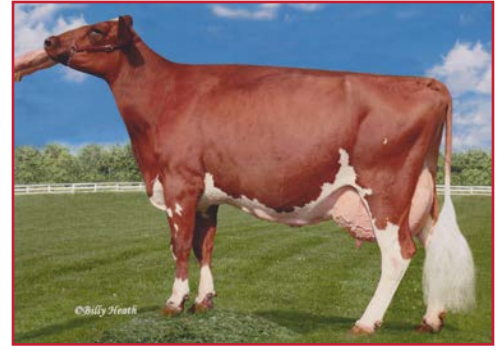
MAPLE-DELL ZORRO DAFOURTH, EX-95 2E 6-01 365D 30,950M 4.5% 1387F 3.0% 939P 2X RES ALL-AMERICAN GRANDDAM OF LOT 11