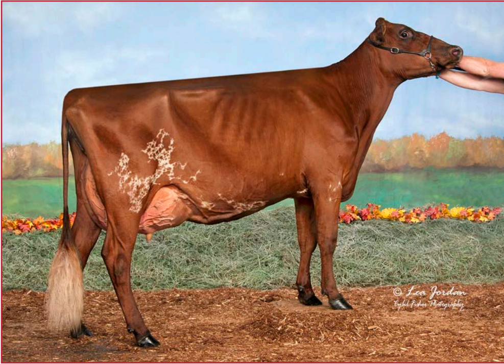
OLD-N-LAZY MARCH MADNESS, EX-91 ALL-AMERICAN JR 3-YEAR-OLD, 2020 2-03 347D 22,860M 4.0% 911F 3.2% 722P MATERNAL SISTER OF LOT 5