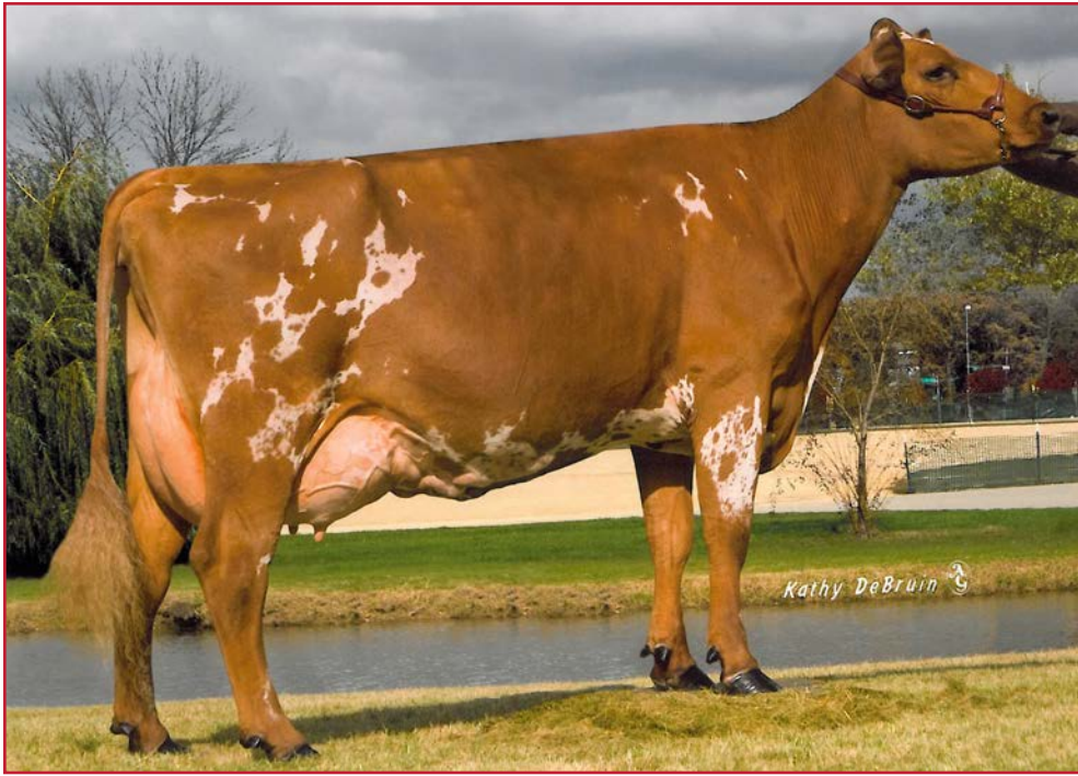
SHIREDALE PHIL'S SUSAN, EX-93 3E UNAN ALL-AMERICAN 4-YEAR-OLD, 2010 THIRD DAM OF LOT 3