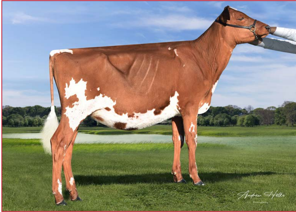
BRICKER-FARMS GENTLE CHAOS NOM JR ALL-AMERICAN SPRING CALF, 2021 SELLING AS LOT 12