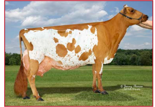
YELLOW BRIAR BURDETTE PANAMA, EX-94 3E 2X RES ALL-AMERICAN 7-02 360D 35,160M 3.8% 1326F 3.2% 1136P GRANDDAM OF LOT 9