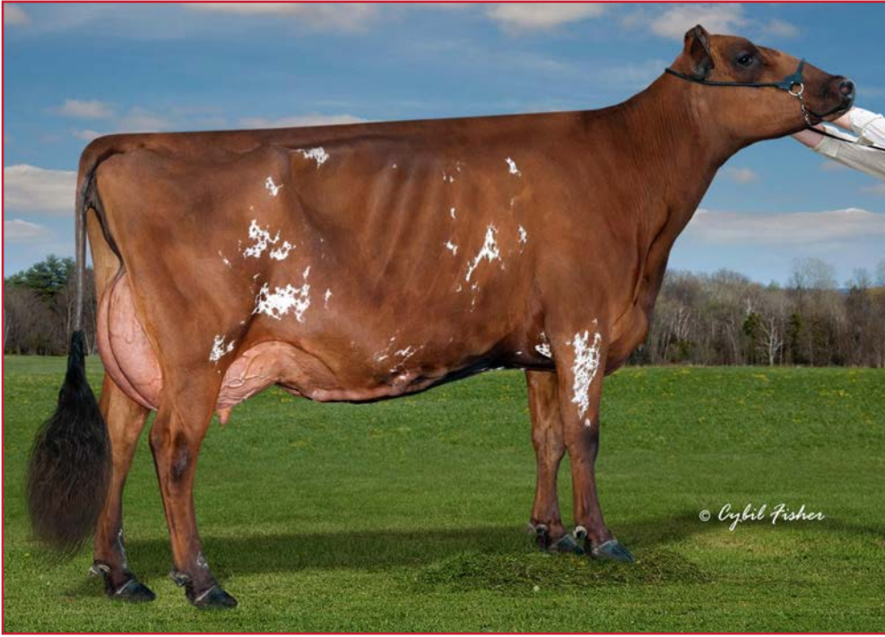
OLD-N-LAZY GENTLE WIPEOUT-ET, EX-93 3-04 321D 26,280M 3.8% 995F 3.2% 830P UNAN ALL-AMERICAN JR 3-YEAR-OLD, 2019 HM ALL-AMERICAN 5-YEAR-OLD, 2021 MATERNAL SISTER OF LOT 4