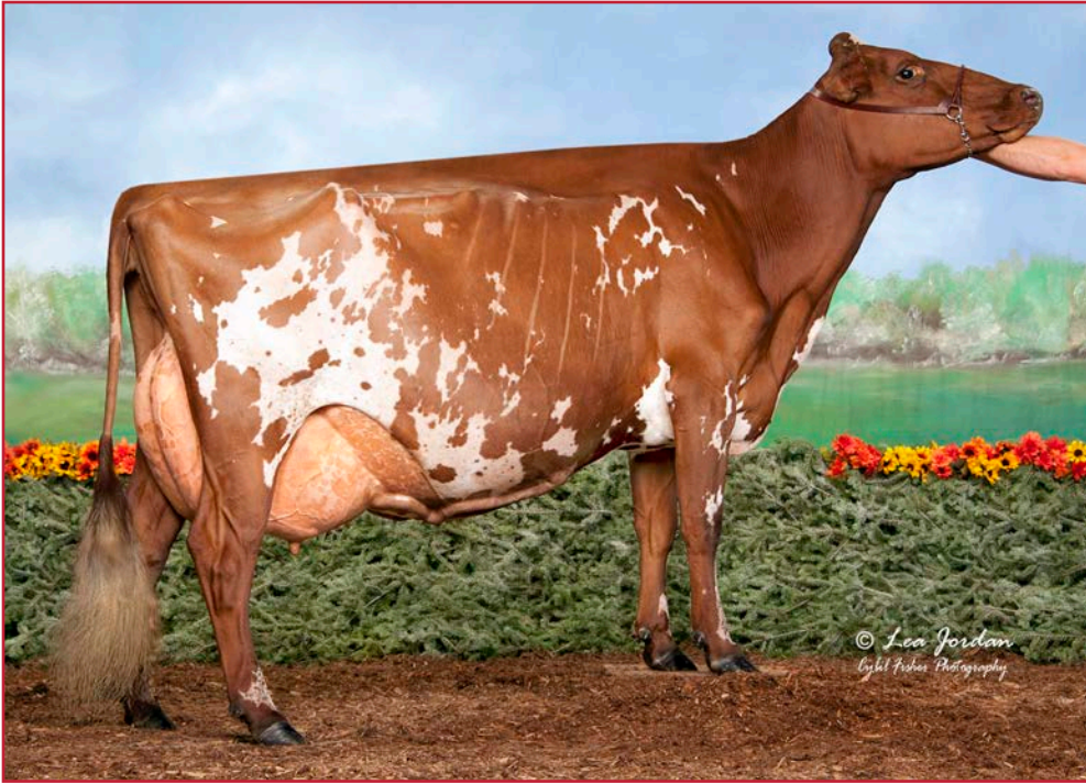
HARDY-FARM PRIME KRINGLE, EX-94 2E RES ALL-AMERICAN AGED COW, 2021 4-08 305D 21,320M 3.6% 773F 2.8% 589P MATERNAL SISTER TO DAM OF LOT 7