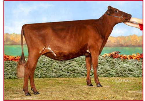
OLD-N-LAZY MONOTONUS-ET UNAN ALL-AMERICAN WINTER YEARLING, 2021 MATERNAL SISTER OF LOT 5