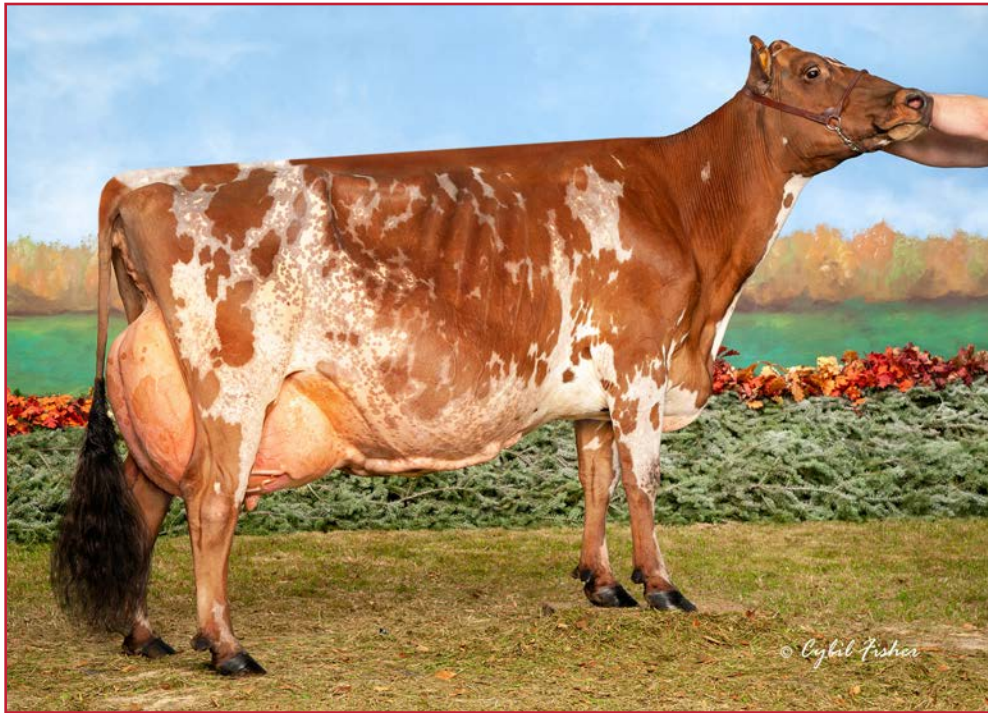
MOWRY'S BURDETTE SUMMER, EX-94 4E 8-04 365D 35,730M 4.3% 1545F 3.0% 1085P 3X UNANIMOUS ALL-AMERICAN DAM OF LOT 20