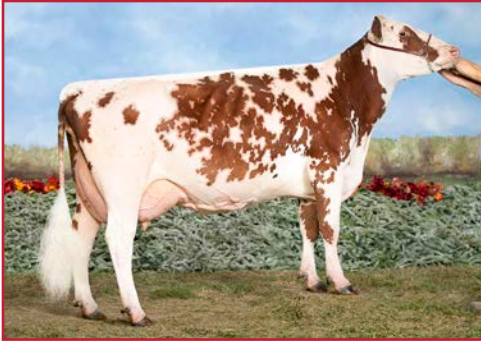
STILLMORE LEXI MIDORI-ET, EX-92 ALL-AMERICAN (TIE) SR 3-YEAR-OLD, 2012 GRANDDAM OF LOT 17