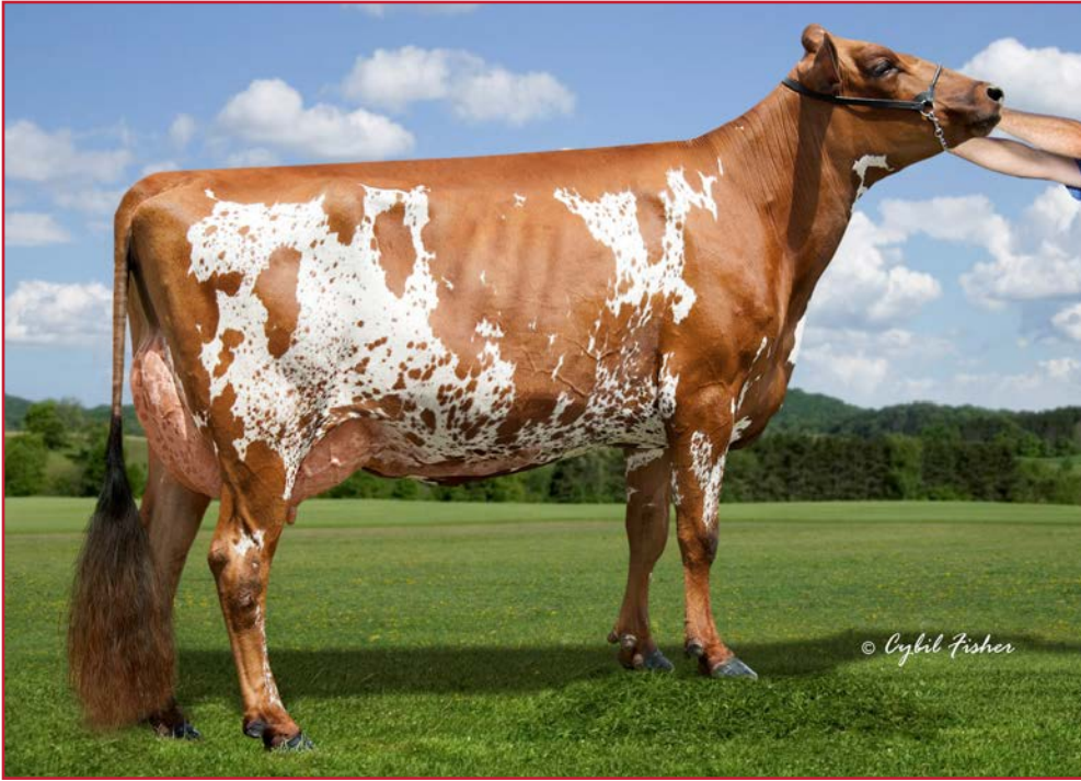
OLD-N-LAZY TSB WATCH THIS-ET, EX-93 EX-94 MAM 3-01 342D 22,730M 4.2% 952F 3.3% 740P SELLING AS LOT 15