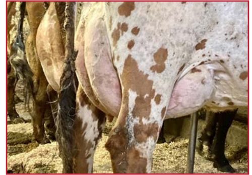
GRAND-VIEW JAMISON DEEVA, EX-90 IN HER WORKING CLOTHES! AVG 84 LBS PER TEST THIS LACTATION DAM OF LOT 22