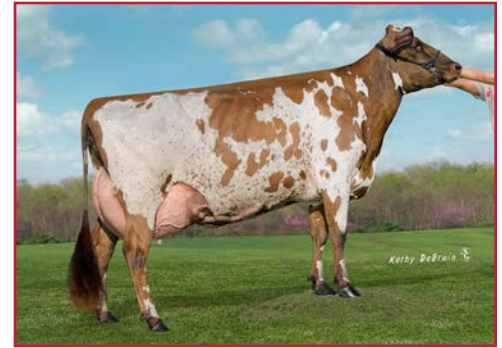
REINHOLTS BURDETTE ANNEKA-ET, EX-93 2E 6-11 365D 45,230M 7.0% 3154F 4.0% 1812P NUMEROUS ALL-AMERICAN HONORS FAMILY MEMBER OF LOT 10