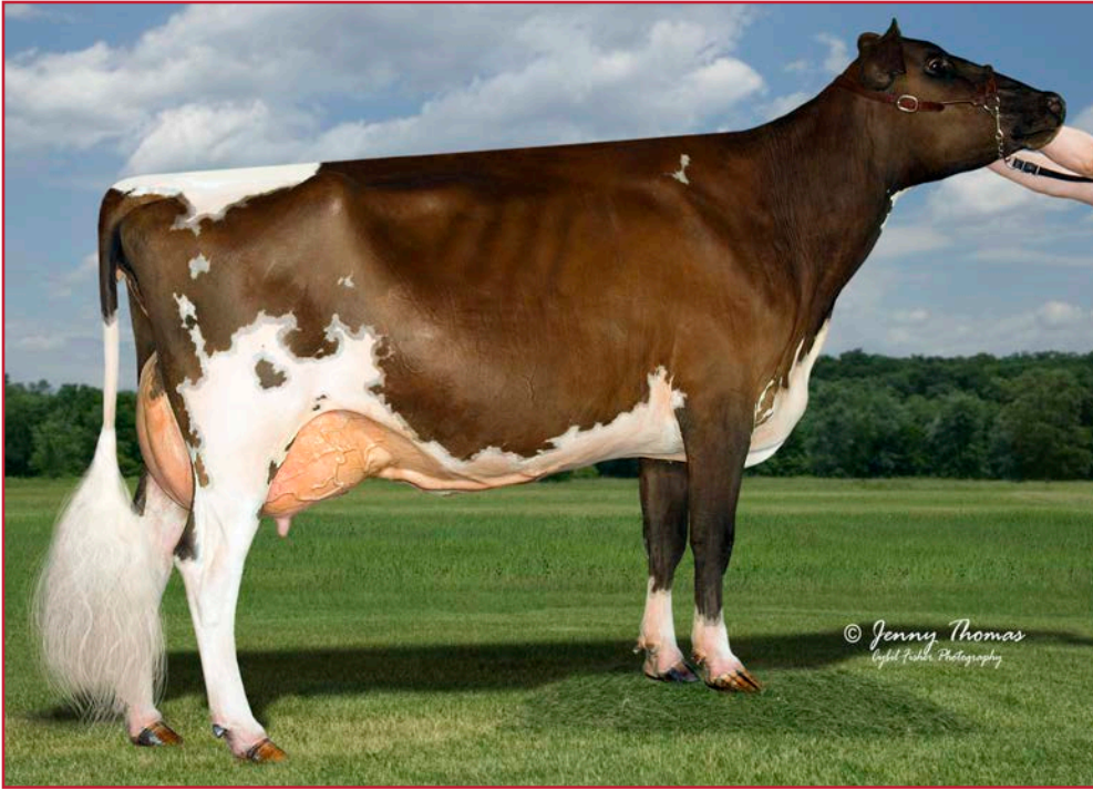
EMERALD-FARMS POKERS SWEETHING, EX-94 4E NOM ALL-AMERICAN 5-11 22,690M 4.1% 925F 3.3% 756P DAM OF LOT 19