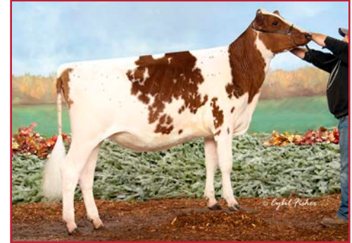
DOMYNAIRE BORN WRONG-ET UNAN ALL-AMERICAN WINTER YEARLING, 2018 MATERNAL SISTER OF LOT 6