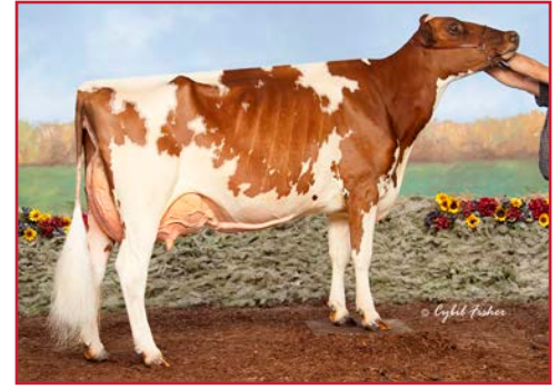
PALMYRA BERKELY P RUTH-ET EX-94 2E 3X UNAN ALL-AMERICAN 2X INTERNATIONAL SHOW (WDE) GRAND GRANDDAM OF LOT 1