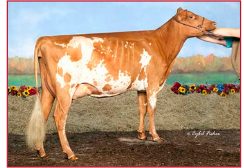
HARDY-FARM REAGAN KINLEY, EX-90 2ND, 2020 NORTHEAST FALL ALL BREED SALE FAMILY MEMBER OF LOT 7