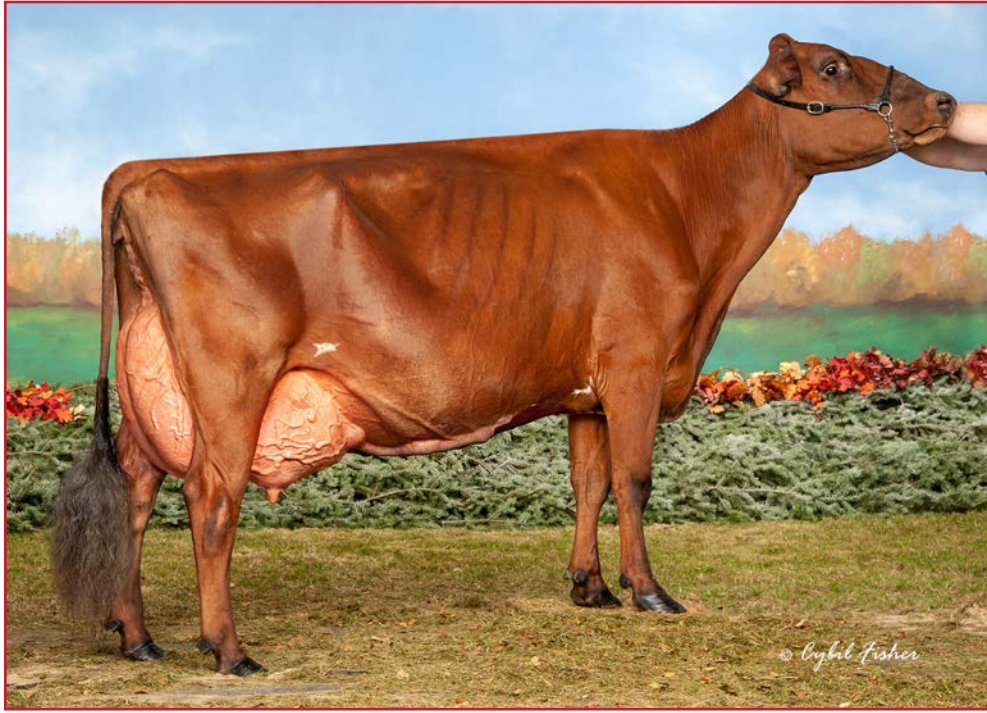
MARILIE GENTLEMAN KARMINA, EX-94 GRAND CHAMPION, 2022 WORLD DAIRY EXPO UNAN ALL-AMERICAN AGED COW, 2021 8-03 365D 43,200M 3.6% 1573F 2.9% 1263P DAM OF LOT 16