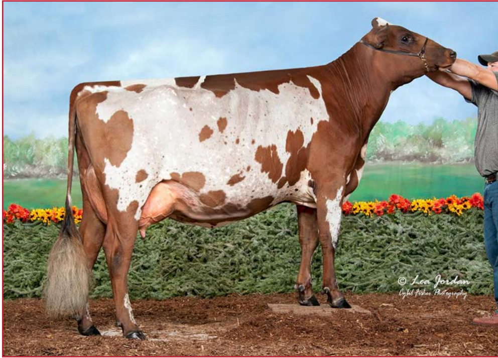
JOMILL BURDETTE KALIENTE-ET, VG-87 @ 1-11 NOM ALL-AMERICAN & JR ALL-AMERICAN MILKING YEARLING, 2021 DAM OF LOT 21