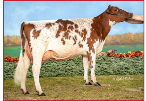
OLD-N-LAZY REAGAN WREN-ET VG-86 @ 2-03 NOM ALL-AMERICAN JR 2-YEAR-OLD, 2021 MATERNAL SISTER OF LOT 15