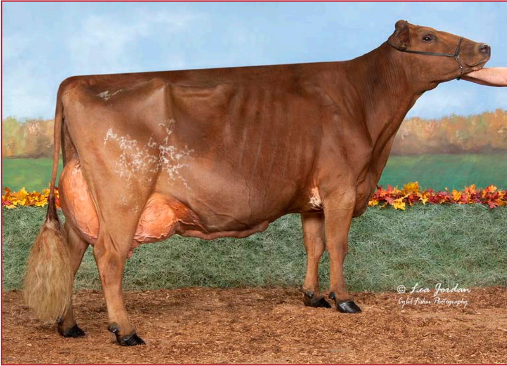
YELLOW BRIAR J BEVERLEY, EX-93 2E 3X ALL-AMERICAN NOMINEE 3-03 365D 29,460M 3.6% 1046F 3.3% 981P DAM OF LOT 6