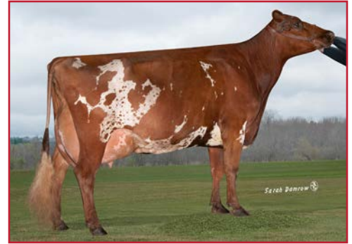
SHARWARDS CALIMERO MEGAN, EX-94 3E 4X ALL-AMERICAN 7-06 365D 28,120M 4.6% 1303F 3.1% 884P DAM OF LOT 5