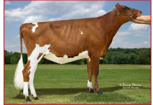
EMERALD-FARMS SWEET DELIGHT-ET NOM ALL-AMERICAN FALL YEARLING, 2020 MATERNAL SISTER OF LOT 19