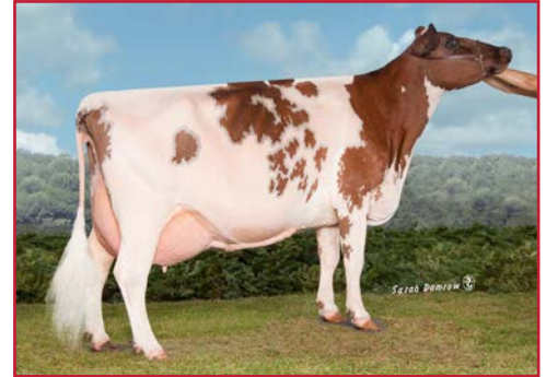
CEDARVALE BLACK CHINA, EX-92 6-04 365D 25,540M 3.6% 922F 3.4% 857P GREAT-GRANDDAM OF LOT 13