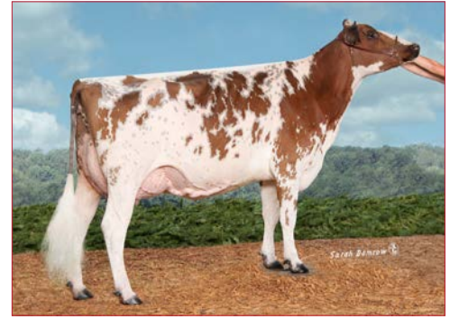
DE LA PLAINE REMINGTON WING-ET EX-92 2E 4-11 322D 28,290M 4.5% 1274F 3.3% 934P DAM OF LOT 4