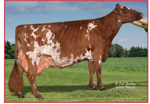
FOREST-PARK PERCY SWAY, EX-93 4E 9-05 305D 26,140M 4.0% 1054F 3.0% 789P 3X ALL-AMERICAN NOMINEE GRANDDAM OF LOT 18