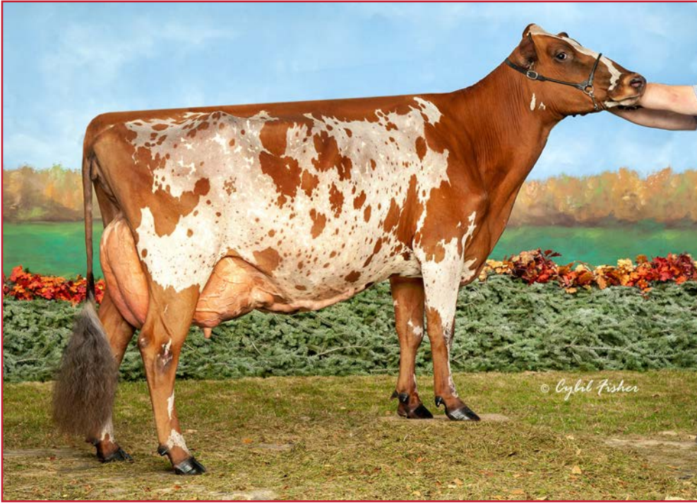
ELITE-HP PROMISE-ET, EX-91 NOM ALL-AMERICAN SR 3-YEAR-OLD, 2021 3-08 276D 25,155M 4.2% 1061F 3.4% 857P DAM OF LOT 9