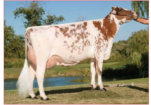
KLER-VU RAMIUS CHRISTMAS, EX-93 4E 120,616M 4.1% 4983F 3.2% 3803P 3X ALL-AMERICAN GRANDDAM OF LOT 14