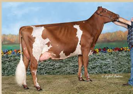
Granddam: Family-Af-Ayr Cal Dominique, EX-93 2E

98.84% AYRSHIRE 06/01/22 FEMALE 840003240832431 98.84% P- +397