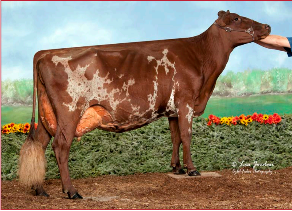
REDWOOD DEMPSEY SHARDHA, EX-93 2E 4-00 329D 23,490M 3.8% 902F 3.0% 696P NOM ALL-AMERICAN 4-YEAR-OLD, 2021 DAM OF LOT 18