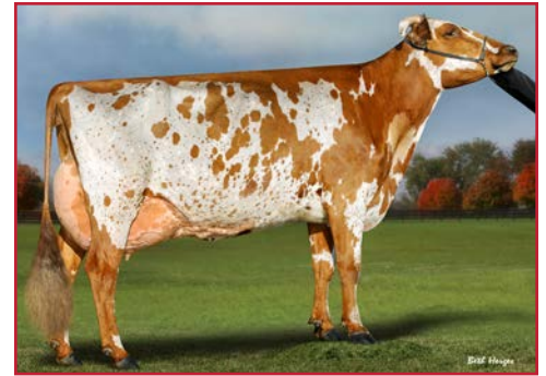
DOMYNAIRE BARBIE GIRL-ET, EX-90 RES ALL-AMERICAN JR 2-YEAR-OLD, 2019 MATERNAL SISTER OF LOT 6