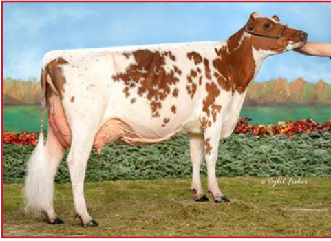
MISS MALIBU MIMOSA, EX-91 3-03 305D 20,510M 5.2% 1060F 2.9% 603P RES ALL-AMERICAN JR 3-YEAR-OLD, 2021 MATERNAL SISTER OF LOT 17