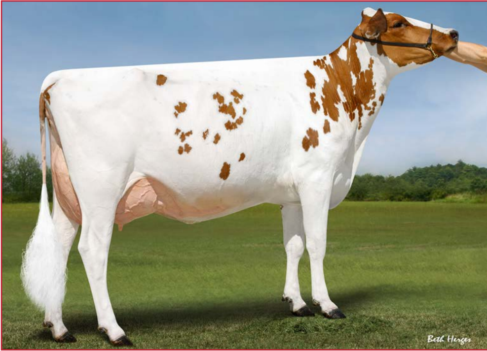
PALMYRA LOCHINVAR B REJOICE, VG-88 EX-MS 2X ALL-AMERICAN NOMINEE DAM OF LOT 1