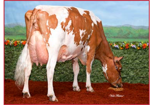
FOREVER SCHOON PING, EX-95 4E 9-08 365D 27,015M 4.4% 1186F 3.5% 948P ALL-AMERICAN & ALL-CANADIAN GRANDDAM OF LOT 4