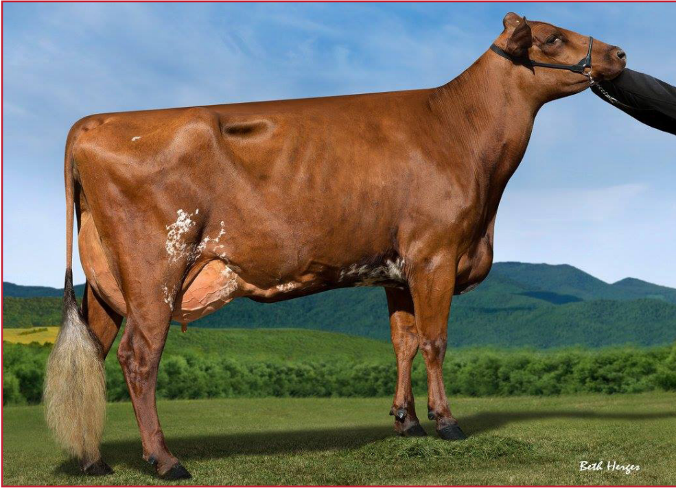
MAPLE-DELL B DELLA-ET, EX-93 3E 100,220M 4.4% 4410F 3.0% 3012P LIFETIME DAM OF LOT 11