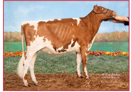
EMERALD-FARMS CHEROKEE BABY NOM ALL-AMERICAN SPRING YEARLING, 2020 MATERNAL SISTER OF LOT 19