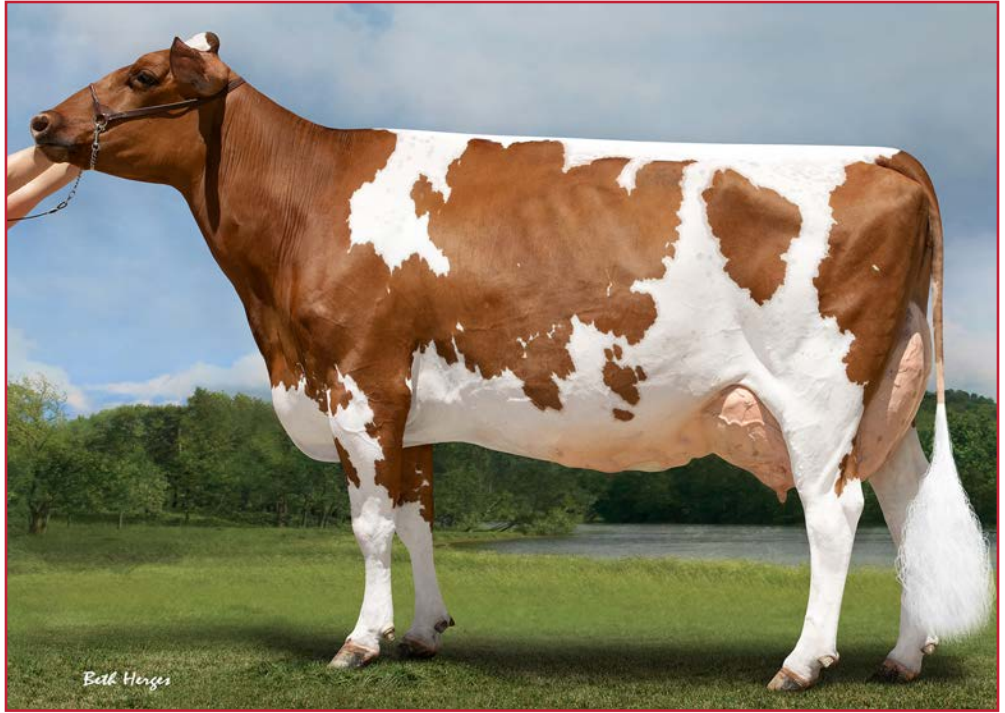
OLD-BANKSTON JC MALIBU-ET, EX-94 2E 4-07 291D 20,990M 4.0% 836F 3.0% 637P DAM OF LOT 17