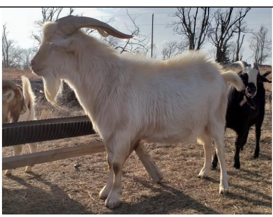
Hidden Springs Farm