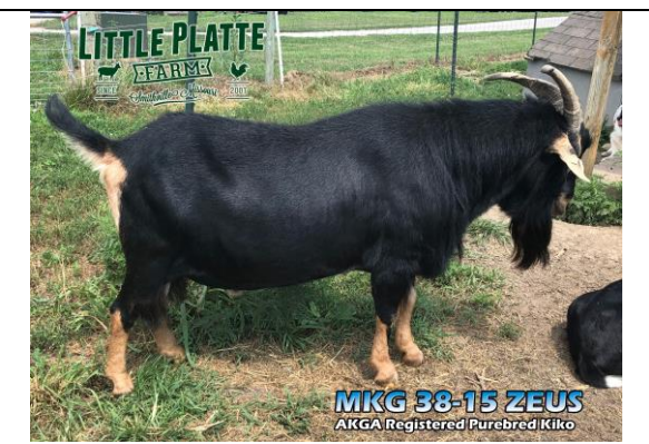
Little Platte Farm