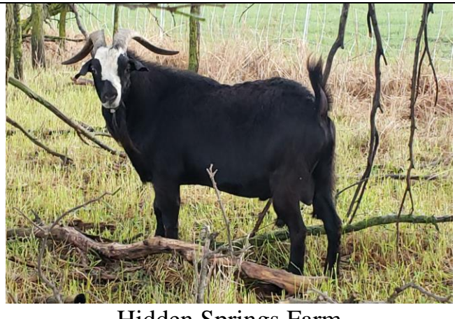
Hidden Springs Farm

MKG 38-15 ZEUS - Zeus is an extremely large framed buck. He has great length, prominent chest and ample hindquarters. He consistently adds frame, hoof quality and parasite resistance to his progeny. Just some of the notable sires in his pedigree include TNT RAIZ'N'KANE, LRF W-7, SKY T20 COMMANDER, BLUE'S SON and ELH BLUE BOY 1L. Zeus is truly an easy keeper, having never required deworming or hoof trimming. Zeus has built quite a reputation and has had an enormous impact on the commercial meat herds in the central United States. MJI THUNDERBOLT - Thunderbolt is a large framed 100% New Zealand buck from the GOLDMINE lineage who placed a respectable 7 th place in ADG at the 2016 Maryland buck test. He consistently sires sizeable kids who grow quickly and top our index ratings each year. Hidden Springs Farm has retained numerous does produced by Thunderbolt, and they exhibit straight