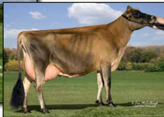
SSF SUPREME LEE EX-92% 4TH DAM OF LOT 10

1st Senior 3-Year-Old, NY State Fair 2019