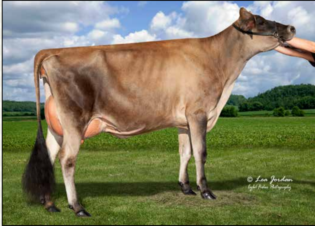
SSF KLONDIKE ELLA SELLS AS LOT 86