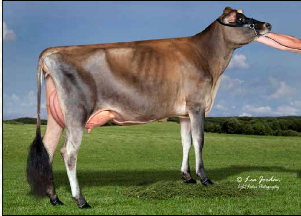
SSF VIP LELIE EX-91% SELLS AS LOT 56; DAM OF LOT 57 1st Milking Yearling, NY State Fair 2019