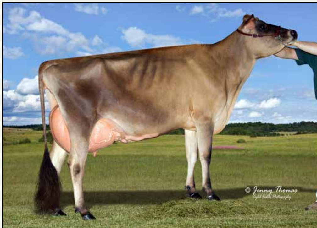
SSF GOVERNOR IRIS EX-93% 3RD DAM OF LOTS 50 & 51