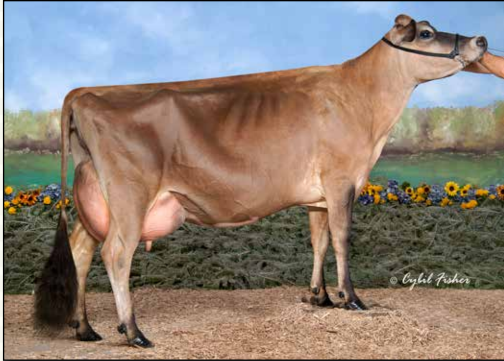
SSF BELLEVUE PAPRIKA EX-93% SAME MATERNAL FAMILY AS LOTS 59 & 60