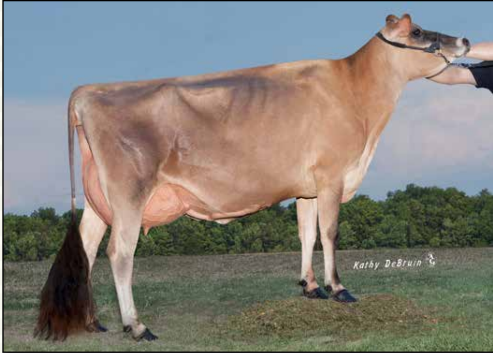
SSF GOVERNOR CARA EX-92% SAME MATERNAL FAMILY AS LOTS 24 THRU 30 1st Aged Cow, NY State Fair 2015