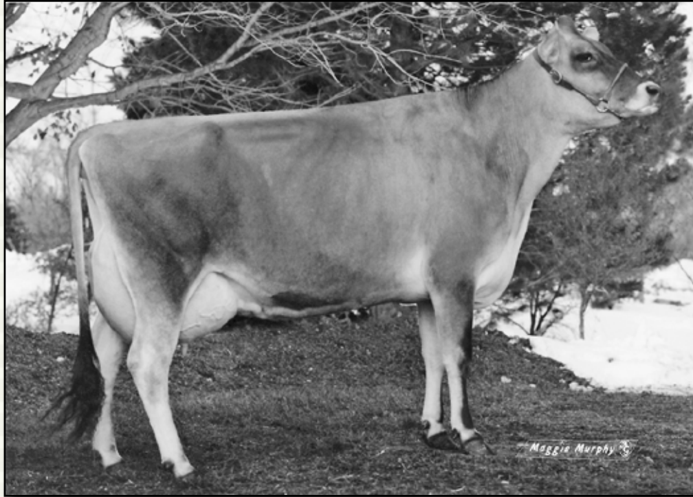
SOONER ELISE OF SSF EX-93% SAME MATERNAL FAMILY AS LOTS 86 & 87 Reserve National Jersey Jug Winner 1995