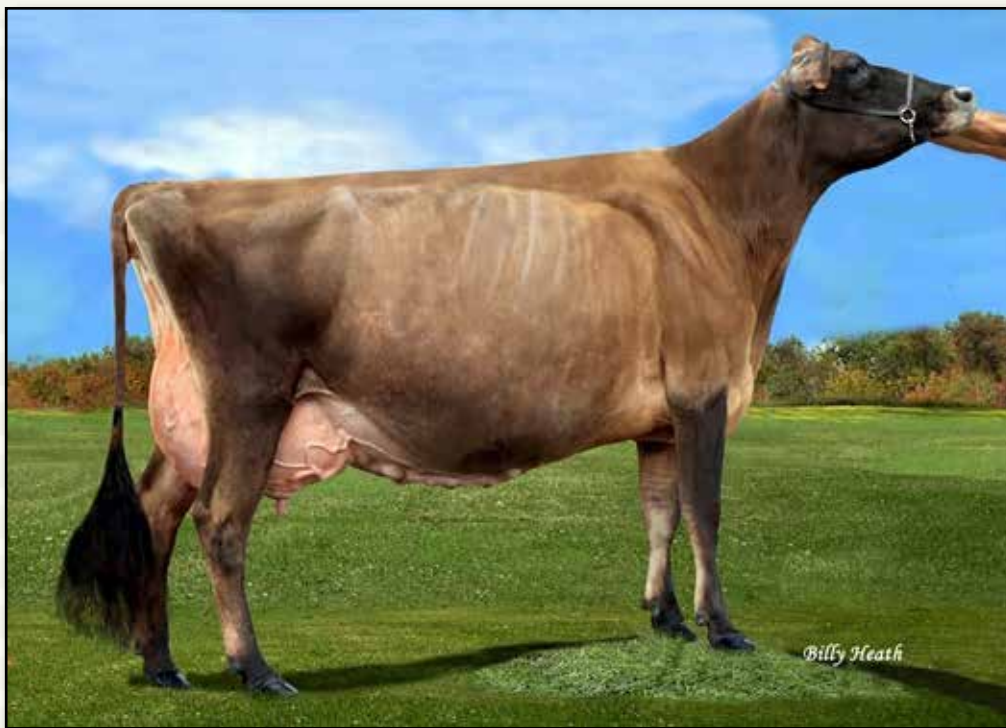
JEWELS SAPPHIRE EX-93% MATERNAL SISTER TO 2ND DAM OF LOTS 88 & 89 Nominated ABA All-American Junior 2-Year-Old 2010