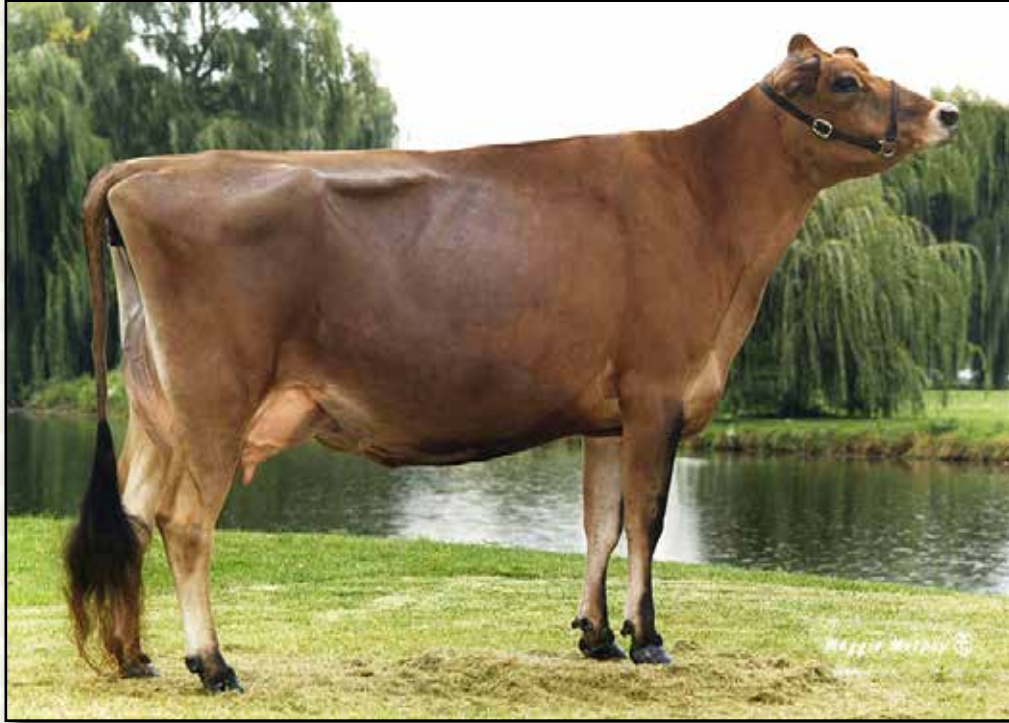
HOLLYLANE JEWELS JASMINE EX-94% 4TH DAM OF LOTS 88 & 89 All-American 5-Year-Old 2003