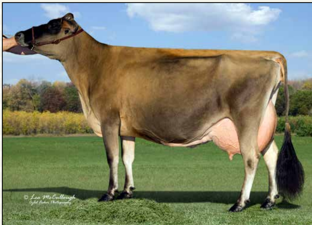
SSF SIGNATURE POLLY EX-92% MATERNAL SISTER TO 3RD DAM OF LOTS 41 & 42 Reserve All-American Milking Yearling 2006