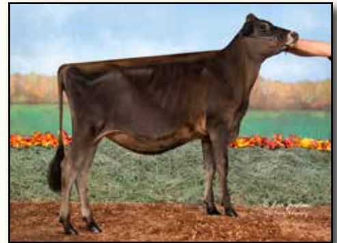
SSF COLTON LORELIA VG-85% MATERNAL SISTER TO LOT 58

840 3234326332 Born: December 2, 2021 AMID: 1901