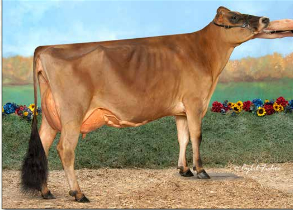
SSF BOEHEIM CANDACE EX-94% 2ND DAM OF LOTS 29 & 30