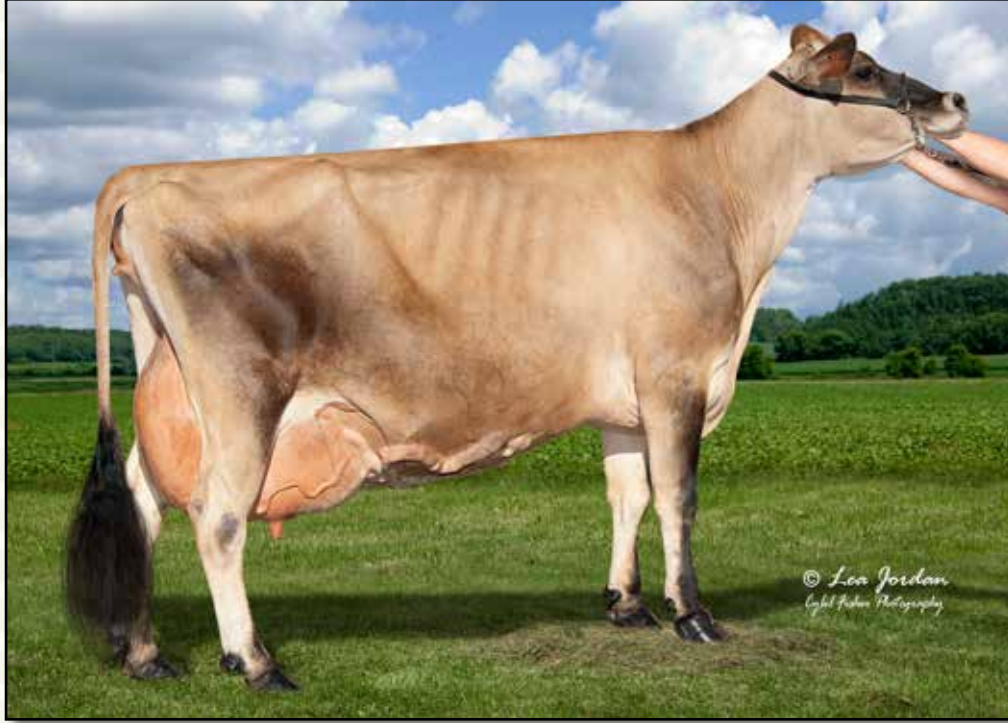
SSF JADE BETHANY EX-95% MATRIARCH OF LOTS 1 THRU 7