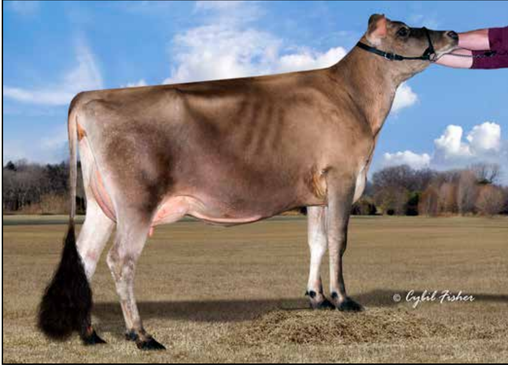
SSF PRESTIGE CARLA EX-93% SAME MATERNAL FAMILY AS LOTS 24 THRU 30 Reserve National Jersey Jug Winner 2013