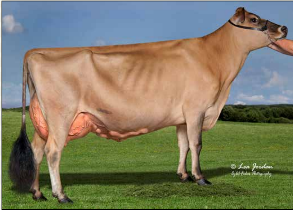
SSF ADAM POETRY EX-94% DAM OF LOTS 74 & 75