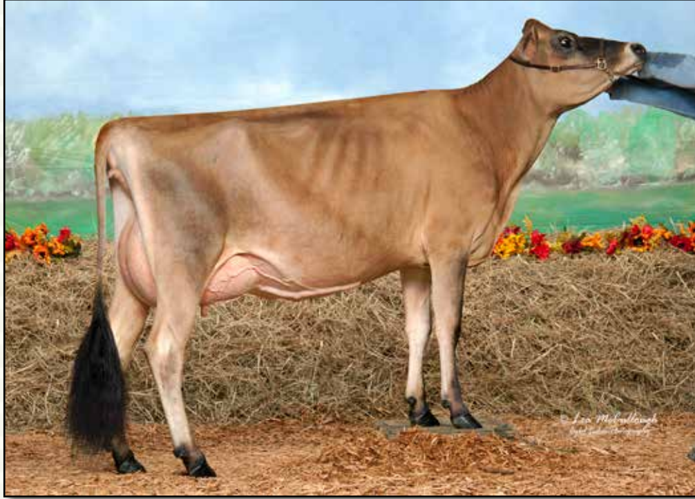
GORDONS NEVADA INDIGO EX-91% MATERNAL SISTER TO 2ND DAM OF LOTS 48 & 49