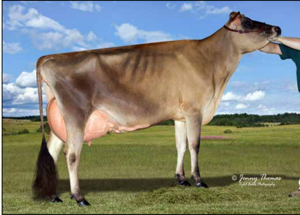
SSF GOVERNOR IRIS EX-93% SAME MATERNAL FAMILY AS LOTS 44 THRU 51