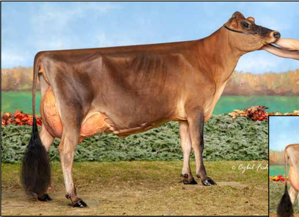
SSF ANDREAS CAMILLA EX-91% MATERNAL SISTER TO LOT 11

Nominated ABA All-American Senior 3-Year-Old 2021