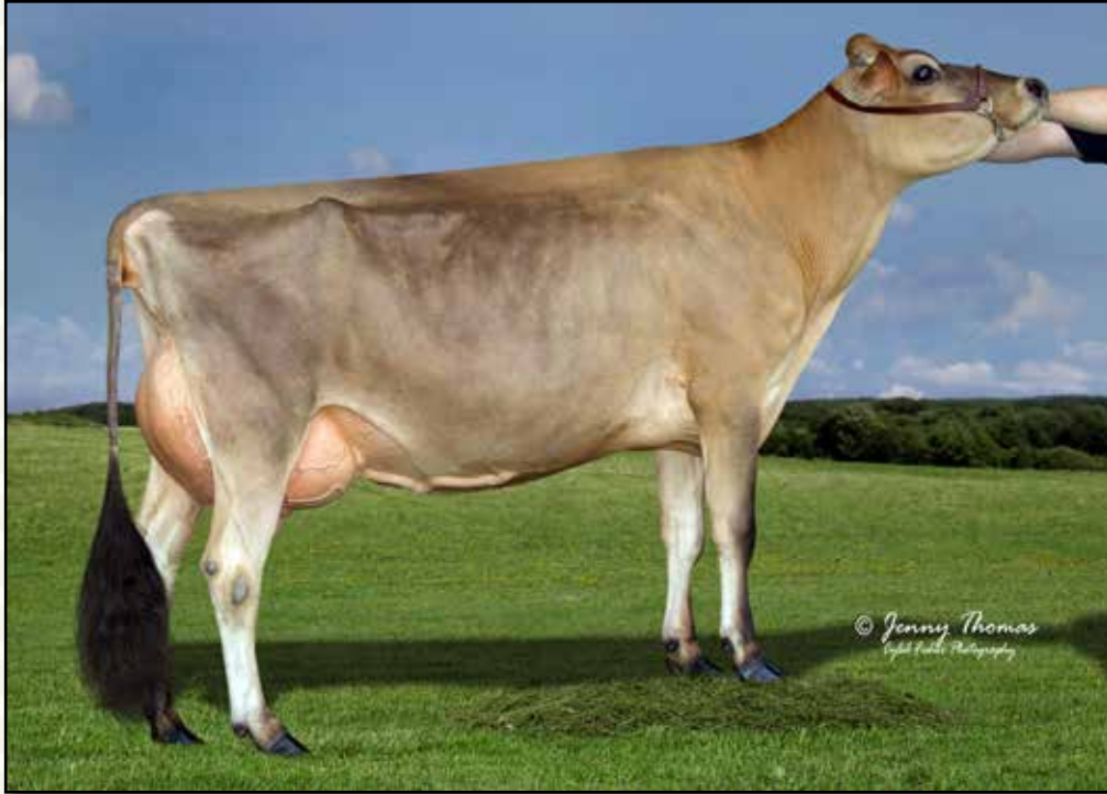
SSF EXCITATION PARKER EX-90% SAME MATERNAL FAMILY AS LOTS 38 THRU 43