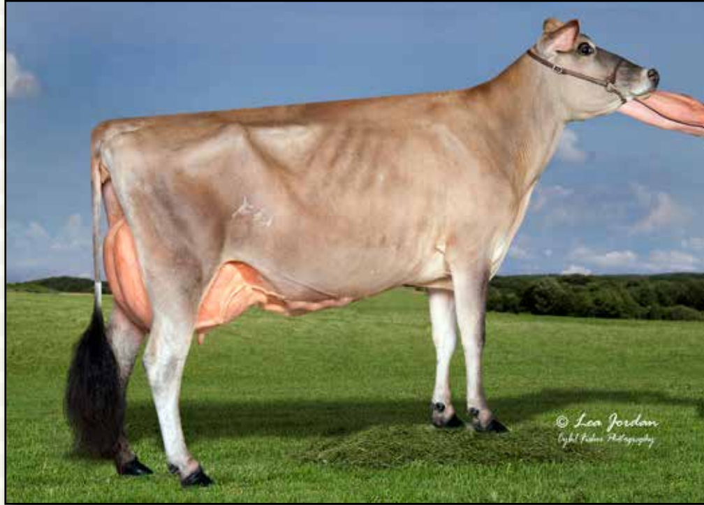
SE2 GENTRY CHAR EX-90% DAM OF LOT 61