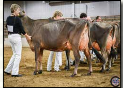
SSF VIP JANIE VG-89% SAME FAMILY AS LOTS

113246184 4-06 EX-92% 4-01 2x 305d 23090 5.1 1183 3.6 836 5-04 2x 305d 22190 4.8 1075 3.6 798 6-09 2x 305d 21260 4.9 1045 3.5 737