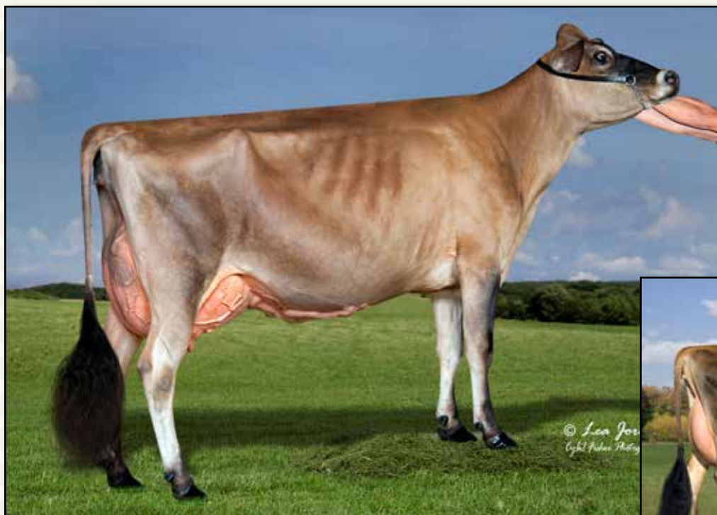
SSF ANDREAS LINDA EX-92% 2ND DAM OF LOT 10

1st Senior 3-Year-Old, NY State Fair 2019