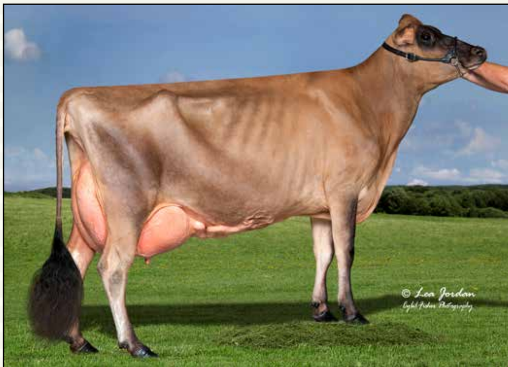
SSF RAPTOR CASSIDY EX-92% DAM OF LOTS 19 & 20