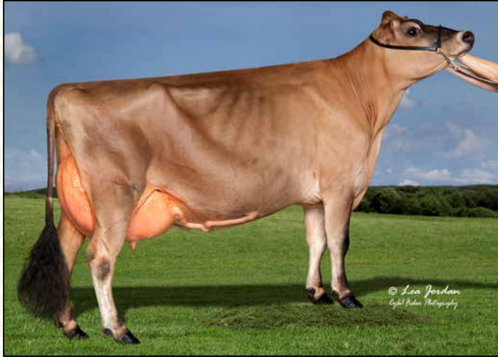
SSF INCENTIVE CHEERFUL EX-94% DAM OF LOT 12