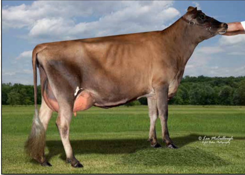
GORDONS LEGION INGA EX-91% MATERNAL SISTER TO 2ND DAM OF LOTS 50 & 51