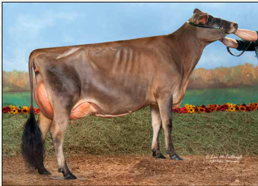
SSF TEQUILA ETITA EX-90% MATERNAL SISTER TO DAM OF LOTS 79 THRU 82