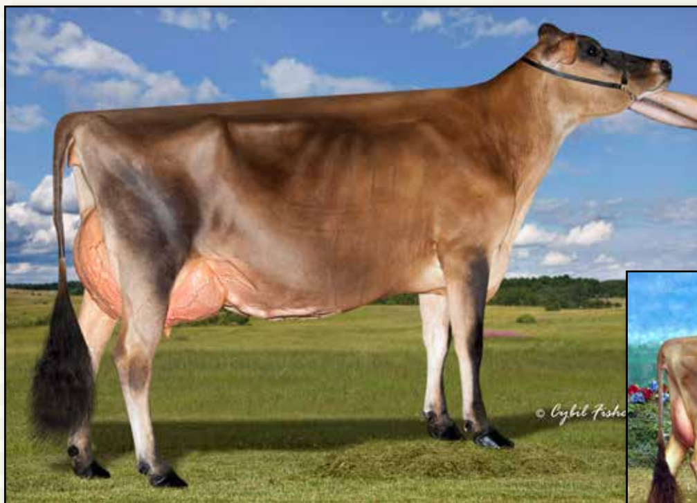
AVON ROAD PREMIER JESSICA EX-94% SAME MATERNAL FAMILY AS LOTS 76 THRU 78 Nominated ABA All-American 5-Year-Old 2020