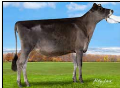
SSF MAGICIAN SOPHIA

840 3234326334 Born: December 4, 2021 AMID: 1903