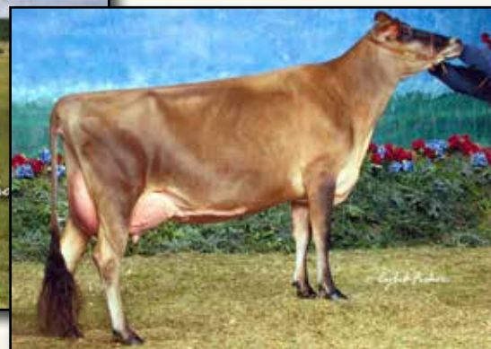
JUSTINES DELUXE JUSTINE-ET EX-93% 3RD DAM OF LOT 76 1st Junior 2-Year-Old, WDE 2003