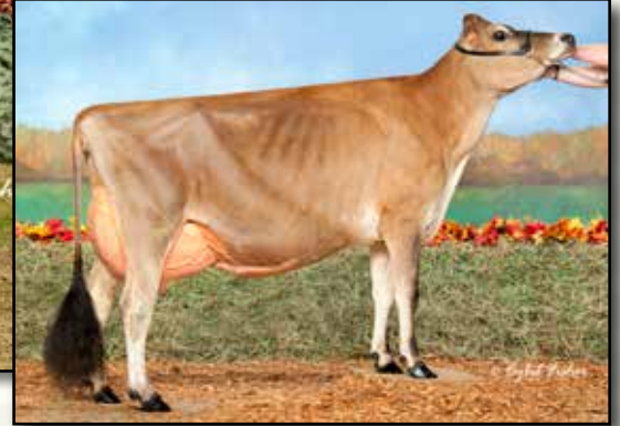
SSF GENTRY CHANTILLY EX-91% 2ND DAM OF LOT 11

Nominated ABA All-American Senior 3-Year-Old 2021