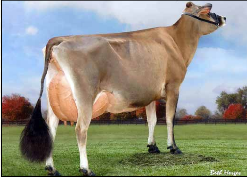
NORSE STAR TEQUILA KATIE {4} EX-94% 2ND DAM OF LOT 35; 3RD DAM OF LOT 36