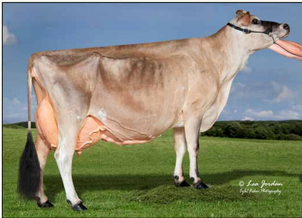
SSF BELLEVUE BLOSSOM EX-94% DAM OF LOT 2; 2ND DAM OF LOT 1