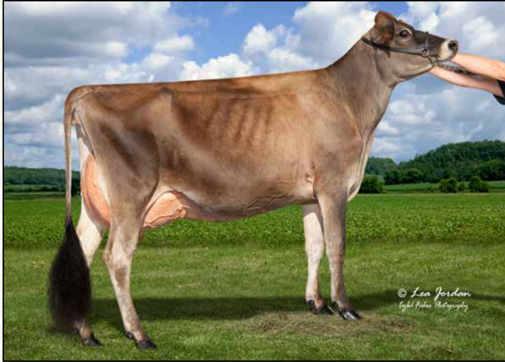
SSF CASINO BRIE VG-89% SELLS AS LOT 1