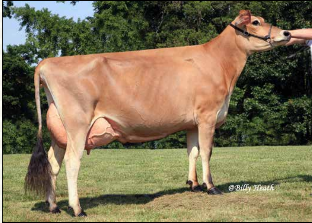
SSF COMISKEY PACER EX-91% SAME MATERNAL FAMILY AS LOTS 59 & 60