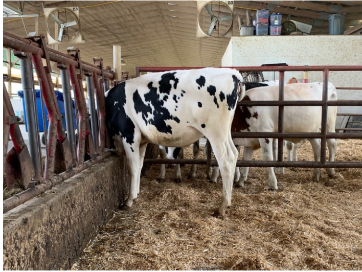
Lot 4G PINE-TREE 8361 ENGI 9339-ET