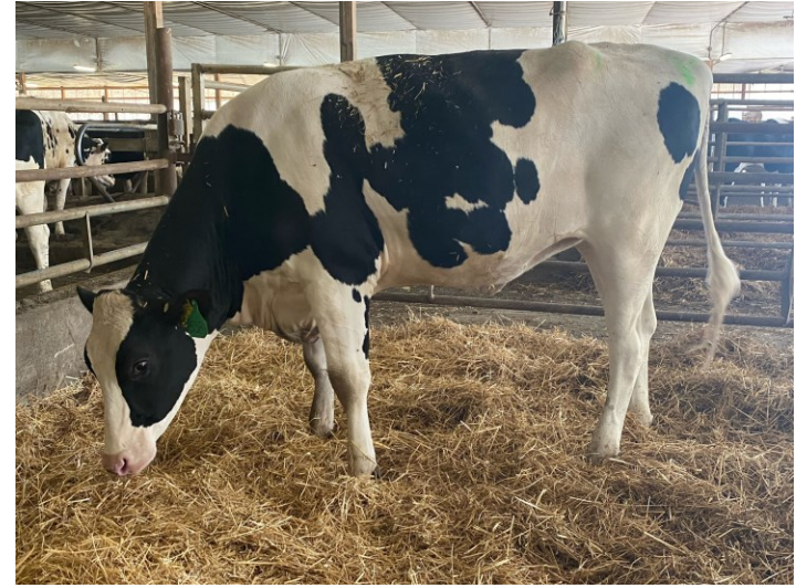
Lot 14G T-SPRUCE TAOS 15384-ET