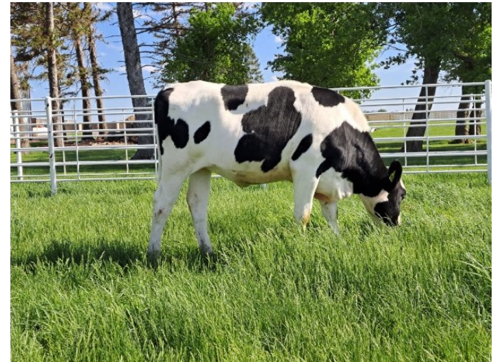
Lot 22G BLUMENFELD GAMEDAY 7814-ET