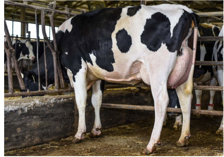
Lot 28G_DAM_VATLAND DRIVE MONA 5736