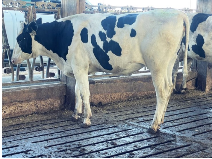
Lot 27G GENOSOURCE AUSTAD 47823-ET