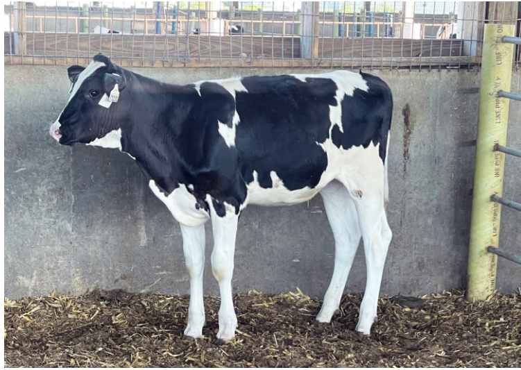
Lot 31G GENOSOURCE ZZ TOP 71131-ET