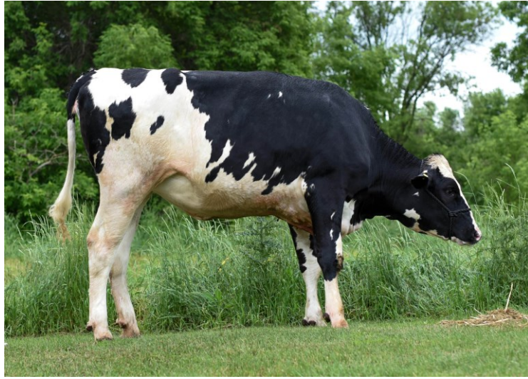
Lot 24G MELARRY TOPDOG 2281-ET