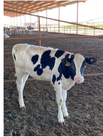
Lot 32G_MS BRASS 19691-ET