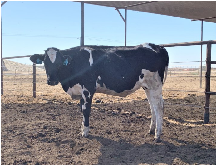
Lot 25G TERRA-LINDA HGHJMP 11322-ET