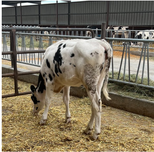
Lot 8G WINSTAR PLINKO 2818-ET