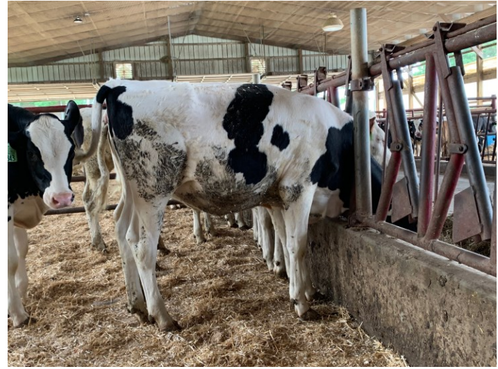
Lot 5G PINE-TREE 8361 ENGI 9327-ET