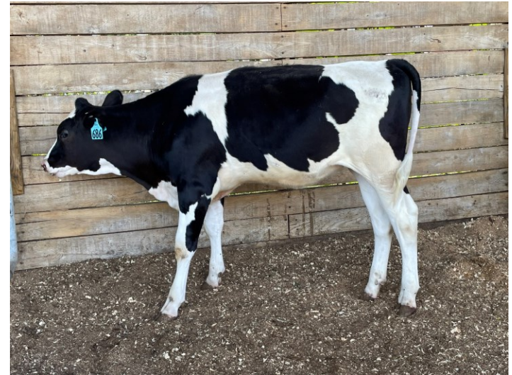
Lot 26G CHERRYPENCOL GD LIND 686-ET