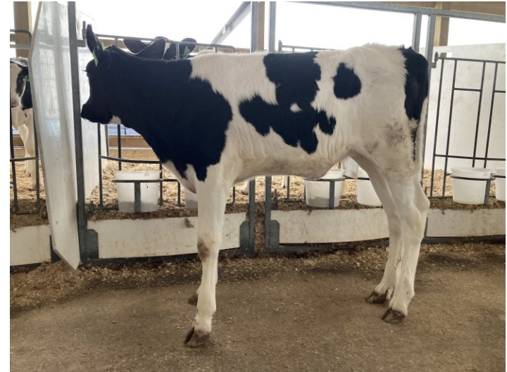
Lot 29G PINE-TREE 8361 LIFT 9466-ET