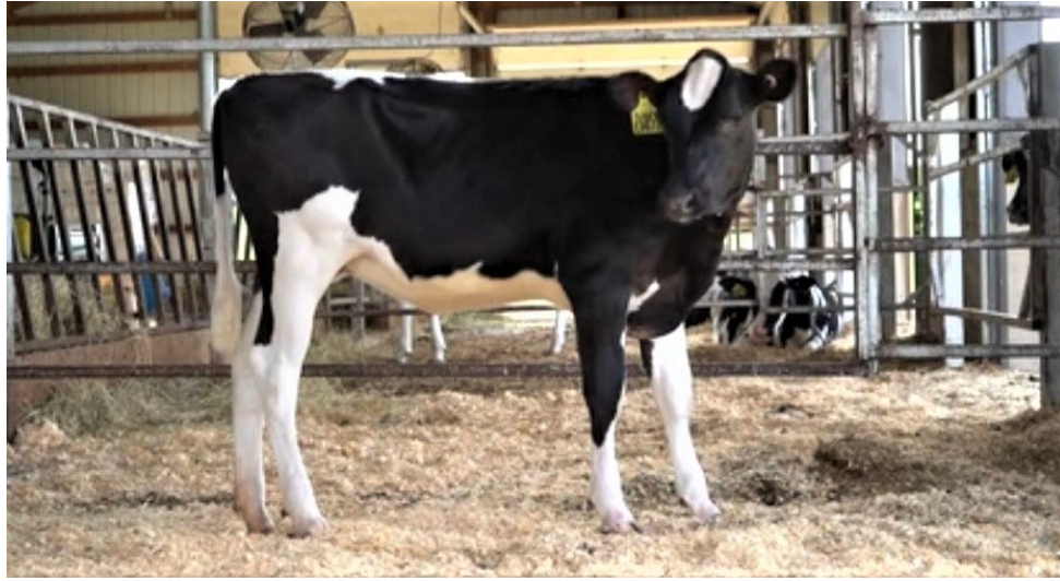
Lot 11G LARS-ACRES GAMEDAY ALYSA-ET