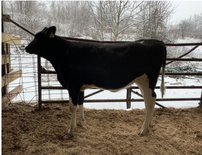
Lot 20G CHERRYPCOL G 993-ET