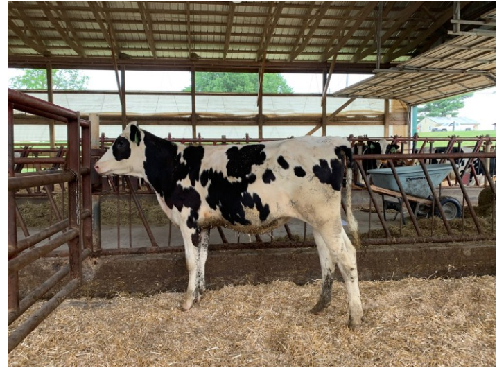
Lot 10G PINE-TREE 8361 EXPE 9345-ET