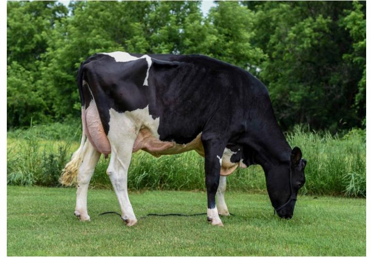
Lot 24G_Dam- MELARRY CHALLENGER 304-ET