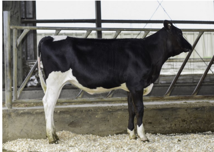
Lot 28G_VATLAND DRIVE MONA 5736