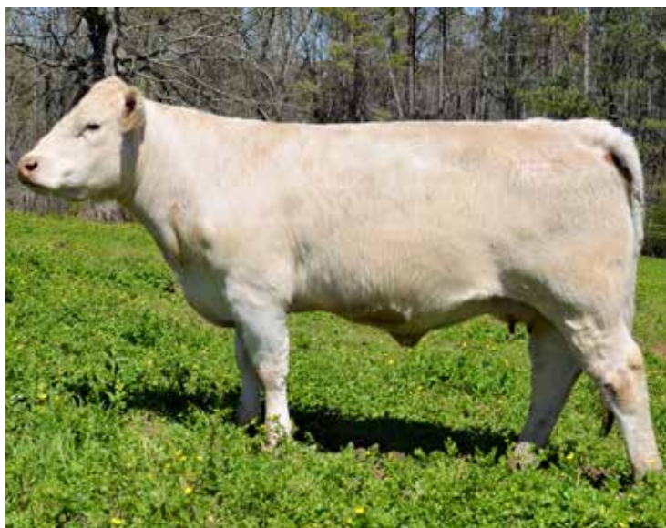
OHF VANESSA H832 SELLS AS LOT 59

Sells bred to Welcome Grove Rave 1824 ET, EM914413. Due: 10/8/22. E916 E916 has produced 24 calves and is in Mazeppa's ET program, NC. 4121 has produced 14 calves, and D029 continues her dominance in the breed. Good numbers, she ranks in top 30% MTL, 15% REA and Fat. Milestone adds calving ease along with eye-appeal and Cigar adds dimensions, thickness, and volume. H832 displays tremendous femininity as well!