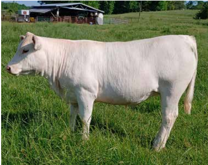
WC SUGAR LILI 131 SELLS AS LOT 43