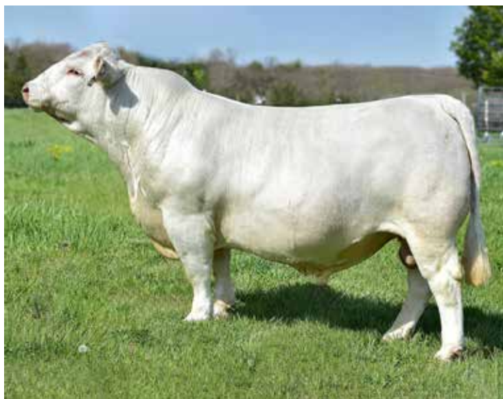
WC MONUMENTAL 5524 P SIRE OF LOT 16