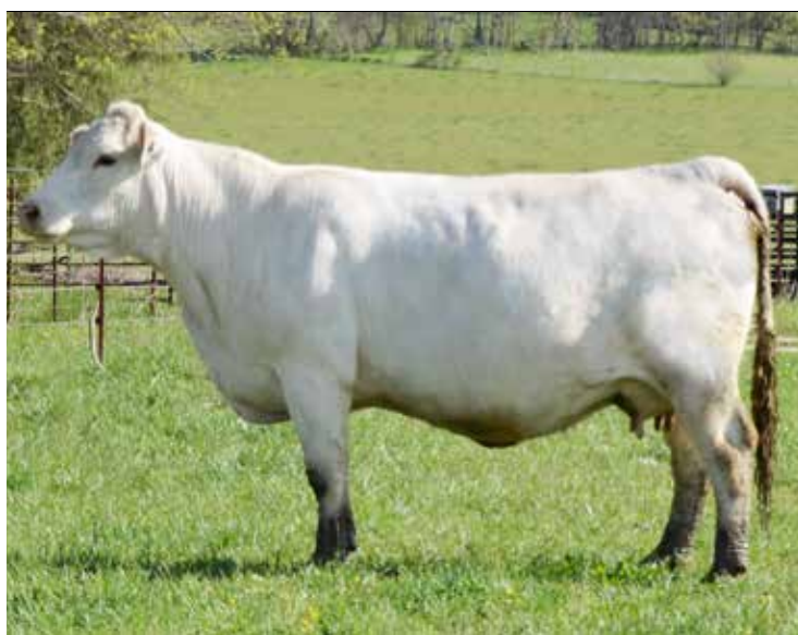
M6 MS FRESH NANCY 4136 P SELLS AS LOT 22

DUE before the sale to M6 Law & Order 577. Law & Order is a son of the top selling M6 Ms New Nancy 274. A daughter of the top selling M6 Ms 761 Nancy 6100 P ET that went to Double-H and contributed highly to the whole M6 program. 2017's dam sells as Lot 22, so you get evaluate the whole family! The guess work is out on this exceptional prospect and will have a calf at side to prove her worth!