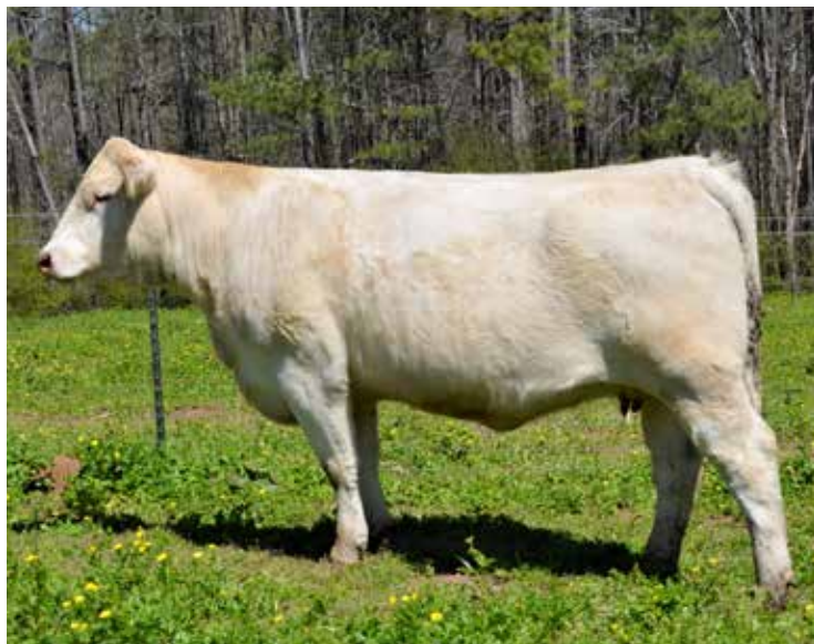
OHF LADY J905 ET SELLS AS LOT 61