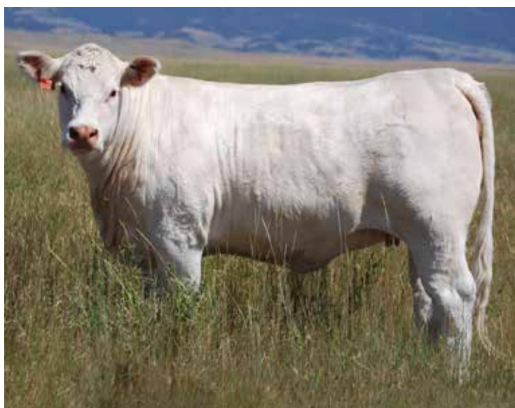
JDJ MS LEDGER C3228 PET DONOR DAM OF LOT 69 EMBRYOS

Selling 3-Embryos from mating of LT Rushmore 8060 Pld x M6 New Germaine 484. 484 was the lead-off Lot 1 in the M6 Dispersal sale in 2017. Beside being a Cool Germaine 1145 daughter, she is also a daughter of M6 New Standard 842. This combination has topped many sales with their highly rated EPDs and genetic success in the pastures! She has 32 progenies registered with AICA at this time. She ranks in the top 1% EPDs for WW, YW, MTL, SC, REA, and TSI. She is rated in top 2% for Milk and CW. What an opportunity!