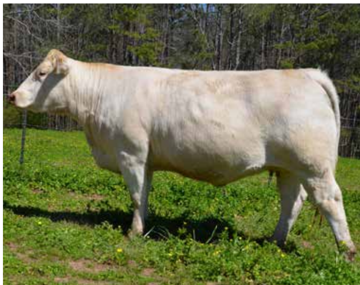
OHF SMOKING H816 ET SELLS AS LOT 58

Sells bred to Welcome Grove Rave 1824 ET, EM914413. Due: 10/17/22. Lots 60 & 61 are maternal sibs. She has very good numbers ranking in the top 25% WW, 15% YW, 30% Milk, 20% MTL and CW, 15% REA and Fat, and 20% TSI. Her dam, D823 is now in Herndon Farm's ET program, and she has 23 calves, her dam 9126 has 16 calves. What a coup to add these three sisters into one herd!!