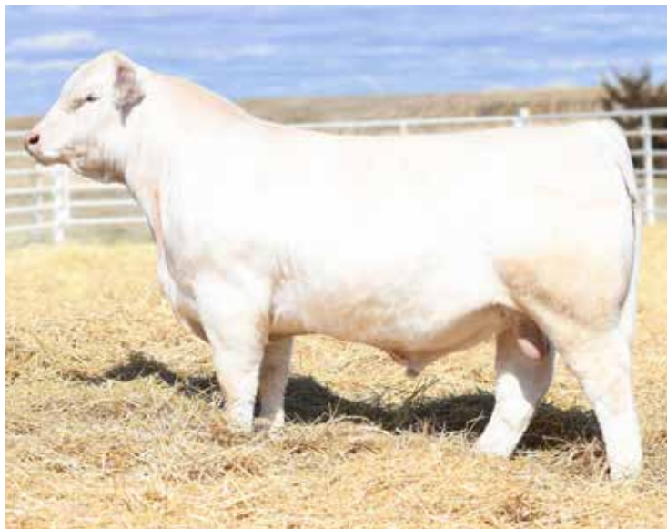
GHC REAGAN 9012 A-I SIRE OF LOT 14