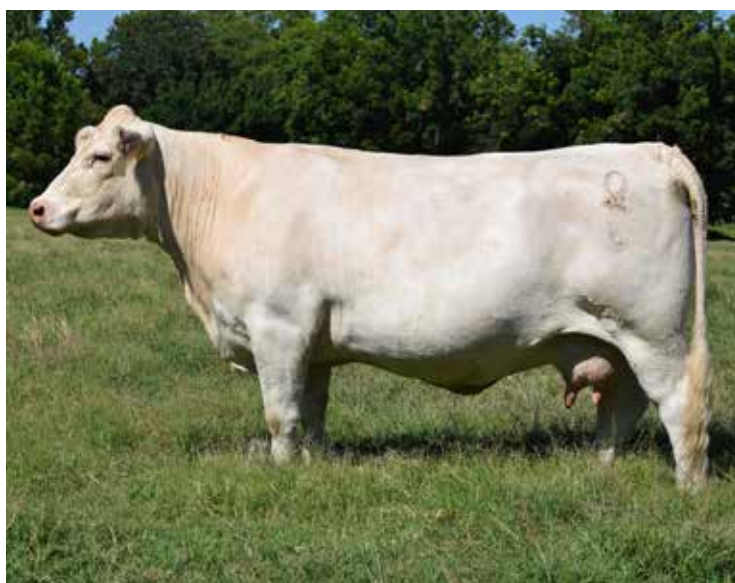
JDJ MS PRESIDENT W3071 DAM OF LOT 63

62A: Pld heifer calf # A911, born 9/11/21, bw 70, sired by FTJ Cascade 1508, M868134. A Blue Value son out of an LT Silver Distance cow. He ranks in top 6% for Marbling. Bred back to Welcome Grove Rave 1824 ET and DUE 11/5/22. Windy's dam, 94E has a great calving interval: 10/14; 9/15; 9/16; 9/17; 11/18; 11/19; and 12/20, showing a great fertility record! 128G ranks in top 20% CE, 8% BW, 25% YW, 30% MTL, and 15% TSI.