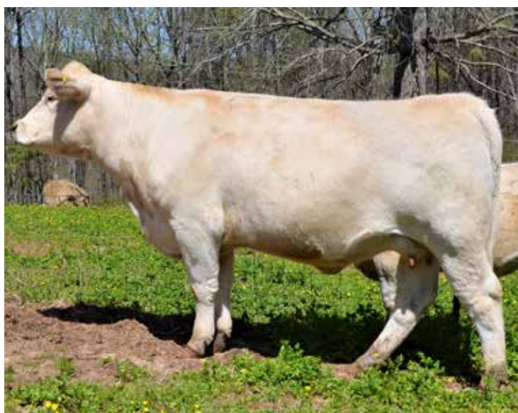
OHF SMOKING LADY J827 ET SELLS AS LOT 60

60A: Pld heifer calf #A106, born 10/16/21, bw 75, sired by Hayden G840, an M6 New Standard 842 son. Bred back to Welcome Grove Rave 1824 ET and DUE 10/25/22. Out of a very prolific and fertile cow family tracing back to the original foundation of the Nancy cow family, WCR Miss Duke 8742. J827 ranks in the top 20% WW, 15% Milk, 9% MTL, 20% REA for breed comparisons. Maternal sib to Lot 58 and Full sib to Lot 61.