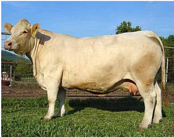
ABC DAN MACKIE DONOR DAM OF LOT 72 EMBRYOS