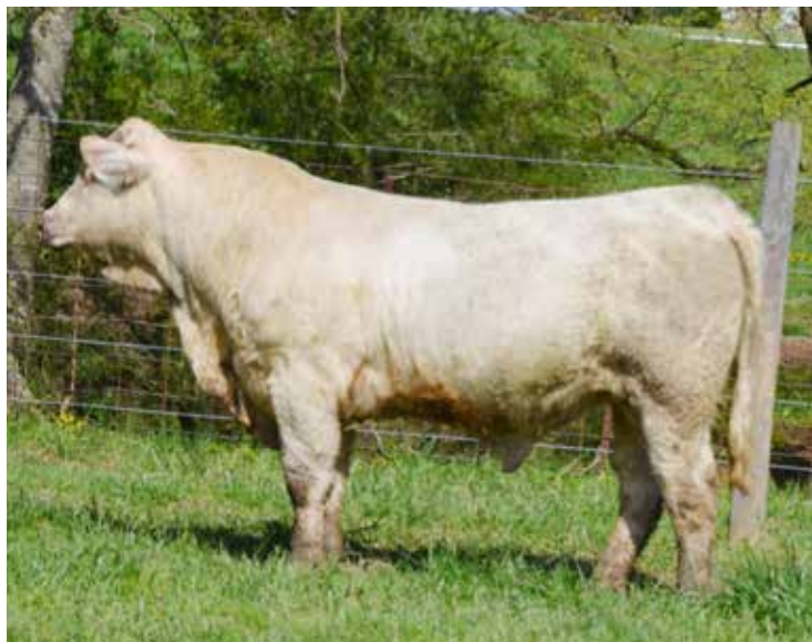
REAVES BRAXTON 2049 SELLS AS LOT 1