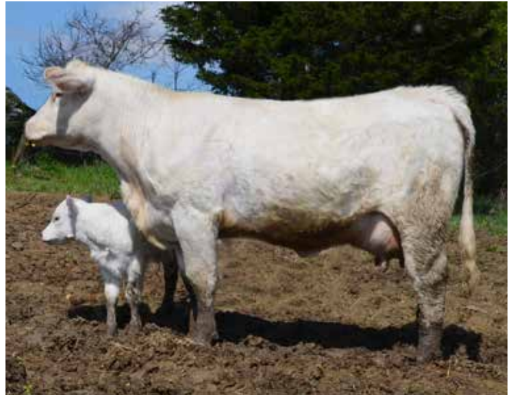
REAVES MS MOLLY 2016 SELLS AS LOT 24