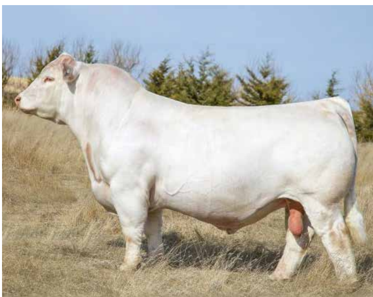
TR CAG CARBON COPY 7630E ET SIRE OF LOT 9

8A: Pld Heifer calf # 2117, born 9/11/21, bw 105, sired by LT Patriot 4004 Pld. On 2/12/22 was 3 months safe in calf to Desco Del Rio P ET 512. Dam is a full sib to some of the top selling and top quality Charolais in the breed. A daughter of the illustrious Reaves Donor, M6 Cool Germaine 1145 P ET. 12D ranks in the top 20% for both WW and YW EPDs, top 5% Milk, and 4% MTL. Top 6% for REA, 7% FAT, and 20% for TSI rankings!