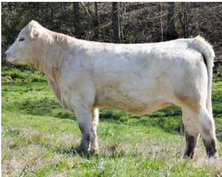
JBC MS MILESTONE 003 P ET SELLS AS LOT 7