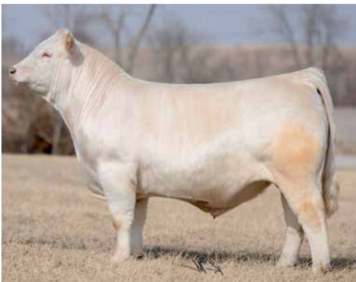
WC UNCHARTED 7328 P DONOR SIRE OF LOT 73 EMBRYOS