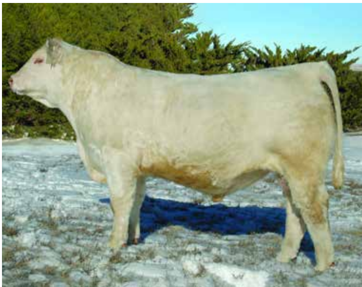
LT PATRIOT 4004 PLD SIRE OF LOT 8 CALF