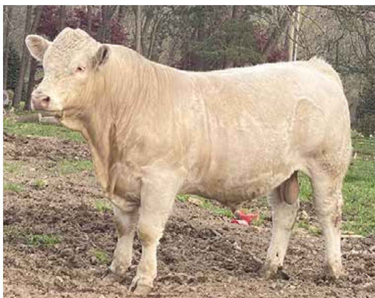
B&B DENALI 2113 SELLS AS LOT 3

Selling Full Interest and Full Possession, Fertility & Trich Tested. With tremendous foundation of proven genetics on both sides of his pedigree, this high rated EPD bull offers abundant ability. He ranks in the top 7% for WW, 10% YW, 1% Milk and MTL, 9% for CW, 15% REA, 30% Marb, and 15% for TSI for leading EPDs in the breed. A very stout, deep bodied, and thick made dehorned bull. Excellent bone and Scrotal enhances his value.