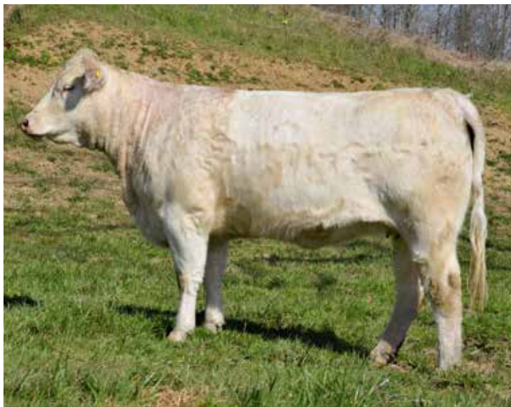
HINSHAW CHANEL H14 SELLS AS LOT 10

Bred A-I on 2/11/22 to WCR Master Chief 0307, M939613, safe in calf on 3/16/22. This thick made, deep, soggy heifer displays tremendous eye-appeal and femininity. A big square rump, wide-topped, with good bone. Chanel ranks in the top 3% for CE and BW EPDs. Master Chief is bred by Wienk, sired by Elders Blackjack out of a good Prime Cut x Kingsbury 116 cow. Huckleberry is also owned by Aces Wild, TX, J/D Cattle, NE, & Lawrence Family, OH.