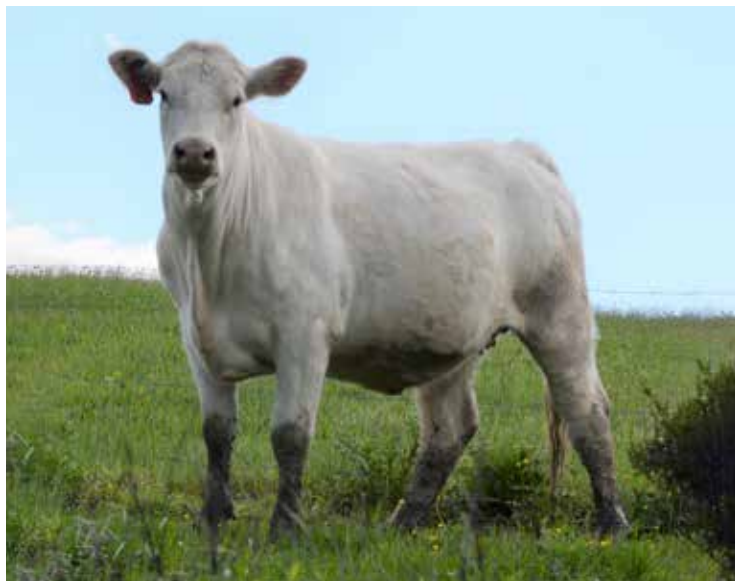
REAVES MOLLY SMOKE 906 SELLS AS LOT 26