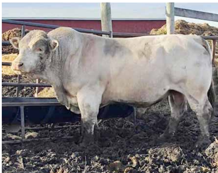
ZH TILLMASTER 101Y SIRE OF LOT 5

Bred A-I on 12/14/21 to TTR-OHF Beyond the Grid; PE from 1/1/21 to 4/15/22 to Faraway Viking. Another top Supreme descendant with a blend of ZH Tillmaster, a full French bull that is one of the most widely used French bull in the world! His sire, Till, is in the background of many Silverstream cattle. A bigger frame heifer with a lot of potential based on her outcross pedigree!