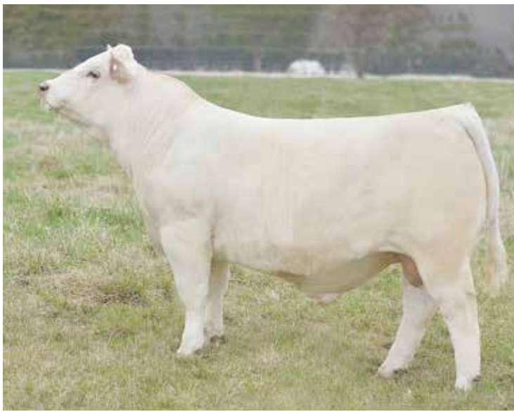
CCC WC RESOURCE 417 P SIRE OF LOT 32