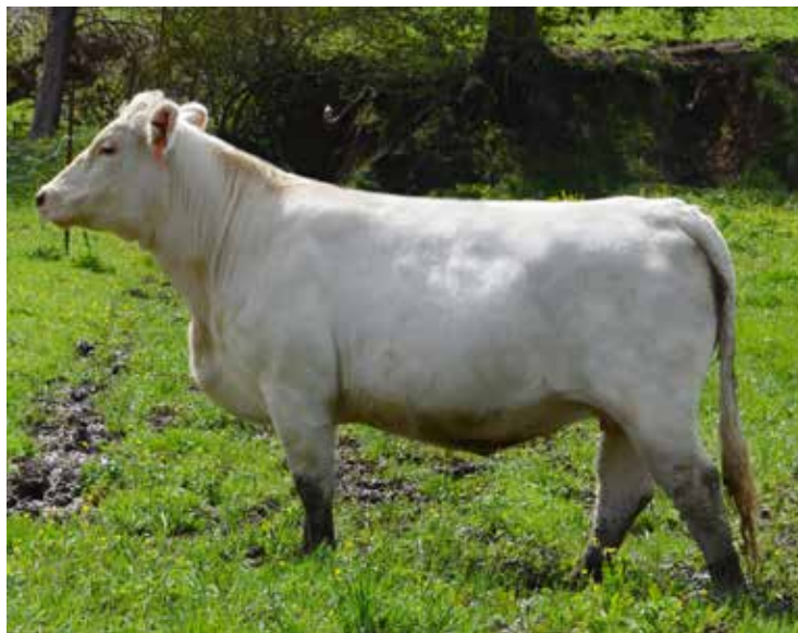
RS MS FARGO F3320 SELLS AS LOT 20