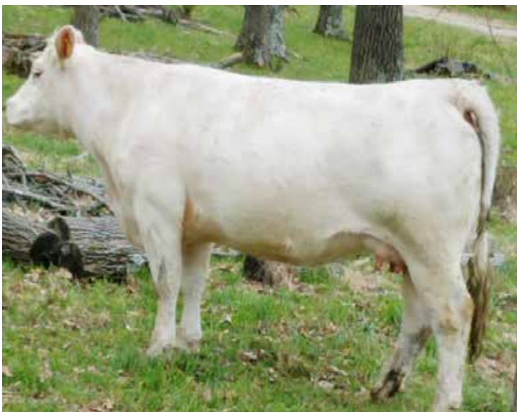
TNT SUPREME OBSIDIAN G1912 P SELLS AS LOT 13

13A: Polled heifer calf # 2123, born 12/6/2021, bw 89, sired by DC/CRJ Tank E108 P. This young pair offers tremendous opportunity, with the Tank hfr excelling in EPDs, top 8% YW, 15% Milk, 20% MTL, 7% CW, and 8% TSI. The 0236 maternal granddam, has 76 calves registered with AICA. She was used in ET programs for M6, Southern Cattle, Faraway, Bush, Double-H, and EJ Shepherd herds! Great performance pedigree here!