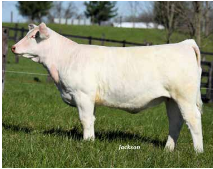
DRUIN KAYCEE D911 SELLS AS LOT 51

Sells Open. This classy, super sharp heifer also has the winning design for the ring and broodcow look. Her depth is superb along with her long-spined feminine features. A big square rump, good bone, and smooth correct structure. Her dam has a great calving interval, 2/17; 4/18; 4/19; 9/20; and 9/21 for added fertility. Talk about genetic power, she traces to Fire Fly, that has produced 77 progenies and 0641, the all-time great one, 323 progenies with AICA! This heifer has a long and illustrious career in Charolais circles!