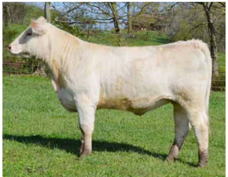
REAVES MS MILESTONE TW 2063 SELLS AS LOT 25

Bred to CAG GARW Gringo 9621G ET, safe in calf. The Miranda U805 was used in Oak Hill Farms, GA, Reaves, TN, M&M Cattle, TN has a daughter, and Cawley Cattle Co., GA has two daughters. The Wind 2074 daughters had perfect udder quality. This long-spined, attractive heifer displays femininity, growth, and style! She started with a light birth wt of only 65 lbs being a twin, but has developed into a fast-growing, high-performance female!