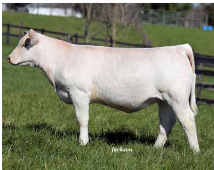
D&K GIGI D115 ET SELLS AS LOT 50