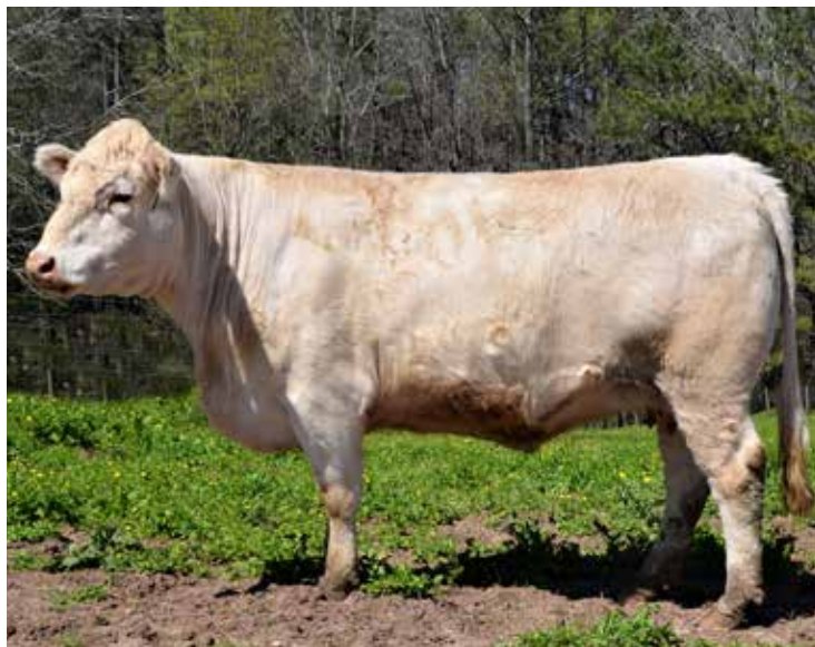
OHF NEW WINDY H831 ET SELLS AS LOT 57