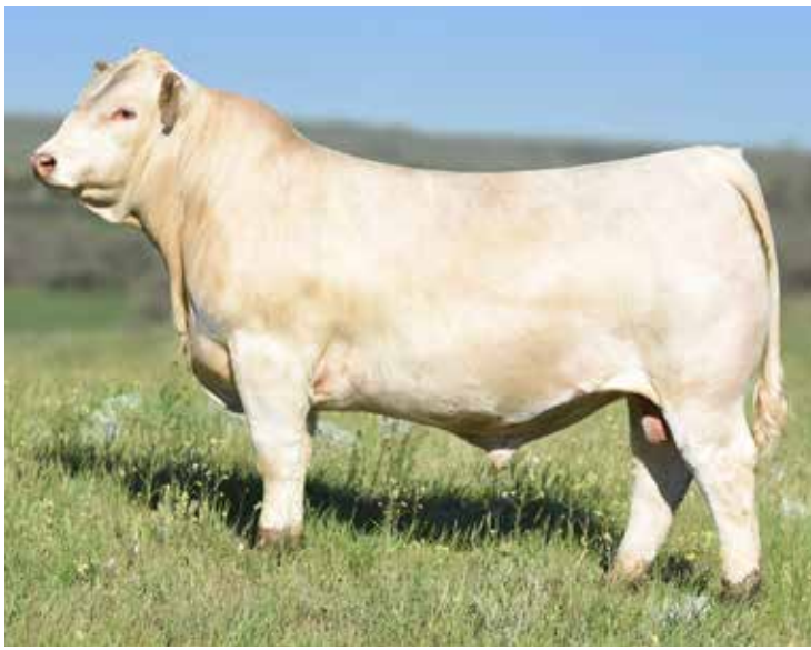
LT AFFINITY 6221 PLD AI SIRE TO LOT 42