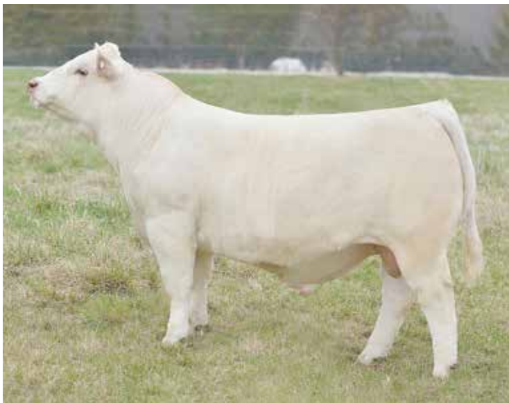
CCC WC RESOURCE 417 P SIRE OF LOT 53

Sells Open. Dam is a 3/4 sister to the dam of Lot 52. 443 has produced 5 calves, 2016, 17, 18, 19, and 2020. 131 ranks in the top 30% for WW, 25% for MTL, and 15% for REA EPDs. 417 has been a very popular sire in the breed with over 2000 calves registered with AICA. New Standard is recognized as one of the good Marbling lines in the breed! This heifer has the genetics to take your herd to a higher level of success!