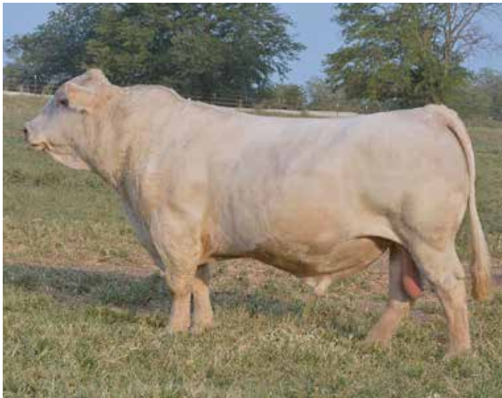
LT RUSHMORE 8060 PLD SIRE OF LOT 33