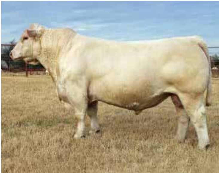
M6 SLAM DUNK 3115 P ET MATERNAL GRANDSIRE OF LOT 56

Sells Open. Great numbers on this top-end heifer. Excels in CE and BW, along with solid EPDs across the board in most all traits. Actual light birth weight of 78 lbs. but exploded to a 696 Weaning weight for 111% ratio. M6 Wind & Water is a TR Mr Fire Water 5792 RET son out of a daughter tracing to M6 761 Nancy 6100! Lots of pedigree in this young prospect!