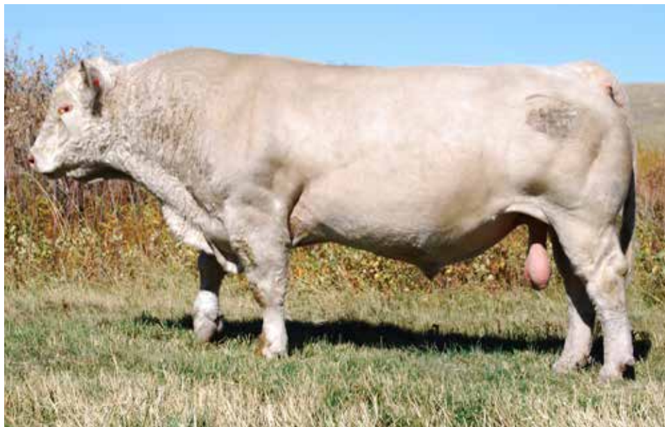
BHD COBALT S553 MATERNAL GRANDSIRE OF LOT 70