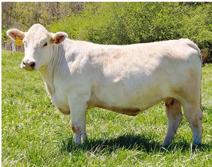
MC MISS DOLLY 161 SELLS AS LOT 46

46A: Pld heifer calf # 191, born 9/1/21, bw 83, sired by WC Marshall Tucker 894. PE to WC Genesis 032, safe in calf. Hank is a former AICA Trait Leader as his sire, Oakdale Duke, a Milk Trait Leader. EPDs rank this female in the top 35% WW, 25% YW, and very good Marb at 15% with a TSI ranking of top 20%. Dolly displays a very feminine appearance, long bodied frame, excellent teat color, and a sharp heifer calf to display her ability!