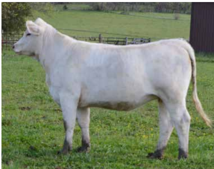
REAVES MS FRONIE 2067 SELLS AS LOT 19