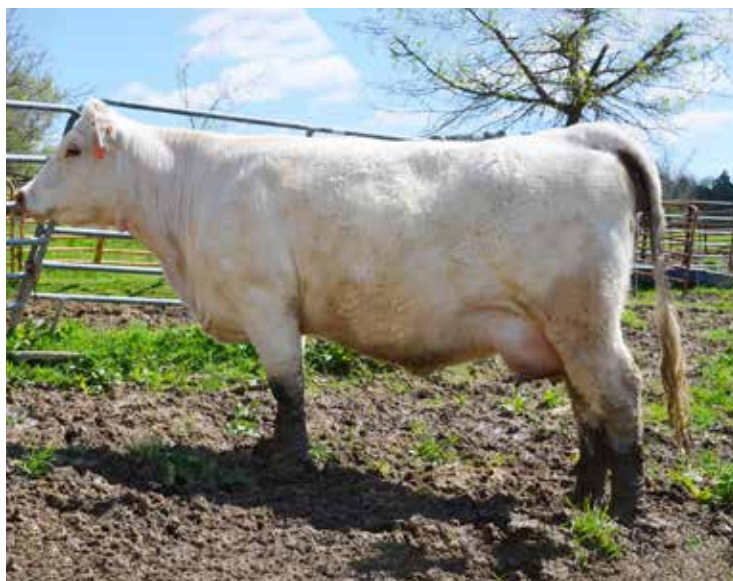
REAVES MS NANCY RESOURCE 2017 SELLS AS LOT 21

Sells bred to M6 Law & Order 577 for a fall 2022 calf. Another great Fargo daughter that is making a super young broodcow. Her EPDs rank in top 7% WW, 2% YW, 25% Milk, 9% MTL, 5% SC, 1% CW, 6% REA, and 3% TSI for the breed. One of the great descendants of the legendary JWK Vanessa D029. Another great pedigree with impeccable credentials, numbers, bloodlines, broody, deep bodied cow, with a strong top and correctness.