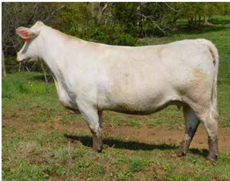
OHF VANESSA G825 ET SELLS AS LOT 18