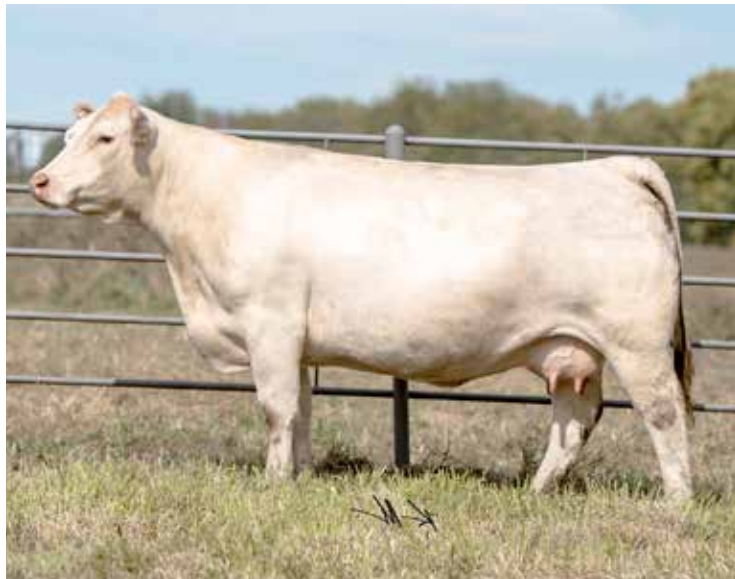
WC CLARICE 2214 P ET DONOR DAM OF LOT 66 EMBRYOS