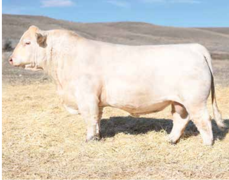
LT AUTHORITY 7229 PLD SIRE OF LOT 52

Sells Open. Her sire, Authority has produced several sale toppers in the breed. A son of Authority, LT Badge 9184 produced the record setting $225,000 LT Governor 1560 bull in the 2022 LT Bull sale. Benelli bloodline has been solid for practical and productive Charolais. 532 has produced 4 calves, 2017, 2018, 2019, & 2020 to insure good fertility in this line.