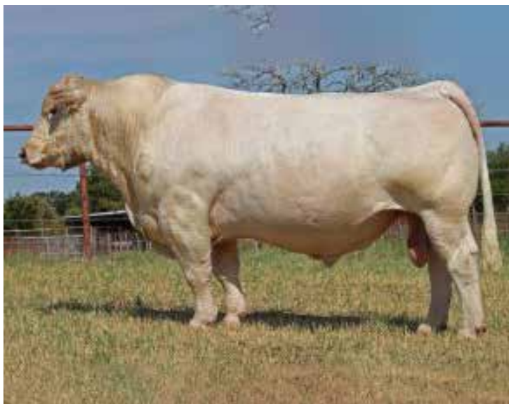
M6 COOL REP 8108 ET SIRE OF LOT 47

47A: Pld heifer calf # 213, born 12/6/21, sired by WCR Sir Countyline 551 P, M862741. PE from 2/20/22 to 3/16/22 to SF Samson 723P, M905556. PE from 4/6/22 to 5/21/22 to SF Sir Amos 016 P, M950828. Cool Rep is considered one of the best performance sires in the breed with a major influence on the breed! 617 has produced 16 calves, her dam 223 has 9 calves, and following the built-in fertility, 1625 has 4 calves!