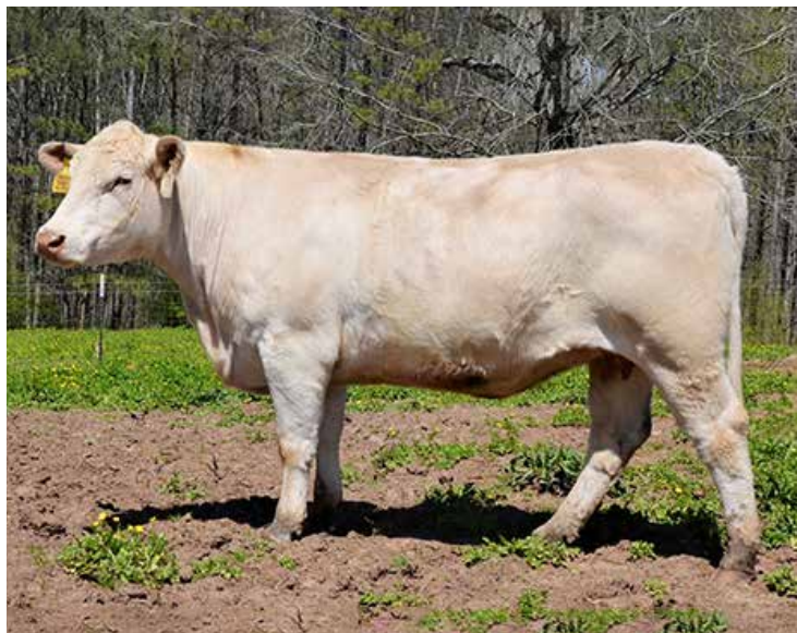
BARA MS MAX CIGAR 58F P SELLS AS LOT 64

Sells bred to Welcome Grove Rave 1824 ET, EM914413. Due: 9/17/22 Dam was bred in the Mississippi State University herd. She produced 8 natural calves, 9/10, 10/11, 10/12, 10/13, 11/14, 1/16, 10/18, and 12/19. She has daughters in the Spurlock Ranch, AR, and 2 in the Sweet herd, TX. Duke 815 sired some powerful broodcows, great udders, and excellent confirmation. 309 was in Southern Cattle's ET program.