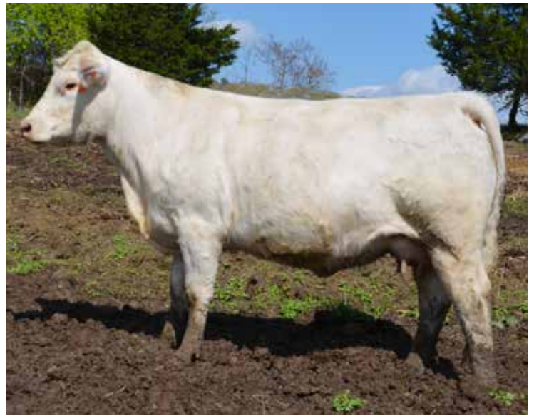
REAVES FRESH DAISEY 900 SELLS AS LOT 23

23A: Bull calf born 3/10/22 sired by M6 Law & Order 577. Another top pedigree on this super female! A quality udder enhances her value with her deep side, femininity, and good bone on a strong, sound frame. The 706 donor cow produced lots of high sellers, including a National sale consignment. She has 29 calves, mostly for Bamboo Farms. 906 had 8 calves for Stormie Acres, including a herdsire for Heath Hyde, TX.