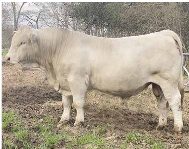
B&B MR HOT SHOT 2102 SELLS AS LOT 2

Selling Full Interest and Full Possession, Fertility & Trich Tested. Long-bodied, stout bull out of the $165,000 high selling Canadian bull, Sparrows Braxton 519C. Braxton has proved to be a great calving ease sire with superb growth and abundant eye-appeal. His daughters have some of the best designed udders in the breed. His dam is the fabulous D3116 Donor cow that sold for $9750 in the 2020 Sale of Excellence and her dam, JDJ Ms Cigar B2011 is proving to be one of the great matrons of the breed! A "Pick of DeBryucker Herd" in 2019.