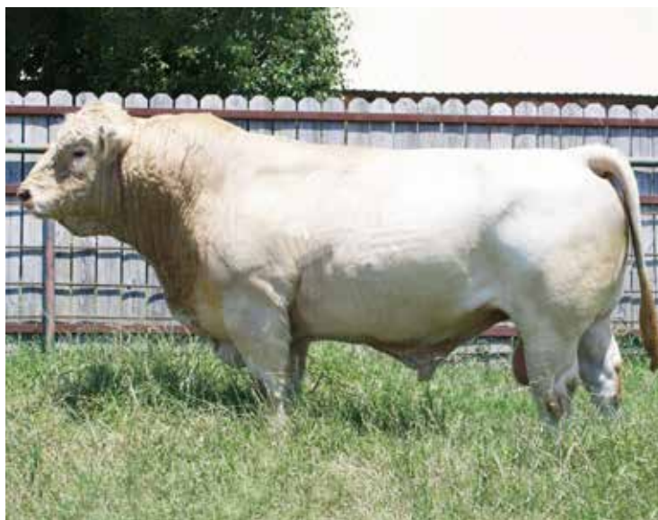
DCF RELENTLESS 8577 P SIRE OF LOT 15