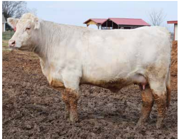
JDJ MS KINCSEM D3116 DONOR DAM OF LOT 30 EMBRYOS

Selling 3-Embryos from mating of Sparrows Braxton 519C x JDJ Ms Kincsem D3116. Full sib to Lot 1 bull in the sale. D3116 has a beautiful udder quality and was the top selling bred heifer in a previous Sale of Excellence at $9750.00. Her dam, a Pick of DeBruycker Herd, has been a power producer, JDJ Ms Cigar B2011. Her offspring continues to dominate sales with super quality offspring. Braxton is well known in Canada for his superior daughters and great milking ability.