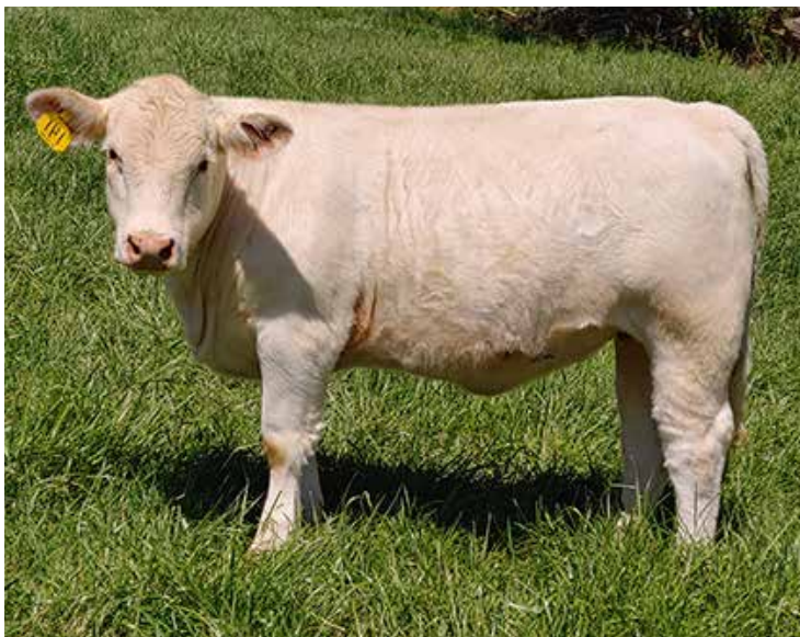
WC BETH DUTTON 141 SELLS AS LOT 44