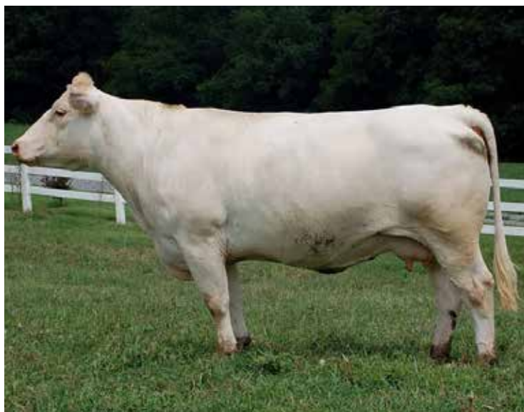
MCF LADY GI DUKE 5003 P ET DAM OF LOT 27