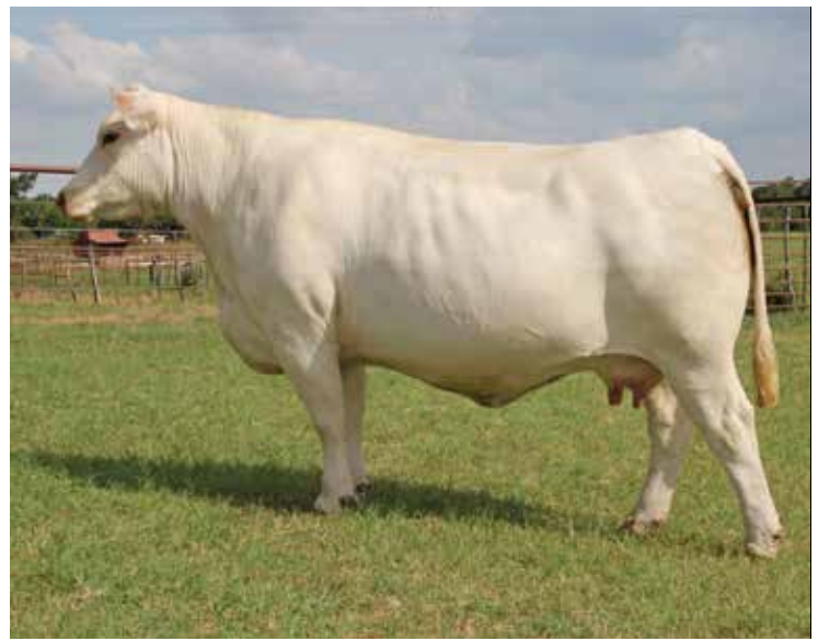
M6 COOL GERMAINE 1145 P ET DONOR DAM OF LOT 29 EMBRYOS