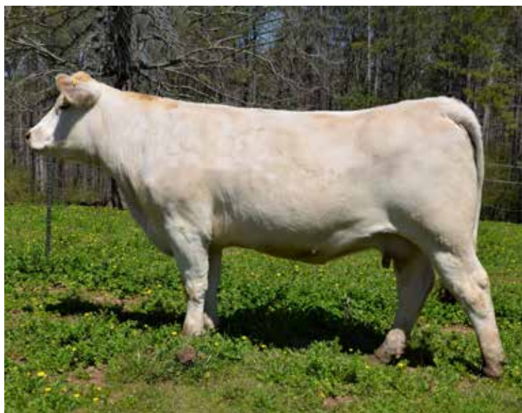
CMF 94E WINDY 128G SELLS AS LOT 62