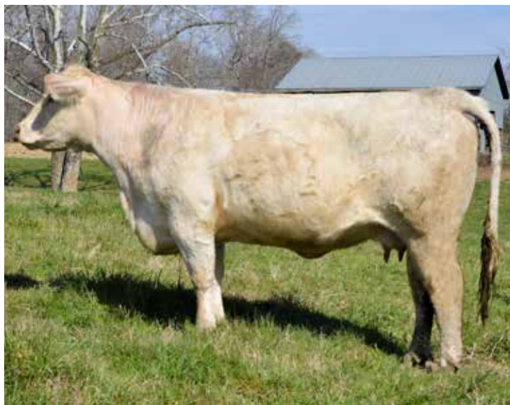
CCF MISS ALLISON 1928 SELLS AS LOT 6

6A: Pld Heifer calf # 2118, born 9/12/21, BW 94, sired by LT Patriot 4004 Pld. Bred A-I on 4/1/22 to GHC Regan 9012. A magnificent broodcow, udder quality, good size, long-bodied, very feminine, with superb growth and performance. An extra sharp heifer calf at side will be make a great addition to any herd. Allison ranks in the top 9% for CE, 20% BW, 15% for both WW and YW, top 9% CW, 15% REA, and 8% TSI for EPD rankings!