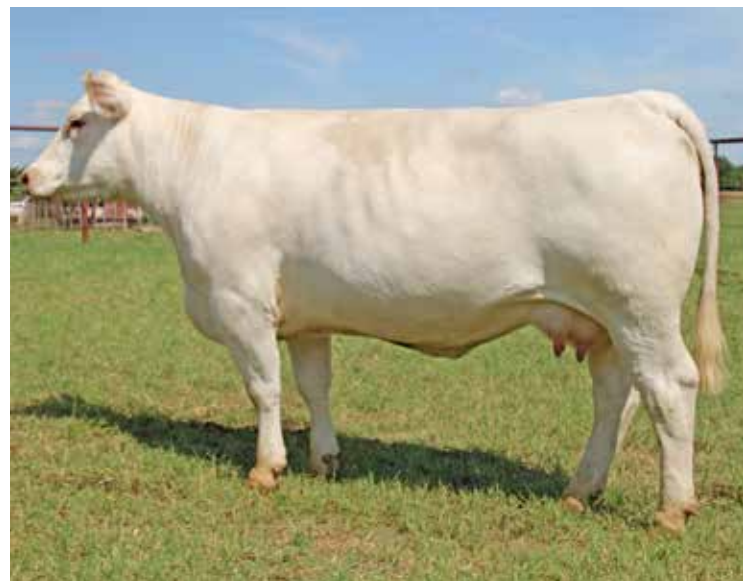
M6 MS NEW NANCY 277 P ET DONOR DAM OF LOT 31 EMBRYOS

Selling 3-Embryos from mating of LHD Cigar E46 x M6 MS New Nancy 277 P ET. Nancy has been a workhorse of production ability. These eggs will be highly valuable to continue a tradition of some of the best genetics ever in the Charolais Breed! Cigar daughters continue to be some of the most valuable in terms of production and selling values. 277 one of the greatest daughters of M6 Ms 761 Nancy 6100 P ET. You will have solid pedigree to work with on a potential herdsire or donor cow from this mating!