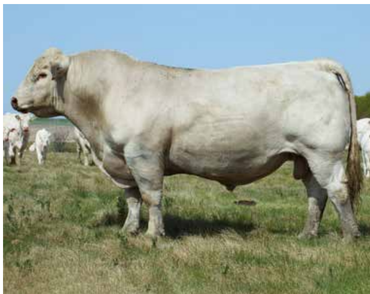
WCF MR SILVER GUN 467 SIRE OF LOT 65

Sells bred to Welcome Grove Rave 1824 ET, EM914413. Due: 11/14/22. Looking for a Pinnacle EPD cow? Here she is! She ranks in the top 1% for WW and YW, 15% Milk, 1% MTL, 2% SC, 1% for CW and REA and 1% TSI! She isn't bad for CE and BW either, being in the 25% and 30% range. Being a young female, she has lots to offer in the future! Do you have a bull to meet up to her high-level status?