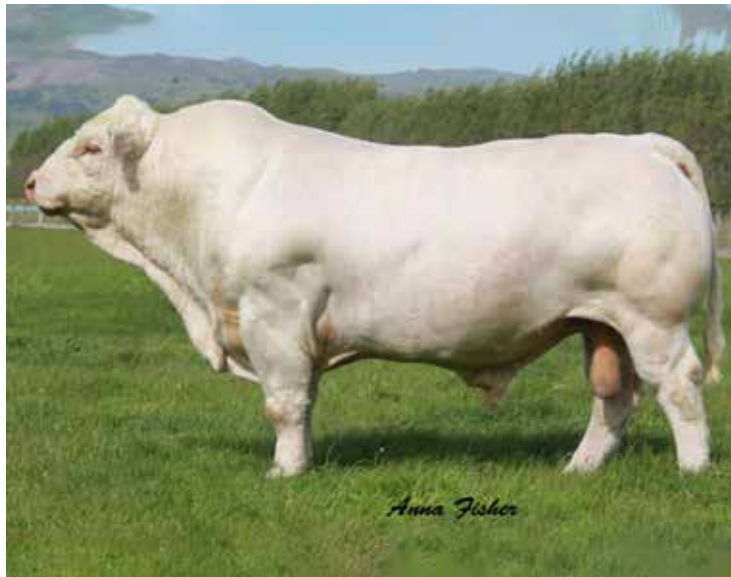
SILVERSTREAM EVOLUTION A-I SIRE OF LOT 4

Bred A-I on 12/14/21 to Silverstream Evolution; PE from 1/1/22 to 4/15/22 to Faraway Viking, EM935058 A very moderate, early maturing female, tracing to Grid Maker five times in her pedigree. She is Homozygous Polled for added value! We're retaining her first calf, an Akaushi bull to use in our program. Her granddam was National Reserve Division Champion twice, Res Grand in Kansas City 2007, and raised 9 calves.