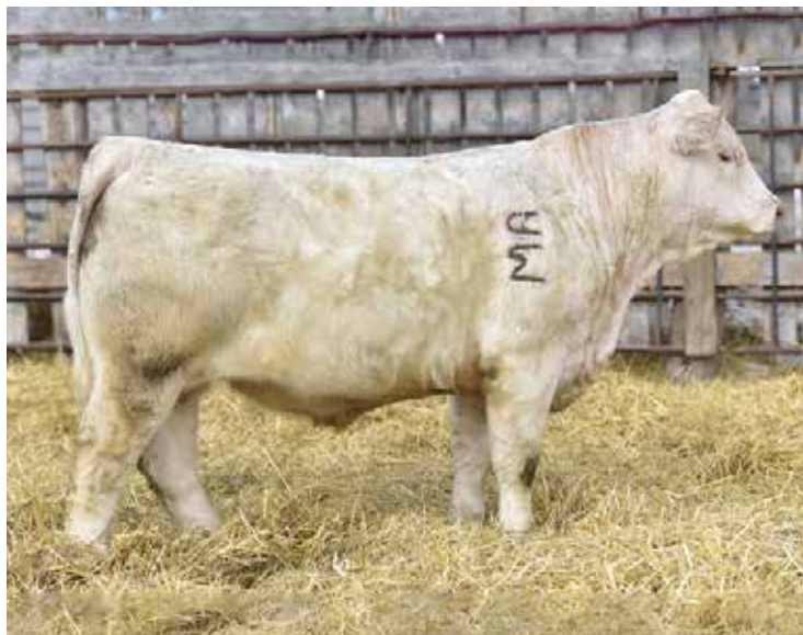
WCR SIR COUNTYLINE 551 P SIRE OF LOT 48