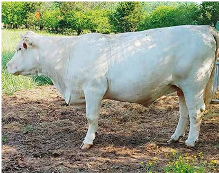
WC GENEVIEVE 423P SELLS AS LOT 45

45A: Pld heifer calf # 192, born 9/2/21, bw 77, sired by WC Marshall Tucker 894, M924441. Marshall is a President son out of Lady GaGa. PE to WC Genesis 032, M954826, safe in calf. Genesis is a Silverstream Evolution son out of a superb daughter! Another great Miley descendant with top 20% ranking in WW and YW Growth EPDs. Resource Z365 is a maternal sib to JDJ Ms Cigar B2011, one of the all-time great ones!