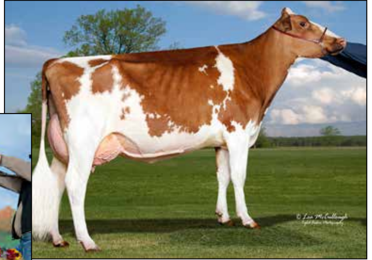
LUCK-E LADD JUBILEE-RED-ET EX-93 EEEEE 2E 2ND DAM OF LOT 19