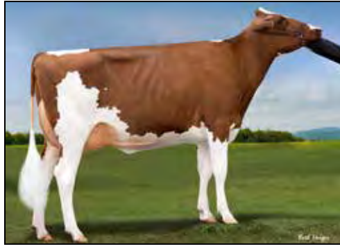
GREENLEA AD AVERY-RED-ET EX-90 MATERNAL SISTER TO LOT 12