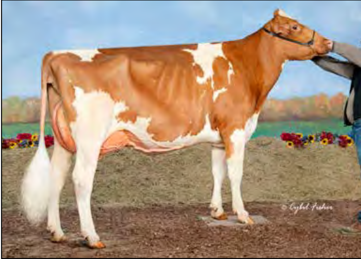
LUCK-E AWESOME JOY-RED-ET EX-92 EX-MS DAM OF LOT 19