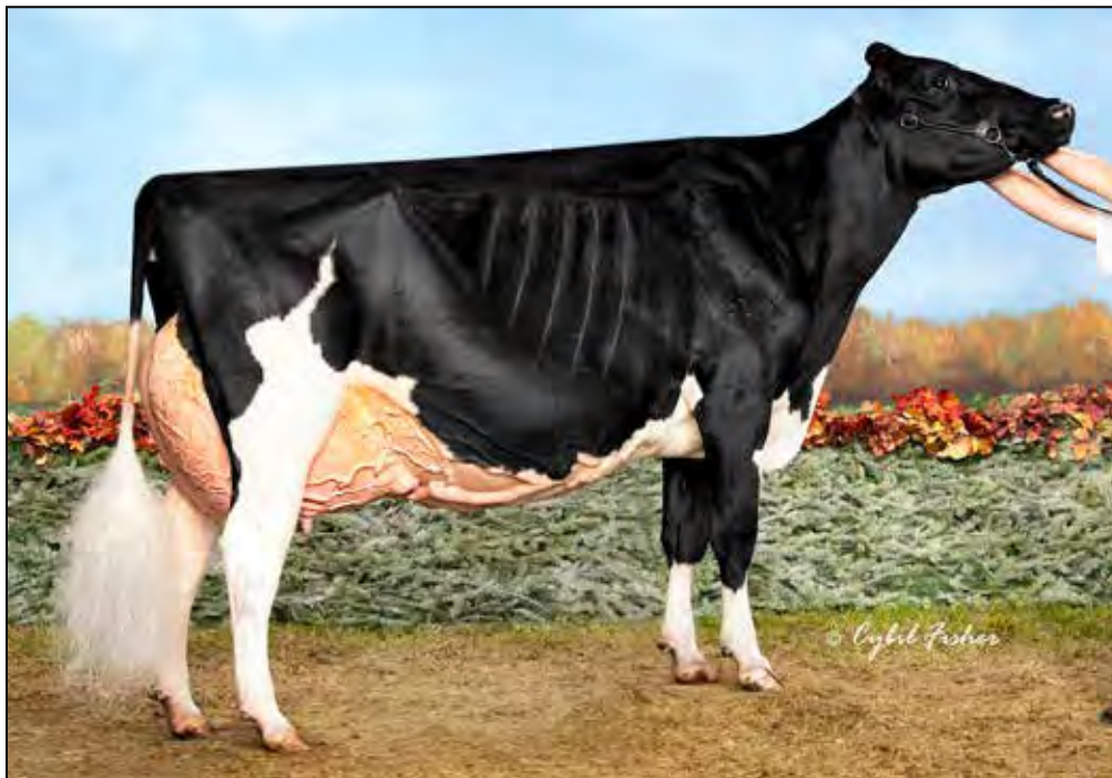
ROSIERS BLEXY GOLDWYN 3E-97 4TH DAM OF LOT 18