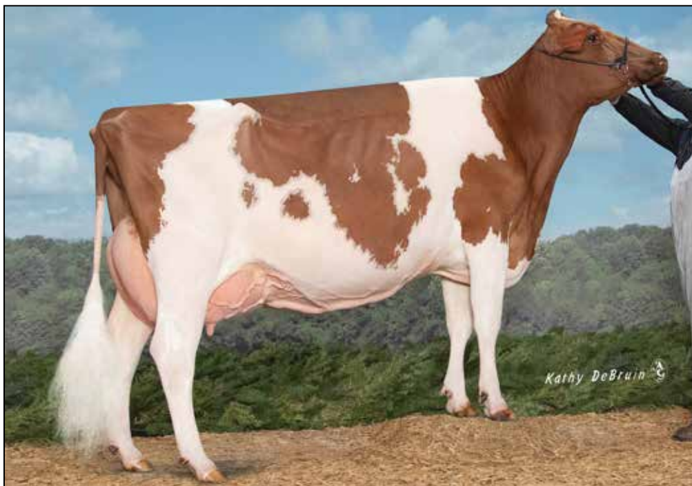
MISS DISARONNO-RED EX-94 EEEEE 2E DAM OF LOT 37