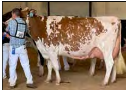
JUSTA-BEAUTY JOANNAH-RED EX-94 95-MS DAM OF LOT 22

LYNNCREST HOLSTEINS C/O CHAD HORST 717-269-2925