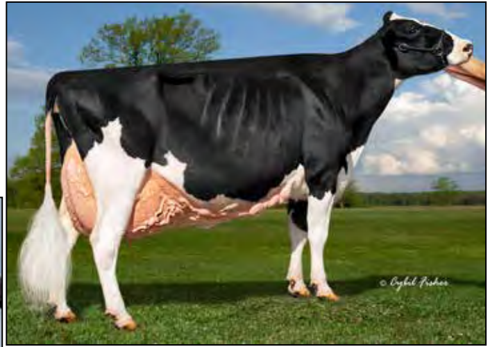
BLONDIN GOLDWYN SUBLIMINAL-ETS EX-97 EEEEE 4E 2ND DAM OF LOT 17