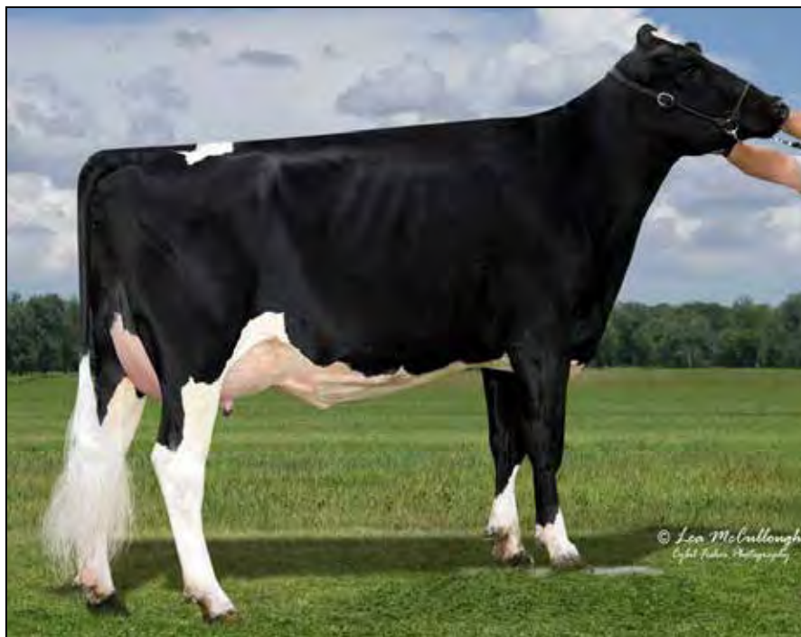
MS PINELAND FORTUNE TELLER EX-90 EX-MS 4TH DAM OF LOT 30