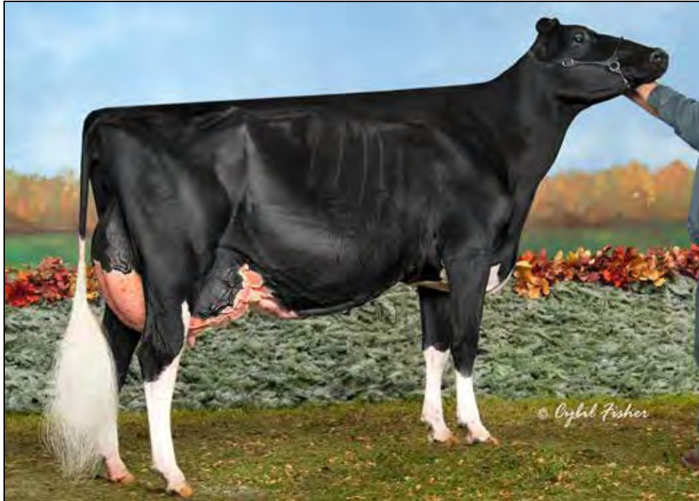
PORPO GOLDWYN BARBY-ET EX-94 EEEEE DAM OF LOT 31