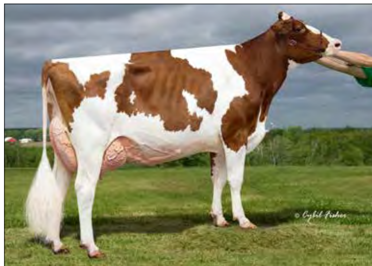
MILKSOURCE LVRG TINA-RED-ET EX-90 EX-MS DAM OF LOT 20