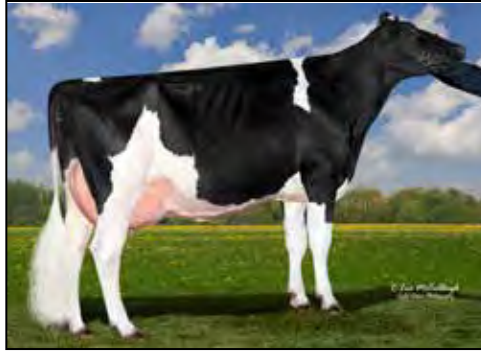
MS CURR-VALE HONEYNUT-ET EX-92 EX-MS 2E 2ND DAM OF LOT 38