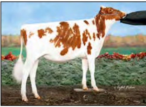
KITCH-VUE D PRIMROSE-RED-ET VG-87 EX-MS DAM OF LOT 29