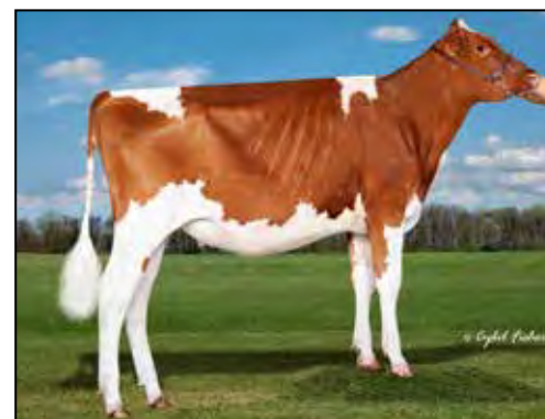
CANTATA WARRIOR TANZANIA-RED-ET MATERNAL SISTER TO LOT 20