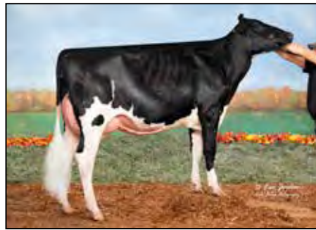
LANDIS-MRK JACOBY DILLY-D EX-90 EX-MS DAM OF LOT 23 & MATERNAL SISTER TO LOTS 24-26