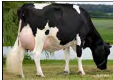
LYLEHAVEN CRISSY-ET EX-94 EEEEE 2E GMD DOM 4TH DAM OF LOT 39 & 40