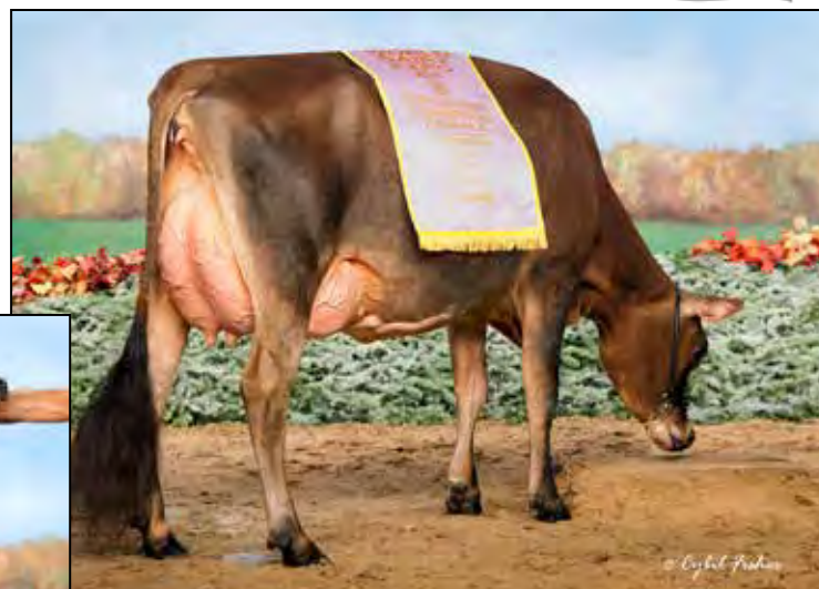
DESPRESVERTS JOEL GLAMOUR-ET EX-91 DAM OF LOT 11