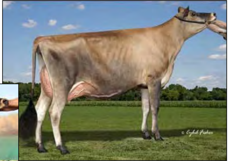
HEART&SOUL FIZZ FAITH EX-91 MATERNAL SISTER TO LOT 10