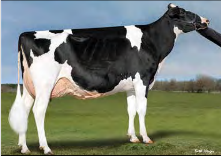
BUDJON-VAIL AW SARA JEAN-ET EX-90 EX-MS DAM OF LOT 17