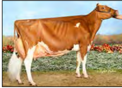
ROSEDALE LUCKY-ROSE-RED EX-94 EEEEE 2E 3RD DAM OF LOT 21