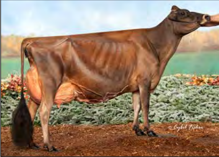
MB LUCKY LADY FELIZ NAVIDAD-ET EX-93 MATERNAL SISTER TO DAM OF LOT 10