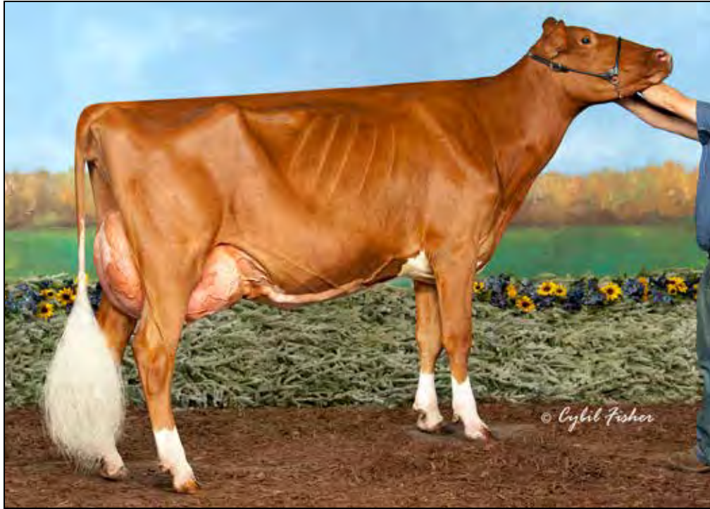
VALE-HIGH D PRINCE 5013-RED EX-91 EX-MS 2ND DAM OF LOT 34