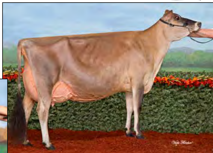
EDGELEA GENTRY SHARON VG-89 MATERNAL SISTER TO LOTS 8 & 9