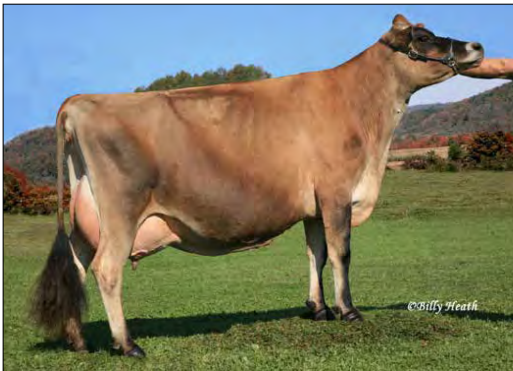
MID-DEL NATE MAMIE EX-94 6TH DAM OF LOT 37