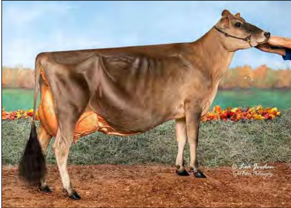
STONEY POINT COMERICA KATHIE EX-94 DAM OF LOT 7