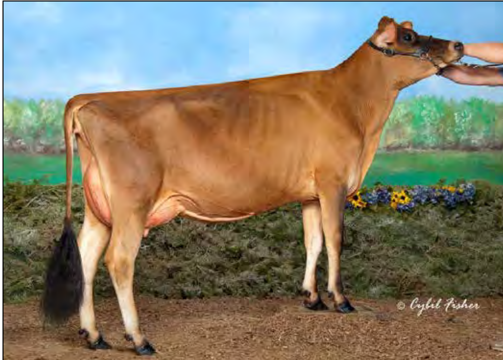
KLINEDELL H GUN PALINE EX-95 MATERNAL SISTER TO DAM OF LOT 36