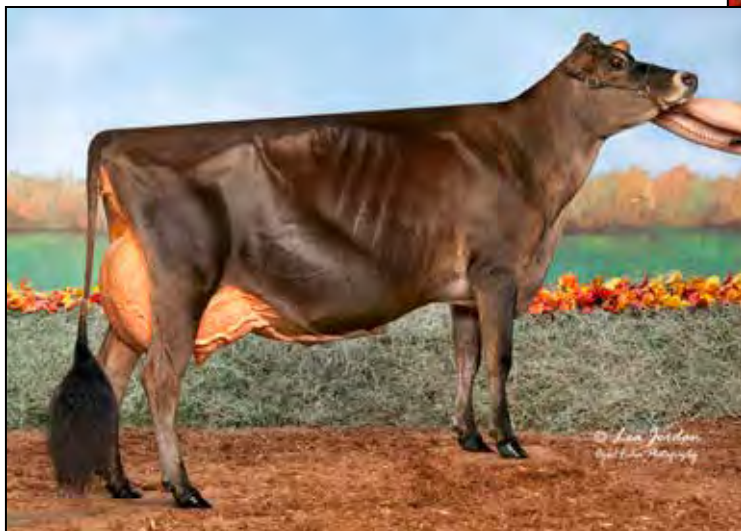
EDGELEA TEQUILA SHERATON EX-93 DAM OF LOTS 8 & 9