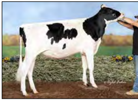
DJ-PUREPRIDE ABSOL PRIME-ET VG-87 VG-MS 2ND DAM OF LOTS 27-29