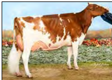
MS-AOL CNTNDR REVIVE-RED-ET EX-94 MATERNAL SISTER TO LOT 13