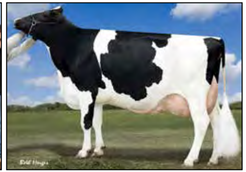
HILROSE RUBENS PATSY EX-93 EEEEE 3E GMD 4TH DAM OF LOTS 27-29