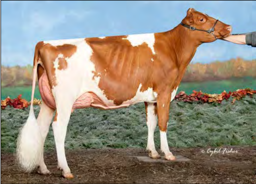
MS RANSOM-RAIL BETH-RED-ET EX-91 EX-MS DAM OF LOT 4