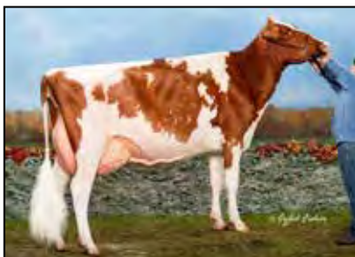
GREENLANE DESTRY LAUREL-RED EX-93-CAN 93-MS MATERNAL SISTER TO 2ND DAM OF LOT 32