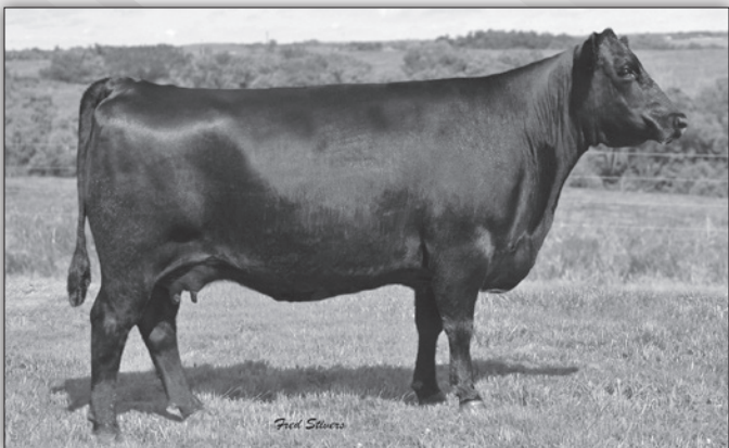
TC Marcia 1069 – 3rd Generation dam of Lot 14.

Exposed to Trowbridge Finn 806. Due 7/15/22.