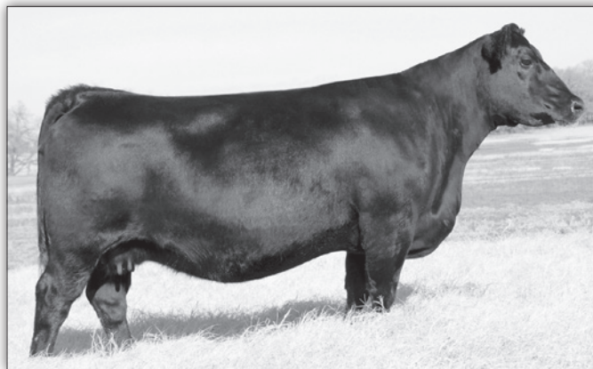
EF Rita 9052 — Dam of Lot 37.