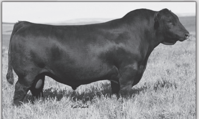
Ellingson Chaps 4095 – Sire of Lot 12.

Here is an excellent female that is high calving, low birth and a tremendous spread to Weaning and Yearling Weights. She ranks in the top 1% for claw and has an excellent pedigree as she is sired by the popular Ellingson Chaps 4095 and stems back to a tremendous Elba cow family. All bred to Yon Top Cut 6730 and Pasture Exposed to Baldridge Glacier G1083.