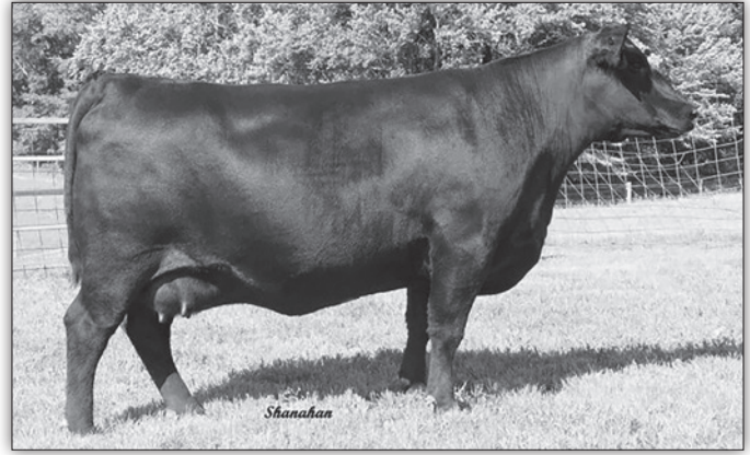
Frosty Elba Lizzy 564 — Dam of Lot 31.