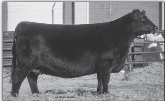
Quaker Hill Erianna 8T2 – Third generation dam of Lot 47 embryos.

Selling 3 embryos out of this excellent Blackcap donor sired by EWA Peyton. You are going to have some high numbered, high quality calves that will catch anyone's attention. Great opportunity here. Embryos are located at Genetic Visions in Pennsylvania.