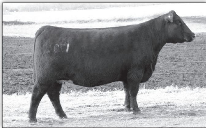
CHF 3784 Rita 1706 — Donor dam of Lot 50 embryos.