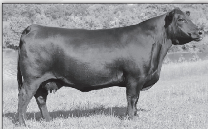
Riverbend Blackcap S762 — Granddam of Lot 38.

Tremendous female that stems back to an excellent Blackcap family as you can see her granddam pictured below. On top of that she is sired by one of the great Pathfinders the breed has to offer, Deer Valley All In. This is a high calving female that is excellent in terms of her growth EPDs and top notch when it comes to her $Values and Marbling. We have retained her 2021 bull calf for herd use. Bred to Veracious on 11/27/21. Examined safe. Due 9/5/22