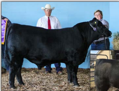
C&C Farms Conversation Chaz – His semen sells as Lot 51.

FIRST-CLASS U.S. POSTAGE PAID St. Joseph, MO Permit #2017