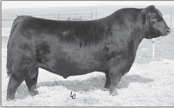
RB Tour of Duty 177 – Paternal grandsire of Lots 7 – 11.