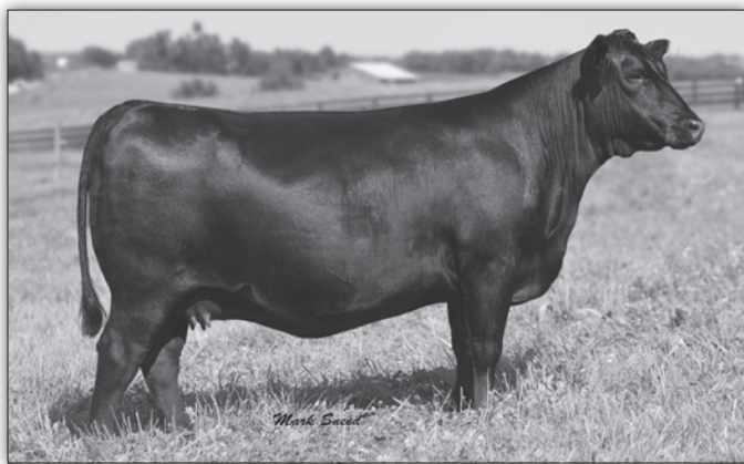
Boyd Abigale 4152 — Donor dam of Lots 48 and 49 embryos.