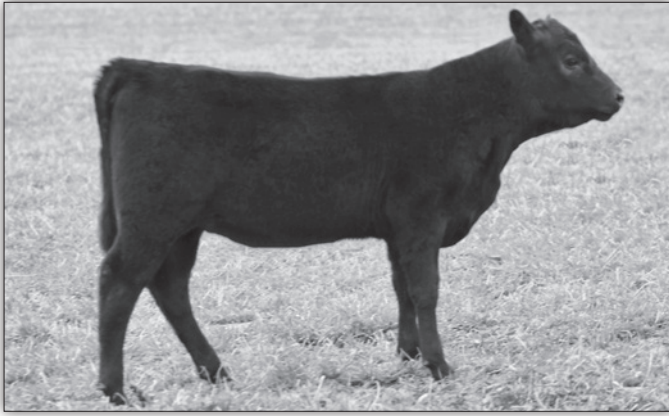
GLC AA Clarity 818 210 — Sells as Lot 1.