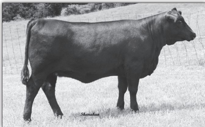
Trowbridge Blackcap 5106 – Granddam of Lot 13.