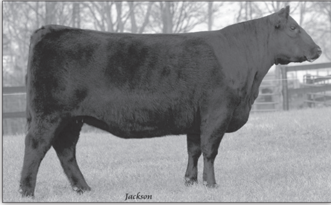
EXAR Henrietta Pride 5162 – Granddam of Lot 45A and 45B embryos.