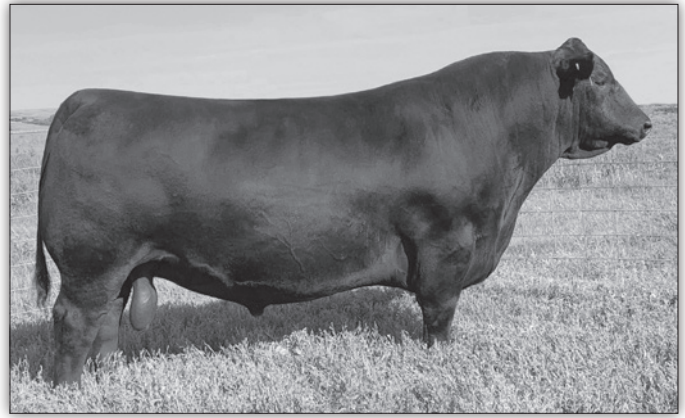
SAV Raindance 6848— Sire of Lot 43.

A great young herd prospect that is sired by MOGCK Entice and stems back to the immortal Shadoe cow family that has done great things for many breeders across the country, specifically the Champion Hill and Gambles program.