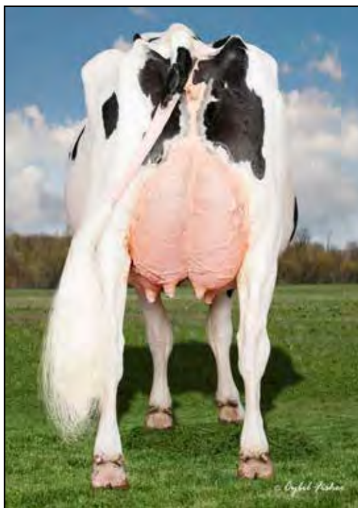
KINGS-RANSOM MONTRY CANS-ET EX-94 97-MS FULL SISTER TO LOT 55