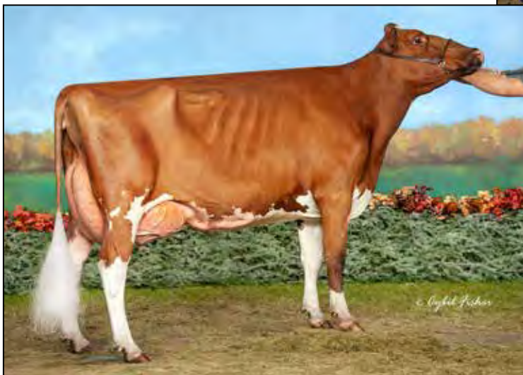
MS TREEHAYVEN SECRET-RED-ET EX-91 SAME FAMILY AS LOT 83-85