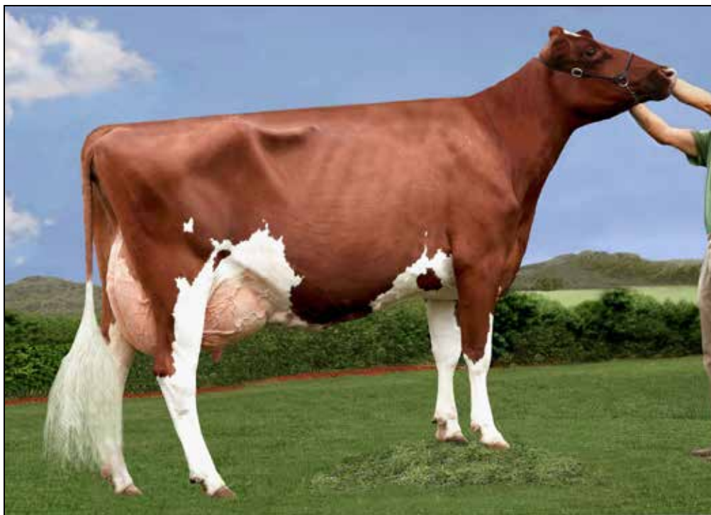
GREENLEA MINDY-RED EX-94 EEEEE 2E 3RD DAM OF LOT 128