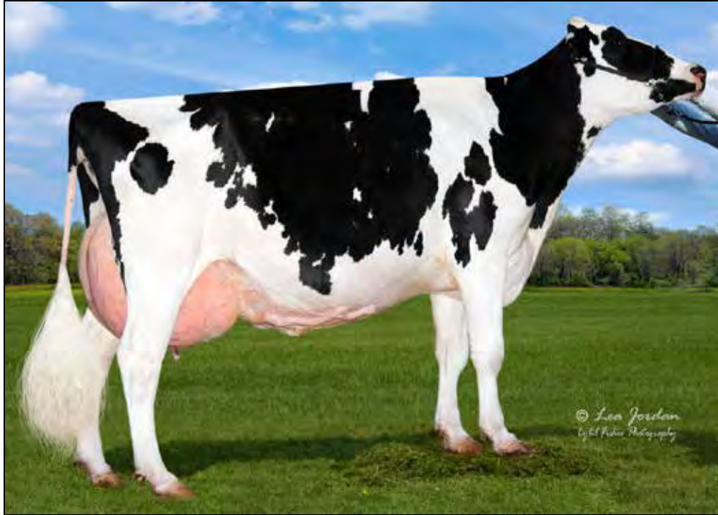
KULP-DALE BRAXTON EXPLODE EX-94 EEEEE DAM OF LOT 106