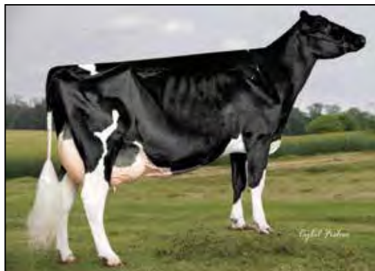
SAVAGE-LEIGH LICORICE-ET EX-92 GMD DOM 4TH DAM OF LOT 116