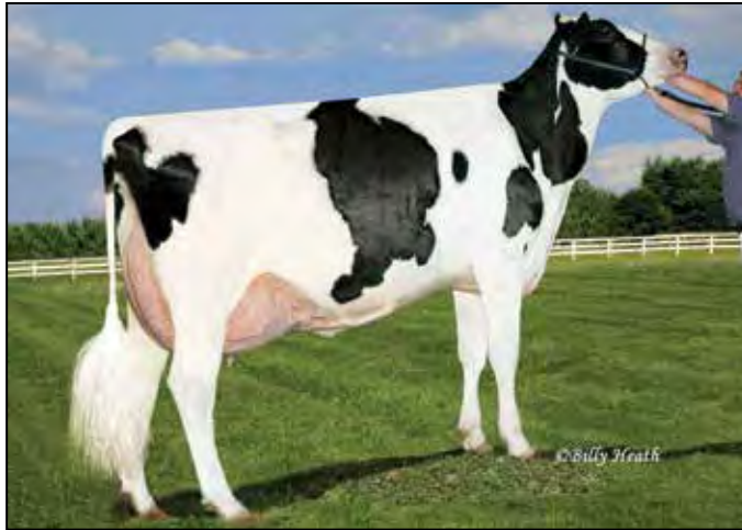
ASTRAHOE RALEIGH LEE ROBUST EX-94 2E 4TH DAM OF LOT 51