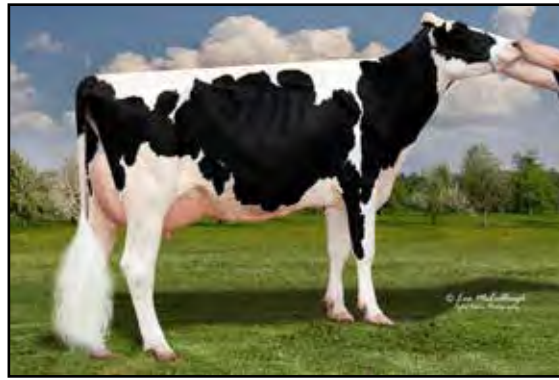
VISION-GEN SHF AS D12158-ET 2E-94 DAM OF LOT 36