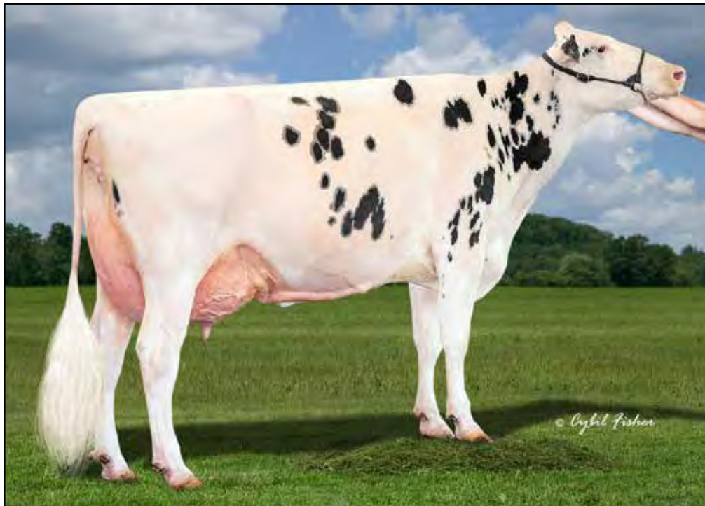
KINGS-RANSOM KB CUPID-ET EX-94 FULL SISTER TO DAM OF LOT 61