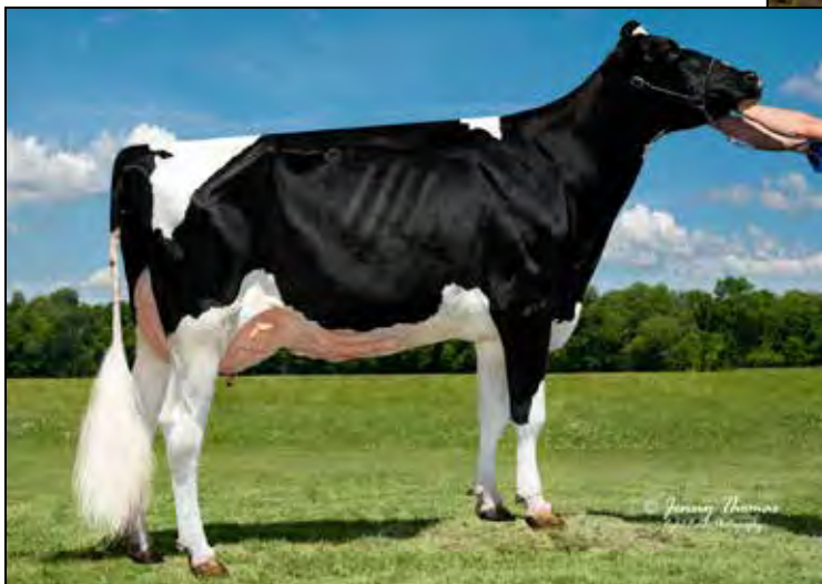
LIN-RO GOLDSUN COARA-ET 2E-92 MATERNAL SISTER TO LOT 23