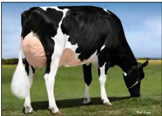
GOLDEN-ROSE RASBERRY-ET EX-91 EX-MS FULL SISTER TO DAM OF LOT 41