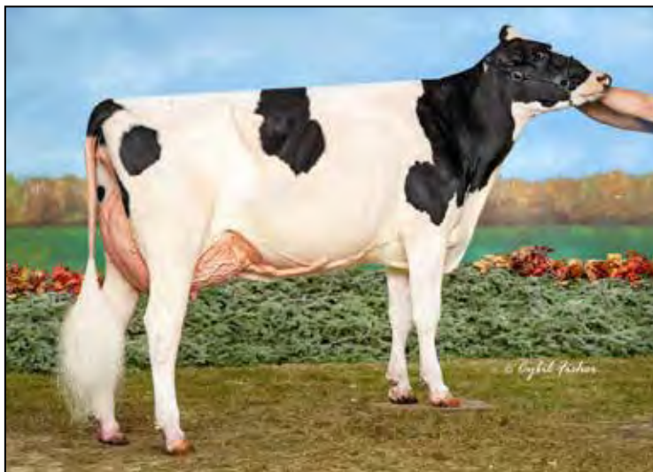
KINGS-RANSOM DOC CLEVER-ET EX-92 MATERNAL SISTER TO LOT 53 & 54