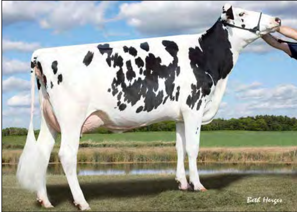
MS ROCKHOME BAXTER LUCKY-ET VG-87 VG-MS 3RD DAM OF LOT 127