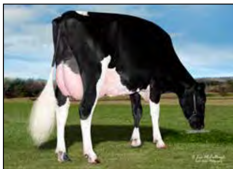
GOLDEN-ROSE ATWOOD RITZI EX-93 EEEEE 2E GMD 2ND DAM OF LOT 41