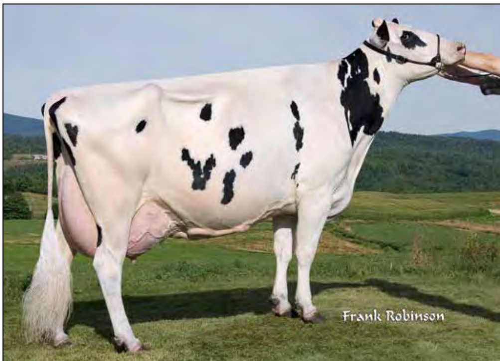
BRIGEEEN CONVINCER RHONDA EX-95 GMD DOM 4TH DAM OF LOT 68