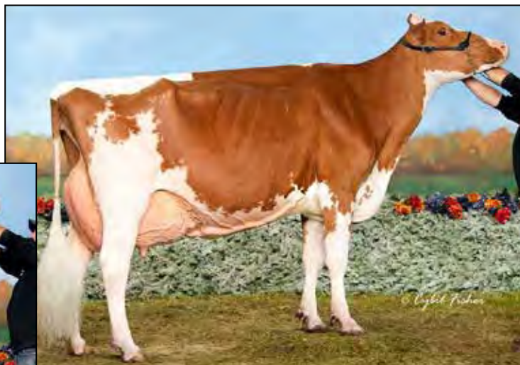
RIDGEDALE RUNWAY-RED-ET EX-95 MATERNAL SISTER TO 2ND DAM OF LOT 63