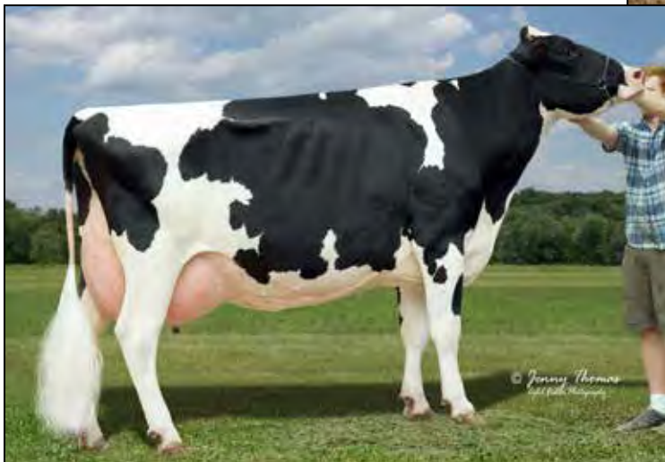
GOLDEN-OAKS DUR RAE2-ET EX-94 EEEEE 2ND DAM OF LOT 76