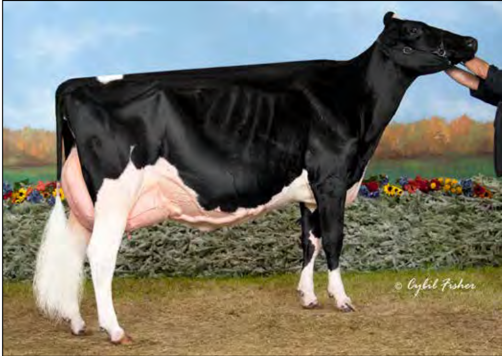
CRAIGCREST RUBIES GOLD REJOICE EX-94 EEEEE 2ND DAM OF LOT 87