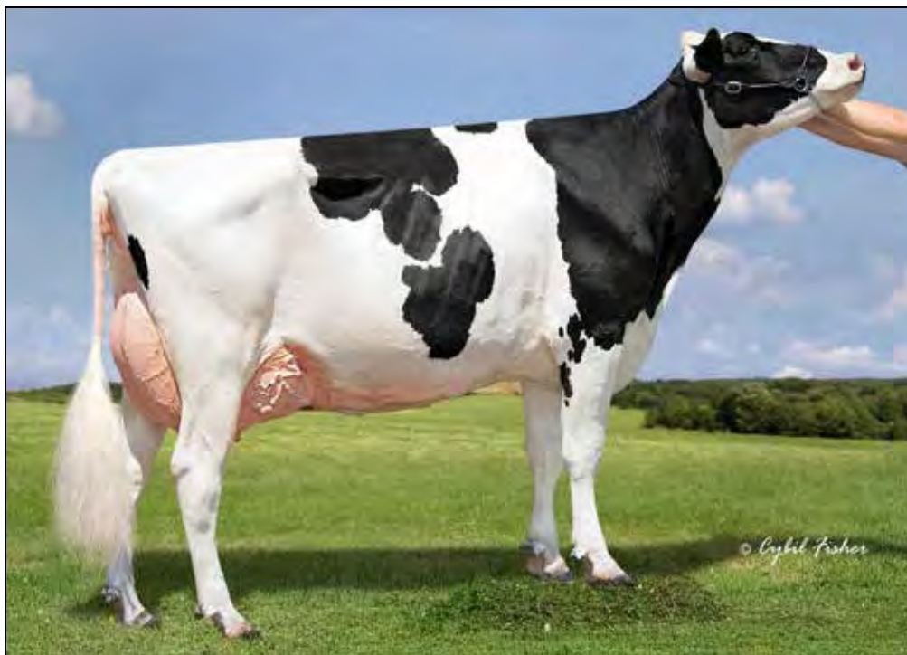
KINGS-RANSOM KROY CLIMAX-ET EX-94 97-MS MATERNAL SISTER TO DAM OF LOTS 56 & 57