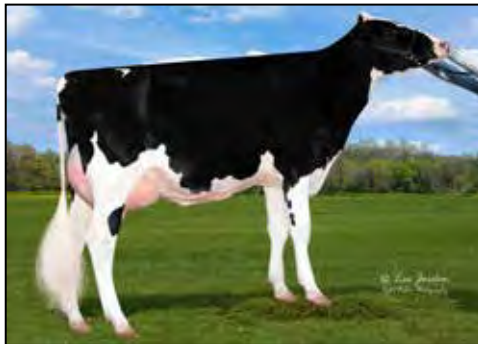
LIN-RO CROWN-P MITZI EX-90 EX-MS DAM OF LOT 48