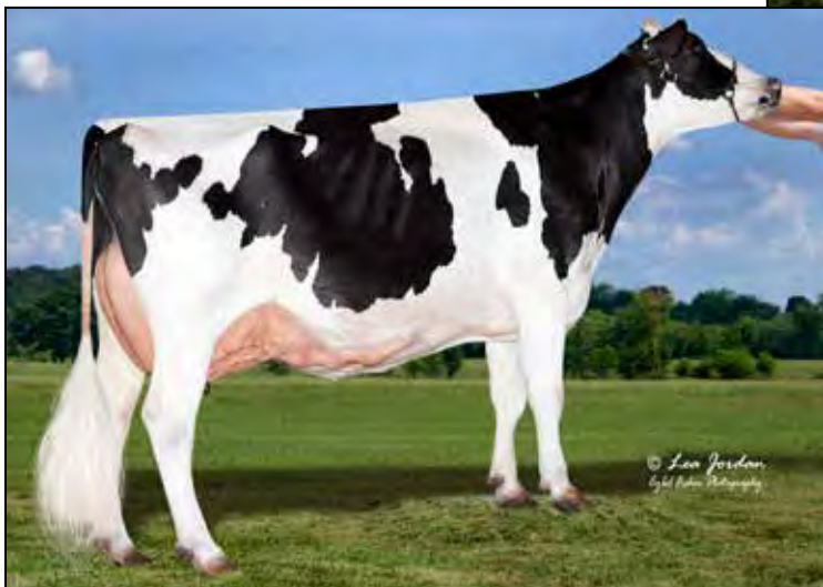
LIN-RO REDBURST HALLY-ET EX-94 EX-MS 2E *RC 2ND DAM OF LOT 1 & 3RD DAM OF LOT 2