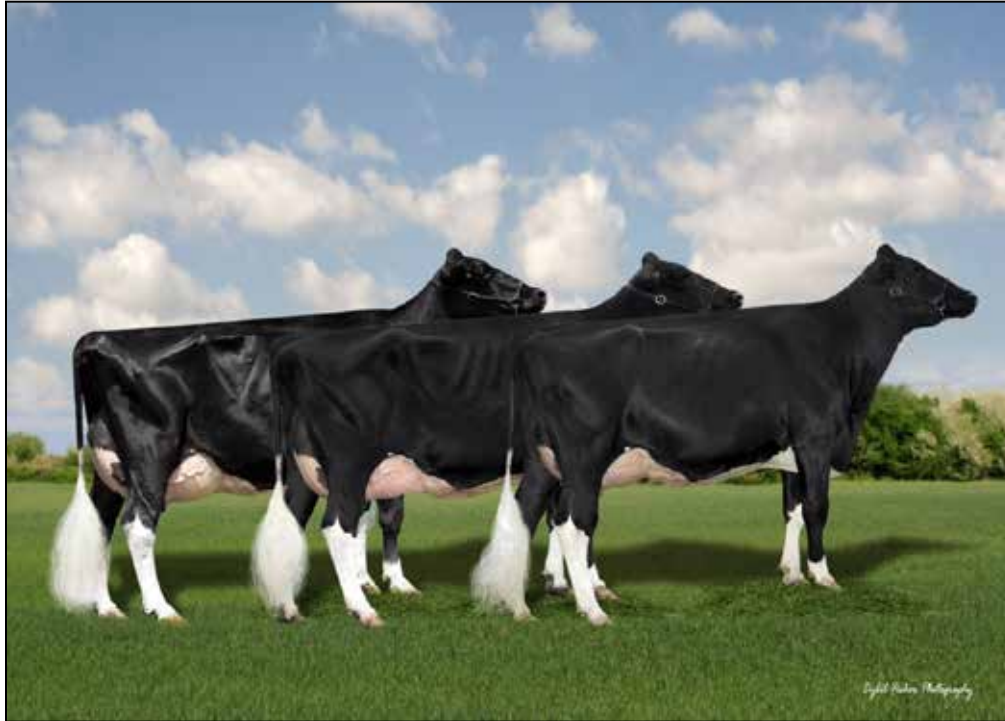
MS DONWALAND TALNT TILLY-ET EX-95 EEEEE 4E GMD MATRIARCH OF LIN-RO