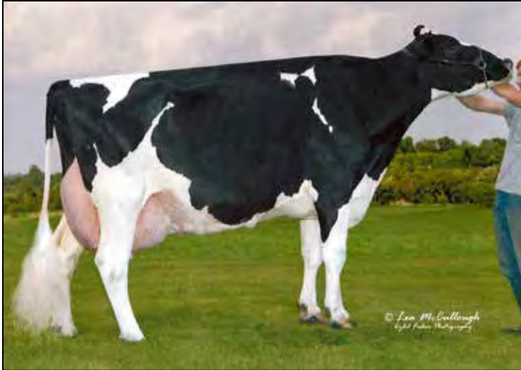
BUTTWOOD DURHAM PERFUME EX-94 3E DOM 4TH DAM OF LOT 134