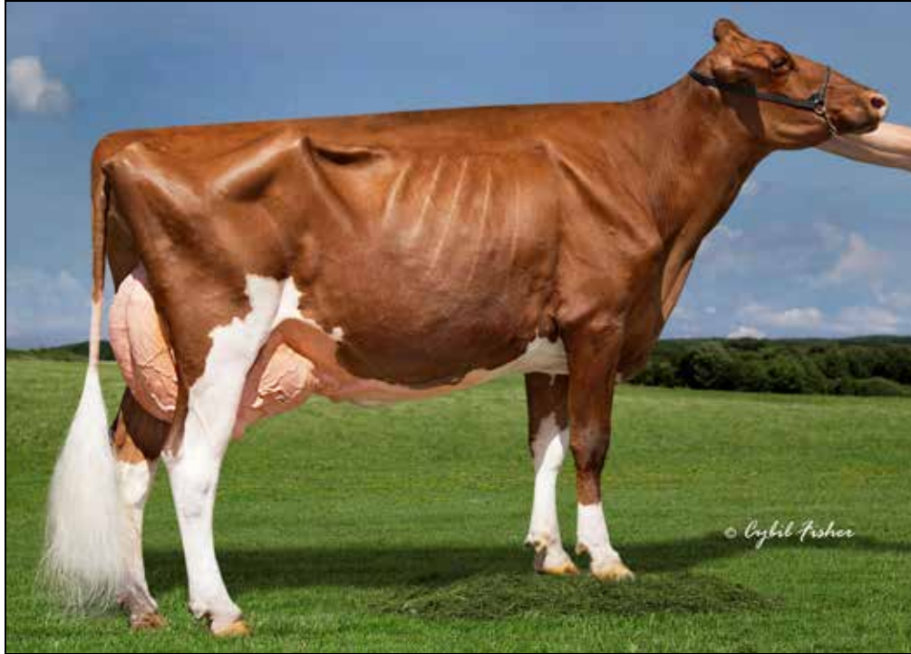
ZBW-ZIEMS LISTENTOME-RED-ET EX-94 EEEEE 2E DAM OF LOT 62