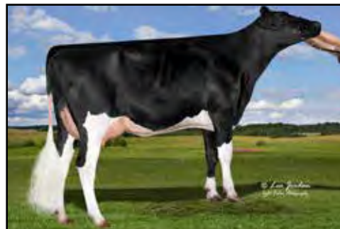
LIN-RO GOLDWYN LILLIE-ET EX-91 FULL SISTER TO LOLLY

135060883 Excellent-94 EEEEE 2E 5-02 2x 365d 31570 4.1 1304 3.1 989 3-06 2x 365d 28050 4.0 1132 3.2 894 2-02 2x 365d 22660 4.0 901 3.1 709 Life: 1550d 113100 4.1 4663 3.2 3622