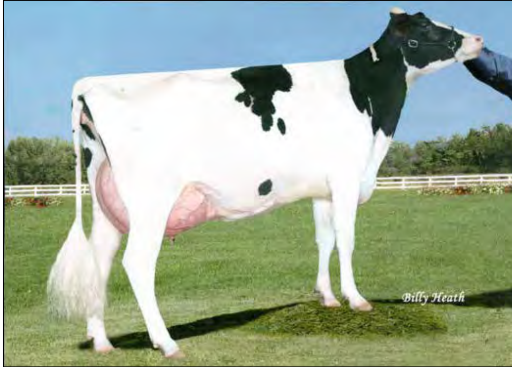
MCWILLIAMS CHAMPION PAPAYA EX-92 EX-MS 2E 3RD DAM OF LOT 162