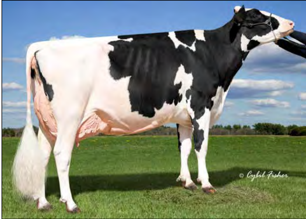
KINGS-RANSOM MG CLEAVAGE-ET EX-95 EEEEE DOM 2ND DAM OF LOT 59