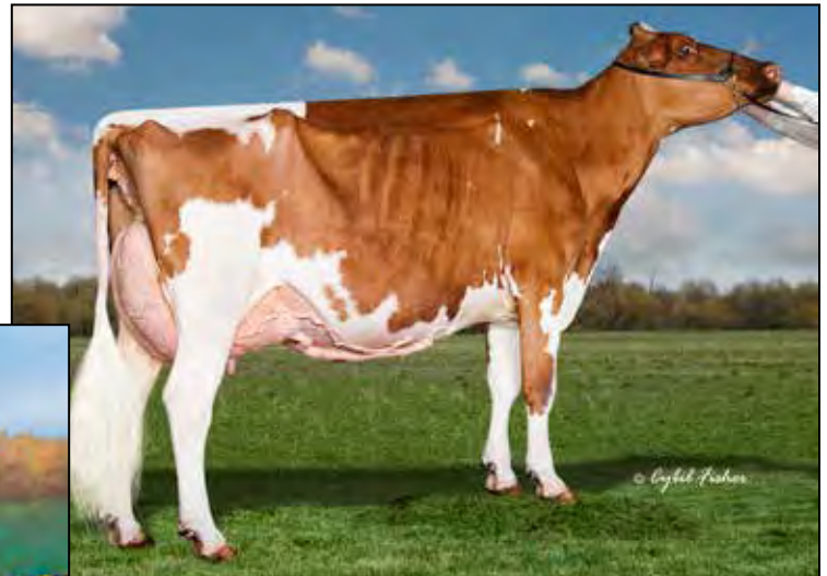
SHE-KEN APPLE DUMPLE-RED-ET 2E-94 MATERNAL SISTER TO 2ND DAM OF LOT 91