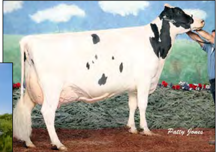
QUALITY B C FRANTISCO-ET EX-96-CAN 3E 3RD DAM OF LOT 110