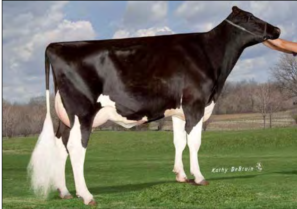
SANDY-VALLEY ATWD BARBIE-ET EX-91 2ND DAM OF LOT 81 & 3RD DAM OF LOT 82