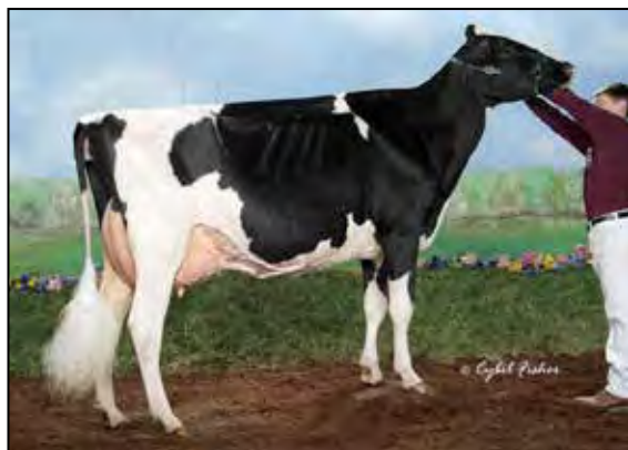
GOLDEN-OAKS GWYN CLASSY-ET EX-92 EX-MS 2ND DAM OF LOT 53 & 54