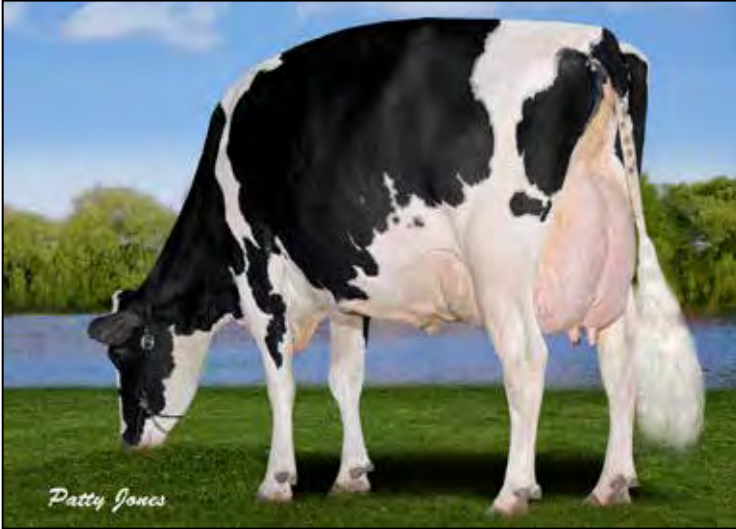
QUALITY GIBSON FINSCO-ET EX-95-CAN 3E 2ND DAM OF LOT 110