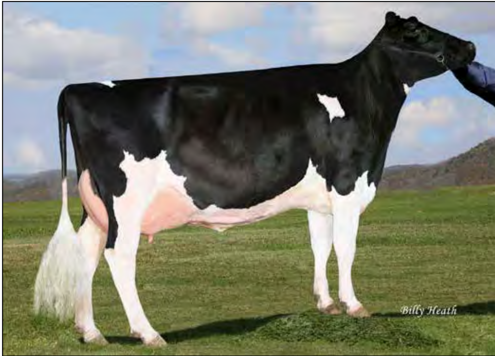
SAVAGE-LEIGH LEOLA-ET EX-91 EX-MS 3RD DAM OF LOT 126