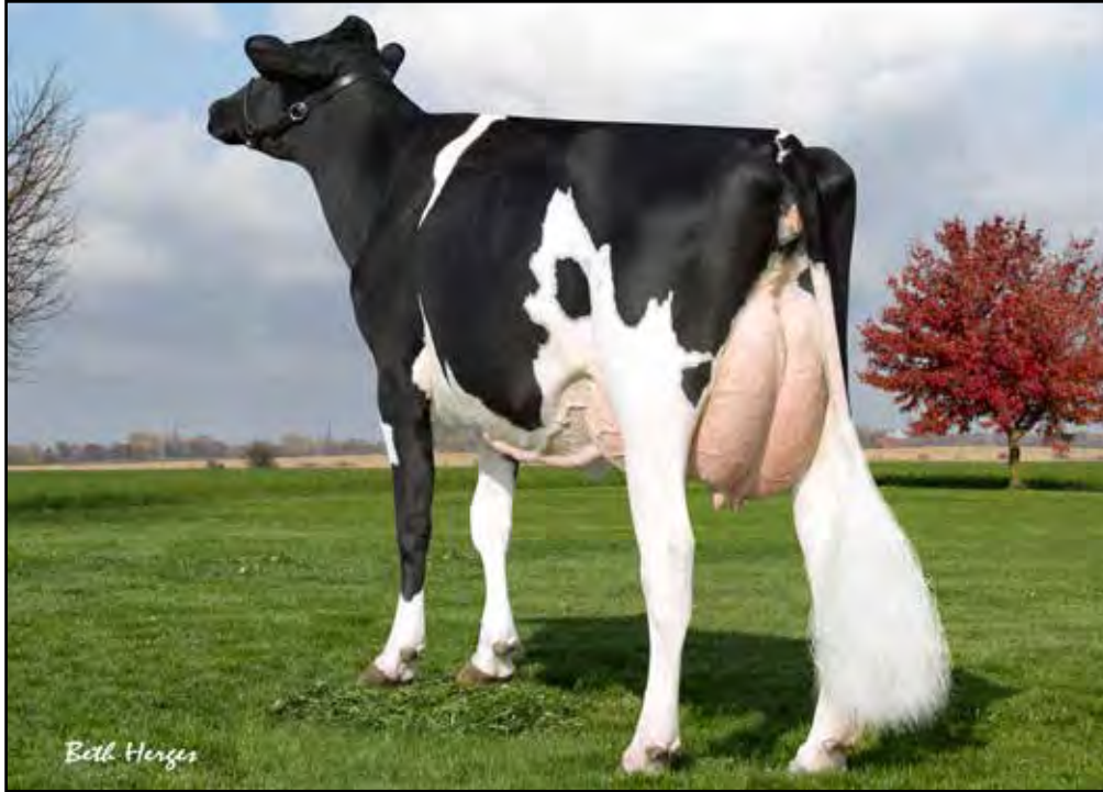
AMMON-PEACHEY SHAUNA-ET 2E-92 GMD DOM SAME FAMILY AS LOT 115