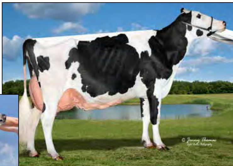
LIN-RO REDBURST JEN-ET 3E-94 FULL SISTER TO 2ND DAM OF LOT 1 & FULL SISTER TO 3RD DAM OF LOT 2