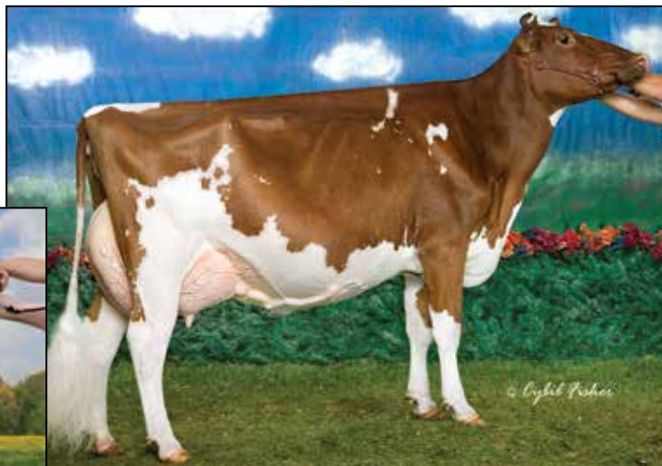
RED-VISION DIS DELLA-RED-ET EX-92 EX-MS MATERNAL SISTER TO 3RD DAM OF LOT 79