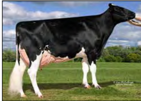
GOLDEN-ROSE REMEMBER ME-ET EX-92 EX-MS 2ND DAM OF LOT 48