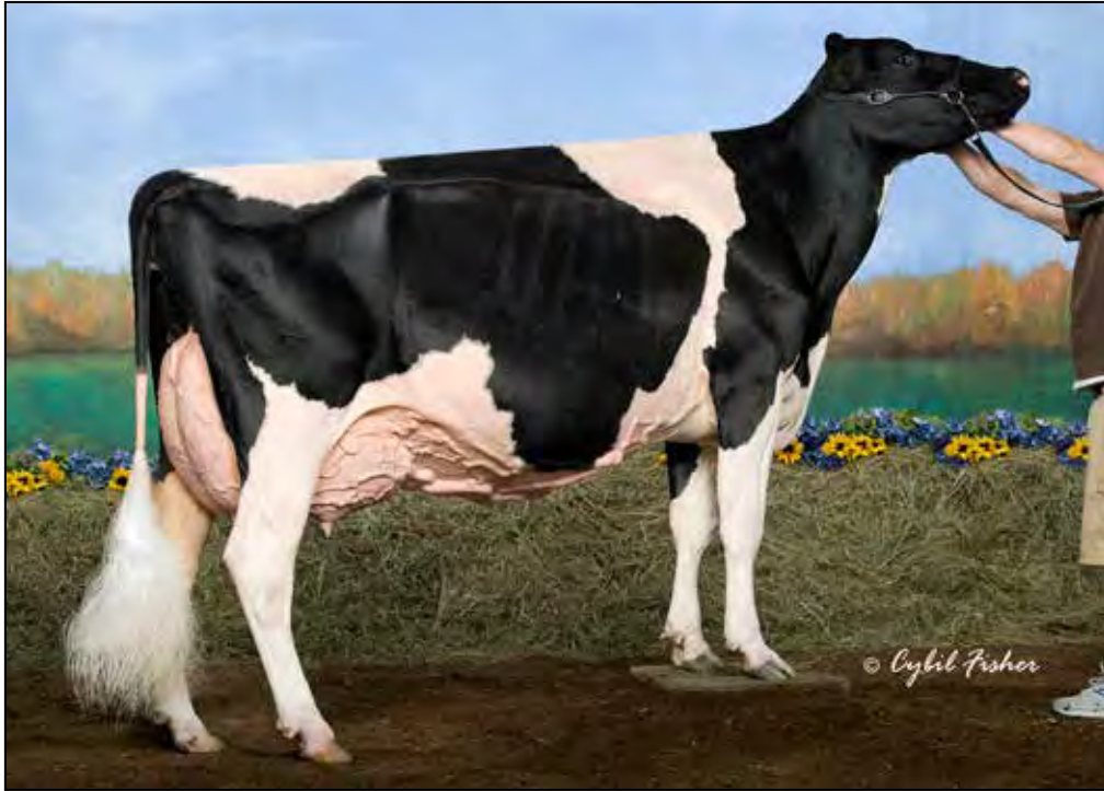
ERNEST-ANTHONY THRILLER-ET EX-95 EEEEE 2E DAM OF LOT 98