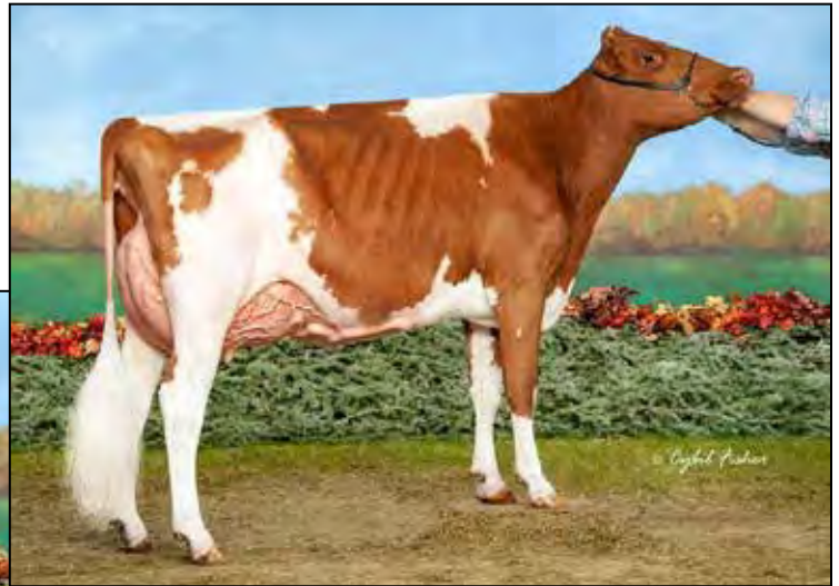
MS RANSOM-RAIL BETH-RED-ET EX-91 EX-MS FULL SISTER TO LOT 40 & DAM OF LOT 40A