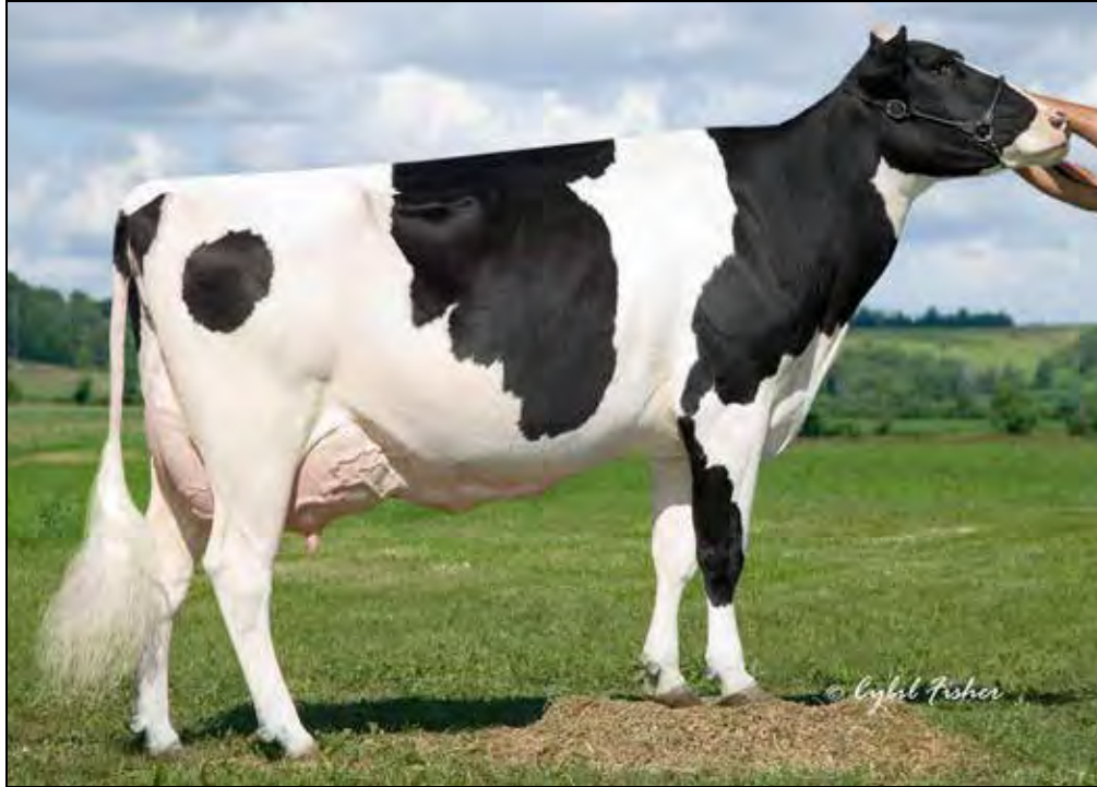
SANDY-VALLEY STRM TWEETY-ET EX-91 4TH DAM OF LOT 130