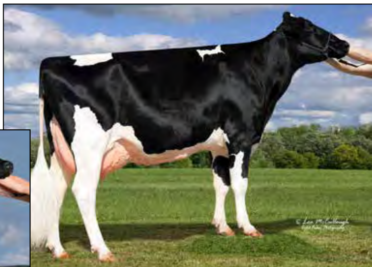
MS BRANDYS BREEZE-ET EX-94 EEEEE 2E 2ND DAM OF LOT 92