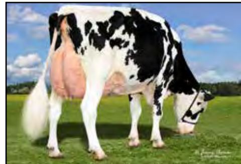
LIN-RO SYMT DORIS-ET EX-93 98-MS 3E FULL SISTER TO DAM OF LOT 36