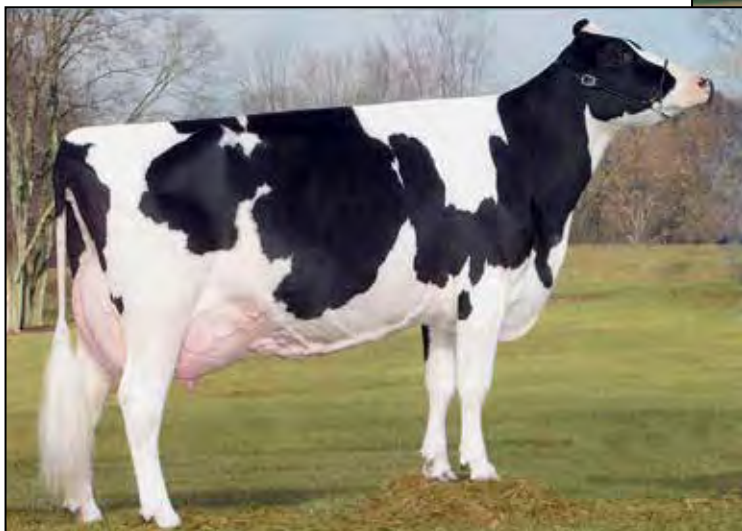
ERNEST-ANTHONY SD TOBI-ET EX-96 3E DOM 6TH DAM OF LOT 99