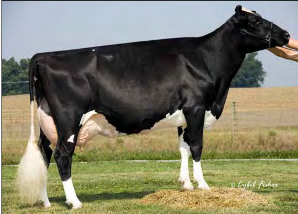
SCIENTIFIC RUBIRAE SOCKS-ET EX-93 EX-MS 3E DOM 4TH DAM OF LOT 135