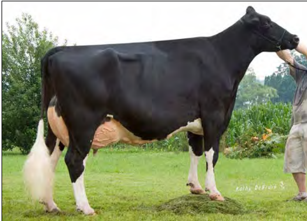
PENN-GATE STORM FLEUREL-ET EX-94 2E DOM 3RD DAM OF LOT 109