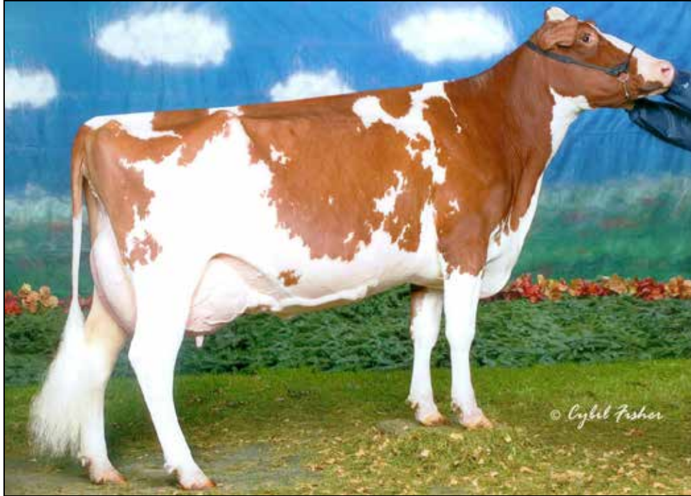
DERRWYN MISS SPECIAL-RED-ET EX-94 4E DOM 3RD DAM OF LOTS 141 & 142