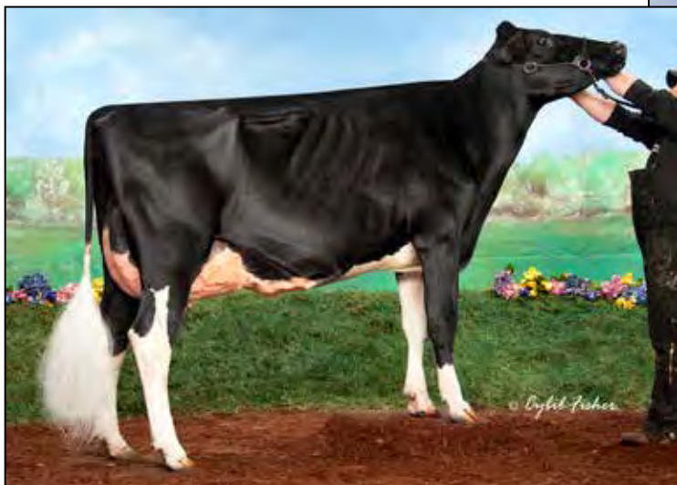
JUST-N-RUST ATWD PLEDGE-ET EX-91 MATERNAL SISTER TO DAM OF LOT 102