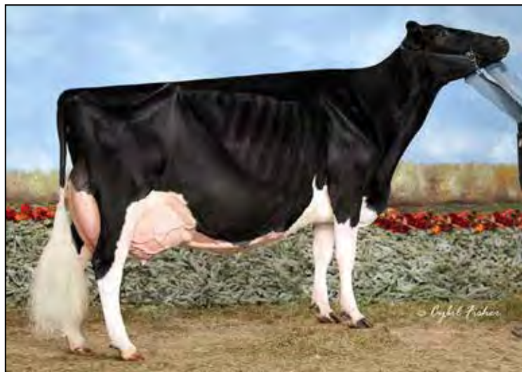
SAVAGE-LEIGH LEONA 3E-96 GMD MATERNAL SISTER TO 3RD DAM OF LOT 116