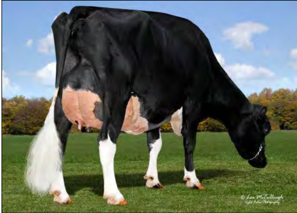
MS DONWALAND TALNT TILLY-ET EX-95 EEEEE 4E GMD

5 LIN-RO ALTITUDE JOY-RED 840003213704346 99%RHA-I Born: September 1, 2020 • Herd No. 341