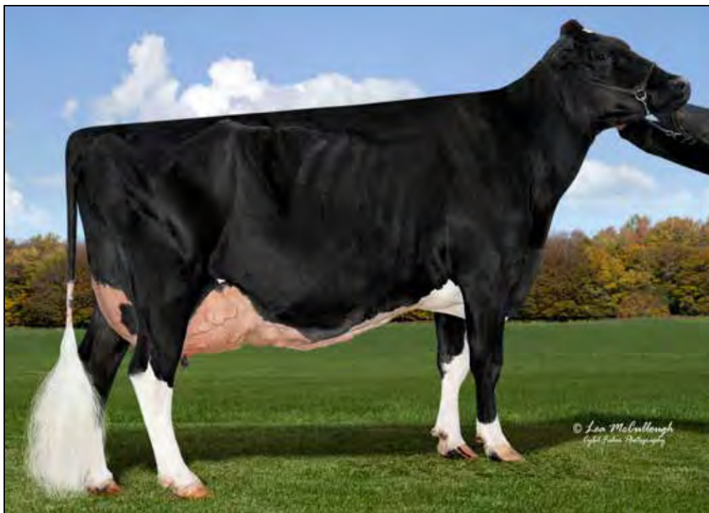
MS DONWALAND TALNT TILLY-ET EX-95 EEEEE 4E GMD