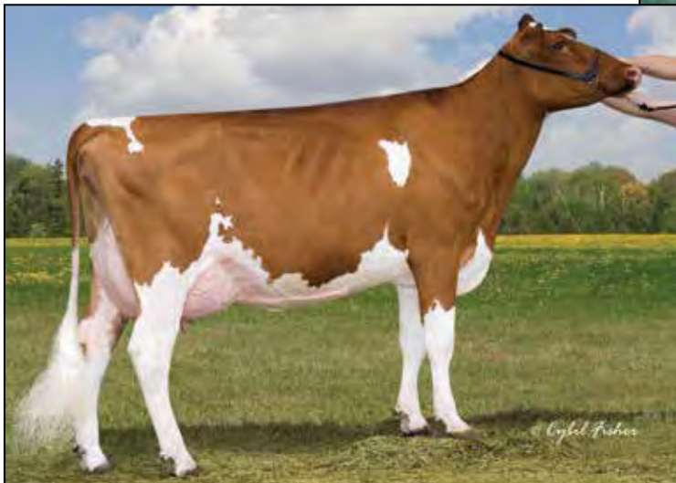
RED-VISION ADELLEA-RED-ET EX-91 3RD DAM OF LOT 79