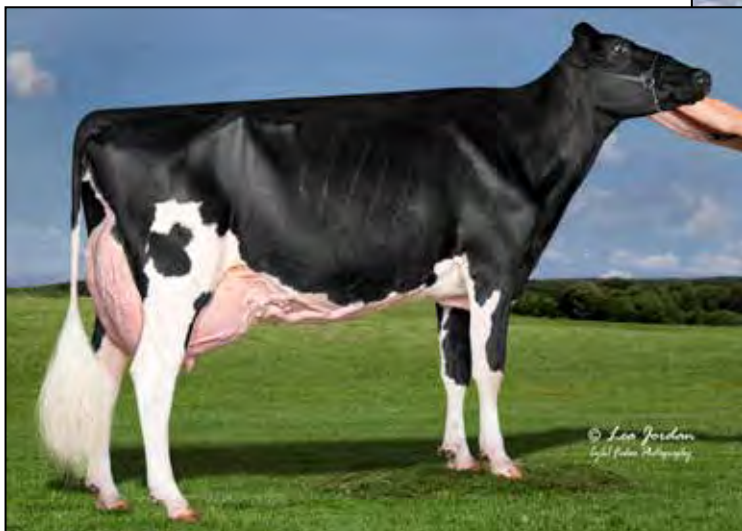
MS BRANDYS GOLD BAILEY-ET EX-94 EEEEE 2E MATERNAL SISTER TO 2ND DAM OF LOT 92