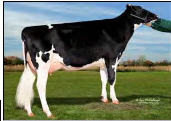
GOLDEN-ROSE REVOLUTION VG-87 3RD DAM OF LOT 50