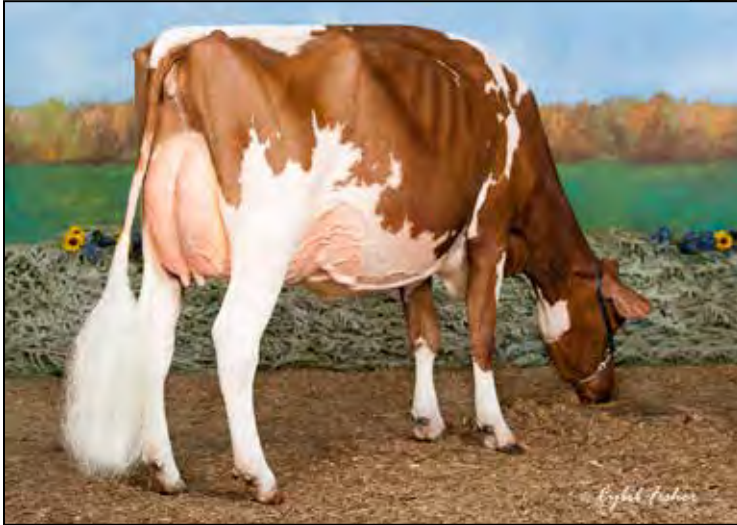
MS D APPLE DANELLE-RED-ET EX-95 EX-MS 2E 3RD DAM OF LOT 91