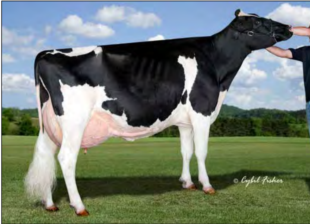
CURR-VALE GOLDWYN DELICIOUS EX-94 EX-MS 2E DOM 2ND DAM OF LOT 113 & 3RD DAM OF LOT 114