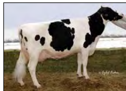
EASTRIVER SKYMARKER POLI-ET EX-CAN 2E 3* 4TH DAM OF LOT 111