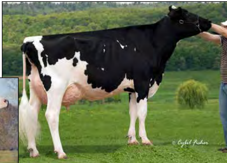
PEACHEY TALENT TAYLOR EX-93 EEEEE 2E 4TH DAM OF LOT 100