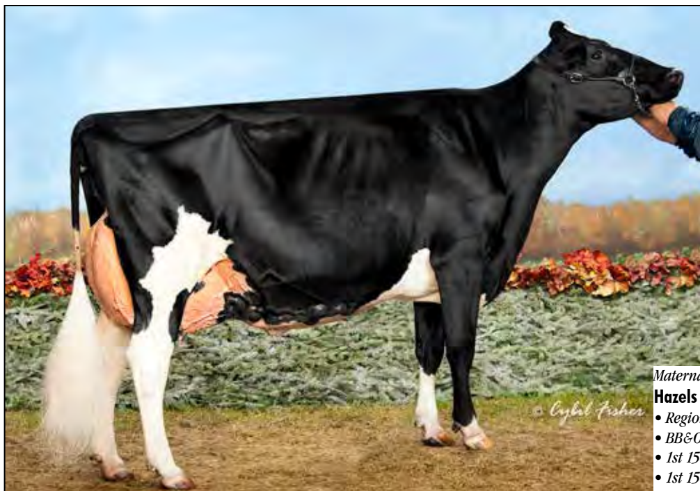
HAZELS GLDWN HATTY-ET EX-96 EEEEE 3E MATERNAL SISTER TO 2ND DAM OF LOT 86