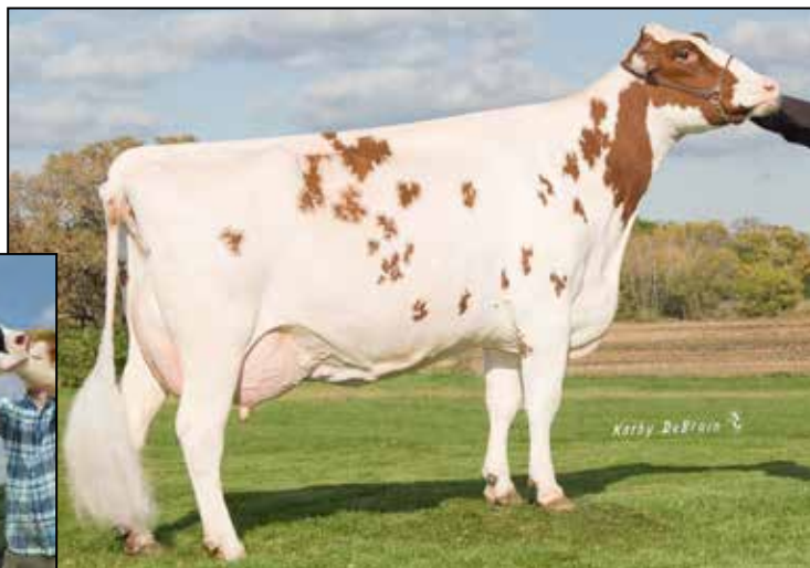
GOLDEN-OAKS PERK RAE-RED-ET EX-90 EX-MS 3RD DAM OF LOT 76