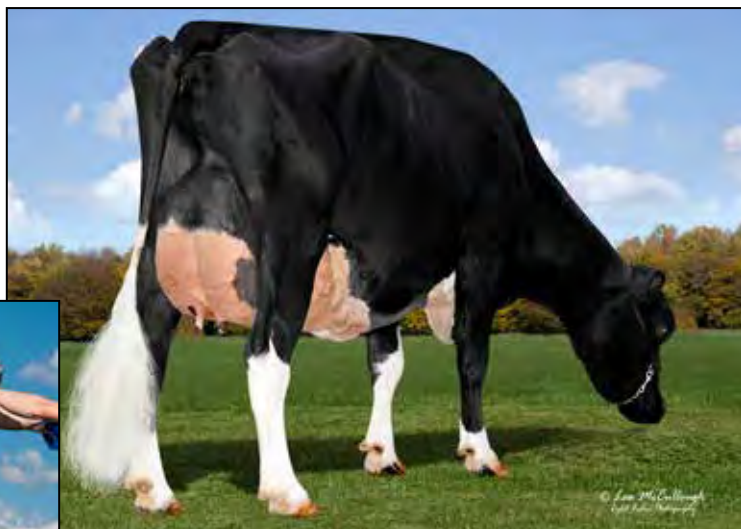
MS DONWALAND TALNT TILLY-ET EX-95 EEEEE 4E GMD DAM OF LOT 23