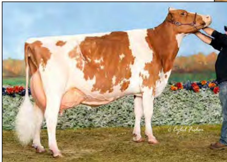
RIDGEDALE-T RAICHU-RED EX-96 EEEEE 3E 2ND DAM OF LOT 63