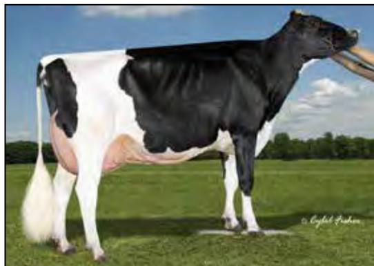
KINGS-RANSOM MOGUL CLEO-ET EX-95 EEEEE 2E DAM OF LOT 53 & 54