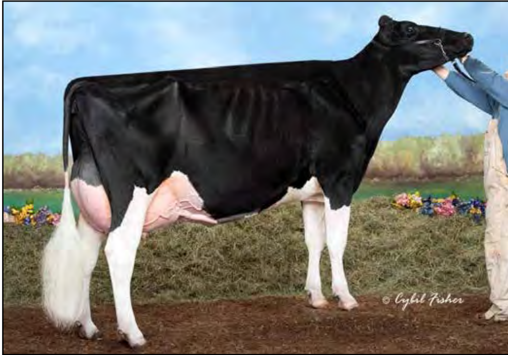
SAVAGE-LEIGH GOLD LONA EX-92 EX-MS 3RD DAM OF LOT 125