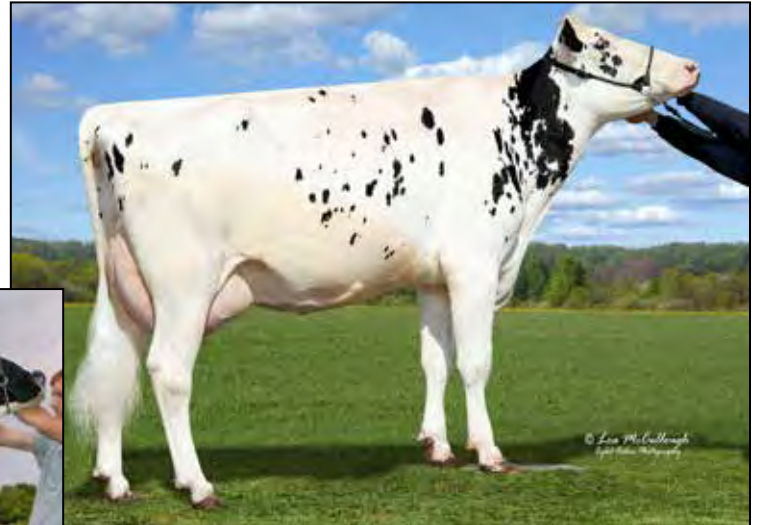
KING-LANE SHITLE POLKADOT-ET VG-88 MATERNAL SISTER TO 3RD DAM OF LOT 134