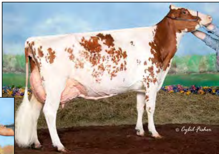
BLONDIN REDMAN SEISME-RED-ETS EX-97 EEEEE 3E 3RD DAM OF LOT 83