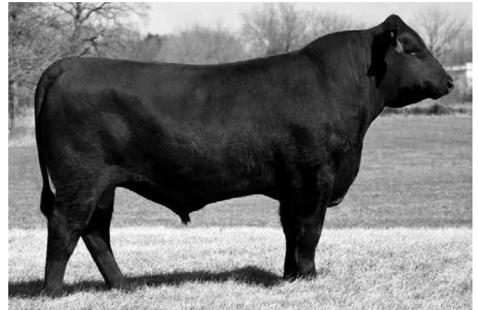
E W A PEYTON 642