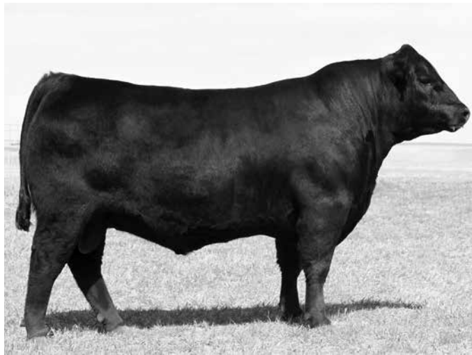
CONNEALY CAPITALIST 028