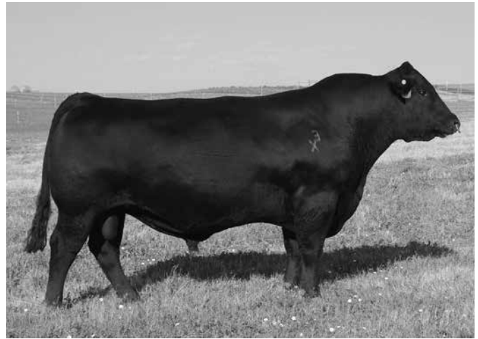
EXAR UPSHOT 0562B