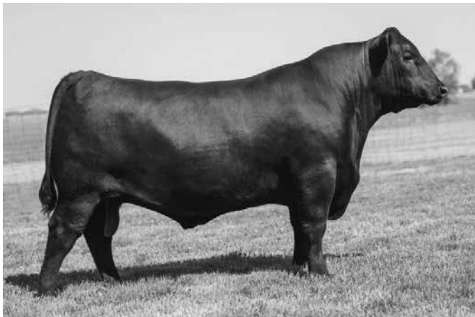
S S NIAGARA Z29