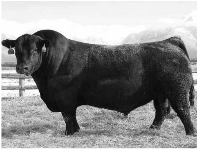
COLEMAN CHARLO 0256