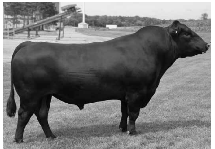
PA SAFEGUARD 021

Another PA Safeguard 021 daughter out of a dam sired by G A R Concrete. Her $B is in the Top 4% of the Angus breed. She sells bred to Matney Niagara 7133 whose EPD's are: +2 +2.2 +64 +116 +28 $B+151. Breeding update sale day.