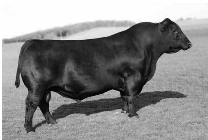
S A V THUNDERBIRD 9061