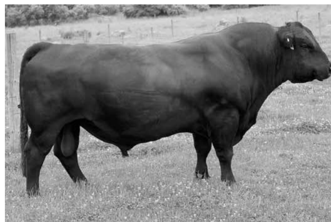
WERNER WAR PARTY 2417