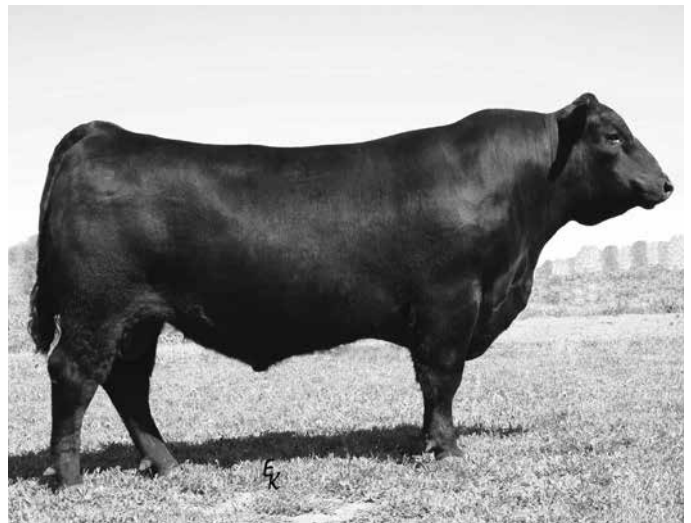
SITZ UPWARD 307R