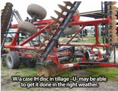
W/a case IH disc in tillage –U- may be able to get it done in the right weather.