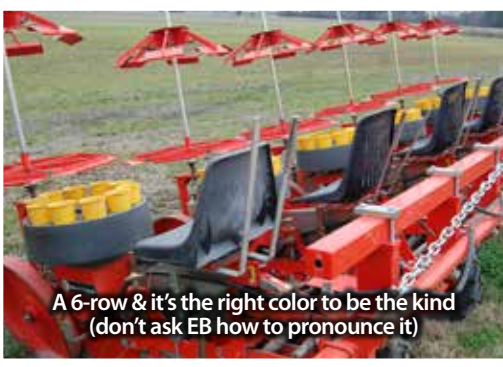
A 6-row & it's the right color to be the kind (don't ask EB how to pronounce it)