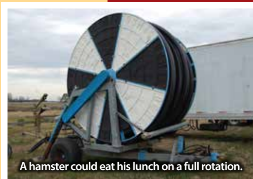
A hamster could eat his lunch on a full rotation.