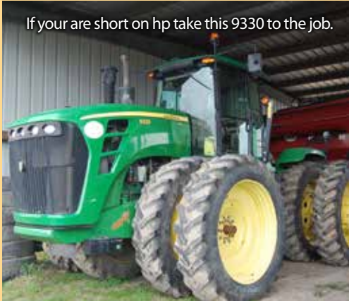
If your are short on hp take this 9330 to the job.

Conetoe, NC (close to Tarboro & Williamston, NC)