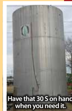
Have that 30 S on hand when you need it.

TERMS & CONDITIONS: All purchases must be paid for sale day. All property sells as is where is with all faults, with absolutely no warranties implied or expressed in any way. All Serial Numbers, mileage & hrs. unverified. All info printed in brochure is believed to be correct but not guaranteed. The auction company reserves the right to offer property in separate sales, combinations thereof or as a whole.