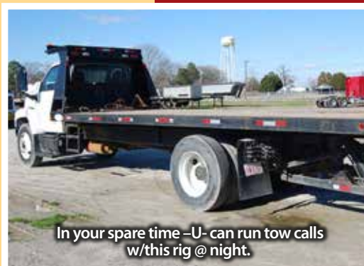
In your spare time -U- can run tow calls w/this rig @ night.