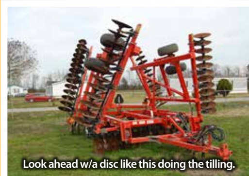
Look ahead w/a disc like this doing the tilling.