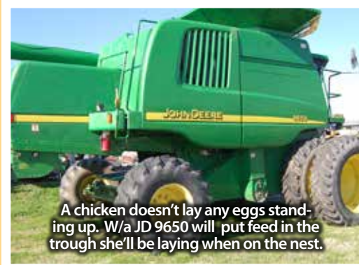
A chicken doesn't lay any eggs standing up. W/a JD 9650 will put feed in the trough she'll be laying when on the nest.