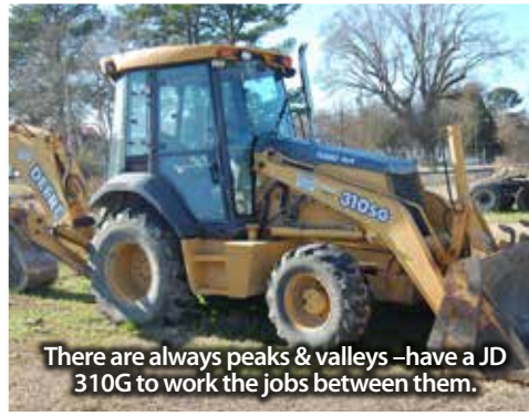
There are always peaks & valleys - have a JD 310G to work the jobs between them.