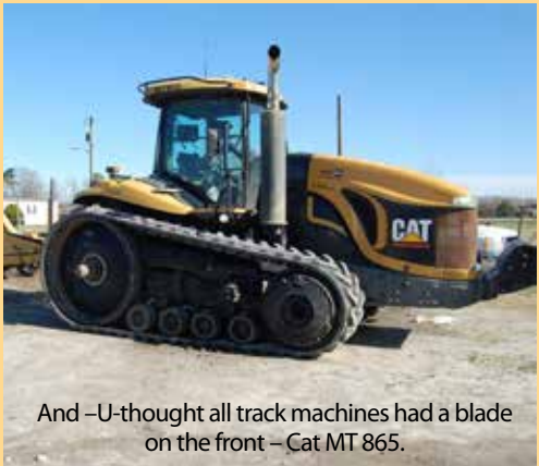
And –U-thought all track machines had a blade on the front – Cat MT 865.