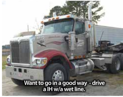
Want to go in a good way - drive a IH w/a wet line.