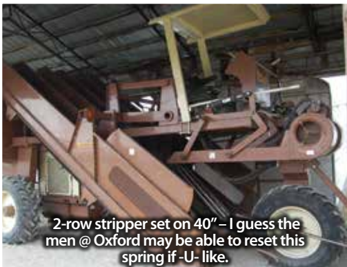
2-row stripper set on 40" – I guess the men @ Oxford may be able to reset this spring if -U- like.