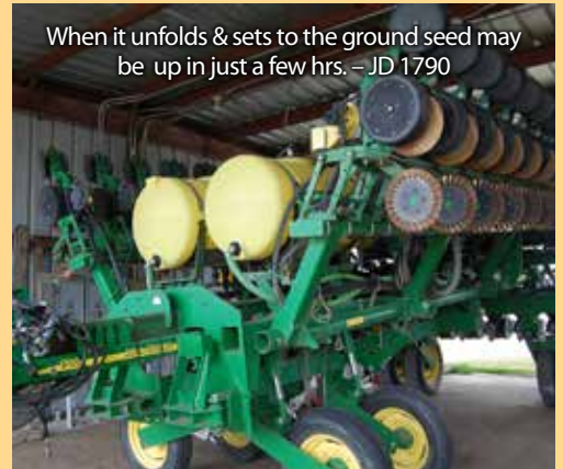
When it unfolds & sets to the ground seed may be up in just a few hrs. – JD 1790

DIRECTIONS: Being on Hwy 64 east of Tarboro & west of Williamston, take exit 494 (Hwy 42) take Hwy. 42 west for 3.7 miles, sale on right, also 27 miles north east of Wilson on Hwy. 42. Watch for auction signs.