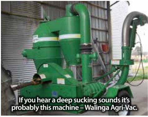
If you hear a deep sucking sounds it's probably this machine - Walinga Agri-Vac.