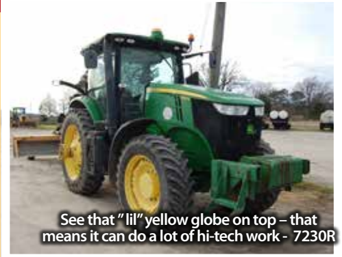
See that "lil" yellow globe on top - that means it can do a lot of hi-tech work - 7230R