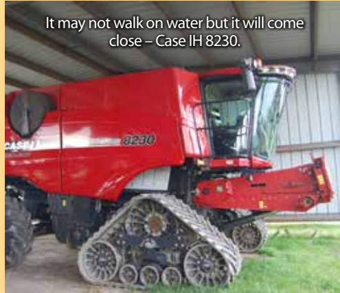
It may not walk on water but it will come close – Case IH 8230.