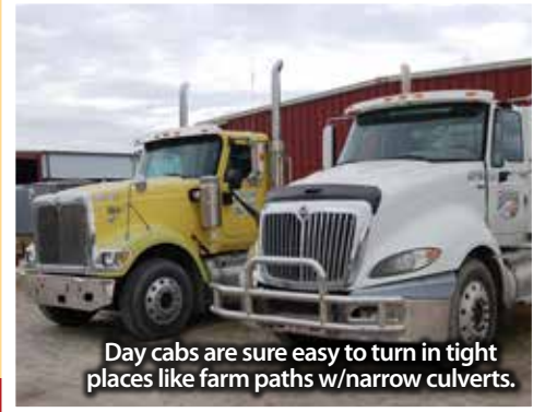
Day cabs are sure easy to turn in tight places like farm paths w/narrow culverts.