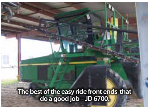
The best of the easy ride front ends that do a good job – JD 6700.

Whitehurst Farms tobacco equipment set on 40" rows.