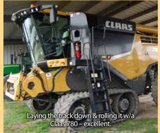
Laying the track down & rolling it w/a Claas 780 – excellent.