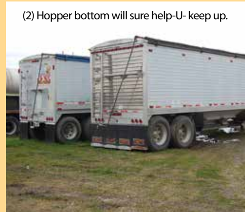
(2) Hopper bottom will sure help-U- keep up.