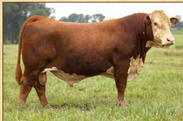
NJW 174C 203D Long Range 242G – Sire of Lot 26A