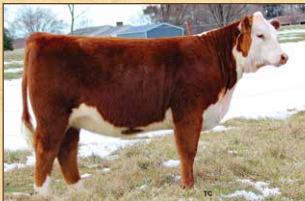
Lot 1 – PDF 19G Cave Lady 18J