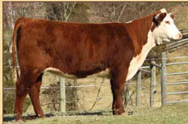
Lot 13 – NP Georgia Peach

• Consigned by North Pino Land & Cattle Co., Mocksville, N.C.