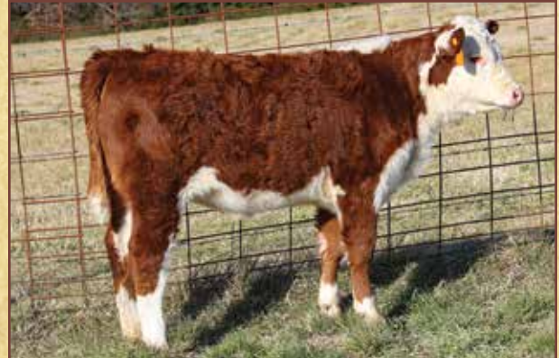
Lot 33A – Will-Via Ms Gloria T-310