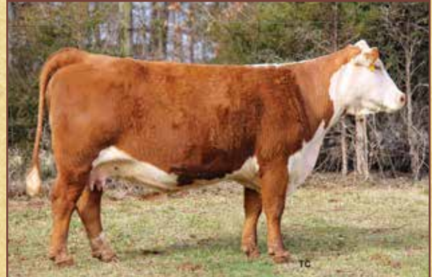
Lot 30 – BAW 735 Victoria 403B