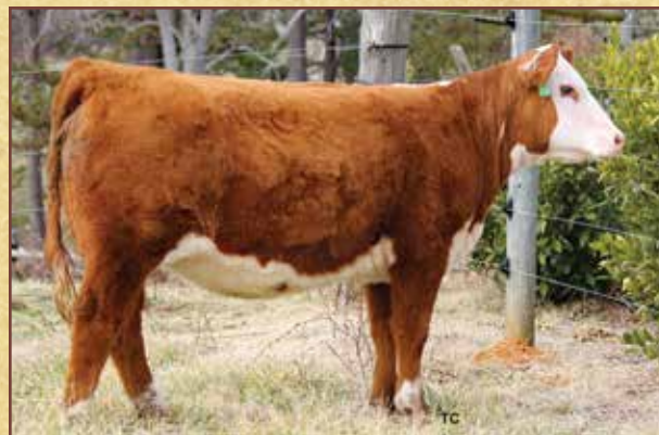
Lot 14 – MF3C Dom 12J

• This heifer comes out of a very maternal cow with an excellent udder that we purchased from Express Ranch several years ago. She is a long-bodied female with nice pigmentation. Her sire, R Excitement, is a Certified Hereford Beef Sire of Distinction and his daughters that are in production are performing well.