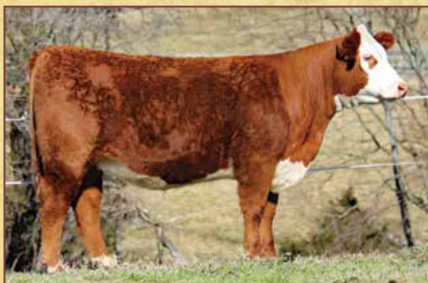
Lot 10 – NP Emma Lee