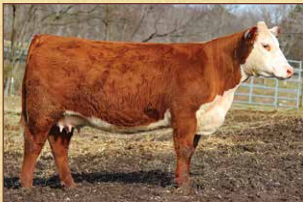
Lot 34 – TF Ms Endurance 7022 7212 G006