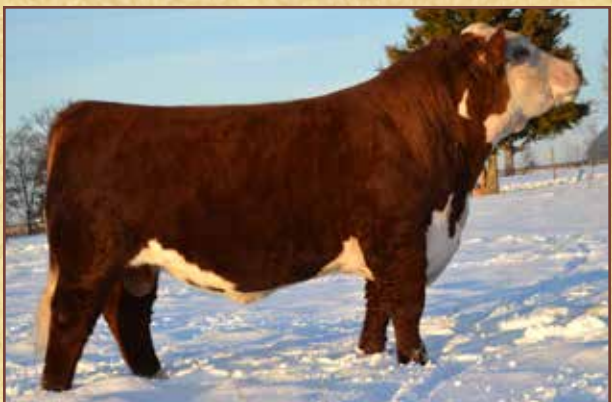
JDH Victor 719T 33Z ET – Sire of Lot 44A, Service sire for Lot 44