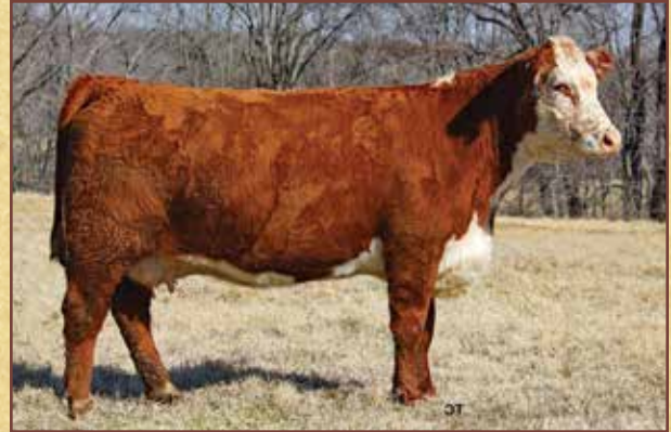
Lot 53 – GTW B716 Miss Mace 728

CE 3.1 (0.40); BW 2.3 (0.48); WW 56 (0.42); YW 88 (0.42); DMI 0.1 (0.14); SC 1.7 (0.32); SCF 31.1 (0.28); MM 43 (0.27); M&G 72; MCE 2.4 (0.25); MCW 56 (0.35); UDDR 1.30 (0.45); TEAT 1.30 (0.46); CW 63 (0.24); FAT 0.057 (0.26); REA 0.57 (0.23); MARB 0.18 (0.25); BMI$ 569; BIIS 657; CHB$ 115 • Pasture exposed 12/12/21 to 2/15/22, to White Hawk Chief 3186 ET. Safe in calf. • Consigned by W&A Hereford Farm, Providence, N.C.