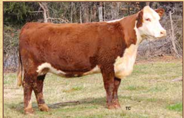
Lot 31 – CES Meredith 16A P170 ET