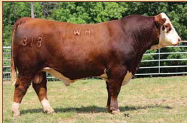
White Hawk Chief 318G ET – Service sire for Lots 53, 54 and 55