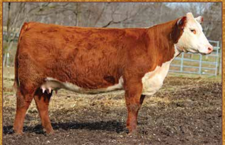
Lot 34 – TF Ms Endurance 7022 7212 G006