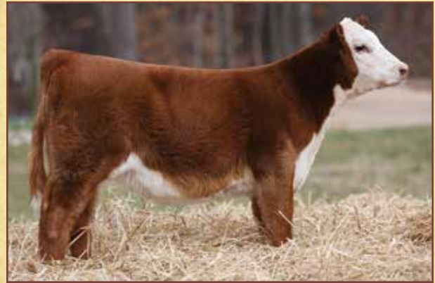
Lot 22 – Day EXR Boyd Lexus 9329 936

• Consigned by Day Ridge Farm, Telford, Tenn.