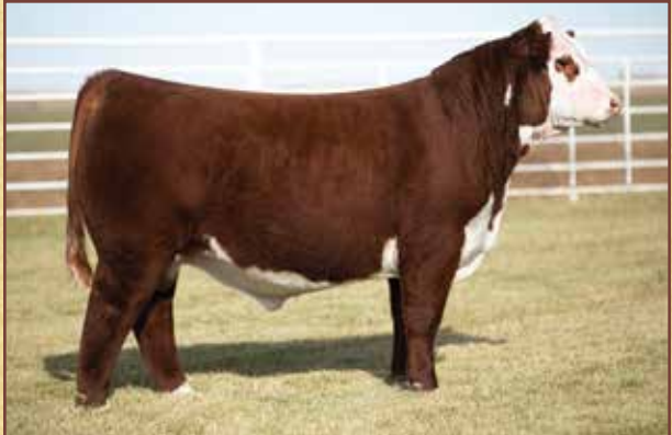
Loewen Genesis G16 ET – Sire of Lot 48