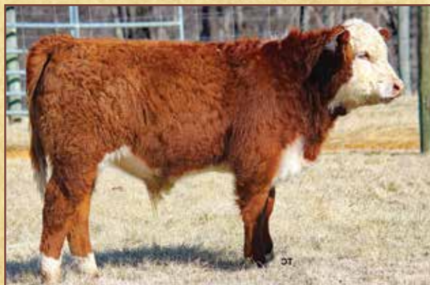
Lot 55A – GTW 817 Kismet 2109