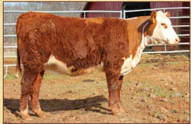
Lot 28 – 4B 859 Victor Queen H56