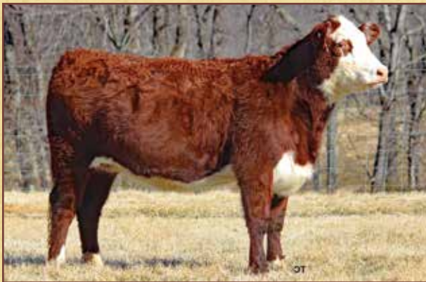
Lot 50 – RKM Pricon 1703 Abigal

CE -6.7 (0.29); BW 6.3 (0.28); WW 62 (0.22); YW 101 (0.21); DMI 0.3 (0.08); SC 1.3 (0.15); SCF 17.5 (0.13); MM 23 (0.13); M&G 54; MCE -0.6 (0.17); MCW 102 (0.12); UDDR 1.30 (0.19); TEAT 1.30 (0.19); CW 65 (0.03); FAT -0.013 (0.03); REA 0.47 (0.03); MARB -0.05 (0.03); BMI$ 360; BIIS 428; CHBS 98 • Pasture exposed 7/10/21 to 11/4/21 to THM Made Believer 6081. Safe in calf. • Consigned by William Ward and Kenneth Underwood, Providence, N.C.