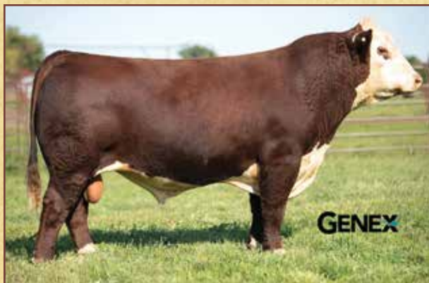
TH Frontier 174E – Sire of Lots 17, 18 and 19

CE 8.6 (0.41); BW 1.0 (0.48); WW 65 (0.42); YW 103 (0.42); DMI 0.3 (0.14); SC 0.9 (0.35); SCF 22.4 (0.29); MM 30 (0.28); M&G 63; MCE 5.4 (0.25); MCW 95 (0.21); UDDR 1.60 (0.41); TEAT 1.70 (0.41); CW 66 (0.10); FAT 0.087 (0.10); REA 0.25 (0.10); MARB 0.30 (0.10); BMI$ 440; BII$ 541; CHB$ 122 • 39J is a really nice, easy going, open heifer sired by the ever popular 4013, whose progeny have topped sales all over the country. This heifer's dam is a direct daughter of the 33A cow that serves as a donor for Flat Stone Lick. This heifer has real brood cow potential. Sells open and ready to breed to the bull of your choice. • Consigned by Hereford Hollow Farm, Wytheville, Va.