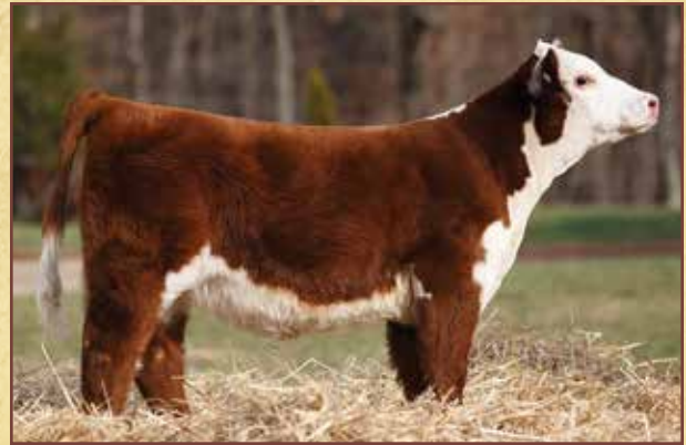
Lot 21 – Day Rachel Longrange 613 ET

• Consigned by Day Ridge Farm, Telford, Tenn.