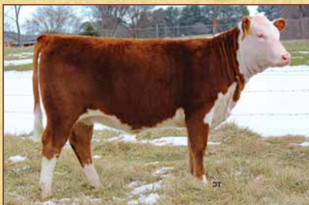
Lot 3 – PDF 358F Reeva 13J

CE 3.2 (0.28); BW 3.0 (0.32); WW 69 (0.24); YW 114 (0.23); DMI 0.6 (0.09); SC 1.2 (0.15); SCF 16.7 (0.13); MM 26 (0.13); M&G 60; MCE 4.1 (0.16); MCW 93 (0.01); UDDR 1.40 (0.18); TEAT 1.40 (0.19); CW 78 (0.03); FAT 0.027 (0.03); REA 0.40 (0.03); MARB 0.19 (0.03); BMI$ 363; BII$ 454; CHB$ 131 This heifer probably is my pick of the February heifers. She's long necked, walks like a cat, long and level topped and on top of all that she is halter broke with good balanced EPDs. Consigned by PD Farms, Dobson, N.C.