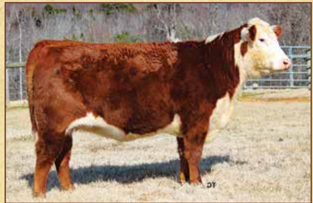
Lot 56 – RCF 9615 A412 Hashtag H311