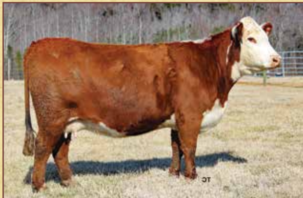
Lot 54 – GTW 6125 Miss Renaissance 829