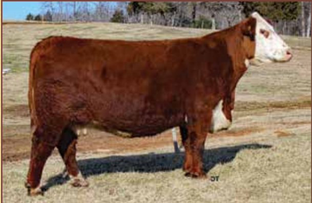
DTF Vanity 0091 2Z37 – Dam of Lot 47 and 48