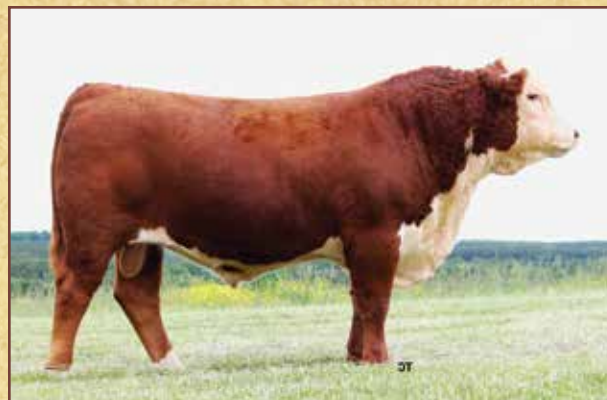
Behm Cuda 100W 504C – AI service sire for Lot 8