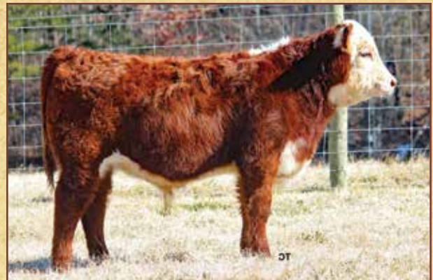
Lot 53A – GTW 817 Kismet 2107

CE -0.2 (0.28); BW 3.1 (0.33); WW 62 (0.23); YW 101 (0.24); DMI 0.3 (0.09); SC 1.3 (0.16); SCF 24.7 (0.14); MM 36 (0.14); M&G 67; MCE -1.6 (0.17); MCW 77 (0.01); UDDR 1.40 (0.20); TEAT 1.40 (0.20); CW 71 (0.03); FAT 0.037 (0.03); REA 0.49 (0.03); MARB 0.22 (0.03); BMI$ 482; BIIS 573; CHB$ 126 • BW 90 lb. • Consigned by W&A Hereford Farm, Providence, N.C.