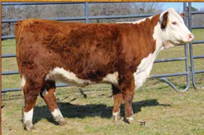
Lot 42 – Five J's Kate A250 0946