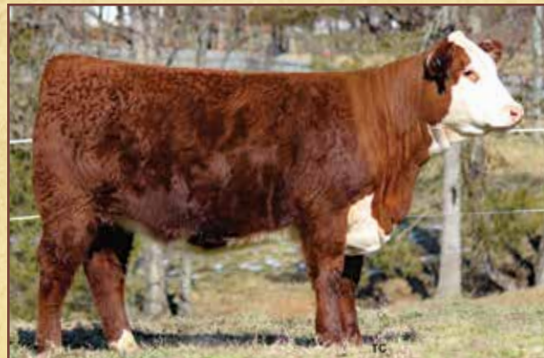
Lot 12 – NP Carol

• Consigned by North Pino Land & Cattle Co., Mocksville, N.C.