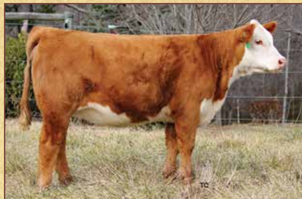
Lot 15 – MF3C Okies Excitement 20J

• A nice, moderate framed heifer out of a Revolution daughter sired by R Excitement. She is nicely pigmented and has great rib shape in a structurally sound package. Juniors take notice, she could be shown and then go on to be a nice female in any herd.