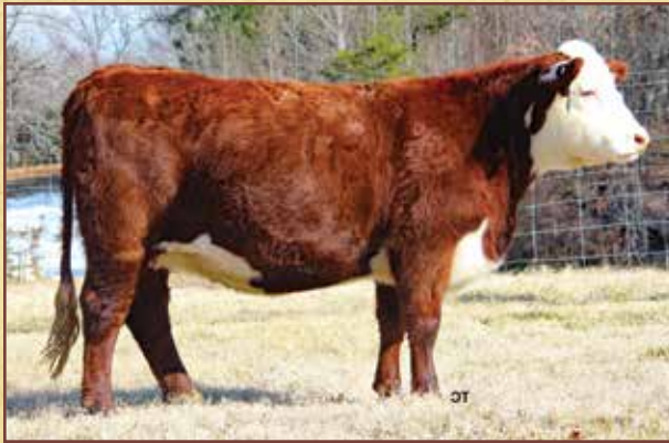
Lot 49 – RKM Pricon 1703 Martha