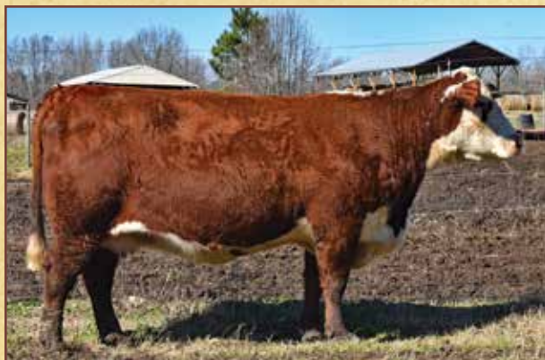
Lot 37 – FPH Ms Vicki Encore E117