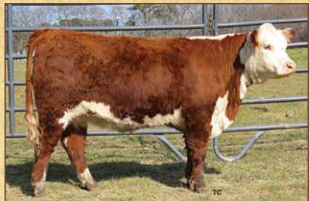
Lot 43 – Five JS Ms Pack 4013 J80

CE -0.4 (0.32); BW 3.8 (0.24); WW 73 (0.21); YW 118 (0.21); DMI 0.4 (0.08); SC 1.6 (0.17); SCF 17.2 (0.13); MM 32 (0.17); M&G 69; MCE 2.6 (0.24); MCW 101 (P); UDDR 1.30 (0.19); TEAT 1.30 (0.19); CW 75 (0.03); FAT 0.047 (0.03); REA 0.37 (0.03); MARB 0.45 (0.03); BMI$ 391; BII$ 504; CHB$ 155 • This heifer is very thick, easy keeping and slick haired. On 11/23/21 this heifer weighed 833 lb., a 9 in. ribeye and IMF of 5.20. Her dam calved her at 21 months and backed up on rebreeding. Her dam has a 9 teat and 9 udder score. • Bred AI to 77 Pinstripe 76D 73G. • Consigned by Five J's Cattle Co., Clayton, N.C.