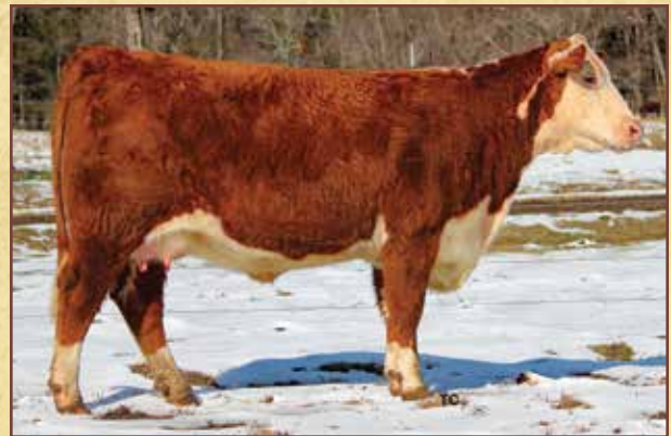
Lot 40 – KB MB Belles Beauty 26B

CE 2.2 (0.30); BW 3.3 (0.25); WW 62 (0.22); YW 103 (0.22); DMI 0.3 (0.08); SC 1.3 (0.18); SCF 14.2 (0.17); MM 26 (0.15); M&G 57; MCE 1.7 (0.20); MCW 112 (0.18); UDDR 1.30 (0.21); TEAT 1.30 (0.21); CW 73 (0.03); FAT -0.003 (0.03); REA 0.56 (0.03); MARB 0.16 (0.03); BMI$ 334; BII$ 413; CHB$ 129 • Tremendous daughter of our Ward bred, Homeward donor Belle 715. She has a beautiful udder. • 40A: Heifer calf born 12/6/21, sired by Behm 100W Cuda 504C is special. She is quite a prospect in her own right and will have an incredible EPD profile. • Breeding information available on sale day. • Consigned by Blinson Polled Herefords, Lenoir, N.C.