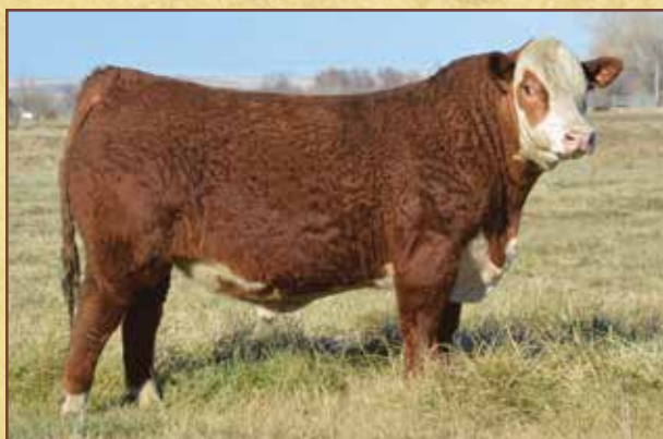
/S Mandate 66589 ET – Sire of Lot 38 and service sire for Lot 11

CE -1.4 (0.35); BW 4.3 (0.36); WW 65 (0.25); YW 107 (0.25); DMI 0.1 (0.09); SC 1.1 (0.18); SCF 16.8 (0.19); MM 25 (0.19); M&G 58; MCE 3.7 (0.26); MCW 102 (0.18); UDDR 1.10 (0.32); TEAT 1.10 (0.32); CW 76 (0.03); FAT 0.027 (0.03); REA 0.28 (0.03); MARB 0.37 (0.03); BMI5 486; BI1 486; CHB5 155 • An outstanding Encore daughter that we hate to part with. With her dam and sister still in our herd we are offering her for sale. Dark red, red eyes and an outstanding producer you can't go wrong with this one. • Bred AI to TH Masterplan 183F, then pasture exposed 6/1/21 to 7/10/21 to a Mandate son. • Consigned by Wayne Garber, Laurens, S.C.