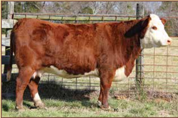
Lot 32 – Will-Via Ms Vicky T-256