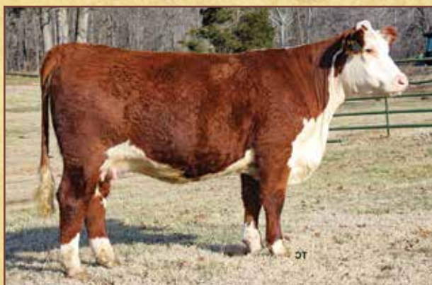
Lot 45 – DTF Dixie 6964 0H07

• Consigned by Deer Track Farm, Spotsylvania, Va.