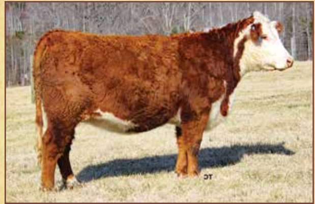
Lot 52 – H B711 Charlee 031

CE 3.0 (0.33); BW 0.7 (0.38); WW 54 (0.31); YW 79 (0.30); DMI 0.0 (0.11); SC 1.1 (0.20); SCF 19.6 (0.19); MM 32 (0.18); M&G 58; MCE -0.8 (0.23); MCW 66 (0.19); UDDR 1.50 (0.27); TEAT 1.60 (0.27); CW 58 (0.03); FAT 0.007 (0.03); REA 0.66 (0.03); MARB 0.15 (0.03); BMI$ 400; BIIS 473; CHB$ 110 • Pasture exposed 7/10/21 to 11/4/21 to THM Made Believer 6081. Safe in calf. • Consigned by W&A Hereford Farm, Providence, N.C.