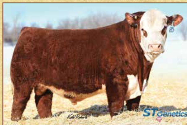
TH Masterplan 183F – AI service sire for Lot 9, 10, 35 and 37