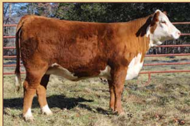
Lot 6 – JL Lady Love 361 347 433