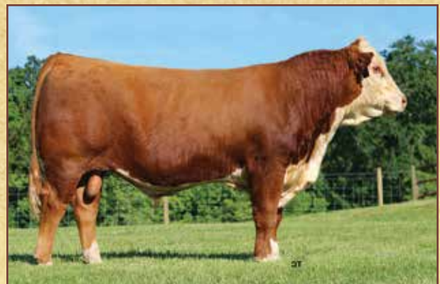
NJW 11B Authorize 79G ET – Sire of Lot 54A