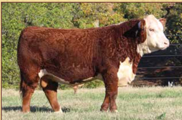
GTW C776 Kismet 817 – Sire of Lots 51, 53A and 55A