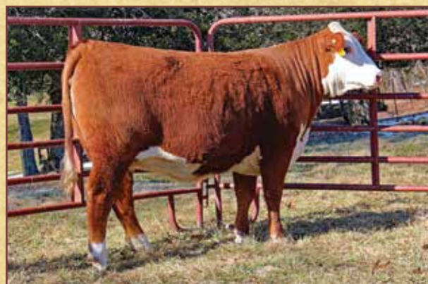
Lot 7 – JL Lady Love 334 347 434