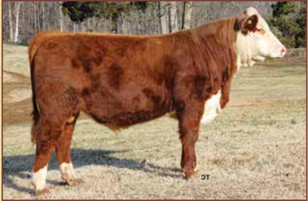
Lot 47 – DTF Fernando 4013 1J19 ET