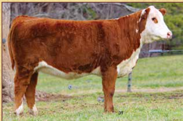
Lot 39 – NCSU Miss Way Home 844 36J

CE 2.7 (0.33); BW 1.5 (0.22); WW 59 (0.20); YW 89 (0.20); DMI 0.2 (0.07); SC 1.3 (0.16); SCF 19.3 (0.15); MM 24 (0.16); M&G 53; MCE 2.0 (0.21); MCW 110 (0.15); UDDR 1.50 (0.23); TEAT 1.50 (0.23); CW 74 (0.03); FAT 0.057 (0.03); REA 0.42 (0.03); MARB 0.22 (0.03); BMI5 406; BI1 491; CHB5 127 • Fancy Mandate daughter out of one of our most productive cows. This heifer will make someone a great cow. • Bred to TH Masterplan 183F and will calve by sale day. • Consigned by Wayne Garber, Laurens, S.C.