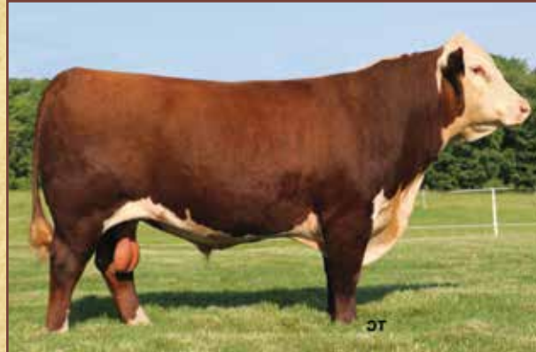
THM Made Believer 6081 – Service sire for Lots 49, 50, 52 And 56

CE 0.7 (0.28); BW 3.6 (0.27); WW 50 (0.20); YW 80 (0.19); DMI -0.2 (0.07); SC 1.0 (0.12); SCF 16.1 (0.11); MM 21 (0.11); M&G 46; MCE 2.9 (0.17); MCW 94 (0.12); UDDR 1.20 (0.16); TEAT 1.20 (0.16); CW 59 (0.03); FAT -0.003 (0.03); REA 0.30 (0.03); MARB 0.06 (0.03); BMI$ 343; BIIS 406; CHBS 106 • Pasture exposed 7/10/21 to 11/4/21 to THM Made Believer 6081. Safe in calf. • Consigned by William Ward and Kenneth Underwood, Providence, N.C.