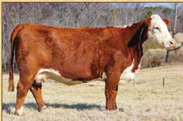
Lot 55 – GTW 1080 Miss Callie 609