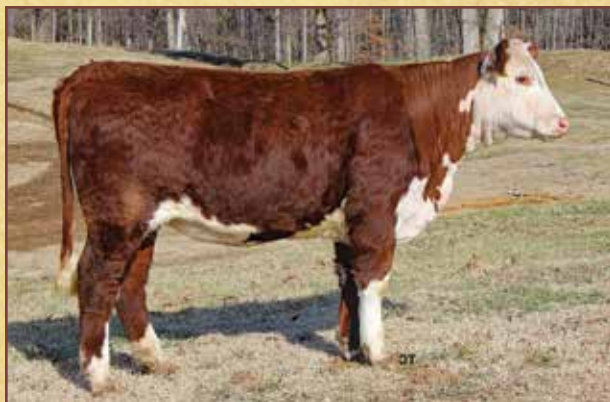
Lot 46 – DTF Lily 8F52 1J06

• Consigned by Deer Track Farm, Spotsylvania, Va.