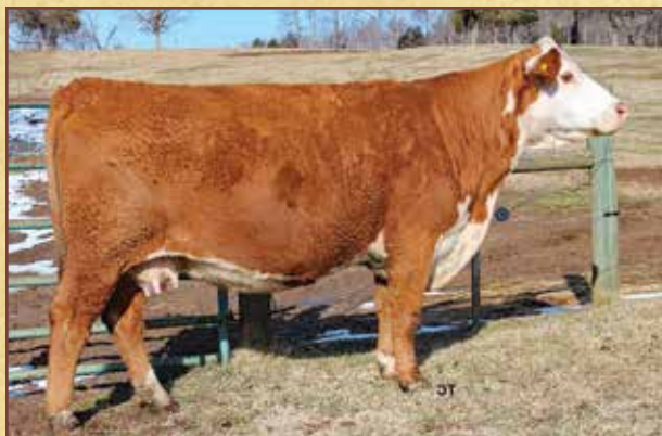
Lot 44 – DTF Anna Belle Z311 7E24

• Consigned by Deer Track Farm, Spotsylvania, Va.