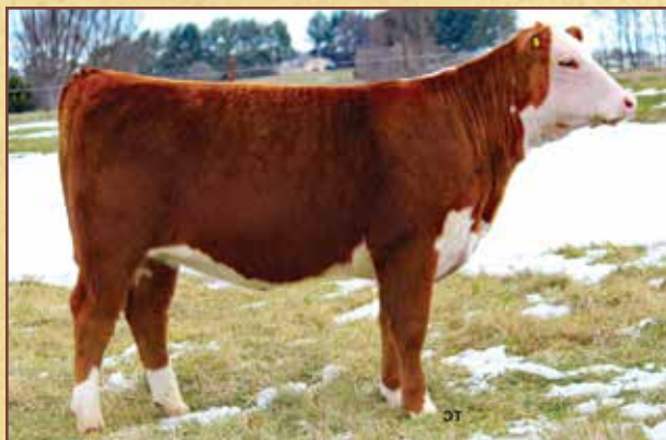
Lot 2 – PDF 019G Lady Cave 17J

CE 5.6 (0.28); BW 2.0 (0.32); WW 64 (0.24); YW 100 (0.23); DMI 0.6 (0.09); SC 1.1 (0.16); SCF 21.1 (0.13); MM 27 (0.12); M&G 58; MCE 4.1 (0.17); MCW 99 (0.01); UDDR 1.40 (0.19); TEAT 1.40 (0.19); CW 72 (0.03); FAT 0.047 (0.03); REA 0.52 (0.03); MARB 0.24 (0.03); BMI$ 425; BII$ 517; CHB$ 123 This heifer is halter broke and will make a good show heifer that will make an even better cow out in the pasture. She is bred out of top and bottom side White Hawk Ranch genetics. Consigned by PD Farms, Dobson, N.C.