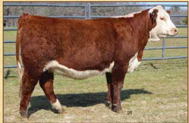
Lot 41 – Prestwood Victoria D42 H99

CE -0.8 (0.29); BW 2.2 (0.22); WW 57 (0.19); YW 84 (0.18); DMI 0.3 (0.07); SC 1.3 (0.15); SCF 22.9 (0.15); MM 31 (0.15); M&G 60; MCE -2.3 (0.19); MCW 78 (0.10); UDDR 1.20 (0.20); TEAT 1.20 (0.20); CW 68 (0.03); FAT 0.027 (0.03); REA 0.37 (0.03); MARB 0.15 (0.03); BMI$ 444; BII$ 525; CHB$ 111 • This heifer is freckle faced, thick and has excellent pigment. This heifer was raised with NO creep feed. On 11/23/21, she weighed 869 lb., a 12.5 in. ribeye and IMF 3.30. She is from an excellent Mr Maternal daughter. • Bred AI to CMF 1756 Guideline 532G. • Consigned by Prestwood Beef Cattle, Lenoir, N.C.