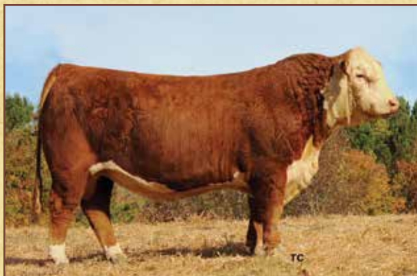
Innisfail WHR X651/723 4013 ET – Sire of Lot 16