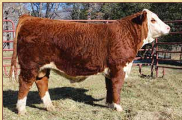
Lot 5 – JL Herd Leader 445 359 6964