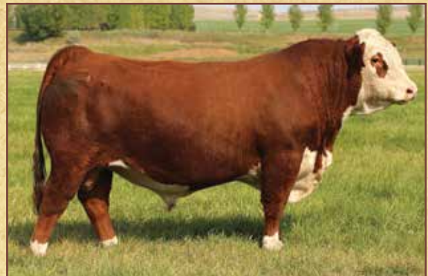
NJW 133A 6589 Manifest 87G – Service sire for Lots 19, 24 and 25

• Consigned by P and J Farms, Monroe, N.C.