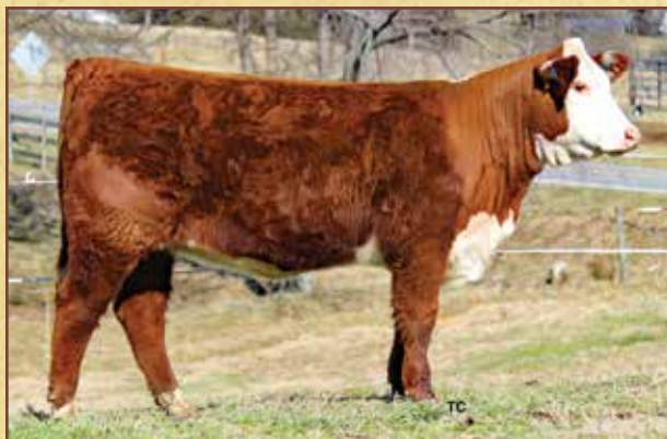
Lot 9 – NP Lady Liberty

All five of these heifers are by our herd bull, Churchill Wildcat 7212E, that we jointly own with Terrace Farms. All their dams are from some of the top herds in the breed, including WMC Cattle Co., White Hawk Ranch, Barnes Herefords, etc. All dark red with heavy pigmentation and all were bred AI with sexed heifer semen to either TH Masterplan 183F or /S Mandate 66589 ET as indicated. Then pasture exposed to TH 22A 358C Pioneer 73E (P43818546), from 1/10/22 to 3/24/22. The heifers have GE-EPDs and they will benefit any program.