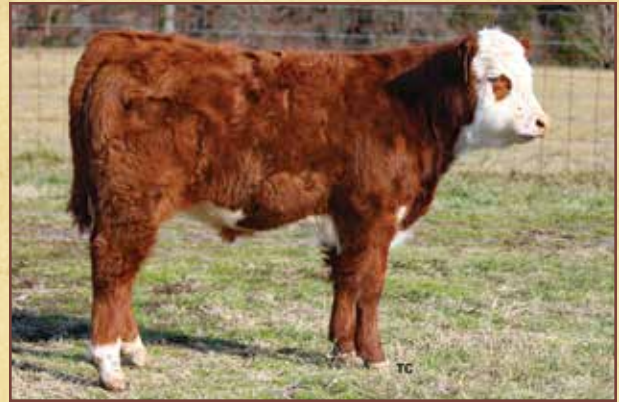
Lot 32A – Will-Via Mr. Endure