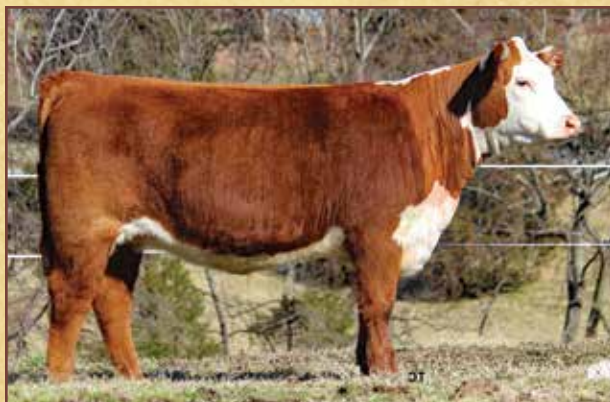
Lot 11 – NP Harper