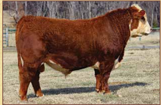
Lot 51 – GTW Kismet 2035

CE -4.0 (0.37); BW 4.1 (0.46); WW 69 (0.39); YW 123 (0.40); DMI 0.8 (0.13); SC 1.0 (0.34); SCF 21.7 (0.26); MM 29 (0.23); M&G 64; MCE -1.6 (0.18); MCW 97 (0.15); UDDR 1.50 (0.36); TEAT 1.50 (0.36); CW 78 (0.19); FAT 0.037 (0.21); REA 0.58 (0.19); MARB 0.15 (0.19); BMI$ 434; BIIS 525; CHB$ 125 • BW 85 lb., adj. WW 744 lb., adj. YW 1,282 lb., yearling SC 36.5 cm. • Consigned by W&A Hereford Farm, Providence, N.C.