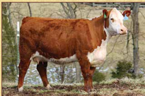
Lot 35 – TF Rita 831E 73E G004