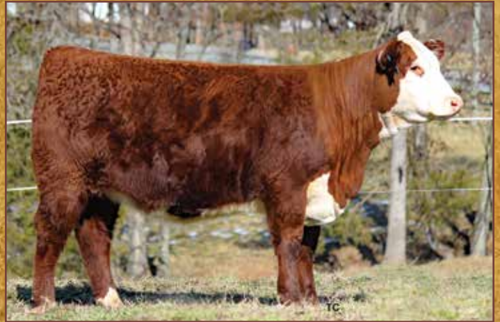
Lot 12 – NP Carol