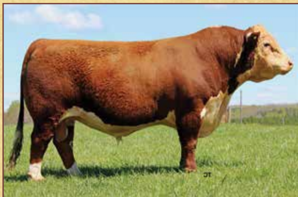
KCF Bennett Encore Z311 – Grandsire of Lot 20

CE 1.8 (0.41); BW 2.9 (0.48); WW 60 (0.43); YW 102 (0.43); DMI 0.8 (0.14); SC 1.2 (0.35); SCF 19.8 (0.28); MM 29 (0.28); M&G 59; MCE -0.4 (0.23); MCW 103 (0.16); UDDR 1.30 (0.40); TEAT 1.30 (0.41); CW 50 (0.10); FAT 0.067 (0.10); REA 0.49 (0.10); MARB 0.04 (0.10); BMI$ 366; BII$ 440; CHB$ 71 • 24H is a deep bodied, easy fleshing Frontier daughter out of a 4R dam, and should make a great brood cow. She will calve before sale day to NJW 133A 6589 Manifest 87G, who was the $200,000 high selling bull from the NJW bull sale last spring. Calf information available sale day. • Consigned by Hereford Hollow Farm, Wytheville, Va.