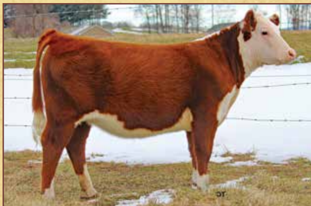
Lot 4 – PAC 358F 17G Whitney 07J

CE -0.1 (0.27); BW 3.6 (0.30); WW 53 (0.22); YW 86 (0.21); DMI 0.0 (0.08); SC 1.1 (0.13); SCF 13.4 (0.13); MM 22 (0.12); M&G 49; MCE 3.3 (0.17); MCW 109 (0.01); UDDR 1.30 (0.18); TEAT 1.30 (0.19); CW 64 (0.03); FAT 0.027 (0.03); REA 0.39 (0.03); MARB 0.36 (0.03); BMI$ 325; BII$ 410; CHB$ 137 This heifer is halter broke, and a well dispositioned show prospect and will make an even better cow for anyone. She is out of an almost perfect uddered cow that we raised that goes back to P606 and is sired by one of the Barnes 4013 sons. Consigned by PD Farms, Dobson, N.C.