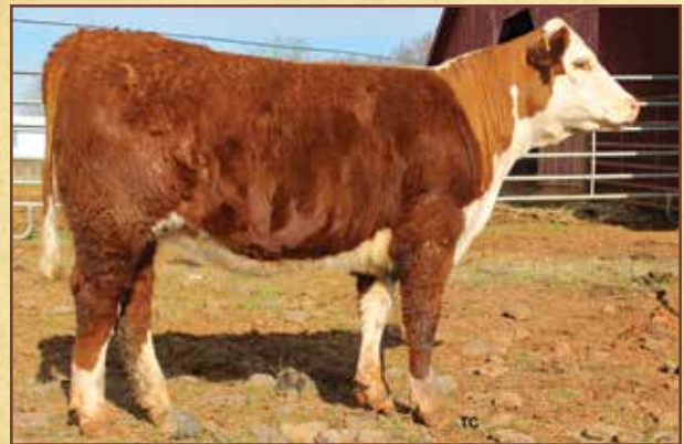
Lot 29 – 4B 724 MS Victress H43