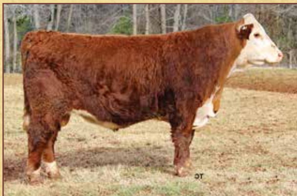
Lot 27 – 4B A250 808F Westbrook H26

Our first heifer offering by 242G. BW 89 lb. Consigned by Forrest Polled Herefords, Saluda, S.C.