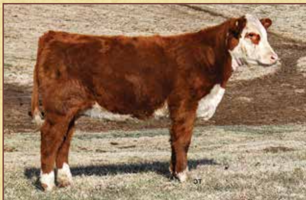
Lot 44A – DTF Belle Marie 33Z 1J29