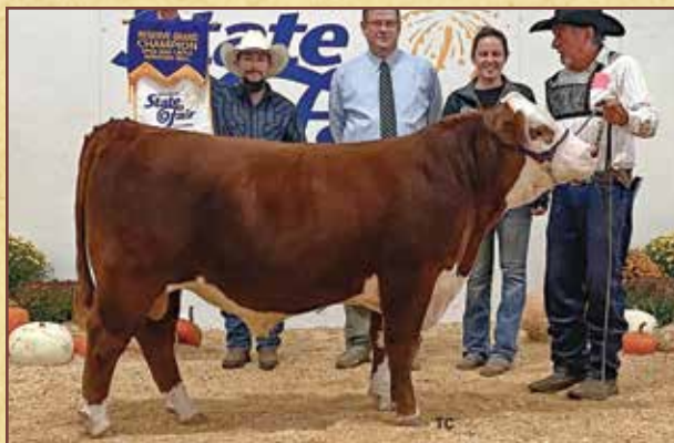
Lot 36 – GCC Next Step 071