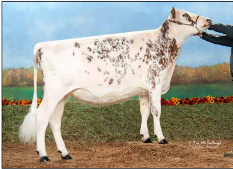
JCC SHOWSTAR VERA GRANDDAM OF LOT 27

KLEIN FAMILY 5191 S STATE ROAD ONE MILTON IN 47357 BRIAN 765-969-3315