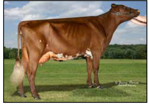
NORTH STAR DAKOTA RUBY, EX-90 DAM OF LOT 37