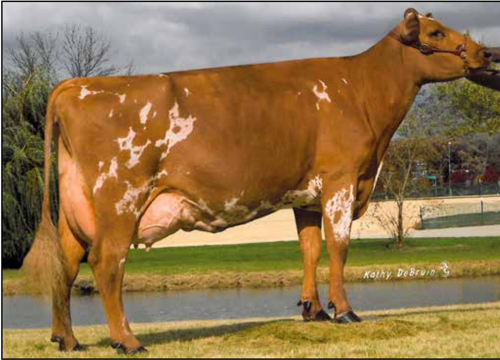
SHIREDALE PHIL'S SUSAN, EX-93 3E UNAN ALL-AMERICAN 4-YEAR-OLD, 2019 THIRD DAM OF LOT 30