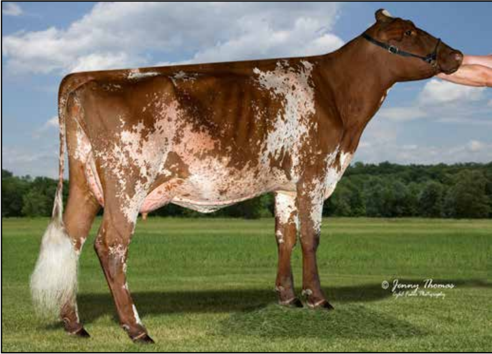
MOR-LOG CLANCY ROXANNE, VG-88 SELLING AS LOT 37