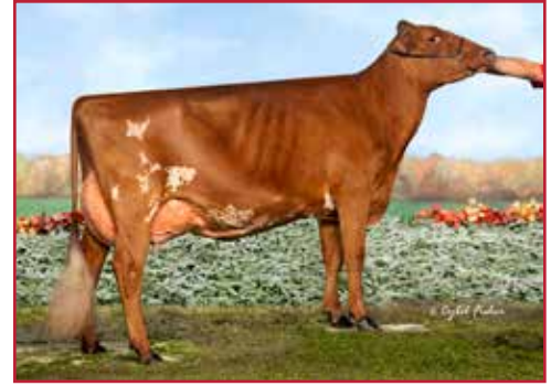
MARILIE REALITY MELANA-ET HM ALL-AMERICAN SR 2-YEAR-OLD, 2018 NOM ALL-AMERICAN SR 3-YEAR-OLD, 2019 MATERNAL SISTER OF LOT 7