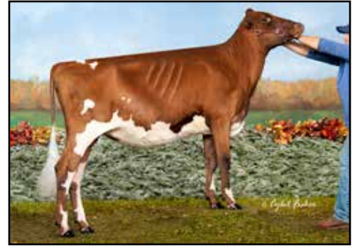
GVP DREAMER GABRIELLA-ET JR CHAMPION, 2016 WDE GRANDDAM OF LOT 22