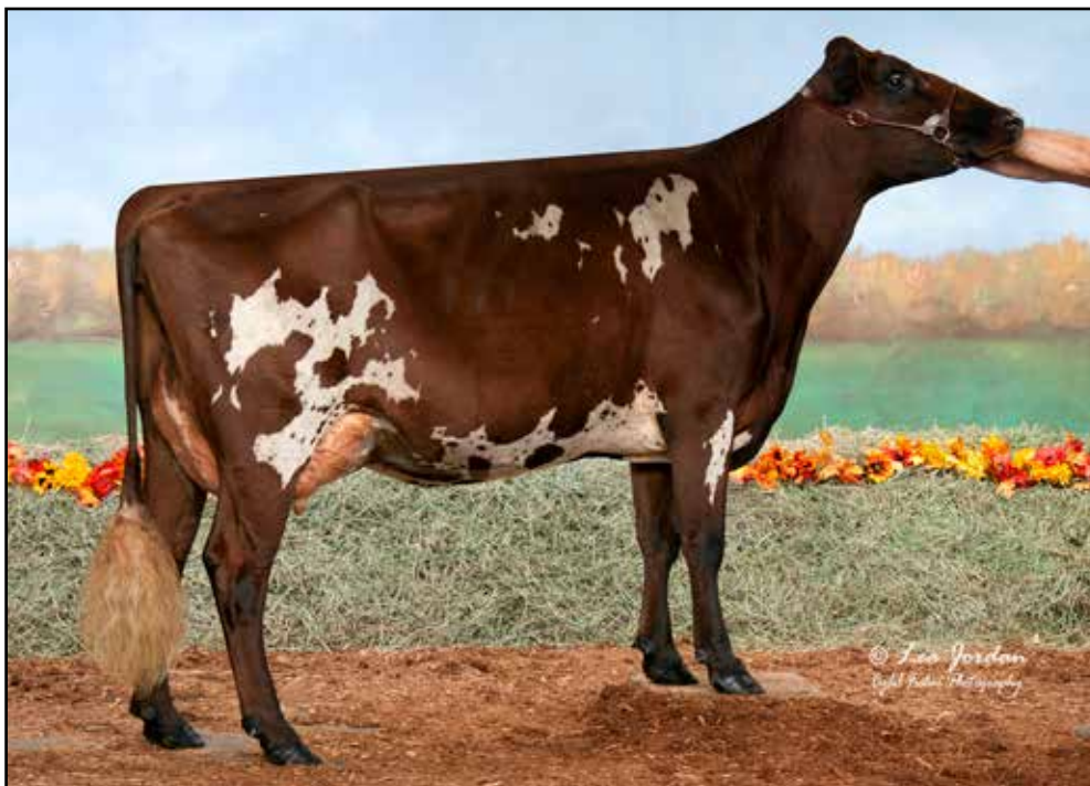
DOUBLE D FARM BURDETTE BELLE, EX-91 2E DAM OF LOT 4