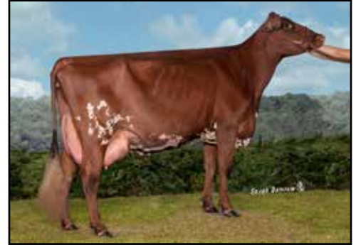
PALMYRA POKER GIGI-ET, EX-90 4-05 337D 24,780M 3.7% 911F 3.1% 780P FOURTH DAM OF LOT 22