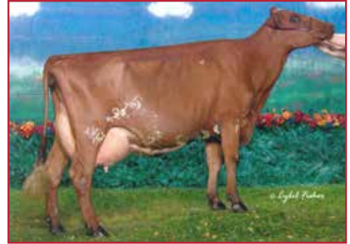
VIEUX VILLAGE RENO MARILYN, EX-93 5-04 306D 24,200M 4.5% 1083F 2.9% 698P ALL-AMERICAN 5-YEAR-OLD, 2007 FOURTH DAM OF LOT 29