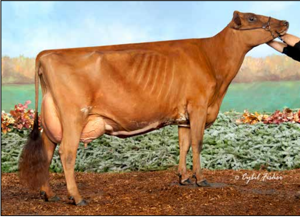
PALMYRA GIGI GABRIELLA-ET, EX-94 OVER 26,000M - 2X ALL-AMERICAN NOMINEE GREAT-GRANDDAM OF LOT 22