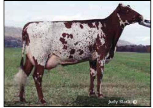
PALMYRA SATELLITE L GINGER, VG-86 6-00 298D 25,100M 3.1% 789F 2.9% 731P FOURTH DAM OF LOT 25