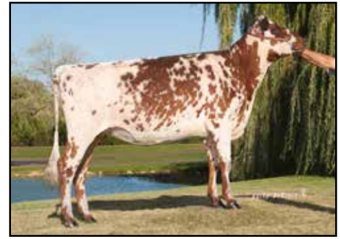
TOPPGLEN POKER SUZIE RES ALL-AMERICAN WINTER YEARLING, 2013 FULL SISTER TO DAM OF LOT 30