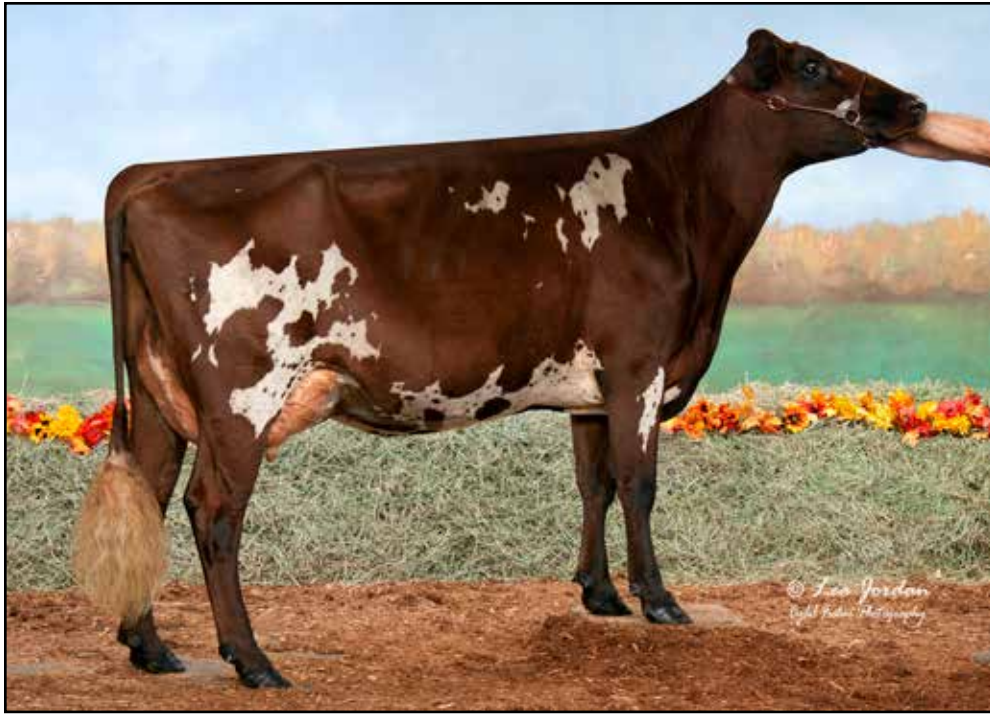
DOUBLE D FARM BURDETTE BELLE, EX-91 2E GRANDDAM OF LOT 17