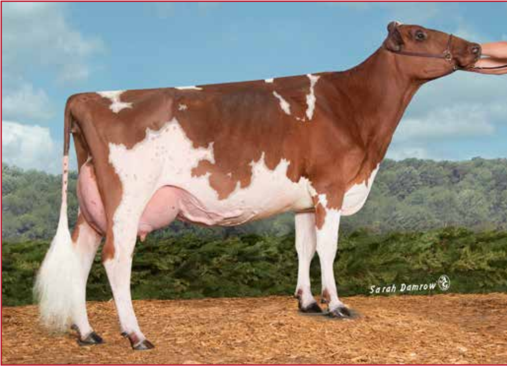
SCO-LO REALITY MADDIE-ET, EX-92 2E ALL-AMERICAN SR 2-YEAR-OLD, 2015 FULL SISTER TO GRANDDAM OF LOT 29