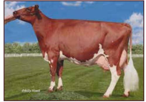
MAPLE-DELL ZORRO DAFOURTH EX-95 2E 6-01 365D 30,950M 4.5% 1387F 3.0% 939P 2X RESERVE ALL-AMERICAN FIFTH DAM OF LOT 32