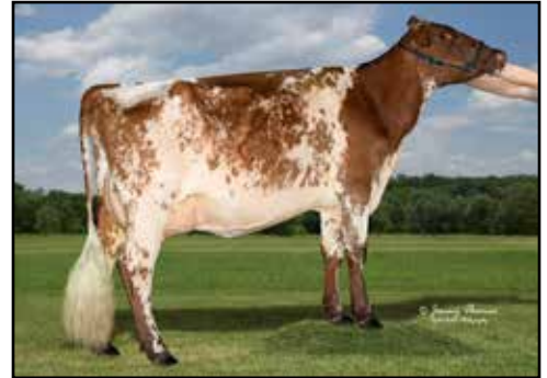
MOR-LOG MYZER RUMOR 1ST OHIO STATE FUTURITY 2021 1ST JR 2-YEAR-OLD, RES INT CHAMPION & HM GRAND CHAMPION, 2021 OHIO STATE FAIR OPEN SHOW DAUGHTER OF LOT 37