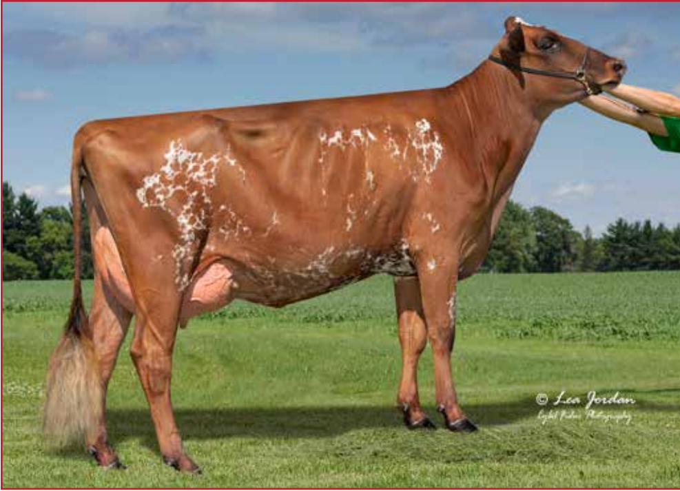
MARILIE BURDETTE MELAKA-ET, VG-88 RES ALL-AMERICAN MILKING YEARLING, 2020 SELLING AS LOT 7