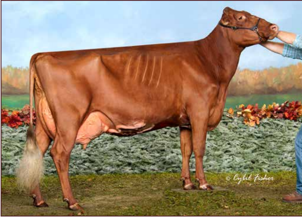
GOOD-VUE REALITY DASH-ET, EX-92 5-00 312D 22,730M 3.5% 798F 3.3% 741P 2X NOMINATED ALL-AMERICAN GREAT-GRANDDAM OF LOT 32