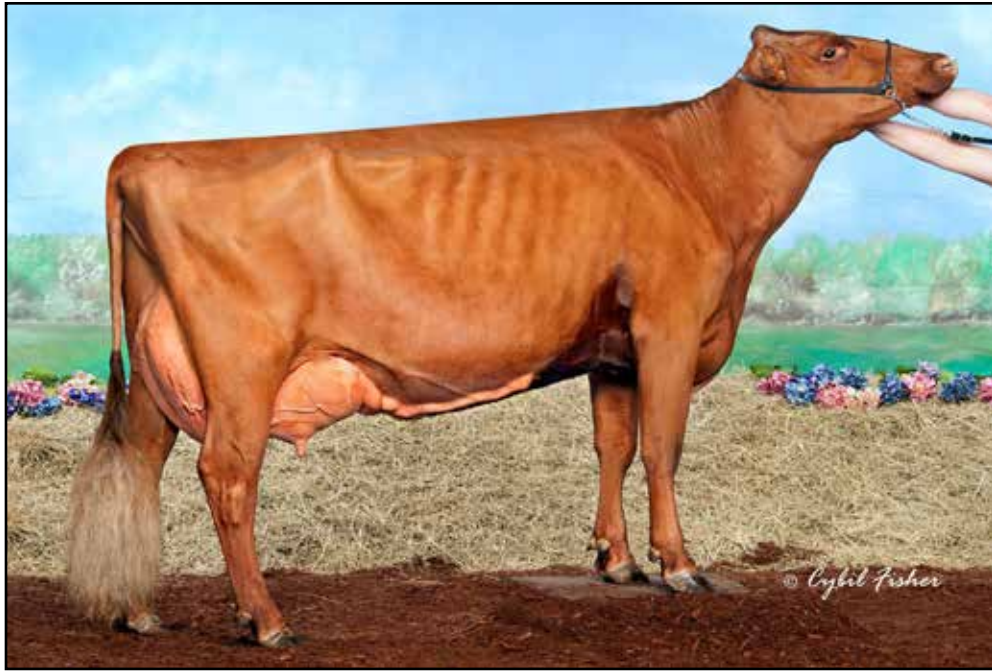
HARD CORE PREMIUM FIRE MAID EXP, EX-94 2E GRANDDAM LOT 41