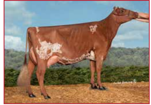
SCO-LO REALITY MYSTIQUE, EX-92 3-05 3 308 29860 3.2 955 2.8 843 RES ALL-AMERICAN SR 2-YEAR-OLD, 2015 GRANDDAM OF LOT 29