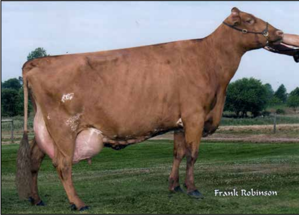
PALMYRA RAVEN S. GINGER, VG-89 7-03 365D 33,490M 4.3% 1453F 2.9% 976P THIRD DAM OF LOT 25