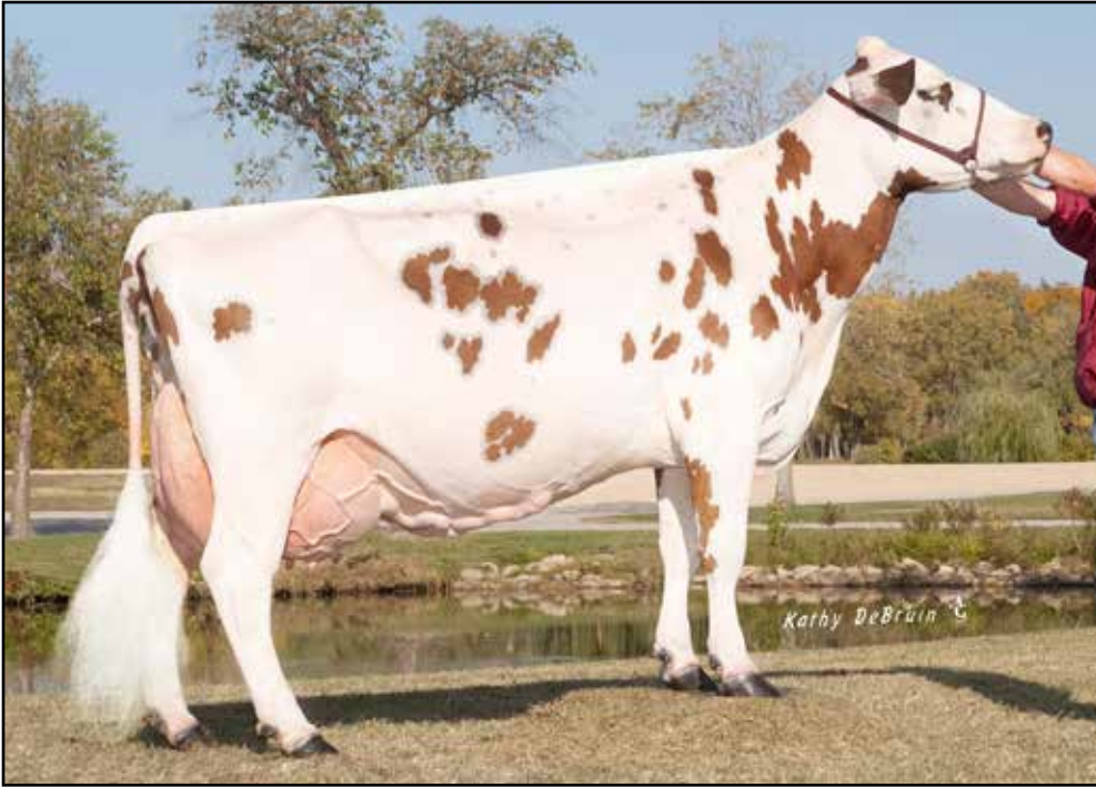
TMB SPECIAL K HELOISE, EX-93 3E 6-02 365D 34,920M 4.8% 1675F 3.4% 1186P GREAT-GRANDDAM OF LOT 31