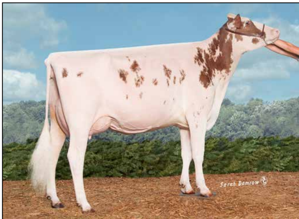
MACKINSON OBLIQUE DARCY, EX-91 3E 6-10 305D 28,930M 3.2% 940F 2.8% 814P GREAT-GRANDDAM OF LOT 16