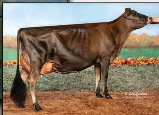
RIVER VALLEY EXCITATION FLAWLESS-ET EX-93% 2nd DAM OF LOT 16 All-American Senior 3-Year-Old 2019