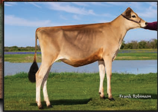
MM GENTRY JUNIPER-ET LOT 17

Lot 17 MM GENTRY JUNIPER-ET 840 3245152433 AMID: 17678 Born: December 7, 2021 *2nd Winter Calf, Western National Spring Jersey Show 2022*