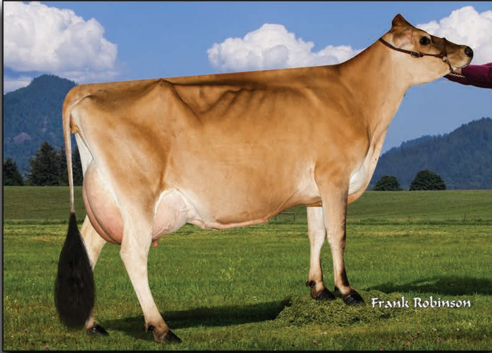
ROG-AL CHROME SHELBY EX-90% 2nd DAM OF LOT 1G