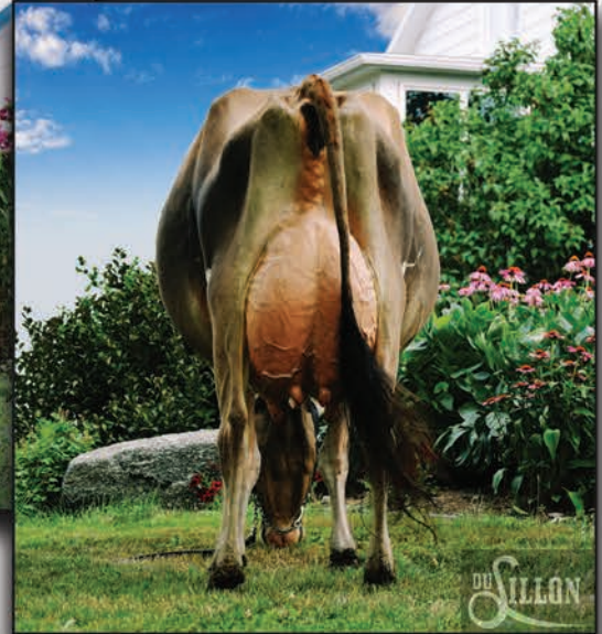
LOOKOUT FOREVER IMPRESSED VG-88% DAM OF LOT 3B

Nominated All-Canadian Junior Yearling 2016