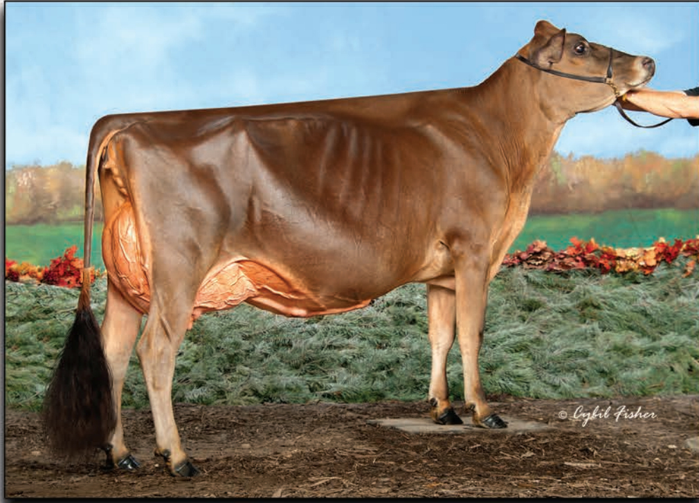
MUSQIE JOEL VILLETTA EX-90% DAM OF LOT 44

Reserve ABA All-American Junior 3-Year-Old 2020