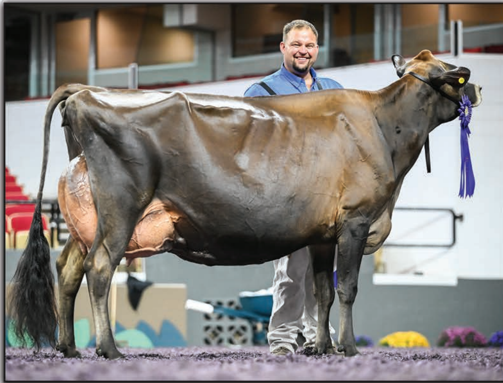
BRI-LIN VALSON SPRITZ EX-96% 2nd DAM OF LOT 96