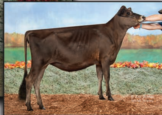
ARETHUSA GENTRY CHANTILE-ET VG-87% DAM OF LOT 83

Grand Champion, Royal Agriculture Winter Fair 2010