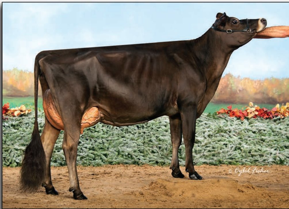
LLR TEQUILA EXCITEMENT VG-89% DAM OF LOTS 38-43 ABA All-American Senior 2-Year-Old