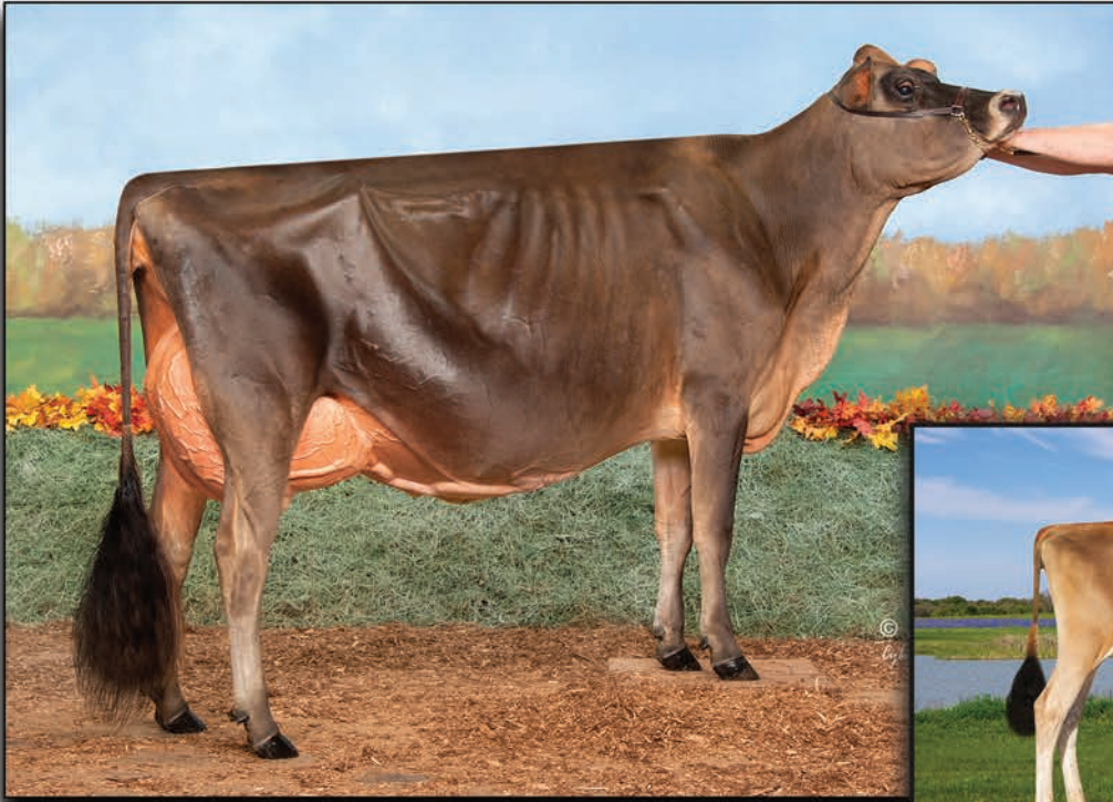
LONE PINE JOEL JUGOJUICE 9807 EX-94% DAM OF LOTS 17 & 18 All-American 5-Year-Old & Best Udder 2021