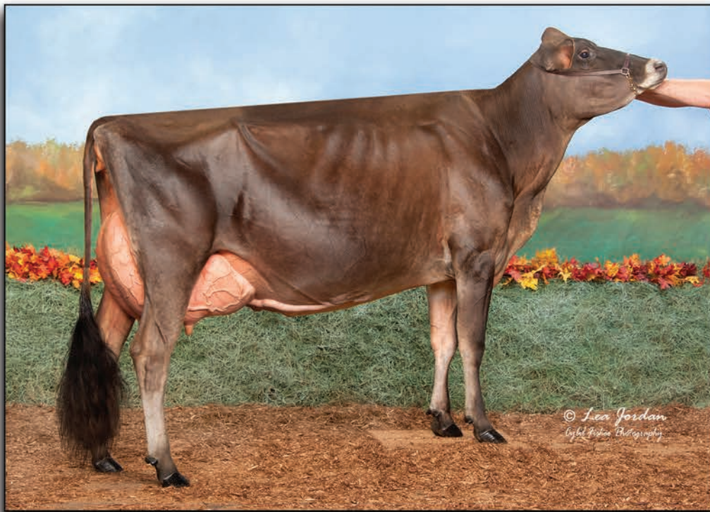
TOP GENE JOEL PASTEL EX-91% DAM OF LOTS 27-30 Reserve All-American Senior 3-Year-Old 2021