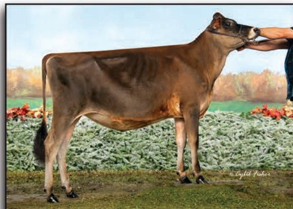
SOUTH MOUNTAIN AJ RAMBLIN ROSE-ET EX-90% DAM OF LOT 78 (PICTURED AS FALL CALF)

Lot 78 MM FRANK REVERE-ET 840 3250240916 AMID: 18645 Born: March 7, 2022