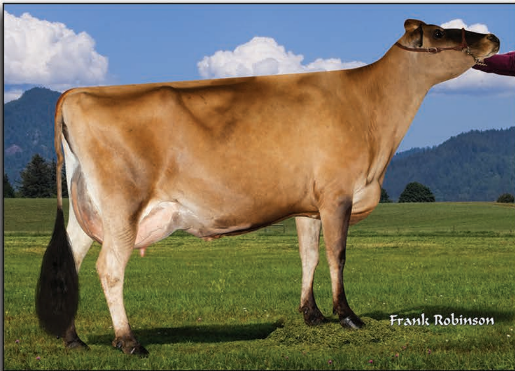
ROSEBUDS EXCITING ROSINA-ET VG-88% DAM OF LOTS 31-35