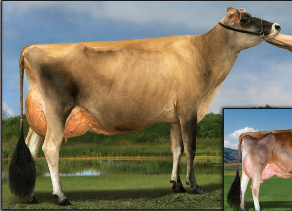
CROSSBROOK HG DIXIE-ET EX-94%