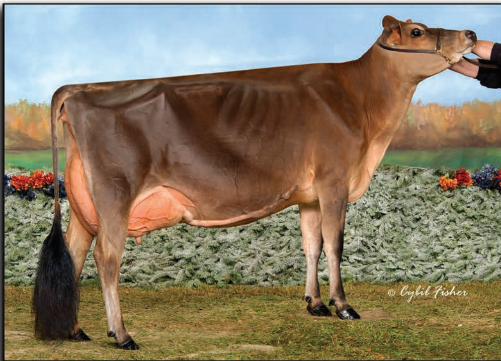
CHILLI PREMIER CINEMA-ET EX-93% 2nd DAM OF LOTS 90 & 91 ABA All-American Junior 3-Year-Old 2015

Lot 90 MM BONTINO CROSSWORD-ET 840 3245152430 AMID: 17675 Born: December 7, 2021