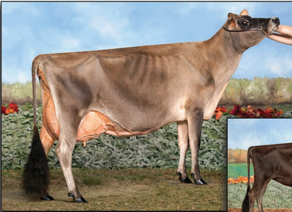
ARETHUSA VERONICAS COMET-ET EX-95% 2nd DAM OF LOT 83

Grand Champion, Royal Agriculture Winter Fair 2010