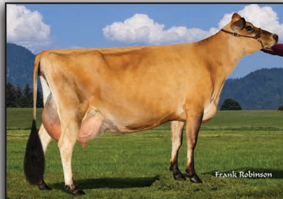
SOUTH MOUNTAIN VOLTAGE RAZOR-ET EX-90% DAM OF LOTS 76 & 77