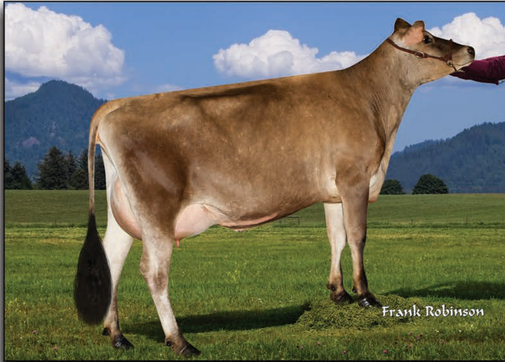
MM LOOT RUSTY 12629 {5} DAM OF LOT 2G & 3G