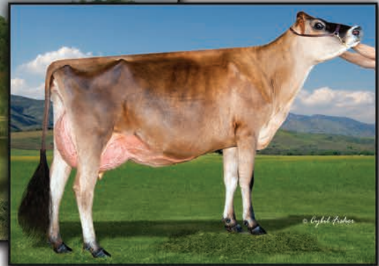
DIXIES PREMIER DARLING EX-92%

Unanimous All-Canadian Senior 2-Year-Old 2015