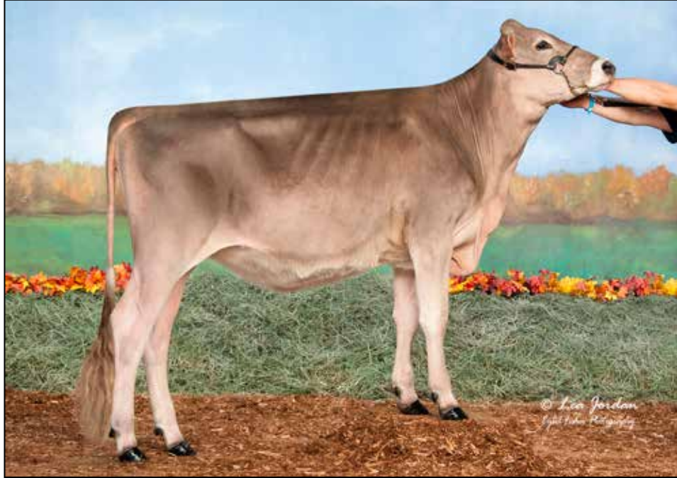
DUBLIN HILLS SIZZLE TWIN MATERNAL SISTER TO LOT 1