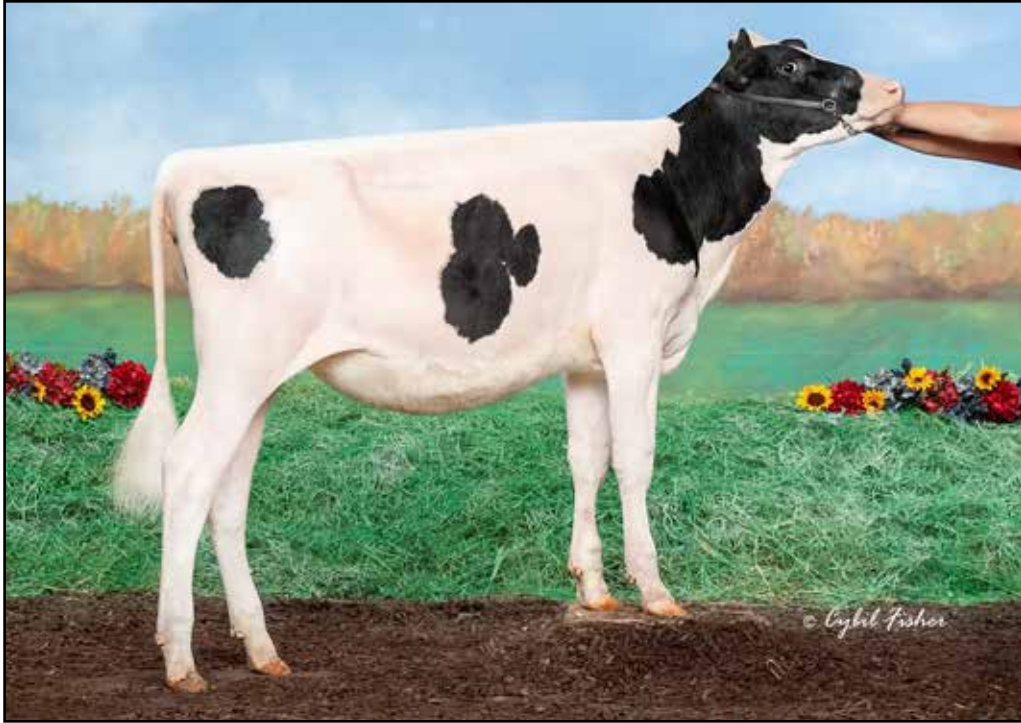
LOCUST-AYR HOTLINE MOLLY MATERNAL SISTER TO LOT 12