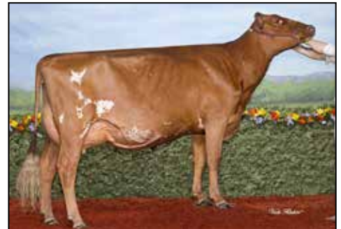
MARILIE REALITY MELANA-ET VG-88-CAN FULL SISTER TO DAM OF LOT 34