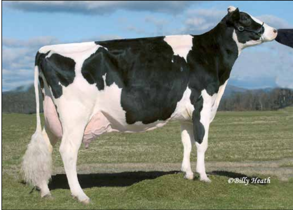
WINDSOR-MANOR RUD ZIP EX-95 4E GMD DOM 4TH DAM OF LOT 10