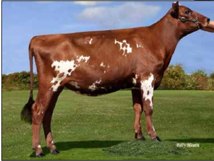
SHIR-LYN LOCHINVAR DAISY DAM OF LOT 35