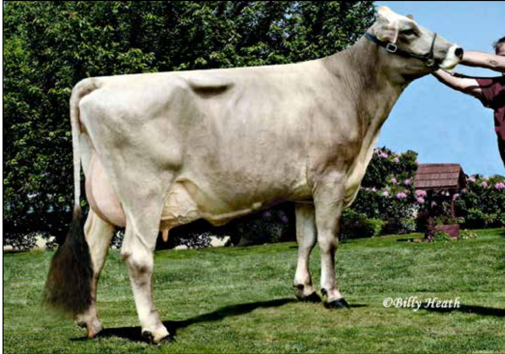
DUBLIN-HILLS SASHA EX-93 4E 2ND DAM OF LOT 2