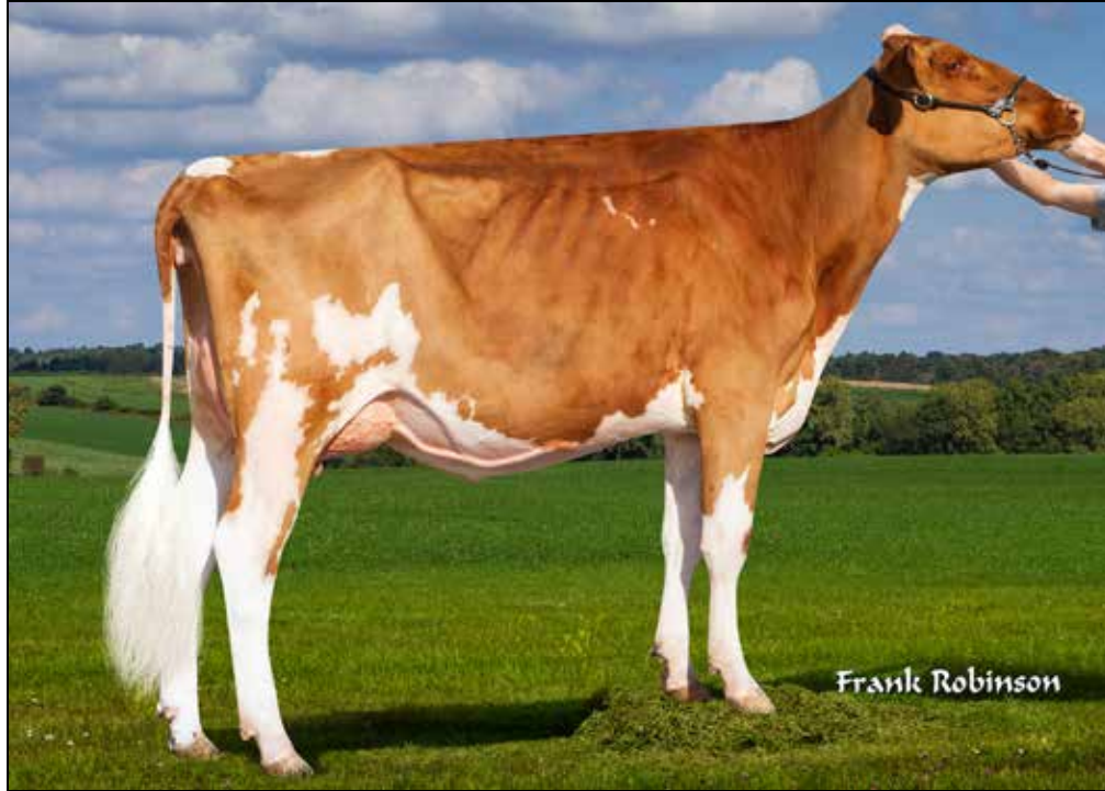
MAPLE-DREAM UNSTP MAPLE-RED DAM OF LOT 31