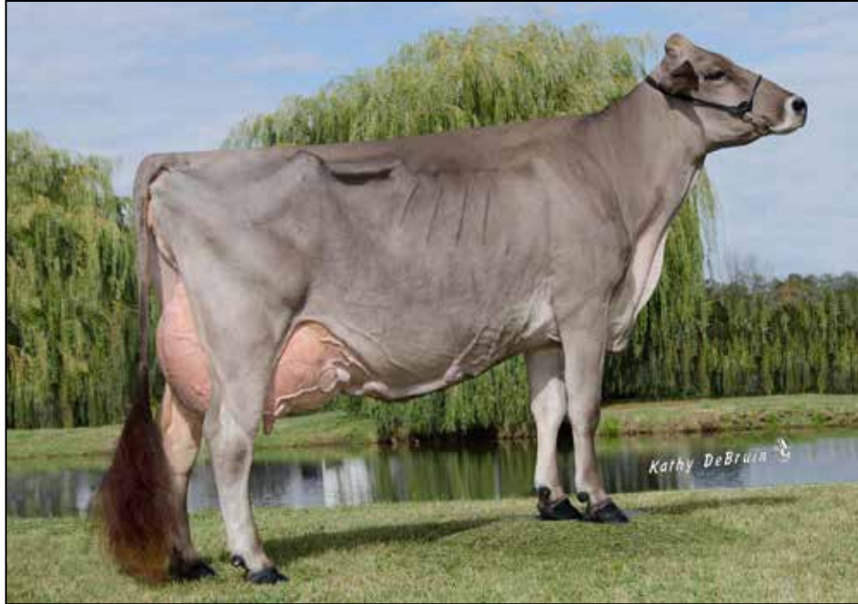
TOP ACRES SUPREME WIZARD-ET EX-95 3E 2ND DAM OF LOT 24