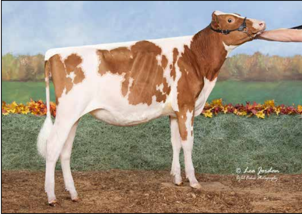
LOCUST-AYR MONOPOLY INEZ-RED SELLS AS LOT 32