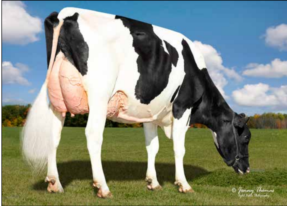
JOBO MOGUL 8057 EX-92 EX-MS DAM OF LOT 8