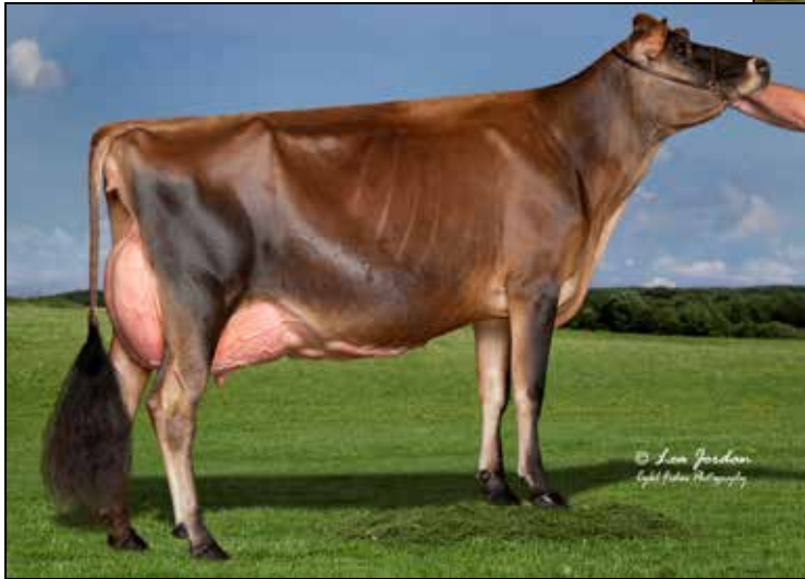
STONEY POINT BELMONT FASHION EX-94 SAME FAMILY AS LOT 19