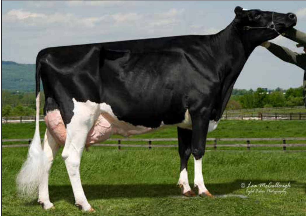
RC-LC GOLDWYN ATM EX-92 DOM 4TH DAM OF LOT 9