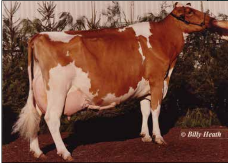
DERRWYN FACTOR MIATA-RED EX-94 2E 5TH DAM OF LOT 30