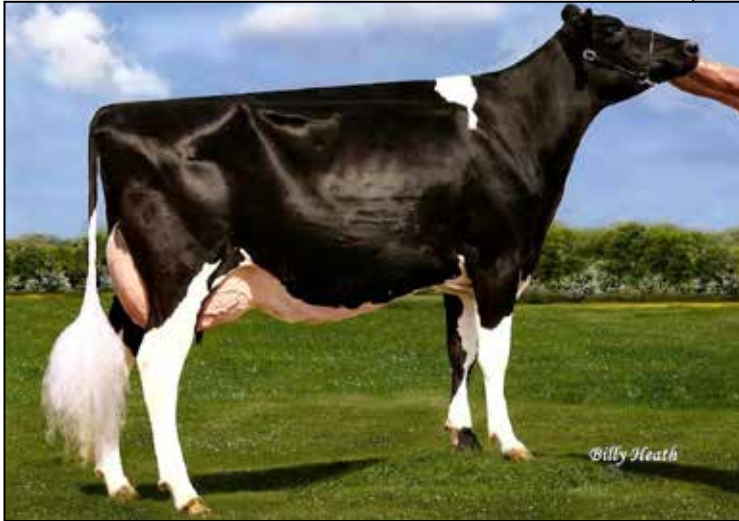
R-E-W CHARM BRACELET-ET EX-92 EX-MS 3RD DAM OF LOT 7