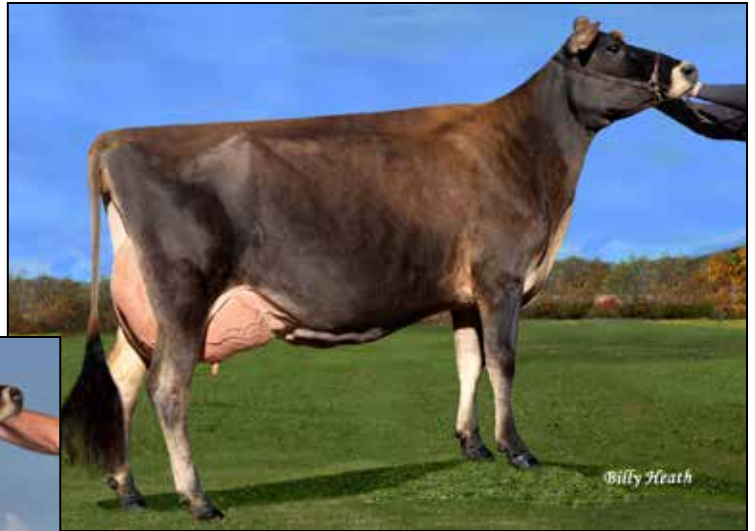
STONEY POINT VINDICATION FALINE EX-95 SAME FAMILY AS LOT 19