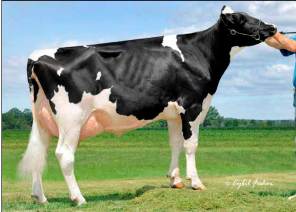
APPEALING SHOTTLE KELSEY EX-91 MATERNAL SISTER TO DAM OF LOT 6