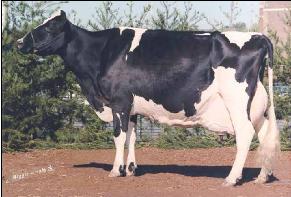
EHRHARDT ASTRO JODY-ET EX-94 EEEEE 2E 7TH DAM OF LOT 11