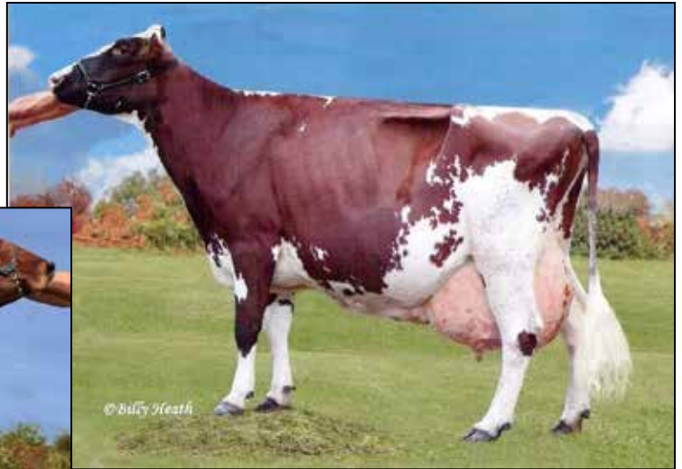
R-LYN TRIDENT JODEE 4E-93 5TH DAM OF LOT 35