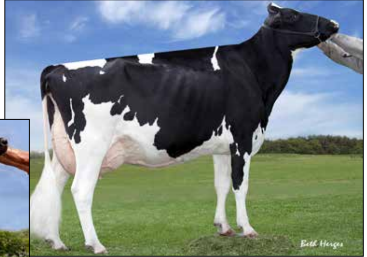
REGANCREST S CHASSITY-ET EX-92 EX-MS GMD DOM 5TH DAM OF LOT 7