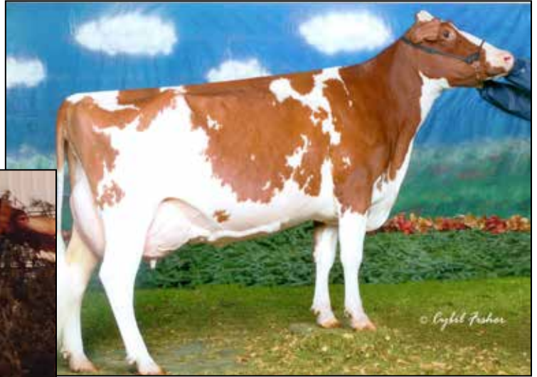
DERRWYN MISS SPEICAL-RED-ET EX-94 4E DOM MATERNAL SISTER TO 4TH DAM OF LOT 30