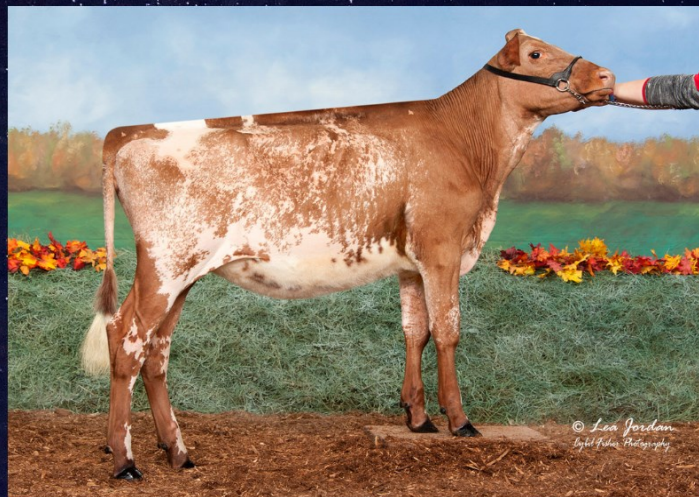
Hillholm Fstr Briar Rose - EXP - ET