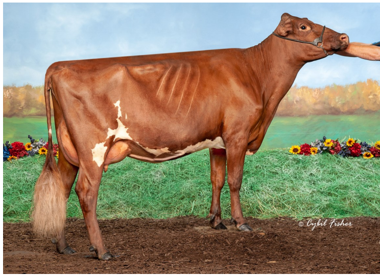
Briar Rose R Alibi Dam of Lot 23 MS