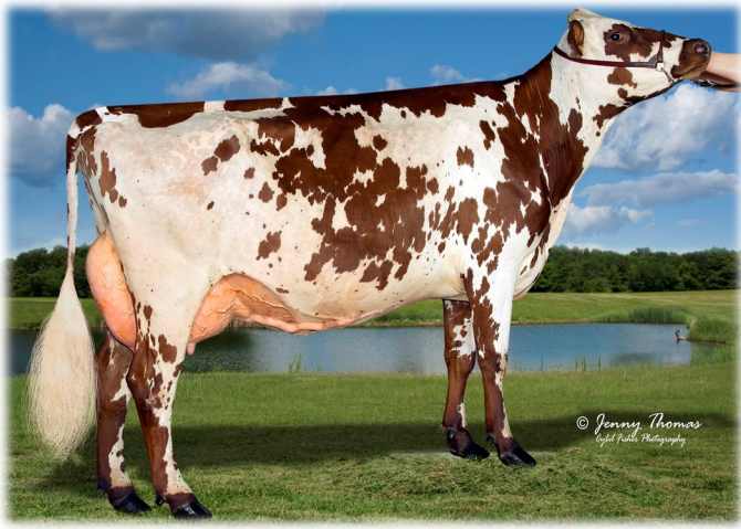
Spring-Vale Apple Cinnamon EX 91