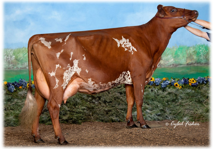
Spring-Vale Burdette Apple EX 91