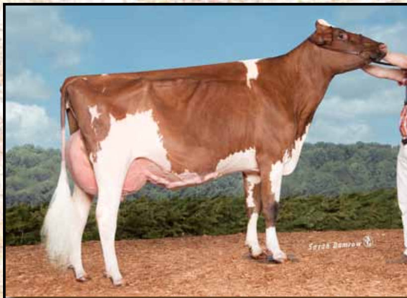
PAULINN PSC MEME 919-RED-TW EX-92 Maternal Sister to Granddam of Lot 11