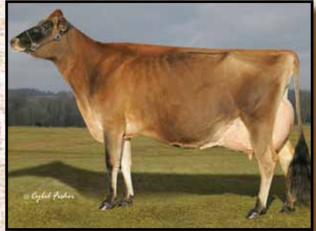
LLOLYN JUDE GRIFFEN-ET 4E-95% 3rd Dam of Lot 61