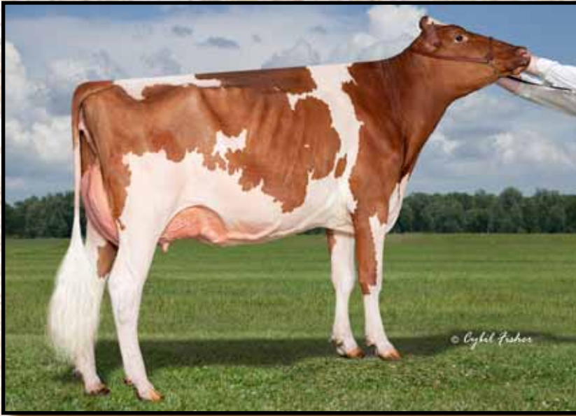
MS ROLLNVIEW JUMP4FUN-RED-ET VG-88 Dam of Lot 14