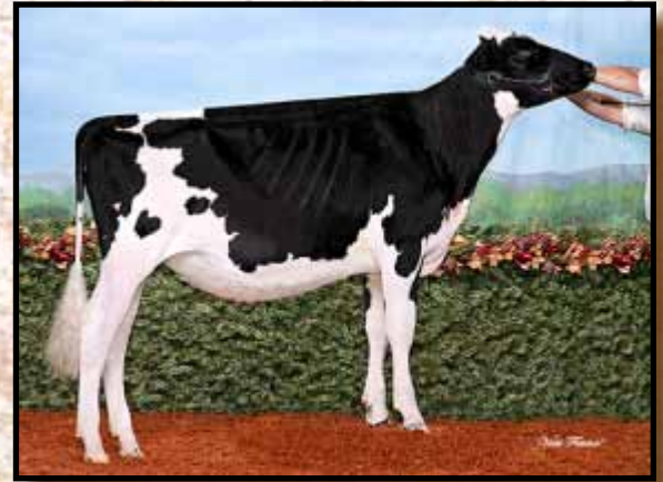
MISS OCD DOORM GEORGETTE-ET VG-88 Dam of Lot 15