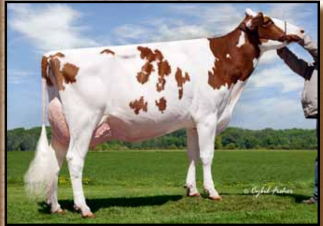
SILVERMINE ADV TALLY-RED-ET 2E-93 Granddam of Lot 26