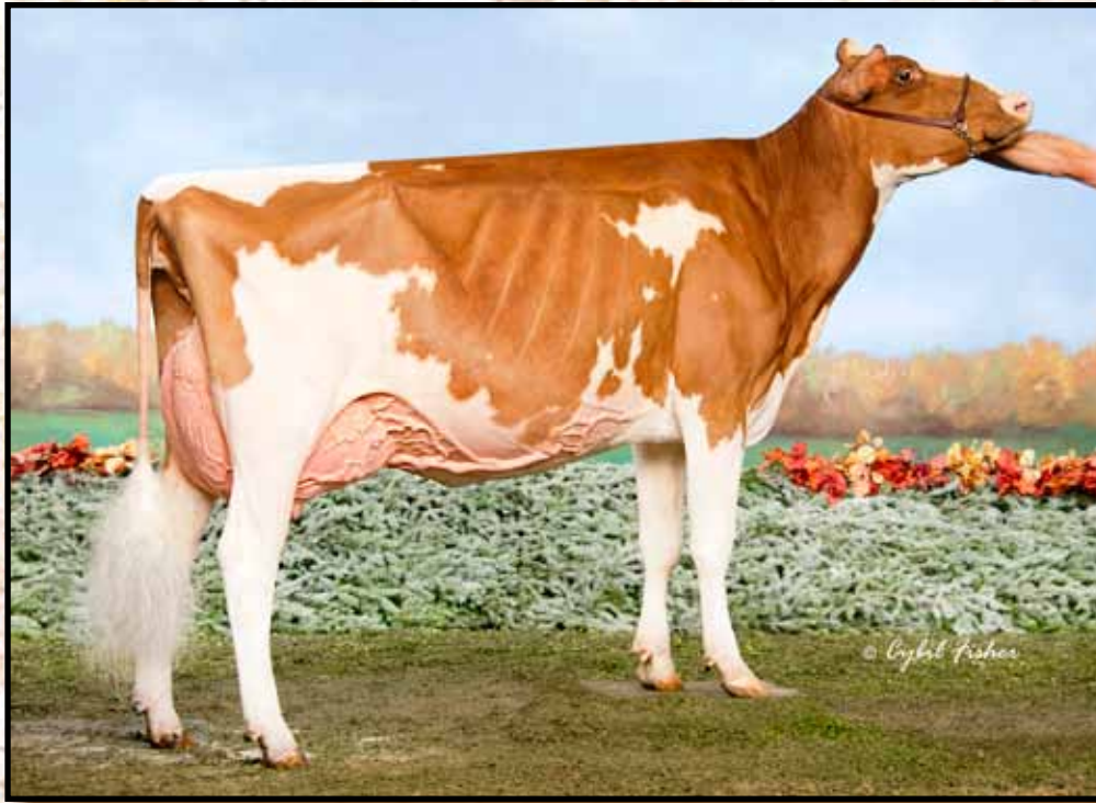
SIEMERS AWESOME GREAT-RED 2E-93 Dam of Lot 6