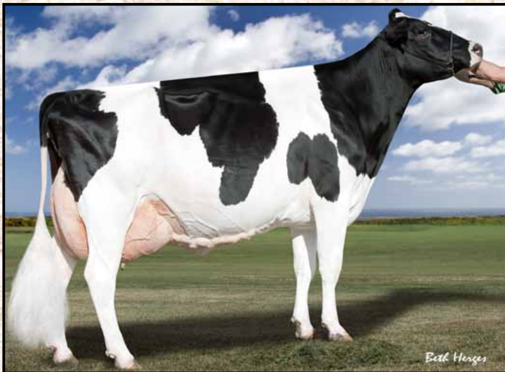
DELE STORMATIC SHADAISY EX-94 4th Dam of Lot 38