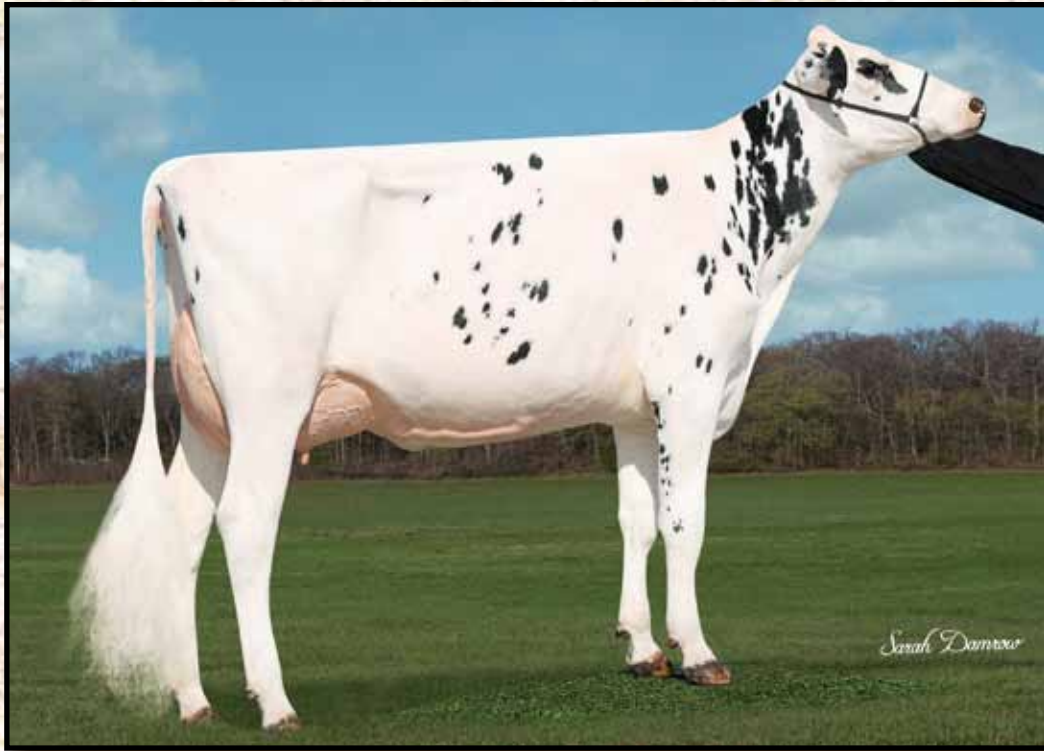
GROVES-VU AXL LATTITUDE VG-85 Dam of Lot 24