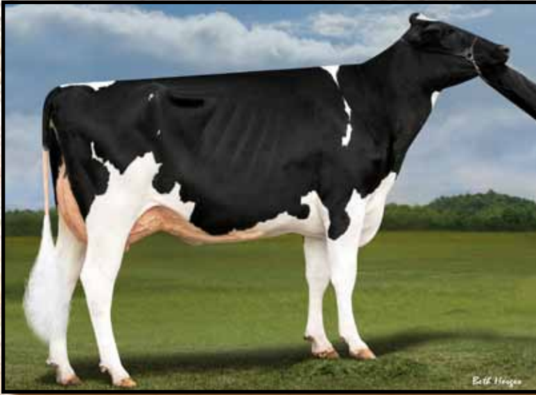
GOLDEN-OAKS SID CREOLE-ET VG-87 Dam of Lot 35