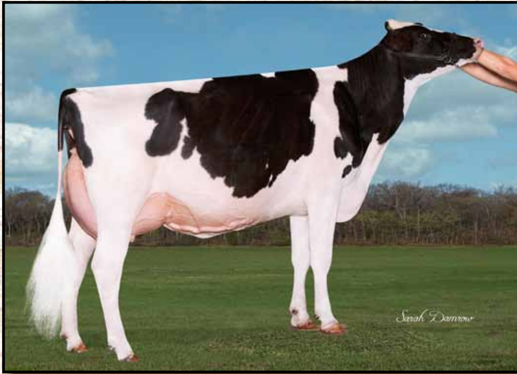
ARAGORN MADE YOU LOOOK 2E-94 Granddam of Lot 33