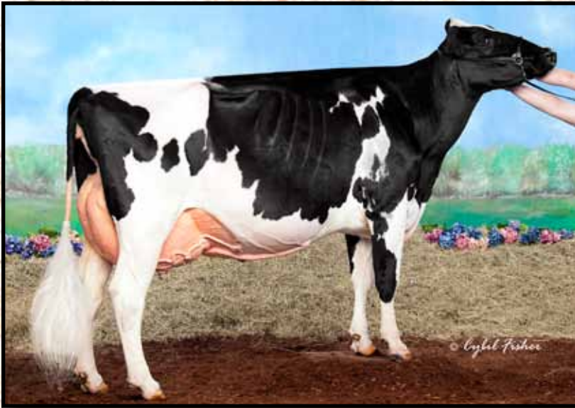
PENLOW GEOGRAPHY GOLDWYN-ET EX-94 Granddam of Lot 15