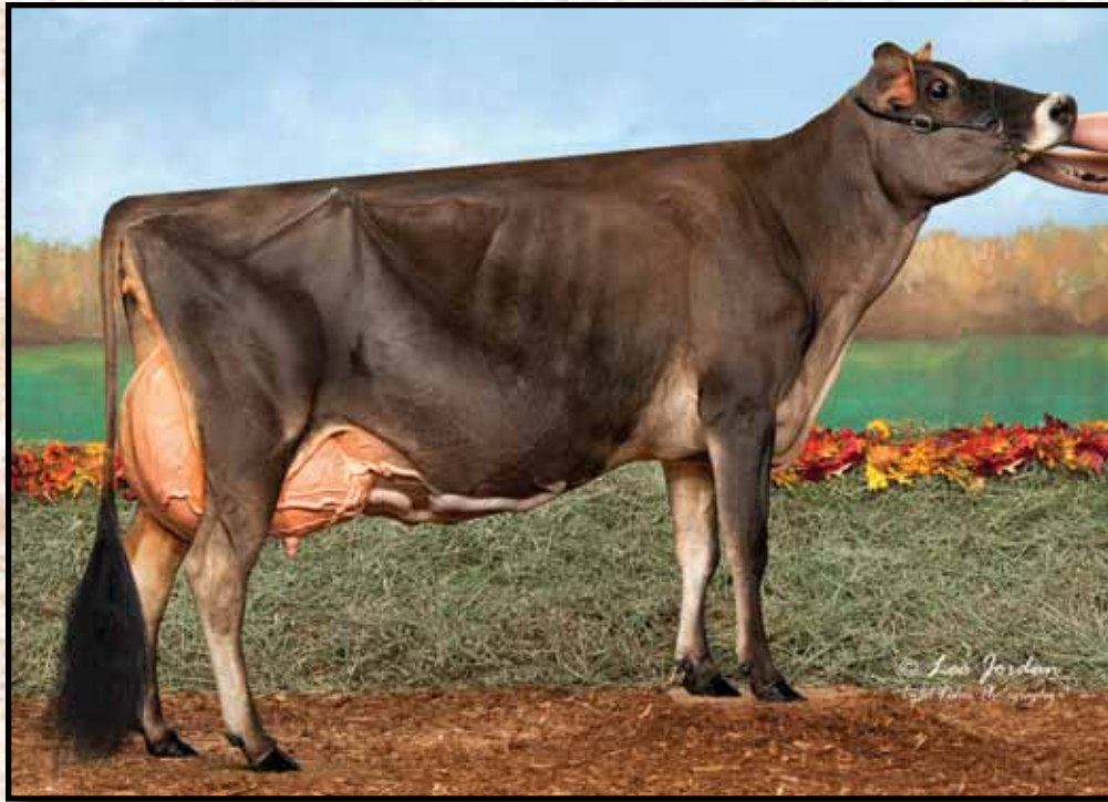
DISCOVERYS TEQUILA JEWELENE EX-94% Full Sister to Dam of Lot 62