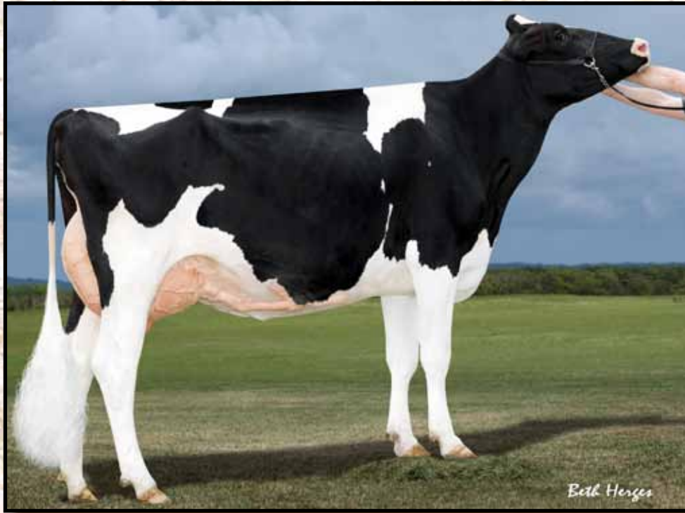
HILROSE BALTIMOR PENNY-ET EX-93 3rd Dam of Lot 28