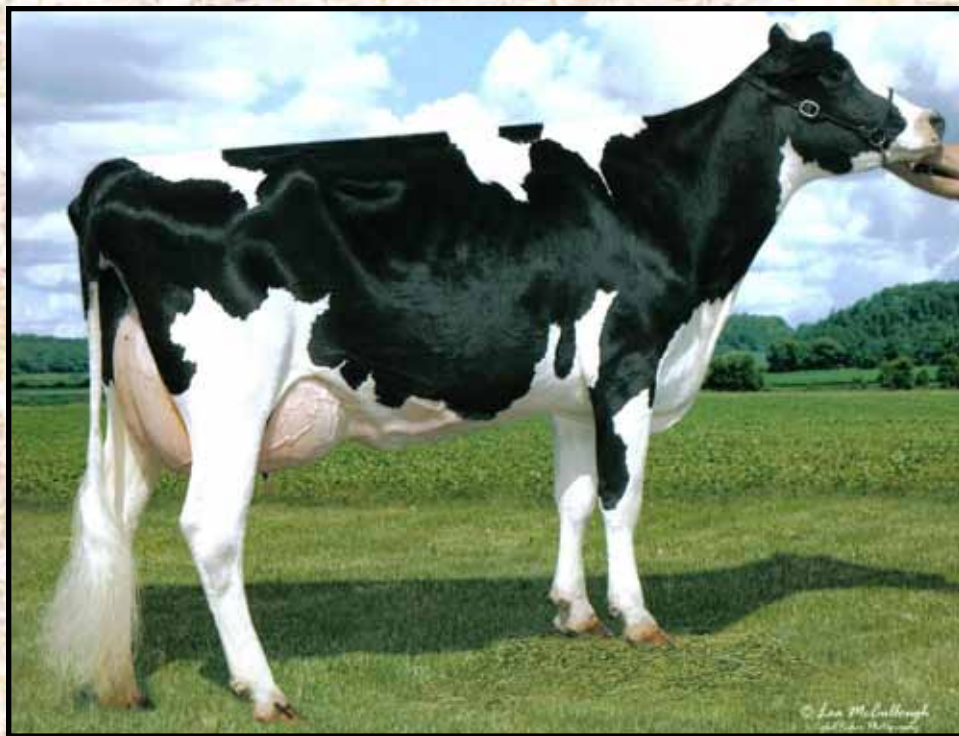
JEFFREY-WAY TISH 3E-93 GMD DOM 4th Dam of Lot 39