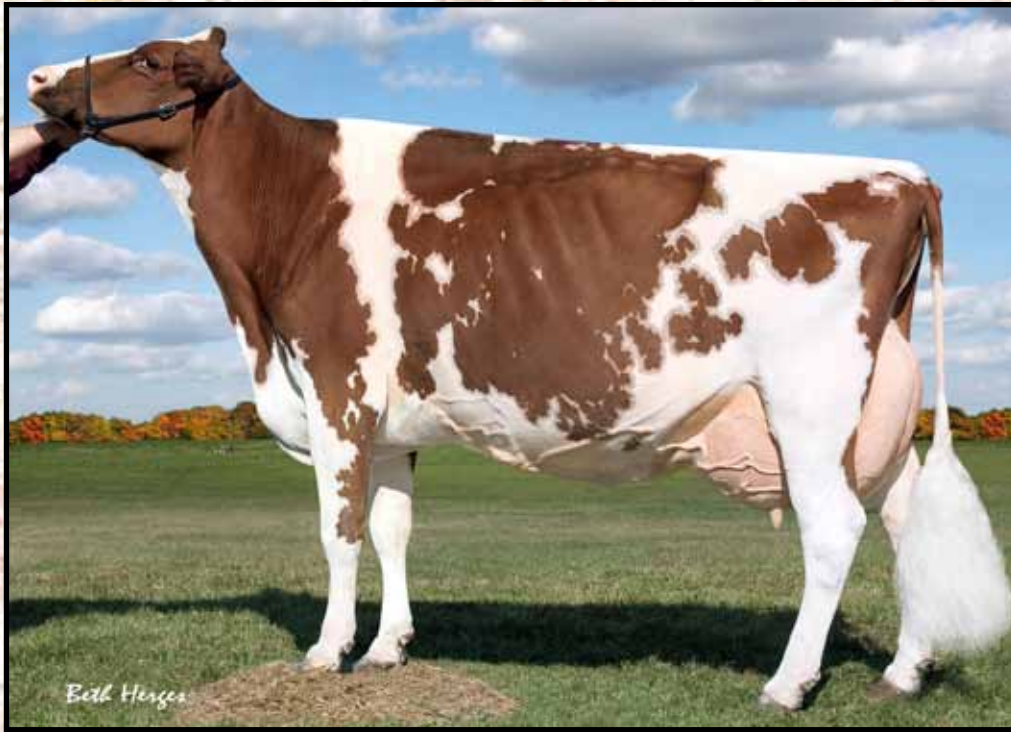
LAVENDER RUBY REDROSE-RED 4E-96 3rd Dam of Lot 3