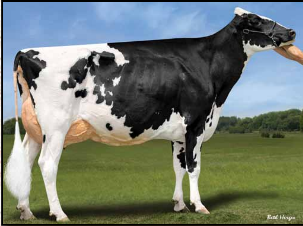
MS GOLD BARBARA BRISK-ET 2E-93 Dam of Lot 4