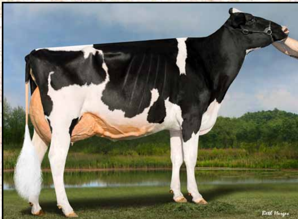
APPLE-PTS AMITA-ET EX-93 Dam of Lot 12