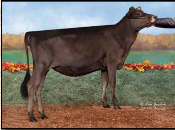
RATLIFF LO LALALA DANCER-ET Full Sister to Lot 64