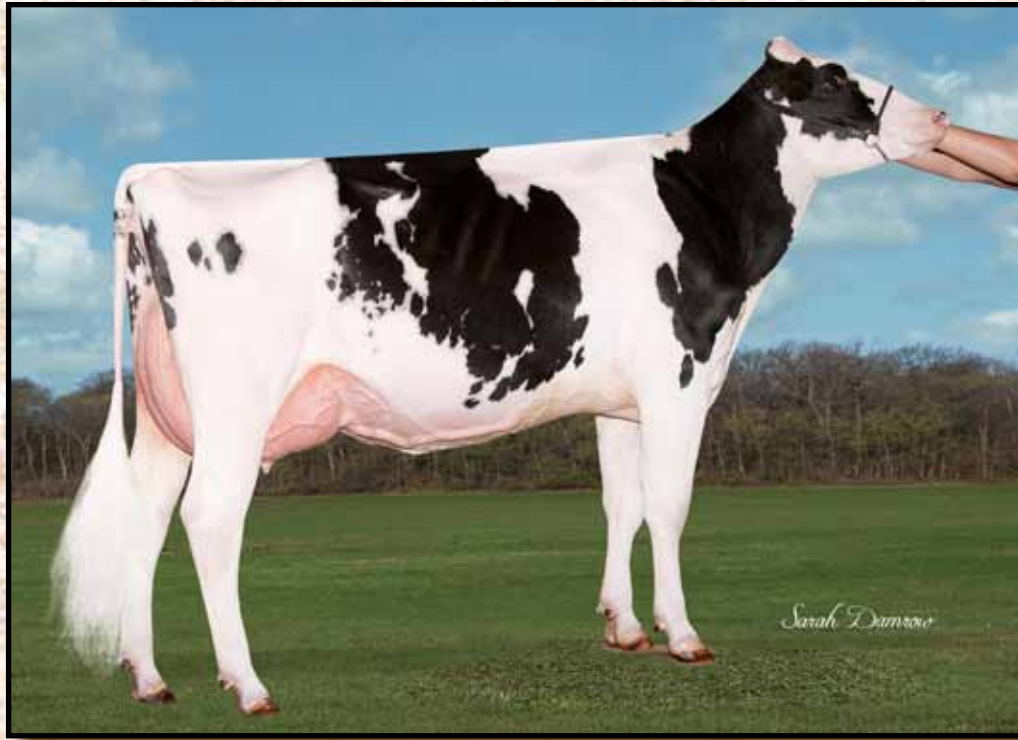
FRIESS-JK LISCENCE ERICA EX-90 Granddam of Lot 31; Maternal Sister to Dam of Lot 32