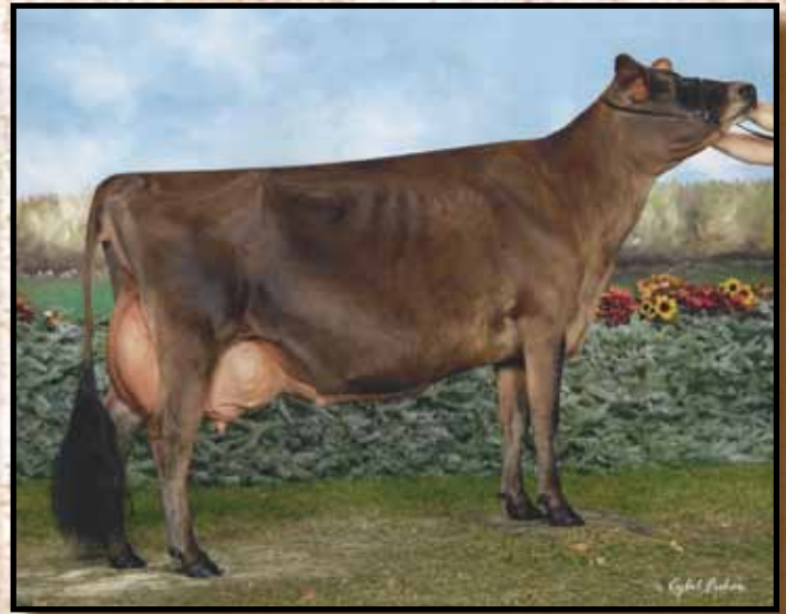
ARETHUSA PRIMETIME DEJA VU-ET EX-95 Granddam of Lot 64