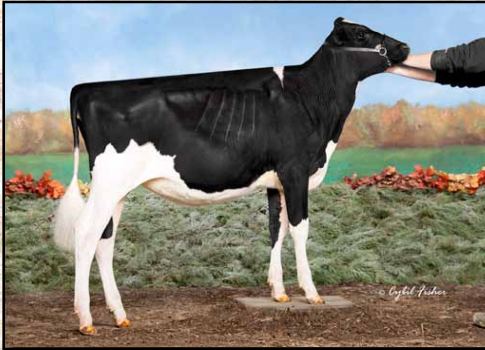
WINRIGHT ATWOOD CORONA-ET Selling: Lot 37