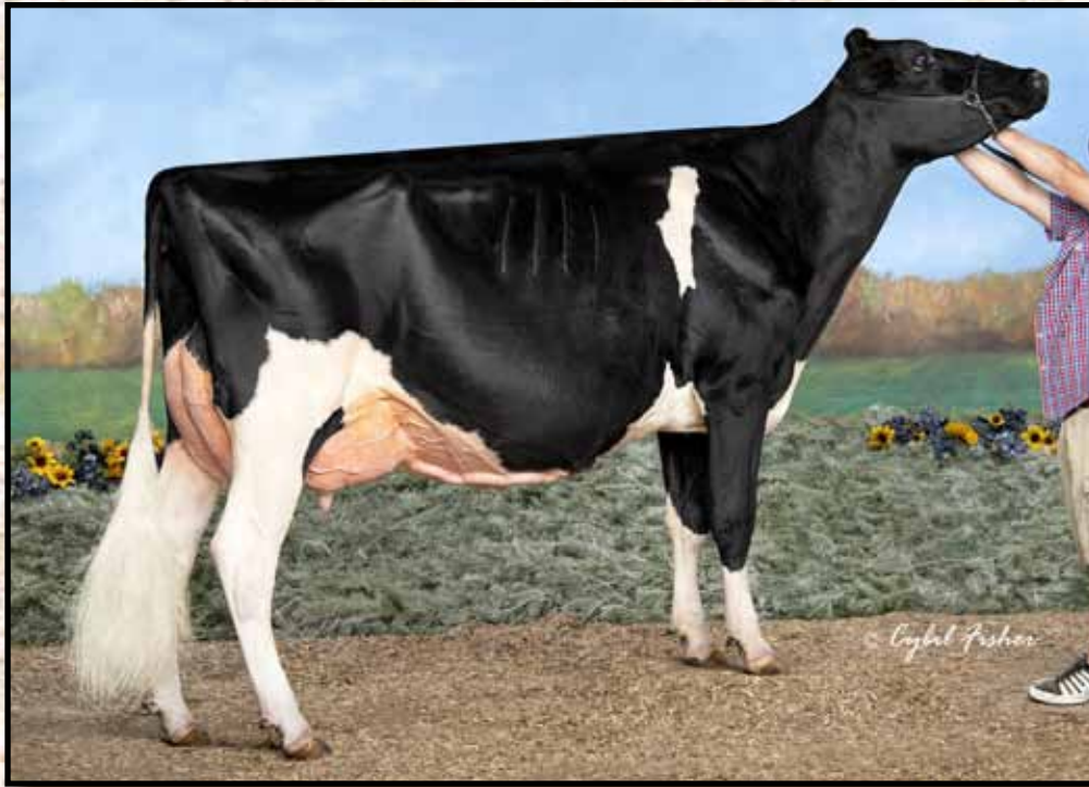
T-TRIPLE-T-I DURHAM POPPI EX-95-2E Granddam of Lot 13