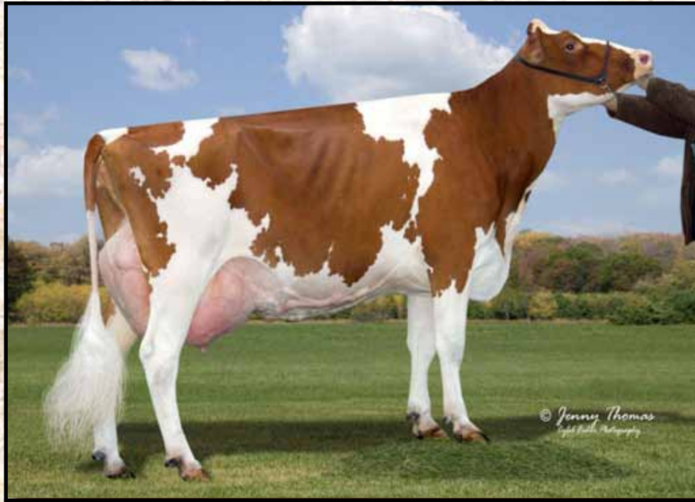
SCRATCHWELL ROSITA-RED-ET EX-90 Granddam of Lot 29