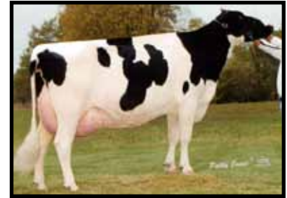
Tri-Day Ashlyn-ET 5th Dam of Lot 53

The College of the Ozarks PO Box 17 Point Lookout, Missouri 65726 417-838-1093 rbilyeu@cofo.edu