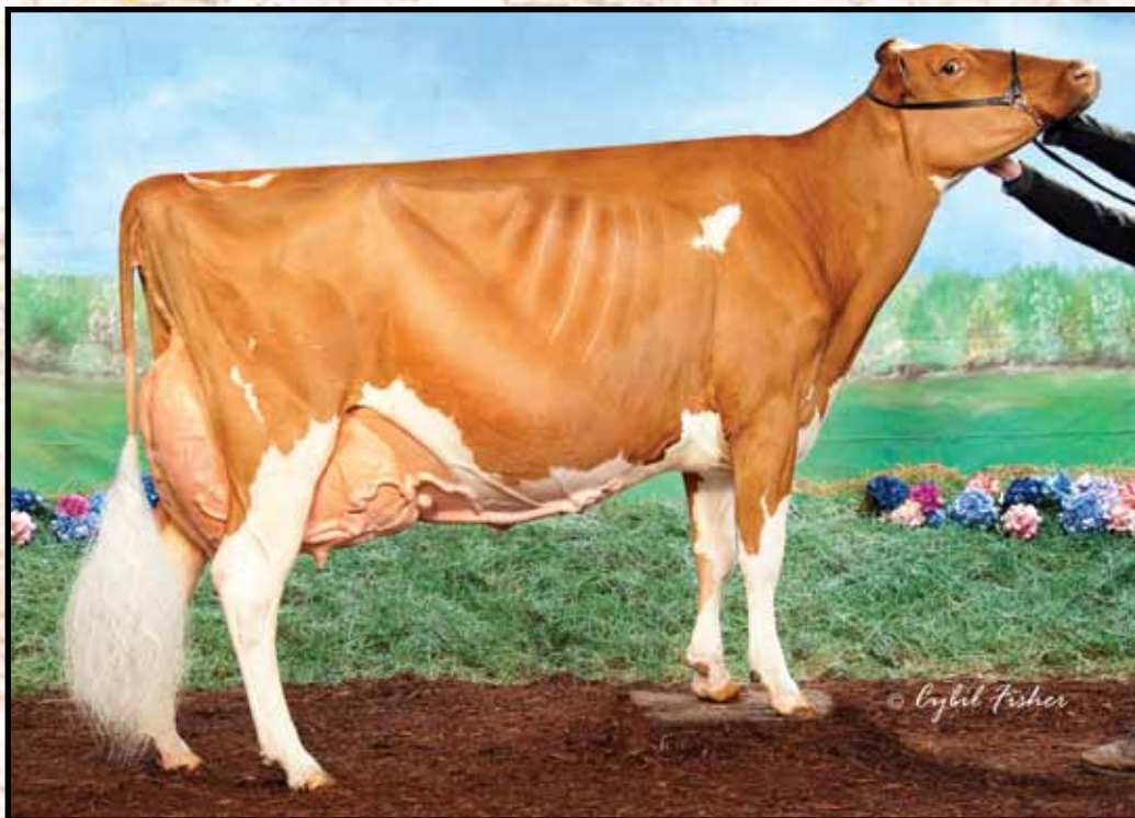
ROSEDALE LUCKY-ROSE-RED 2E-94 Dam of Lot 2