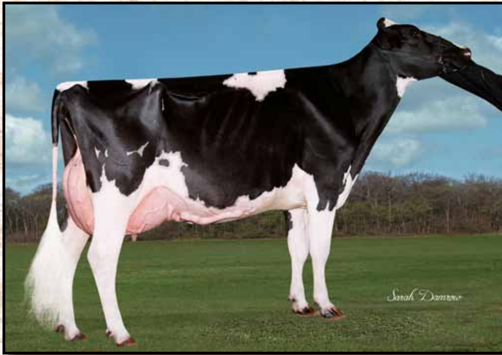
FRIESS-JK RCHMN EVA 3907-ET EX-92 Granddam of Lot 32 3rd Dam of Lot 31