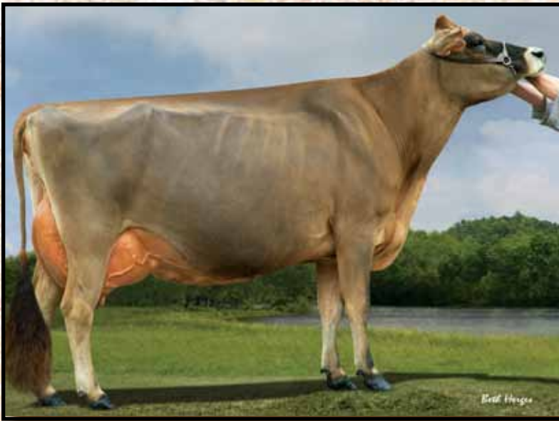
BUDJON-VAIL JADE GIANNA-ET EX-95% Granddam of Lot 61