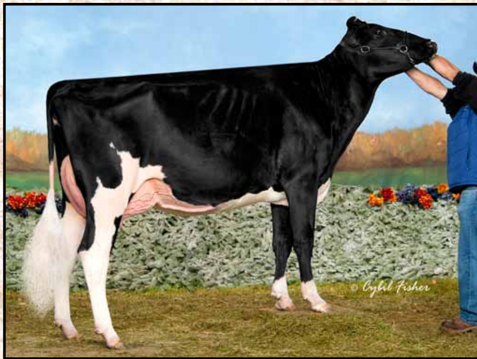
DUCKETT G CHIP TOKYO-ET EX-93 Dam of Lot 10