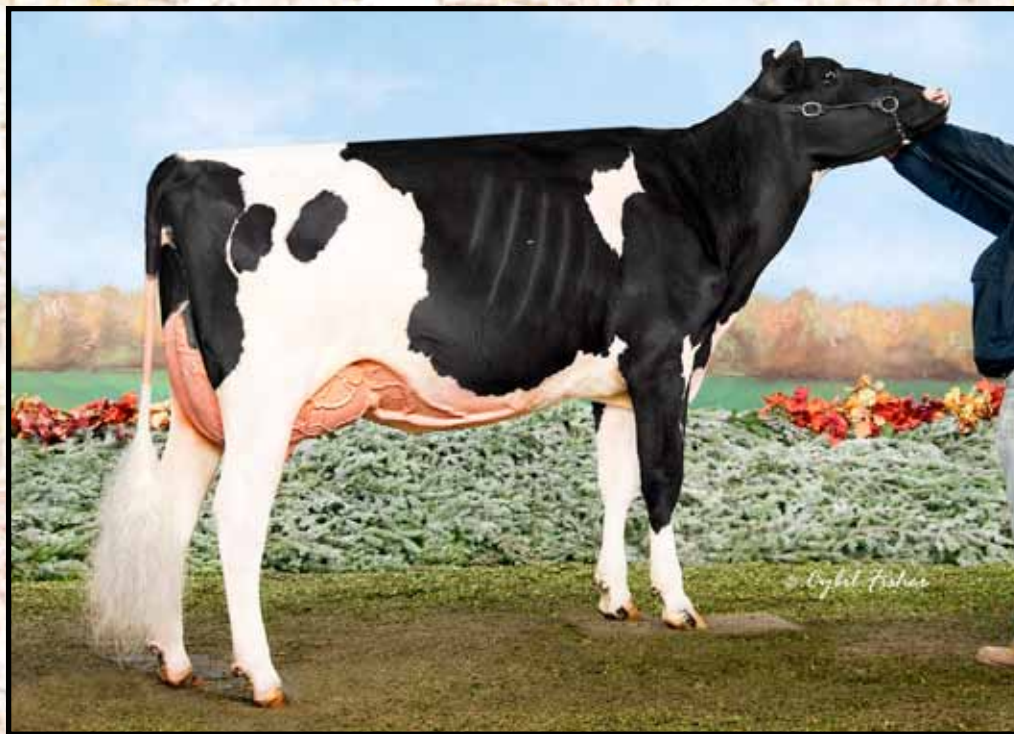
JACOBS CONTROL BRISK-ET EX-94 Dam of Lot 1