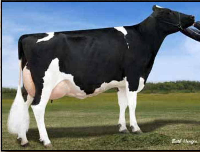
RYAN-VU TALENT EARRINGS EX-91 Maternal Sister to Granddam of Lot 17