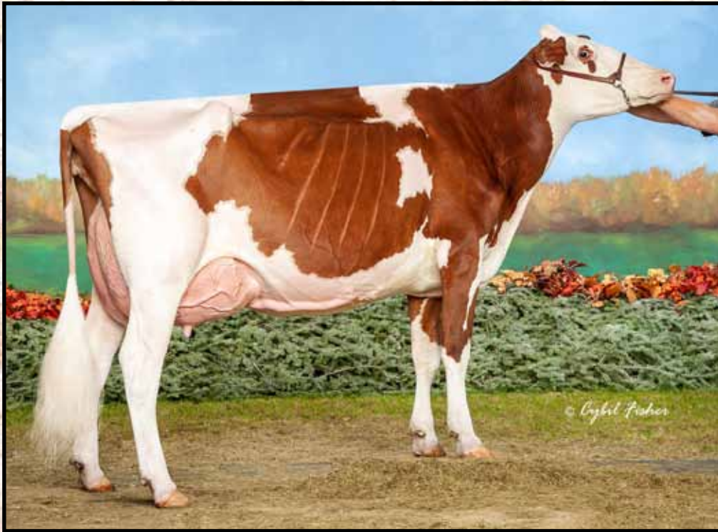
APPLE-PTS ABRIANNA-RED-ET EX-94 Granddam of Lot 20