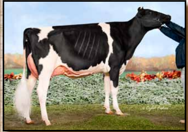
GOLDEN-OAKS SID CHROME-ET VG-88 Full Sister to Dam of Lot 35