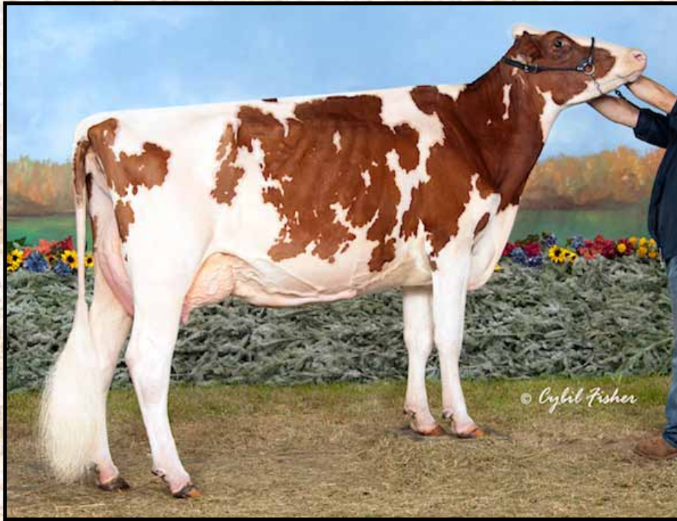
RG-MUELLER ADVNTGE RUBY-RED VG-87 Granddam of Lot 34