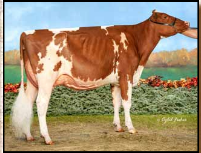
OAKLAND-VIEW H CHAMP-RED-ET EX-91 3rd Dam of Lot 36