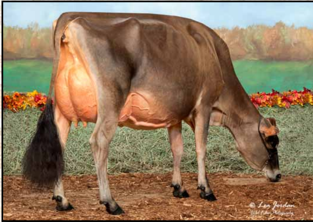
SPATZ APPLEJACK BAYLEE EX-91 Dam of Lot 66