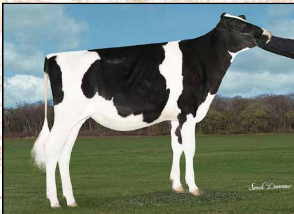
SHEEKNOLL AVALA AUBREE-ET VG-87 Dam of Lot 8