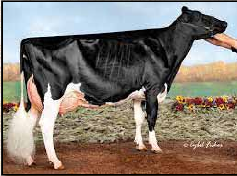
TUYTEL ATW BARBARA 9-ET EX-94 Granddam of Lot 5