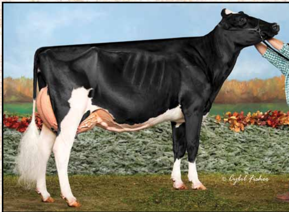
CRAIGCREST RUBIES RACHELLE-ET EX-94 Dam of Lot 9