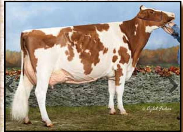
ST-YLE-SA JUMP4JOY-RED-ET 2E-94 Granddam of Lot 14