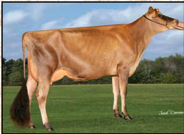
CIMARRONS VICTORIOUS Dasher Selling: Lot 65