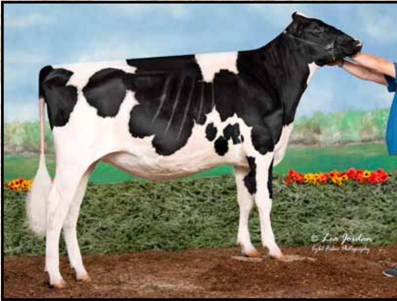
REDCARPET WRRIOR WRIGLEY Selling: Lot 40