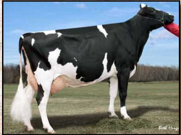
RYAN-VU DUPLEX EMERALD-ET EX-91 3rd Dam of Lot 17