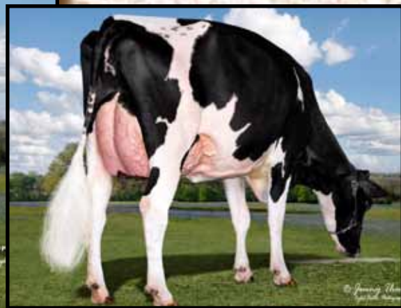
TRI-KOEBEL GLDCHIP RONDA-ET 2E-92 Granddam of Lot 19