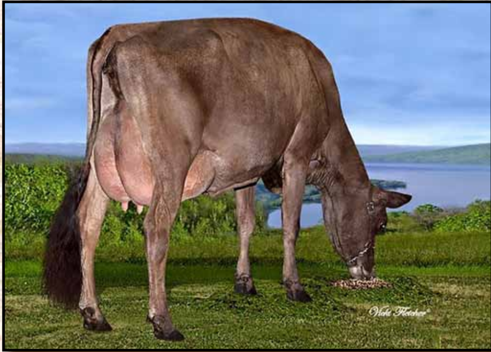
HOMERIDGE V BUTTONS EX-92 Granddam of Lot 70