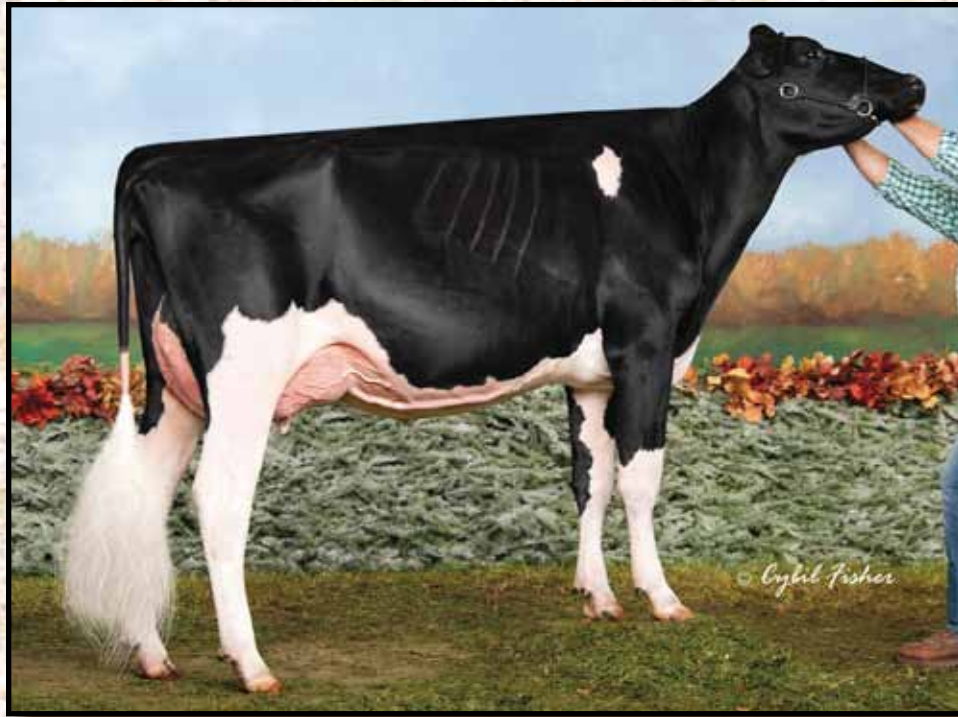
OAKFIELD GOLD CHIP DARE-ET 2E-94 3rd Dam of Lot 18