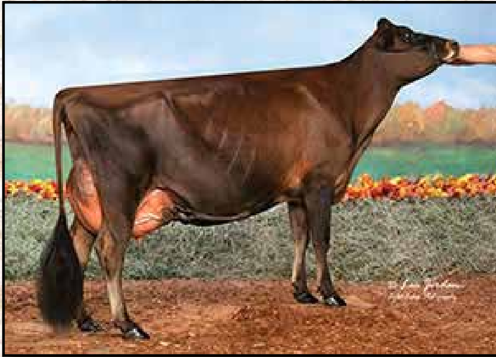
PAGE-CREST SATIN JUJU EX-94 Granddam of Lot 60