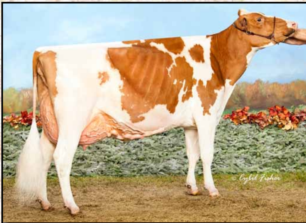
HEATHERSTONE REDHOT-RED EX-92 Dam of Lot 16