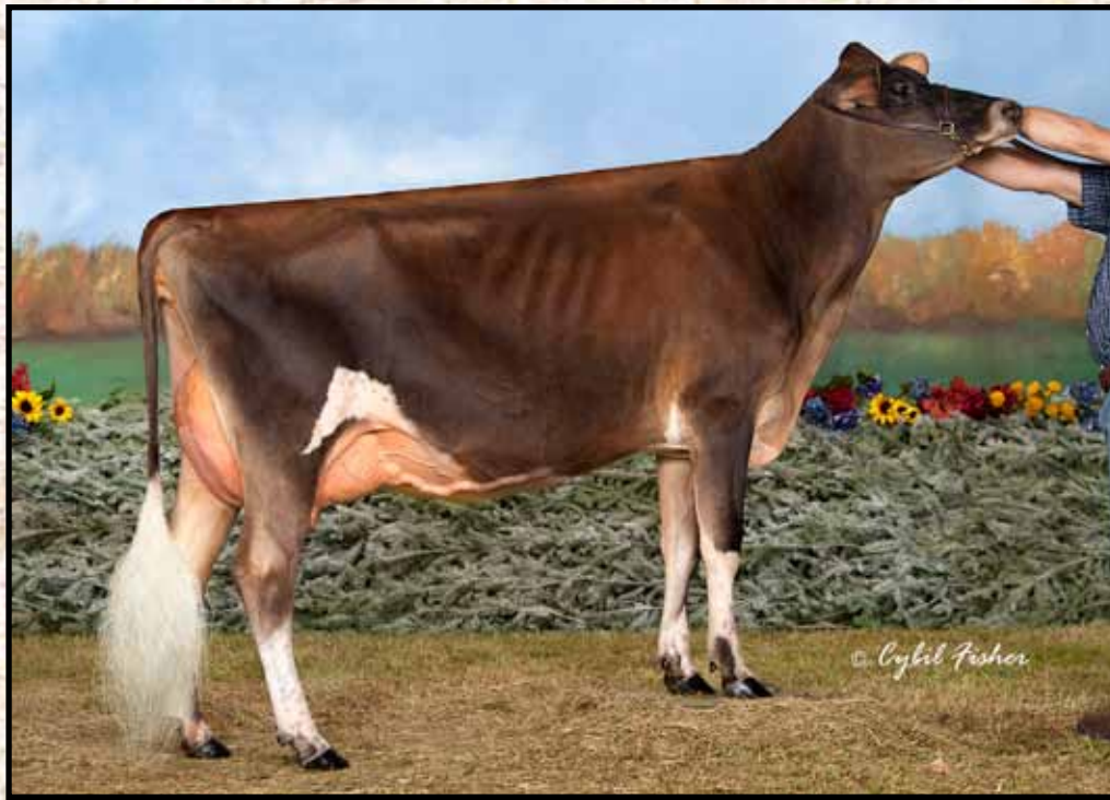
SOUTH MOUNTAIN TEQUILA JEM EX-93% 3rd Dam of Lot 63