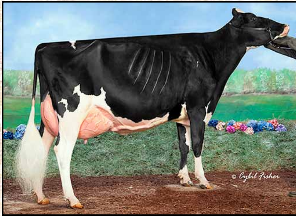
COMESTAR LARION GOLDWYN-ET 2E-95 Dam of Lot 27