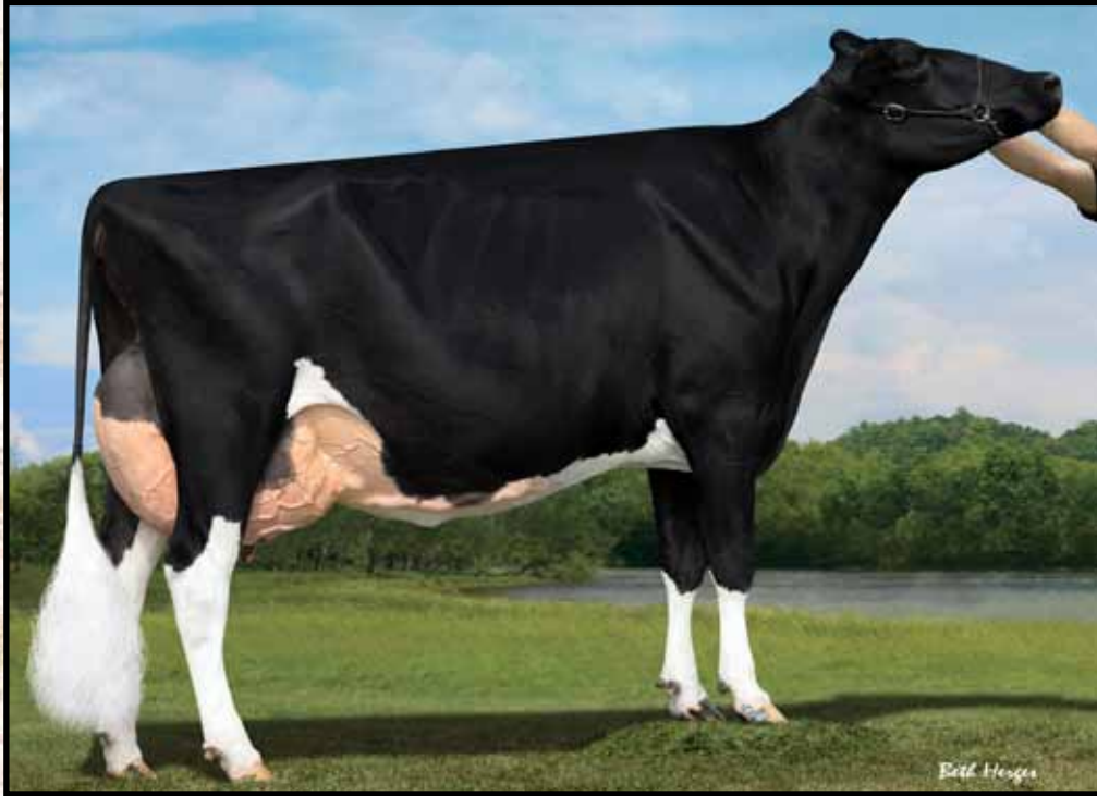
GARAY ALEXANDER DESTINY-ET EX-94 Granddam of Lot 23