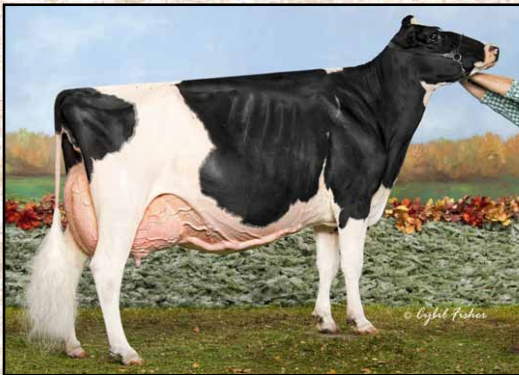
SHEEKNOLL DURHAM ARROW 2E-96 Dam of Lot 7; Granddam of Lot 8