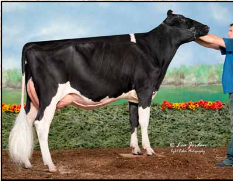
MILKSOURCE A TRADITION-ET VG-86 Dam of Lot 26