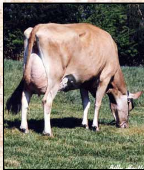
TP ACRES B SOONER MANDY FLIRT EX-96 5th Dam of Lot 67