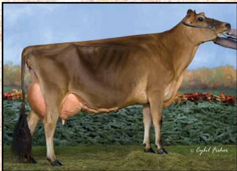
BRJ DUAISEOIR BARBER FLIRT K-33-ET EX-93 3rd Dam of Lot 67