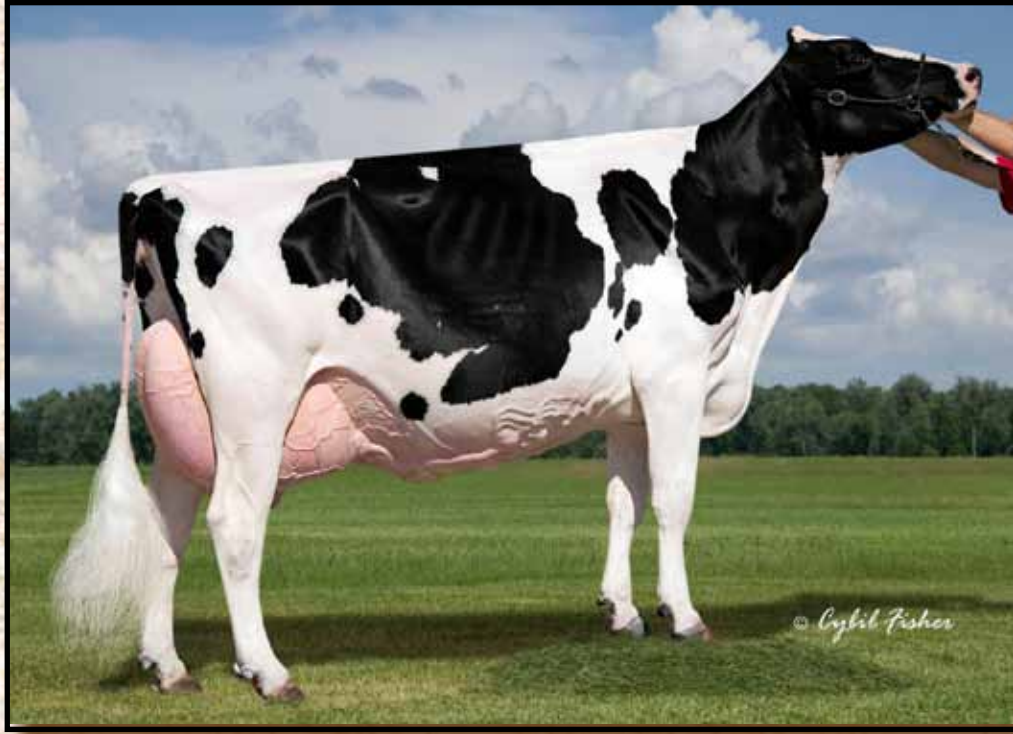
DUBEAU DUNDEE HEZBOLLAH EX-92 Dam of Lot 25