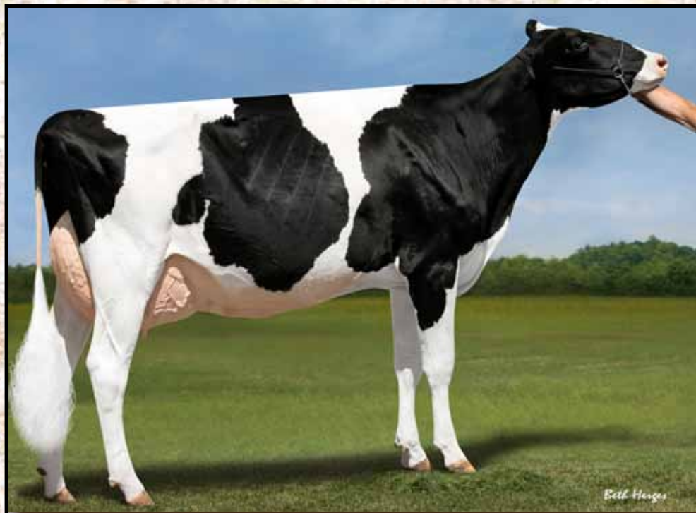
BLONDIN GOLDWYN BISTRO-ET EX-94 Dam of Lot 22