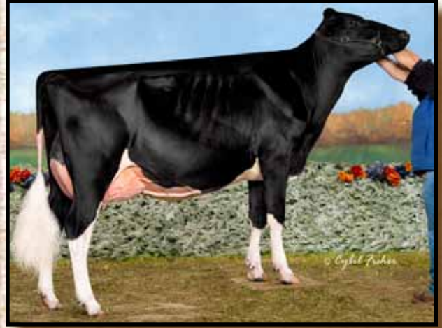
ARETHUSA SID TESS EX-92 Dam of Lot 40