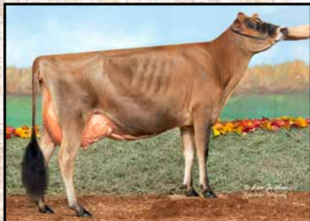
CIMARRONS IMPRESSION Dasher EX-92 Dam of Lot 65