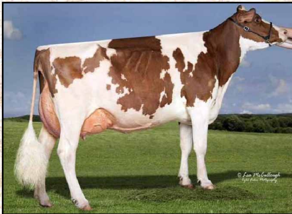
ZIEMS ABSOL MIMOSA-RED-ET 2E-90 3rd Dam of Lot 30