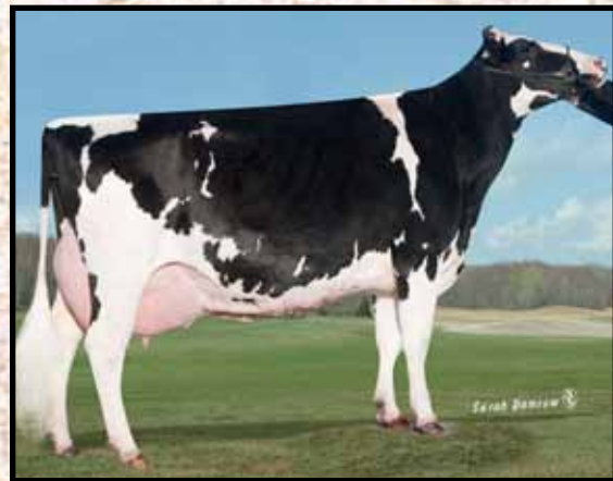
PAULINN BAXT MAZIE 529-ET 2E-91 4th Dam of Lot 11