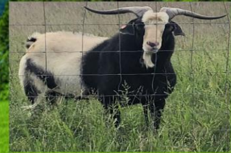
SSK WAR HORSE