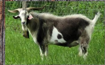
SJH SANJA BLUE PATCHES