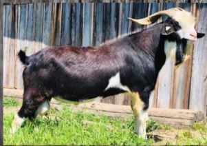
LFK OUTLAW'S IRONMAN