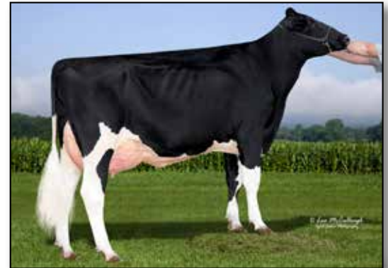
Milksource Goldwyn Lala-ET dam of Lot 23