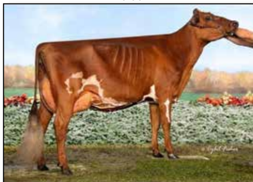
Old-N-Lazy V Melania-ET VG-89 maternal sister to dam of Lot 65