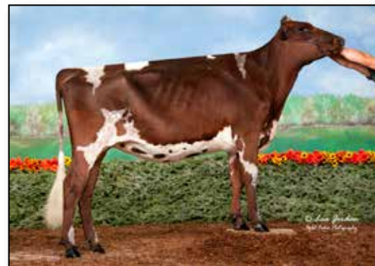
Glenmar-Dale KS Dreamsickle maternal sister to Lot 66