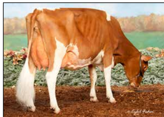
Hi Guern View Diva Designer EX-93 maternal sister to Lot 52