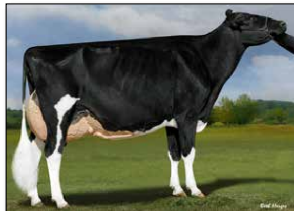
Oakfield GC Darby-ET EX-95 maternal sister to 2nd dam of Lot 22