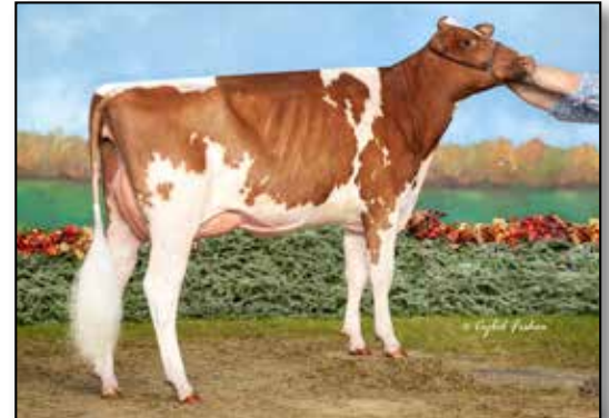
Riedel-Ridge Dback Amor-Red VG-85 same maternal line as Lot 26