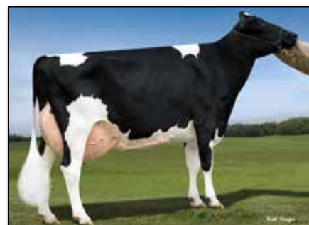
Hi-Lo-Valley Alex Luvable EX-90 2E 2nd dam of Lot 37

Jerry & Brenda Yager 5718 Hines Rd Highland, WI 53543 608.929.7650