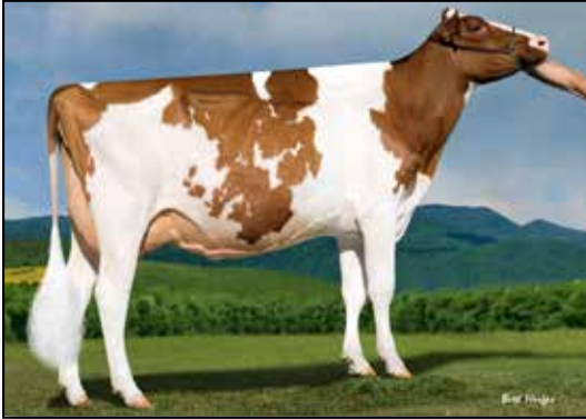
Sunny-Valley Freedom-Red-ET EX-91 3rd dam of Lot 16