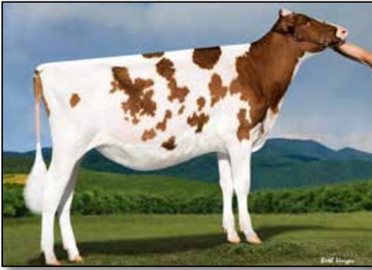
Sunny-Valley Dbk Flash-Red GP-83 2nd dam of Lot 16