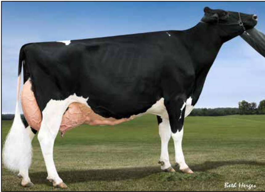
Idee Shottle Lalia EX-95 2E 2nd dam of Lot 23