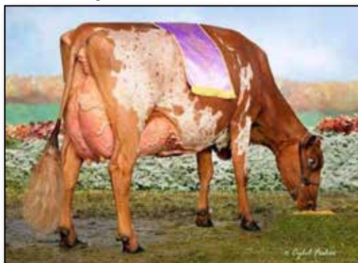
Old-N-Lazy Gibbs Morgan EX-94 maternal sister to dam of Lot 65