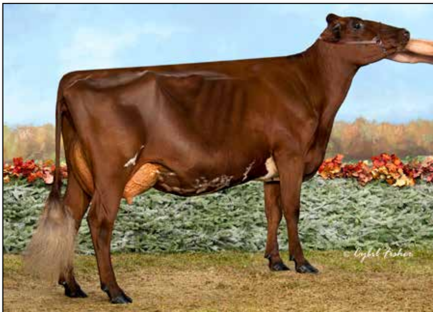
Family-Af-Ayr Dare To Dream EX-92 3E dam of Lot 66