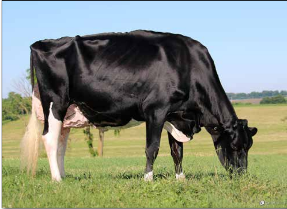
Unique Dempsey Cheers EX-95 2E 2nd dam of Lot 7