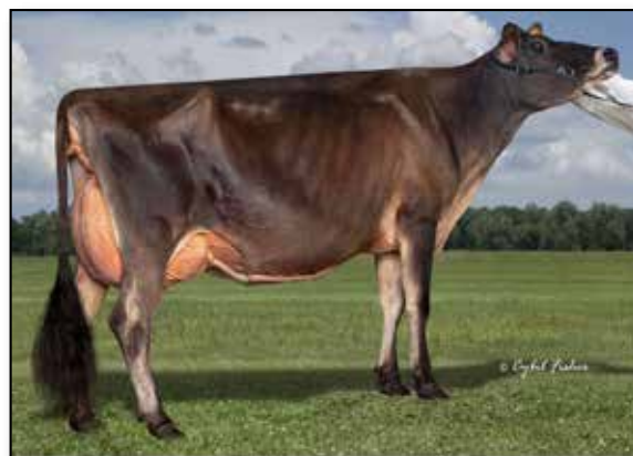
Opportunity Tequila Margherita-ET EX-92% 2nd dam of Lot 56