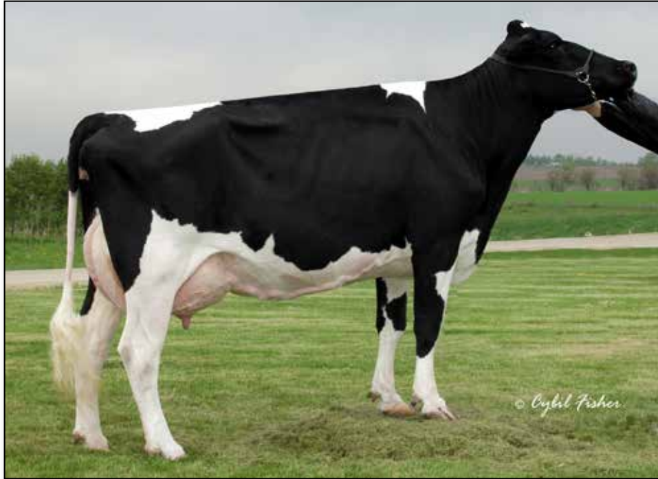
Moorclose Linjet Whitney EX 93 GMD DOM 4th dam of Lot 34