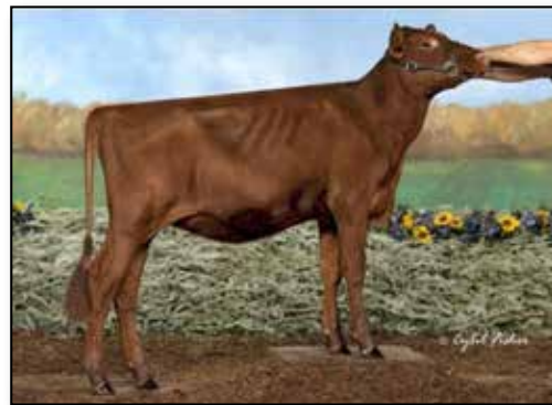
Millcreek Premium Raven dam of Lot 71

Tyler Endres S5344 State Hwy 23 Reedsburg, WI 53959 608.333.3579