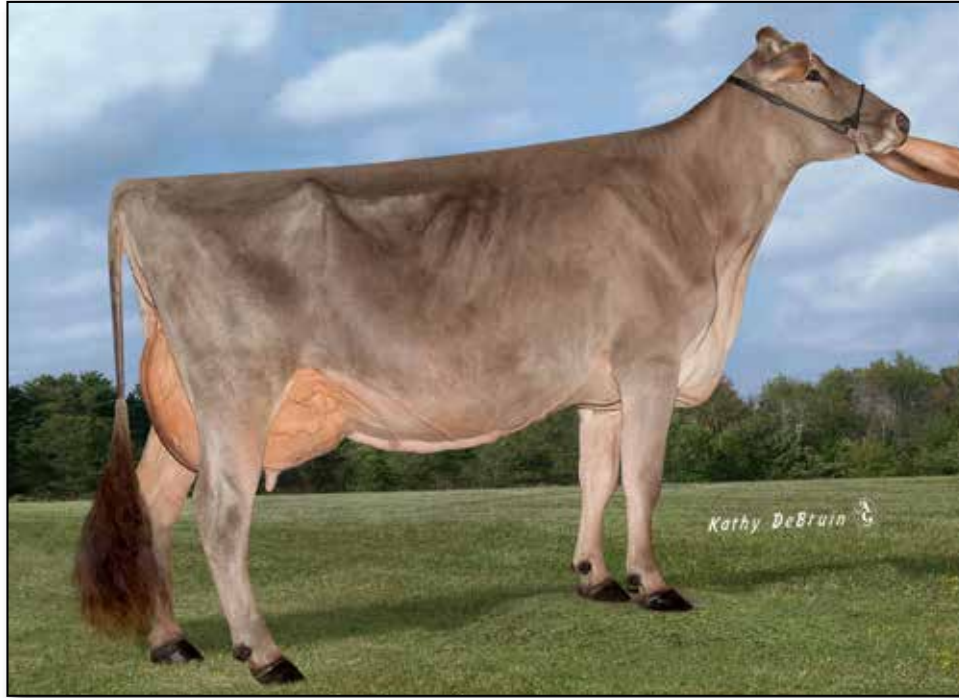
Random Luck Jetway Petra-ET 2E-E92 2nd dam of Lot 48