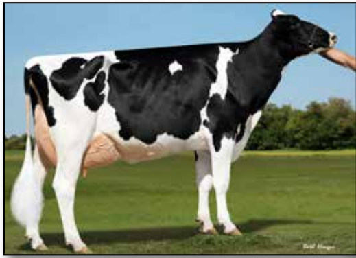
Glenn-Ann Gold Surprise EX-90