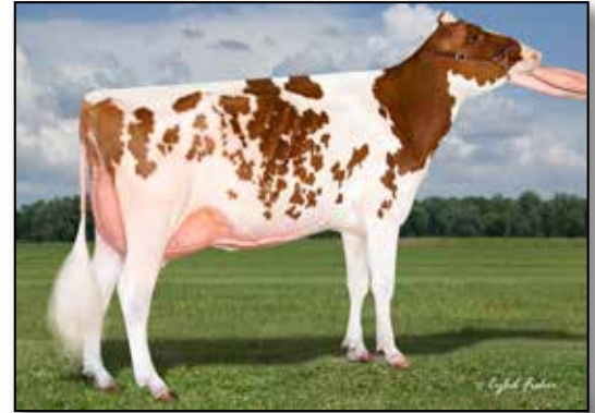
Opstal Dft Amazing In-Red-ET EX-90 Reserve Jr. AA R&W Jr. 2Y 2020, Jr. All-WI Jr. 2Y 2020