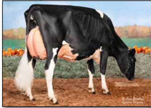
Miesens Diamondback Blissful EX-90 92-MS same maternal line as Lot 35