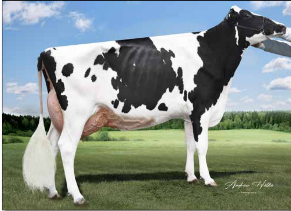
Our-Favorite Reckoning-ET EX-94 dam of Lot 10