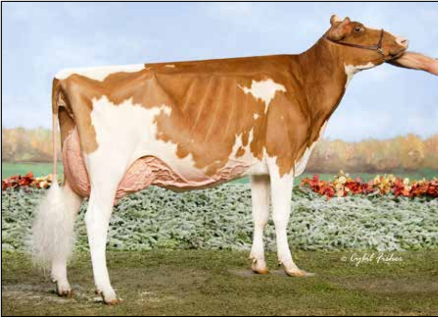
Siemers Awesome Great-Red EX-93 2E dam of Lot 1