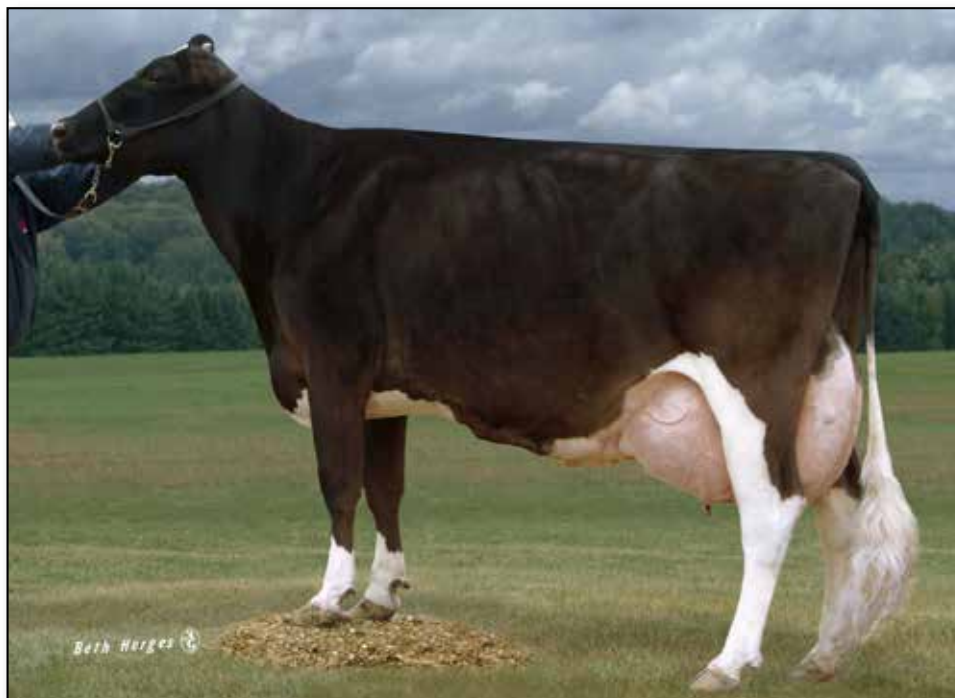
Stone-Front Lee Pansy EX-91 GMD DOM 5th dam of Lot 33