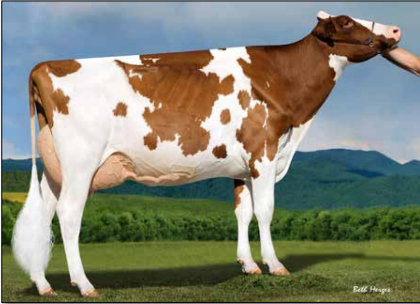
Sunny-Valley Fiona-Red EX-93 2nd dam of Lot 15