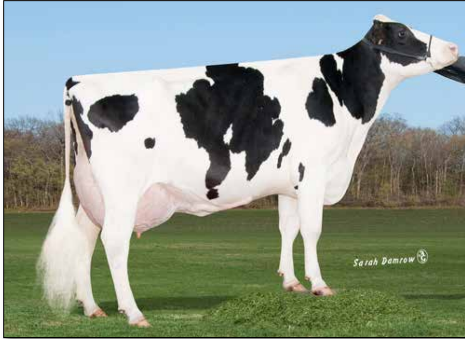
Mil-R-Mor Aspen Rosie EX-93 maternal sister to 3rd dam of Lot P