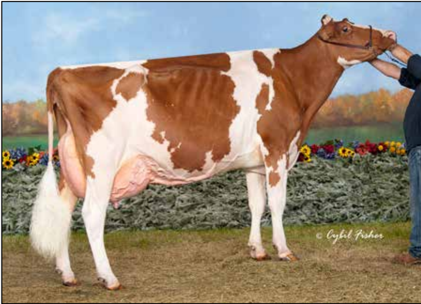
Milgene Advn Jezabel-Red-ET EX-94 4E 2nd dam of Lot14