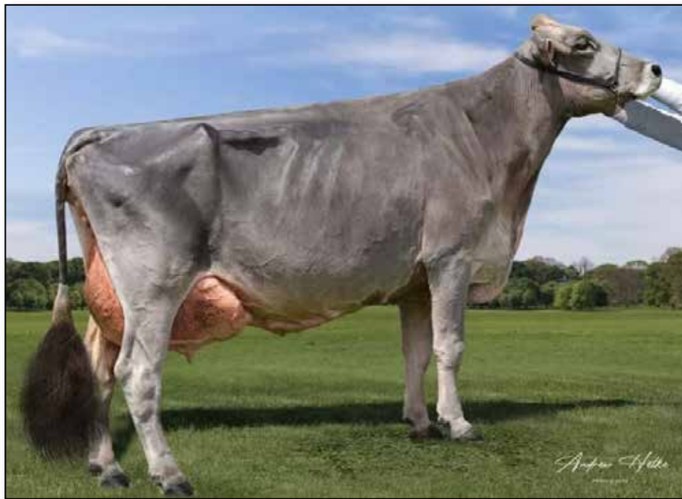
Random-Luck Prem Talent ET 2E-94 3rd dam of Lot 43