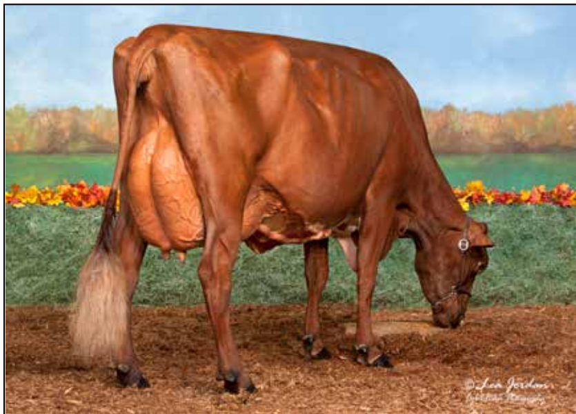
Lazy M PS Ladylump EXP ET 2E-93 dam of Heavenly Lumps EXP, Lot 73