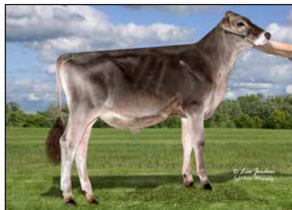
Oak Knoll Top Pick 10th Spring Yrlg, WDE 2021