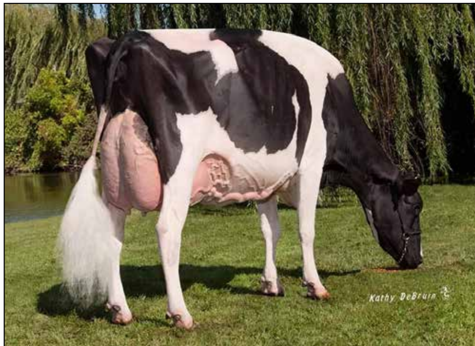
Jeffrey-Way Advent Dynasty EX-95 3E 2nd dam of Lot 24