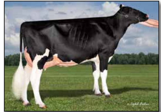
Ziems Jacoby Los Angeles EX-90 full sister to Lot 23