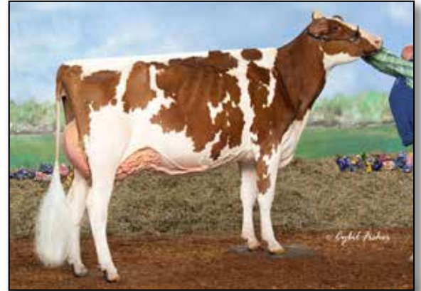
Siemers Defnt Great-Red-ET EX-92 2nd dam of Lot 1