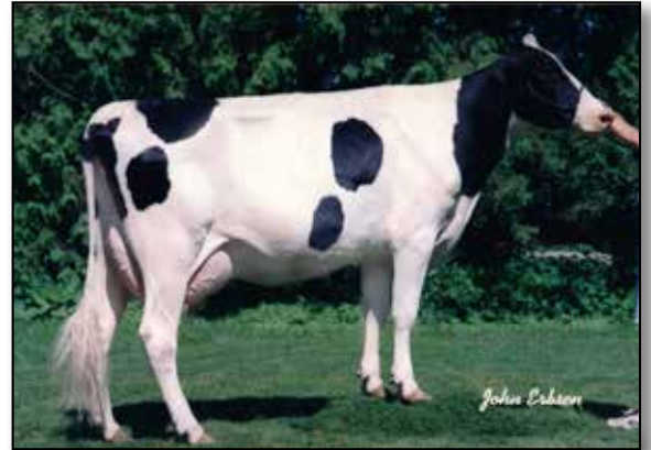
GBM Winch Tesk Deana VG-87 DOM 4th dam of Lot 38