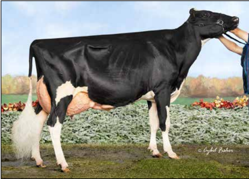
Lars-Acres Gwatwd Landi-ET EX-93 2E full sister to dam of Lot 25