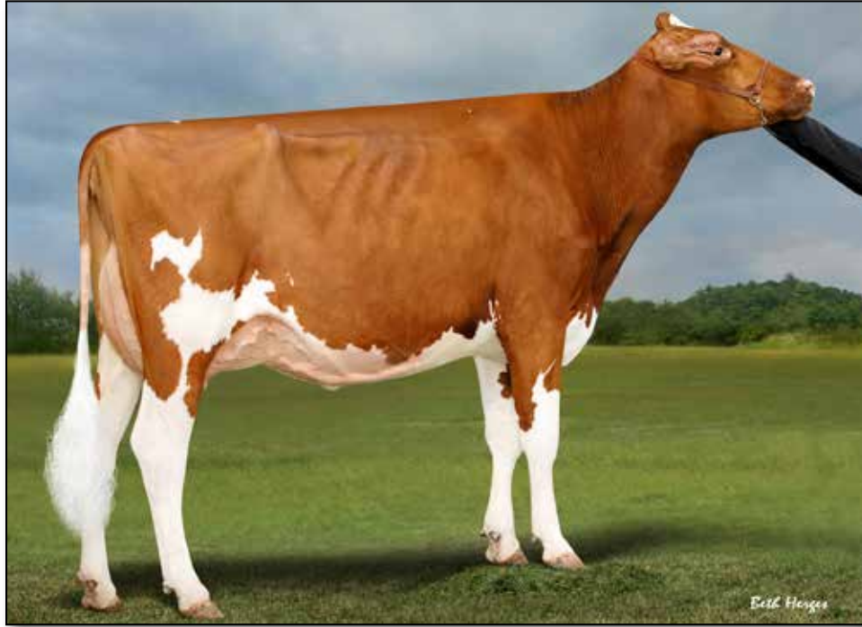
Wapsi-Ana Akeela-Red-ET VG-85 Lot AA