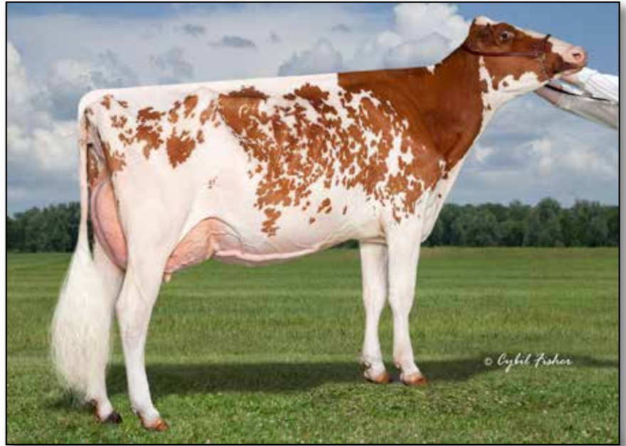
Sunny-Valley Freckles-Red EX-90 dam of Lot 16