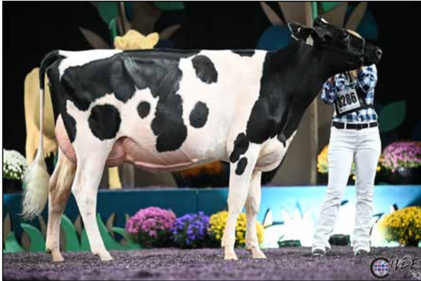
Milksource Tstorm Chrome VG-88 maternal sister to dam of Lot 5