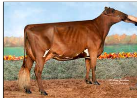
Glenmar-Dale Maxum Delilah EX-90 maternal sister to Lot 66