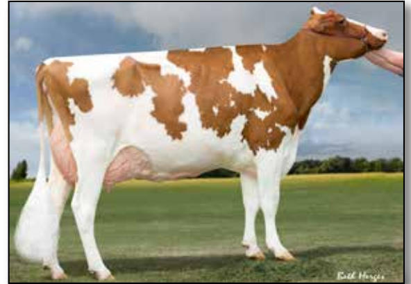
Sunny-Valley A Favor-Red-ET EX-91 EX-MS 3rd dam of Lot 15, 4th dam of Lot 16