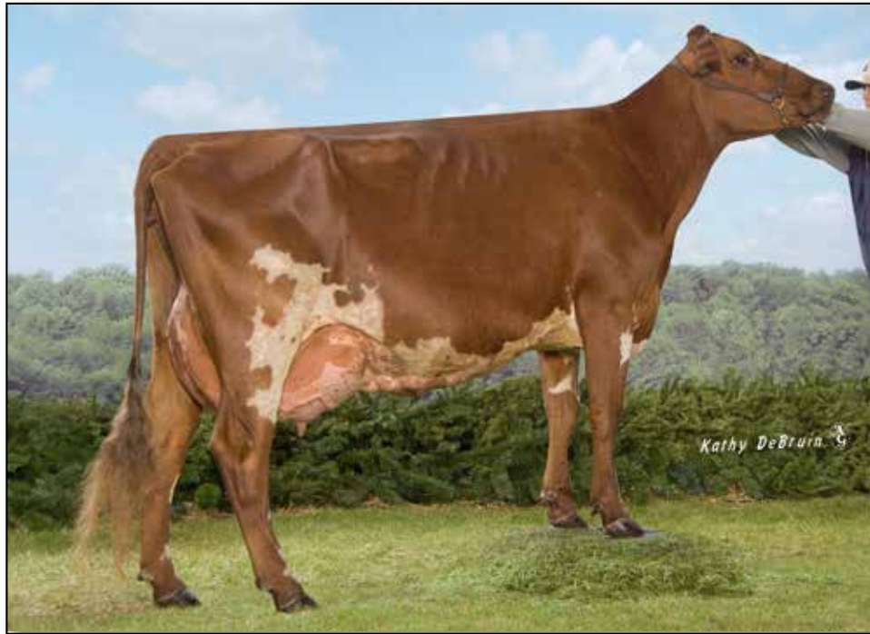
Family-Af-Ayr Bonanza Alisha EX-90 2nd dam of Lot 67