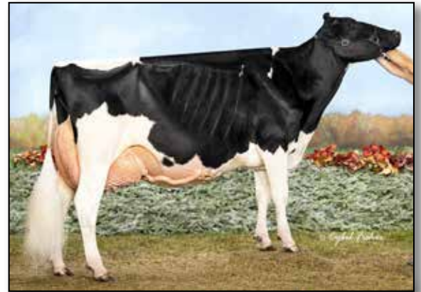
Walk-Era Dundee Annelise EX-95 2nd dam of Lot 3