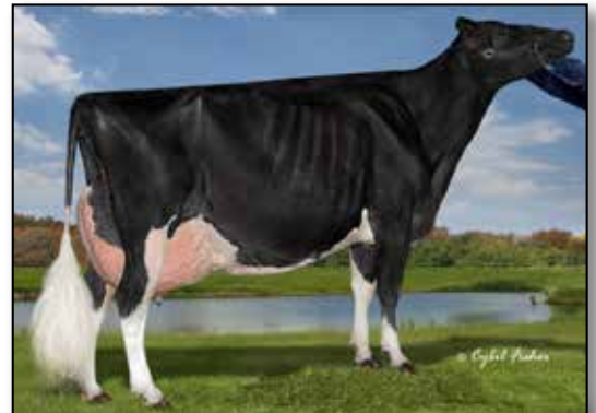
Brackleyfarm Chelios Cheerio EX-96 2E 2nd dam of Lot 5