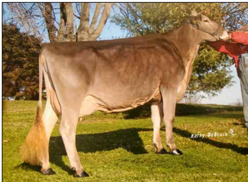
Oak Knoll Top Priority 3E-E92 2nd dam of Lot 46