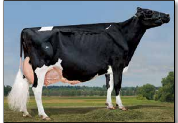
Ocean-View Damion Elise EX-94 3E dam of Lot 13