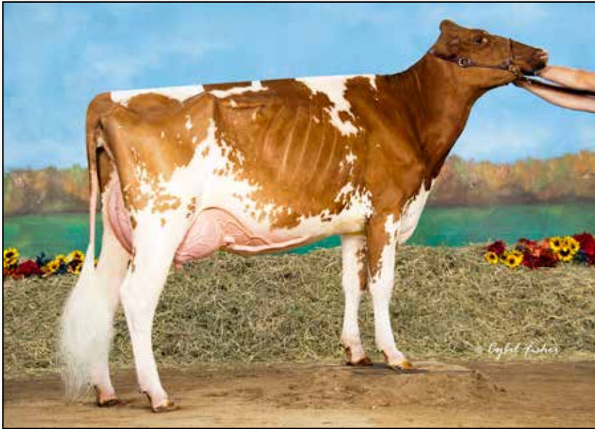
Sorg-Land Adorable-Red EX-91 maternal sister to dam of Lot 26