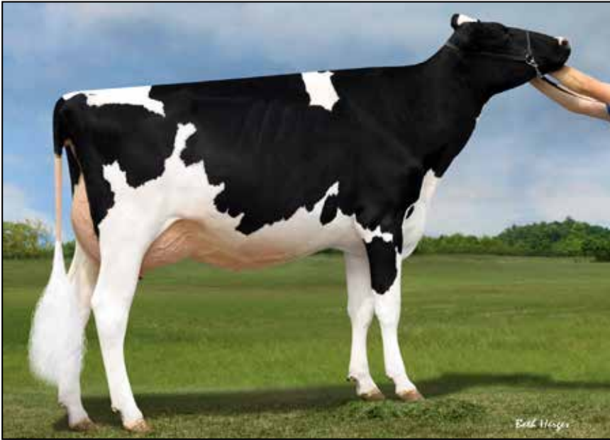
MS Apple Andorra-ET EX-91 dam of Lot 6