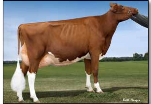
KHW Regiment Apple B-Red-ETN EX-90 2nd dam of Lot 8