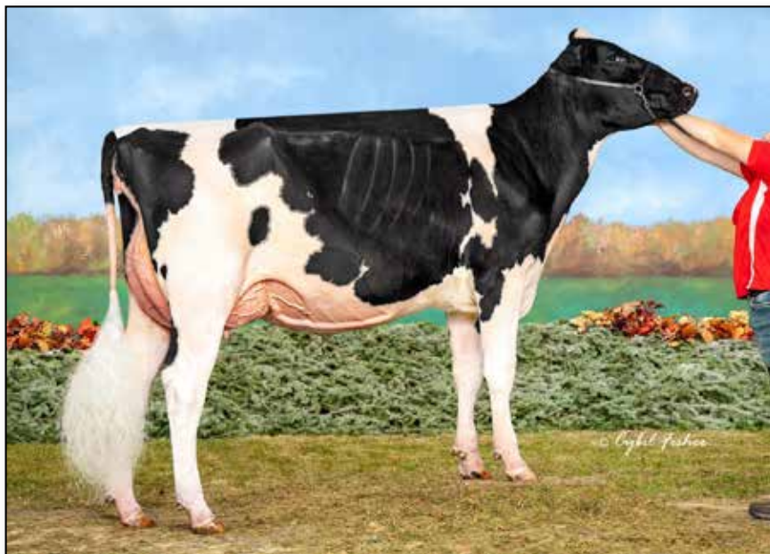
R-Homestead Jacoby Doodle-ET VG-87 dam of Lot 22