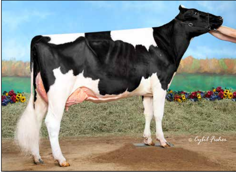
Heatherstone Cantina EX-91 dam of Lot 27