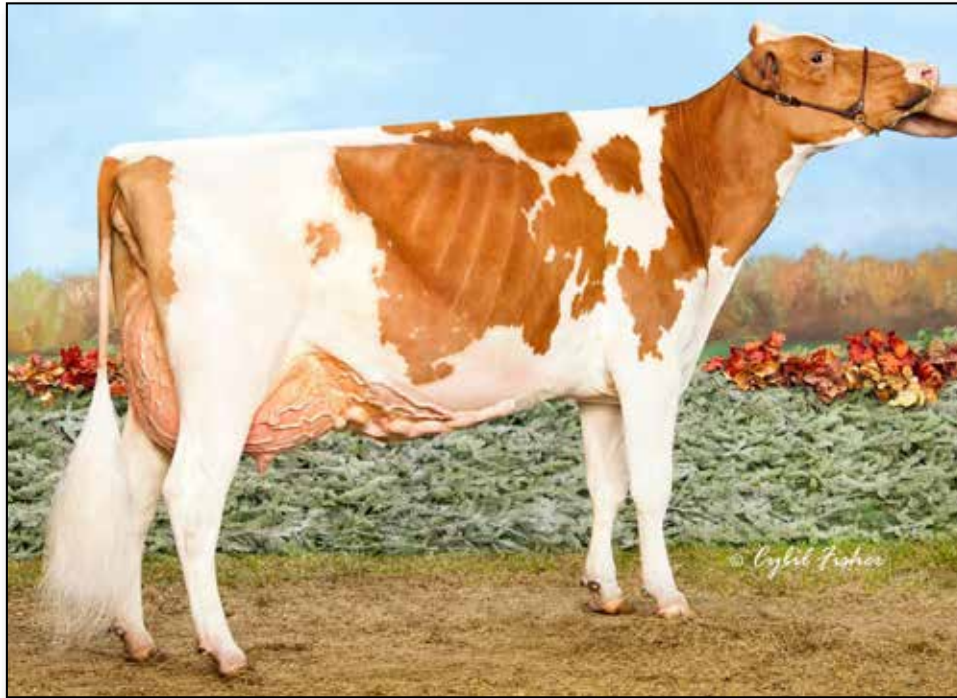
Heatherstone Redhot-Red EX-92 dam of Lot 12