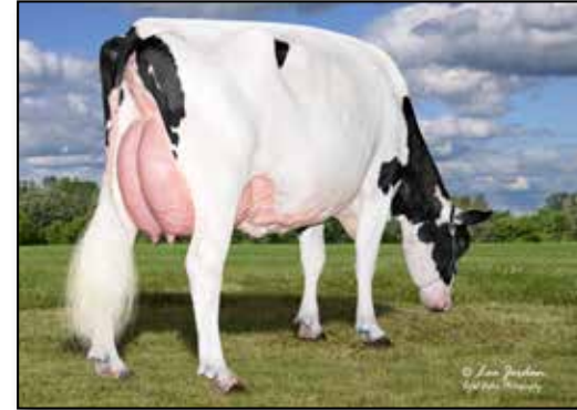
Miesens McCutchen Brielle EX-90 91-MS maternal sister to dam of Lot 35