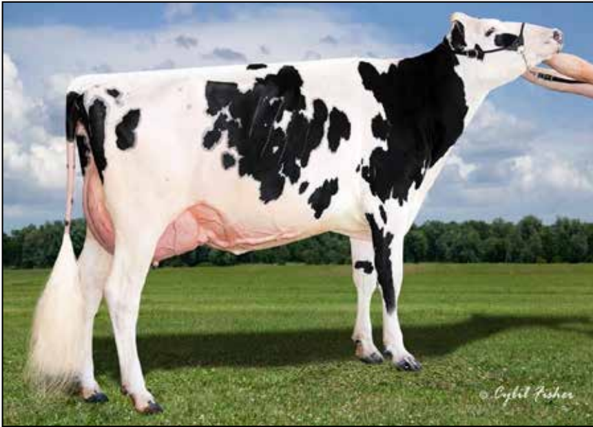
Stone-Front Practical-ET EX-92 dam of Lot 28