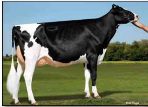
Glenn-Ann Seattle Fever EX-92 2E