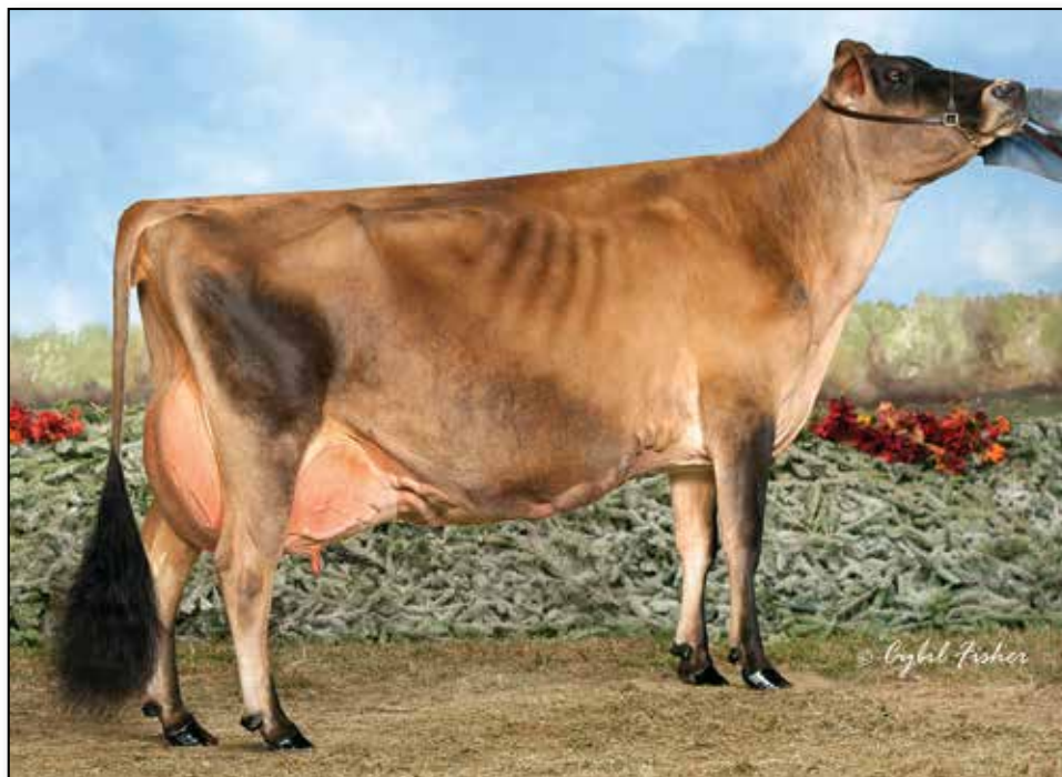
Huronia Centurion Veronica EX-97% 4th dam of Lot 55