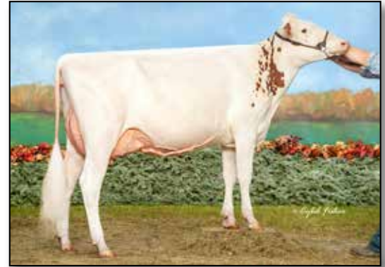
Opstal Bailey Ariana-Red VG-87 Unan. AA R&W Fall Calf 2020, HM AA Milking Yrlg2021