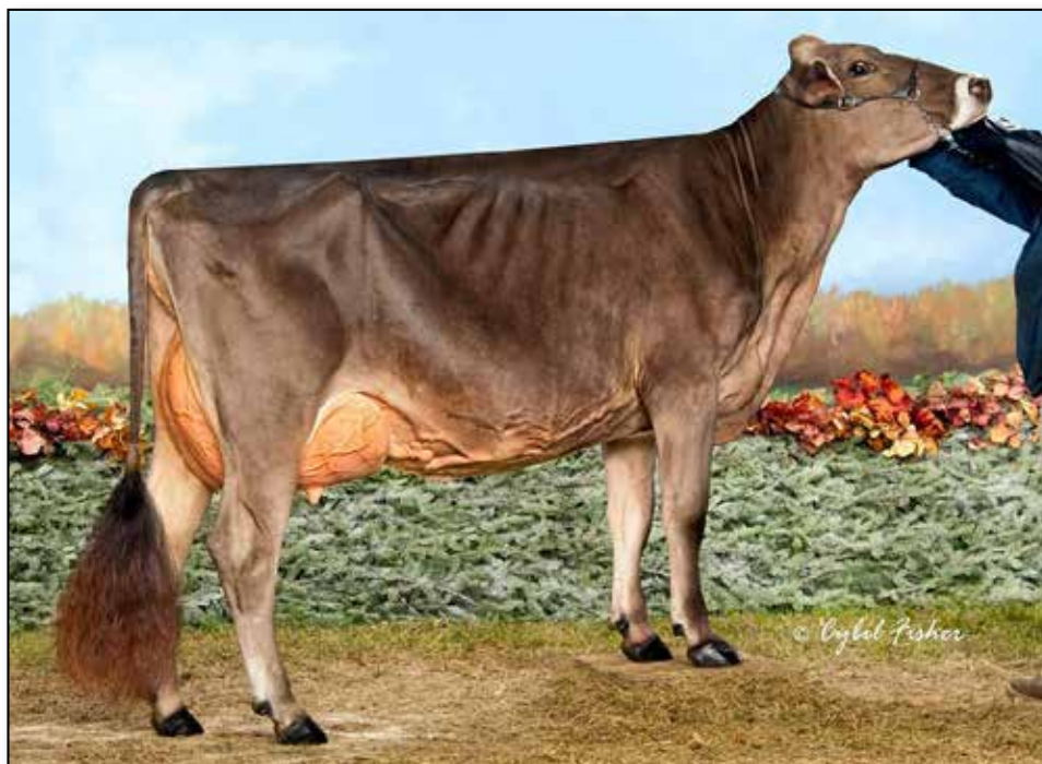
Random Luck V Whatfor ET E91 2nd dam of Lot 47