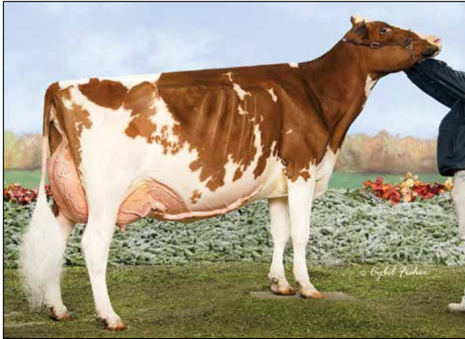
MS-Aol Cntndr Revive-Red-ET EX-94 dam of Lot 4