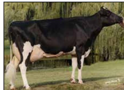
McCoy-Valley Legendary Lucy EX-93 4E GMD 4th dam of Lot 37