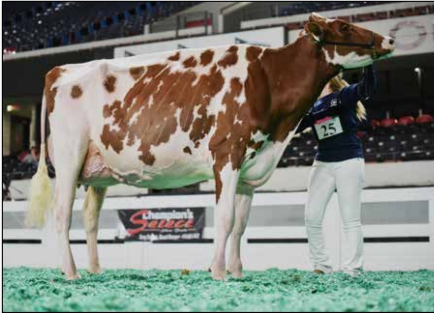
Opstal Dfnt Adore Me-Red-ET EX-91 full sister to dam of Lot 11