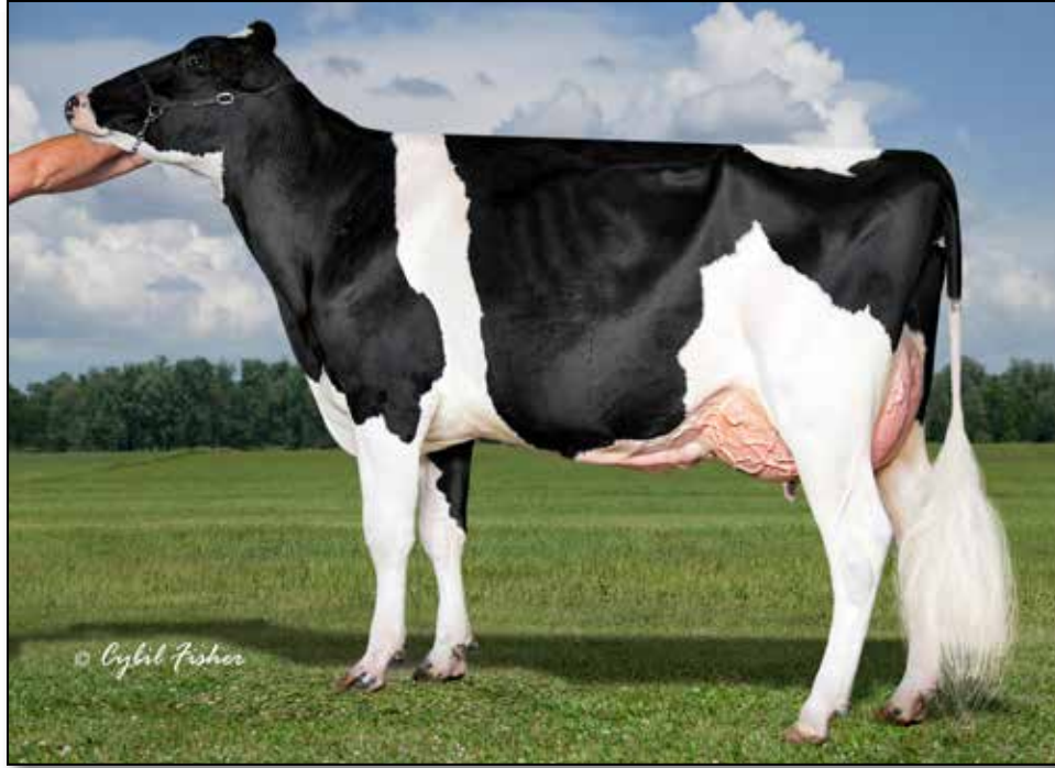
Ryan-Vu Regin Raz A Taz EX-93 2nd dam of Lot 19