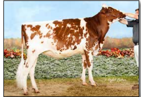
Sorg-Land Redneck Party-Red (VG-87) maternal sister to dam of Lot 26