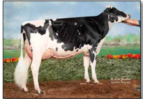
Lars-Acres D Lombardi-ET VG-88 maternal sister to Lot 25