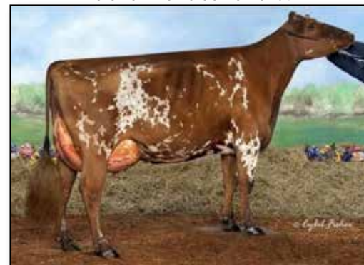
Old-N-Lazy Motion for Mistrial EX-93 maternal sister to dam of Lot 65