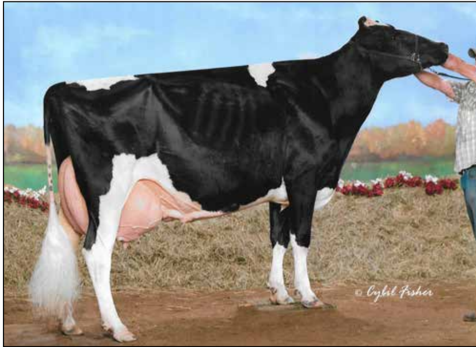
Willows-Edge Dur Michele-ET EX-94 3E 3rd dam of Lot 9