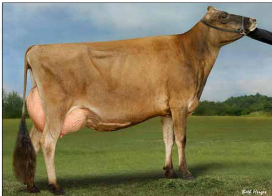
Wapsi-Ana Colton Venus EX-90% maternal sister to Vanish