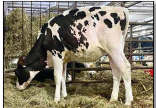
Milksource Anlyst Cassanova Lot 5