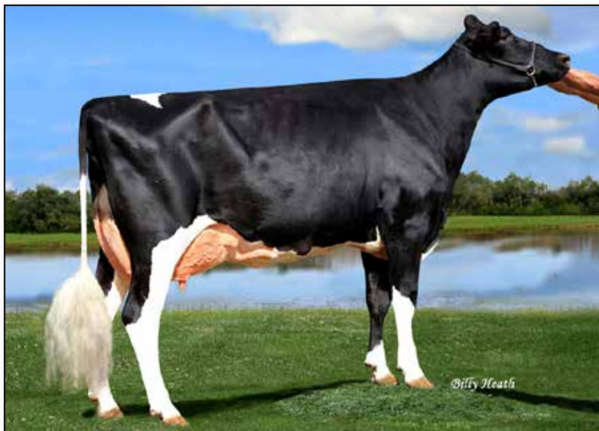
MS Apples Ainsley-ET EX-90 4th dam of Lot 29