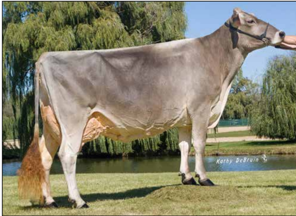
Random Luck Kb Phoebe 2E-93 2nd dam of Lot 45