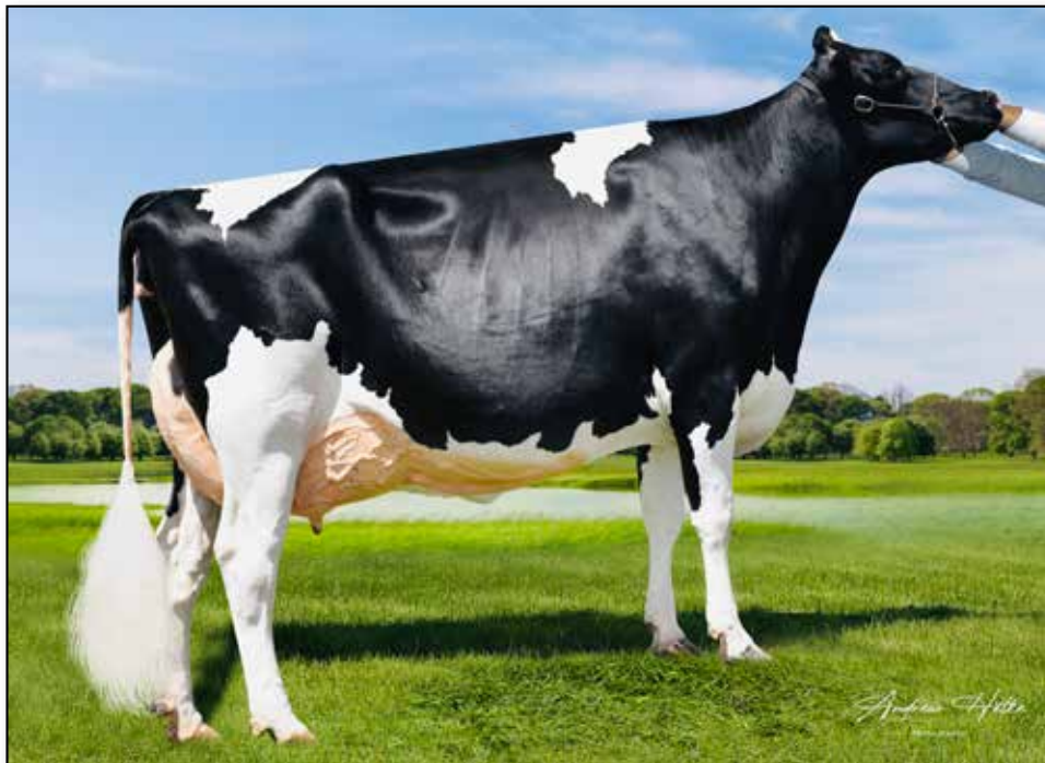
Tree-Hayven Awesome Mae EX-93 2nd dam of Lot 30