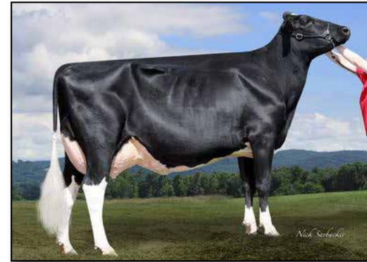
Glenn-Ann Jasper Shining EX-90