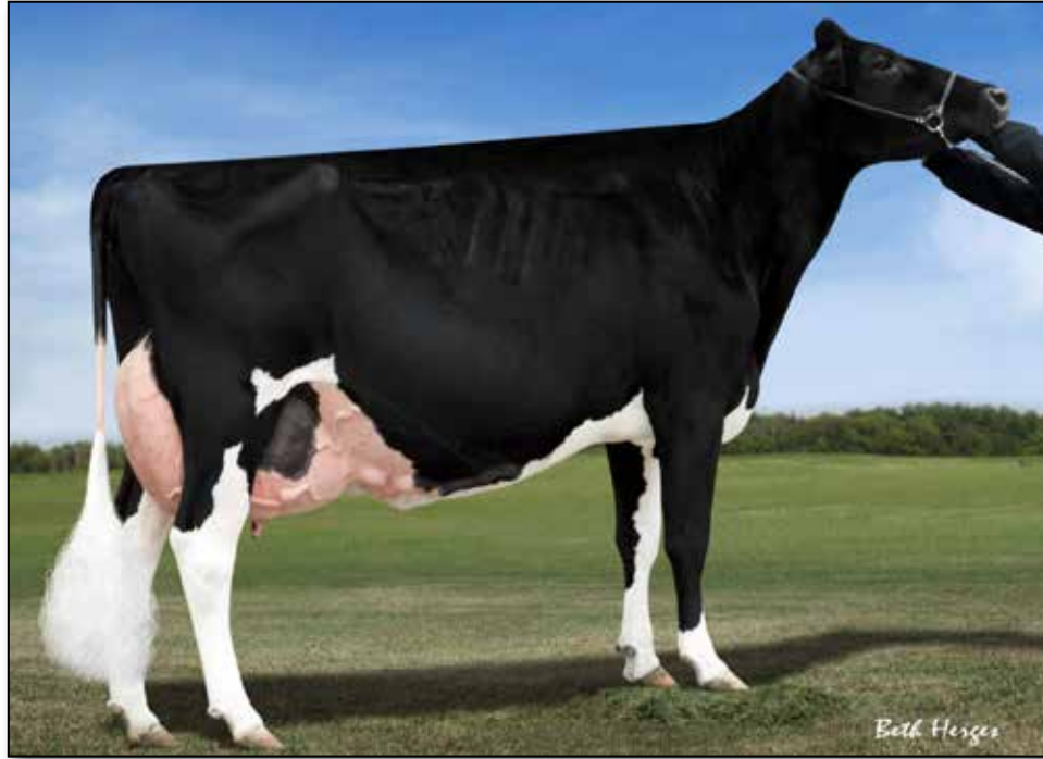
Silvermaple Damion Camomile EX-95 4th dam of Lot 75