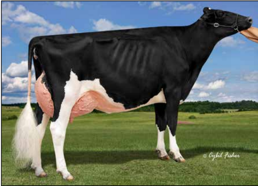
Budjon-Abbott Alexandra-ET EX-92 dam of Lot 3