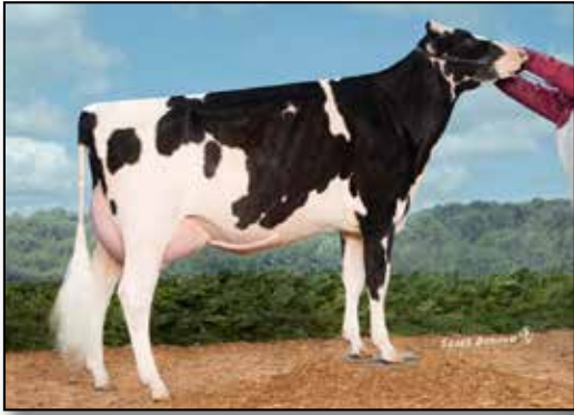
Miesens Cuthrie Bling EX-90 2nd dam of Lot 35