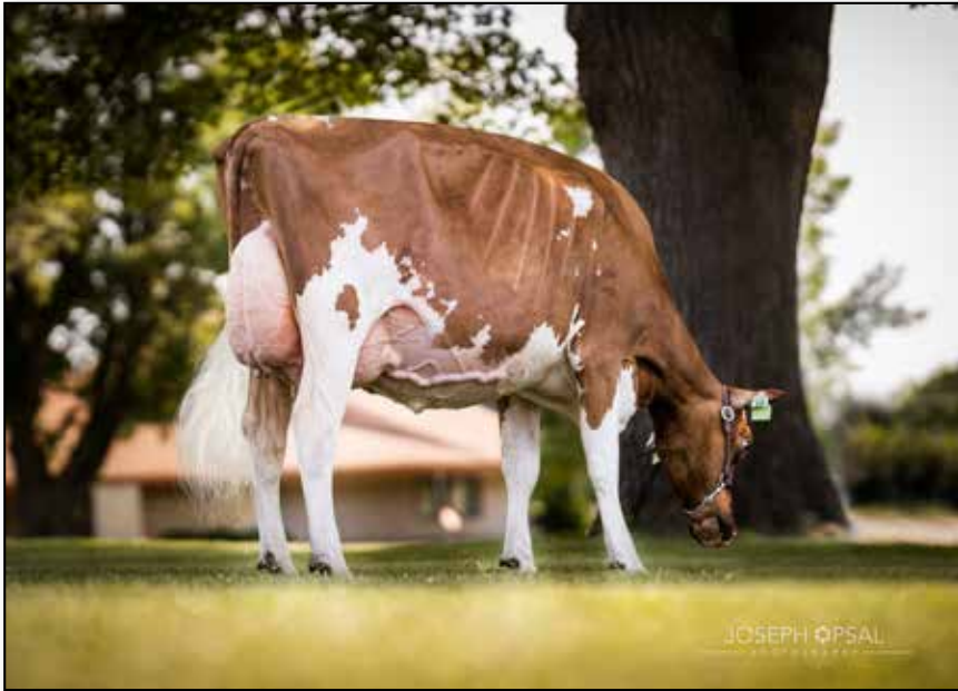
Kamps-Rx Apb Annalie-Red-ET VG-88 dam of Lot 8