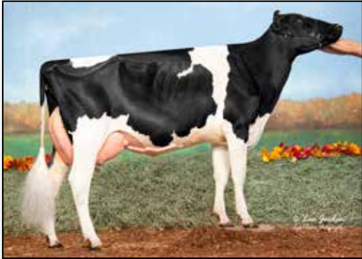
Miesens Buxton Bliss VG-89 91-MS maternal sister to dam of Lot 35