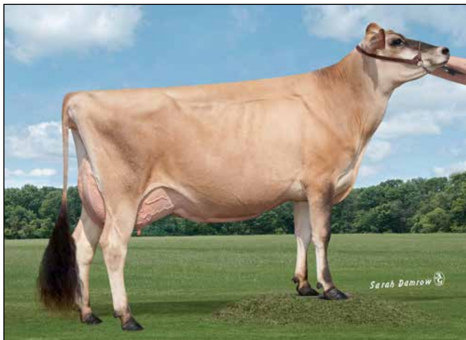
GCJ Action Hopscotch EX-92% 3rd dam of Lot 59