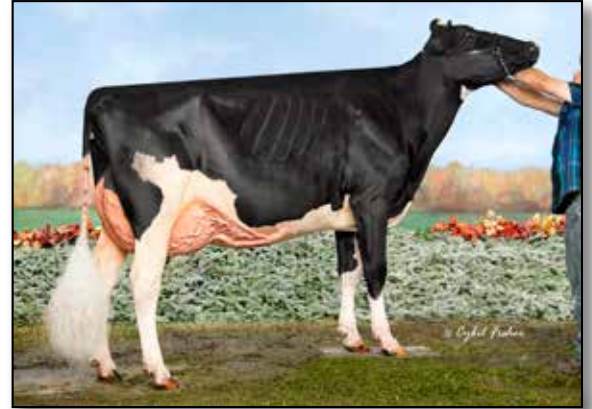
Milgene Just A Game-ET EX-92 full sister to dam of Lot 14