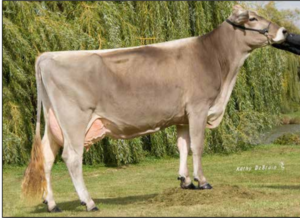
Dublin-Hills Cookie 2E-EX92 3rd dam of Lot 51