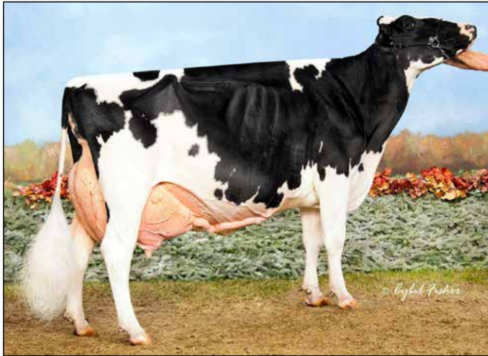
Smith-Crest-TW SH Virgie-ET EX-95 dam of Lot 2