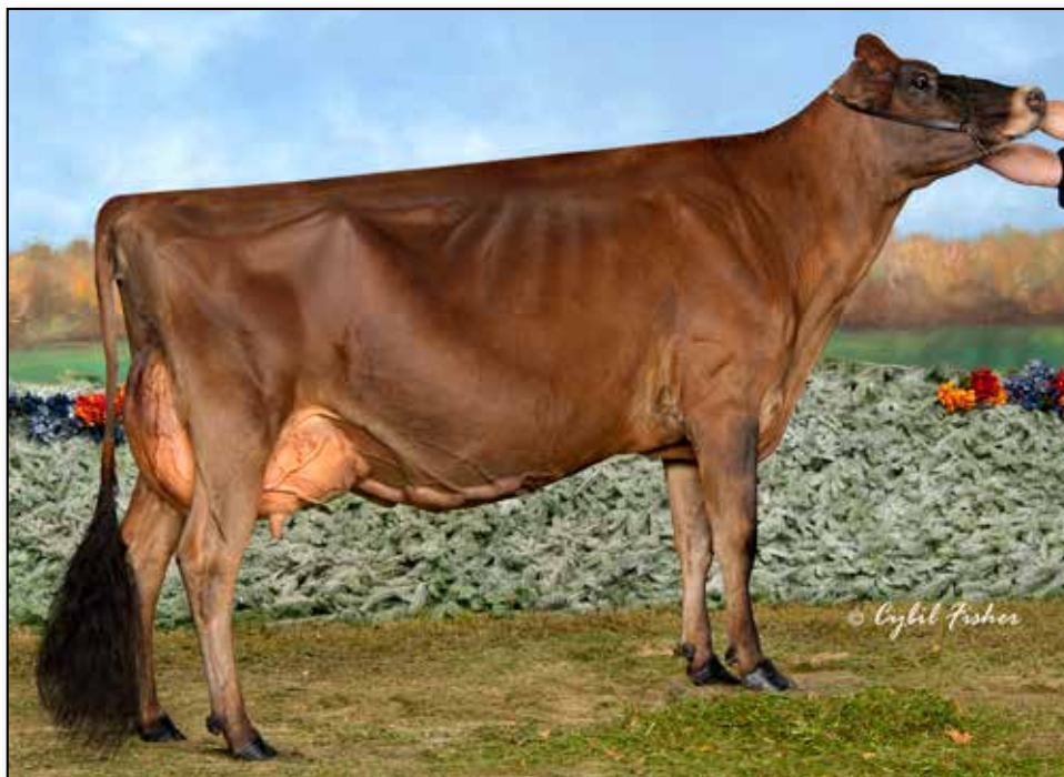
Voigtscrest Attitude EX-92% 3rd dam of Lot 57