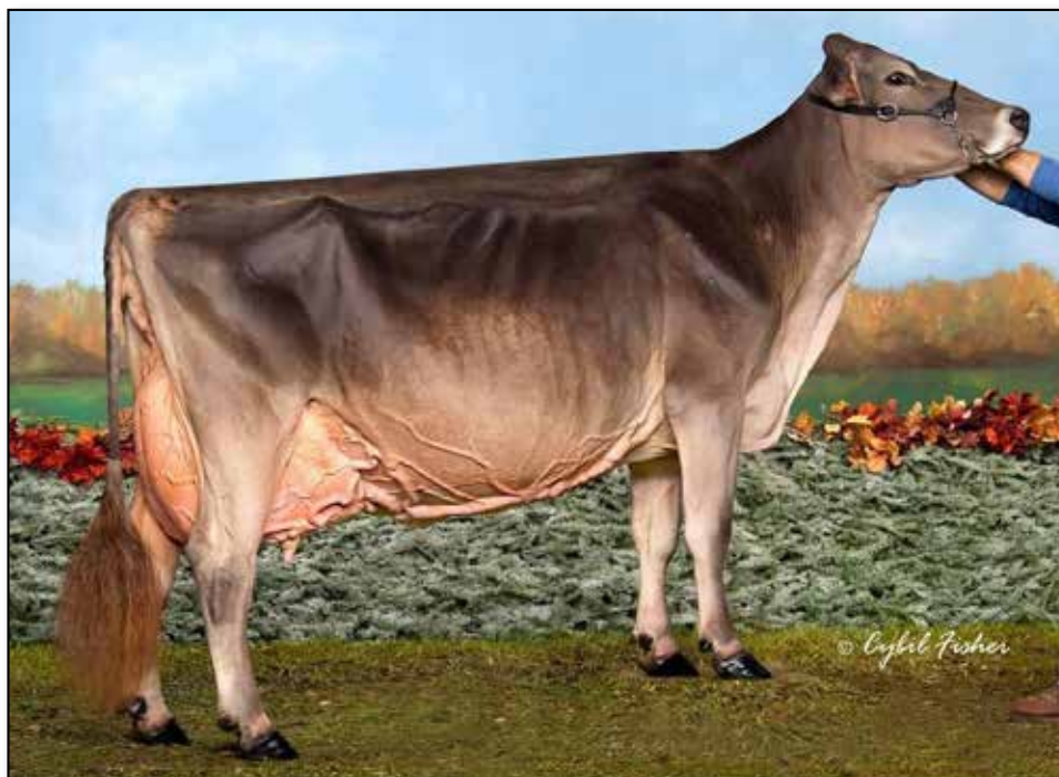
Kruses Victor Judy 2E-E94 2nd dam of Lot 44