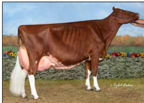
KHW Regiment Apple-Red-ET EX-96 3E DOM 5th dam of Lot 29