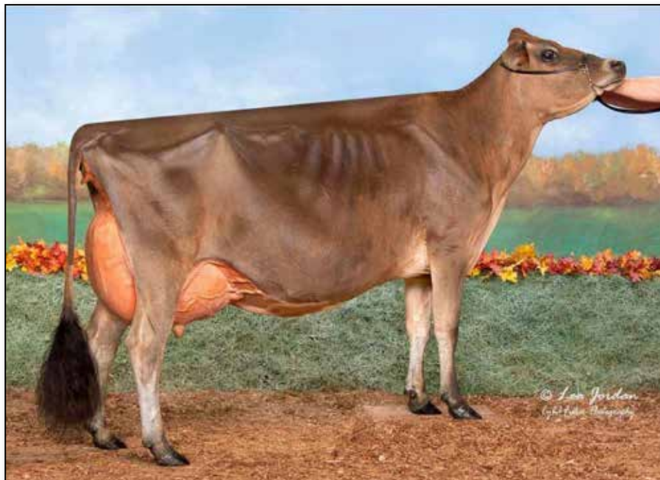
Random Luck Surprise Me EX-94% 2nd dam of Lot 58