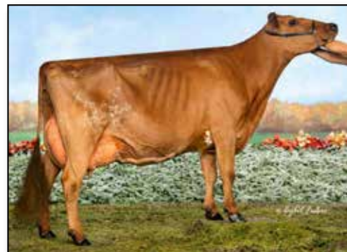
Yellow Briar J Beverley EX-91 2nd dam of Lot 69

100666205 EX-91 4-02 3-03 2x 365d 29,460 3.6 1046 3.3 981 2-03 2x 326d 22,630 4.2 945 3.4 764 • Nominated All-American Aged Cow 2021 • Total Performance Award Southern National 2021 • 2nd Aged Cow 2021 Southern National • Reserve Grand KY State Fair 2019 • Res. All-Canadian Jr. 3-Yr-Old 2015 • Nominated All-American Jr. 3-Yr-Old 2015 • Nominated All-Canadian Jr. 2-Yr-Old 2014 • Nominated All-American Spring Yearling 2013