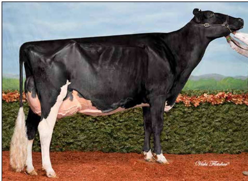
Jacobs Goldwyn Brittany-ET EX-96 2E 7* 4th dam of Lot 17