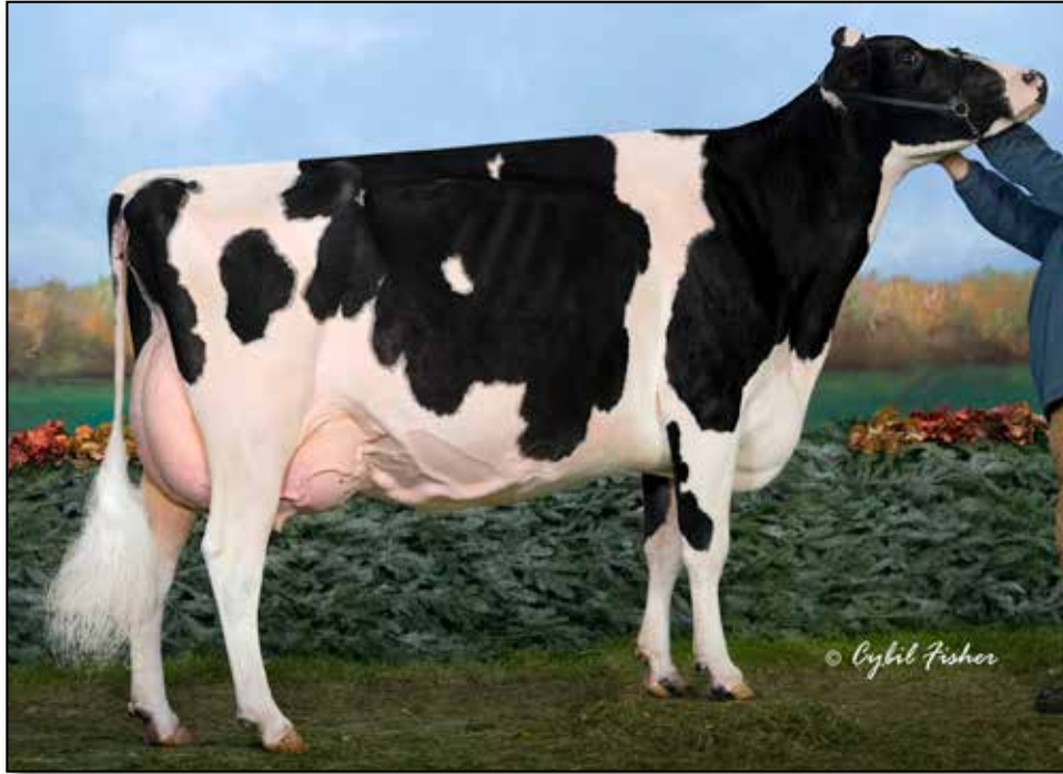
MD-Maple-Dell Roy Image EX-95 3E 2nd dam of Lot 21