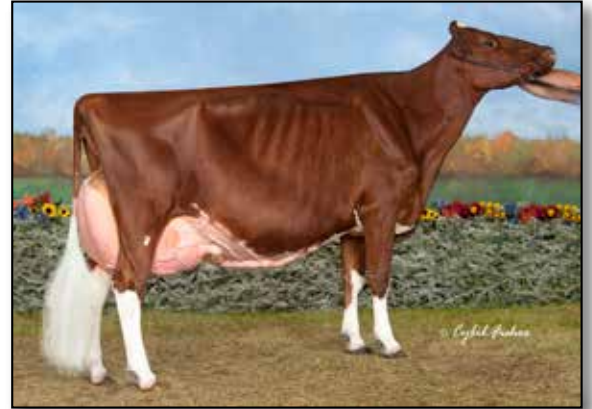
KHW Regment Apple-Red-ET EX-96 4E DOM 2nd dam of Lot 6