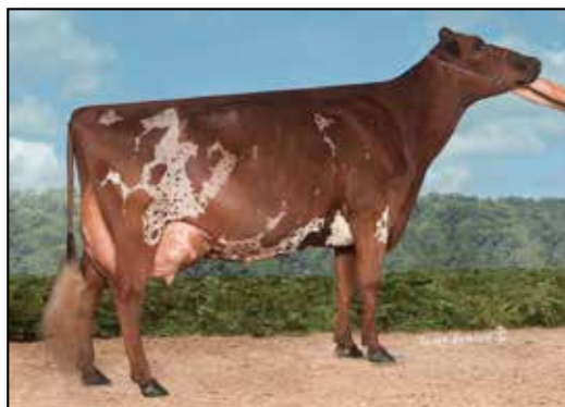
Sharwards Callimero Megan EX-94 2nd dam