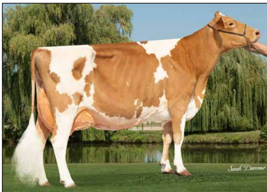
Hi Guern View Dancing Diva-ET EX-96 dam of Lot 52