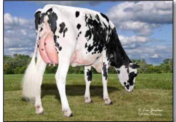
Klassy-K Tatoo Party VG-85 maternal sister to Lot 28