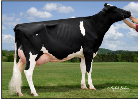
Ernest-Anthony Andorra-ET "EX-90 2E" Dam or Granddam of Lots 1 - 6

Owners: Larry & Kim Voigts, Platteville, WI 608-732-3983 • DHI Herd Code 35-330915