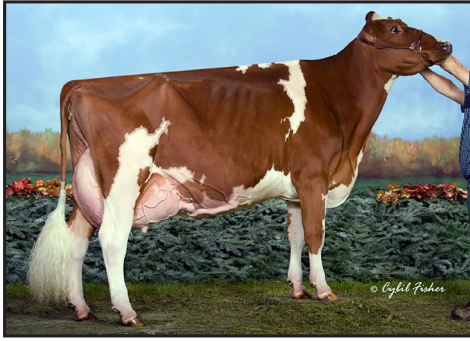
Rocher Jordan Snow-Red-ET "EX-94 2E" Maternal Sister to Dam of Lot 8