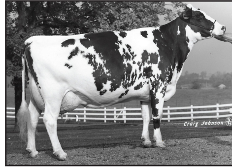
Stookey Fagn Scarlet-Red-ET "EX-94 3E" GMD DOM Foundation Cow behind Lots 7 - 11