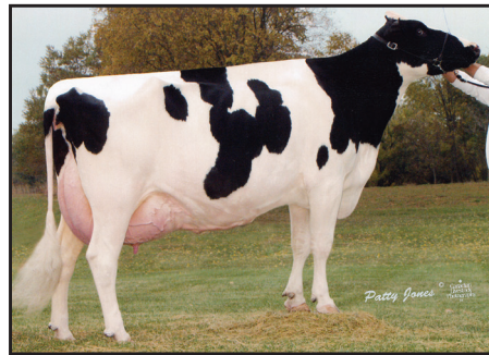
Tri-Day Ashlyn-ET "EX-96 2E" GMD DOM Third or Fourth Dam of Lots 1 - 6