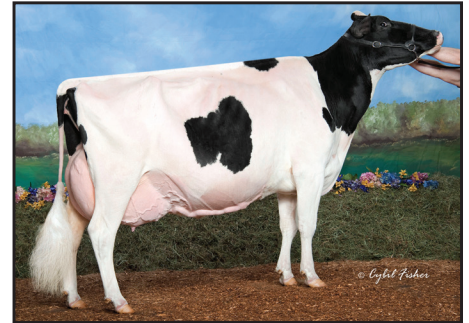
EK-Oseeana Ambrosia-ET "EX-95 2E" GMD Granddam or Third Dam of Lots 1 - 6