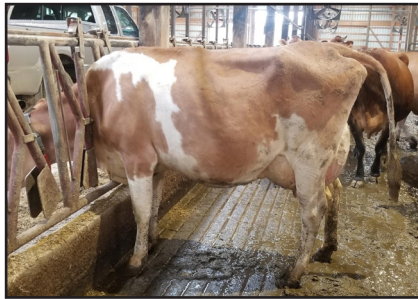
AJ WESTPORT 4459 {6} Dam of Lot 9

JX RIVER VALLEY CHECKMATE {5}-ET 200JE10008 JE840003126479255 GT99K BBR 100 JH1C JNSF CDCB GPTA S 12/01/2021 795DAUS 59HRDS 9%RIP 99%R 901M 0.03% 51F 64%ILE 99%R 0.03% 40P 346CM$ 339NM$ 280FM$ 268GM$ 0.1PL -4.3LIV -3.9DPR -3.2CCR 1.2HCR 3.04SCS 0.1MFV -0.3DAB -0.1KET -3.6MAS 0.3MET 0.1RPL -6.60HTI AJCA 12/01/2021 402DAUS GPTAT 98%R 0.3 GJUI -0.6 GJPI 96%R 59