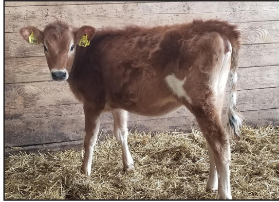
AJ CHIEF 5094 SELLING AS LOT 9