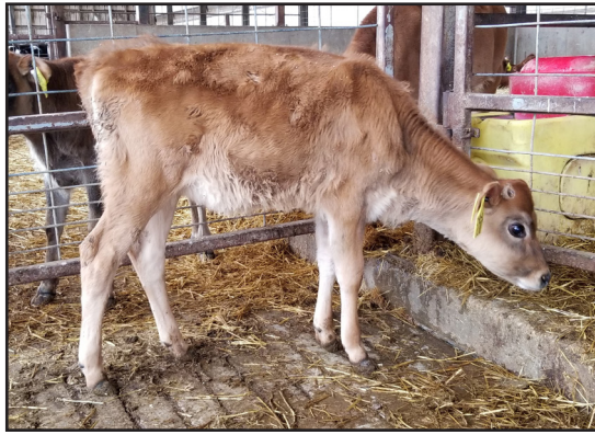
JX KB TROOPER 26387 {3} SELLING AS LOT 6