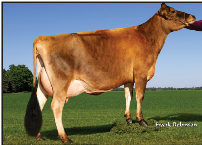
PRIMUS VICEROY CAMILLE 23108-ET Sister of the Dam of Lot 3