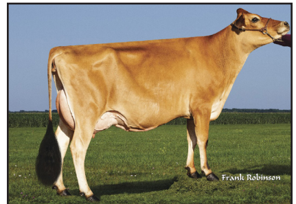
PRIMUS DISCO CAROLINE 100407-ET Sister of the Dam of Lot 2