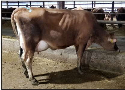
JX KB LANCER 18978 {4} Dam of Lot 5