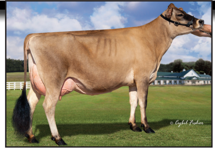
GOFF PHAROAH CIRCUS ACT-ET Great-Grand Dam of Lot 2 Dam of CRAZE

4TH DAM: GOFF VALENTINO 9595 84% 1-11 305 3 14110 4.9 687 3.5 500 73DCR 1728C