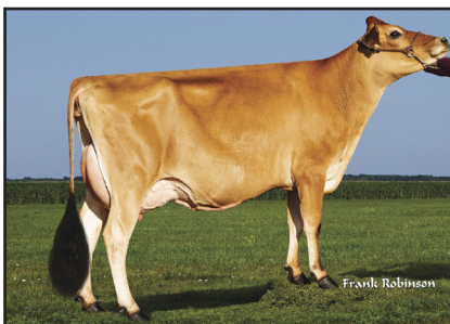
PRIMUS DISCO CAROLINE 100407-ET Sister of the Dam of Lot 3