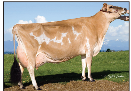
PLEASANT NOOK F PRIZE CIRCUS, E-97% Seventh Dam of Lot 2