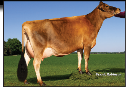
PRIMUS VICEROY CAMILLE 23108-ET Dam of Lot 4

4TH DAM: GOFF VALENTINO 9595 84% 1-11 305 3 14110 4.9 687 3.5 500 73DCR 1728C