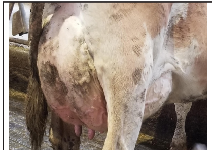
AJ WESTPORT 4459 {6} Dam of Lot 9

JX RIVER VALLEY CHROME CHERITA 1261 {5}- 90% JE840003126479388 GT13K BBR 100 JH1F JNSF DHIA HERD # 33-87-0722 CONTROL # 1261 1-10 305 3 16230 4.2 678 4.1 662 101DCR 2009C 2-10 305 3 16910 5.1 859 3.7 619 103DCR 2141C 305 2X ME AVG 3L 21257M 1088F 818P 2723C PPA 919M 84F 68P / YD 1256M 76F 60P CDCB GPTA S 12/01/2021 3RECS 86%R 99%ILE 672M 0.05% 43F 0.01% 27P 572CM$ 568NM$ 536FM$ 4.3PL 0.7LIV 1.6DPR 2.2CCR 0.5HCR 3.00SCS 578GM$ -0.1MFV 0.0DAB 0.2KET 0.5MAS 0.1MET 0.0RPL 0.16HTI AJCA 12/01/2021 GPTAT 84%R 1.7 GJUI 12.7 GJPI 81%R 127