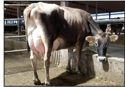
JX KB AMP 18897 {2} Dam of Lot 6

4TH DAM: YOSEMITE PERFORM GARRETT S30328 83%