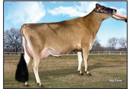
GOFF VALENTINO 9595 Fourth Dam of Lot 2