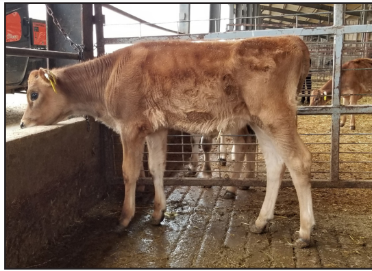
JX KB TROOPER 26384 {5} SELLING AS LOT 5