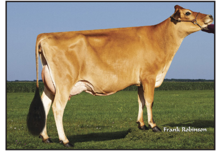
PRIMUS DISCO CAROLINE 100407-ET Sister of the Dam of Lot 4