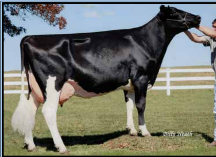
Ricecrest Mac Melinda-ET VG-88 VE+UU 4-01 365 35150 3.8 1338 3.1 1092 (13 descendants sell)