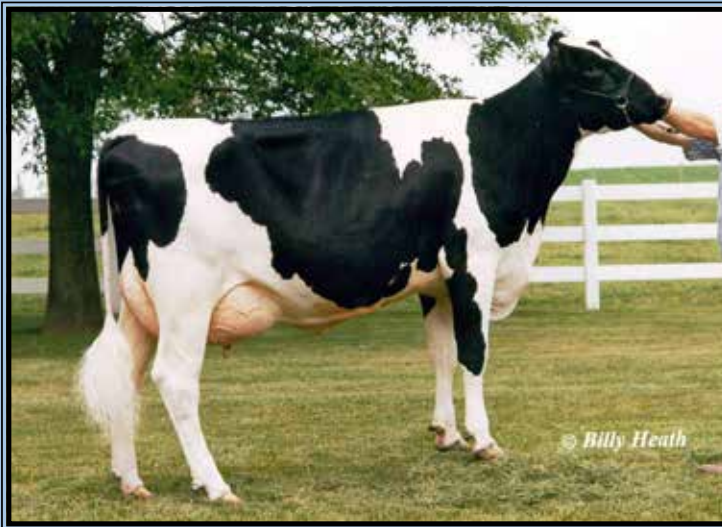
Ricecrest Luke Lauren EX-91 GMD-DOM *Full sister to former #1 TPI sire 'Lantz' (40 descendants sell)