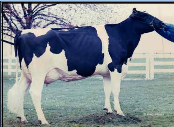
Ricecrest Convinc Cristy-ET EX-90 EEVUE DOM 7-10 365 30300 4.1 1244 3.0 913 (16 descendants sell)