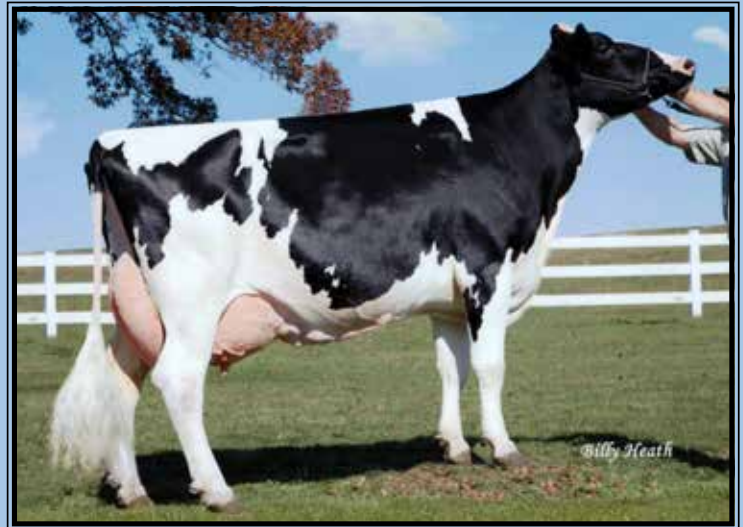
Ricecrest Shottle Sherry-ET EX-90,2E 4-04 365 39410 3.4 1331 3.1 1231 (57 descendants sell)