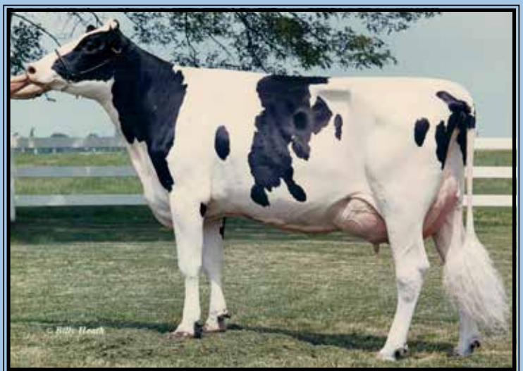
Ricecrest Jester Jamie-ET EX-90 VEEEE 4-04 365 385120 3.6 1372 3.1 1183 (38 descendants sell)