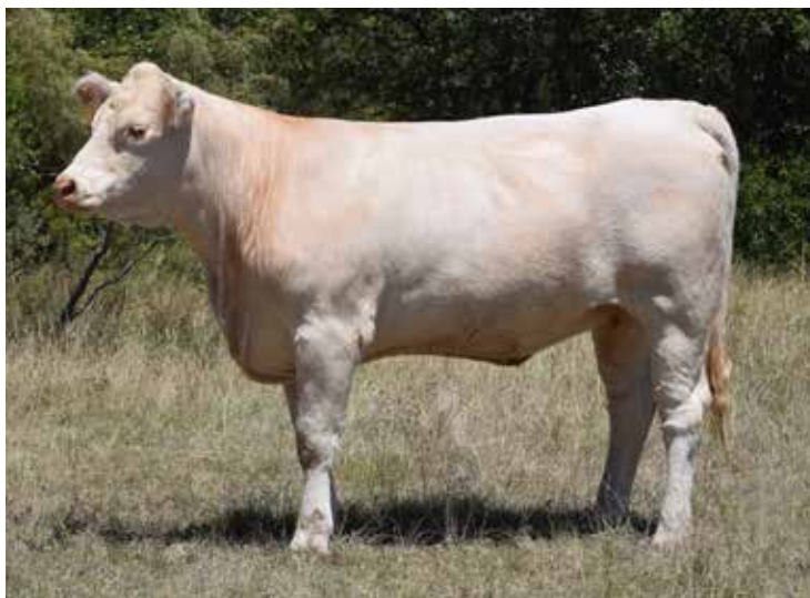
RE MAX DYNASTY 966 Sells as Lot 57

DUE with ET calf on 1/24/22 from mating of DC/CRJ Tank 108E x JDJ Ms Cigar B2011. WOW! WOW! A super mating, these were the top selling embryos in the 2021 Appalachian Sale! What an explosive genetic package. B2011 has been setting sales on fire with her offspring. Her Dam R120, a donor at DeBruycker's, is also the dam of JDJ Truemark T39, the sire of BHD Zeus X3041. The calves from this could "mark" your herd!