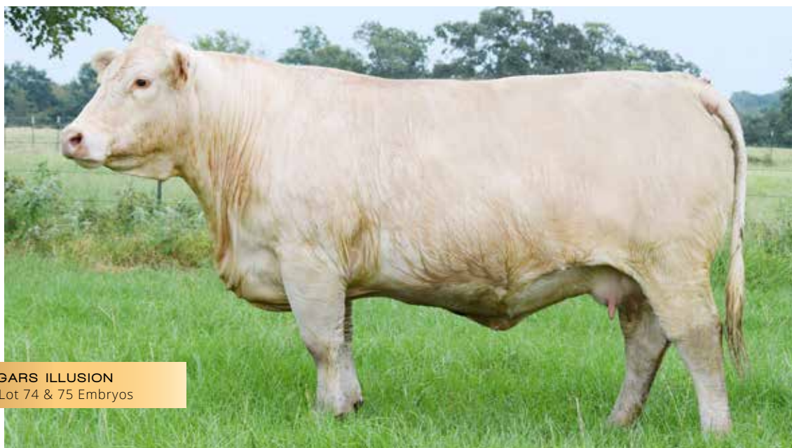
AC MS CIGARS ILLUSION Donor Dam of Lot 74 & 75 Embryos