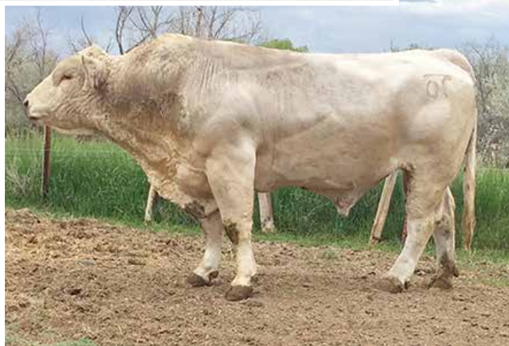
BHD KINCSEM B629 Sire of Lot 2