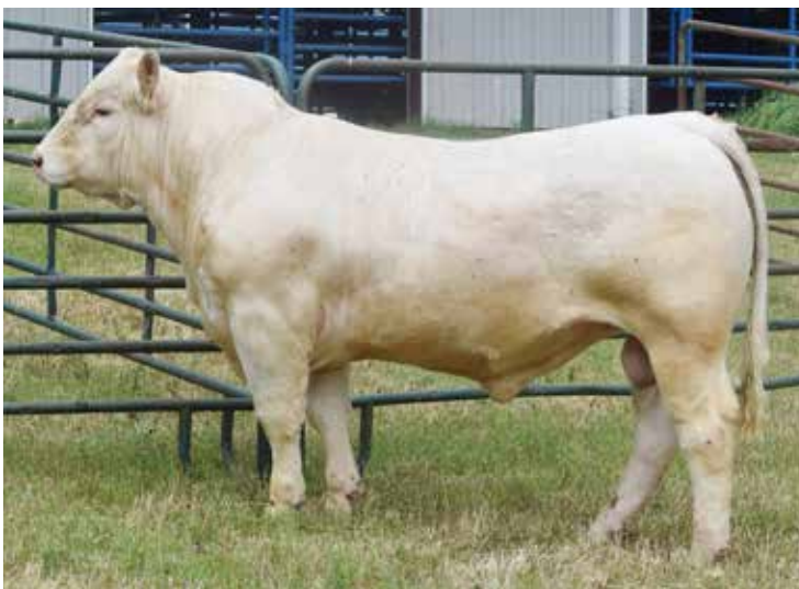
DC/JDJ PEGASUS D3330 P