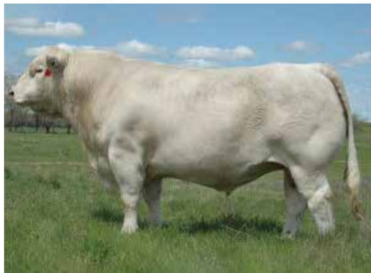
LT BLUEGRASS 4017 P Sire of Lots 15 & 16

Sells Open , an early "pick of our older 2021 heifer calves!" Bluegrass makes some awesome broodcows with superb milking, easy fleshing ability, with eye-appeal. Her maternal granddam is the famous donor, M6 Ms E46's Duke 248, a house-hold name in Charolais industry. This superb prospect is stacked with maternal power on all sides! If your looking to add quality, performance, and name-recognition pedigree for extra value, this is the lot.