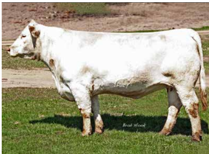
TR MS CIGAR 5785R ET Donor Dam of Lot 76 Embryos

5785 is a full sib to the immortal Zsa Zsa and has 68 progenies registered with AICA. She is owned by Thomas Ranch, Polzin, and Slack Farms. She would be a maternal sib to the Reserve AICA National Champion Bull, Thomas Mr Ice Bucket, and many other champions on a national basis. A very elite mating. Embryos are at Bovine Elite, College Station, TX.