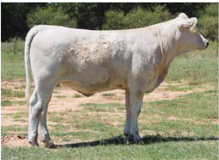
RE QUEEN RACHEL 084 ET Sells as Lot 51

Sells Open. This exciting heifer has that added stretch and growth factor. Going to make a big cow, her dam was huge, lots of volume and a great milking cow with fantastic udder quality. She had 38 calves registered with AICA. Super correct, feminine, and stylish, this well-bred heifer exemplifies perfection in design. With her deep spring of rib, good bone, and great disposition, she will quickly become one of the favorites in the herd!