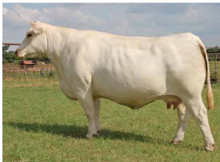
M6 COOL GERMAINE 1145 P ET Dam of Lot 3

Fertility and Trich Tested, selling Full Interest and Full Possession. A real treat here in this well-bred individual. A full brother topped the 2021 Appalachian Sale going to Rocky & Issac Hughes, MS. A light birth weight with excellent weaning makes this an ideal herd sire! His dam was a feature of the M6 Dispersal where her progenies commanded over $167,500 in sales. Use a herd sire with superb pedigree, performance, & style!