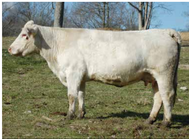
OHF LADY K008 Dam of Lot 27