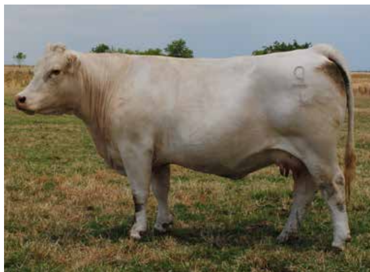
JDJ MS CIGAR S288 Donor Dam of Lot 66 Embryos