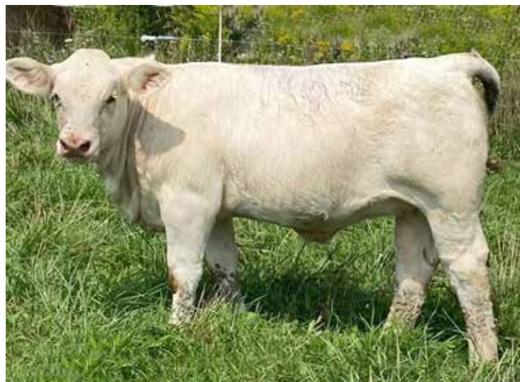
CIRCLE K JEWEL

Sells Open , a full sister to Lot 22, coming from the strong and successful Antionette, our featured Donor cow. She descends from a long line of winners in the ring and will be ready for all the winter and spring shows! Jewel has that same great look as the Champion Juliette, a maternal sister. You get a great opportunity to evaluate a true winning family in these top 4 prospects!