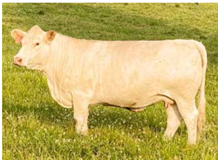
RE EQUAL DYNASTY 418 ET Sells as Lot 69