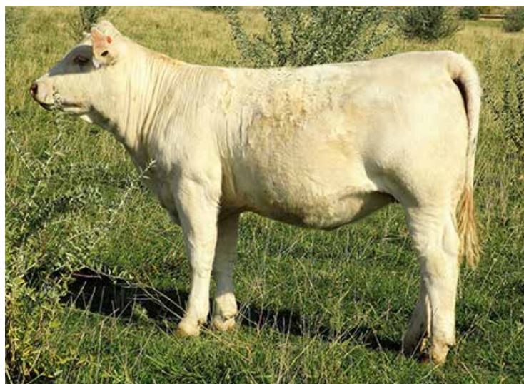
SM MS DEEP FREEZE H3020 P

Sells Open. Super feminine heifer with extended neck and femininity displayed by this 2020 daughter of lot 48. You get to evaluate the whole family here! Super bone and style on this heifer that could have been campaigned in the ring! Her sire's dam, Y150 was a "Pick of Herd" from DeBruycker by Double-H Charolais, MN for the elite ET program. I sure wouldn't let this heifer get away, or her dam and sister!