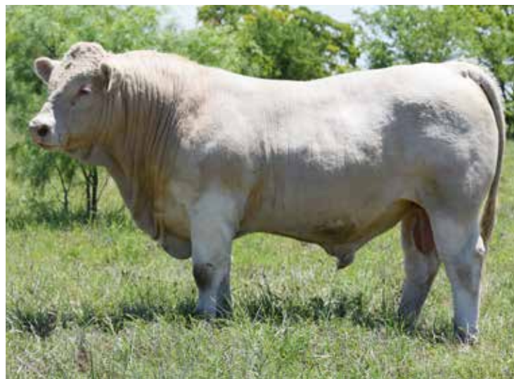
RE SIR BRAXTON 022 ET

Selling 10 straws semen, located at Bovine Elite, College Station, TX. One of the most outstanding sons of Sparrows Braxton 519C, but he should be with his stacked pedigree with JDJ Ms Cigar B2011 P. One of the most promising young sires in the industry today. This is your opportunity to make an early investment in one destined to become a great one. His growth, thickness, and pedigree insures a superb opportunity!