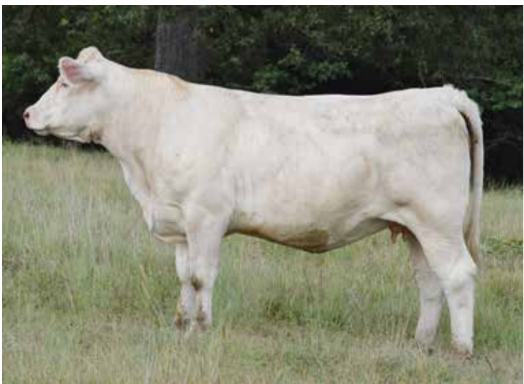
RS MS FRISCO G4 Sells as Lot 7