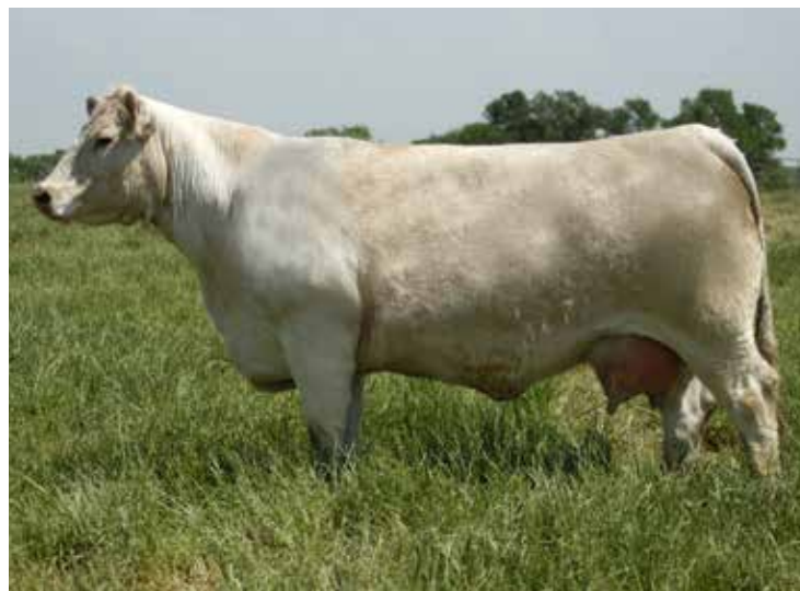
SRC MS BLUE VERNA T97 ET Donor Dam of Lot 77 Embryos

Verna T97 worked in the Sparkman Cattle Co's herd before going to Timmber Farms ET program. A very heavy milking cow, Verna had the volume and scale to instantly impress anyone! Her dam was the $50,000 donor at Three Trees, JWK Verna E225! These should make awesome females or stout, powerful bull calves!