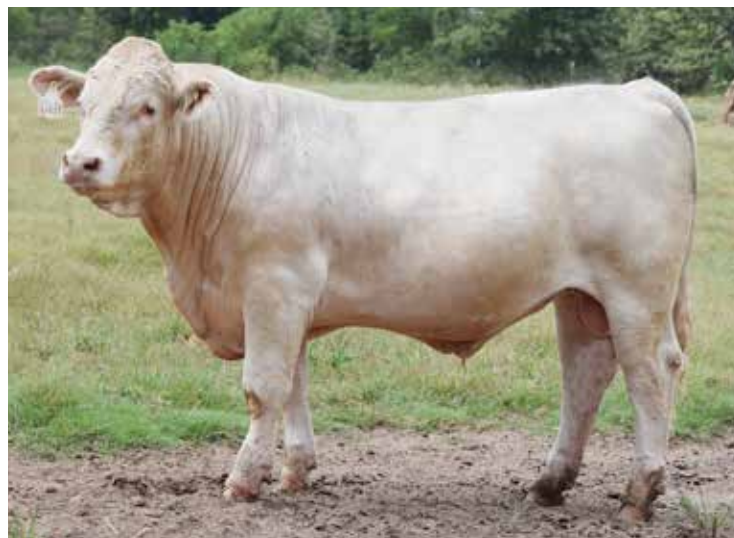
RS MR CIGAR CURLIN H10 Sells as Lot 5

Fertility and Trich Tested, selling Full Interest and Full Possession. A unique opportunity in this outstanding prospect. His dam is selling as lot 6, so you can effectively evaluate the foundation for this proven lineage of producing high caliber maternal power females and thick meaty bulls. Curlin's dam, K1509, was one of the most impressive daughters of Cigar! The Tradeline S3017 has been a great donor for Arlitt's with many top progenies.