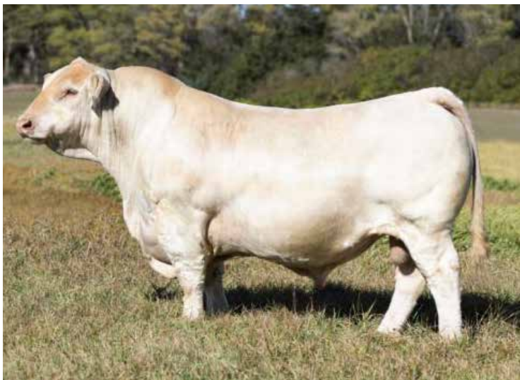
ACE-ORR LOCK N LOAD 243P Sire of Lot 18 Embryos