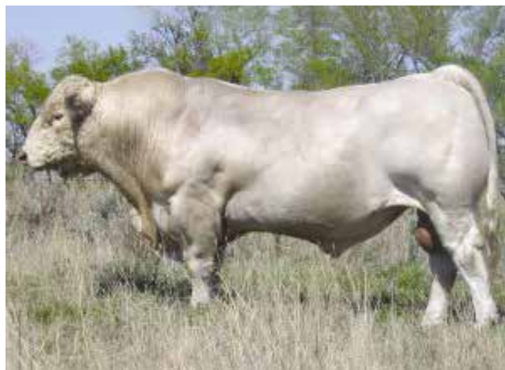
M6 GRID MAKER 104 PET Sire of Lot 28

Bred A-I on 3/27/21 to LT Affinity 6221. An own daughter of the renowned Grid Maker that sires such outstanding females. Alexia ranks in the top 8% for Milk, 20% REA, 5% Fat, and 8% Marbling to enable a breeder to use this solid foundation to excel with a performance sire for maximum production. The Duke and Mac influence adds great maternal value to this elite pedigree. Affinity is one of the great calving ease sires!