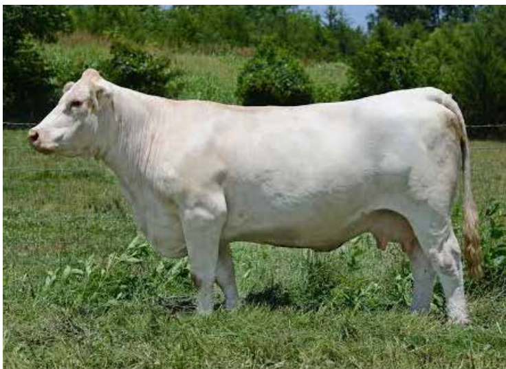
M6 MS E46 QUALITY4241PET Donor Dam of Lot 19 Embryos

Lock & Load offers tremendous EPD numbers , top 6% WW, 2% YW, 15% MTL, 1% CW, 15% REA, 4% Marb, and 1% TSI for the breed comparisons. Clarice adds the calving and BW along with top 5% Milk for a well-rounded blend of top genetics. Two of the more popular genetics lines you could add to your herd!