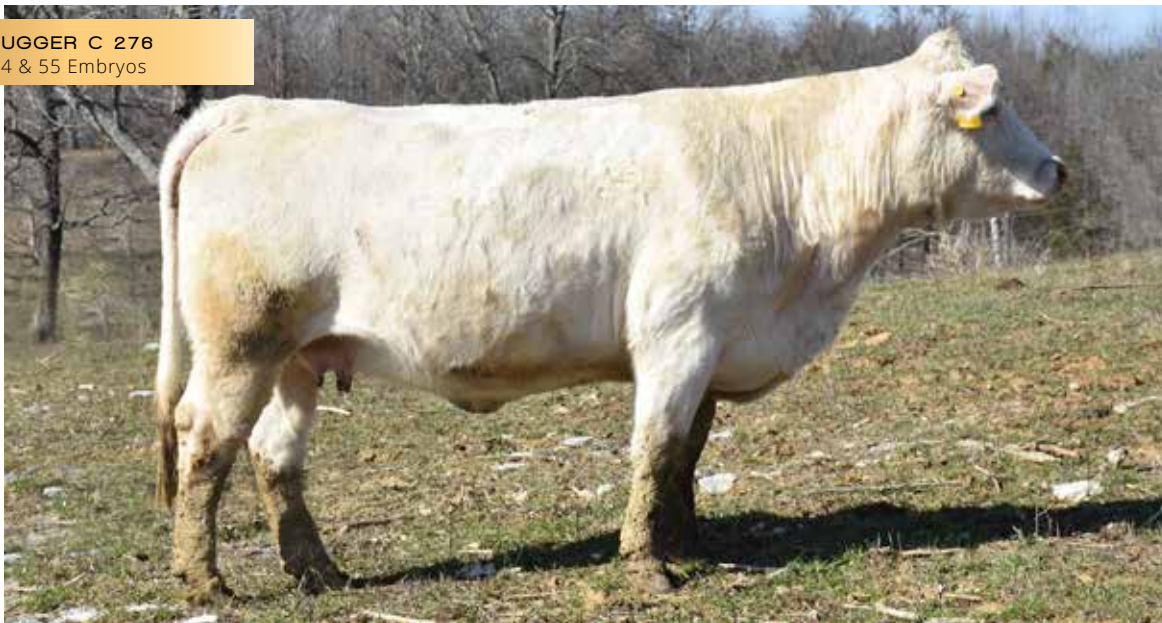
KTR MISS JUGGER C 276 Dam of Lot 54 & 55 Embryos