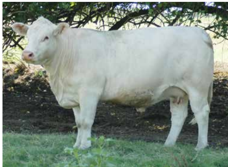
BC MS PERFECT MARK P ET Donor Dam of Lot 64 & 65 Embryos

Good solid numbers on this elite mating. Direct influence of two of DeBruyckers most prominent foundation giants, Ali Mark T214 and LHD Mr Perfect Y416! 7-1G topped the Canadian Farm Fair as Champion Cow/calf as a 2-Year old and sold for $25,000. She sold twice more and each time for $25,000! She had a beautiful udder quality!