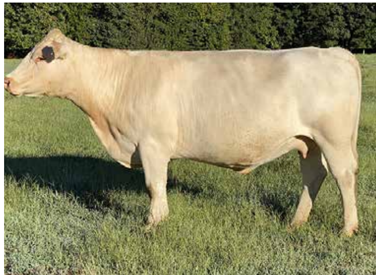
CFR LADY MAC 540 P Sells as Lot 71

Sells bred A-1 to ACE-ORR Efficient, safe in calf and DUE 12/15/21. Another very broody appearing cow with some of the early proven genetics of the 70's and 80's in Duke 914, Mac 2244, and No Doubt. These build a great foundation for many of today's top individuals. She ranks in the top 20% YW, 30% Milk and Marb, and 15% in TSI EPDs. The Efficient calf will add tremendous value to this as a pair!