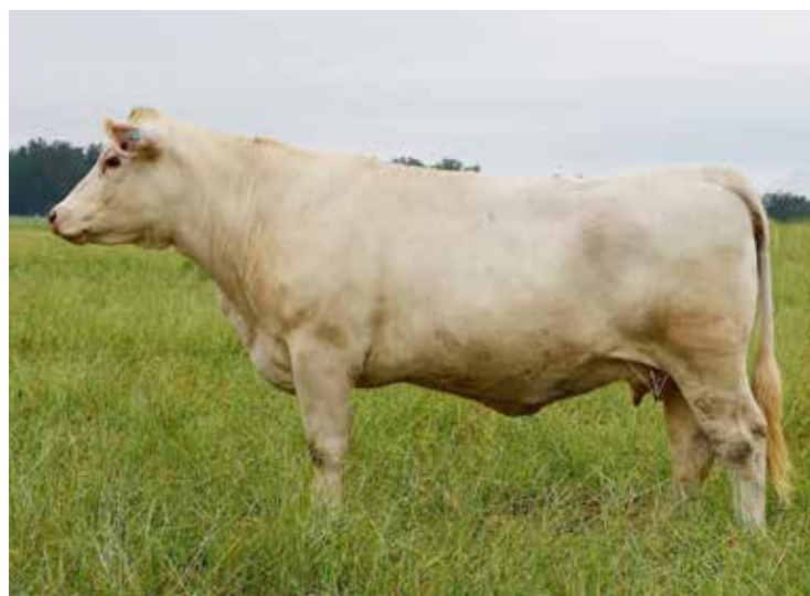
BAMBOO MS ALI SMOKE Dam of Lot 26