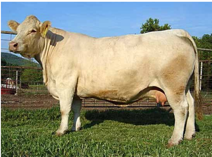
ABC DAN MACKIE Dam of Lot 44