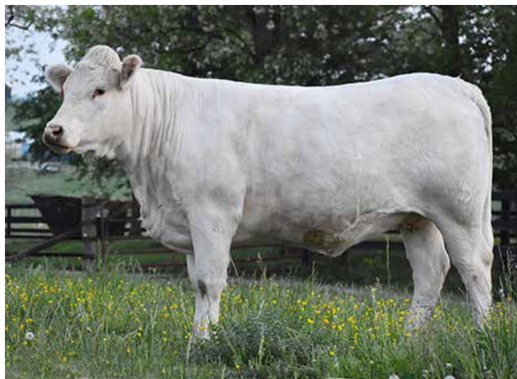
CS MS PRESIDENT DZ12 P Dam of Lot 37