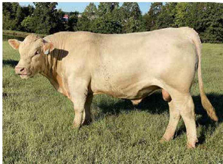
WC RESOURCE 9132 P ET Sells as Lot 4

Fertility and Trich Tested, selling 67 % Interest and Full Possession, Wright Charolais retained 33% Interest. Only due to the dispersal of ABC cattle do you get a chance to purchase some of their best cows and a major herdsire like this. He ranks in the top 3% for Milk and MTL, 9% for Marbling in breed EPDs. Sired by the very popular and proven show sire, Resource 417. He has also proven to be an excellent calving sire with very good CE and BW numbers. Also, he has the age to breed a large number of cows with his maturity!