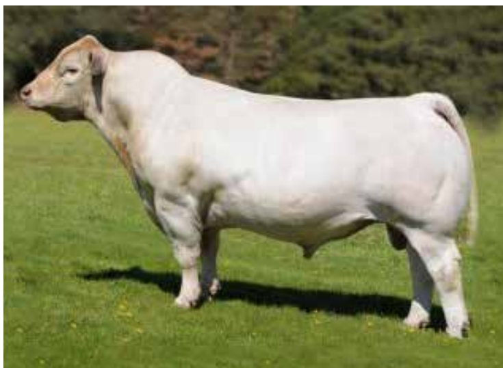
TR MR FIRE WATER 5792RET Sire of Lot 24 Embryos

WOW! Super opportunity to create the "cream of the crop" with this powerful mating! Combining two of the winning programs for maximum competition! Outsider is certainly one of the "go-to" sires for siring winning progeny! These sexed embryos could return awesome results in progeny and value!