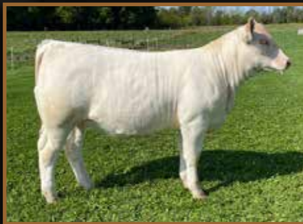
CIRCLE K CHARLI CK 176 WC Milestone 5223 P X Circle K Antoinette Open ET Show Heifer Prospect!