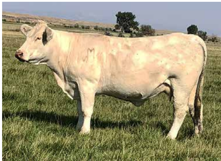
SM MS ARES F803

48A: Pld heifer calf #180, born 3/19/21, bw 72, sired by SM Perfect Leonidis C3251 P, M890553. PE exposed from 4/22/21 to 7/10/21 to Beck's Insight 952G, a Sparrows Braxton son! Tremendous pedigree and great numbers, top 8% WW, 2% YW, 20% Milk, 8% MTL, 8% CW, and 2% TSI for the breed EPD comparisons. Super performance on cow, 120% WW Ratio and 113% YW ratio. Very good milking cow with extra performance.