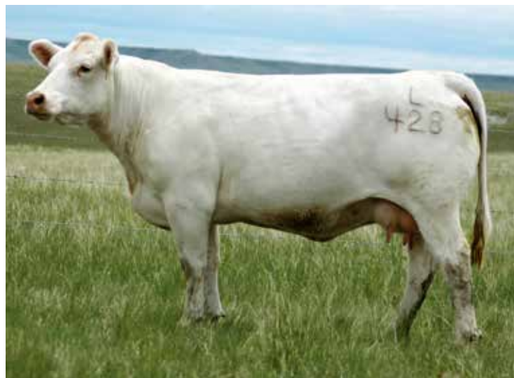
JDJ MS DYNASTY L428 Maternal Grandam of Lot 41

Sells Open. A different package on this highly regarded female. Her maternal granddam is the fabulous JDJ Ms Dynasty L428. A very prolific matron that produced till she was 18 years of age with 87 progenies registered with AICA. She produced several $10,000 + Offspring, including 2- $15,000.00. This will definitely be one to scope out and take home to add quality and consistent productivity to your herd.