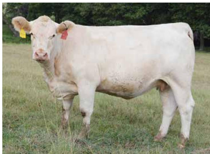
RS MS JO EQUITY F1239 Sells as Lot 9

DUE: October 1, 2021 to LHD Cigar E46. Jo's dam, H891 was referred to as "Tiny" as she weighed over 2100 #lbs and was a massive female with abundant volume, thickness, and size. Definitely wasn't on Weight Watchers! Her calves were awesome, very clean, correct, smooth made and structurally correct! Jo excels in those traits as you notice! Also, a trait of Equity offspring. A calf by Cigar will be a tremendous value as a bull calf or heifer addition!