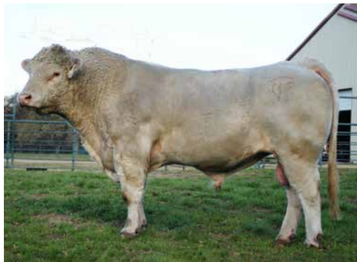
BHD REALITY T3136 P Sire of Lot 65 & 66 Embryos

Few bulls sired as much performance and eye-appeal as Reality! Commercial ranchers loved his stout bulls and the top females by Reality were awesome producers. Twice his daughters were voted best consignments in the President & Reality sale!