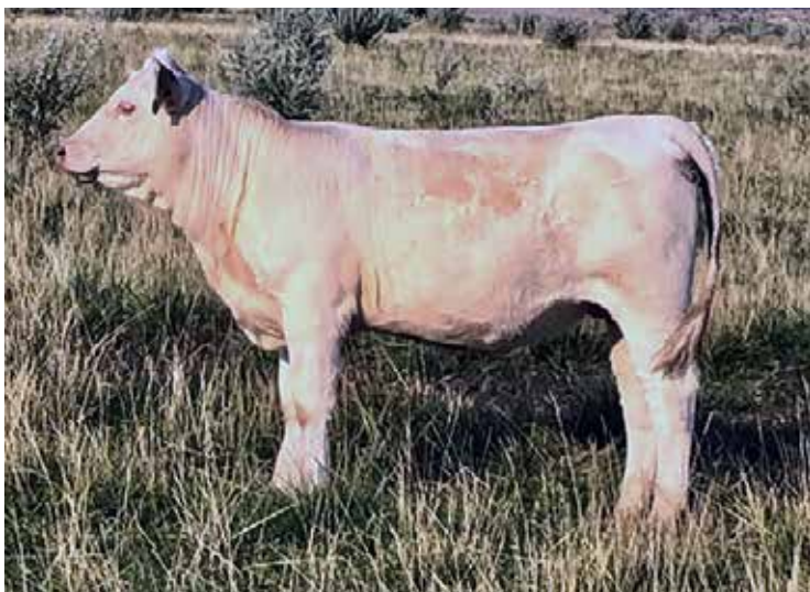
SM MS DEEP FREEZE H3000 P Sells as Lot 50