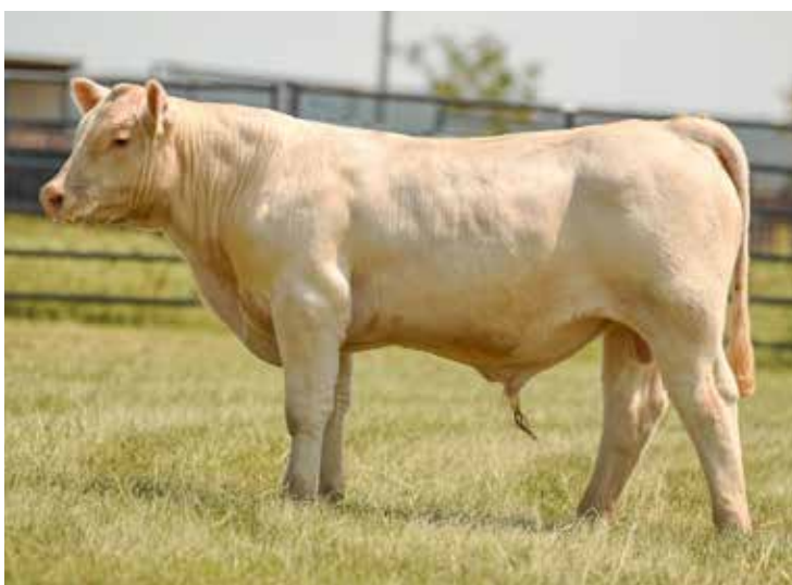
BULL CALF 46A

Semen is located at Bovine Elite, College Station, TX or Champion Genetics, Canton, TX. Pegasus is coming to the forefront as one of the great breeding bulls of his time. He ranks in the top 4% for WW, 2% YW, 8% MTL, 1% for both CW and REA, and 2% for TSI EPDs in the breed! His first daughters have calved and have gorgeous udder quality and size. One of the top Zeus sons in the breed!