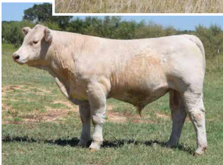
RE MR VERSATILE 088 P ET Sells as Lot 1