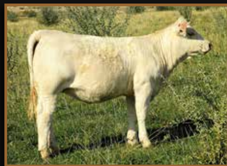
SM MS DEEP FREEZE H3030 P Double-H Deep Freeze 601D ET X SM Ms Isotope C3250