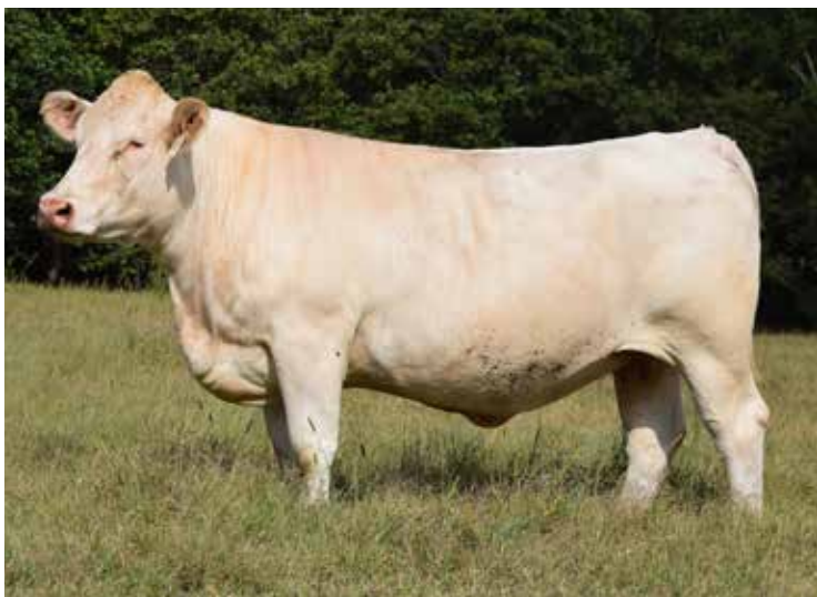
BARA MS CIGAR TRADE 10F P ET Sells as Lot 6