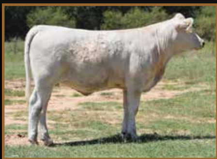
RE QUEEN RACHEL 084 ET DC/BHD King F2503 P X BHD DS Rachel Alex 950 ET

sired by Pegasus D330, DC/BHD King F2503, RE Perfect Mark 578 ET, HF Judge GW53 and more!