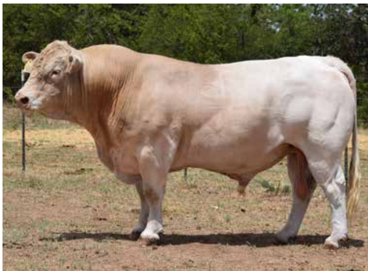
RE MAX DYNASTY 510 ET Sire of lot 56