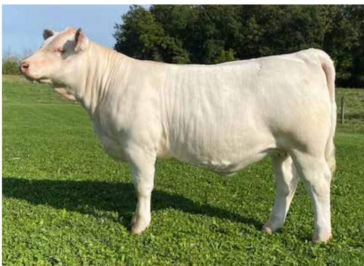
CIRCLE K JACKIE O Dam of Lot 20

This New Zealand sire has become known for adding unbelievable thickness and power to his offspring. Ms 4241 has 41 progenies registered with AICA. One of her daughters topped the first President and Reality sale at $17,000 after being voted as best consignment of the sale. This will be a very exciting blend of top genetics!