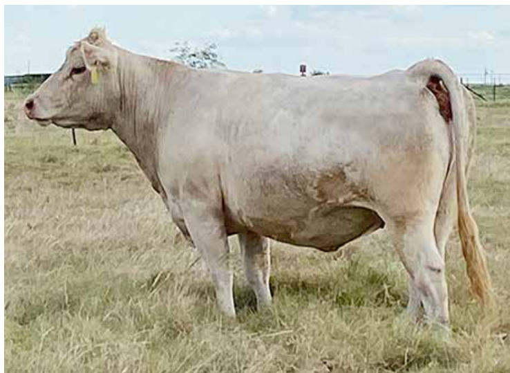
BRP ZEN'S PROUD MARY E04 PLD Sells as Lot 62

Sells PE from 4/15/21 to 8/5/21 to BRP Houdini G05, M936841. Houdini is a LT Rushmore son out of a Slam Dunk cow. Nancy descends from lots of power in scale and genetics. She has the overall volume and capacity that is typical in President daughters and a great udder. Her dam is a full sib to Three Trees Wind 0383 P. This is a very solid broodcow selection in the prime of her production years!