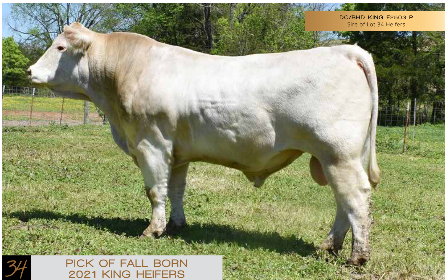
DC/BHD KING F2503 P Sire of Lot 34 Heifers