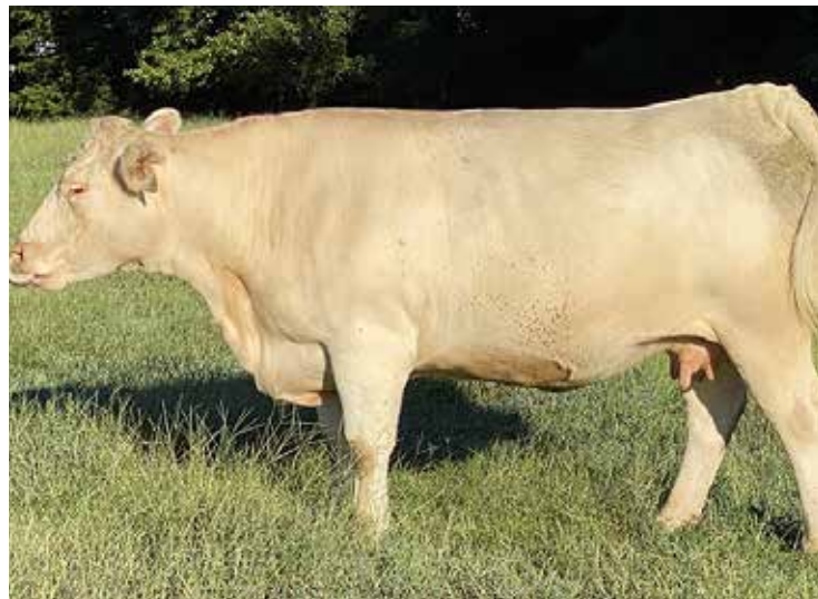
RHC MS PRINCESS DAISY 14A Sells as Lot 70

DUE anytime to TR Mr Outsider 7607E, M894574, a son of M&M Outsider 4003. PE from 12/13/20 to 3/20/21. This broody cow represents Ledger well with her smooth conformation, length, and skeletal correctness. She ranks in the top 30% for calving ease, 35% YW, 25% CW, 25% Marbling, and 35% TSI for breed EPD comparisons. You also have some of the top female in the breed listed in pedigree, like LT Brenda 6120, DS Perfect Bell 851ETPLD, and PJ Lady Gridmaker 511.