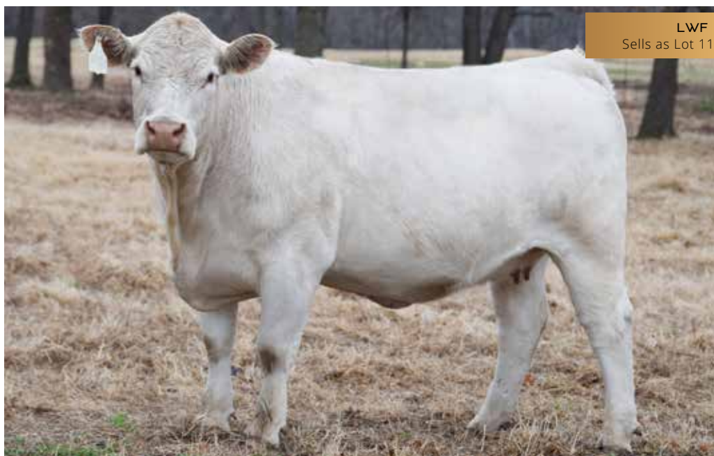
LWF JUNEBUG 1206 Sells as Lot 11 & Dam of Lot 12 Embryos