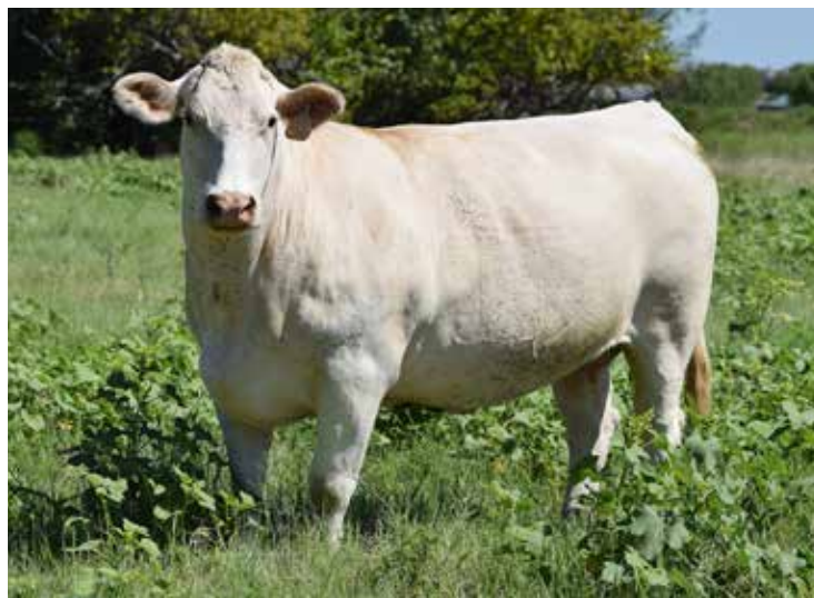
BC MS E46 DUKE Z21 PET Donor Dam of Lot 67 Embryos