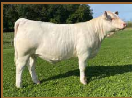
CIRCLE K CAROLINA CK 177 TR CAG Carbon Copy 7630E ET X Circle K Antoinette