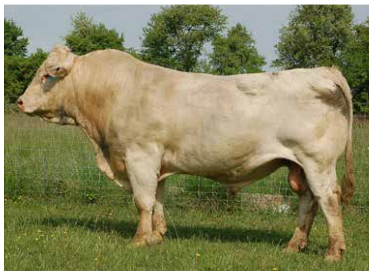
HF HI DEFINITION U08 ET Maternal Grandsire of Lot 38

Sells Open. The genetics here are what made Charolais in the beef industry popular, they grow rapid, have exceptional muscling, females milk well, and gain efficiently! Her dam is a big, powerful cow with superb udder, great depth and spring of rib, with plenty of thickness. She still maintains femininity with her size. 816 is proven to be a great sire. His dam is out of the Cobb bull, Leader L165 and F40, one of the best Mr Prefect daughters ever!