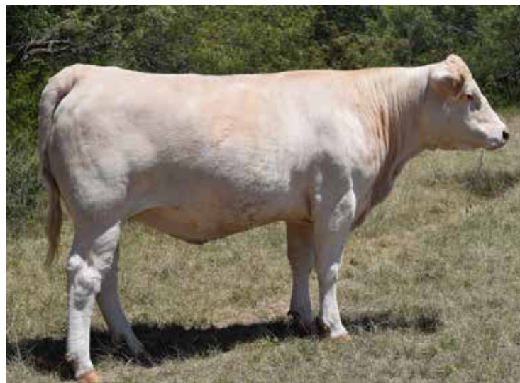
RE MS AVERY 912 ET Sells as Lot 53

Bred A-I to JDJ Maximo A18 P and DUE 3/5/22. What a great way to start a new year with this elite daughter of Landmark and the 950 donor, a full sib to CJC Mr President T122. 950 was on display a couple years ago at the Sale of Excellence and breeders were amazed with her dimensions. Abundant in every way! A sister to Avery calved at 18 months, (not by design), with a super quality udder without a problem. Making a great cow!