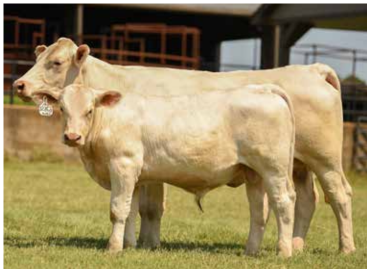
CR MS MILESTONE 6765E2

47A: Pld bull calf born 1/19/21 sired by ACE-ORR Lock N Load 976 P, rebred A-I to ACE-ORR Lock N Load 976 P. PE to WC Unleashed 3128 P ET, EM836965. WOW, quite a pair with a top-rated cow doing a magnificent job of raising a super performance bull calf and very much a herd sire prospect! Ranks in top 35% in 9 different EPD traits with a top 15% for TSI, 10% REA, and 30% for Marb to have tremendous impact on a herd profile!