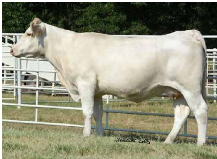
BAMBOO MS PARADIGM 4349 Dam of Lot 10

PE to RE Perfect Max 509, M941838, a son of RE Max Dynasty 510 ET and RE Ms Perfect 921. A very feminine, good producing daughter from a Bamboo Farms design cow. Her Eaton dam was a highly selective element to the Bamboo program. E4349 has a great CE in top 5% of breed EPDs, top 15% BW, 25% Milk, and TSI in top 35% ranking. Asset, a homozygous Polled sire is a great calving ease bull with very good milking ability of daughters.