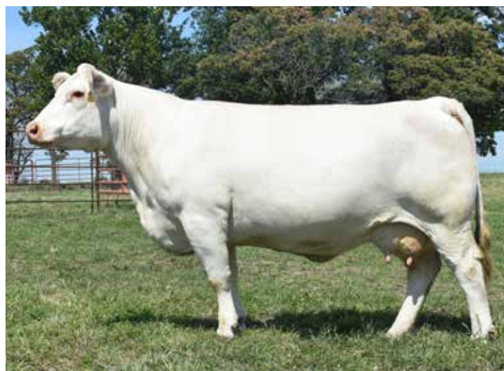
RE MS DUKE 745 ET Dam of Lot 14