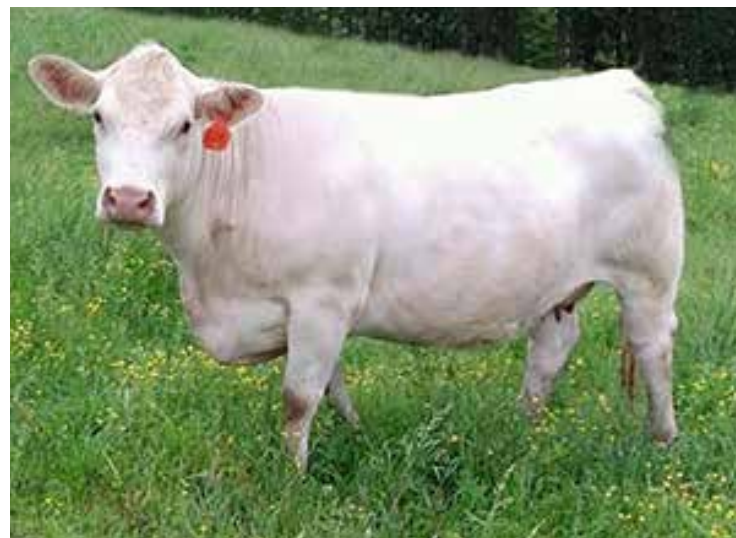
WELCOME GROVE GLORIA 108 Dam of Lot 35

Sells Open. This fancy young lady offers tremendous growth and performance. She ranks in top 35% for WW, YW, and Milk, 30% MTL, and 15% REA, 1% Fat and a total of 9 traits in top 50 % of breed. Her dam is a heavy milking, very feminine Smokester daughter with that extra maternal ability and REA they are known for. She also traces to Camp Cooley's Jackpot sire. Notice the light birth weight the King's are consistent with.