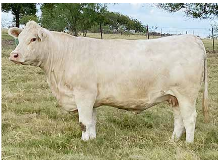
BRP RAISAN'S ASSET E03 PLD Sells as Lot 63

Sells bred A-I on 5/5/21 to DCF Relentless 8577 and PE from 5/23/21 to 8/25/21 to BRP Houdini G05. The Zen daughters are fantastic, Mary ranks in the top 20% WW, 25% YW, 4% CW, 8% REA, and 25% TSI for breed comparison in EPDs. A very broody and feminine cow, strait topped, deep barreled, and extended angular neck design makes her an ideal conformation. Relentless also adds tremendous eye-appeal in his offspring!