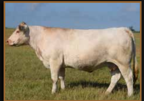
KR MS REALITY 303 BHD Reality T3136 P X MCF Lady GI Duke 5003 PET Choice of ET Calves Sired by LHD Cigar!

Special Offering from Hudspeth Farms! Pick of 2021 fall heifers sired by DC/BHD King F2503!