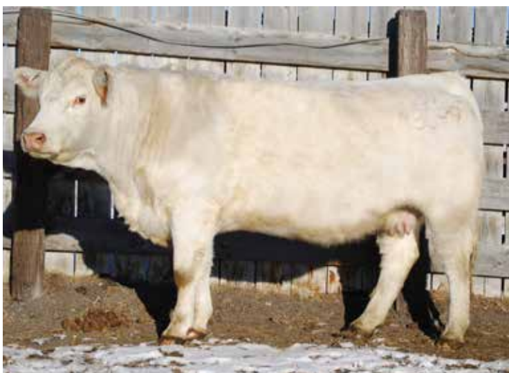
MD MS COBALT W3099 Dam of Lot 8

DUE: October 3, 2021 to BHD Zen X270 P. This big, powerful Braxton daughter is sure to be a welcome addition to any herd. The Braxton's are well known for their great udders and milking ability in Canada. He sold for a record $165,000 in Canada. Zen daughters are some of the top producers in the DeBruycker herd, and many of the top selling bulls each year trace back to Zen dams! Zen has been a good calving sire as well!