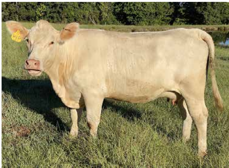
REAVES MS DAWN 952 Sells as Lot 73