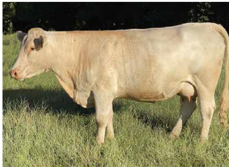
TX SHOOTING STAR Sells as Lot 72

72A: Polled bull calf #109, born 9/8/21, sired by DC/CRJ Tank E108 P. This bull calf is outstanding and what better recommendation for a herd sire than to be out of a great milking Free Lunch daughter with perfect udder quality and size. Great pedigree, the 072 cow on bottom of pedigree would be a full sib to LHD Cigar. Star ranks in the top 15% WW, 20% YW and CW, 8% Marbling, and 25% TSI. Should be high on your list to evaluate!