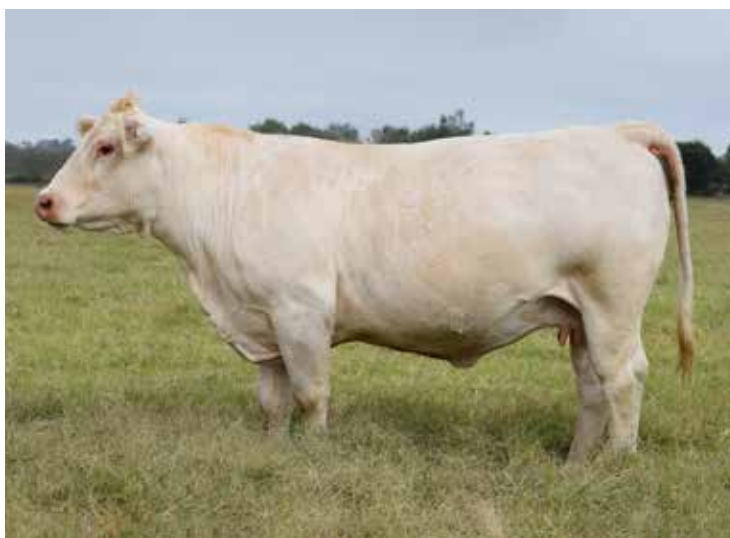
DOUBLE-H LEGENDS ANGEL 125Y ET Dam of Lot 58

DUE 3/5/22 with calf sired by DC/CRJ Tank 108E P. The 72 bull is doing a fantastic job and why wouldn't he...he is out of JDJ Ms Dynasty L428 an axiomatic powerhouse of top genetics. The Tank blend will add great to the EPDs creating a top individual. 966 is a beautiful, clean made, very feminine, good bone, strong top heifer with a stacked pedigree of great ones. The SCC Cigar 3022 ET is a full brother to Cigar and used at Thomas Ranch, TX.