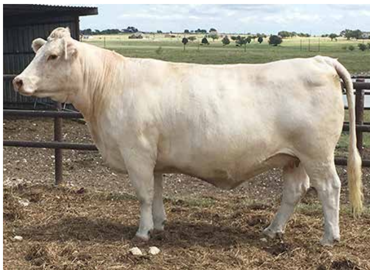
D&D MS NANCY 1715 PLD Sells as Lot 61