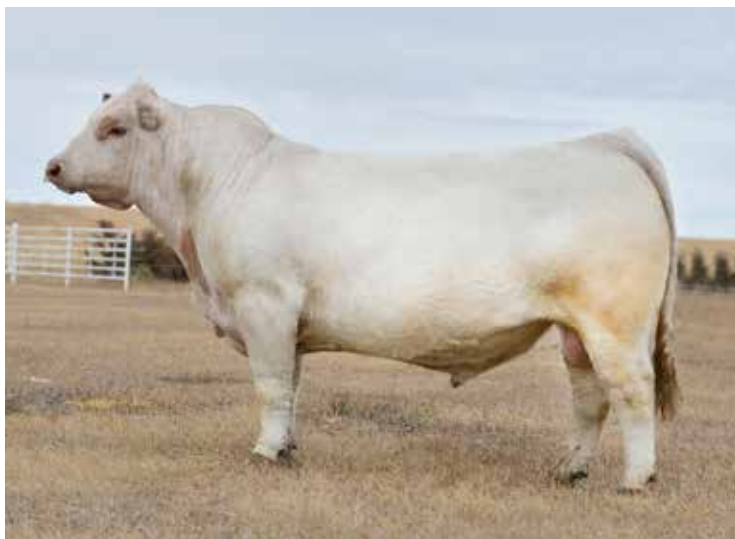
M&M OUTSIDER 4003 PLD Sire of Lot 24 Embryos

Sells Open , another spectacular daughter of Antoinette, the dam of 21 progenies registered at AICA, with three of them in this one sale. What a great opportunity to add all three of this dominant cow family to your herd with these fabulous credentials. That would create a fountain of winners every year to show or sell! Top show heifers are demanding big prices, raise your own with these heifers or sell for the big prices!