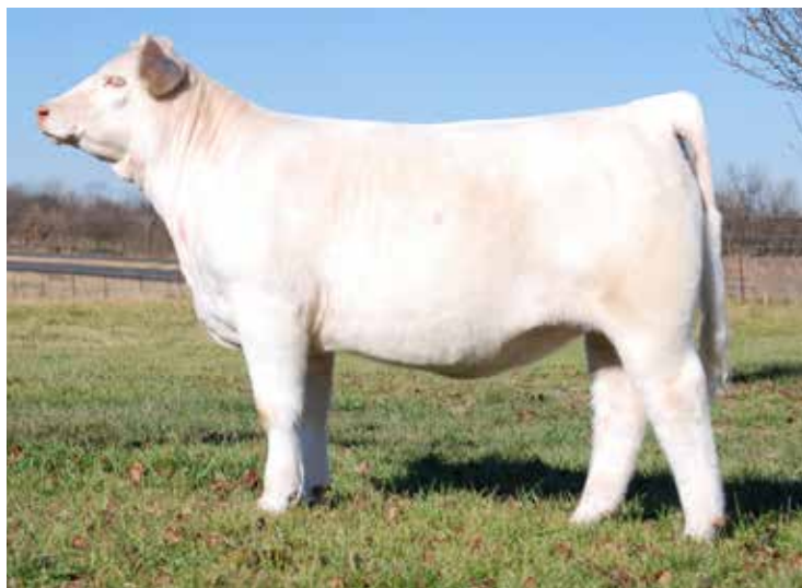
CIRCLE K JULIETTE