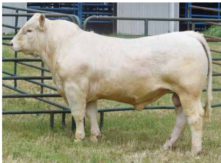
DC/JDJ PEGASUS D3330 P Sire of Lot 36