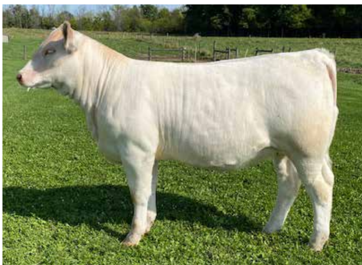
CIRCLE K CHARLI Sells as Lot 23