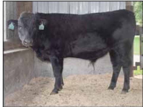
Lot 3 - OCD HARU TOFU 2806H ET • AA • Tend 10