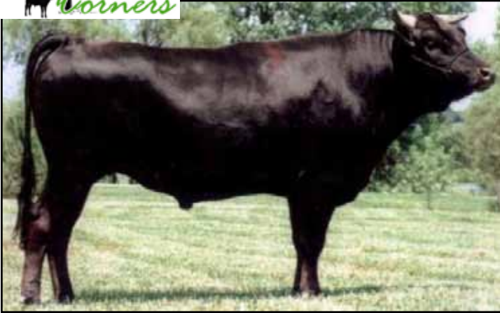
Sire Lots 29 to 31 - WORLD K'S MICHIFUKU