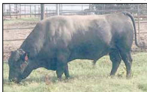
TBR MITSUITOFUKU 2149Y