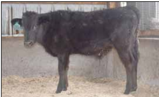
Lot 20 - OCD 1074X HECTOR 5340J ET AA Tend 10