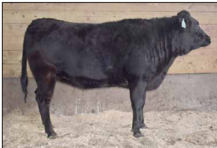
Lot 40 - OCD SANJIROU3-39 HARI 0062G ET AA Tend 5