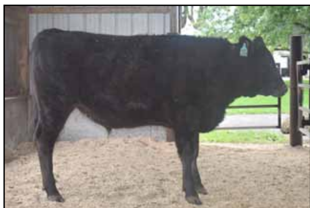
Lot 5 #62819