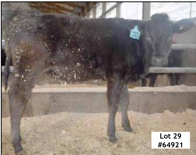
Lot 29 #64921

These bulls are direct sons of the great original import bull Michifuku and out of a linebred Michifuku cow! Michifuku is one of the great utility bulls of the breed famous for throwing huge ribeyes and that supreme tasting Doi fat! Michifuku was chosen from 1000s of bulls in Japan due to his being a direct son of a great marbling bull in Japan named Monjiro whose semen was selling for $50,000 in Japan in the mid 90's at the time of the US imports. This bull is a grandson of the great Monjiro! In fact close to 40% of his DNA comes from Monjiro so you get elite carcass quality heavily concentrated in these bulls in a nicely linebred package which will yield higher uniformity and consistency in quality.