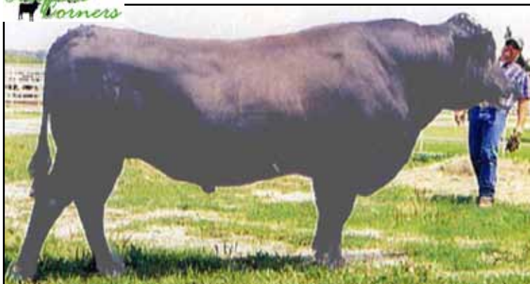
Sire Lots 13 to 15 - WORLD K'S SHIGESHIGETANI