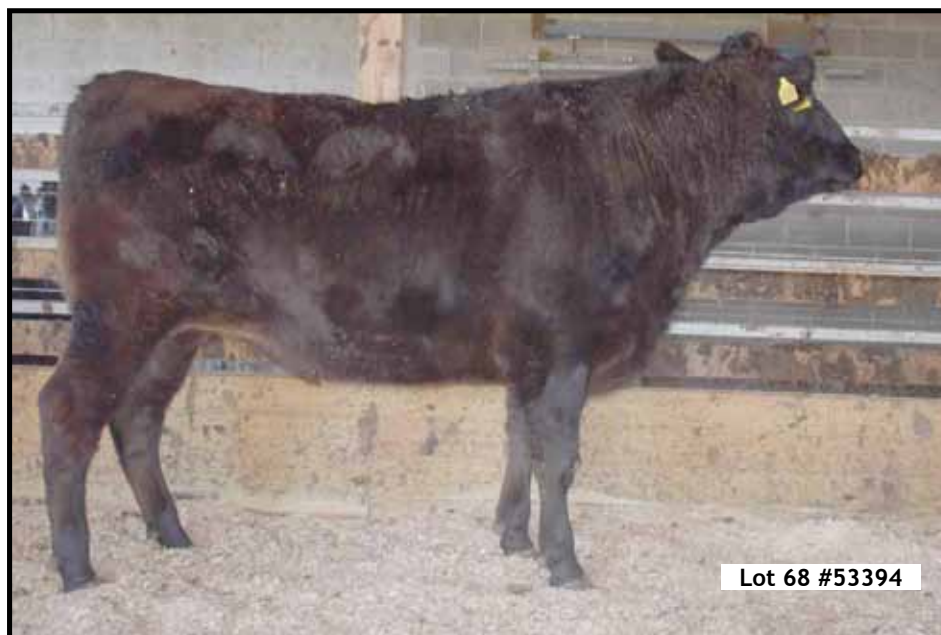
Lot 68 #53394