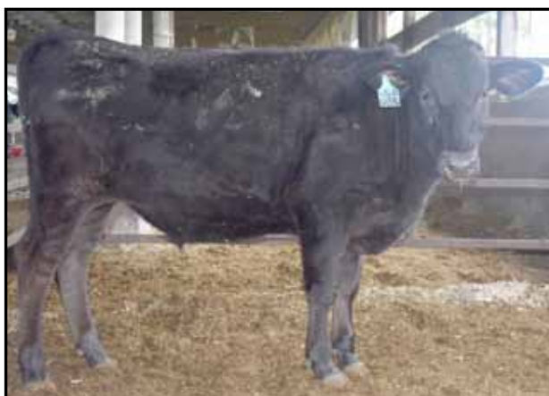
Lot 11 #64396