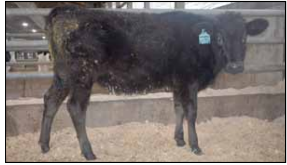
Lot 16 #64726

#64726 Born 04/11/2021 FB66329 Black AA Tend 9