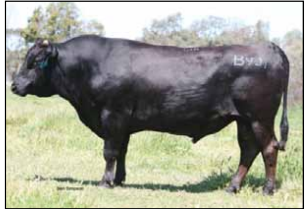
GINO MARBLEMAX™ HIRANAMI B901