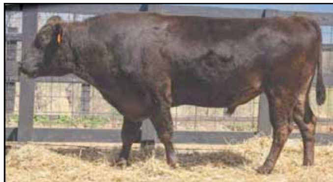
SIRE AA10 Well balanced pedigree for breeding stock or meat production. Dam comes from Crescent Harbor Ranch program. Maternal Brother to sire MFC Itomoritaka 0-41.

WORLD K'S SHIGESHIGETANI [WORLD K'S HARUKI 2 x WORLD K'S SUZUTANI] STUD HIKO 417 LMR MS ITOZURUDOI 8164U [ITOZURU DOI x CF 503]