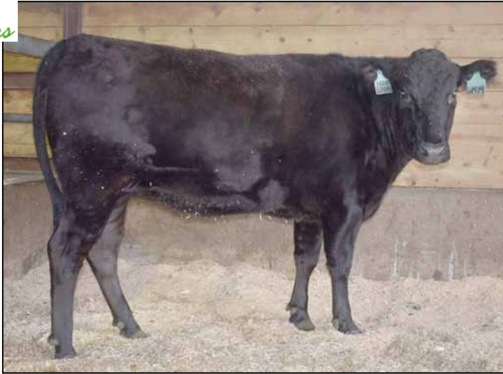
Lot 50 - OCD MACHO MAO 414H ET AA Tend 10 Kedaka and Shimane blood Proven Prolific Donor: IVF 6 embryo avg for 5 collections Flushmate to Dam of Lots 51 + 52

Here's a rare opportunity to acquire the status of an AA-10 donor with above average high growth Kedaka and Shimane blood coursing through her veins. With 002, 147 and Z278 all appearing in her pedigree don't let the SCD and tenderness score fool you this heifer has growth and milk to go with it!!! The growth blood notwithstanding look at all the legendary marbling bulls in her pedigree: 068, 148, Michifuku and Kitaguni Jr who was the only son of two time Wagyu Olympics champ Kitaguni 7/8! What a balanced, high performance donor who has averaged 6 embryos produced over 5 IVF collections! Real long term value opportunity here!