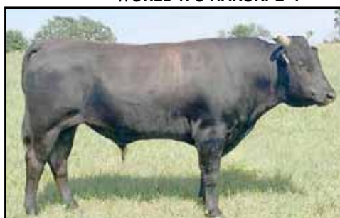
TBR KIKUTNAMI 4051A