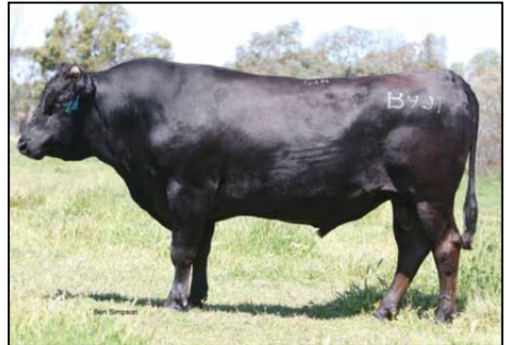
GINO MARBLEMAX™ HIRANAMI B901

TRAITS ANALYSED: 200WT(x2), 400WT, 600WT, Genomics / NOV 2021 NUMBER OF HERDS: 25 PROGENY ANALYSED: 811 SCAN PROGENY: 100 CARCASS PROGENY: 90 NUMBER OF DTRS: 68