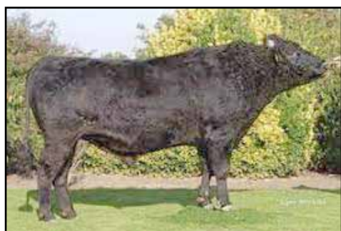
WORLD K'S HARUKI 2 F