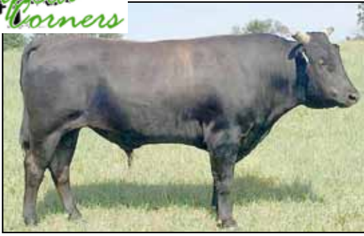
Sire Lot 16 - TBR KIKUTNAMI 4051A