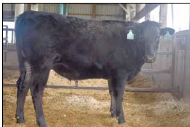
Lot 7 #62803