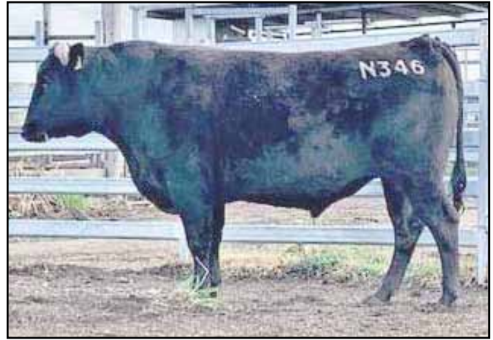
TRENT BRIDGE N346 ET

TRAITS ANALYSED: 200WT, Genomics Number of Herds: 2 Progeny Analysed: 40