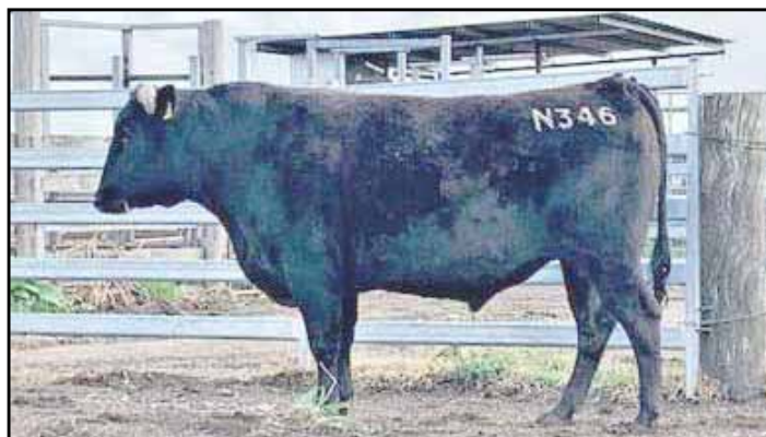
TRENT BRIDGE N346 ET

TRAITS ANALYSED: 200WT, Genomics Number of Herds: 2 Progeny Analysed: 40