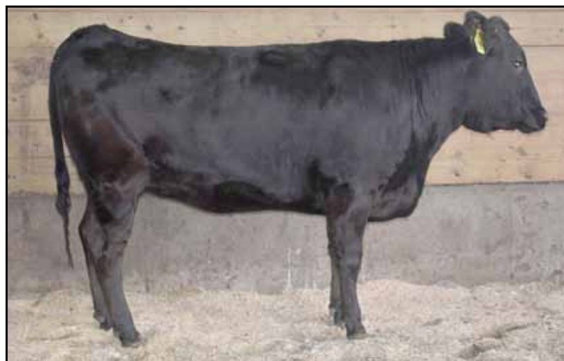
LOT 56 - OCD KIKU SANGRIA 3313H ET AA Tend 7