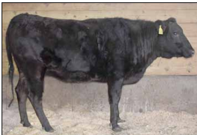
Dam Lots 18 to 24 - OCD KIKU HIRO 389G ET #53389 AA Tend 10

BAR R NAKAGISHIRO 56T [STUD HIKO 417 ✕ WORLD K'S NAKAGISHI 5] OCD 44426E ET STUD HIKO 417 [WORLD K'S SHIGESHIGETANI ✕ LMR MS ITOZURUDO 8164U]