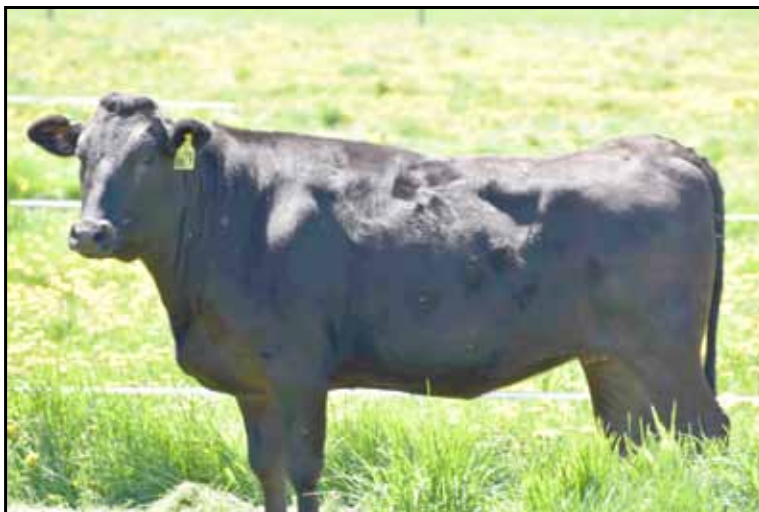
Dam Lots 1 to 17 - TBR TOMIKO 2 7 6679F AA Tend 10

From Triangle B program. Prolific brood cow - 16 progeny sell and 1 embryo lot. Doi blood from Hyogo, Japan - Kobe Beef origin. AA-10 donor averaging 5 embryos over 5 IVF collections! Produced 25 IVF embryos.