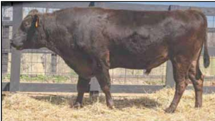
Sire Lot 17 - HLW KIKUYASU AA10