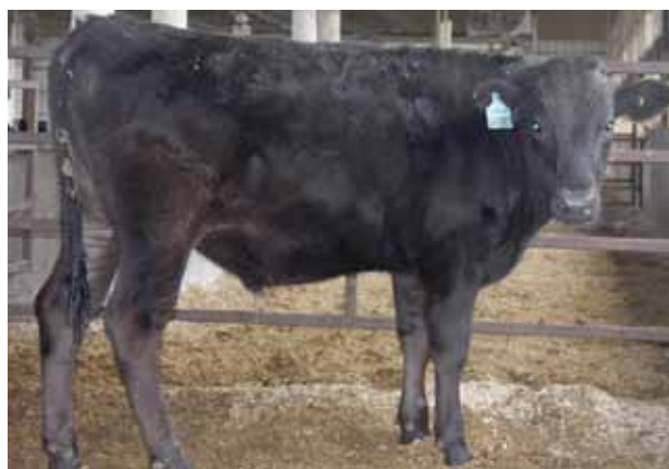
Lot 10 #64387