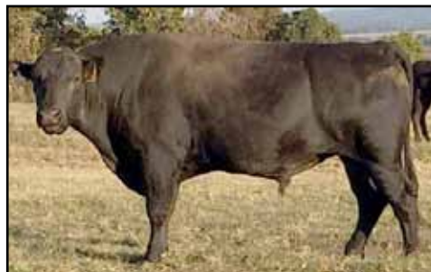
TBR ITOSHIGEFUKU 9059W