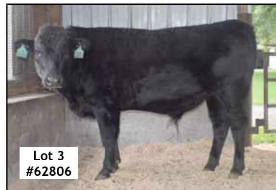
Lot 3 #62806

Lot 2 Female OCD HARU TORRENT 62762H ET #62762 Born 10/03/2020 Pending Black AA Tend 7