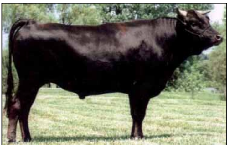
Sire Lot 1 - WORLD K'S MICHIFUKU

Coming from storied Triangle B program in Oklahoma you know this donor is backed by nothing but performance on top of performance! Since she is linebred former #1 marbling bull for many years JVP Fukutsuru 068 top and bottom with some Monjiro top and bottom by way of Michifuku and Sanjiro this heifer is LOADED with top of the line Doi blood from Hyogo, Japan where Kobe Beef comes from!