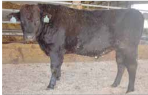
Lot 17 - OCD TOMIKO TOMATO 2156H ET • AA • Tend 10