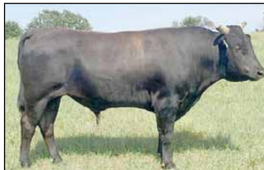
Sire Lot 65 - TBR KIKUTNAMI 4051A

WORLD K'S SHIGESHIGETANI [WORLD K'S HARUKI 2 ✕ WORLD K'S SUZUTANI] STUD HIKO 417 LMR MS ITOZURUDOI 8164U [ITOZURU DOI ✕ CF 503]