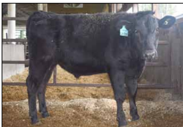
Lot 9 #64388