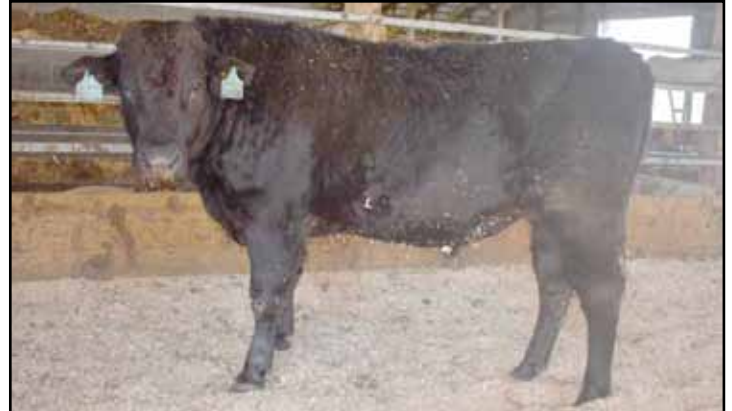
Lot 17 #62156

SIRE AA10 Well balanced pedigree for breeding stock or meat production. Dam comes from Crescent Harbor Ranch program. Maternal Brother to sire MFC Itomoritaka 0-41.