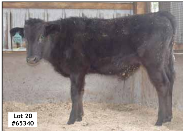
Lot 20 #65340

BAR R NAKAGISHIRO 56T [STUD HIKO 417 ✕ WORLD K'S NAKAGISHI 5] OCD 44426E ET STUD HIKO 417 [WORLD K'S SHIGESHIGETANI ✕ LMR MS ITOZURUDOI 8164U]