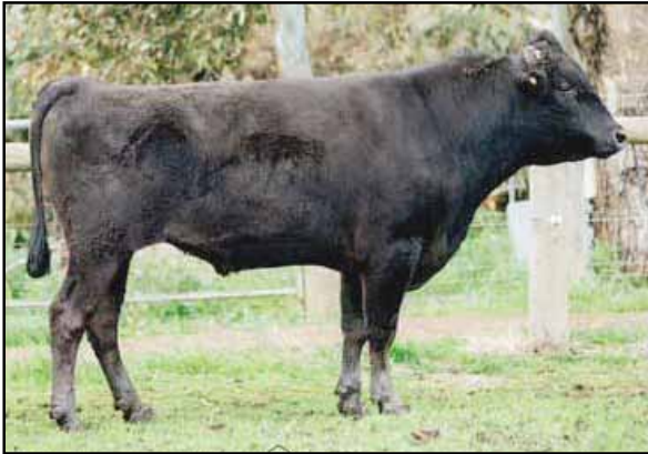
OLIVE GROVE WAGYU Q038

DONOR DAM 414H ET X GINO MARBLEMAX™ HIRANAMI B901 FB51442 X OLIVE GROVE WAGYU Q038 OGWFQ038