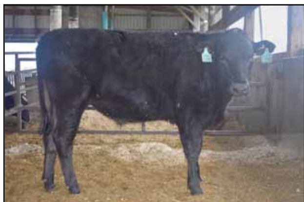
Lot 8 #62815