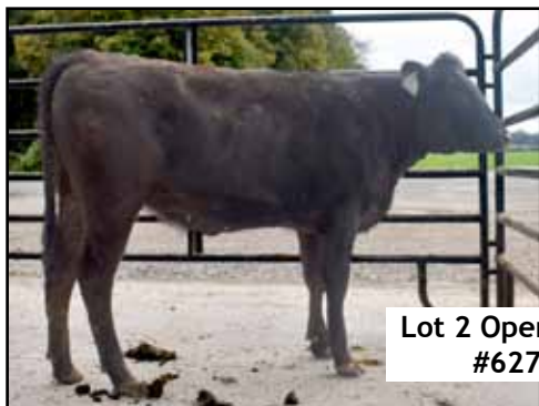
Lot 2 Open Heifer #62762

TBR TOMIKO 2 7 6679F AA Tend 10 [SAME DAM AS LOT 1]