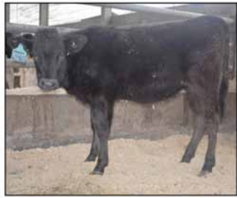
Lot 1 - OCD MICH TREASURE 5460J ET • AA • Tend 10