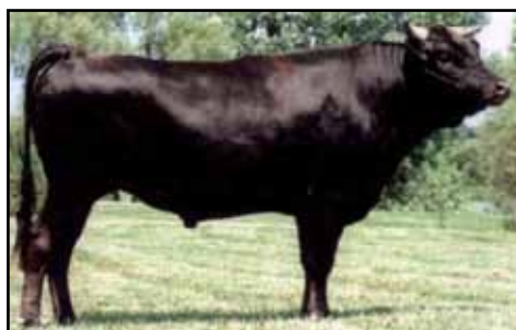
WORLD K'S MICHIFUKU