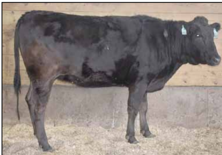
LOT 27 - OCD KIKU HANA 803G ET AA Tend 7 Triple Monjiro pedigree / From Bar R program in northwest Proven Donor IVF 10 embryo avg on 6 collections 12 Progeny Selling / 1 Embryo Lot / Flushmate to Lots 42,49

Outstanding Hikokura maternal line. Her maternal sire 56T comes from Bar R program in the northwest. Plenty of Michifuku and Haruki II here.