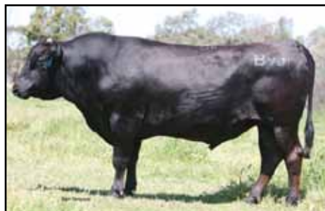
GINO MARBLEMAX™ HIRANAMI B901