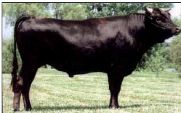
Sire Lots 18 + 19 WORLD K'S MICHIFUKU