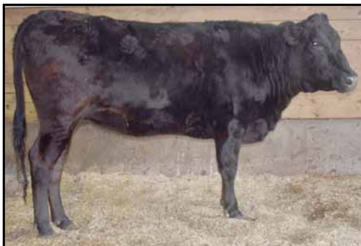
Lot 42 - OCD KIKU HOSHI 414G ET AA Tend 8