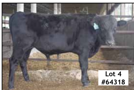
Lot 4 #64318

#64318 Born 01/13/2021 FB66324 Black AA Tend 7