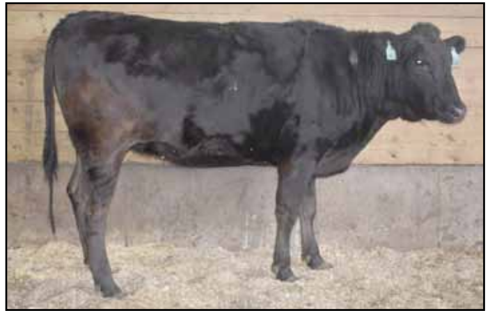
Dam Lots 29 to 31 - OCD KIKU HANA 803G ET (LOT 27) AA Tend 7 / From Bar R program in northwest

Lot 29 Female OCD MICH HIDEHO 4921J ET #64921 Born 05/17/2021 FB71399 Black AA Tend 7