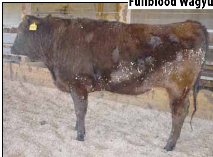
Lot 63 - Finished Weight Steer #53679

Lot 63 Steer OCD KIKUYASU SEIICHI 679G ET