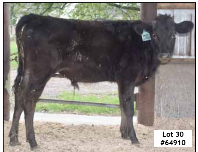
Lot 30 #64910