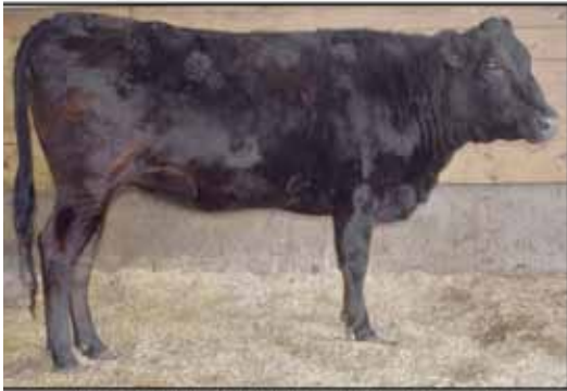
Lot 42 - OCD KIKU HOSHI 414G ET • AA • Tend 8