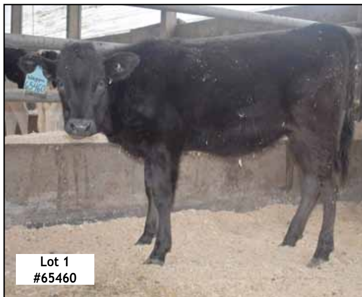
Lot 1 #65460

#65460 Born 06/03/2021 FB71403 Black AA Tend 10