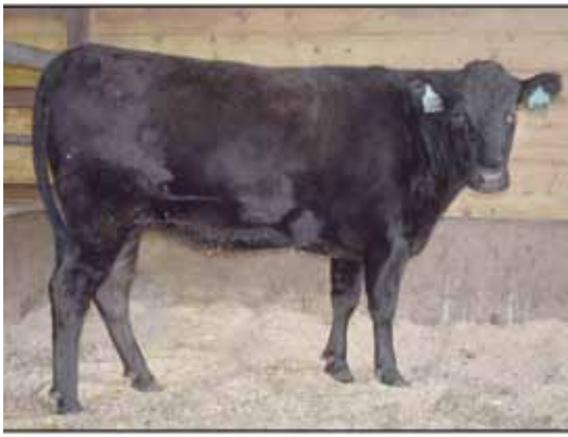
Lot 50 - OCD MACHO MAO 414H ET • AA • Tend 10