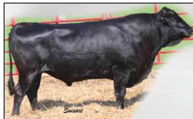
Sire Lot 40 - MFC SANJIROU 3-39

WORLD K'S SANJIROU [WORLD K'S MICHIFUKU x WORLD K'S SUZUTANI] BAR R NAKAGISHIRO 56T WORLD K'S NAKAGISHI 5 [KENRYU 1905 x NAGAYOSHI 472016]