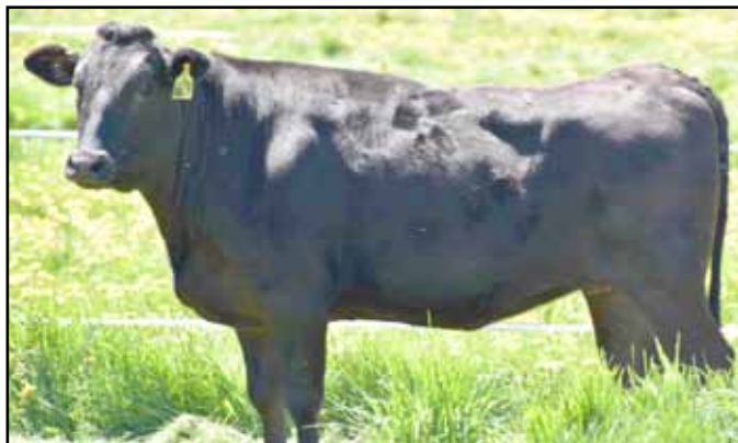
Dam Lots 1 to 17 - TBR TOMIKO 2 7 6679F AA Tend 10