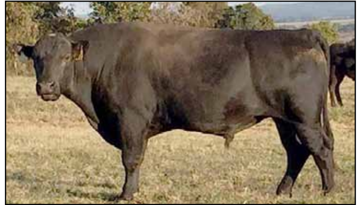
Sire Lots 32 to 39 - TBR ITOSHIGEFUKU 9059W See Lot 4 for Sire Description

BAR R NAKAGISHIRO 56T [STUD HIKO 417 ✕ WORLD K'S NAKAGISHI 5] OCD 44426E ET STUD HIKO 417 [WORLD K'S SHIGESHIGETANI ✕ LMR MS ITOZURUDOI 8164U]