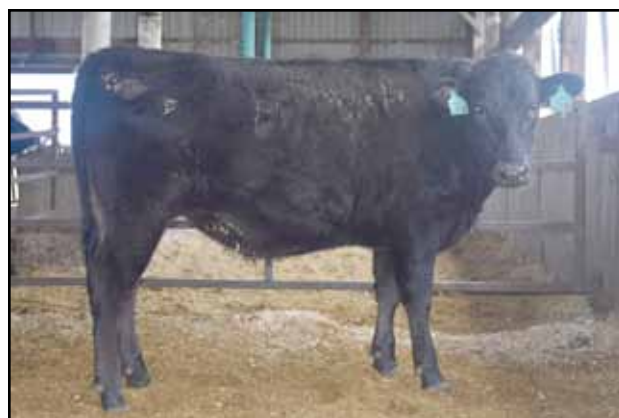
Lot 6 #62796