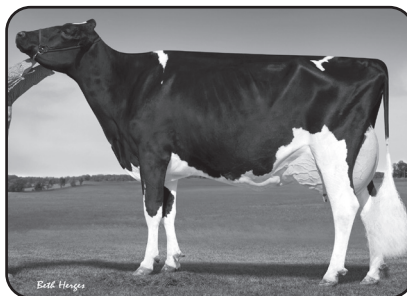
Rosedale Go for Gin-ET "EX-93 2E" (Granddam of Lot 83)