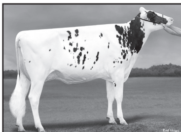
Pierstein Solomon Junisse-ET "VG-88" (Dam of Lot 81)

CAN110153989 Very Good-88 EVVVV 4-04 4-01 2x 157d 13,218 4.6 607 3.0 400"RIP 2-03 2x 263d 13,930 3.7 522 3.1 429 S: Walnutlawn Solomon-ET