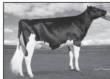
No-Fla Stoic Anne 40873-ET "VG-86" (Granddam of Lot 80)

3138735879 Very Good-86 VG-MS *TC*TL*TD GTPI +2802 +1643M +71F +57P 84R 8/21 PTA +825NM +.03%F +.02%P PTA +5.5PL 2.82SCS +.6DPR 2.0%DCE PTA +.82T +.90UDC +.63FLC 82R 8/21 PTAT +197FE +0.7FI 2.0%SCE 2-01 2x 365d 24,960 4.2 1053 3.4 839 S: Triplecrown JW Matters-ET