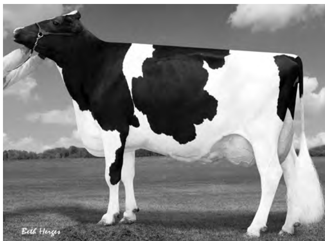
HILROSE RUBENS PATSY, EX-93 3E GMD 3rd Dam of Cat. #52