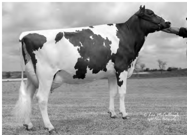
SCHUG PERSIA WHAT4-RED, EX-93 2E 2nd Dam of Cat. #7