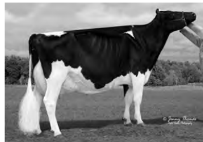
MS EXELS DUNDEE BEAUTY, EX-95 3E 3rd Dam of Cat. #1 & #2