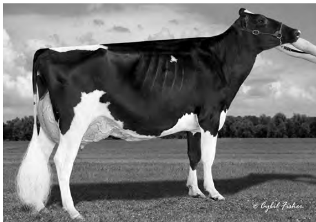
TREFLE CHASSEP DOORMAN-ET, EX-94 2E 2nd Dam of Cat. #89