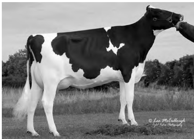
NOVA-TMJ GOLDEN EDEN-ET, VG-89 3rd Dam of Cat. #41