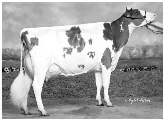
WILSTAR AD ROSES REBA-RED, EX-92 3E 2nd Dam of Cat. #50