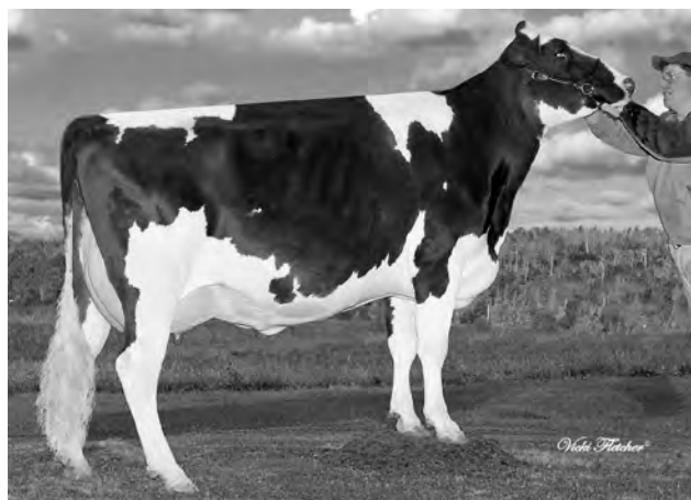
BUDJON-JK-I DERRY ELEGANCE-ET, VG-86 3rd Dam of Cat. #61 & Cat. #62