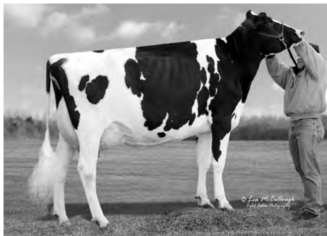
FLOWER-BROOK SS DEUCE GESIN, EX-94 2E 2nd Dam of Cat. #95