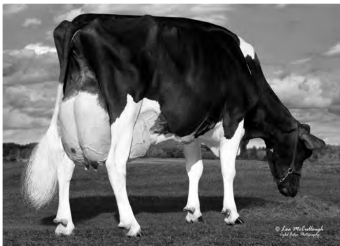
HOLLE-OAKS SANCHEZ LIA-ET, EX-90 2nd Dam of Cat. #45 & Full Sister to 2nd Dam of Cat. #46