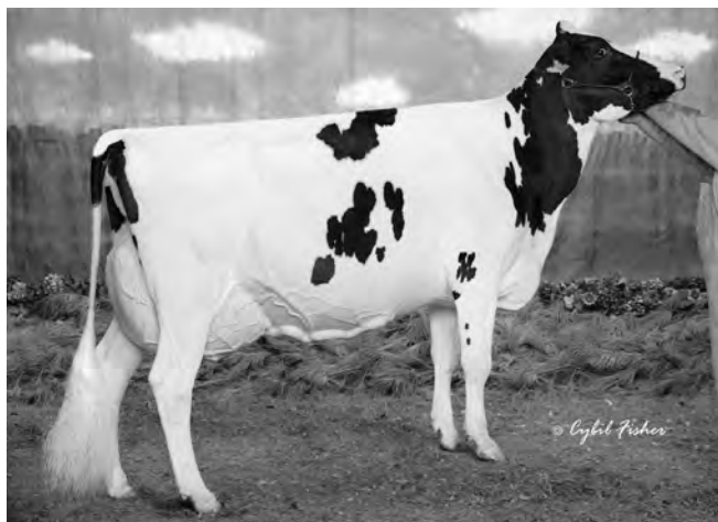
STEPIDO D W BEAUTY, EX-95 3E 3rd Dam of Cat. #31