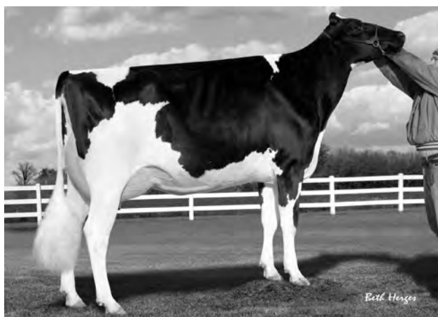
NOVA-TMJ GOLDEN ECHO-ETS, VG-88 DOM 3rd Dam of Cat. #36 & #37