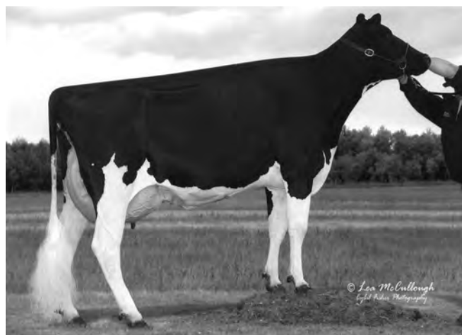
HONADEL BURT ESCANABA-ET, VG-87 3rd Dam of Cat. #8

No. 7 $ _____ Consignor: Udder Acres Dairy LLC 2276 130 th Ave Glenwood City WI 54013-8304 715-684-3166