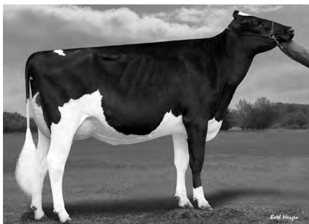
S-S-I DOC HAVE NOT 8784-ET, EX-92 Mat. Sister to Dam of Cat. #16 & #17