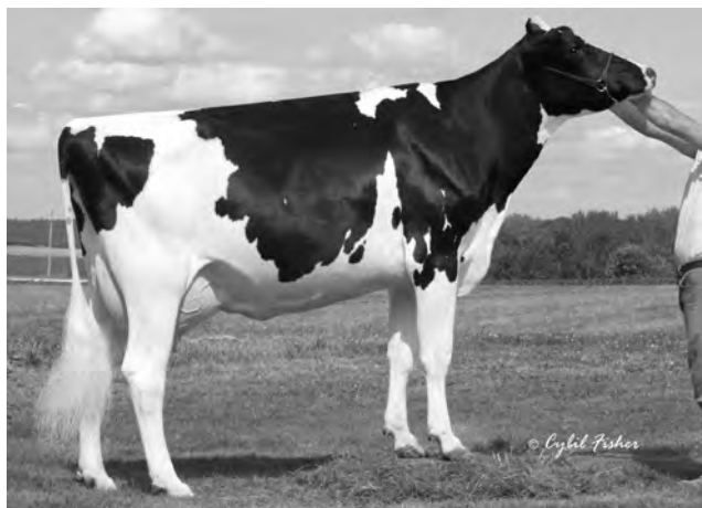
UFM-DUBS EROY, VG-87 GMD DOM 3rd Dam of Cat. #38 & 4th Dam of Cat. #36 & #37