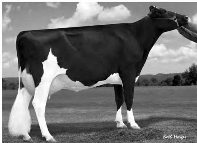
FLOWER-BROOK DAMION JOSIE, EX-92 2E 2nd Dam of Cat. #91