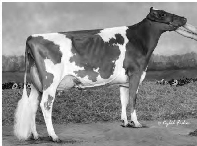
WILLOWS-EDGE MOSCATO-RED, EX-90 3rd Dam of Cat. #18