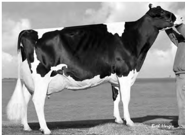
STUEWES CHAMPION DANNIE, EX-93 2E 2nd Dam of Cat. #92