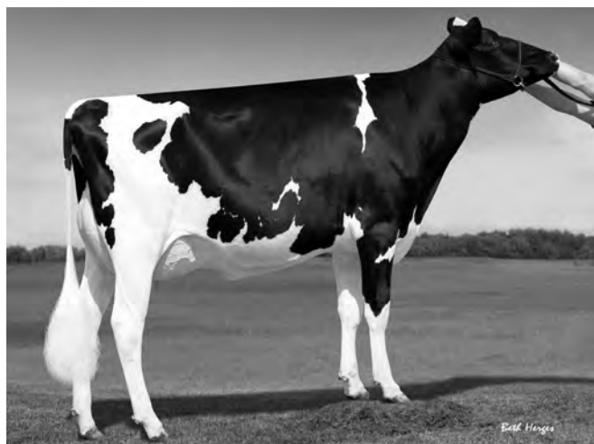
MS APPLES UNO ARMANA-ET, EX-94 3E DOM 4th Dam of Cat. #9