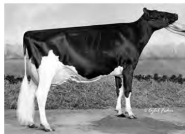
MISS BEAUTYS BOMBSHELL-ET, EX-93 3E 2nd Dam of Cat. #1 & #2