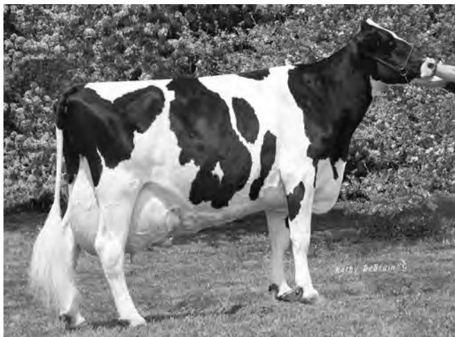
LUCAS-J STEAMER JESSICA, EX-94 4E DOM 4th Dam of Cat. #20