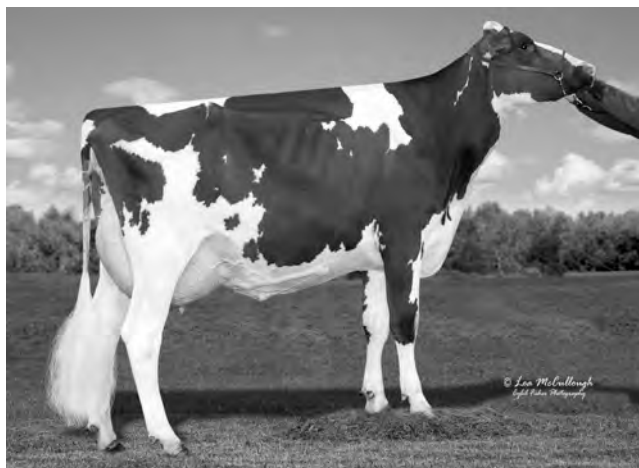
BOSSIDE APPLE PIE-RED-ET, EX-92 2nd Dam of Cat. #11 & #12