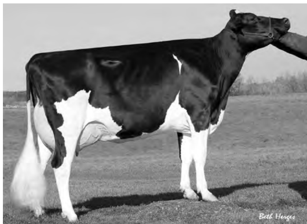
NOVA-TMJ ELEGANT EMBLEM-ET, VG-86 3rd Dam of Cat. #43