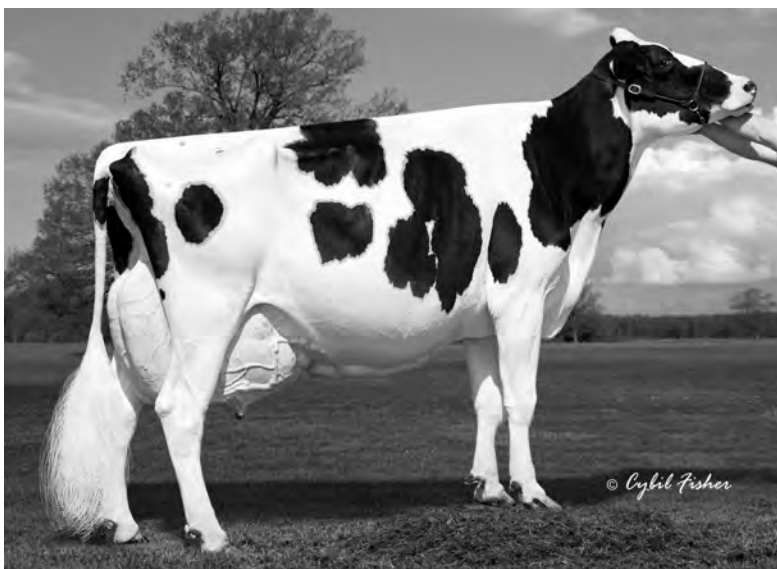
DORSLAND ELLY EVELYN-ET, EX-94 3E Dam of Cat. #5 & 3rd Dam of Cat. #6