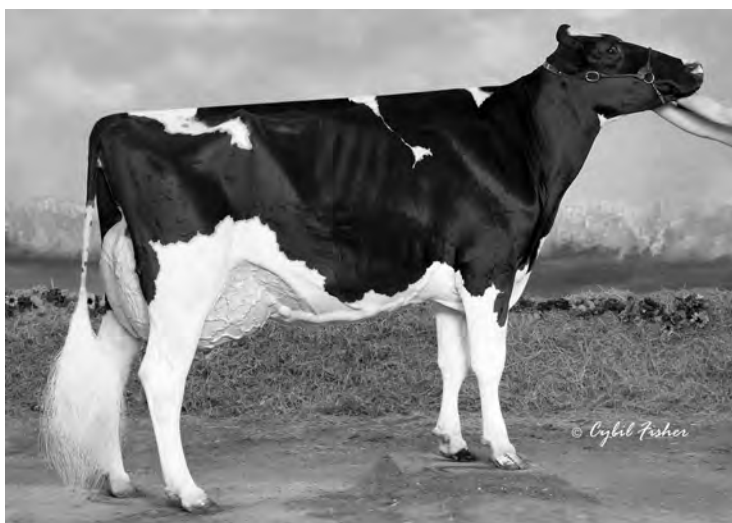
INDIANHEAD REDCARPET TIA-ET, EX-94 3E 2nd Dam of Cat. #64