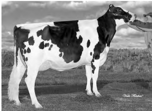
BUDJON-JK-I DERRY ELEGANT-ET, VG-86 2nd Dam of Cat. #59 & 3rd Dam of Cat. #60