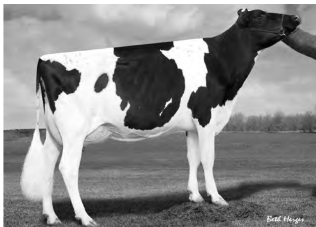
NOVA-TMJ ROUMARE EDNA, EX-90 2nd Dam of Cat. #41