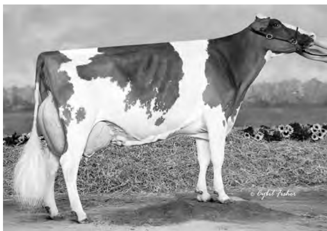
FLOWER-BROOK GINELLE-RED-ET, EX-90 Dam of Cat. #93 & #94