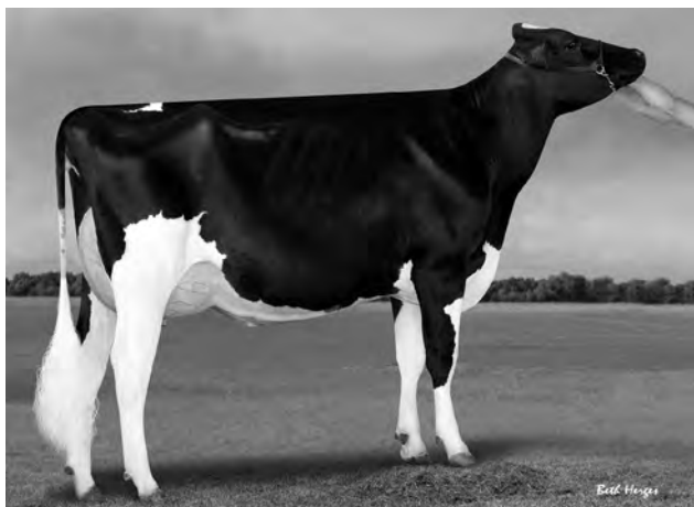
FLY-HIGHER JEDI HAVENOT-ET 2nd Dam of Cat. #16 & #17