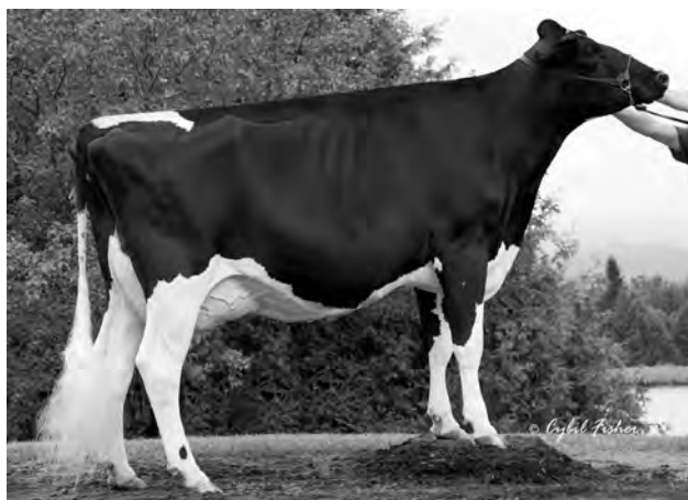
LA-FOSTER GIBSON ALLURE, EX-92 3rd Dam of Cat. #90