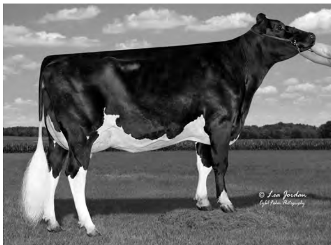
BOSSIDE SEASAW ABBY, VG-85 Dam of Cat. #9