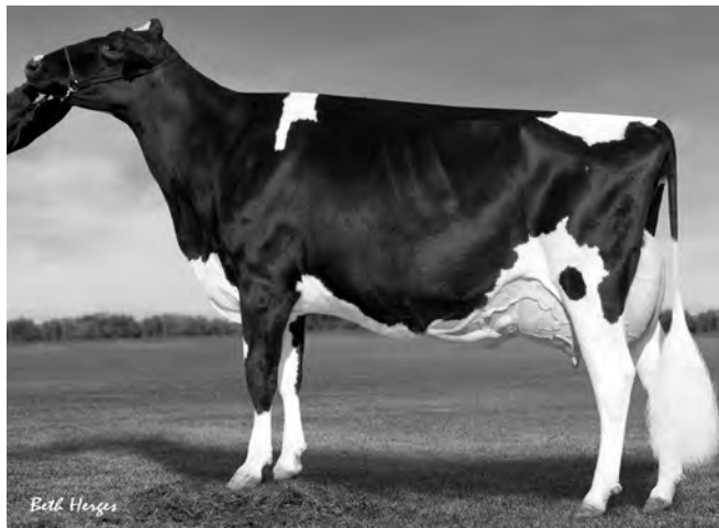
WINDLEWAY SHAQUILE PANDA-ET, EX-93 2E 2nd Dam of Cat. #84