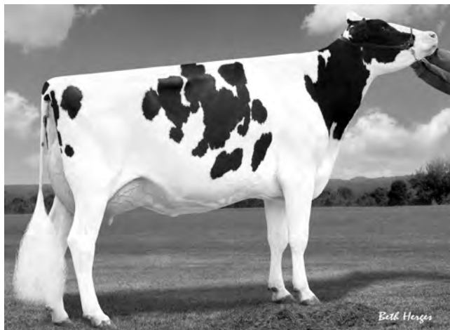
STUEWES DUNDEE GABRINA-ET, EX-94 2E 2nd Dam of Cat. #97 & 4th Dam of Cat. #98 & #99