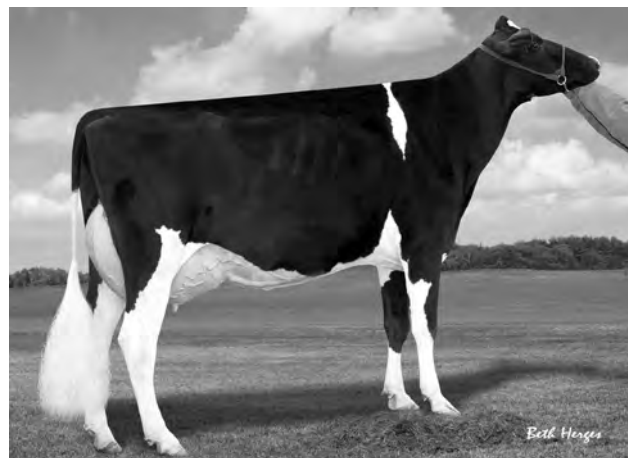
STUEWES ADVENT GIA, EX-90 2nd Dam of Cat. #93 & #94