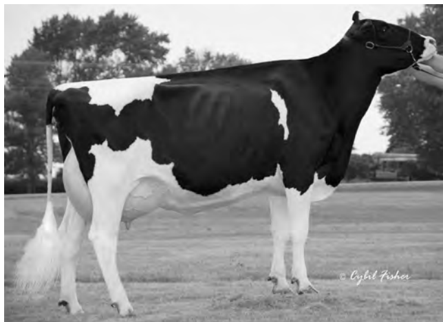
SCIENTIFIC DEBUTANTE RAE-ET, EX-92 GMD DOM 3rd Dam of cat. #32