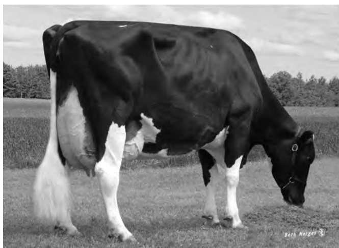
FUSTEAD EMERSON DELIGHT-ET, EX-90 2E GMD 3rd Dam of Cat. #3