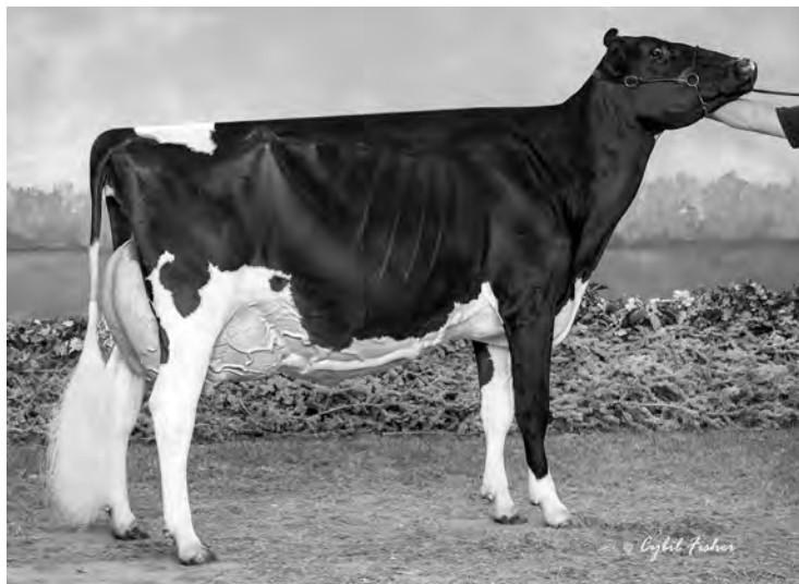
MS BEAUTYS BLACK VELVET, EX-92 Full Sister to 2nd Dam of Cat. #1 & #2