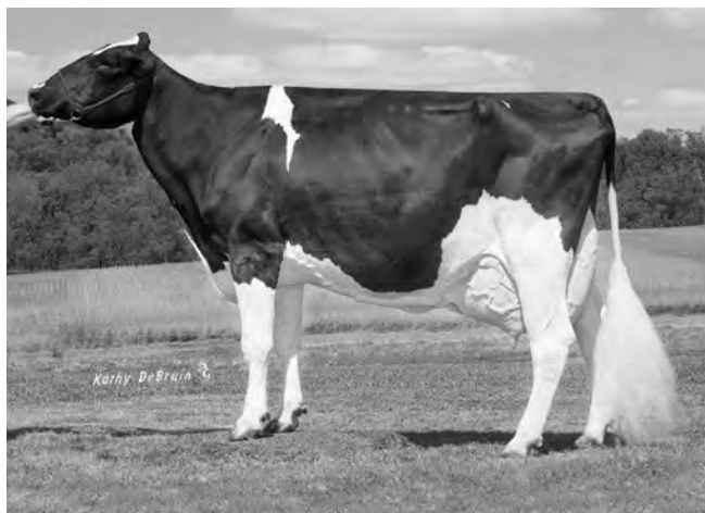
SPRINGHILL-OH CP CONSPIRE, EX-94 2E 3rd Dam of Cat. #51