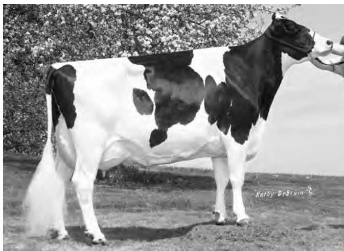
LUCAS-J LINJET JESSIE-ET, EX-94 3E 3rd Dam of Cat. #20