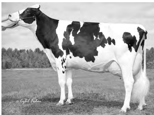
HILROSE LEE PRINCESS, EX-93 3E DOM 4th Dam of Cat. #52