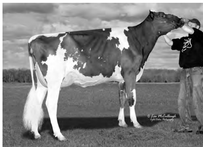
MISS D APPLE DANIKA-RED-ET, EX-91 2E 3rd Dam of Cat. #11 & #12