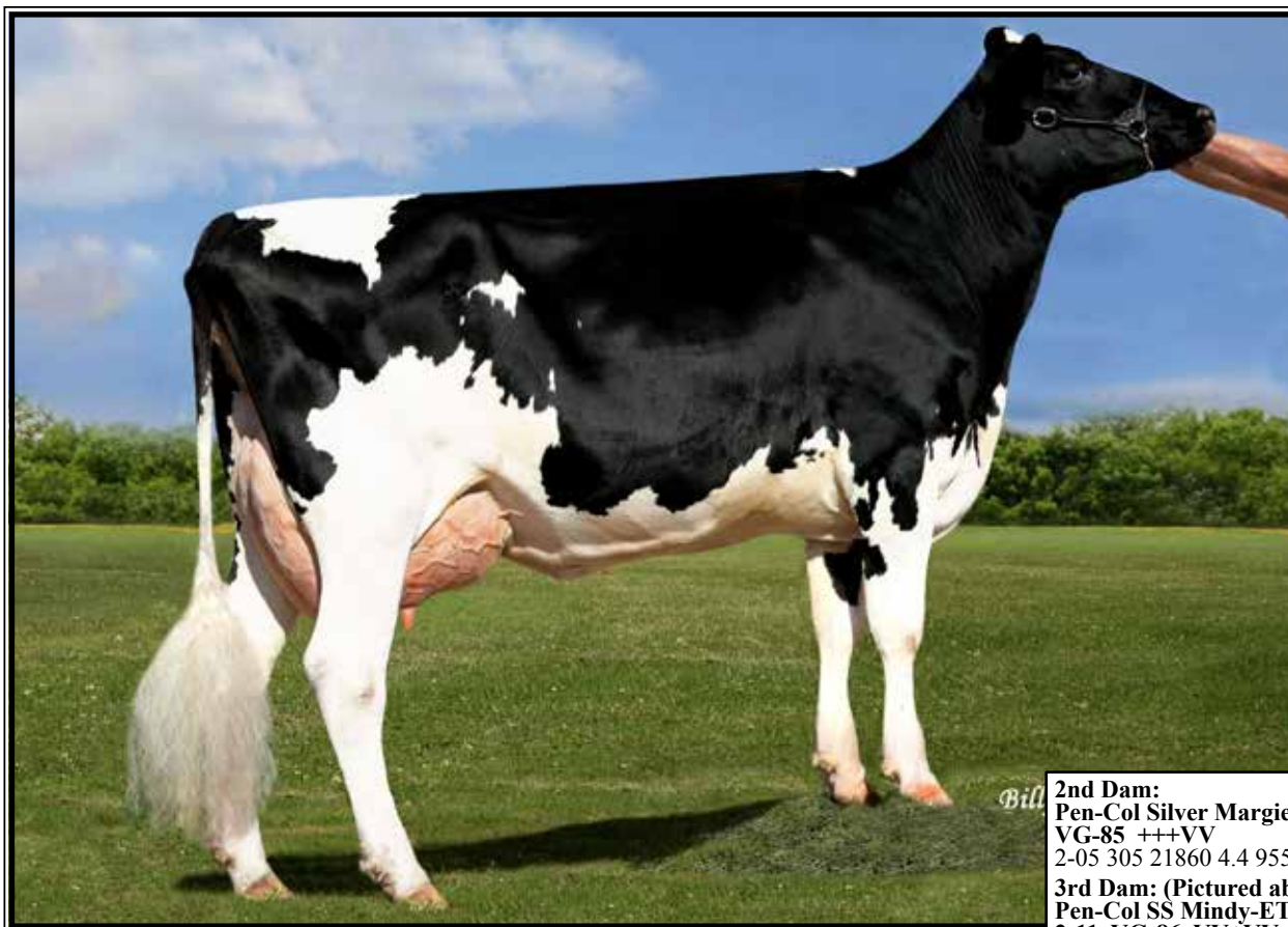
Pen-Col SS Mindy-ET VG-86 UU+UU (2nd Dam of Lot 104)